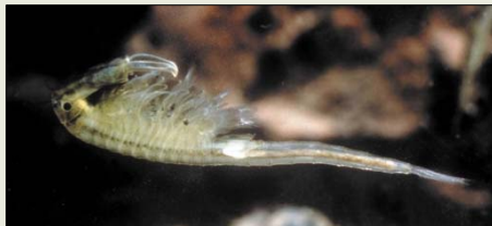
Vernal pool fairy shrimp