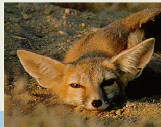
San Joaquin kit fox