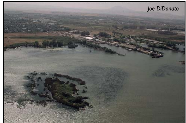
Big Break was formerly an island, breached by Delta flood waters in the 1920's.