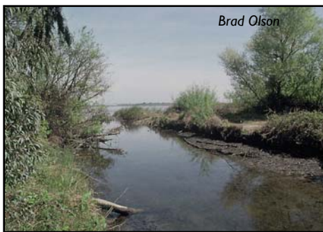
Big Break Regional Park channels provide habitat for fish and wildlife.

the result of a U.S. Bureau of Reclamation project at the Contra Costa Canal, where the Bureau is constructing fish screening facilities to prevent fish from being drawn into the canal. The construction will disturb approximately 30 acres of wetlands. To compensate for some of this damage, the Bureau contributed $50,000 towards the acquisition of the Lauritzen parcel, to help protect its wetlands.