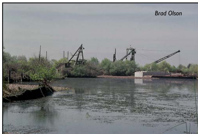
Sunken ships create artificial islands and reefs – unique habitat for fish, birds, and wetland plants.