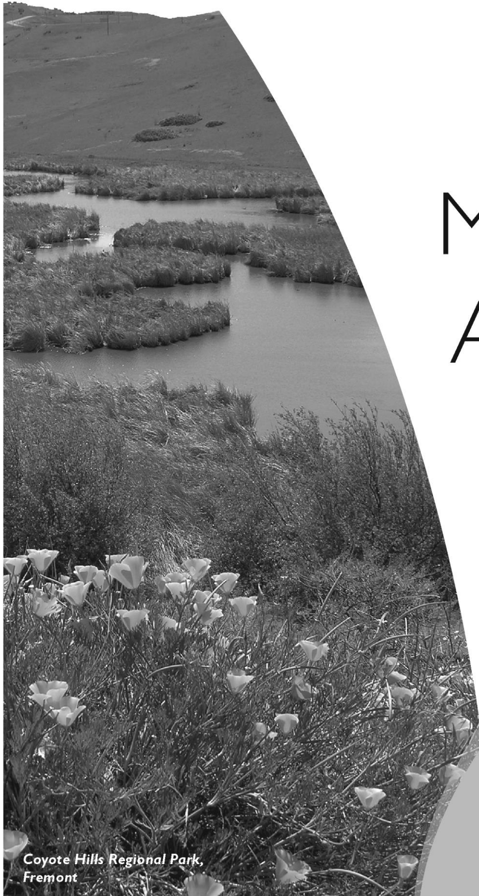
Coyote Hills Regional Park, Fremont