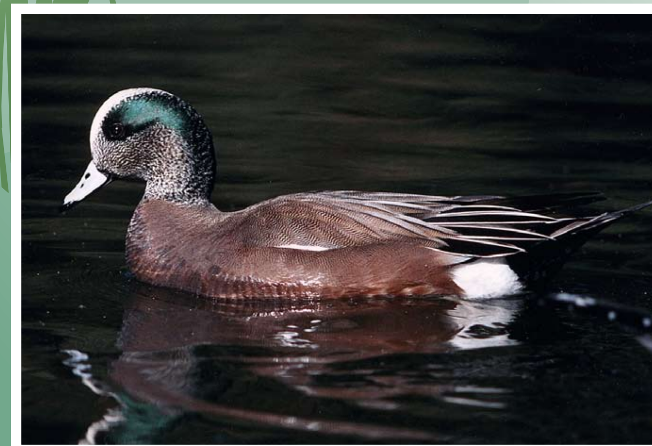
American wigeon (male)