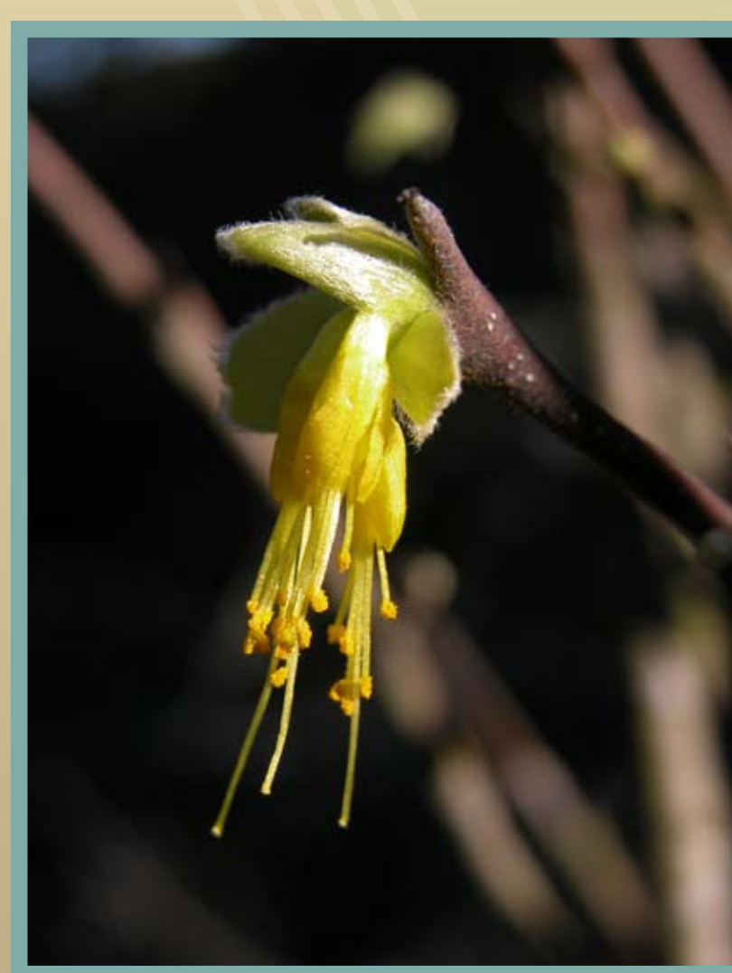
western leatherwood flower

Dogs roaming off-trail in this area may damage vegetation and frighten or injure wildlife. Keep your dogs on leash and help keep the corridor a safe place for organisms to thrive, including rare species such as the Alameda whipsnake and the western leatherwood. Thank you for doing your part in maintaining a healthy and balanced ecosystem in the East