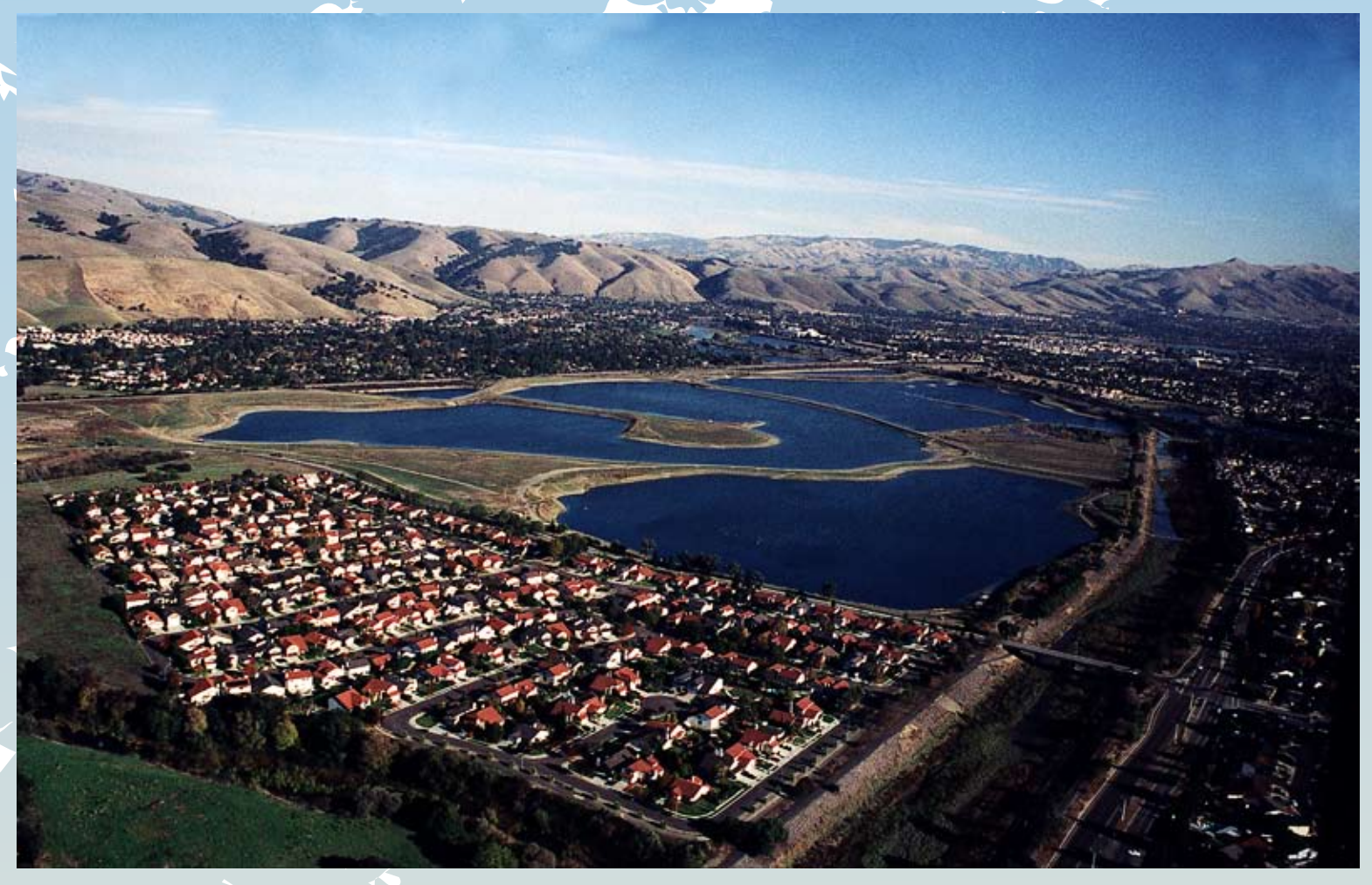
Aerial view of Quarry Lakes looking Southeast