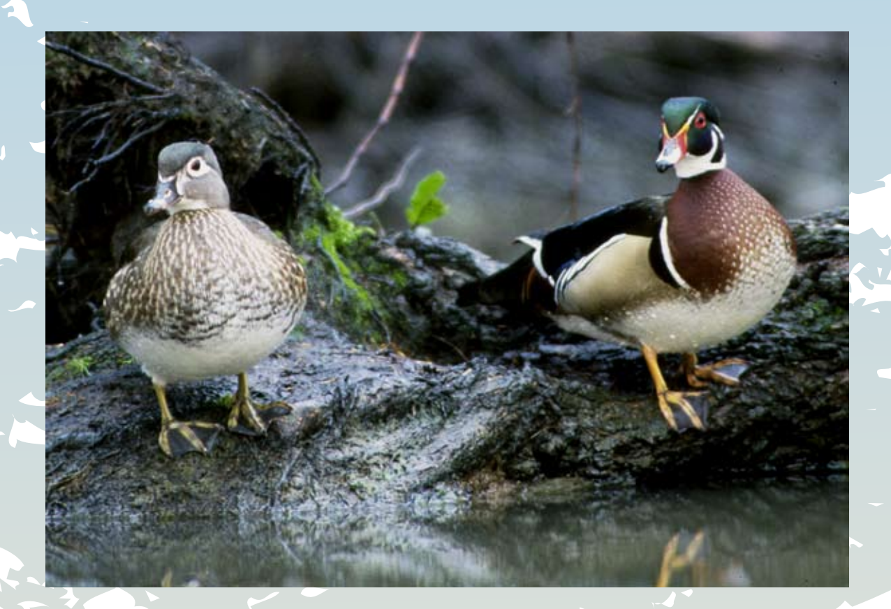
Female and male wood ducks