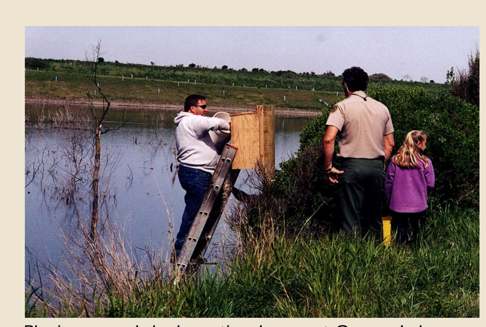
Placing wood duck nesting boxes at Quarry Lakes

Sponsored by the East Bay Regional Park District, Alameda County Water District, and the California Wood Duck Program.