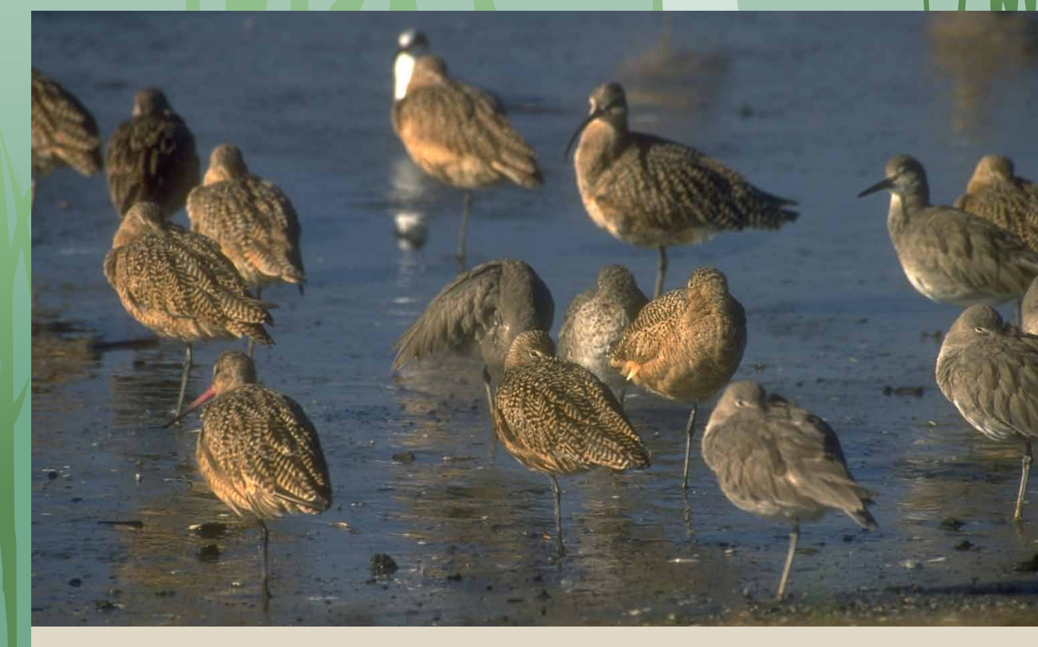
marbled godwits and willets