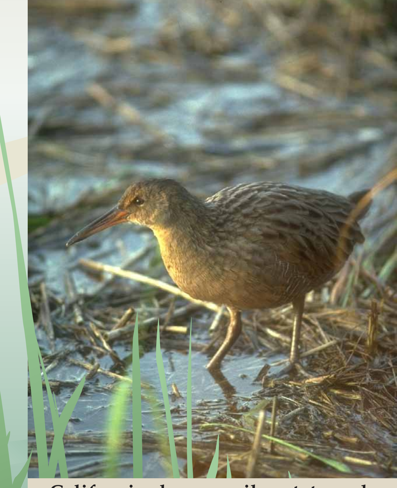
California clapper rail, a state and federal endangered species.