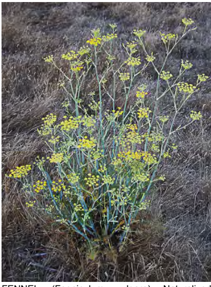
FENNEL (Foeniculum vulgare) Naturalized Perennial - Carrot Family - (May–Sep) -Roadsides, disturbed sites - Plants 3-6.5' tall, anise-scented. Stems waxy-blue, canelike. Flowers yellow. Leaf segments thread-like, edible when young. INVASIVE weed.