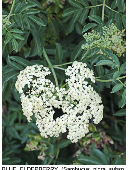
BLUE ELDERBERRY (Sambucus nigra subsp. caerulea) Native Perennial - Muskroot Family -(Mar-Sep) - Common. Streambanks, open places in forest - Shrub 7-26' tall. Flower cluster flat-topped, 1.6-13" diam, petals spreading. Fruits waxy blue-black.