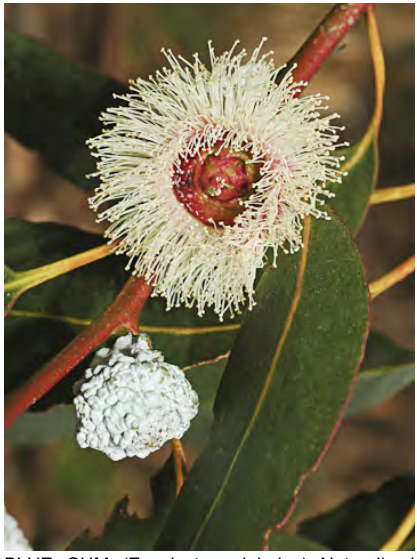
BLUE GUM (Eucalyptus globulus) Naturalized Perennial - Myrtle Family - (Oct–Jan) - Common. Disturbed areas - Tree < 200' tall. Flowers single, large, gen stemless. Leaves 4-12" long, 1-1.6" wide; used medicinally by Aboriginals. INVASIVE weed.