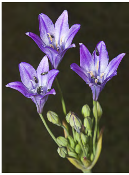
ITHURIEL'S SPEAR (Triteleia laxa) Native Perennial - Brodiaea Family - (Apr–Jun) -Common. Open forest, conifer or foothill woodland, grassland on clay soil - Flower stem 4-28". Leaves 8-16", 0.16-1" wide. Flowers blue, blue-purple or white, 0.7-1.9" long.