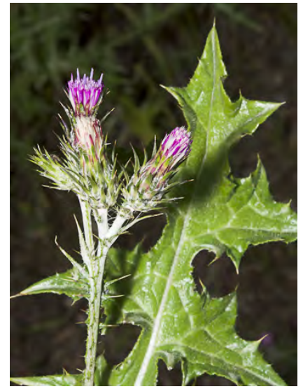
ITALIAN THISTLE (Carduus pycnocephalus subsp. pycnocephalus) Naturalized Annual -Sunflower Family - (Mar–Jul) - Roadsides, pastures, disturbed areas - Stems 8-79", narrow spiny-wings. Lower leaves 4-10 lobed, heads 2-5, flower bracts woolly. NOXIOUS.