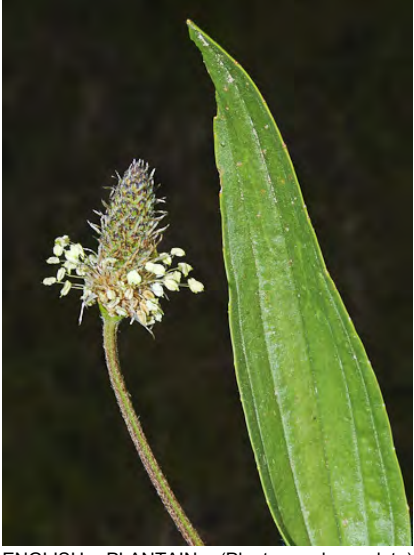
ENGLISH PLANTAIN (Plantago lanceolata) Naturalized Annual - Plantain Family - (Apr–Aug) - Common. Disturbed areas - Leaves basal, hairy, 2-10" long, <= 1" wide. Flowers + stem 8-31" tall, flower cluster 0.8-3" long. INVASIVE, lawn weed.