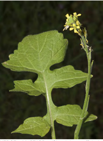
HEDGE MUSTARD (Sisymbrium officinale) Naturalized Annual - Mustard Family - (Apr–Sep) - Disturbed areas, fields, pastures - Stem 10-22" tall, thin, wiry. Petals 0.1-0.16" long, pale yellow. Fruit 0.4-0.55" long, awl-shaped, appressed.