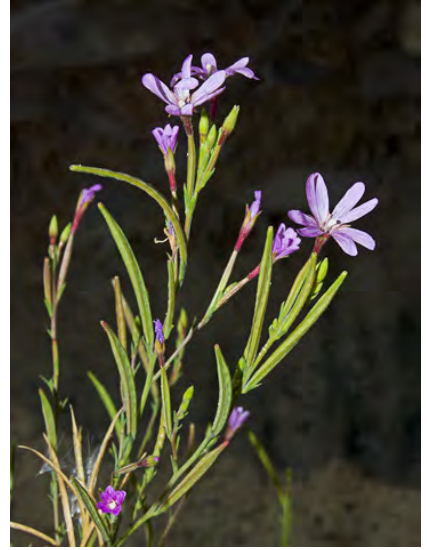
PANICLED / WEEDY WILLOWHERB (Epilobium brachycarpum) Native Annual - Evening Primrose Family - (Jun-Sep) - Common. Dry open or disturbed woodland, grassland, roadsides - Plant 8-79" tall, diffuse. Petals 2-15 mm long, white to rose-purple.