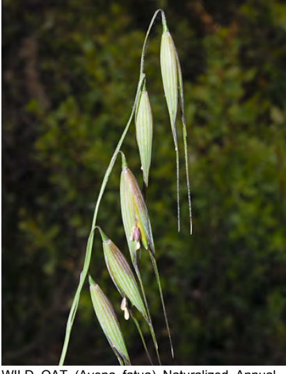
WILD OAT (Avena fatua) Naturalized Annual -Grass Family - (Apr-Jun) - Disturbed sites -Plants 1-5' tall. Spikelets 0.7-1.3" long. Low awn 1-1.6" long. Lemma tip bristles < 0.04" long. Seeds EDIBLE whole or ground for flour. INVASIVE weed.