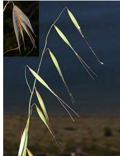
SLENDER WILD OAT (Avena barbata) Naturalized Annual - Grass Family - (Mar–Jun) -Disturbed sites - Plants gen 24-32". Spikelets 0.8-1.2" long. Awns 0.8-1.8" long. Lemma tip bristles >= 0.1" long. Seeds EDIBLE whole or ground for flour. INVASIVE weed.