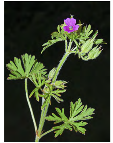
CUT-LEAVED GERANIUM (Geranium dissectum) Naturalized Annual - Geranium Family - (Mar-Jul) - Open, disturbed sites - Stem 3-28" tall, rough-hairy. Leaf blades deeply divided. Petals violet-red, 0.1-0.25" long w/notched tips. Flower stalk sticky. INVASIVE.