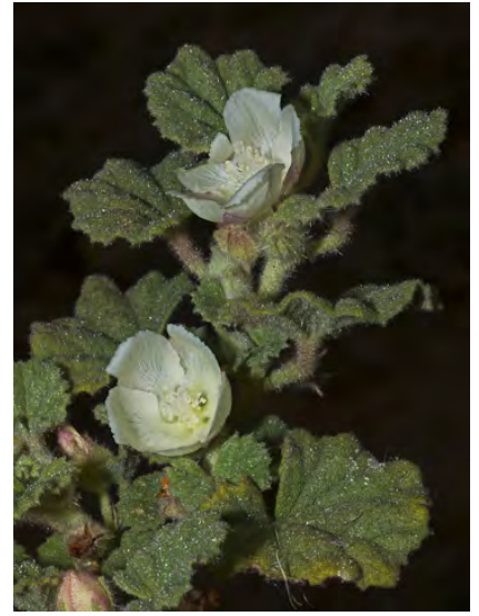
ALKAL-MALLOW (Malvella leprosa) Native Perennial - Mallow Family - (Apr–Nov) - Valleys, gen saline - Stem 4-16" long. Leaf blade 04.-1.4" long, toothed, densely short-hairy. Petals cream-white to yellow, 0.4-0.6" long.