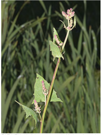
FAT-HEN (Atriplex prostrata) Native Annual -Goosefoot Family - (Apr–Oct) - Wet places, marshes - Plant 4-48" tall, branched at base. Leaves alternate, blades 0.4-3.5" long, triangular, green, not dense-scaly underneath.