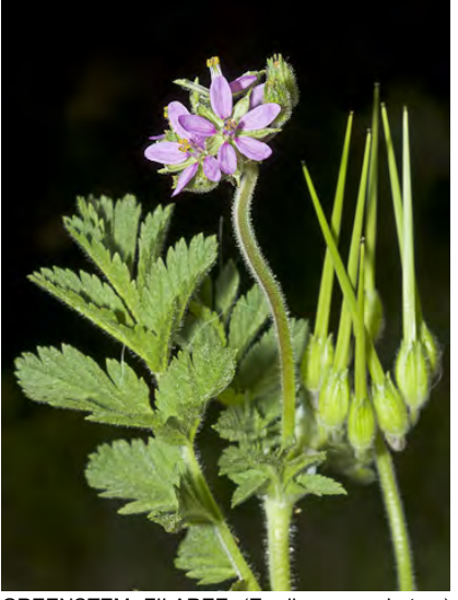
GREENSTEM FILAREE (Erodium moschatum) Naturalized Annual - Geranium Family -(Feb-Sep) - Open, disturbed sites - Stem 4-24", short-hairy. Leaves compound, leaflets toothed. Sepal tip glabrous. Petals 0.4-0.6" long, pink. Fruit beak 0.8-1.6" long.