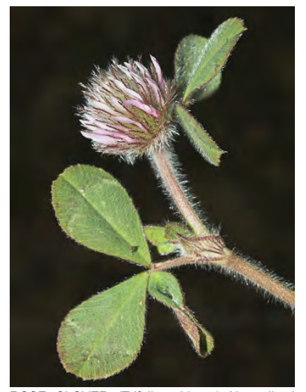
ROSE CLOVER (Trifolium hirtum) Naturalized Annual - Pea Family - (Apr–May) - Disturbed areas, roadsides - Head with 1-2 bract-like leaves immed below. Flowers pink, 0.4-0.6" long, densely-bristly in fruit. INVASIVE weed.