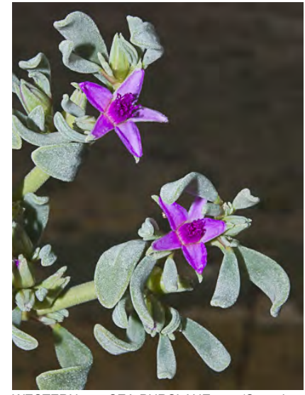
WESTERN SEA-PURSLANE (Sesuvium verrucosum) Native Perennial - Fig-marigold Family - (Apr-Nov) - Uncommon. Moist or seasonally dry flats, margins of generally saline wetlands - Flowers solitary, bright pink to reddish or orange, about 0.4" wide.