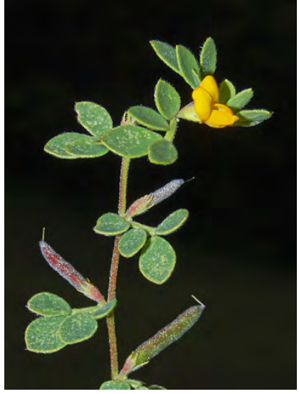
CALIFORNIA LOTUS (Acmispon wrangelianus) Native Annual - Pea Family - (Mar–Jun) -Abundant. Coastal bluffs, chaparral, disturbed areas - Low growing. Flowers yellow aging red, 0.2-0.4" long, almost stemless. Bract lobes same length as flower tube.