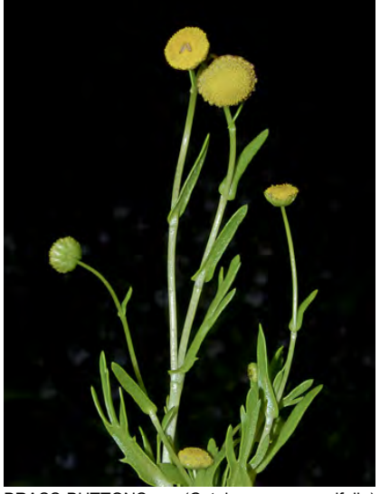
BRASS-BUTTONS (Cotula coronopifolia) Naturalized Perennial - Sunflower Family -(Mar–Dec) - Common. Saline and freshwater marshes, mud flats - Plant 2-16"+ tall, smooth, ± fleshy. Leaves linear to lance-shaped w/linear teeth or lobes. INVASIVE.