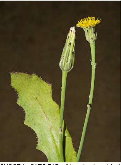
SMOOTH CAT'S-EAR (Hypochaeris glabra) Naturalized Annual - Sunflower Family -(Mar–Jun) - Common. Disturbed areas, grassland, open woodland - Plant 4-24" tall, smooth. Rays 0.2-0.3" long, barely > head bracts. Only inner fruit beaked. INVASIVE.