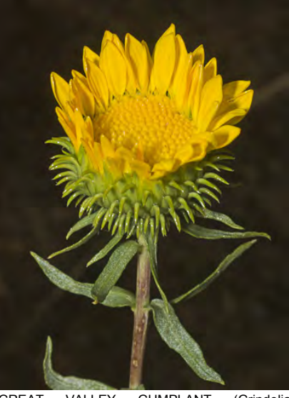
GREAT VALLEY GUMPLANT (Grindelia camporum) Native Perennial - Sunflower Family - (May–Nov) - Sandy or saline bottomland, roadsides - Stem non-woody, 2-8' tall, whitish. Leaves gen resinous. Head to 1.2" wide, bracts bend downward.