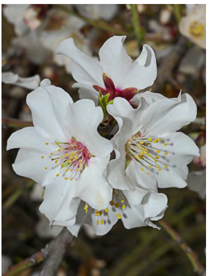
ALMOND (Prunus dulcis) Naturalized Perennial -Rose Family - (Feb–Mar) - Canyons, roadsides, grassland (as waif) - Tree 16-26' tall. Leaf blades 1-4" long. Flowers 1-3/cluster. Petals pink to nearly white, 0.5-1" long. Fruit 1-1.6" long, hairy. Cultivar.