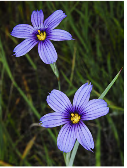
WESTERN BLUE-EYED-GRASS (Sisyrinchium bellum) Native Perennial - Iris Family - (Mar-May) - Common. Open, gen moist, grassy areas, woodland - Stem < 25" tall. Leaves iris-like. Petals 6, blue-purple with dark veins, 0.4-0.7" long.