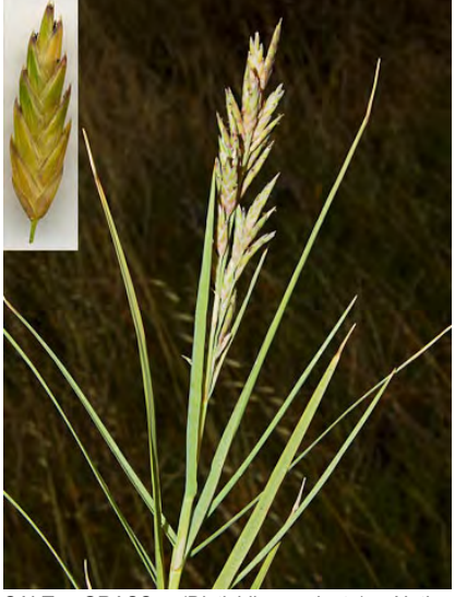
SALT GRASS (Distichlis spicata) Native Perennial - Grass Family - (Apr–Sep) - Salt marshes, coastal dunes, moist, alkaline areas -Stem 4-20" long. Leaves 0.8-4" long, flat, stiff. Flower cluster 0.8-3" long, narrow. Spikelets straw-colored to purple, 2-20/group, 0.24-0.8" long.