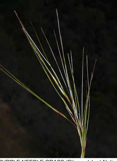
PURPLE NEEDLE GRASS (Stipa pulchra) Native Perennial - Grass Family - (Mar–Jun) - Oak woodland, chaparral, grassland - Stem 14-39" long. Leaf blade 4-8" long, Glumes 0.5-0.8" long, ~equal. Awn 1.6-4" long, last segment straight.