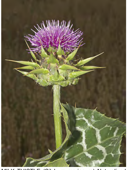
MILK THISTLE (Silybum marianum) Naturalized Annual-Biennial - Sunflower Family - (Feb–Jun) -Roadsides, pastures, disturbed areas - Stem 1-10, stout. Leaves spiny, shiny green w/white veins and spots. Flowers red-purple. INVASIVE weed.