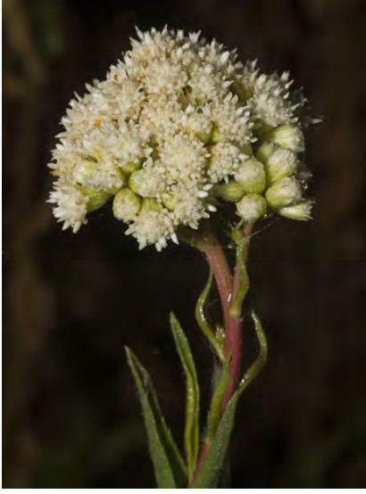
MARSH BACCHARIS (Baccharis glutinosa) Native Perennial - Sunflower Family - (Jul–Oct) -Coastal freshwater and saltwater marshes, streambanks - Plant herbaceous, sticky, 3-6' tall. Leaf blades lance-shaped, < 5" long, 0.5-1.2" wide.