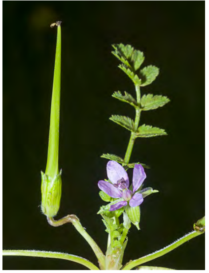
LONG-BEAKED FILAREE (Erodium botrys) Naturalized Annual - Geranium Family -(Mar-Jul) - Dry, open or disturbed sites - Stem 4-35" tall, coarse-hairy. Leaves lobed. Petals pink, 0.3-0.5" long. Sepals w/reddish tip. Fruit beak 2-4.7" long.