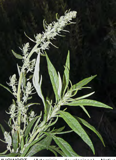
MUGWORT (Artemisia douglasiana) Native Perennial - Sunflower Family - (May–Nov) -Common. Open to shady areas, often in drainages - Plant 20-60" tall. Leaves gen 0.4-4" long, densely hairy below, some 3-5 lobed. Flower bracts hairy.