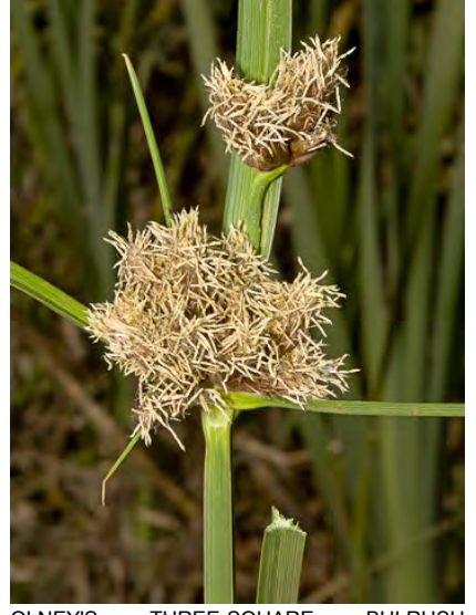
OLNEY'S THREE-SQUARE BULRUSH (Schoenoplectus americanus) Native Perennial -Sedge Family - (Summer) - Mineral-rich or brackish marshes, shores, fens, springs - Stem 1.2-8.2' tall, sharply 3-angled, not leafy. Flower cluster head-like.