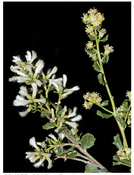
COYOTE BRUSH (Baccharis pilularis subsp. consanguinea) Native Perennial - Sunflower Family - (Jul-Dec) - Coastal bluffs, woodland, grassland, disturbed sites, occ on serpentine -Shrub < 15' tall, brittle, common. Leaves gen 0.6-1.6" long.