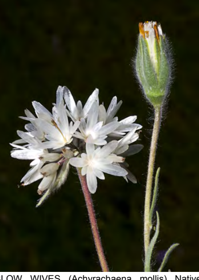
BLOW WIVES (Achyrachaena mollis) Native Annual - Sunflower Family - (Mar–Jun) -Common. Grassy sites, often clay soils - Plant 2-24" tall, soft-hairy. Flowers yellow turning red, 0.1-0.5" wide, extend < 0.1" beyond green bracts. Showy, flat scales attached to seeds.