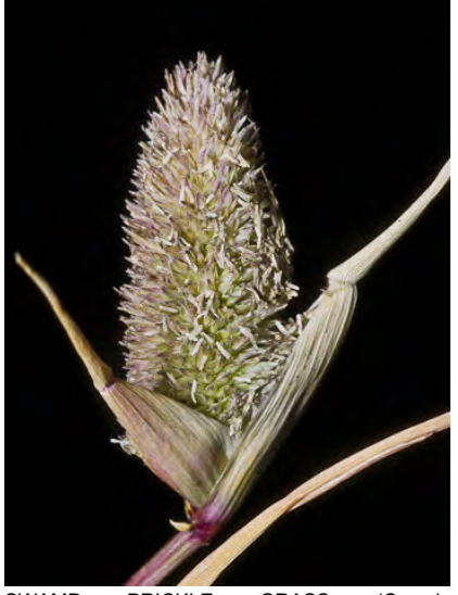
SWAMP PRICKLE GRASS (Crypsis schoenoides) Naturalized Annual - Grass Family - (Jun-Oct) - Wet places - Plant mat-like. Stem 2-30" long. Leaf blade 1-4" long. Flower cluster 0.1-3" long, 0.2-0.6" wide. Spikelet ~0.1" long.