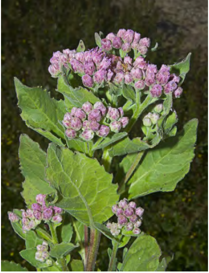
SALTMARSH-FLEABANE (Pluchea odorata var. odorata) Native Perennial - Sunflower Family - (Jun-Nov) - Moist, often saline valley bottoms - Plant 20-48"+, sticky. Leaves 1.6-4.7" long, egg-shaped. Flowers purple, ~0.2" long, in leaf axils.