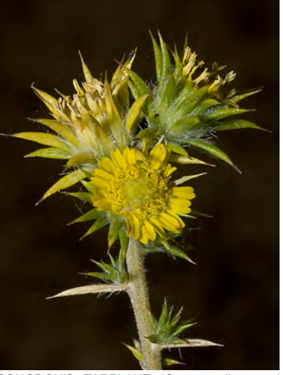
CONGDON'S TARPLANT (Centromadia parryi subsp. congdonii) Native Annual - Sunflower Family - (Jun-Oct) - Terraces, swales, floodplains, grassland, disturbed sites - Main plant not sticky or short-hairy. Spiny. CNPS: ENDANGERED.