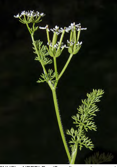
VENUS' NEEDLE (Scandix pecten-veneris) Naturalized Annual - Carrot Family - (Apr–Jun) -Grassy slopes, roadsides - Plant 6-20" tall. Leaf segments finely divided, linear. Flowers white, outer petals larger. Fruit 0.2-1" long with a beak 0.8-2.8" long.