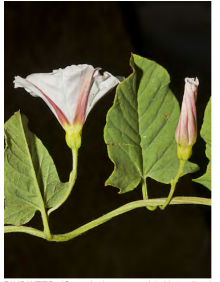
BINDWEED (Convolvulus arvensis) Naturalized Perennial - Morning-glory Family - (Mar–Oct) -Roadsides, open areas in many pl communities -Trailing. Leaf 0.8-1.2" long, w/round tip, pointed lobes. Flowers white to pink, 0.8-1" long. NOXIOUS.