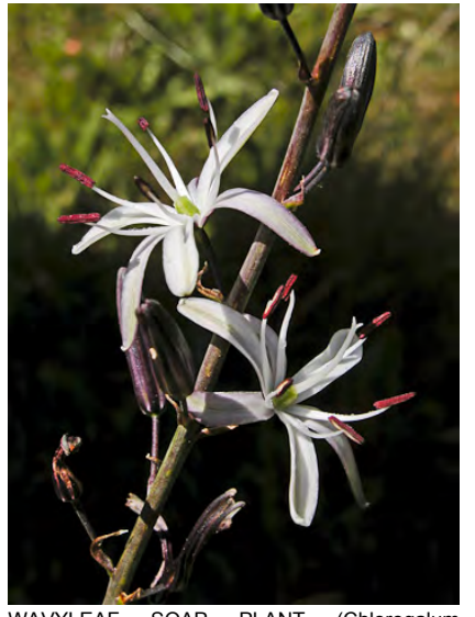
WAVYLEAF SOAP PLANT (Chlorogalum pomeridianum var. pomeridianum) Native Perennial - Century Plant Family - (May–Aug) - Common. Open grassland, chaparral, woodland - Plant 1-8' tall, flowers at night. Bulb juices lather in water.