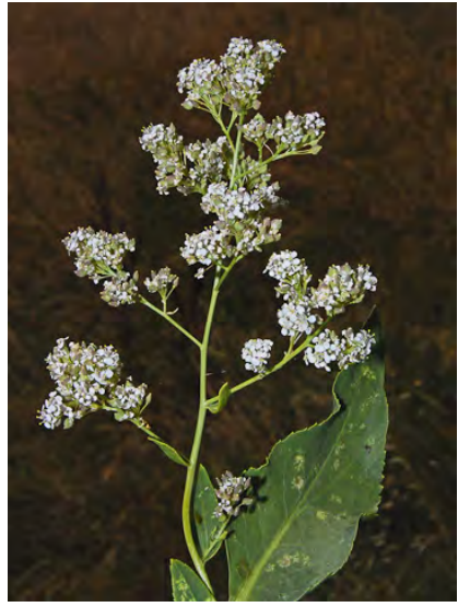
PERENNIAL PEPPERGRASS (Lepidium latifolium) Naturalized Perennial - Mustard Family - (Jun-Sep) - Pastures, disturbed areas, fields, grassland, saline meadows, streambanks, sagebrush scrub, edge of marshes - Plant 14-47". Petals white. NOXIOUS.