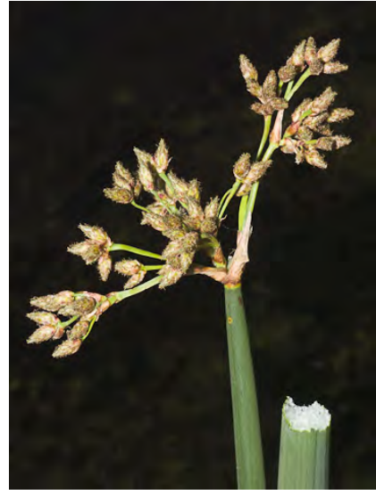
COMMON TULE (Schoenoplectus acutus var. occidentalis) Native Perennial - Sedge Family -(Summer) - Common. Marshes, shores, fens, shallow lakes, often emergent - Stem 3.3-13' tall, fat, round x-section, blue-green.