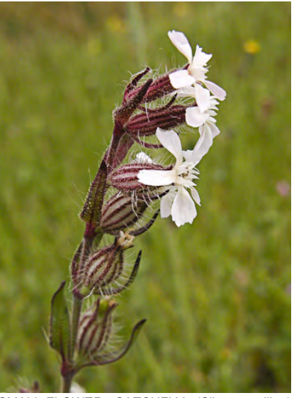
SMALL-FLOWER CATCHFLY (Silene gallica) Naturalized Annual - Pink Family - (Spring-early summer) - Fields, disturbed areas - Plant 4-16". Leaves < 1.4" long. Flower cluster short-hairy, bracts sticky-hairy, petal blade 0.2-0.5" long, smooth to notched, white to pink.