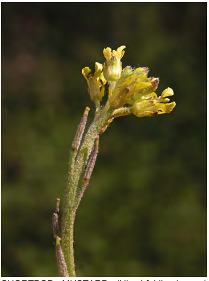
SHORTPOD MUSTARD (Hirschfeldia incana) Naturalized Biennial-Perennial - Mustard Family -(Apr–Oct) - Disturbed areas - Stem 16-60". Longest leaves 1.6-4" long, dense-hairy. Petals pale yellow, ~0.2" long. Fruit appressed. Fall-blooming. INVASIVE.