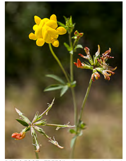
BIRD'S-FOOT TREFOIL (Lotus corniculatus) Naturalized Perennial - Pea Family - (Jun-Sep) -Open, disturbed areas - Leaflets 5, 0.16-0.9" long. Flower cluster 3-7 flowered on0.6-4.7" stalk. Flowers bright yellow, 0.4-0.55" long, banner often reddish.