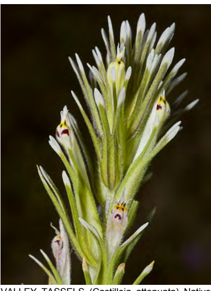
VALLEY TASSELS (Castilleja attenuata) Native Annual - Broom-rape Family - (Mar–May) -Grassland - Plant 4-20" tall, hairy, non-sticky. Leaves 0.8-3.1" long, narrow, 0-3 lobes. Flower cluster 1-12" long, narrow, tips white or pale yellow.