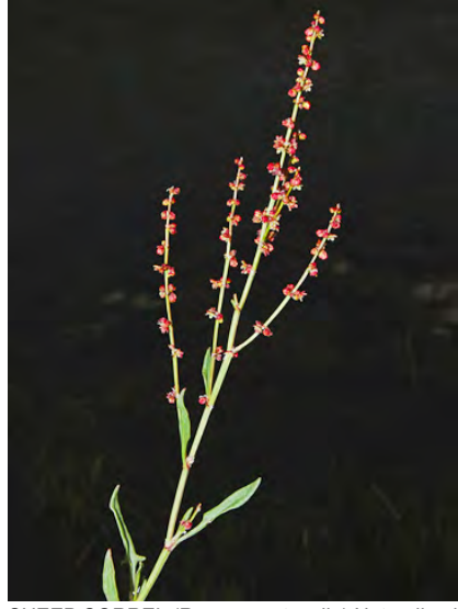
SHEEP SORREL (Rumex acetosella) Naturalized Perennial - Buckwheat Family - (Apr–Jul) - ± Disturbed, often acidic places - Stem < 16". Leaf gen basal, blade 0.8-2.4" long, lower arrowhead-shaped w/2 lobes. Flowers yellowish, turn reddish. INVASIVE.