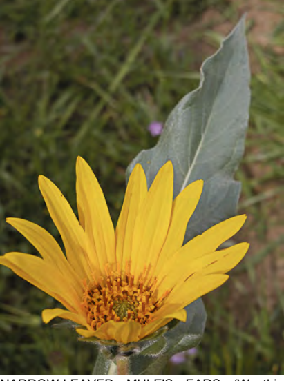
NARROW-LEAVED MULE'S EARS (Wyethia angustifolia) Native Perennial - Sunflower Family - (Apr-Aug) - Grassland - Plant 4-35" tall, rough-hairy. Leaves narrow, veins all similar, base blades 4-20" long. Ray flowers 0.6-1.8" long.