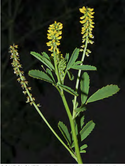
SOURCLOVER (Melilotus indicus) Naturalized Annual-Biennial - Pea Family - (Apr-Oct) - Open, disturbed areas - Stem 4-24" long. Leaflets 3, 0.4-1" long. Flowers yellow, ~0.1" long.