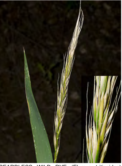
BEARDLESS WILD RYE (Elymus triticoides) Native Perennial - Grass Family - (Jun–Jul) - Dry to moist, often saline, meadows - Plant 18-50" tall, from rhizomes. Flower cluster 2-8" long. Spikelets generally 2/node. Lemmas 3-7, 0.2-0.5" long, awn to 0.12" long.