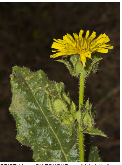
BRISTLY OX-TONGUE (Helminthotheca echioides) Naturalized Annual-Biennial -Sunflower Family - (All year) - Common. Disturbed areas - Stem 1-6.5' tall, bristly. Leaf 2-8" long, covered with prickly bumps. Flower heads 0.8-1.6" wide. INVASIVE weed.