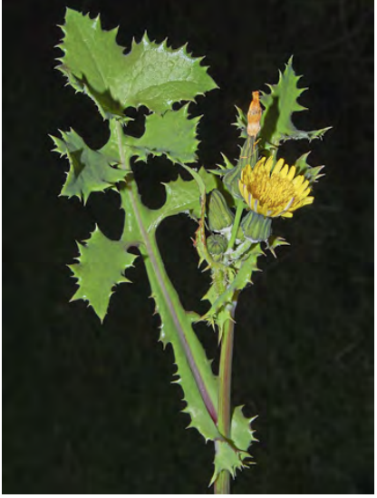
PRICKLY SOW THISTLE (Sonchus asper subsp. asper) Naturalized Annual - Sunflower Family -(All year) - Common. Slightly moist disturbed sites, along streams - Plant 4-48". Leaf teeth prickly. Basal lobes of upper leaves rounded, curving downward.