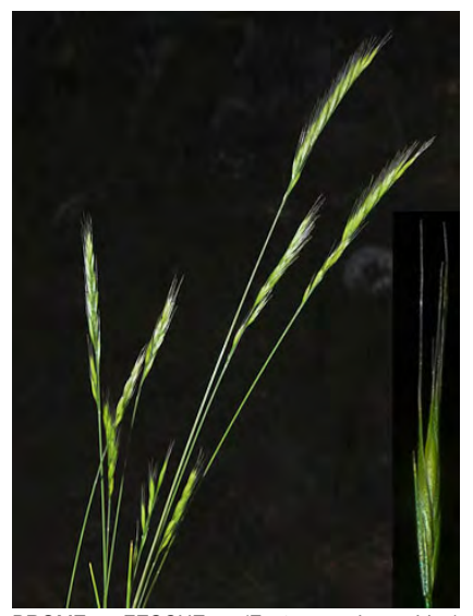
BROME FESCUE (Festuca bromoides) Naturalized Annual - Grass Family - (May–Jun) -Uncommon. Dry, disturbed places, coastal-sage scrub, chaparral - Stem < 20". Inflor 0.6-6" tall, dense, lower branches erect. Spikelet 0.2-0.4" long, awn 0.1-0.3" long.