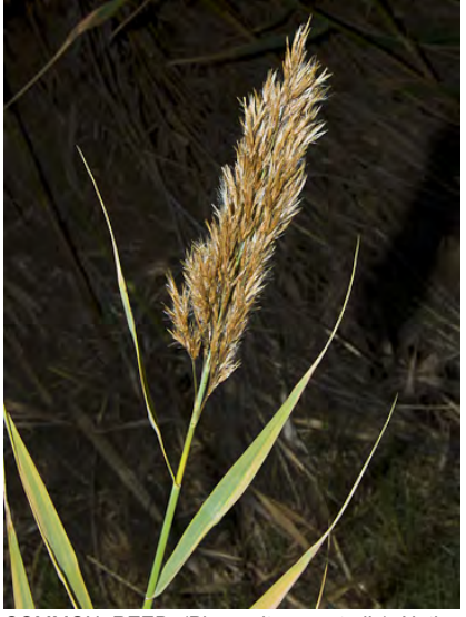
COMMON REED (Phragmites australis) Native Perennial - Grass Family - (Jul-Nov) - Pond & lake margins, sloughs, marshes - Stem 6.6-13', gen < 0.4" diam. Leaf blades gen 8-18" long, base gradually narrowed. Flower cluster 6-20". Spikelet 0.4-0.6", lemmas smooth.