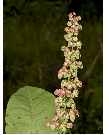
CURLY DOCK (Rumex crispus) Naturalized Perennial - Buckwheat Family - (All year) -Abundant. Disturbed places - Stem 16-39" tall. Flower cluster dense, valves 0.2-0.24", winged around tubercles, smooth edged. 1 tubercle enlarged. INVASIVE.