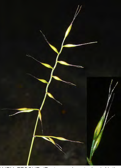
HAIRY FESCUE (Festuca microstachys) Native Annual - Grass Family - (Apr-Jun) - Disturbed, open, gen sandy soils - Stem 6-29". Spikelet 0.2-0.4" long, awn 0.1-0.5" long. Glumes & lemma smooth or hairy.