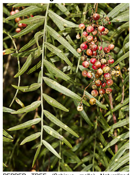
PEPPER TREE (Schinus molle) Naturalized Perennial - Sumac Family - (Jun-Aug) - Washes, slopes, abandoned fields - Tree 16-60' tall. Flowers white to yellow. Leaves compound, leaflets stemless. Fruits pink to red, 0.2-0.3" diam.