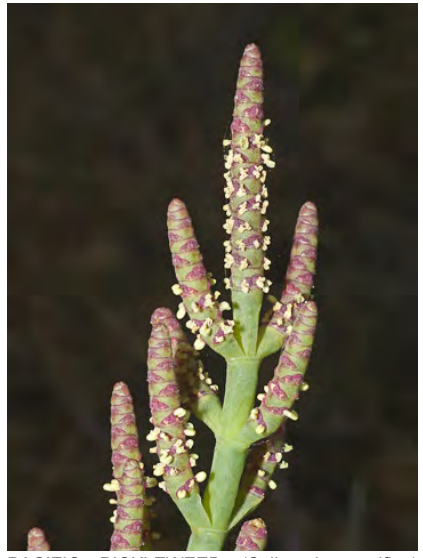
PACIFIC PICKLEWEED (Salicornia pacifica) Native Perennial - Goosefoot Family - (Jul–Nov) -Salt marshes, alkaline flats - Plant 4-28" tall, branching from base, branches opposite. Flower clusters 0.8-3.3" long, 0.1-0.2" wide.