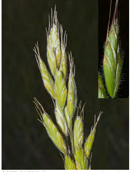
SOFT CHESS (Bromus hordeaceus) Naturalized Annual - Grass Family - (Apr-Jul) - Fields, disturbed areas - Plant 4-26" tall. Leaf hairy. Flower cluster 1-5" long, dense, some stalks > spikelet. Spikelet 0.5-0.9". Lemma 0.26-0.4", awn 0.16-0.4". INVASIVE weed.