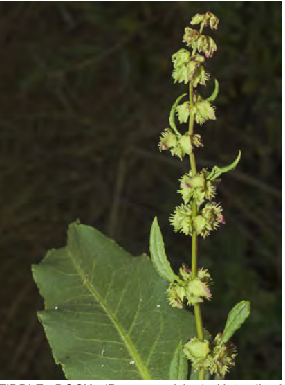
FIDDLE DOCK (Rumex pulcher) Naturalized Perennial - Buckwheat Family - (May–Sep) -Disturbed places, meadows, moist or dry habitats - Stem 8-24" long, branches widely spreading. Leaf blades 1.6-4" long, 1.2-2" wide. Valves w/2-5 teeth.