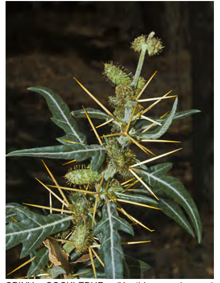
SPINY COCKLEBUR (Xanthium spinosum) Native Annual - Sunflower Family - (Jul–Oct) -Disturbed, seasonally wet, often alkaline sites, in grassland, marshes, watercourses - Plant 4-24". Stem node spines 0.6-1.2" long, golden, gen 3-lobed. Bur 0.4-0.5" long.