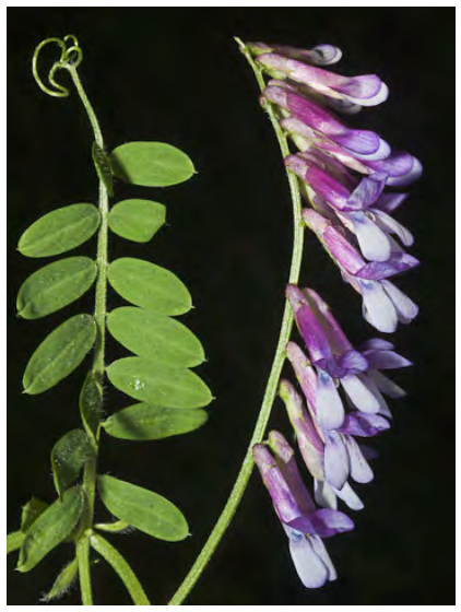
SPARSELY HAIRY VETCH (Vicia villosa subsp. varia) Naturalized Annual-Biennial - Pea Family - (Mar-Jun) - Grassland, roadside, disturbed areas - Stems w/few hairs. Flowers 10-20, blue-purple to white, 0.4-0.55" long. Lower bract lobes 0.04-0.1" long.