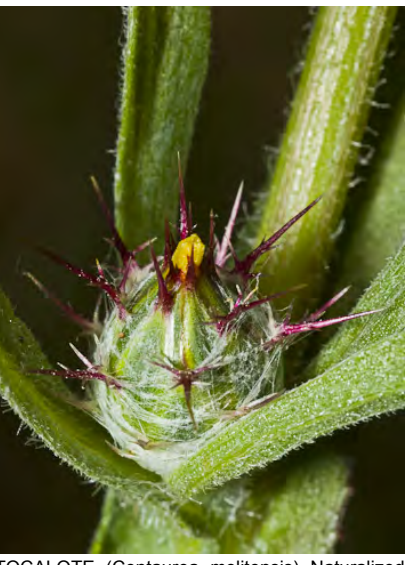
TOCALOTE (Centaurea melitensis) Naturalized Annual - Sunflower Family - (Apr–Jul) - Disturbed fields, open woodland - Plant 4-39", gray-hairy, resinous. Leaves 0.8-6" long. Flowers yellow, 0.4-0.8" long, bracts tipped w/purple spines. NOXIOUS weed.