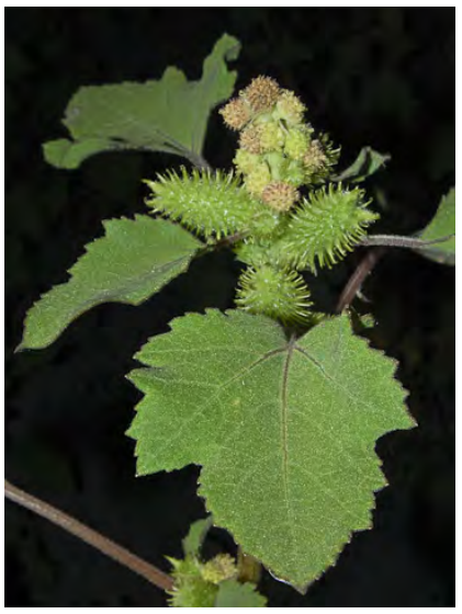
COCKLEBUR (Xanthium strumarium) Native Annual - Sunflower Family - (Jul-Oct) -Disturbed, seasonally wet, often alkaline sites, in grassland, marshes, watercourses - Plant 4-32" tall. Stem spineless. Bur 0.4-1.2"+ long.