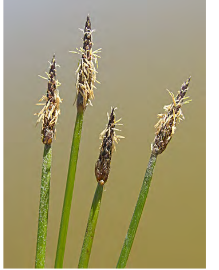
COMMON SPIKERUSH (Eleocharis macrostachya) Native Perennial - Sedge Family -(Spring-summer) - Common. Fresh to brackish wetland - Stem 8-39" tall, 0.06-0.1" wide. Spikelet 0.2-1.6" long, 0.08-0.2" wide, style 2-branched.