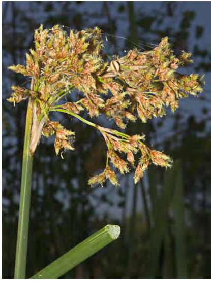
SOUTHERN BULRUSH (Schoenoplectus californicus) Native Perennial - Sedge Family - (Spring-summer) - Common. Brackish to fresh marshes, shores - Stem 3.3-13' tall, slender, bright green, bluntly 3-angled. Flower cluster somewhat open.