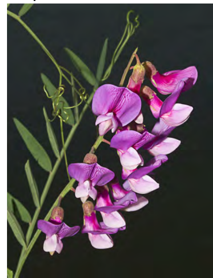
DELTA TULE PEA (Lathyrus jepsonii var. jepsonii) Native Perennial - Pea Family -(Apr–Aug) - Coastal, estuarine marshes - Plant < 8' tall, smooth. Stem climbing, winged. Flowers 0.6-0.8" long, pink to pink-purple. CNPS: FAIRLY ENDANGERED.