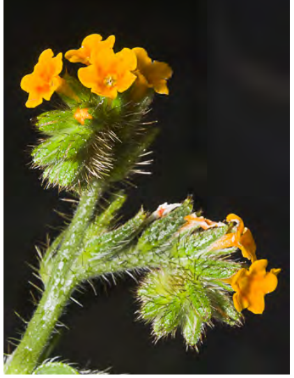
COMMON FIDDLENECK (Amsinckia intermedia) Native Annual - Borage Family - (Mar-Jun) -Abundant. Open, generally disturbed places -Plant 0.5-3' tall. Flowers orange with 5 red spots, 0.3-0.4" long, 0.2-0.4" wide, tube straight.