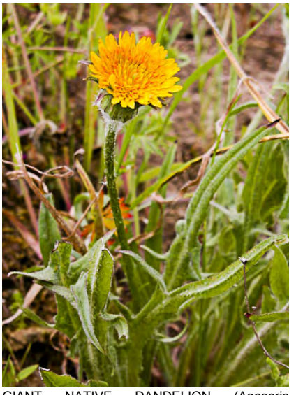
GIANT NATIVE DANDELION (Agoseris grandiflora var. grandiflora) Native Perennial -Sunflower Family - (Apr–Jul) - Grassland, scrub, woodland - Plant 10-40". Leaf lobes point up. Flower rosy-purple, variable-sized bracts. Seed tapers to beak > 2x body length. Leaf lobes point upward.