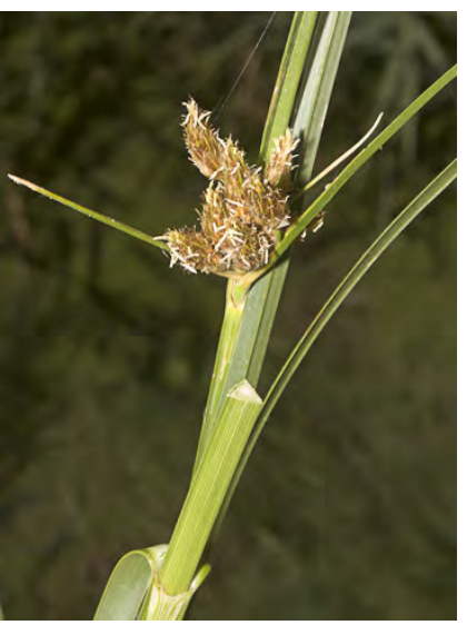
SEACOAST BULRUSH (Bolboschoenus robustus) Native Perennial - Sedge Family -(Summer) - Brackish to saline coastal marshes -Plant 20-60" tall. Stem sharply triangular. Flower cluster dense, stemless, just above bracts. Spikelets 5-25, 0.4-1.2" long.