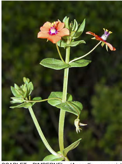
SCARLET PIMPERNEL (Anagallis arvensis) Naturalized Annual - Myrsine Family - (Mar–May) - Common. Disturbed places, ocean beaches -Plants 2-16" tall. Flowers 0.2-0.3" long, salmon or occasionally blue. Leaves TOXIC, can cause dermititis.