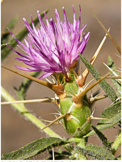
PURPLE STAR-THISTLE (Centaurea calcitrapa) Naturalized Annual-Biennial - Sunflower Family -(Apr-Nov) - Pastures, disturbed places - Plant 8-40"+. Basal leaves 1-2x divided into narrow lobes. Flowers purple with spiny bracts. NOXIOUS weed.