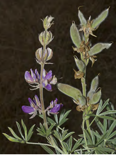
SUMMER LUPINE (Lupinus formosus var. formosus) Native Perennial - Pea Family -(Apr-Sep) - Dry clay soils, grassland, open areas under pines, gen in valleys - Plant 8-32", low growing. Leaves hairy. Flowers purple, hairless, summer/fall blooming.