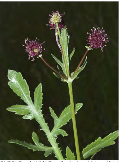
PURPLE SANICLE (Sanicula bipinnatifida) Native Perennial - Carrot Family - (Mar–May) -Open grassland, gen on serpentine, or pine/oak woodland - Plant 5-24" tall. Leaves 1.6-7.5" long, 1-2x divided on a winged central axis. Flowers dark purple. Fruits prickly.