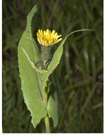
COMMON SOW THISTLE (Sonchus oleraceus) Naturalized Annual - Sunflower Family - (All year) - Abundant. Disturbed places - Plant 4-55" tall. Leaf teeth soft to touch. Basal lobes of upper leaves sharply pointed, straight to curving upward.