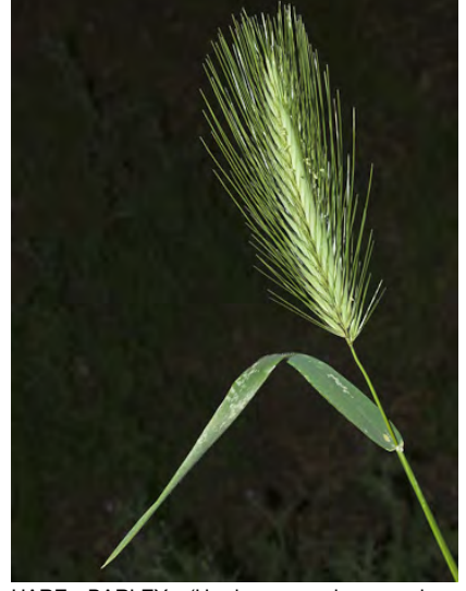
HARE BARLEY (Hordeum murinum subsp. leporinum) Naturalized Annual - Grass Family -(Feb-May) - Moist, gen disturbed sites. Common - Stem 12-43" tall. Central spikelet stalk ~0.06" long. Central floret << lateral florets. INVASIVE weed.