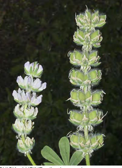
CHICK LUPINE (Lupinus microcarpus var. microcarpus) Native Annual - Pea Family -(Mar–Jun) - Abundant. Open or disturbed areas, occ seeded on roadbanks - Plant 4-32", hairy. Leaves smooth above. Flowers gen pink to purple. Flower bracts shaggy.