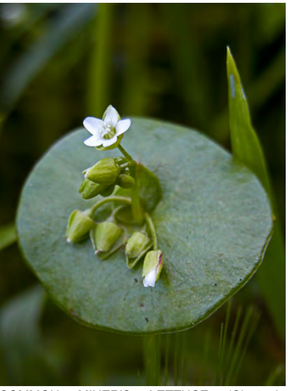
COMMON MINER'S LETTUCE (Claytonia perfoliata subsp. perfoliata) Native Annual -Miner's Lettuce Family - (Jan–May) - Vernally moist, often shady or disturbed sites - Basal leaf length <3x width. Stem leaf gen not angled. Seeds shiny w/large appendage.