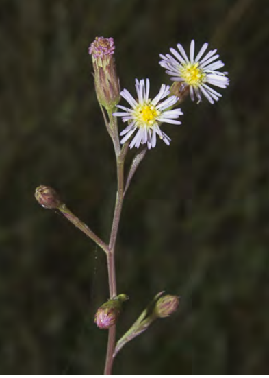
ANNUAL SALTMARSH ASTER (Symphyotrichum subulatum var. parviflorum) Native Annual - Sunflower Family - (Jul–Oct) -Marshes, disturbed places - Heads white to pink, solitary, in leaf axils and stem ends, <50 rays. Flower head bracts sharp-tipped.