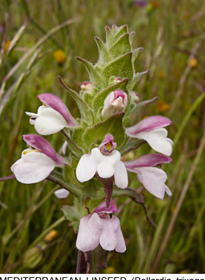
MEDITERRANEAN LINSEED (Bellardia trixago) Naturalized Annual - Broom-rape Family -(Apr-Jun) - Disturbed grassland. - Plant sticky-hairy. Stem 6-32" tall. Leaves lance-shaped, toothed. Flowers 0.8-1" long, 2-lipped: upper lip pink, lower lip white. INVASIVE.