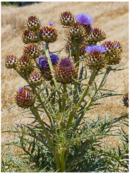
ARTICHOKE THISTLE (Cynara cardunculus subsp. flavescens) Naturalized Perennial -Sunflower Family - (Apr–Jul) - Disturbed places -Plant 1.6-8' tall. Artichoke head 1.6-6" diam, spine-tipped. Flowers blue or purple, 1.2-2" long. NOXIOUS weed.