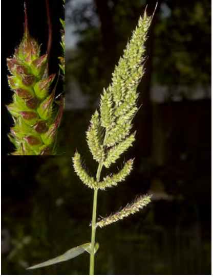
BARNYARD GRASS (Echinochloa crus-galli) Naturalized Annual - Grass Family - (Jun–Oct) -Gen wet, disturbed sites, fields, roadsides - Stem 12-39" long, Leaf blades to 25" long, 0.2-1.2" wide. Spikelet 0.1-0.16" long, floret ~0.14" long, 1 per node. Awns 0-2" long on same plant.