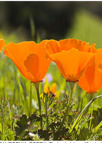
CALIFORNIA POPPY (Eschscholzia californica) Native Perennial - Poppy Family - (Feb–Sep) -Grassy, open areas - Plant 2-24" tall. Flower w/spreading rim <= 0.2". Petals 0.8-2.4" long, early spring = large and orange, fall = smaller and yellow.