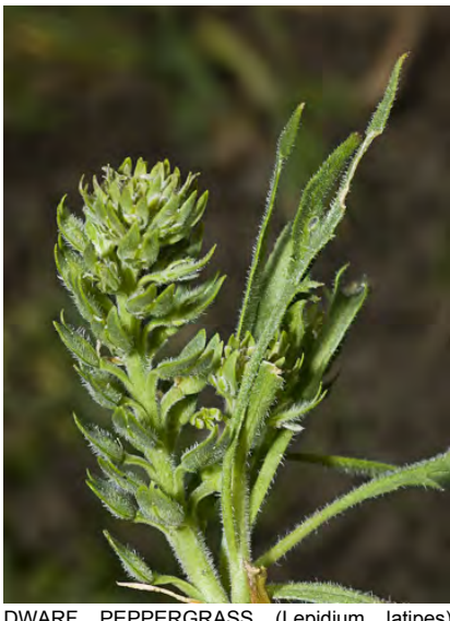
DWARF PEPPERGRASS (Lepidium latipes) Native Annual - Mustard Family - (Mar–Jun) -Alkaline soils, vernal pool margins, salt marsh edges, pastures - Stem 0.8-6" long. Leaves 0.8-4" long. Flower cluster distinctly compacted.