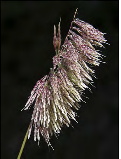
GOLDENTOP (Lamarckia aurea) Naturalized Annual - Grass Family - (Feb-May) - Open ground, moist seeps, rocky hillsides, sandy soil - Stem 2.8-16" long. Flower cluster golden-yellow to purple, dense, 1-sided, 0.8-3.1" long. Fertile flower awns ~0.25" long.