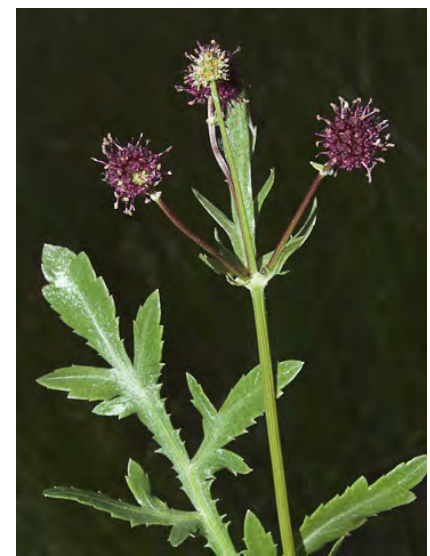
PURPLE SANICLE (Sanicula bipinnatifida) Native Perennial - Carrot Family - (Mar–May) -Open grassland, gen on serpentine, or pine/oak woodland - Plant 5-24" tall. Leaves 1.6-7.5" long, 1-2x divided on a winged central axis. Flowers dark purple. Fruits prickly.