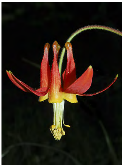
CRIMSON COLUMBINE (Aquilegia formosa) Native Perennial - Buttercup Family - (Apr-Sep) -Streambanks, seeps, moist places, chaparral, oak woodland, mixed-evergreen or conifer forests - Flowers about 2" long, yellow with red sepals &