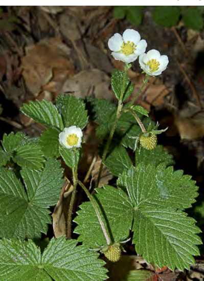
WOOD STRAWBERRY (Fragaria vesca) Native Perennial - Rose Family - (Jan–Jul) - Gen partial shade in forest - Stem gen 1.2-6" long. Leaflets 3, thin. Central leaflet gen w/12-21 teeth. Flower white, gen 0.6" wide, often above leaves. Fruit a strawberry.