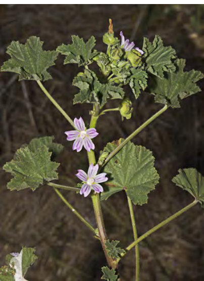
BULL MALLOW (Malva nicaeensis) Naturalized Annual - Mallow Family - (Mar–Jun) - Disturbed places - Stem 0.7-2'. Leaf blade 1.2-4.7" wide, 5-7 shallow lobes. Bractlets egg-shaped,0.16-0.2" long. Petals pink to blue-violet, 0.2-0.5" long.