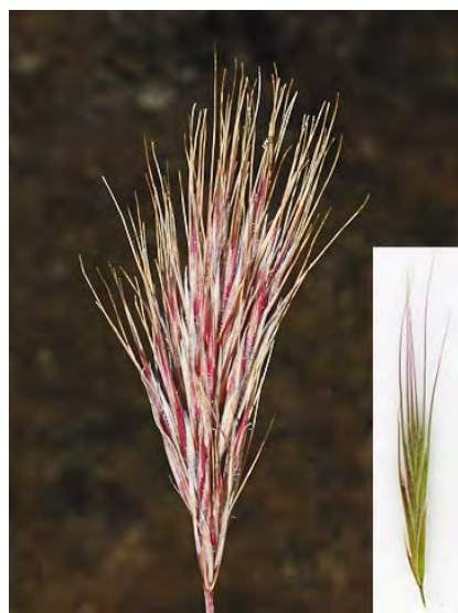
RED BROME (Bromus madritensis subsp. rubens) Naturalized Annual - Grass Family - (Mar–Jun) - Disturbed areas, roadsides - Plant 4-20". Flower cluster condensed, branches obscure, < spikelets. Stem & sheathes hairy. INVASIVE weed.