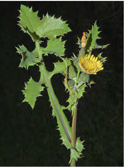
PRICKLY SOW THISTLE (Sonchus asper subsp. asper) Naturalized Annual - Sunflower Family - (All year) - Common. Slightly moist disturbed sites, along streams - Plant 4-48". Leaf teeth prickly. Basal lobes of upper leaves rounded, curving downward.