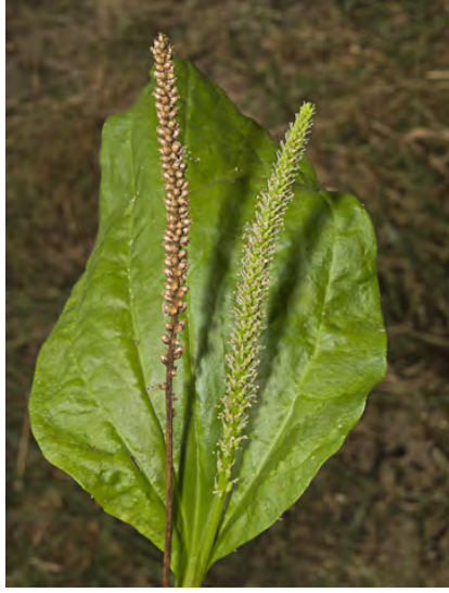
COMMON PLANTAIN (Plantago major) Naturalized Annual-Perennial - Plantain Family -Apr-Sep) - Disturbed areas - Leaves basal, blades 5-18 cm long, broadly oval, not hairy. Flowers + stem 2-24" tall, flower cluster gen 1.2-8" long.