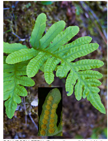
POLYPODY FERN (Polypodium calirhiza) Native Perennial - Polypody Family - - - On plants, rocky cliffs or outcrops, roadcuts, often granitic or volcanic, rarely dunes - Leaf blades 4-8" long, often widest above base, deeply lobed.