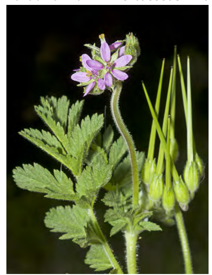
GREENSTEM FILAREE (Erodium moschatum) Naturalized Annual - Geranium Family -(Feb-Sep) - Open, disturbed sites - Stem 4-24", short-hairy. Leaves compound, leaflets toothed. Sepal tip glabrous. Petals 0.4-0.6" long, pink. Fruit beak 0.8-1.6" long.