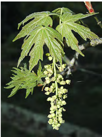
BIG-LEAF MAPLE (Acer macrophyllum) Native Perennial - Soapberry Family - (Mar-Jun) -Common. Streambanks, canyons - Tree < 100'. Leaves 5-lobed, 3-6" long, 4-10" wide. Group of 20-90 hanging flowers appear after leaves. Winged seeds.