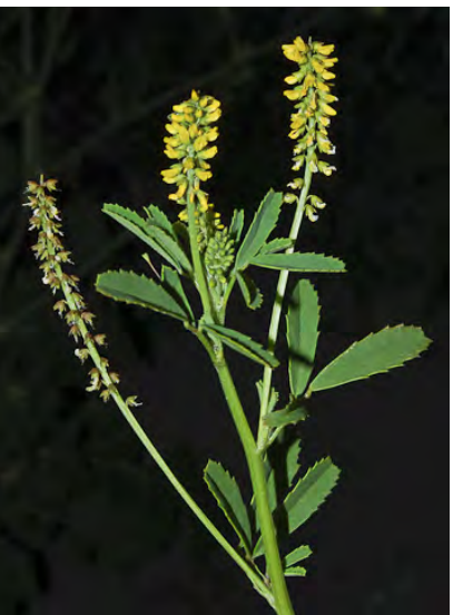
SOURCLOVER (Melilotus indicus) Naturalized Annual-Biennial - Pea Family - (Apr–Oct) - Open, disturbed areas - Stem 4-24" long. Leaflets 3, 0.4-1" long. Flowers yellow, ~0.1" long.