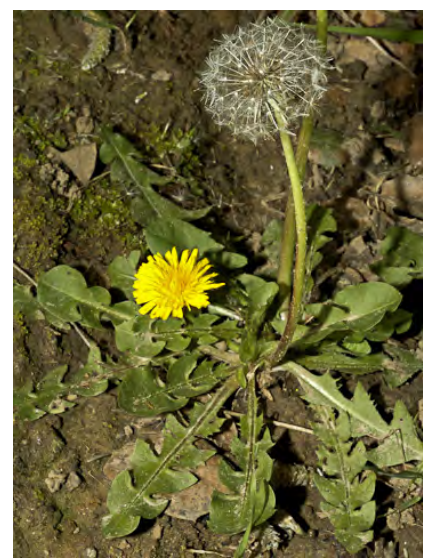
COMMON DANDELION (Taraxacum officinale) Naturalized Biennial-Perennial - Sunflower Family - (All year) - Abundant. Esp disturbed areas - Stem hollow. Leaves bright green with sharp down-pointing lobes. Outer head bracts reflexed. Fruit ~ brown.