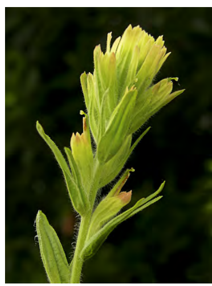
SEASIDE / COASTAL PAINTBRUSH (Castilleja wightii) Native Perennial - Broom-rape Family - (Mar-Aug) - Coastal scrub - Plant 12-32" tall, sticky, short-hairy. Leaves crowded, 0.8-2.4" long. Flower cluster yellowish (bright red to yellow).