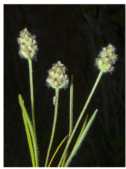
CALIFORNIA DWARF PLANTAIN (Plantago erecta) Native Annual - Plantain Family - (Mar–May) - Sandy, clay, serpentine soil; grassy slopes, flats, open woodland - Leaf 1.2-5" long, linear, hairy. Flowers + stem 1.2-12" tall, cluster 0.2-1.2" long.