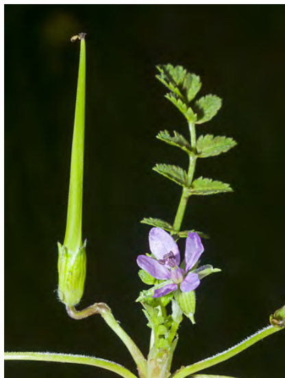
LONG-BEAKED FILAREE (Erodium botrys) Naturalized Annual - Geranium Family -(Mar-Jul) - Dry, open or disturbed sites - Stem 4-35" tall, coarse-hairy. Leaves lobed. Petals pink, 0.3-0.5" long. Sepals w/reddish tip. Fruit beak 2-4.7" long.