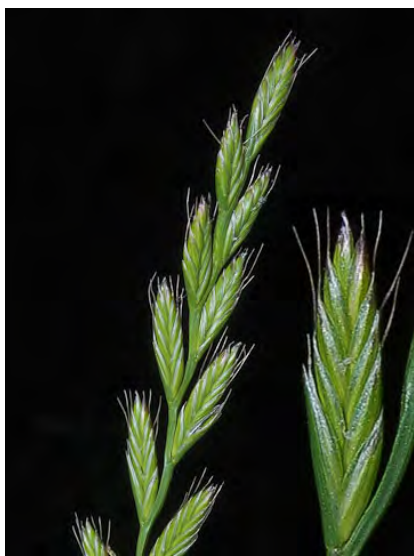
RYE GRASS (Festuca perennis) Naturalized Perennial - Grass Family - (May-Sep) - Dry to moist disturbed sites, abandoned fields - Stem 20-40" tall. Spikelet 0.2-0.9" long, > glume, awned or awnless. Sterile shoots at base. INVASIVE weed.