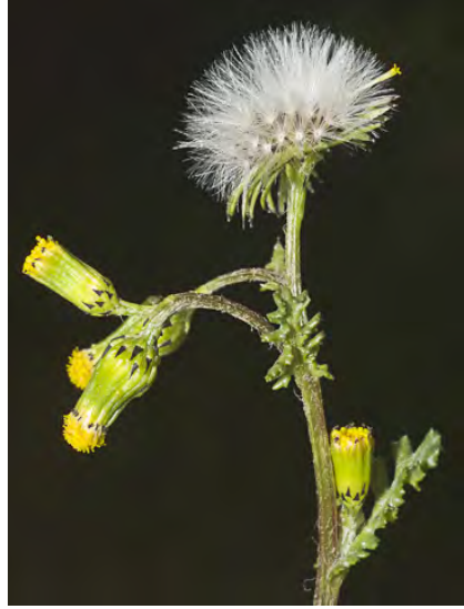
COMMON GROUNDSEL (Senecio vulgaris) Naturalized Annual - Sunflower Family -(Feb-Jul) - Common. Disturbed areas - Plant 4-24" tall, not hairy, w/1-10+ stems. Flower head bracts with black-tips. Milky sap.