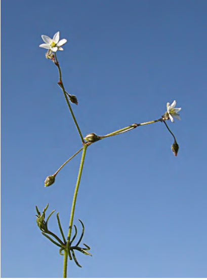
STICKWORT (Spergula arvensis) Naturalized Annual - Pink Family - (Spring-early summer) - Open slopes, pine woodland, sand dunes, fields, disturbed areas - Stem 4-16"+. Leaves 0.4-2" long, linear, in whorls.