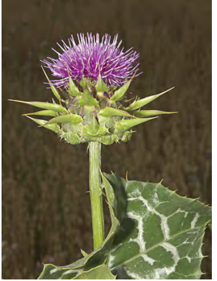
MILK THISTLE (Silybum marianum) Naturalized Annual-Biennial - Sunflower Family - (Feb–Jun) - Roadsides, pastures, disturbed areas - Stem 1-10', stout. Leaves spiny, shiny green w/white veins and spots. Flowers red-purple. INVASIVE weed.