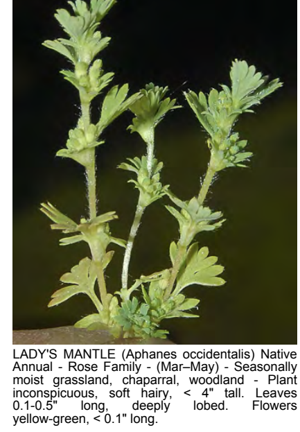
moist grassland, chaparral, woodland - Plant inconspicuous, soft hairy, < 4" tall. Leaves 0.1-0.5" long, deeply lobed. Flowers yellow-green, < 0.1" long.