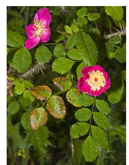
WOOD ROSE (Rosa gymnocarpa var. gymnocarpa) Native Perennial - Rose Family - ((Feb)Apr-Jul) - Common. Gen in shade of forest, scrub - Shrub w/straight thorns. Flowers gen solitary, stalks sticky, fruit smooth, sepals deciduous.