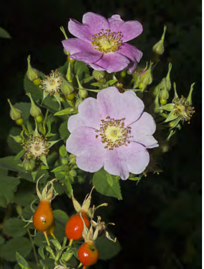
CALIFORNIA ROSE (Rosa californica) Native Perennial - Rose Family - (Feb-Nov) - Gen ± moist areas in sun, esp streambanks - Shrub 2.6-8.2' tall w/thick curved spines, forming thickets. Petals pink, 0.6-1" long; sepals unlobed.