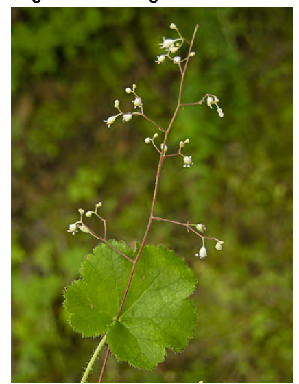
SMALL-FLOWER ALUMROOT (Heuchera micrantha) Native Perennial - Saxifrage Family - (Apr-Jul) - Moist, rocky banks and cliffs - Plant 4-40" tall. Leaf blade 0.8-4.7" long, 5-7 lobed, generally hairy. Petals white, ~ 0.1" long.