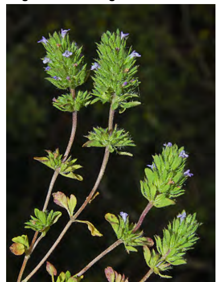
THYMELEAF BEARDSTYLE (Pogogyne serpylloides) Native Annual - Mint Family - (Mar–Jun) - Grassy, brushy areas - Plant inconspicuous. Stem 1-8" long, low-growing. Flowers 0.1-0.2" long, lavender, in dense clusters.