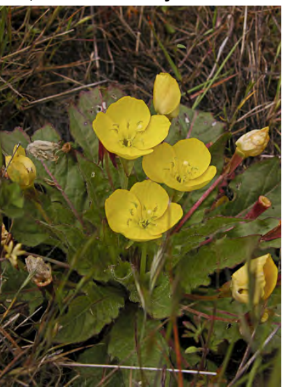
GOLDEN EGGS SUNCUP (Taraxia ovata) Native Perennial - Evening Primrose Family - (Mar–Jun) - Grassy fields, gen clay soil - Stemless. Leaf blade oval, 1.2-6" long w/long stalks. Flower stalks leafless. Petals yellow, 0.3-0.9" long. Ovary hidden.