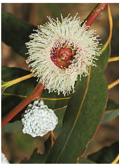
BLUE GUM (Eucalyptus globulus) Naturalized Perennial - Myrtle Family - (Oct-Jan) - Common. Disturbed areas - Tree < 200' tall. Flowers single, large, gen stemless. Leaves 4-12" long, 1-1.6" wide; used medicinally by Aboriginals. INVASIVE