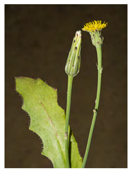
SMOOTH CAT'S-EAR (Hypochaeris glabra) Naturalized Annual - Sunflower Family - (Mar-Jun) - Common. Disturbed areas, grassland, open woodland - Plant 4-24" tall, smooth. Rays 0.2-0.3" long, barely > head bracts. Only inner fruit beaked. INVASIVE.