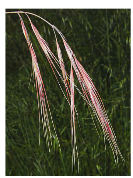
RIPGUT GRASS (Bromus diandrus) Naturalized Annual - Grass Family - (Apr-Jul) - Open, gen disturbed areas - Plant 6-40" tall. Spikelet 1-2.8" long. Lemma body 0.8-1.2" long, awn > 1.2" long. Barbed seeds can stick in flesh of animals. INVASIVE weed.