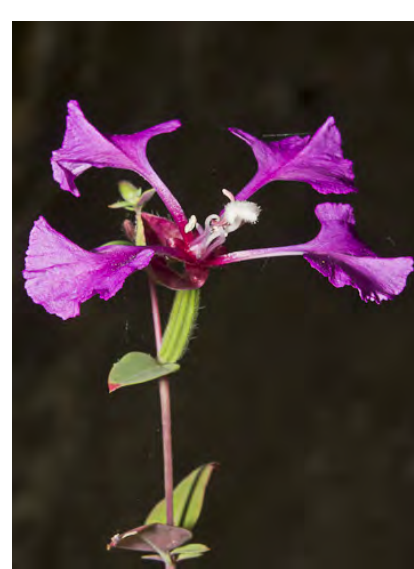
ELEGANT CLARKIA (Clarkia unguiculata) Native Annual - Evening Primrose Family - (Apr–Sep) -Common. Woodland - Buds nodding. Axis erect. Petals 0.4-1" long, pink to dark-red, clawed. Sepals united; sepals & ovary w/spreading hairs