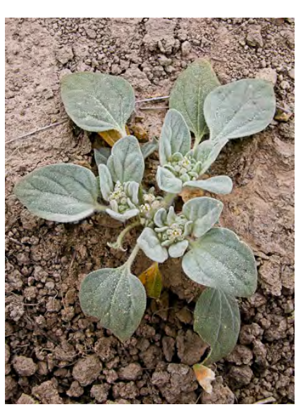
TURKEY-MULLEIN (Croton setigerus) Native Annual - Spurge Family - (May-Oct) - Dry, open, often disturbed areas - Plant < 8" tall, moundlike, covered w/long stiff hairs. Leaf blade 0.4-2" long, oval. TOXIC to livestock.