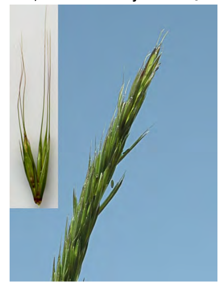
WESTERN WILD-RYE (Elymus glaucus subsp. glaucus) Native Perennial - Grass Family - (Jun-Aug) - Open areas, chaparral, woodland, forest - Tufted. Stem 12-55" tall. Leaf 0.2-0.5" wide, flat. Spikelets0.3-0.6" long, 2-4 per node. Lemma awn 0.4-1.2" long.