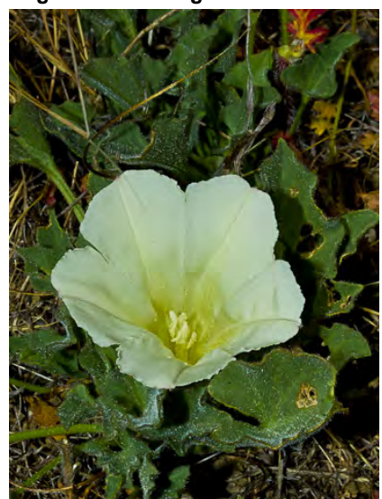
SHORTSTEM MORNING-GLORY (Calystegia subacaulis subsp. subacaulis) Native Perennial - Morning-glory Family - (Apr–Jun) - Dry, open scrub or woodland - Stem gen ~0.8" long. Flowers 1.3-2.4" long, white or cream. Bractlets concealing flower bracts.