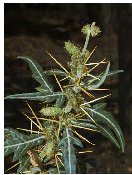
SPINY COCKLEBUR (Xanthium spinosum) Native Annual - Sunflower Family - (Jul-Oct) -Disturbed, seasonally wet, often alkaline sites, in grassland, marshes, watercourses - Plant 4-24". Stem node spines 0.6-1.2" long, golden, gen 3-lobed. Bur 0.4-0.5" long.