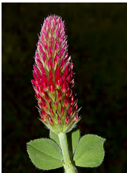
CRIMSON CLOVER (Trifolium incarnatum) Naturalized Annual - Pea Family - (May–Aug) - Uncommon. Disturbed areas - Hairy. Leaflets 0.6-0.8" long, wedge-shaped. Flower cluster 0.8-2.4" long, cylindrical. Flowers crimson or white, 0.4-0.6" long.