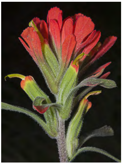
WOOLLY PAINTBRUSH (Castilleja foliolosa) Native Perennial - Broom-rape Family -(Mar–Jun) - Dry, open, rocky slopes, edges of chaparral - Plant 1-2' tall, base slightly woody, much branched, woolly. Flower cluster orange-red (occas. yellow-green).