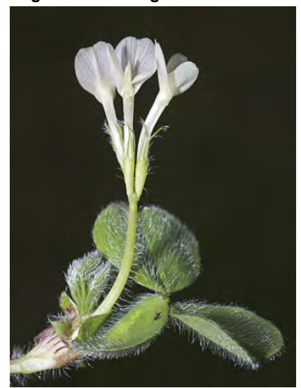
SUBTERRANEAN CLOVER (Trifolium subterraneum) Naturalized Annual - Pea Family - (Mar-Apr) - Meadows, roadsides, disturbed areas - Plant hairy, creeping. Leaflets 0.4-0.6" long. Head 0.4" wide. Flowers white, 0.3-0.55" long, fruit in a bur.