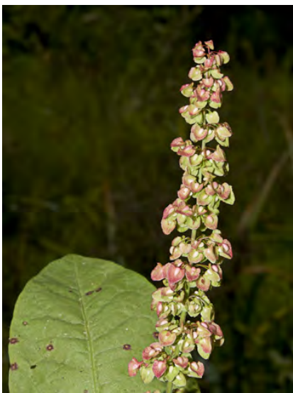
CURLY DOCK (Rumex crispus) Naturalized Perennial - Buckwheat Family - (All year) - Abundant. Disturbed places - Stem 16-39" tall. Flower cluster dense, valves 0.2-0.24", winged around tubercles, smooth edged. 1 tubercle enlarged. INVASIVE.