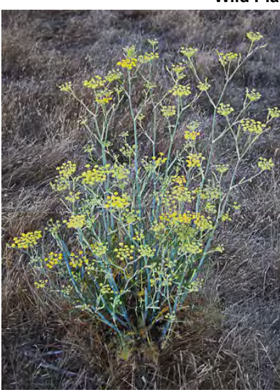
FENNEL (Foeniculum vulgare) Naturalized Perennial - Carrot Family - (May–Sep) - Roadsides, disturbed sites - Plants 3-6.5' tall, anise-scented. Stems waxy-blue, canelike. Flowers yellow. Leaf segments thread-like, edible when young. INVASIVE weed.