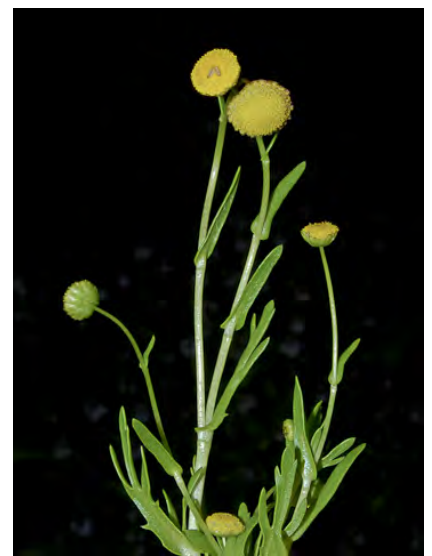
BRASS-BUTTONS (Cotula coronopifolia) Naturalized Perennial - Sunflower Family -(Mar-Dec) - Common. Saline and freshwater marshes, mud flats - Plant 2-16"+ tall, smooth, ± fleshy. Leaves linear to lance-shaped w/linear teeth or lobes. INVASIVE.