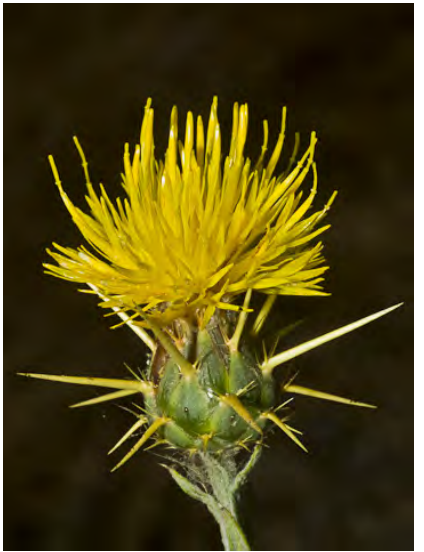
YELLOW STAR-THISTLE (Centaurea solstitialis) Naturalized Annual - Sunflower Family (May-Oct) - Invasive, roadsides, disturbed grassland or woodland - Plant 4-39" tall. Leaves woolly, extend down the stem. Flower bract spines 0.4-1" long. NOXIOUS weed.