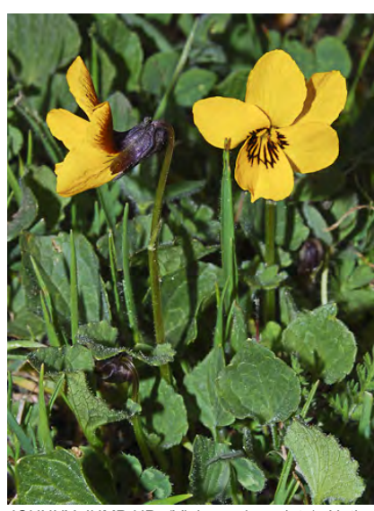
JOHNNY-JUMP-UP (Viola pedunculata) Native Perennial - Violet Family - (Feb-Apr) - Open, grassy slopes, hillsides, chaparral, oak woodland, gen full sun - Plant 2-15" tall. No basal leaves. Petals gold-yellow, lower 3 brown-veined, upper 2 red-brown on back.