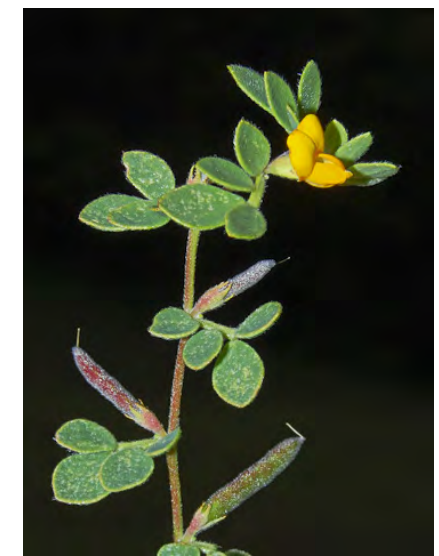
CALIFORNIA LOTUS (Acmispon wrangelianus) Native Annual - Pea Family - (Mar–Jun) - Abundant. Coastal bluffs, chaparral, disturbed areas - Low growing. Flowers yellow aging red, 0.2-0.4" long, almost stemless. Bract lobes same length as flower tube.