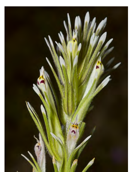
VALLEY TASSELS (Castilleja attenuata) Native Annual - Broom-rape Family - (Mar–May) - Grassland - Plant 4-20" tall, hairy, non-sticky. Leaves 0.8-3.1" long, narrow, 0-3 lobes. Flower cluster 1-12" long, narrow, tips white or pale yellow.