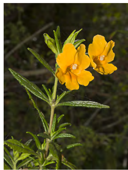
BUSH MONKEYFLOWER (Mimulus aurantiacus var. aurantiacus) Native Perennial - Lopseed Family - (Mar-Jun) - Disturbed areas, coastal cliffs, canyon sides - Shrub 4-60". Flowers yellow, orange or red; 1-2.3" long; bract tube glabrous.