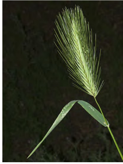
HARE BARLEY (Hordeum murinum subsp. leporinum) Naturalized Annual - Grass Family - (Feb-May) - Moist, gen disturbed sites. Common - Stem 12-43" tall. Central spikelet stalk ~0.06" long. Central floret << lateral florets. INVASIVE weed.