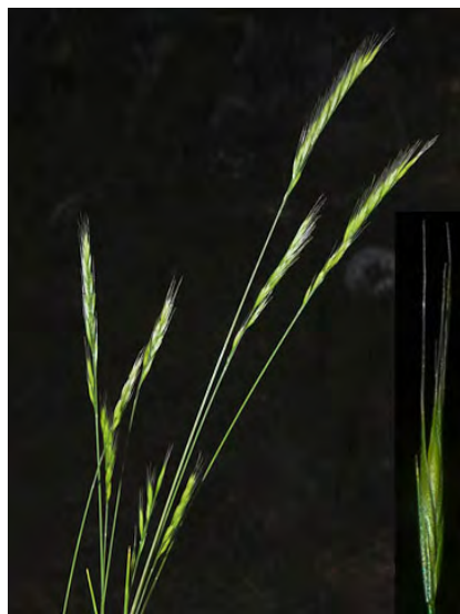
BROME FESCUE (Festuca bromoides) Naturalized Annual - Grass Family - (May—Jun) -Uncommon. Dry, disturbed places, coastal-sage scrub, chaparral - Stem < 20". Inflor 0.6-6" tall, dense, lower branches erect. Spikelet 0.2-0.4" long, awn 0.1-0.3" long.