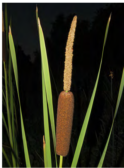
NARROW-LEAVED CATTAIL (Typha angustifolia) Native Perennial - Cattail Family -(May–Aug) - Nutrient-rich freshwater to brackish marshes, wet disturbed places - Plant 4.9-9.8' tall. Leaves gen < 0.4" wide. Flower cluster gap >