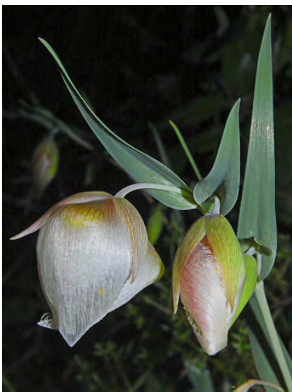
WHITE GLOBE LILY (Calochortus albus) Native Perennial - Lily Family - (Apr-Jun) - Common. Shady to open woodland, scrub - Stem 2-8 dm. Leaves grasslike. Flowers 2-many, hanging, closed at tip. Sepals 10-15 mm. Petals white to pink, 20-25 mm long.