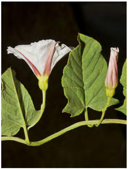
BINDWEED (Convolvulus arvensis) Naturalized Perennial - Morning-glory Family - (Mar–Oct) - Roadsides, open areas in many pl communities - Trailing. Leaf 0.8-1.2" long, w/round tip, pointed lobes. Flowers white to pink, 0.8-1" long. NOXIOUS.