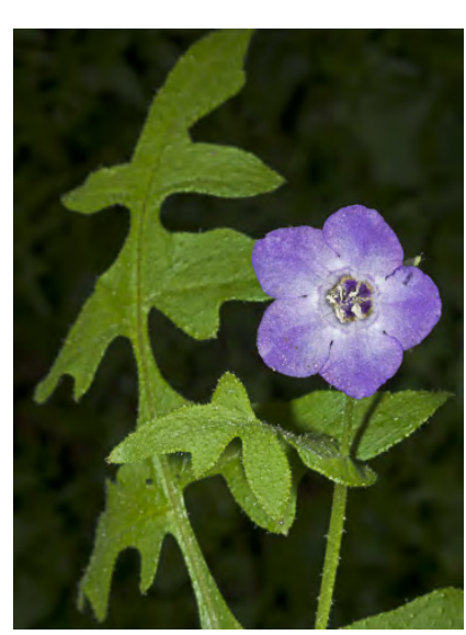
FIESTA FLOWER (Pholistoma auritum var. auritum) Native Annual - Borage Family - (Mar-Jun) - Ocean bluffs, talus slopes, woodland, streambanks, canyons - Stem 8-47" tall. Leaf lobes 7-13. Flowers 0.3-0.6" long, 0.4-1.2" wide, purple, with bractlets.