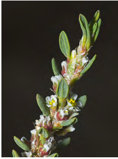
KNOTWEED (Polygonum aviculare subsp. depressum) Naturalized Annual - Buckwheat Family - (May–Nov) - Disturbed places - Stem 4-20", mat-forming. Flowers 2-8/leaf axil, ~0.1" long, fused 1/2 length, w/white or pink margins.