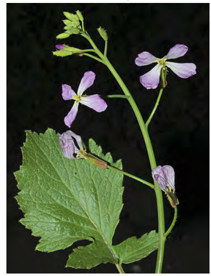
RADISH (Raphanus sativus) Naturalized Annual - Mustard Family - (May-Jul) - Disturbed areas, fields - Stem 16-51" long, Petals 0.6-1" long, white to purple. Fruit a fat cylinder w/constrictions between seeds. INVASIVE weed.