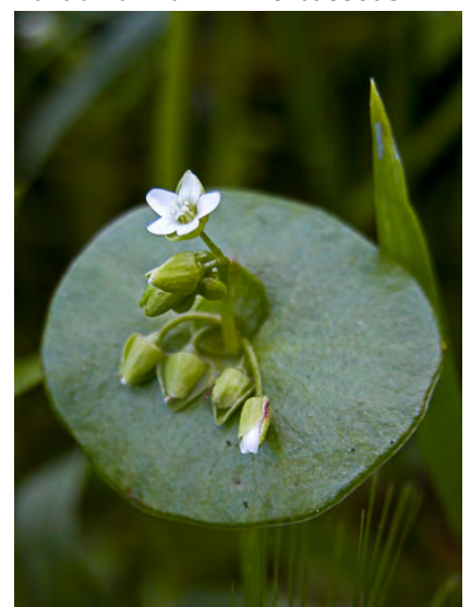
COMMON MINER'S LETTUCE (Claytonia perfoliata subsp. perfoliata) Native Annual - Miner's Lettuce Family - (Jan-May) - Vernally moist, often shady or disturbed sites - Basal leaf length <3x width. Stem leaf gen not angled. Seeds shiny w/large appendage.