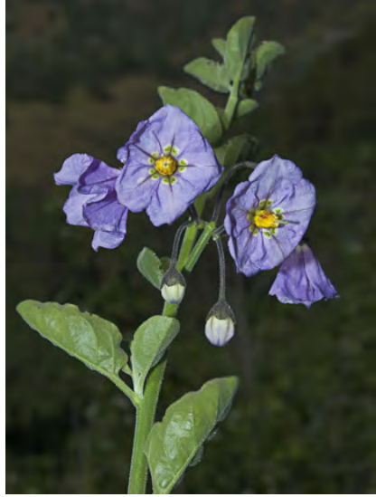
BLUE WITCH (Solanum umbelliferum) Native Perennial - Nightshade Family - (All year) -Shrubland, mixed-evergreen forest, woodland -Plant gen < 39", upper stem hairs branched, dense. Flowers 0.6-1" wide, purple, with green spots at the base.