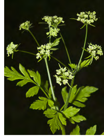
TALL SOCK-DESTROYER (Torilis arvensis) Naturalized Annual - Carrot Family - (Apr–Jul) - Disturbed places - Plant erect, 12-40". Flower clusters open, > leaf. Fruits 0.1-0.2" long, covered with uncurved bristles. Flowers white or pinkish. INVASIVE weed.