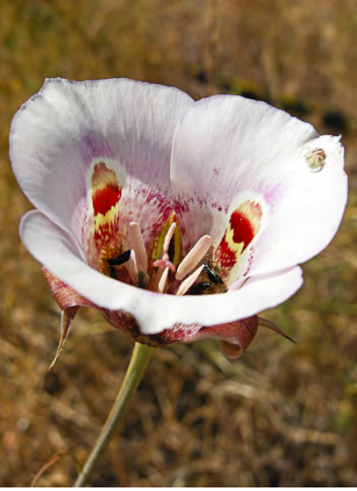
WHITE BUTTERFLY MARIPOSA LILY (Calochortus venustus) Native Perennial - Lily Family - (May–Jul) - Sandy (often granitic) soil in grassland, woodland, yellow-pine forest - Flowers white w/square yellow nectary; 2 red patches above. Petals 1.2-2" long.