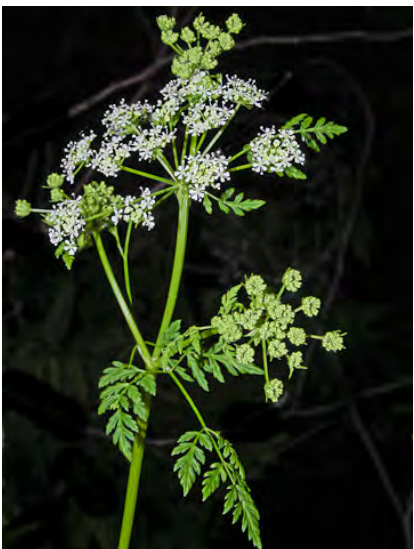
POISON HEMLOCK (Conium maculatum) Naturalized Biennial - Carrot Family - (Apr–Jul) -Common. Moist, esp disturbed places - Plants 2-10' tall. Stems purple-spotted. Leaves fern-like, gen 2x divided. Flowers white. TOXIC. INVASIVE weed.