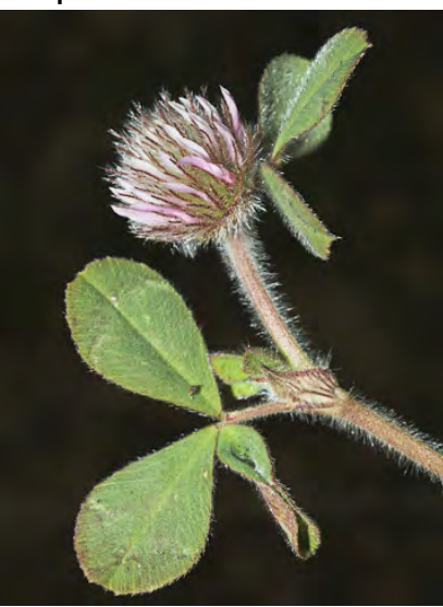
ROSE CLOVER (Trifolium hirtum) Naturalized Annual - Pea Family - (Apr-May) - Disturbed areas, roadsides - Head with 1-2 bract-like leaves immed below. Flowers pink, 0.4-0.6" long, densely-bristly in fruit. INVASIVE weed.