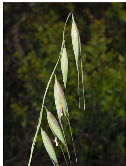
WILD OAT (Avena fatua) Naturalized Annual -Grass Family - (Apr–Jun) - Disturbed sites -Plants 1-5' tall. Spikelets 0.7-1.3" long. Low awn 1-1.6" long. Lemma tip bristles < 0.04" long. Seeds EDIBLE whole or ground for flour. INVASIVE weed.