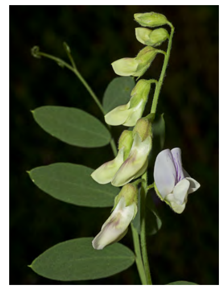
PACIFIC PEA (Lathyrus vestitus var. vestitus) Native Perennial - Pea Family - (Feb—Jul) - North: Conifer forest. South: chaparral & oak woodland -Stem wings to 0.02" wide. Leaves gen elliptic. Flowers 0.5-0.7" long, pale lavender to purple.