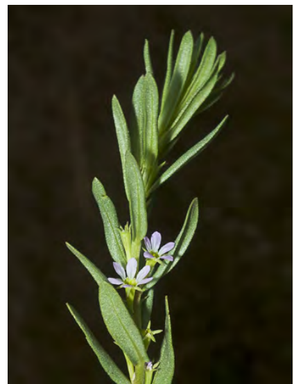
GRASS-POLY (Lythrum hyssopifolia) Naturalized Annual-Perennial - Loosestrife Family - (Apr-Oct) - Marshes, drying pond margins, disturbed ground - Stem 4-24". Leaves 0.2-1.2" long, ~ elliptical. Petals pink, 0.1-0.2" long. 2 awl-like appendages. INVASIVE weed.