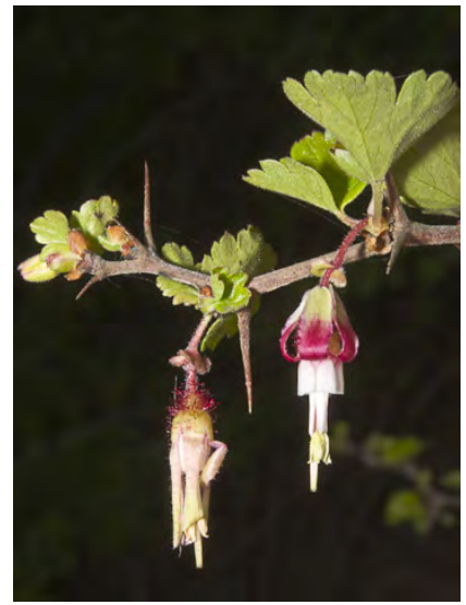
HILLSIDE GOOSEBERRY (Ribes californicum var. californicum) Native Perennial - Gooseberry Family - (Feb-Mar) - Forest openings, woodland - Shrub < 5' tall. Leaf blades 0.4-1.2" long, not sticky. Sepals greenish, petals 0.12" long, white.