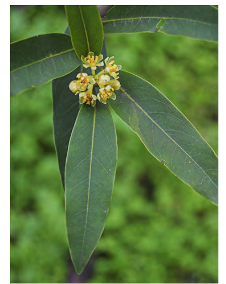
CALIFORNIA BAY (Umbellularia californica) Native Perennial - Laurel Family - (Nov-May) - Common. Canyons, valleys, chaparral - Tree < 150' tall. Leaf 1.2-4", 0.6-1.2" wide, aromatic. Cluster of 5-10 small, yellow or yellow-green flowers. Fruit 0.8-1" diam.