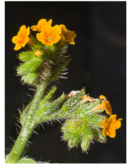
COMMON FIDDLENECK (Amsinckia intermedia) Native Annual - Borage Family - (Mar-Jun) -Abundant. Open, generally disturbed places -Plant 0.5-3' tall. Flowers orange with 5 red spots, 0.3-0.4" long, 0.2-0.4" wide, tube straight.