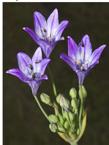
ITHURIEL'S SPEAR (Triteleia laxa) Native Perennial - Brodiaea Family - (Apr-Jun) -Common. Open forest, conifer or foothill woodland, grassland on clay soil - Flower stem 4-28". Leaves 8-16", 0.16-1" wide. Flowers blue, blue-purple or white, 0.7-1.9" long.