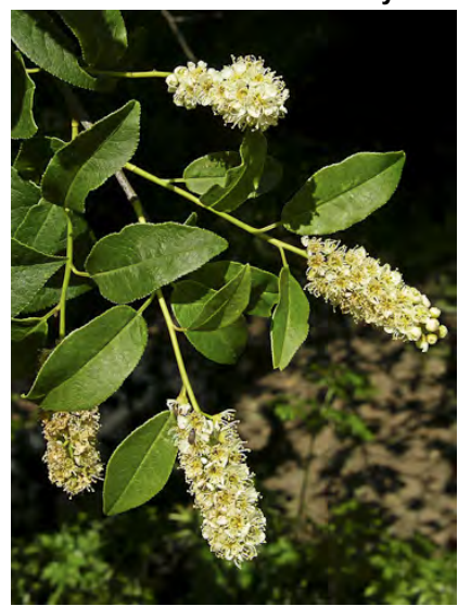
WESTERN CHOKE CHERRY (Prunus virginiana var. demissa) Native Perennial - Rose Family - (May–Jun) - Rocky slopes, canyons, scrubland, oak/pine woodland - Shrub/tree < 20'. Leaf blade 1.2-4" long. Flowers 18+, petals white, 0.16-0.3" long.