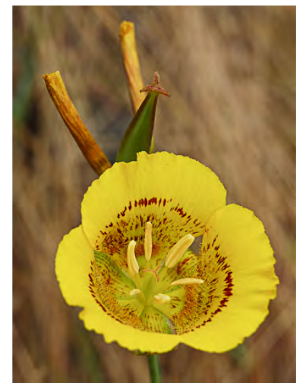
YELLOW MARIPOSA LILY (Calochortus luteus) Native Perennial - Lily Family - (Apr—Jun) - Heavy soils in grassland, woodland, mixed-evergreen forest - Stem 8-20" long. Flowers bell-shaped, deep yellow, 0.8-1.6" long, gen w/inner central red-brown spot.