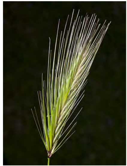
WALL BARLEY (Hordeum murinum subsp. murinum) Naturalized Annual - Grass Family - (Feb-May) - Moist, gen disturbed sites - Stem 1-2'. Leaf auricles notable. Central spikelet stalk 0-0.02". Central floret gen = lateral florets. INVASIVE weed.