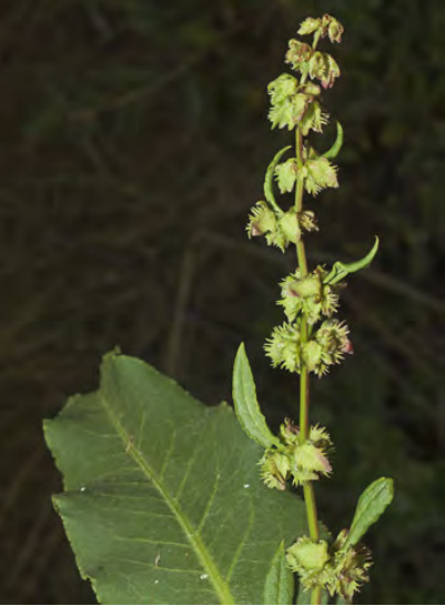
FIDDLE DOCK (Rumex pulcher) Naturalized Perennial - Buckwheat Family - (May–Sep) - Disturbed places, meadows, moist or dry habitats - Stem 8-24" long, branches widely spreading. Leaf blades 1.6-4" long, 1.2-2" wide. Valves w/2-5 teeth.