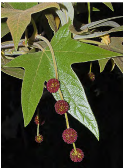
WESTERN SYCAMORE (Platanus racemosa) Native Perennial - Sycamore Family - (Feb-Apr) - Common. Streamsides, canyons, arroyos - Tree 33-115' tall. Bark peeling pale. Leaf blades 4-10" long, palmately lobed, smooth to hairy above, short-woolly under.