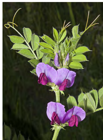
SPRING VETCH (Vicia sativa subsp. sativa) Naturalized Annual - Pea Family - (Mar–Jun) - Roadsides, disturbed areas, grassland, open areas in oak and riparian woodlands - Flowers 1-2 at leaf bases, pink-purple to white, 0.7-1.2" long. Leaflets 0.16-0.4" wide.