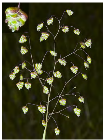
LITTLE QUAKING GRASS (Briza minor) Naturalized Annual - Grass Family - (Apr-Jul) -Shaded or moist, open sites - Stem 3-20" tall. Spikelets 0.1-0.2" long, resemble tiny rattlesnake