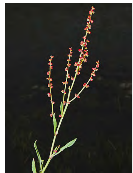
SHEEP SORREL (Rumex acetosella) Naturalized Perennial - Buckwheat Family - (Apr-Jul) - ± Disturbed, often acidic places - Stem < 16". Leaf gen basal, blade 0.8-2.4" long, lower arrowhead-shaped w/2 lobes. Flowers yellowish, turn reddish. INVASIVE.