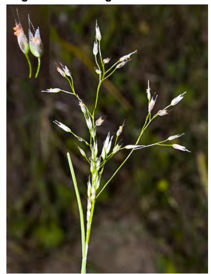
SILVER HAIR GRASS (Aira caryophyllea) Naturalized Annual - Grass Family - (Apr-Jun) -Sandy soils, open or disturbed sites - Flower cluster > 0.6" wide, diffuse with long slender branches. Spikelets about 0.1" long with 2 extended awns.