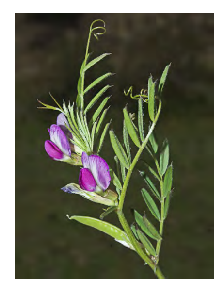
NARROW-LEAVED VETCH (Vicia sativa subsp. nigra) Naturalized Annual - Pea Family - (Mar-Jun) - Roadsides, disturbed areas, grassland, open areas in oak and riparian woodlands - Flowers 1-2 at leaf bases, pink-purple to white, 0.4-0.7" long. Leaflets 0.2-0.3" wide.