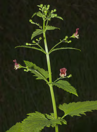
CALIFORNIA FIGWORT (Scrophularia californica) Native Perennial - Snapdragon Family - (Mar—Jul) - Common; damp places, chaparral, roadsides - Stem 2.6-4' tall, square x-section. Leaves opposite, to 7" long, triangular, toothed. Flowers 0.3-0.5" long, upper lips red to maroon, lower paler or yellowish.