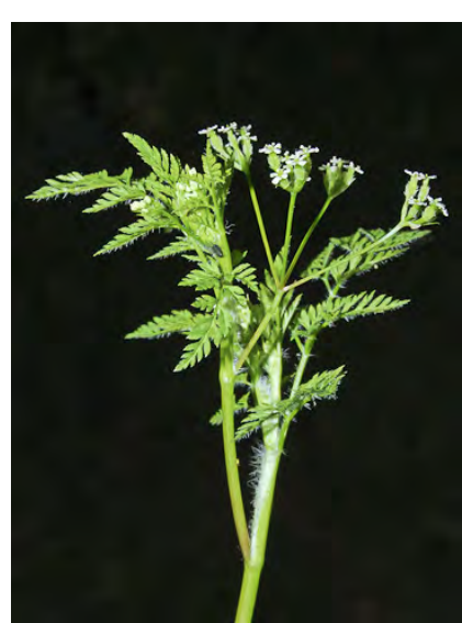
BUR-CHERVIL (Anthriscus caucalis) Naturalized Annual - Carrot Family - (Apr-Jun) - Generally shady places - Plant 18-40" tall. Flowers white; flower stalk >= fruit length. Fruits 0.1-0.2" long with curved "velcro" bristles. Leaves fern-like, triangular outline.