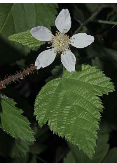
CALIFORNIA BLACKBERRY (Rubus ursinus) Native Perennial - Rose Family - (Mar–Jul) - Open, disturbed areas - Stem round, bristly/prickly. Leaves simple to 3 leaflets, underside green. Plants unisexual. Petals 0.24-0.6" long, white. Blackberry-type fruit.