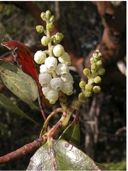
PACIFIC MADRONE (Arbutus menziesii) Native Perennial - Heath Family - (Mar–May) - Conifer, oak forests - Tree < 130' tall, evergreen, peeling red bark. Leaf blades < 5" long. Flowers yellow-white or pink, < 3.1" long. Berries red, < 0.5" diam, round.