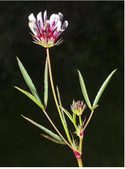
TOMCAT CLOVER (Trifolium willdenovii) Native Annual - Pea Family - (Mar–Jun) - Abundant. Disturbed, gen spring-moist, heavy soils, occas serpentine - Head bract wheel-shaped, sharp-lobed. Leaf narrow. Flowers purple w/white tip, 0.3-0.6" long.