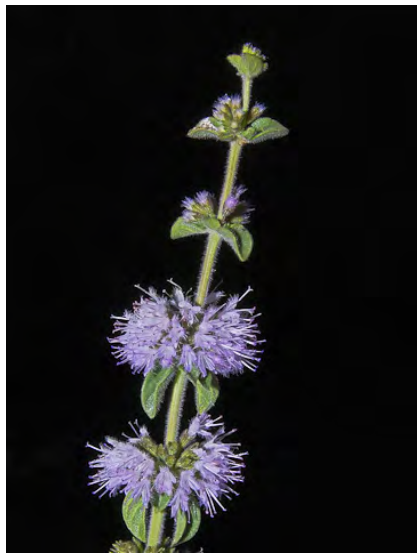
PENNYROYAL (Mentha pulegium) Naturalized Perennial - Mint Family - (Jul-Oct) - Moist places, fields - Stem 4-12" tall, short-hairy. Leaves 0.2-1" long, upper stalkless. Flowers 0.2-0.3" long, violet to lavender. Aromatic. INVASIVE weed.