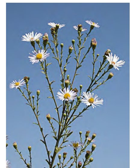
COMMON CALIFORNIA-ASTER (Corethrogyne filaginifolia) Native Perennial - Sunflower Family - (Jul-Nov) - Coastal scrub, chaparral, grassland, foothill woodland, forest - Heads 3-20+, calyx length 2x width. Rays white to pink-purple.