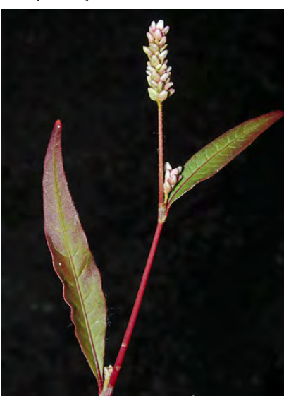
FALSE WATERPEPPER (Persicaria hydropiperoides) Native Perennial - Buckwheat Family - (Jun–Oct) - Wet banks, shallow water, marshes, moist prairies - Stem 6-39" long . Flowers 0.1-0.16" long, pink or white-green, not gland-dotted.