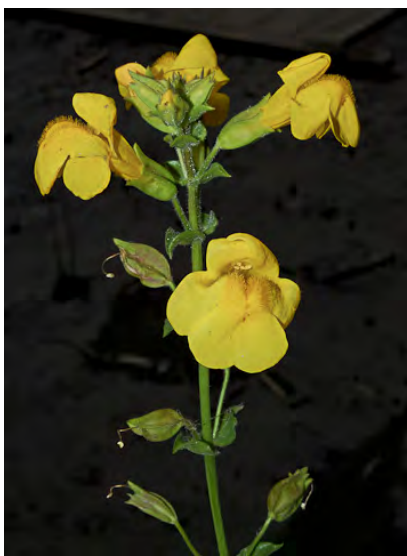
GOLDEN MONKEYFLOWER (Mimulus guttatus) Native Perennial - Lopseed Family - (Mar–Aug) - Common. Wet places, gen terrestrial, occ emergent or floating in mats - Plant 0.8-60". Flower yellow, gen > 0.8" long; mature bracts flattened sideways, inflated in fruit.