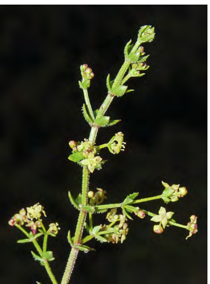
CLIMBING BEDSTRAW (Galium porrigens var. porrigens) Native Perennial - Madder Family - (May-Aug) - Among shrubs in chaparral, forest - Stem 4-59" long. Leaves 0.1-0.7" long, oval to egg-shaped, in whorls of 4. Flowers yellow to red, 4-lobed.