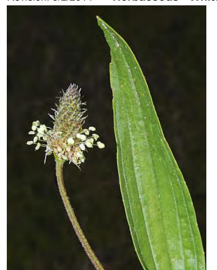
ENGLISH PLANTAIN (Plantago lanceolata) Naturalized Annual - Plantain Family - (Apr-Aug) - Common. Disturbed areas - Leaves basal, hairy, 2-10" long, <= 1" wide. Flowers + stem 8-31" tall, flower cluster 0.8-3" long. INVASIVE, lawn weed.