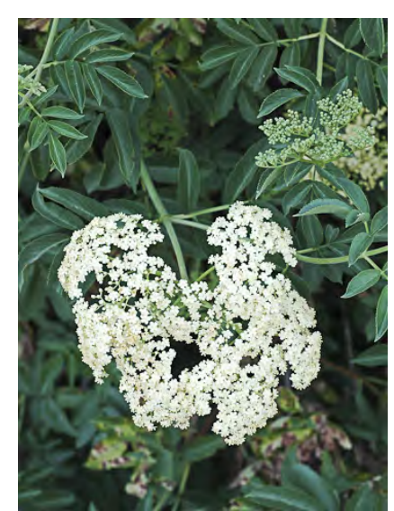
BLUE ELDERBERRY (Sambucus nigra subsp. caerulea) Native Perennial - Muskroot Family - (Mar–Sep) - Common. Streambanks, open places in forest - Shrub 7-26' tall. Flower cluster flat-topped, 1.6-13" diam, petals spreading. Fruits waxy blue-black.