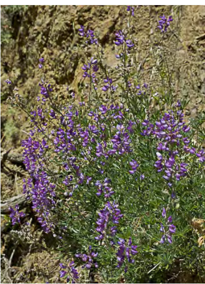
BAY AREA SILVER LUPINE (Lupinus albifrons var. collinus) Native Perennial - Pea Family - (Mar-Jun) - Cliffs, forest openings - Subshrub 8-16" tall, woody only at base, silvery. Flowers 0.35-0.6" long, violet to lavender.