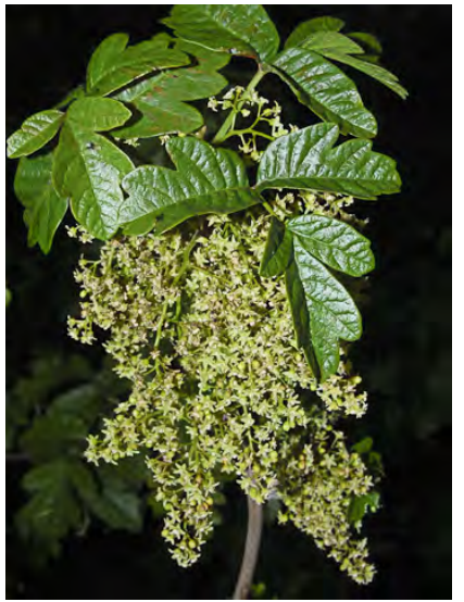
WESTERN POISON OAK (Toxicodendron diversilobum) Native Perennial - Sumac Family -(Apr–Jun) - Canyons, slopes, chaparral, coastal scrub, oak woodland - Shrub or vine. Leaflets 3, red in fall, mid leaflet stalked. Flowers green. Fruits white. TOXIC.