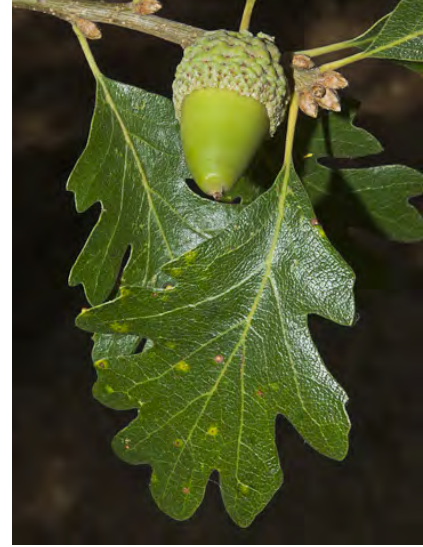
VALLEY OAK (Quercus lobata) Native Perennial - Oak Family - (Mar–Apr) - Slopes, valleys, savanna - Tree < 115' tall, deciduous. Leaves 2-5" long, not leathery, deeply lobed, lobes without bristles. Acorns 1.2-2" long, slender, cup 0.4-1.2" deep.