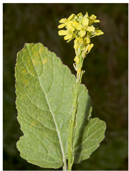
BLACK MUSTARD (Brassica nigra) Naturalized Annual - Mustard Family - (Apr–Sep) - Common. Disturbed areas, fields - Plant 1-6' tall. Petals bright yellow, 0.3-0.4" long. Fruit upright, pressed against stem. INVASIVE weed.