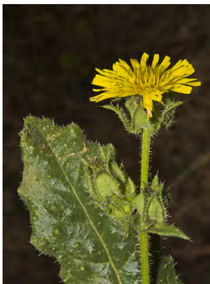
BRISTLY OX-TONGUE (Helminthotheca echioides) Naturalized Annual-Biennial - Sunflower Family - (All year) - Common. Disturbed areas - Stem 1-6.5' tall, bristly, Leaf 2-8" long, covered with prickly bumps. Flower heads 0.8-1.6" wide. INVASIVE weed.