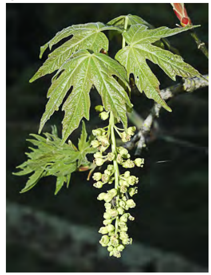
BIG-LEAF MAPLE (Acer macrophyllum) Native Perennial - Soapberry Family - (Mar–Jun) -Common. Streambanks, canyons - Tree < 100'. Leaves 5-lobed, 3-6" long, 4-10" wide. Group of 20-90 hanging flowers appear after leaves. Winged seeds.