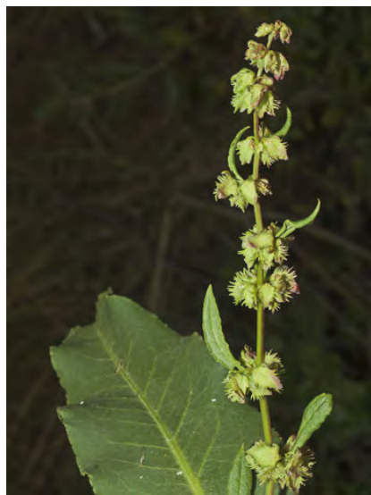
FIDDLE DOCK (Rumex pulcher) Naturalized Perennial - Buckwheat Family - (May–Sep) - Disturbed places, meadows, moist or dry habitats - Stem 8-24" long, branches widely spreading. Leaf blades 1.6-4" long, 1.2-2" wide. Valves w/2-5 teeth.