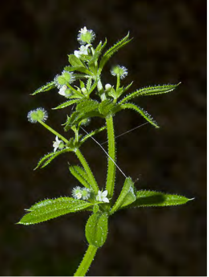
GOOSE GRASS (Galium aparine) Native Annual - Madder Family - (Apr-Jun) - Grassy, ± shady places - Stem 12-35" long, weak, brittle. Leaves 0.5-1.6" long, in whorls of 6-8. Flowers white, 4-lobed. Fruits covered w/short, hooked hairs.