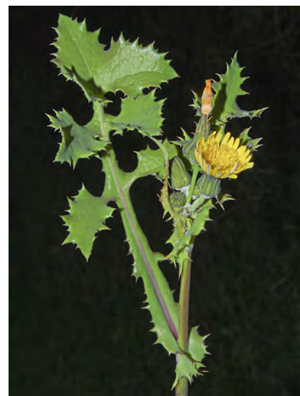
PRICKLY SOW THISTLE (Sonchus asper subsp. asper) Naturalized Annual - Sunflower Family - (All year) - Common. Slightly moist disturbed sites, along streams - Plant 4-48". Leaf teeth prickly. Basal lobes of upper leaves rounded, curving downward.