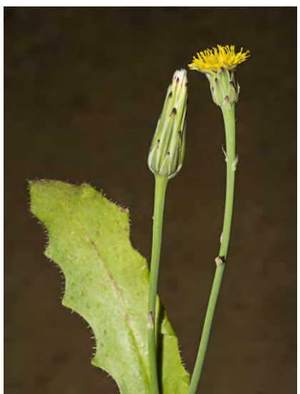
SMOOTH CAT'S-EAR (Hypochaeris glabra) Naturalized Annual - Sunflower Family -(Mar–Jun) - Common. Disturbed areas, grassland, open woodland - Plant 4-24" tall, smooth. Rays 0.2-0.3" long, barely > head bracts. Only inner fruit beaked. INVASIVE.