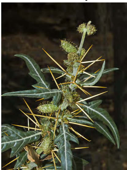
SPINY COCKLEBUR (Xanthium spinosum) Native Annual - Sunflower Family - (Jul-Oct) - Disturbed, seasonally wet, often alkaline sites, in grassland, marshes, watercourses - Plant 4-24". Stem node spines 0.6-1.2" long, golden, gen 3-lobed. Bur 0.4-0.5" long.