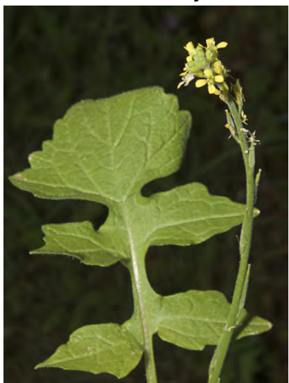
HEDGE MUSTARD (Sisymbrium officinale) Naturalized Annual - Mustard Family - (Apr-Sep) - Disturbed areas, fields, pastures - Stem 10-22" tall, thin, wiry. Petals 0.1-0.16" long, pale yellow. Fruit 0.4-0.55" long, awl-shaped, appressed.