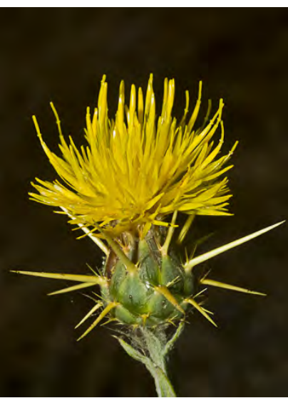
YELLOW STAR-THISTLE (Centaurea solstitialis) Naturalized Annual - Sunflower Family -(May-Oct) - Invasive, roadsides, disturbed grassland or woodland - Plant 4-39" tall. Leaves woolly, extend down the stem. Flower bract spines 0.4-1" long. NOXIOUS weed.