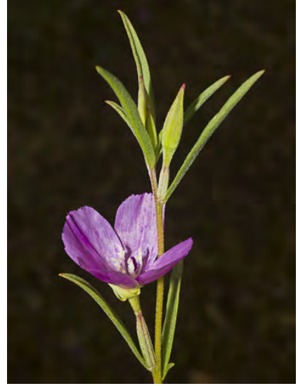
SMALL CLARKIA (Clarkia affinis) Native Annual -Evening Primrose Family - (May-Jun) - Openings in woodland, chaparral - Stem < 32". Buds erect, ovary 8-grooved, sepals united on side. Petals 0.2-0.6" long, pale pink to dark wine-red, often purple-flecked.