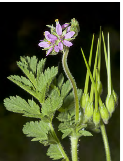
GREENSTEM FILAREE (Erodium moschatum) Naturalized Annual - Geranium Family -(Feb-Sep) - Open, disturbed sites - Stem 4-24", short-hairy. Leaves compound, leaflets toothed. Sepal tip glabrous. Petals 0.4-0.6" long, pink. Fruit beak 0.8-1.6" long.