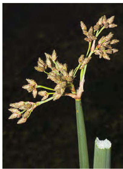
COMMON TULE (Schoenoplectus acutus var. occidentalis) Native Perennial - Sedge Family - (Summer) - Common. Marshes, shores, fens, shallow lakes, often emergent - Stem 3.3-13' tall, fat, round x-section, blue-green.