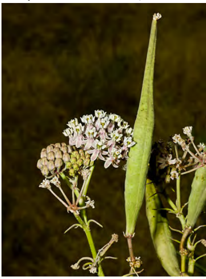
NARROW-LEAF MILKWEED (Asclepias fascicularis) Native Perennial - Dogbane Family - (May-Oct) - Dry ground, valleys, foothills - Plant gen hairless. Stem leaves narrow, 3-5 in whorls. Flowers green-white to purple-tinged, ~0.25" long.