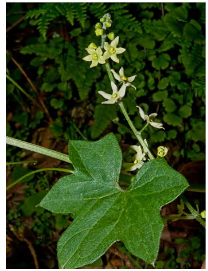
CALIFORNIA MAN-ROOT (Marah fabacea) Native Perennial - Gourd Family - (Feb-Apr) - Streamsides, washes, shrubby open areas - Vine 6-20' long. Leaves moderately lobed. Flowers cream or white, < 0.3" wide. Fruit spiny all over.