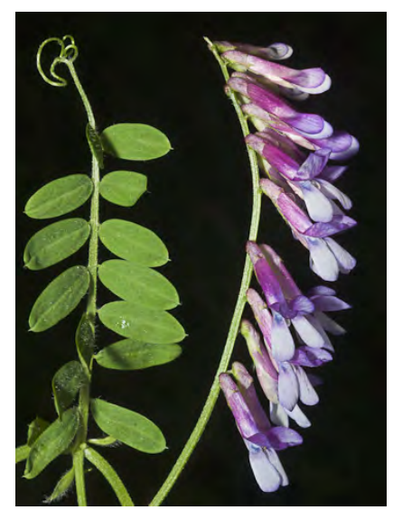
SPARSELY HAIRY VETCH (Vicia villosa subsp. varia) Naturalized Annual-Biennial - Pea Family - (Mar-Jun) - Grassland, roadside, disturbed areas - Stems w/few hairs. Flowers 10-20, blue-purple to white, 0.4-0.55" long. Lower bract lobes 0.04-0.1" long.