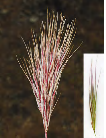
RED BROME (Bromus madritensis subsp. rubens) Naturalized Annual - Grass Family -(Mar-Jun) - Disturbed areas, roadsides - Plant (Wal-Sun) - Distribute a reas, readstates - Flath 4-20". Flower cluster condensed, branches obscure, < spikelets. Stem & sheathes hairy. INVASIVE weed.