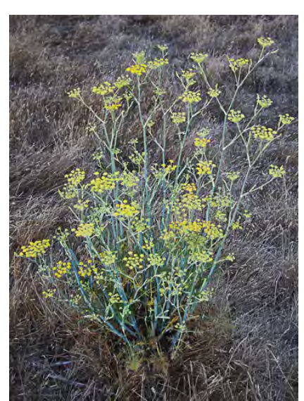
FENNEL (Foeniculum vulgare) Naturalized Perennial - Carrot Family - (May–Sep) - Roadsides, disturbed sites - Plants 3-6.5' tall, anise-scented. Stems waxy-blue, canelike. Flowers yellow. Leaf segments thread-like, edible when young. INVASIVE weed.