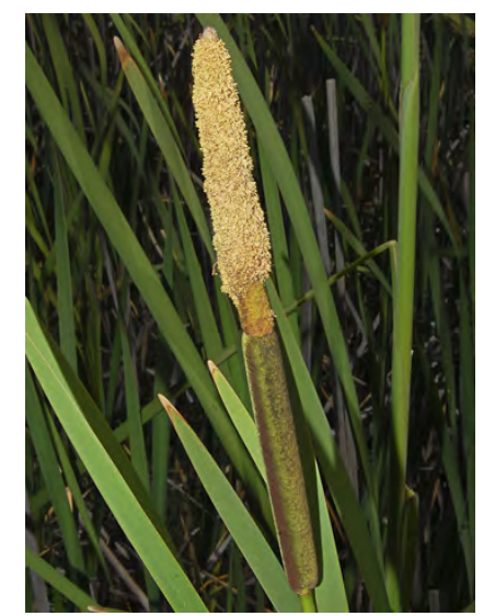
BROAD-LEAVED CATTAIL (Typha latifolia) Native Perennial - Cattail Family - (Jun–Jul) - Unpolluted to nutrient-rich freshwater (brackish) marshes - Plant 4.9-9.8' tall. Widest leaves 0.4-1.1" wide. Flower cluster with no gap between flower types.

Wild Plants of Sycamore Valley Regional Open Space Preserve - Sorted by Form, Color and Family