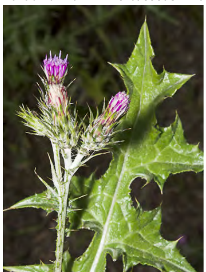
ITALIAN THISTLE (Carduus pycnocephalus subsp. pycnocephalus) Naturalized Annual -Sunflower Family - (Mar–Jul) - Roadsides, pastures, disturbed areas - Stems 8-79", narrow spiny-wings. Lower leaves 4-10 lobed, heads 2-5, flower bracts woolly. NOXIOUS.