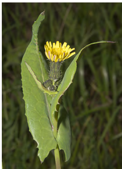
COMMON SOW THISTLE (Sonchus oleraceus) Naturalized Annual - Sunflower Family - (All year) - Abundant. Disturbed places - Plant 4-55" tall. Leaf teeth soft to touch. Basal lobes of upper leaves sharply pointed, straight to curving upward.