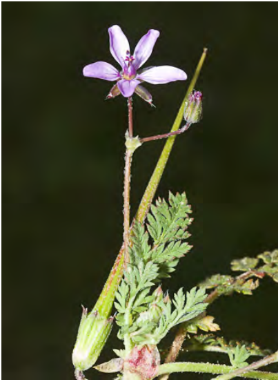
REDSTEM FILAREE (Erodium cicutarium) Naturalized Annual - Geranium Family (Feb-Sep) - Open, disturbed sites, grassland, scrub - Stem 4-20". Leaves compound, leaflets dissected. Sepal tip bristly. Petal pink to purple. Fruit beak 0.8-2". INVASIVE.