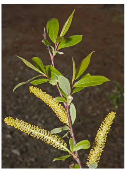
RED WILLOW (Salix laevigata) Native Perennial Willow Family - (Dec-Jun) - Common. Riverbanks, seepage areas, lakeshores, canyons - Tree bark fissured. Leaf lanceolate, glaucous below, gen w/stalk glands. Stamens 5. Fruit glabrous.