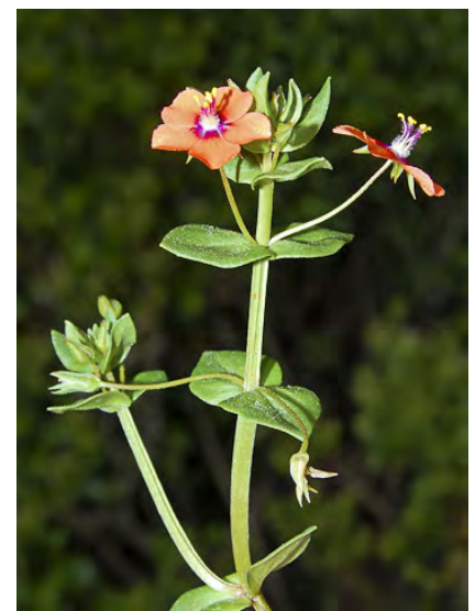
SCARLET PIMPERNEL (Anagallis arvensis) Naturalized Annual - Myrsine Family - (Mar–May) - Common. Disturbed places, ocean beaches - Plants 2-16" tall. Flowers 0.2-0.3" long, salmon or occasionally blue. Leaves TOXIC, can cause dermittis.