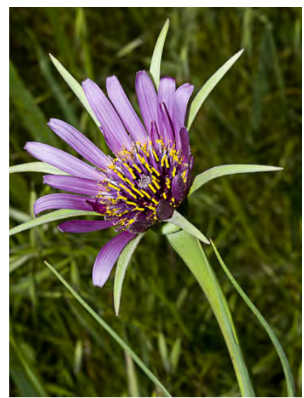
PURPLE SALSIFY (Tragopogon porrifolius) Naturalized Biennial-Perennial - Sunflower Family - (Mar-Nov) - Common. Disturbed places - Plant 16-39" tall, milky sap. Leaves 0.8-1.6" long, very narrow, waxy blue. Flowers purple.