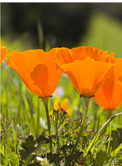
CALIFORNIA POPPY (Eschscholzia californica) Native Perennial - Poppy Family - (Feb-Sep) - Grassy, open areas - Plant 2-24" tall. Flower w/spreading rim <= 0.2". Petals 0.8-2.4" long, early spring = large and orange, fall = smaller and volley.