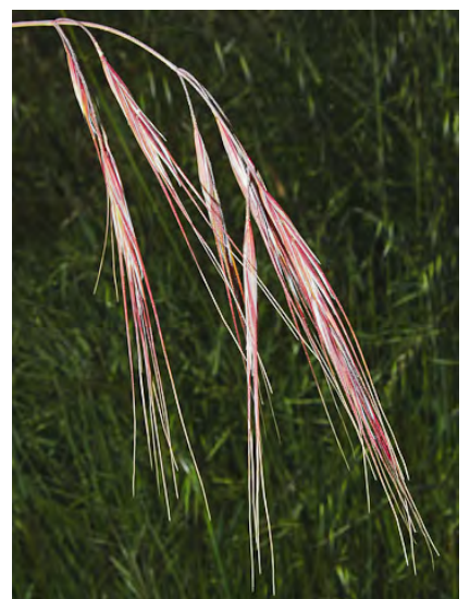
RIPGUT GRASS (Bromus diandrus) Naturalized Annual - Grass Family - (Apr-Jul) - Open, gen disturbed areas - Plant 6-40" tall. Spikelet 1-2.8" long. Lemma body 0.8-1.2" long, awn > 1.2" long. Barbed seeds can stick in flesh of animals. INVASIVE weed.