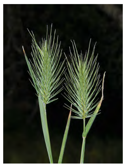
MEDITERRANEAN BARLEY (Hordeum marinum subsp. gussoneanum) Naturalized Annual - Grass Family - (Apr-Jun) - Dry to moist, disturbed sites - Stem 4-20". Leaf blades to 32" long, auricles < 0.08". Central lemma awn 0.25-0.7" long. INVASIVE weed.