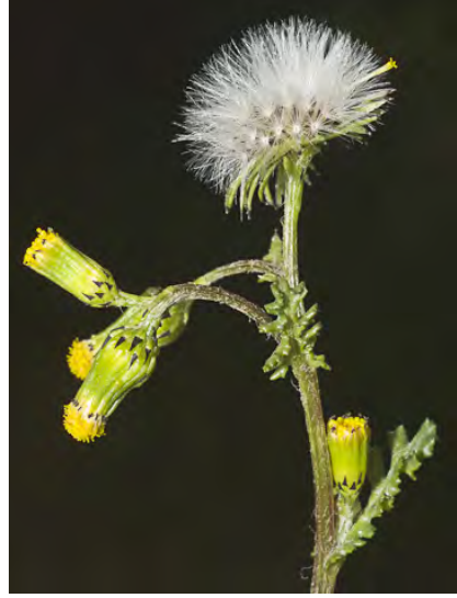
COMMON GROUNDSEL (Senecio vulgaris) Naturalized Annual - Sunflower Family -(Feb-Jul) - Common. Disturbed areas - Plant 4-24" tall, not hairy, w/1-10+ stems. Flower head bracts with black-tips. Milky sap.