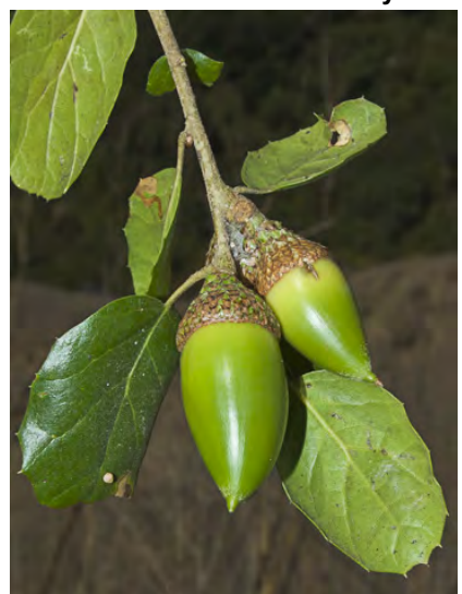
COAST LIVE OAK (Quercus agrifolia var. agrifolia) Native Perennial - Oak Family - (Mar-Apr) - Valleys, slopes, mixed-evergreen forest, woodland - Tree 30-80'. Leaves convex, hair-tuft below in vein axils. Acorns on 1st year twigs, shell glabrous inside.