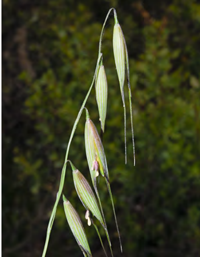
WILD OAT (Avena fatua) Naturalized Annual - Grass Family - (Apr–Jun) - Disturbed sites - Plants 1-5' tall. Spikelets 0.7-1.3" long. Low awn 1-1.6" long. Lemma tip bristles < 0.04" long. Seeds EDIBLE whole or ground for flour. INVASIVE weed.