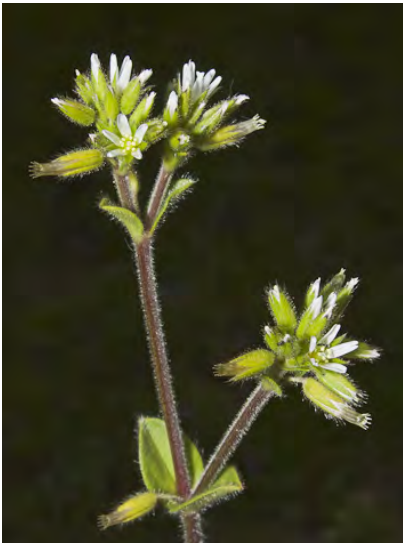
STICKY MOUSE-EAR CHICKWEED (Cerastium glomeratum) Naturalized Annual - Pink Family - (Spring) - Dry hillsides, grassland, chaparral, disturbed areas - Flowers 0.1-02" long, white, sticky-hairy. Flower bract hairs extend beyond tip; bracts herbaceous.