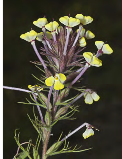
YELLOW JOHNNY-TUCK (Triphysaria eriantha subsp. eriantha) Native Annual - Broom-rape Family - (Mar–May) - Grassland, foothills - Plant 4-14" tall, purple. Leaves 0.4-2" long, 3-7 lobed. Flowers yellow with dark purple beak, 0.4-1" long.