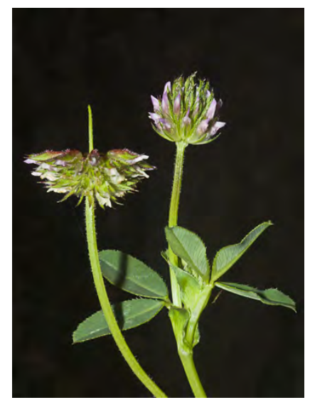
PINPOINT CLOVER (Trifolium gracilentum) Native Annual - Pea Family - (Mar–Jun) - Open, disturbed places, occas serpentine - Leaflet tips not deep-notched. Reflexed pink-purple flowers w/point. Flower bracts completely smooth.