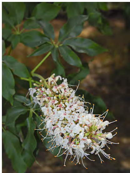
CALIFORNIA BUCKEYE (Aesculus californica) Native Perennial - Soapberry Family - (May–Jun) - Dry slopes, canyons, borders of streams - Large shrub or tree 13-39' tall. 5-7 leaflets. Flowers white to pale rose. Large seeds toxic but edible after leaching out saponins.