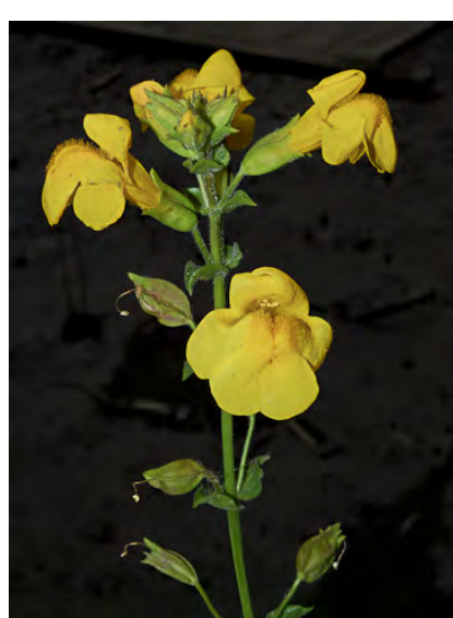
GOLDEN MONKEYFLOWER (Mimulus guttatus) Native Perennial - Lopseed Family - (Mar–Aug) - Common. Wet places, gen terrestrial, occ emergent or floating in mats - Plant 0.8-60". Flower yellow, gen > 0.8" long; mature bracts flattened sideways, inflated in fruit.