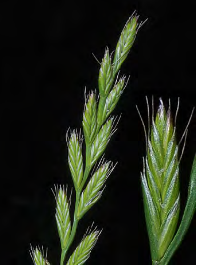
RYE GRASS (Festuca perennis) Naturalized Perennial - Grass Family - (May-Sep) - Dry to moist disturbed sites, abandoned fields - Stem 20-40" tall. Spikelet 0.2-0.9" long, > glume, awned or awnless. Sterile shoots at base. INVASIVE weed.