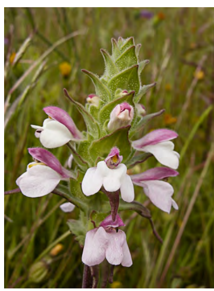
MEDITERRANEAN LINSEED (Bellardia trixago) Naturalized Annual - Broom-rape Family - (Apr-Jun) - Disturbed grassland. - Plant sticky-hairy. Stem 6-32" tall. Leaves lance-shaped, toothed. Flowers 0.8-1" long, 2-lipped: upper lip pink, lower lip white. INVASIVE.