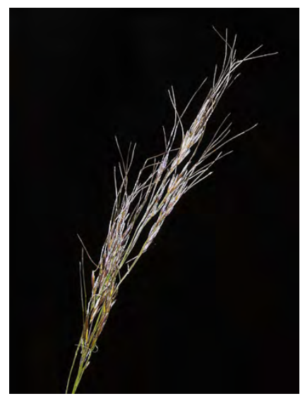
FOOTHILL NEEDLE GRASS (Stipa lepida) Native Perennial - Grass Family - (Mar–Jun) - Dry slopes, chaparral, grassland, savanna, coastal scrub - Stem 14-39" tall. Leaf blade 4.7-9.1" long, narrow. Glumes 0.2-0.6" long. Awn 0.8-2" long.