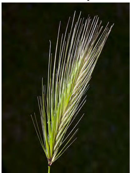
WALL BARLEY (Hordeum murinum subsp. murinum) Naturalized Annual - Grass Family - (Feb-May) - Moist, gen disturbed sites - Stem 1-2'. Leaf auricles notable. Central spikelet stalk 0-0.02". Central floret gen = lateral florets. INVASIVE weed.