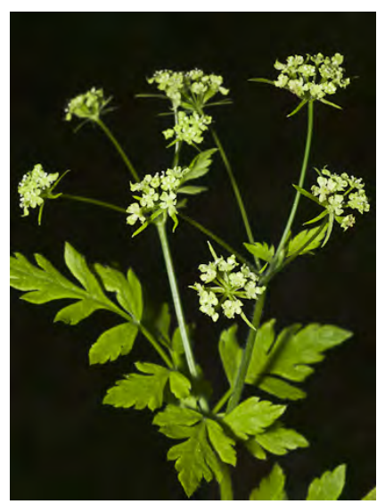
TALL SOCK-DESTROYER (Torilis arvensis) Naturalized Annual - Carrot Family - (Apr–Jul) - Disturbed places - Plant erect, 12-40". Flower clusters open, > leaf. Fruits 0.1-0.2" long, covered with uncurved bristles. Flowers white or pinkish. INVASIVE weed.