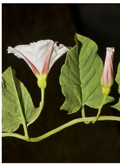
BINDWEED (Convolvulus arvensis) Naturalized Perennial - Morning-glory Family - (Mar–Oct) - Roadsides, open areas in many pl communities - Trailing. Leaf 0.8-1.2" long, w/round tip, pointed lobes. Flowers white to pink, 0.8-1" long. NOXIOUS.