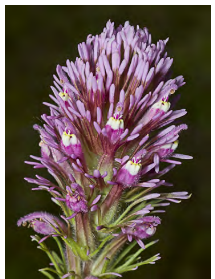
PURPLE OWL'S-CLOVER (Castilleja exserta subsp. exserta) Native Annual - Broom-rape Family - (Mar–May) - Open fields, grassland - Plant sticky, short-hairy. Flower cluster tipped white, pale yellow or rose. Flower upper lip hooked, fuzzy.