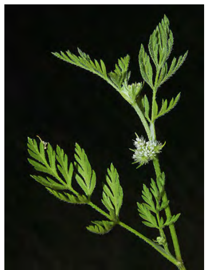
SHORT SOCK-DESTROYER (Torilis nodosa) Naturalized Annual - Carrot Family - (Apr-Jun) - Disturbed places - Plant spreading, 4-20" tall. Flowers white to red, clusters dense, < leaf. Fruit ~ 0.1" long, uncurved bristles on outer surface, bumps inside.