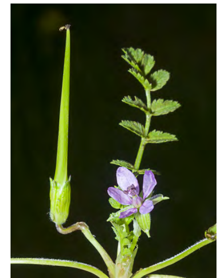
LONG-BEAKED FILAREE (Erodium botrys) Naturalized Annual - Geranium Family -(Mar–Jul) - Dry, open or disturbed sites - Stem 4-35" tall, coarse-hairy. Leaves lobed. Petals pink, 0.3-0.5" long. Sepals w/reddish tip. Fruit beak 2-4.7" long.