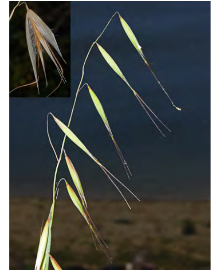
SLENDER WILD OAT (Avena barbata) Naturalized Annual - Grass Family - (Mar—Jun) Disturbed sites - Plants gen 24-32" Spikelets 0.8-1.2" long. Awns 0.8-1.8" long. Lemma tip bristles >= 0.1" long. Seeds EDIBLE whole or around for flour. INVASIVE weed.