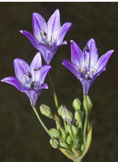
ITHURIEL'S SPEAR (Triteleia laxa) Native Perennial - Brodiaea Family - (Apr–Jun) - Common. Open forest, conifer or foothill woodland, grassland on clay soil - Flower stem 4-28". Leaves 8-16", 0.16-1" wide. Flowers blue, blue-purple or white, 0.7-1.9" long.