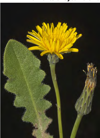
ROUGH CAT'S-EAR (Hypochaeris radicata) Naturalized Perennial - Sunflower Family -(Apr–Jul) - Disturbed areas, grassland, open woodland - Plant 4-32" tall, rough-hairy. Rays 0.4-0.6" long, well exceeding head bracts. Fruits all beaked. INVASIVE weed.