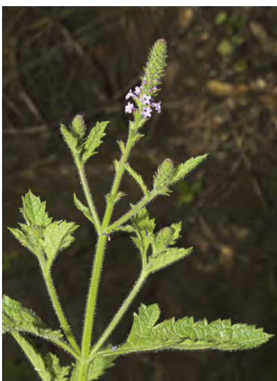
ROBUST VERVAIN (Verbena lasiostachys var. scabrida) Native Perennial - Vervain Family - (May-Sep) - Open, dry to wet places - Plant 14-32" tall. Leaves green, narrow, 3-lobed, stiff-haired above. Flowers blue to purple on long