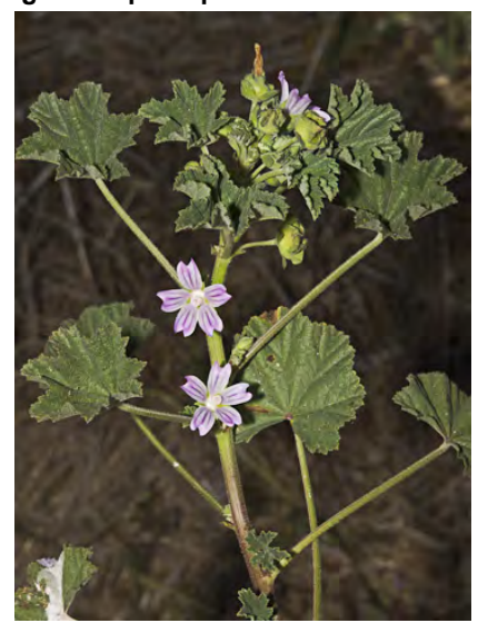
BULL MALLOW (Malva nicaeensis) Naturalized Annual - Mallow Family - (Mar–Jun) - Disturbed places - Stem 0.7-2'. Leaf blade 1.2-4.7" wide, 5-7 shallow lobes. Bractlets egg-shaped,0.16-0.2" long. Petals pink to blue-violet, 0.2-0.5" long.