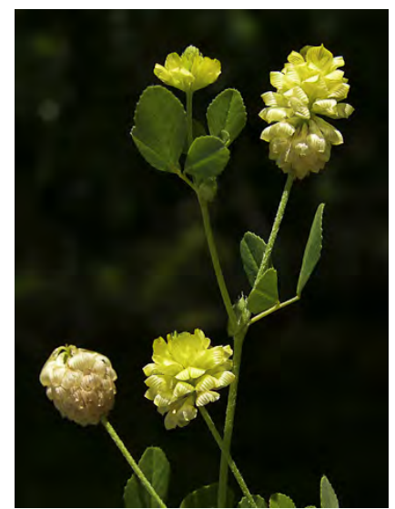
HOP CLOVER (Trifolium campestre) Naturalized Annual - Pea Family - (Apr-May) - Disturbed areas, roadsides - Flower heads 0.3-0.5" wide, bright yellow, brown w/age, quickly reflexing. Flowers with lengthwise ridges.