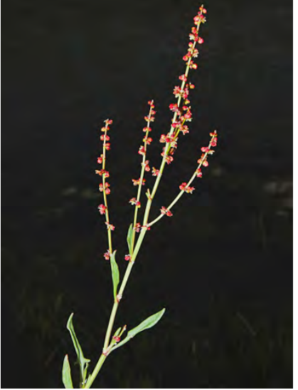
SHEEP SORREL (Rumex acetosella) Naturalized Perennial - Buckwheat Family - (Apr-Jul) - ± Disturbed, often acidic places - Stem < 16". Leaf gen basal, blade 0.8-2.4" long, lower arrowhead-shaped w/2 lobes. Flowers yellowish, turn reddish. INVASIVE.