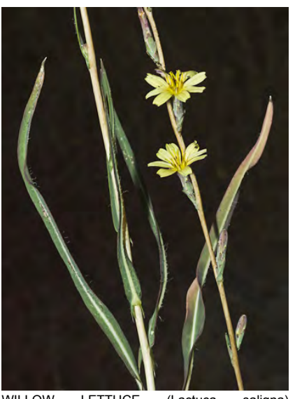
WILLOW LETTUCE (Lactuca saligna) Naturalized Annual - Sunflower Family -(Jul–Nov) - Roadsides, grassland - Stem 12-39" tall. Leaf lobes entire or few-toothed, no prickles underneath. Flowers 5-12, pale yellow, open in morning.