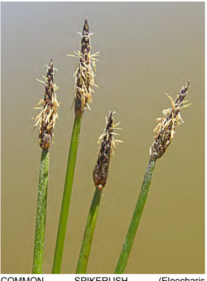
COMMON SPIKERUSH (Eleocharis macrostachya) Native Perennial - Sedge Family -(Spring-summer) - Common. Fresh to brackish wetland - Stem 8-39" tall, 0.06-0.1" wide. Spikelet 0.2-1.6" long, 0.08-0.2" wide, style 2-branched.