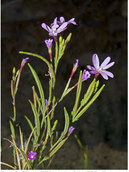
PANICLED / WEEDY WILLOWHERB (Epilobium brachycarpum) Native Annual - Evening Primrose Family - (Jun-Sep) - Common. Dry open or disturbed woodland, grassland, roadsides - Plant 8-79" tall, diffuse. Petals 2-15 mm long, white to rose-purple.