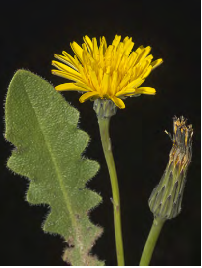
ROUGH CAT'S-EAR (Hypochaeris radicata) Naturalized Perennial - Sunflower Family -(Apr-Jul) - Disturbed areas, grassland, open woodland - Plant 4-32" tall, rough-hairy. Rays 0.4-0.6" long, well exceeding head bracts. Fruits all beaked. INVASIVE weed.