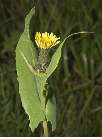
COMMON SOW THISTLE (Sonchus oleraceus) Naturalized Annual - Sunflower Family - (All year) - Abundant. Disturbed places - Plant 4-55" tall. Leaf teeth soft to touch. Basal lobes of upper leaves sharply pointed, straight to curving upward.