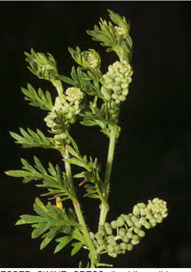
LESSER SWINE CRESS (Lepidium didymum) Naturalized Annual - Mustard Family - (Mar–Jul) -Common. Disturbed areas, fields, pastures -Stem 4-18" tall. Petals white, ~0.02" long. Fruit wrinkled, style < notch.