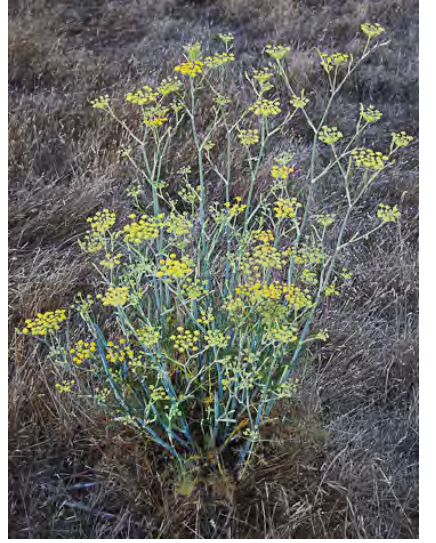
FENNEL (Foeniculum vulgare) Naturalized Perennial - Carrot Family - (May–Sep) -Roadsides, disturbed sites - Plants 3-6.5' tall, anise-scented. Stems waxy-blue, canelike. Flowers yellow. Leaf segments thread-like, edible when young. INVASIVE weed.