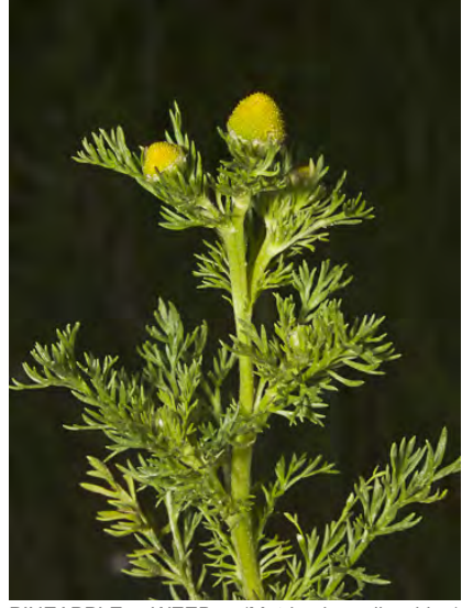
PINEAPPLE WEED (Matricaria discoidea) Naturalized Annual - Sunflower Family -(Feb-Aug) - Abundant. Disturbed sites, riverbanks - Plant 4-12" tall, sweet-scented. Heads pineapple-shaped, ~ 0.4" wide; head stalk to 0.6" long.