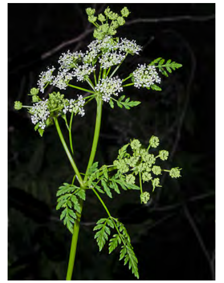
POISON HEMLOCK (Conium maculatum) Naturalized Biennial - Carrot Family - (Apr–Jul) -Common. Moist, esp disturbed places - Plants 2-10' tall. Stems purple-spotted. Leaves fern-like, gen 2x divided. Flowers white. TOXIC. INVASIVE weed.