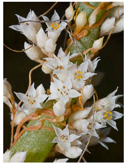
GOLDENTHREAD (Cuscuta pacifica var. pacifica) Native Annual - Morning-glory Family -(Jul–Oct) - Gen on Salicornia, Jaumea in coastal salt marshes, tidal flats - Vine. Stem thread-like. Flowers white, ~0.2" long.