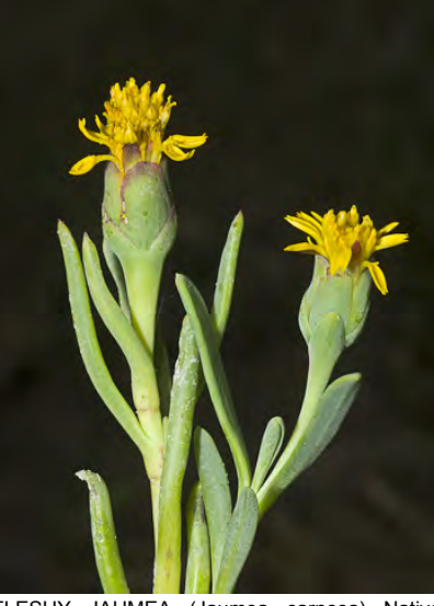
FLESHY JAUMEA (Jaumea carnosa) Native Perennial - Sunflower Family - (Apr–Dec) -Coastal salt marshes, bases of sea cliffs - Stem trailing. Leaf gen 0.6-2" long, fleshy. Flower head yellow, 0.5-0.8" long; rays 0.4-0.2" long, disks ~ 0.25" long. Aromatic.