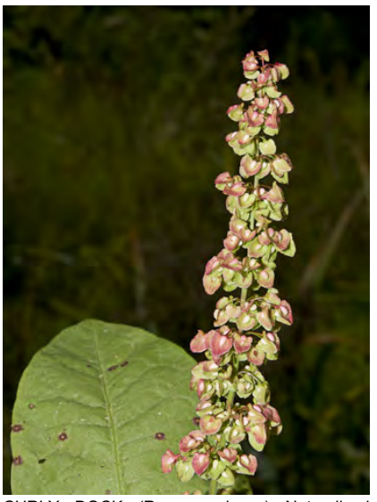
CURLY DOCK (Rumex crispus) Naturalized Perennial - Buckwheat Family - (All year) -Abundant. Disturbed places - Stem 16-39" tall. Flower cluster dense, valves 0.2-0.24", winged around tubercles, smooth edged. 1 tubercle enlarged. INVASIVE.