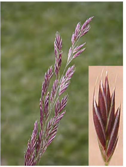
RED FESCUE (Festuca rubra) Native Perennial -Grass Family - (May–Jul) - Sand dunes, grassland, subalpine forest - Plant 12-32", hairy, clumped, w/closed sheath. Generally with rhizomes. Spikelets 0.4-0.5", florets 3-10, awns < 0.16" long.