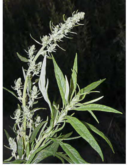
MUGWORT (Artemisia douglasiana) Native Perennial - Sunflower Family - (May–Nov) -Common. Open to shady areas, often in drainages - Plant 20-60" tall. Leaves gen 0.4-4" long, densely hairy below, some 3-5 lobed. Flower bracts hairy.