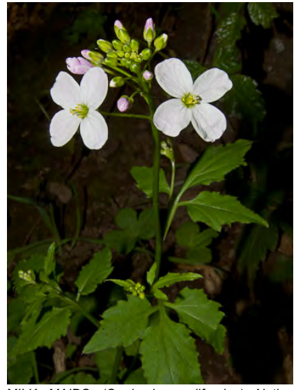
MILK MAIDS (Cardamine californica) Native Perennial - Mustard Family - (Jan-May) - Gen shaded sites, canyons, woodland. One of first spring flowers - Stem 10-24<sup>1</sup> long. Leaves lobed to compound w/sharp teeth. Petals white or pale rose, 0.3-0.5" long.