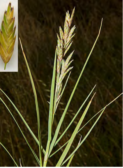
SALT GRASS (Distichlis spicata) Native Perennial - Grass Family - (Apr-Sep) - Salt marshes, coastal dunes, moist, alkaline areas -Stem 4-20" long. Leaves 0.8-4" long, flat, stiff. Flower cluster 0.8-3" long, narrow. Spikelets straw-colored to purple, 2-20/group, 0.24-0.8" long.