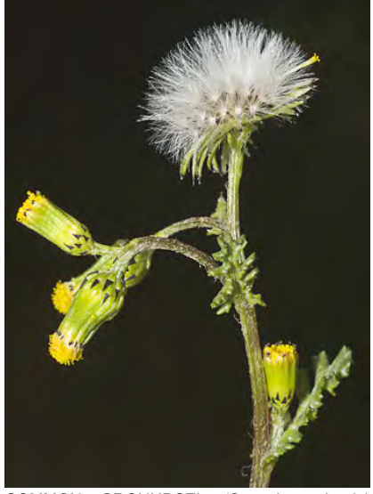
COMMON GROUNDSEL (Senecio vulgaris) Naturalized Annual - Sunflower Family -(Feb-Jul) - Common. Disturbed areas - Plant 4-24" tall, not hairy, w/1-10+ stems. Flower head bracts with black-tips. Milky sap.