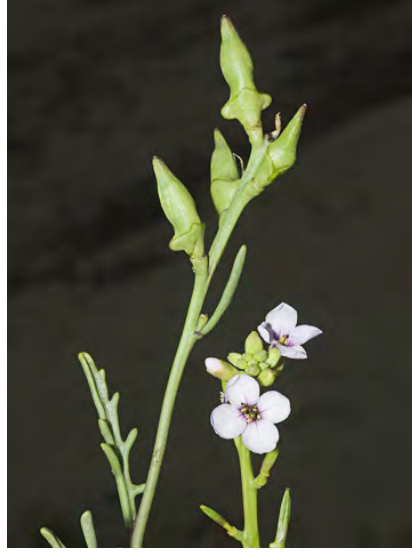
HORNED SEA ROCKET (Cakile maritima) Naturalized Annual - Mustard Family - (May-Nov) - Beach dunes - Plants low. Stem <= 32" long. Early leaves divided into long lobes; petals 0.1-0.3" wide, white to lavender. Fruit horned. INVASIVE weed.