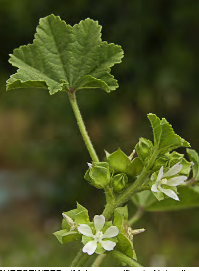
CHEESEWEED (Malva parviflora) Naturalized Annual - Mallow Family - (Mar–May) - Common. Disturbed places - Stem 8-32" long, gen erect, widely branched. Flower bractlets linear. Petals 0.1-0.2" long, pink to gen white. Fruit with flange from flower bracts.