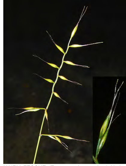
HAIRY FESCUE (Festuca microstachys) Native Annual - Grass Family - (Apr–Jun) - Disturbed, open, gen sandy soils - Stem 6-29". Spikelet 0.2-0.4" long, awn 0.1-0.5" long. Glumes & lemma smooth or hairy.