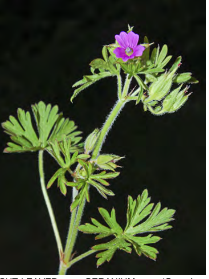
CUT-LEAVED GERANIUM (Geranium dissectum) Naturalized Annual - Geranium Family - (Mar-Jul) - Open, disturbed sites - Stem 3-28" tall, rough-hairy. Leaf blades deeply divided. Petals violet-red, 0.1-0.25" long w/notched tips. Flower stalk sticky. INVASIVE.