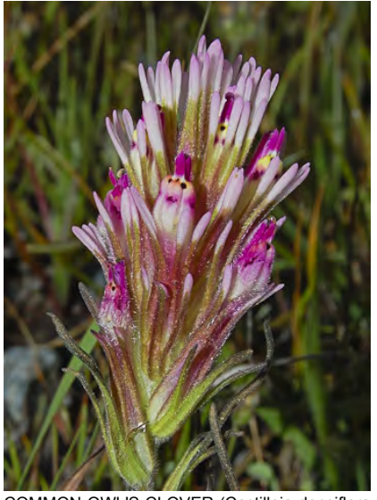
COMMON OWL'S-CLOVER (Castilleja densiflora subsp. densiflora) Native Annual – Broom-rape Family - (Mar–May) - Grassland - Plant 4-16" tall. Leaves 0.8-3.1" long, narrow-lobed. Flower cluster gen rose-purple. Flower upper lip straight.