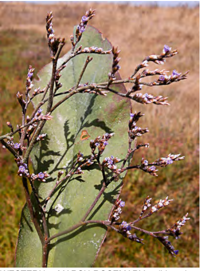
WESTERN MARSH-ROSEMARY (Limonium californicum) Native Perennial - Leadwort Family - (Jul-Dec) - Common; coastal dunes, salt marshes - Plant < 14" tall. Leaves all at base, blades 2-6" long, thick, unlobed. Flowers lavender to whitish.