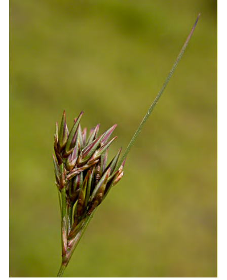
WESTERN RUSH (Juncus occidentalis) Native Perennial - Rush Family - (May–Sep) - Moist gen sunny areas - Plant 1-2' tall, tufted, stiff. Flower cluster gen tightly clustered. Leaves basal, < 1/2 stem length, 'petals' > 0.16".