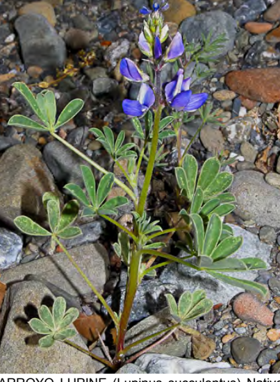
ARROYO LUPINE (Lupinus succulentus) Native Annual - Pea Family - (Feb–May) - Abundant. Open or disturbed areas, often seeded on roadbanks - Plant 8-40" tall, fleshy, sparsely hairy. Flowers 0.5-0.7" long, whorled, gen blue-purple, petal claws short-hairy.