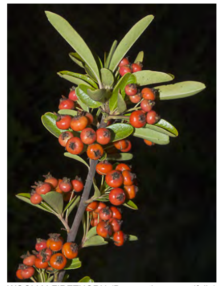
WOOLLY FIRETHORN (Pyracantha angustifolia) Naturalized Perennial - Rose Family - (Feb–Jun) - Disturbed areas, fencerows, abandoned fields, roadsides - Plant < 13', gray-hairy. Leaves narrow, entire. Calyx and below leaves often woolly. INVASIVE.