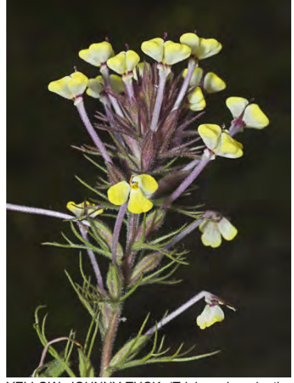
YELLOW JOHNNY-TUCK (Triphysaria eriantha subsp. eriantha) Native Annual - Broom-rape Family - (Mar–May) - Grassland, foothills - Plant 4-14" tall, purple. Leaves 0.4-2" long, 3-7 lobed. Flowers yellow with dark purple beak, 0.4-1" long.