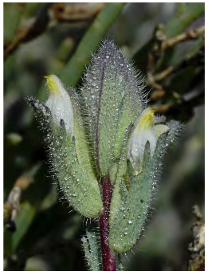
SOFT SALTY BIRD'S-BEAK (Chloropyron molle subsp. molle) Native Annual - Broom-rape Family - (Jul-Nov) - Coastal salt marshes - Plant 4-16" tall, gen soft-hairy. Flowers white to yellowish, 0.6-0.8" long. Fed: ENDANGERED Cal: RARE.