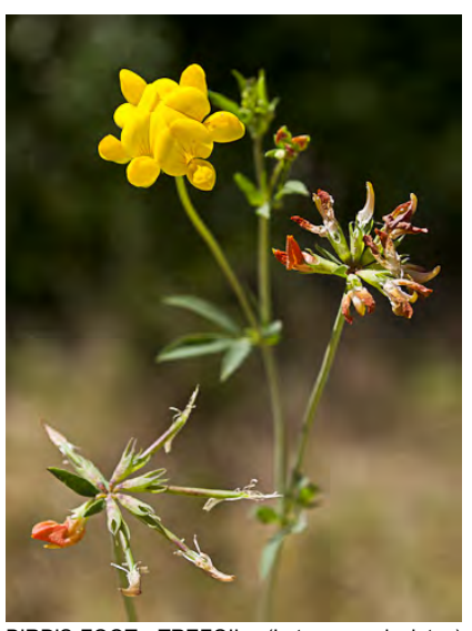
BIRD'S-FOOT TREFOIL (Lotus corniculatus) Naturalized Perennial - Pea Family - (Jun–Sep) -Open, disturbed areas - Leaflets 5, 0.16-0.9" long. Flower cluster 3-7 flowered on0.6-4.7" stalk. Flowers bright yellow, 0.4-0.55" long, banner often reddish.