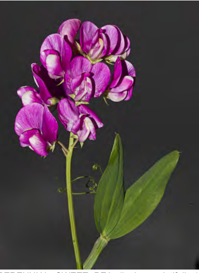
PERENNIAL SWEET PEA (Lathyrus latifolius) Naturalized Perennial - Pea Family - (Apr–May) -Disturbed areas, esp roadsides - Stem smooth, robust, broadly winged. Leaflets in 2's. Flowers 0.8-1.2" long, bright pink. Escaped ornamental.