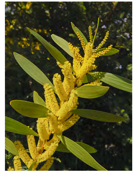
SYDNEY GOLDEN WATTLE (Acacia longifolia) Naturalized Perennial - Pea Family - (Jan-Apr) -Uncommon. Disturbed places, especially sandy coastal areas - Shrub-small tree, spineless. Leaves simple, 2-6" long with 2-4 main veins. Flowers bright yellow.