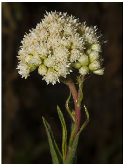
MARSH BACCHARIS (Baccharis glutinosa) Native Perennial - Sunflower Family - (Jul–Oct) -Coastal freshwater and saltwater marshes, streambanks - Plant herbaceous, sticky, 3-6' tall. Leaf blades lance-shaped, < 5" long, 0.5-1.2" wide.