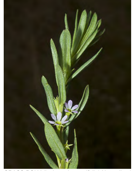
GRASS-POLY (Lythrum hyssopifolia) Naturalized Annual-Perennial - Loosestrife Family - (Apr–Oct) - Marshes, drying pond margins, disturbed ground - Stem 4-24". Leaves 0.2-1.2" long, ~ elliptical. Petals pink, 0.1-0.2" long. 2 awl-like appendages. INVASIVE weed.