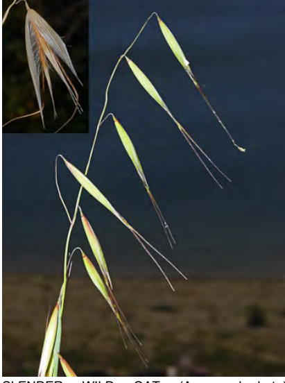
SLENDER WILD OAT (Avena barbata) SLENVEK WILD OAI (Avena barbata) Naturalized Annual - Grass Family - (Mar–Jun) -Disturbed sites - Plants gen 24-32". Spikelets 0.8-1.2" long. Awns 0.8-1.8" long. Lemma tip bristles >= 0.1" long. Seeds EDIBLE whole or ground for flour. INVASIVE weed.