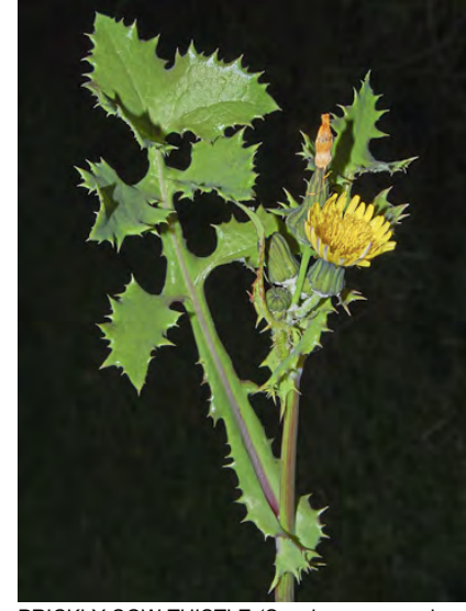
PRICKLY SOW THISTLE (Sonchus asper subsp. asper) Naturalized Annual - Sunflower Family - (All year) - Common. Slightly moist disturbed sites, along streams - Plant 4-48". Leaf teeth prickly. Basal lobes of upper leaves rounded, curving downward.