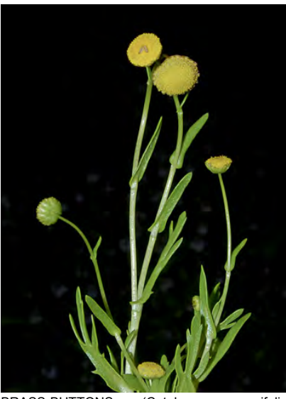
BRASS-BUTTONS (Cotula coronopifolia) Naturalized Perennial - Sunflower Family -(Mar-Dec) - Common. Saline and freshwater marshes, mud flats - Plant 2-16"+ tall, smooth, ± fleshy. Leaves linear to lance-shaped w/linear teeth or lobes. INVASIVE.