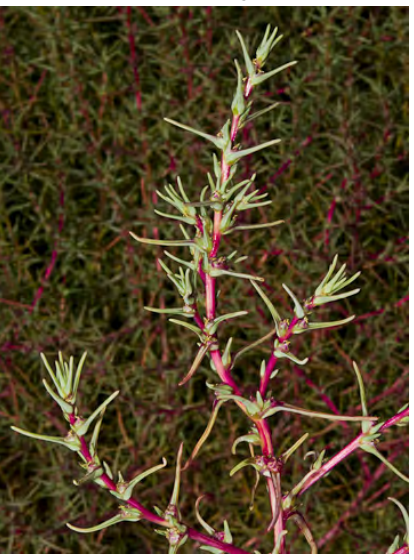
FLESHY RUSSIAN THISTLE (Salsola soda) Naturalized Annual - Goosefoot Family -(Jul–Oct) - Uppermost intertidal zone, saline or muddy flats, open areas in salt marshes - Plant 6-18" tall, succulent, branched from base, not red-striped. INVASIVE weed.