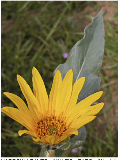
NARROW-LEAVED MULE'S EARS (Wyethia angustifolia) Native Perennial - Sunflower Family - (Apr–Aug) - Grassland - Plant 4-35" tall, rough-hairy. Leaves narrow, veins all similar, base blades 4-20" long. Ray flowers 0.6-1.8" long.