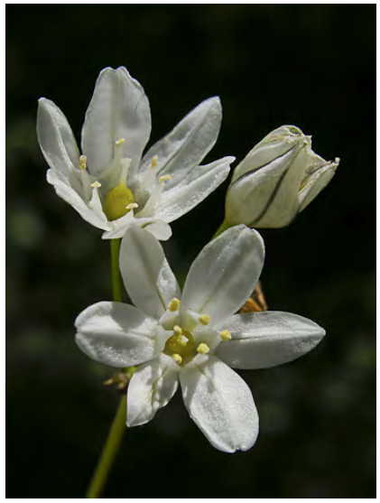
FOOL'S ONION (Triteleia hyacinthina) Native Perennial - Brodiaea Family - (Mar–Jul) -Grassland, vernally wet meadows, occ drier slopes - Flowering stem 1-2' tall. Leaves 4-16", 0.16-0.9" wide. Flower stalks 0.2-0.6" long. Flowers white, 0.35-0.6" long.