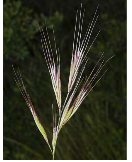
FOXTAIL CHESS (Bromus madritensis subsp. madritensis) Naturalized Annual - Grass Family - (Apr–Jan) - Disturbed areas, roadsides - Plants 4-20" tall. Stem and sheathes smooth. Flower cluster branches visible, lower spikelets erect, > stalk.