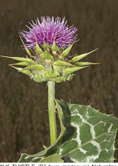
MILK THISTLE (Silybum marianum) Naturalized Annual-Biennial - Sunflower Family - (Feb–Jun) -Roadsides, pastures, disturbed areas - Stem 1-10', stout. Leaves spiny, shiny green w/white veins and spots. Flowers red-purple. INVASIVE weed.