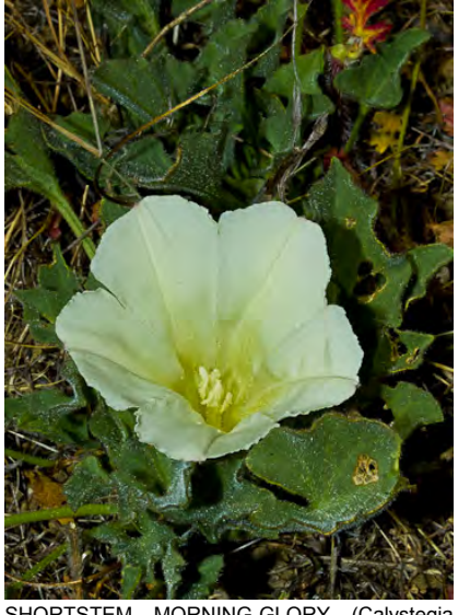
SHORTSTEM MORNING-GLORY (Calystegia subacaulis subsp. subacaulis) Native Perennial - Morning-glory Family - (Apr–Jun) - Dry, open scrub or woodland - Stem gen ~0.8" long. Flowers 1.3-2.4" long, white or cream. Bractlets concealing flower bracts.