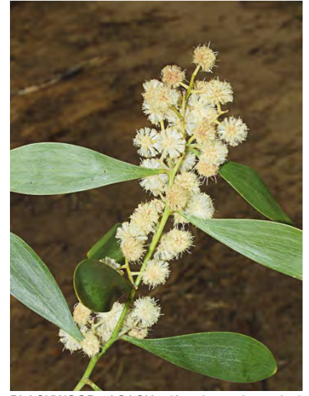
BLACKWOOD ACACIA (Acacia melanoxylon) Naturalized Perennial - Pea Family - (Feb-Mar) -Uncommon. Disturbed areas - Tree < 100' tall. Leaves simple, 0.2-1.2" wide, 3-5 main veins. Flowers pale yellow, 2-8 per head. INVASIVE weed.