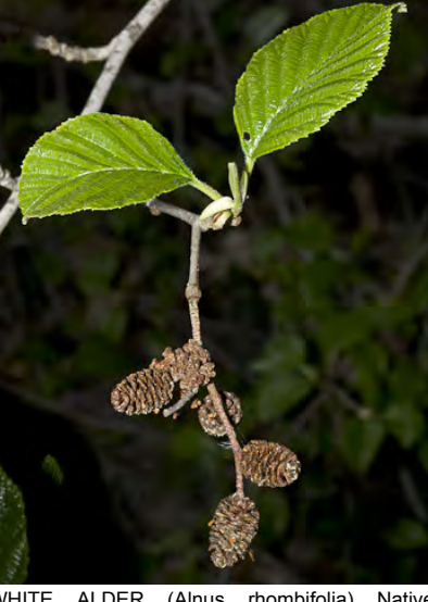
WHITE ALDER (Alnus rhombifolia) Native Perennial - Birch Family - (Apr–Jun) - Along permanent streams - Tree. Leaves flat, not rusty underneath, margins serrate, not rolled under. Female flowers cone-like. Wood used for furniture and for smoking meats.