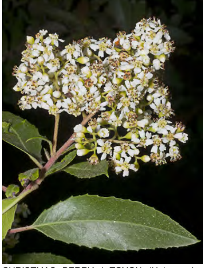
CHRISTMAS BERRY / TOYON (Heteromeles arbutifolia) Native Perennial - Rose Family -((May)Jun-Aug) - Chaparral, oak woodland, mixed-evergreen forest - Shrub-tree < 33' tall, evergreen. Leaf 2-4" long. Petals white, < 0.16" long. Fruit bright red.