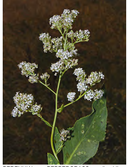
PERENNIAL PEPPERGRASS (Lepidium latifolium) Naturalized Perennial - Mustard Family - Jun-Sep) - Pastures, disturbed areas, fields, grassland, saline meadows, streambanks, sagebrush scrub, edge of marshes - Plant 14-47". Petals white. NOXIOUS.