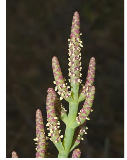
PACIFIC PICKLEWEED (Salicornia pacifica) Native Perennial - Goosefoot Family - (Jul–Nov) -Salt marshes, alkaline flats - Plant 4-28" tall, branching from base, branches opposite. Flower clusters 0.8-3.3" long, 0.1-0.2" wide.