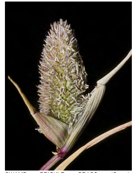
SWAMP PRICKLE GRASS (Crypsis schoenoides) Naturalized Annual - Grass Family - (Jun–Oct) - Wet places - Plant mat-like. Stem 2-30" long. Leaf blade 1-4" long. Flower cluster 0.1-3" long, 0.2-0.6" wide. Spikelet ~0.1" long.