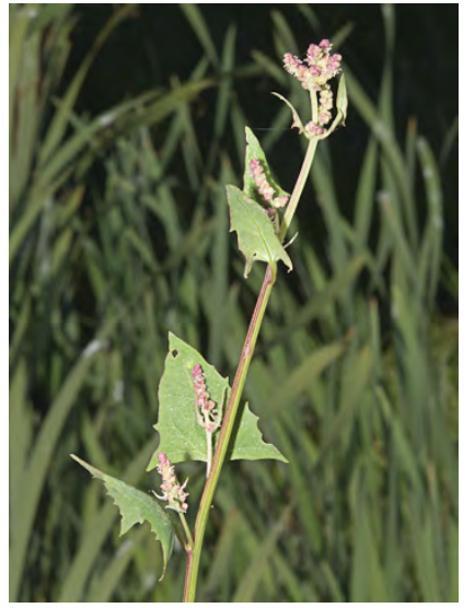
FAT-HEN (Atriplex prostrata) Native Annual -Goosefoot Family - (Apr–Oct) - Wet places, marshes - Plant 4-48" tall, branched at base. Leaves alternate, blades 0.4-3.5" long, triangular, green, not dense-scaly underneath.