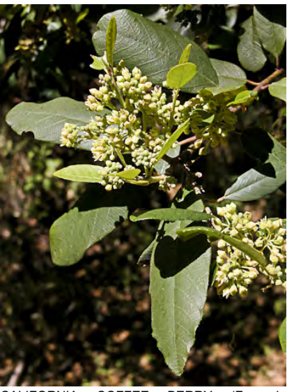
CALIFORNIA COFFEE BERRY (Frangula californica subsp. californica) Native Perennial - Buckthorn Family - (May–Jul) - Coastal-sage scrub, chaparral, forest, woodland - Shrub < 16' tall. Flowers greenish. Leaves smooth beneath.