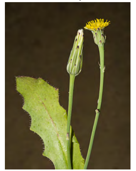
SMOOTH CAT'S-EAR (Hypochaeris glabra) Naturalized Annual - Sunflower Family -(Mar–Jun) - Common. Disturbed areas, grassland, open woodland - Plant 4-24" tall, smooth. Rays 0.2-0.3" long, barely > head bracts. Only inner fruit beaked. INVASIVE.