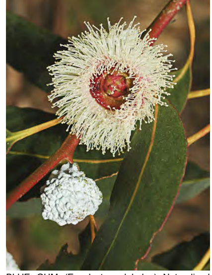
BLUE GUM (Eucalyptus globulus) Naturalized Perennial - Myrtle Family - (Oct–Jan) - Common. Disturbed areas - Tree < 200' tall. Flowers single, large, gen stemless. Leaves 4-12" long, 1-1.6" wide; used medicinally by Aboriginals. INVASIVE weed.