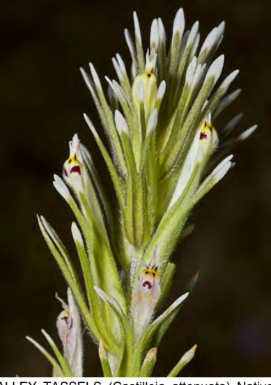
VALLEY TASSELS (Castilleja attenuata) Native Annual - Broom-rape Family - (Mar–May) -Grassland - Plant 4-20" tall, hairy, non-sticky. Leaves 0.8-3.1" long, narrow, 0-3 lobes. Flower cluster 1-12" long, narrow, tips white or pale yellow.