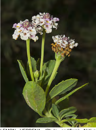
LEMON VERBENA (Phyla nodiflora) Native Perennial - Vervain Family - (May–Nov) - Wet places, pond margins - Mat-like. Leaf blade 0.2-1.2" long, < 0.4" wide, 5-11 teeth. Flowers white to red. Flower stem 0.6-3.5" tall. Ornamental.