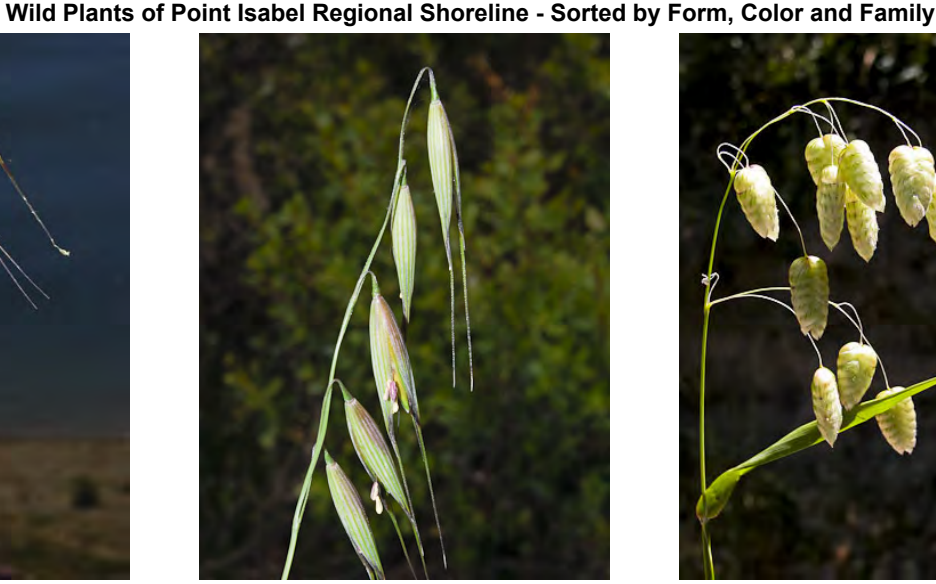
WILD OAT (Avena fatua) Naturalized Annual -Grass Family - (Apr–Jun) - Disturbed sites -Plants 1-5' tall. Spikelets 0.7-1.3" long. Low awn 1-1.6" long. Lemma tip bristles < 0.04" long. Seeds EDIBLE whole or ground for flour. INVASIVE weed.