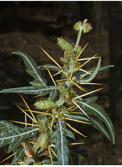
SPINY COCKLEBUR (Xanthium spinosum) Native Annual - Sunflower Family - (Jul–Oct) -Disturbed, seasonally wet, often alkaline sites, in grassland, marshes, watercourses - Plant 4-24". Stem node spines 0.6-1.2" long, golden, gen 3-lobed. Bur 0.4-0.5" long.