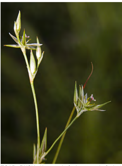
TOAD RUSH (Juncus bufonius var. bufonius) Native Annual - Rush Family - (May–Sep) - Damp sunny ground, gen disturbed - Stem gen 1-4" tall, gen brached from base, ~0.04" wide. Flower cluster open. Flowers 0.16-0.3" long.