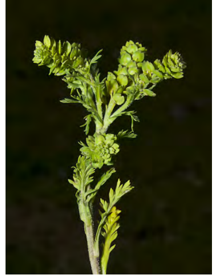
PROSTRATE PEPPERGRASS (Lepidium strictum) Naturalized Annual - Mustard Family -(Apr–Jun) - Uncommon. Disturbed areas, woodland, slopes - Stem 2.8-6.7", gen crawling. Leaves pinnately lobed. Flower cluster crowded, stallk < fruit, sepals stay.