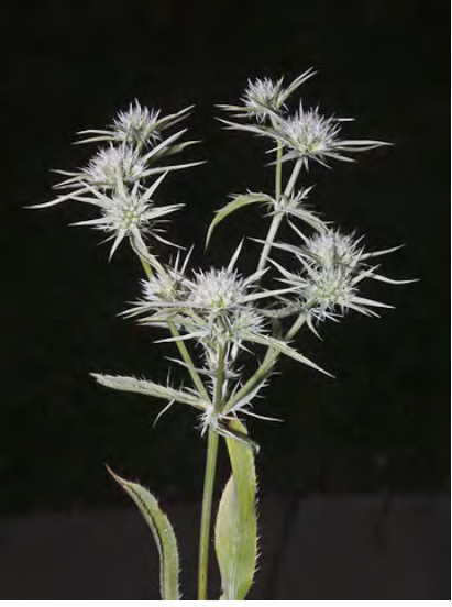
BUTTON CELERY (Eryngium jepsonii) Native Perennial - Carrot Family - (Apr–Aug) - Moist clay soil, vernal pools, lake shores, drying lakes, wet depressions - Leaf blade toothed-irreg lobed. Sepals 0.1", smooth-edged. Flowers white to blue or purple.