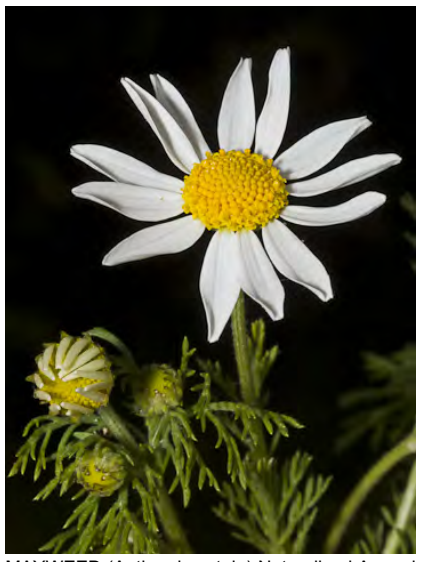
MAYWEED (Anthemis cotula) Naturalized Annual -Sunflower Family - (Apr–Aug) - Common. Disturbed areas, fields, coastal dunes, chaparral, oak woodland - Leaves finely divided into thread-like lobes. Flowers > 0.6" wide, many on top of a well-branched stem.