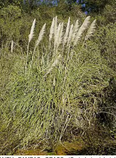
HAIRY PAMPAS GRASS (Cortaderia jubata) Naturalized Perennial - Grass Family - (Sep–Feb) - Disturbed sites, many habitats, esp coastal -Plant 6-23' tall. Leaf blades 0.1-0.5" wide, sheathes hairy. NOXIOUS weed.