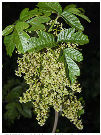
WESTERN POISON OAK (Toxicodendron diversilobum) Native Perennial - Sumac Family - (Apr-Jun) - Canyons, slopes, chaparral, coastal scrub, oak woodland - Shrub or vine. Leaflets 3, red in fall, mid leaflet stalked. Flowers green. Fruits white. TOXIC.