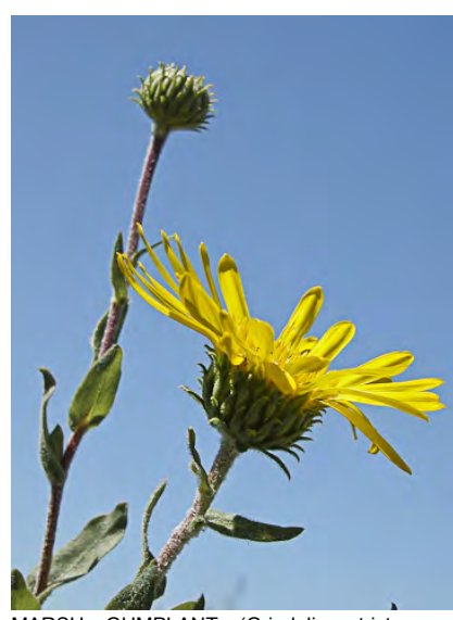
MARSH GUMPLANT (Grindelia stricta var. angustifolia) Native Perennial - Sunflower Family - (May–Dec) - Tidal wetlands - Plant 3.3-6.6' tall, woody base, evergreen. Leaves 0.4-6" long, fleshy, not resinous. Flower rays yellow, 16-56, 0.5-0.7" long.