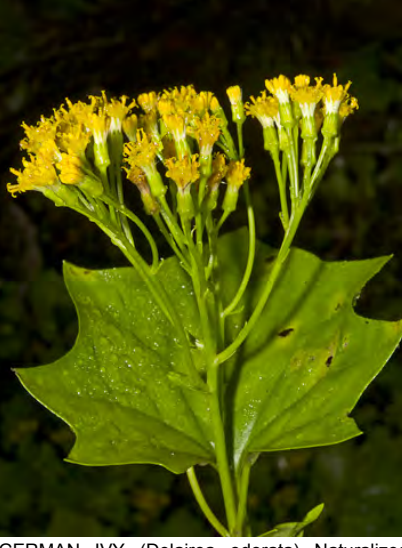
GERMAN IVY (Delairea odorata) Naturalized Perennial - Sunflower Family - (Nov–Mar) -Shady, ± disturbed places, riparian woodland, coastal scrub - Vine stem 3-20' long. Heads ~ 20 per cluster. Disk flowers bright yellow. NOXIOUS weed.