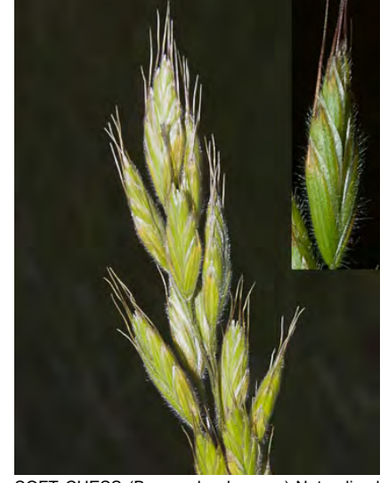
SOFT CHESS (Bromus hordeaceus) Naturalized Annual - Grass Family - (Apr-Jul) - Fields, disturbed areas - Plant 4-26" tall. Leaf hairy. Flower cluster 1-5" long, dense, some stalks > spikelet. Spikelet 0.5-0.9". Lemma 0.26-0.4", awn 0.16-0.4". INVASIVE weed.