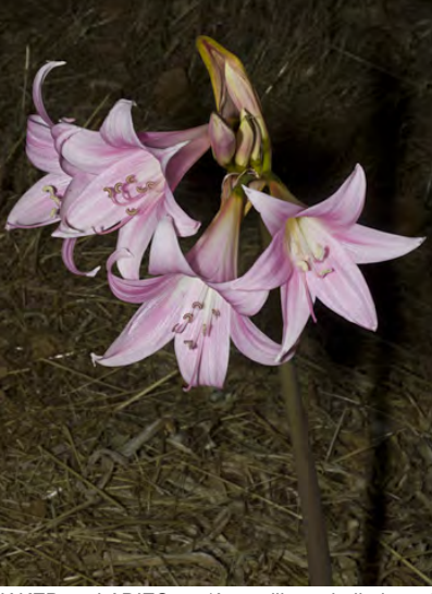
NAKED LADIES (Amaryllis belladonna) Naturalized Perennial - Amaryllis Family -(Jul-Sep) - Disturbed sites, often around abandoned home sites - Stems leafless, 1-2' tall. Flowers large and pink (sometimes white or yellow at the base). Escaped ornamentals.