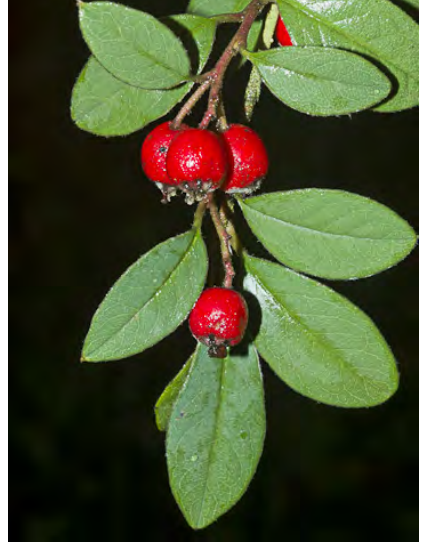
SILVERLEAF COTONEASTER (Cotoneaster pannosus) Naturalized Perennial - Rose Family -(May–Jul) - Disturbed places, mixed-evergreen forest - Leaves 0.8-1.4" long, pointed tip, smooth above. Petals white, spreading. Fruit red. INVASIVE weed.