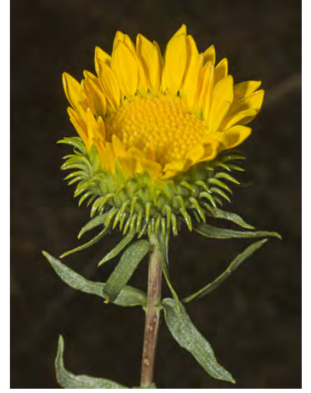
GREAT VALLEY GUMPLANT (Grindelia camporum) Native Perennial - Sunflower Family - (May–Nov) - Sandy or saline bottomland, roadsides - Stem non-woody, 2-8' tall, whitish. Leaves gen resinous. Head to 1.2" wide, bracts bend downward.