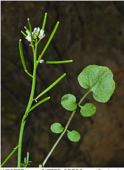
WESTERN BITTER-CRESS (Cardamine oligosperma) Native Annual - Mustard Family - (Mar-Jul) - Wet meadows, shady banks, damp areas - Plants < 16". Leaves divided into 5-9 leaflets. Flowers white, 0.1-0.2" long. Fruit < 0.1" wide.