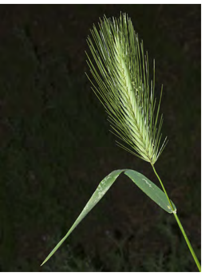
HARE BARLEY (Hordeum murinum subsp. leporinum) Naturalized Annual - Grass Family - (Feb-May) - Moist, gen disturbed sites. Common - Stem 12-43" tall. Central spikelet stalk ~0.06" long. Central floret << lateral florets. INVASIVE weed.