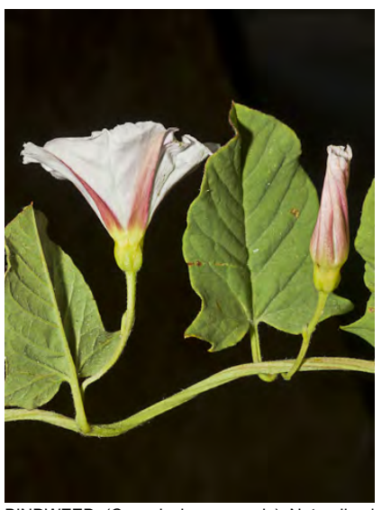
BINDWEED (Convolvulus arvensis) Naturalized Perennial - Morning-glory Family - (Mar–Oct) -Roadsides, open areas in many pl communities -Trailing. Leaf 0.8-1.2" long, w/round tip, pointed lobes. Flowers white to pink, 0.8-1" long. NOXIOUS.