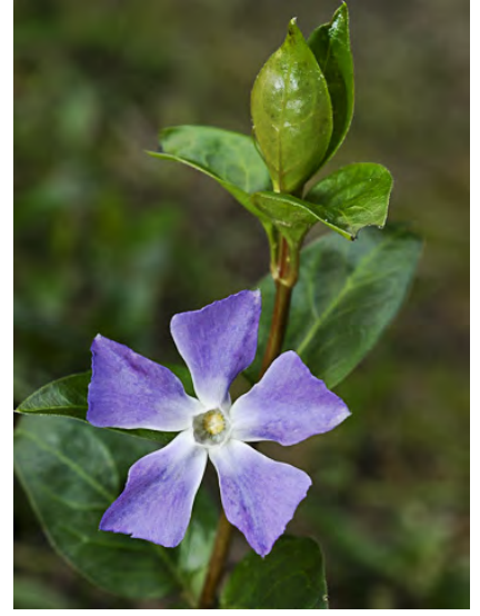
GREATER PERIWINKLE (Vinca major) Naturalized Perennial - Dogbane Family -(Mar–Jun(Jan)) - Coastal bluffs, sheltered places, esp along stream beds - Plant sprawling. Leaf blade ~ 2.8" long, oval. Flower purple-blue, 1.2-2" wide at top. INVASIVE weed.