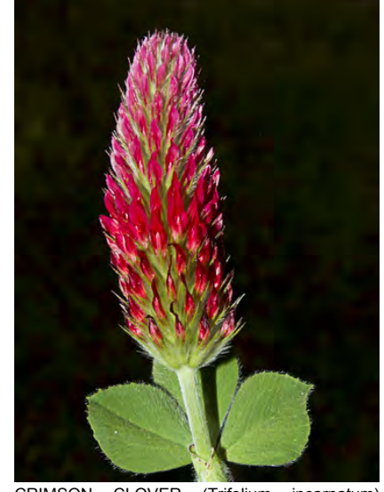
CRIMSON CLOVER (Trifolium incarnatum) Naturalized Annual - Pea Family - (May–Aug) -Uncommon. Disturbed areas - Hairy. Leaflets 0.6-0.8" long, wedge-shaped. Flower cluster 0.8-2.4" long, cylindrical. Flowers crimson or white, 0.4-0.6" long.