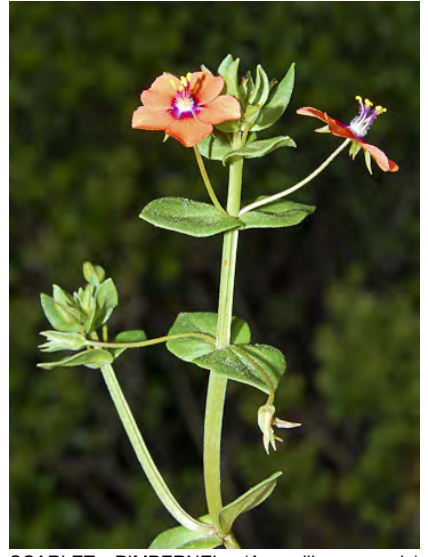
SCARLET PIMPERNEL (Anagallis arvensis) Naturalized Annual - Myrsine Family - (Mar–May) - Common. Disturbed places, ocean beaches -Plants 2-16" tall. Flowers 0.2-0.3" long, salmon or occasionally blue. Leaves TOXIC, can cause dermititis.