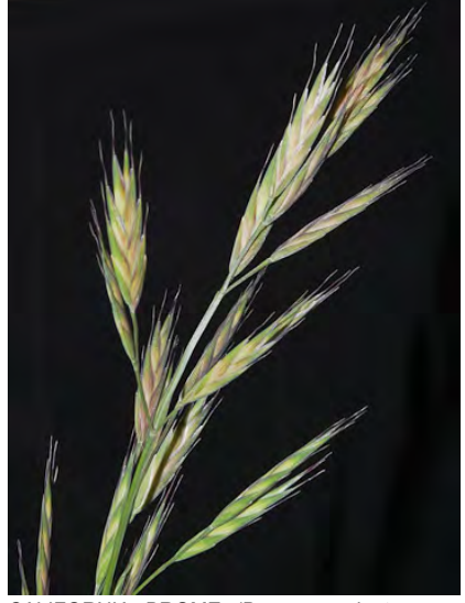
CALIFORNIA BROME (Bromus carinatus var. carinatus) Native Perennial - Grass Family -(Apr-Aug) - Coastal prairies, openings in chaparral, plains, open oak and pine woodland -Plant 20-40" tall. Flower cluster 6-16" long. Spikelet 0.8-1.6" long. Lemma 0.5-0.8" long, hairy, awn 0.3-0.6" long.