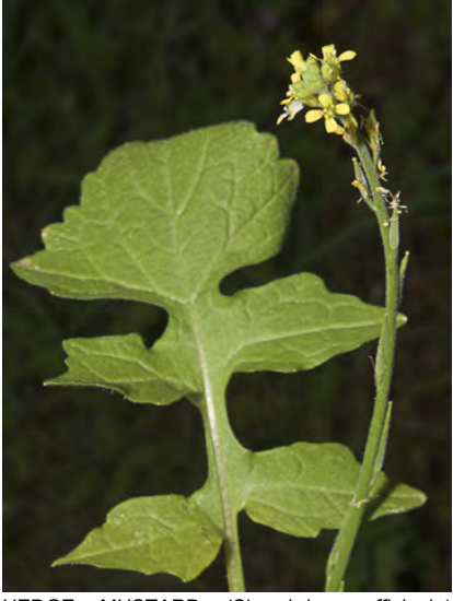
HEDGE MUSTARD (Sisymbrium officinale) Naturalized Annual - Mustard Family - (Apr–Sep) - Disturbed areas, fields, pastures - Stem 10-22" tall, thin, wiry. Petals 0.1-0.16" long, pale yellow. Fruit 0.4-0.55" long, awl-shaped, appressed.