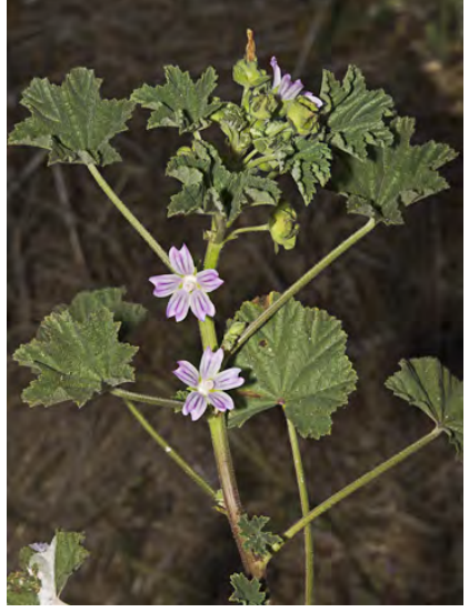
BULL MALLOW (Malva nicaeensis) Naturalized Annual - Mallow Family - (Mar–Jun) - Disturbed places - Stem 0.7-2'. Leaf blade 1.2-4.7" wide, 5-7 shallow lobes. Bractlets egg-shaped,0.16-0.2" long. Petals pink to blue-violet, 0.2-0.5" long.