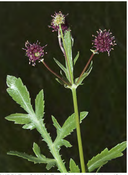
PURPLE SANICLE (Sanicula bipinnatifida) Native Perennial - Carrot Family - (Mar–May) -Open grassland, gen on serpentine, or pine/oak woodland - Plant 5-24" tall. Leaves 1.6-7.5" long, 1-2x divided on a winged central axis. Flowers dark purple. Fruits prickly.