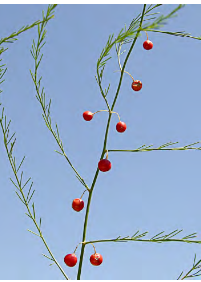
GARDEN ASPARAGUS (Asparagus officinalis subsp. officinalis) Naturalized Perennial - Lily Family - (Mar-Sep) - Disturbed places, roadsides, fields - Stem 3-10' tall. Flowers green-white, 3-7 mm long. Fruits red, ~0.3" long. Escaped garden vegetable.