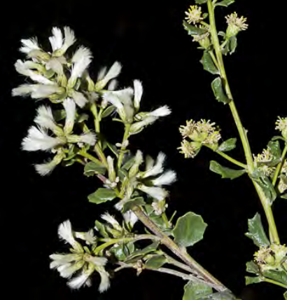
COYOTE BRUSH (Baccharis pilularis subsp. consanguinea) Native Perennial - Sunflower Family - (Jul-Dec) - Coastal bluffs, woodland, grassland, disturbed sites, occ on serpentine - Shrub < 15' tall, brittle, common. Leaves gen 0.6-1.6" long.