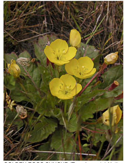
GOLDEN EGGS SUNCUP (Taraxia ovata) Native Perennial - Evening Primrose Family - (Mar–Jun) - Grassy fields, gen clay soil - Stemless. Leaf blade oval, 1.2-6" long w/long stalks. Flower stalks leafless. Petals yellow, 0.3-0.9" long. Ovary hidden.