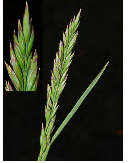
JUNE GRASS (Koeleria macrantha) Native Perennial - Grass Family - (May–Jul) - Dry, open sites, clay to rocky soils, shrubland, woodland, conifer forest - Stem 8-32" long. Flower cluster condensed, shiny, branches short-hairy. Spikelet ~0.2" long, no awns.

Wild Plants of Point Isabel Regional Shoreline - Sorted by Form, Color and Family