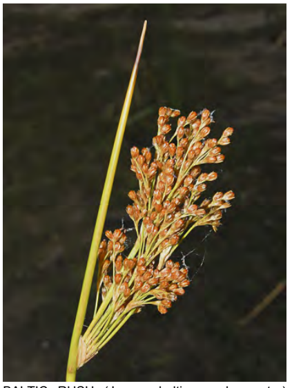
BALTIC RUSH (Juncus balticus subsp. ater) Native Perennial - Rush Family - (Jul–Nov) -Moist to \pm dry sites - Stem 14-43" tall, round, not twisted. No leaf blade. Flowers generally 0.1-0.2" long.