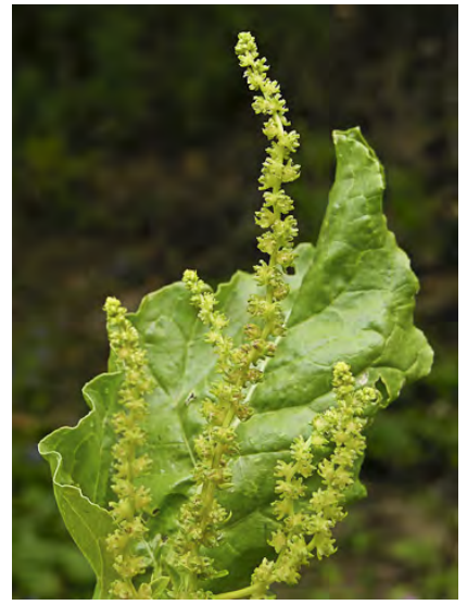
SEA BEET (Beta vulgaris subsp. maritima) Naturalized Annual - Goosefoot Family -(Feb-Sep) - Moist sandy places, disturbed areas -Plant succulent. Stem < 32" tall. Leaf blades < 4" long. Fruits fall in clusters.