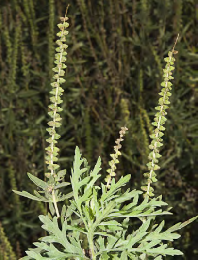
WESTERN RAGWEED (Ambrosia psilostachya) Native Perennial - Sunflower Family - (Jun–Nov) -Common. Roadsides, dry fields - Plant 1-6.5' tall, upright with long roots. Leaves 1-5' long with narrow lobes. Fruits spineless. Allergenic pollen.