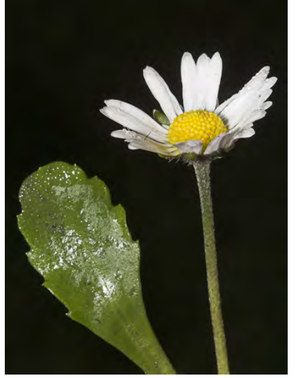
ENGLISH DAISY (Bellis perennis) Naturalized Perennial - Sunflower Family - (Dec–Sep) - Damp, grassy areas - Herbaceous lawn weed. Leaves 0.8-4" long, spoon-shaped. Ray flowers white, 0.3-0.4" long, narrow. Disk flowers yellow, \sim 0.1 " long.