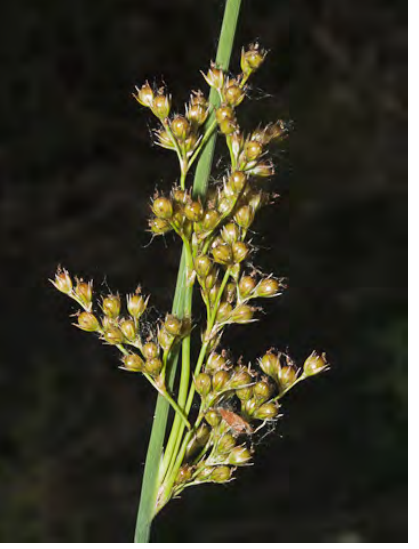
SPREADING RUSH (Juncus patens) Native Perennial - Rush Family - (Jun–Oct) - Marshy places, creeks, seeps - Plant 12-41" tall, densely tufted. Stems blue-gray-green & distinctly grooved when fresh. Stamens 6.