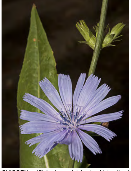
CHICORY (Cichorium intybus) Naturalized Perennial - Sunflower Family - (Apr-Oct) -Common. Roadsides, disturbed places - Plants 16-78" tall. Stems leafless. Leaves dandelion-like. Flowers pale blue, 0.8-1.6" wide. Roots roasted as coffee substitute.