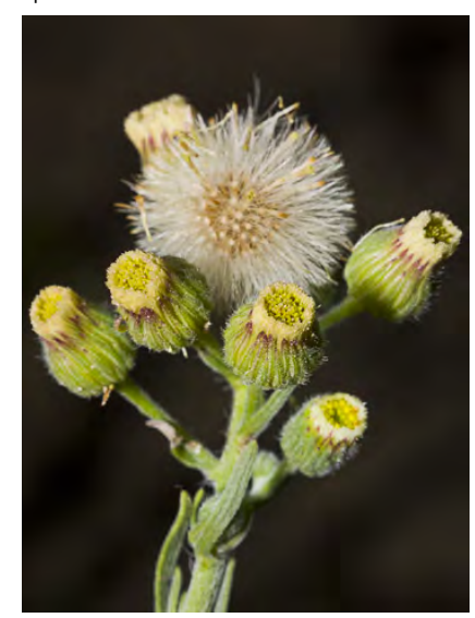
FLAX-LEAVED HORSEWEED (Erigeron bonariensis) Naturalized Annual - Sunflower Family - (All year) - Disturbed sites - Plant 4-39" tall, gray-hairy. Upper leaves narrow. Disk flowers yellow, disk-like rays white. Head bracts 0.14-0.2" tall.