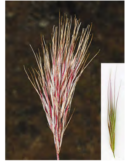
RED BROME (Bromus madritensis subsp. rubens) Naturalized Annual - Grass Family -(Mar–Jun) - Disturbed areas, roadsides - Plant 4-20". Flower cluster condensed, branches obscure, < spikelets. Stem & sheathes hairy. INVASIVE weed.