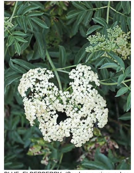
BLUE ELDERBERRY (Sambucus nigra subsp. caerulea) Native Perennial - Muskroot Family -(Mar-Sep) - Common. Streambanks, open places in forest - Shrub 7-26' tall. Flower cluster flat-topped, 1.6-13" diam, petals spreading. Fruits waxy blue-black.