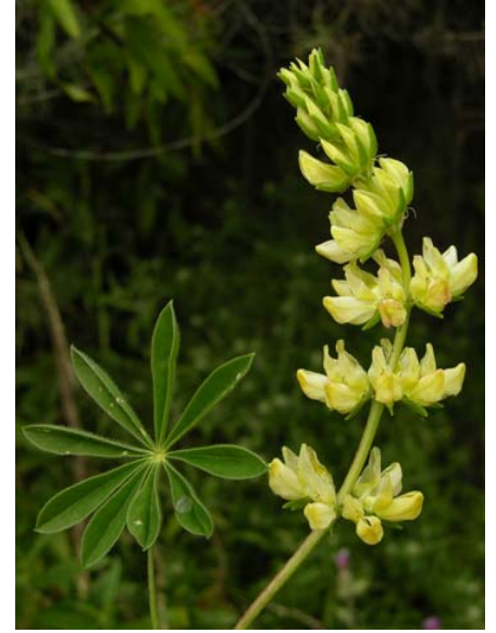
Gully Lupine Lupinus microcarpus var. densiflorus Native Annual Pea Family