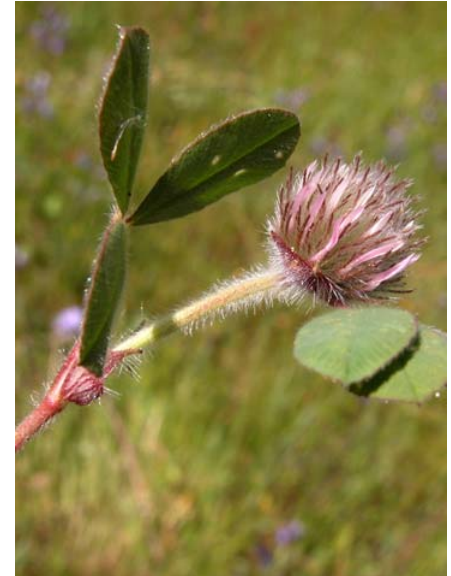
Rose Clover Trifolium hirtum Introduced Annual Pea Family