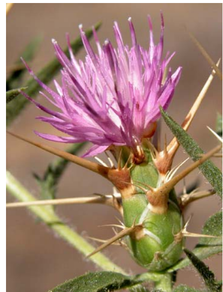
Purple Star Thistle Centaurea calcitrapa Introduced Annual-Biennial Sunflower Family