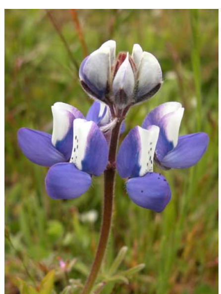
Douglas Sky Lupine Lupinus nanus Native Annual Pea Family