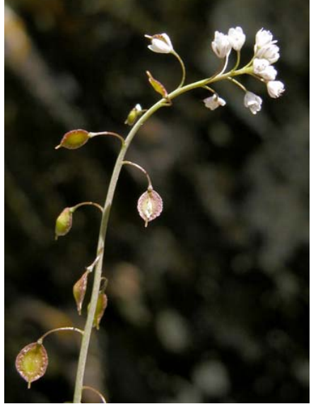
Hairy Fringepod Thysanocarpus curvipes Native Annual Mustard Family