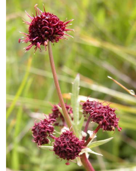
Purple Sanicle Sanicula bipinnatifida Native Perennial Carrot Family