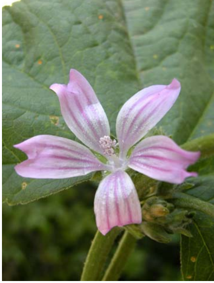
Bull Mallow Malva nicaeensis Introduced Annual Mallow Family