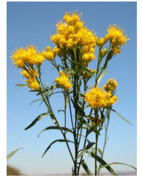
Western Goldenrod Euthamia occidentalis Native Perennial Sunflower Family