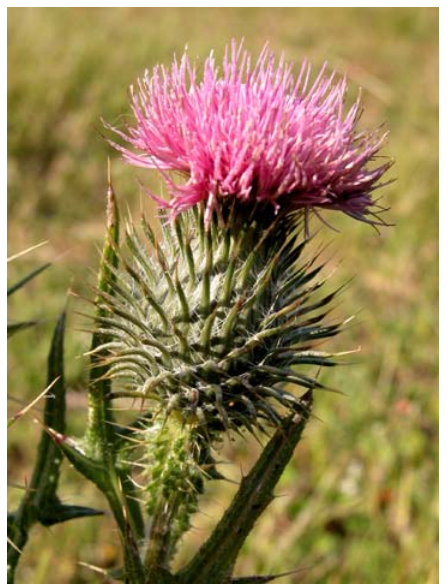
Bull Thistle Cirsium vulgare Introduced Biennial Sunflower Family