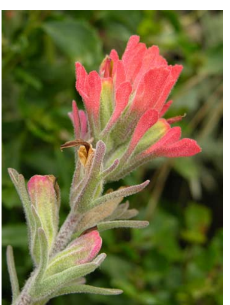
Woolly Paintbrush Castilleja foliolosa Native Perennial Snapdragon Family