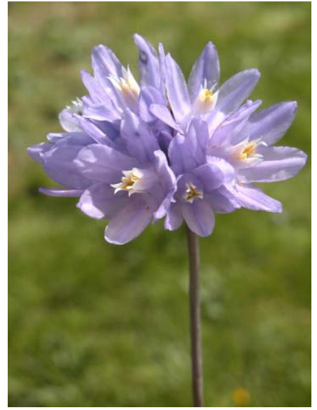
Blue Dicks Dichelostemma capitatum ssp. capitatum Native Perennial Lily Family