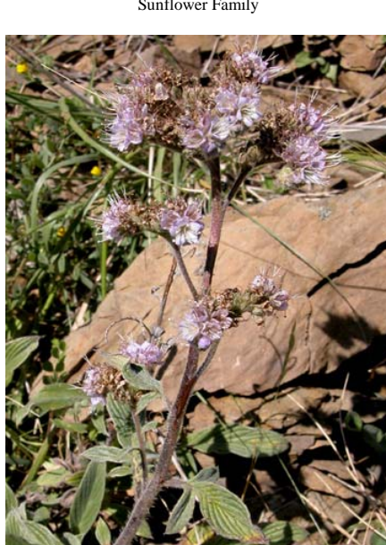
California / Rock Phacelia Phacelia californica Native Perennial Waterleaf Family