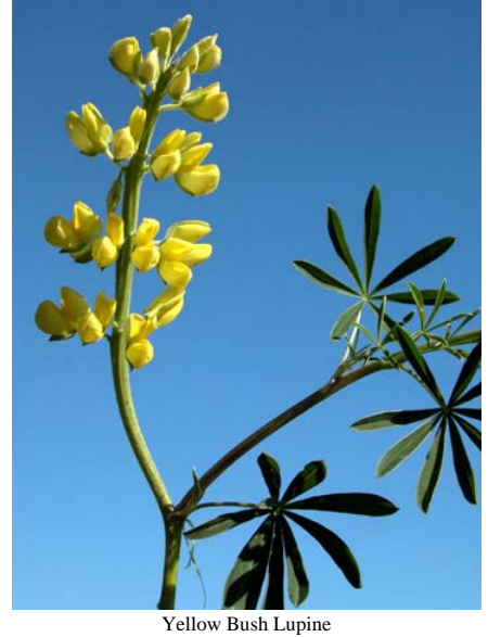
Yellow Bush Lupine Lupinus arboreus Native Perennial Pea Family