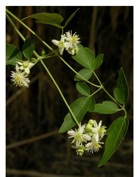
Western Virgin's Bower Clematis ligusticifolia Native Perennial Buttercup Family