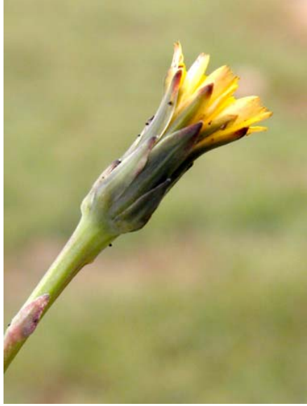
Smooth Cat's-ear Hypochaeris glabra Introduced Annual Sunflower Family