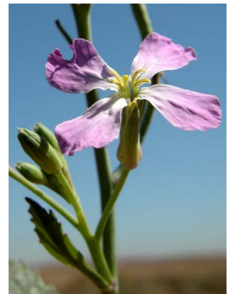
Wild Radish Raphanus sativus Introduced Annual Mustard Family