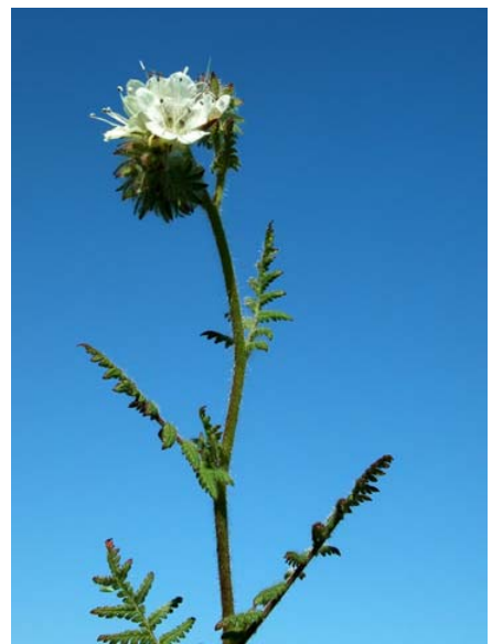
Wild Heliotrope Phacelia Phacelia distans Native Annual Waterleaf Family