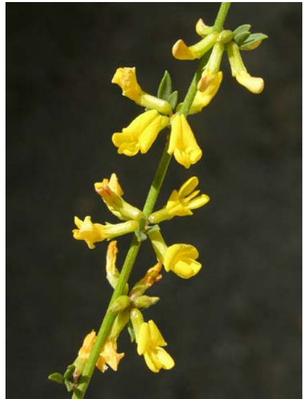
Deerweed Lotus scoparius var. scoparius Native Perennial Pea Family