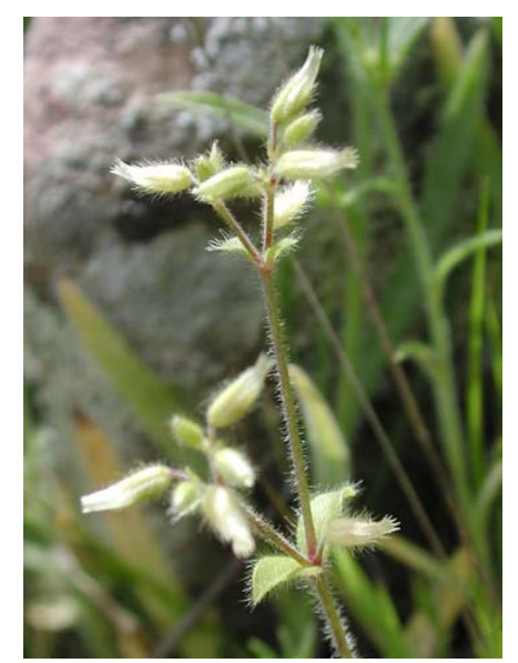
Mouse-ear Chickweed Cerastium glomeratum Introduced Annual Pink Family