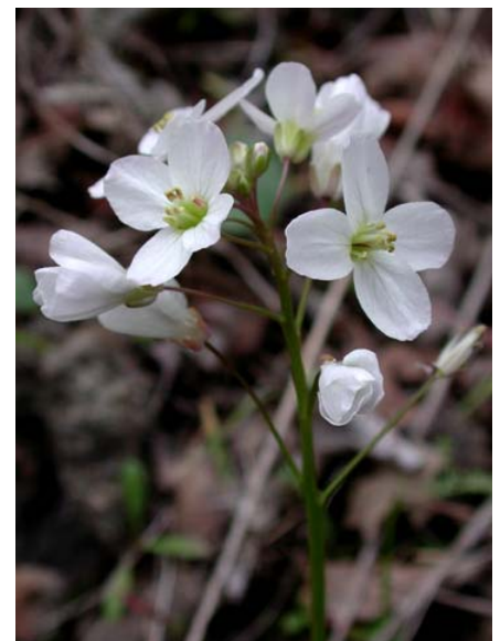
Milkmaids Cardamine californica Native Perennial Mustard Family