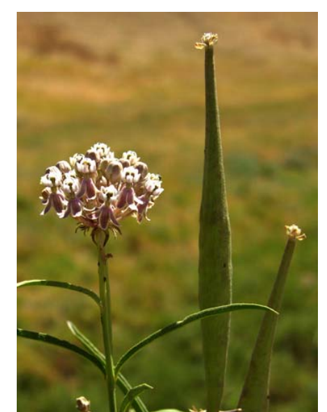
Whorled/Narrow-leaf Milkweed Asclepias fascicularis Native Perennial Milkweed Family