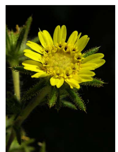
Fitch Spikeweed Hemizonia fitchii Native Perennial Sunflower Family