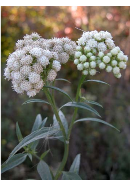
Douglas/Salt Marsh Baccharis Baccharis douglasii Native Perennial Sunflower Family