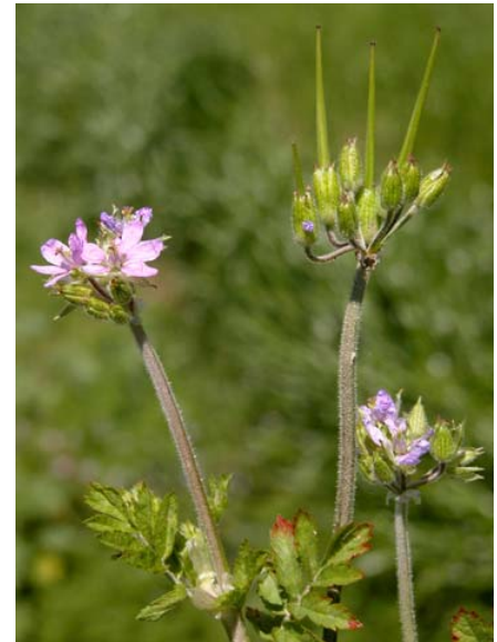
White-stem Filaree Erodium moschatum Introduced Annual Geranium Family