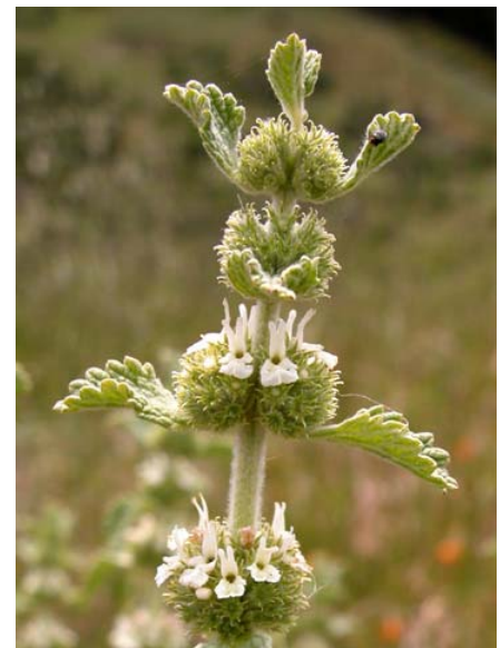
Common Horehound Marrubium vulgare Introduced Perennial Mint Family