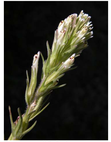
Valley Tassels Castilleja attenuata Native Annual Snapdragon Family