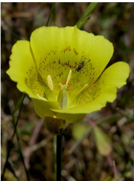
Yellow Mariposa Lily Calochortus luteus Native Perennial Lily Family