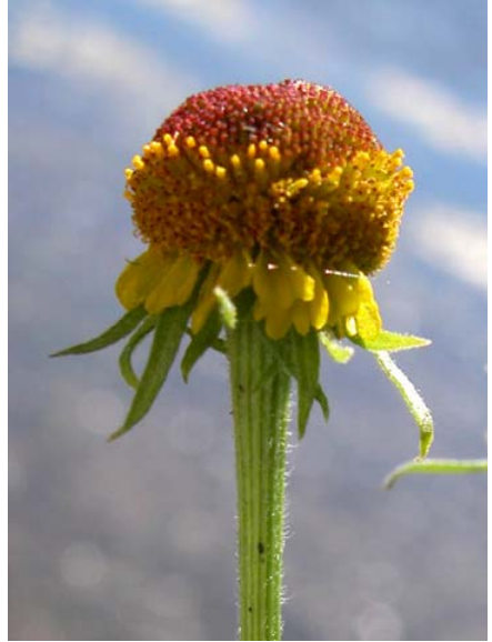
Rosilla Helenium puberulum Native Biennial Sunflower Family