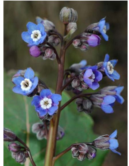
Large Hound's Tongue Cynoglossum grande Native Perennial Borage Family