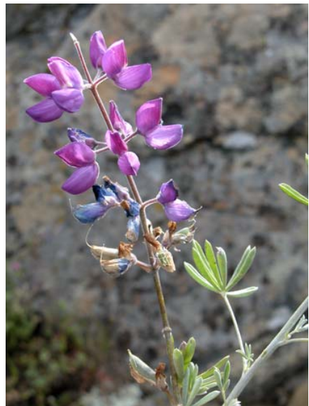
Bay Area Silver Lupine Lupinus albifrons var. collinus Native Perennial Pea Family