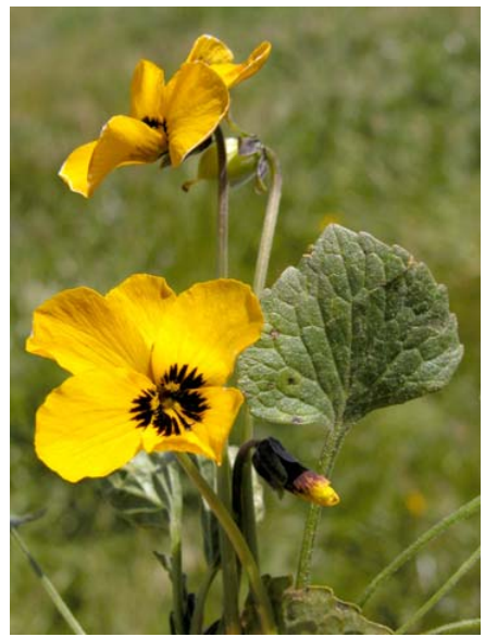
Johnny-Jump-Up / Wild Pansy Viola pedunculata Native Perennial Violet Family