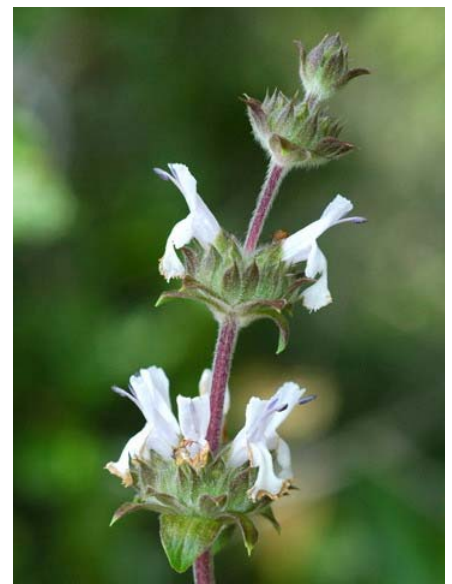
Black Sage Salvia mellifera Native Perennial Mint Family