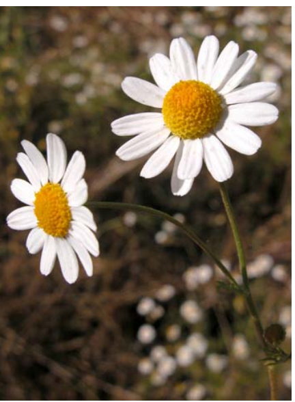
Mayweed Anthemis cotula Introduced Annual Sunflower Family