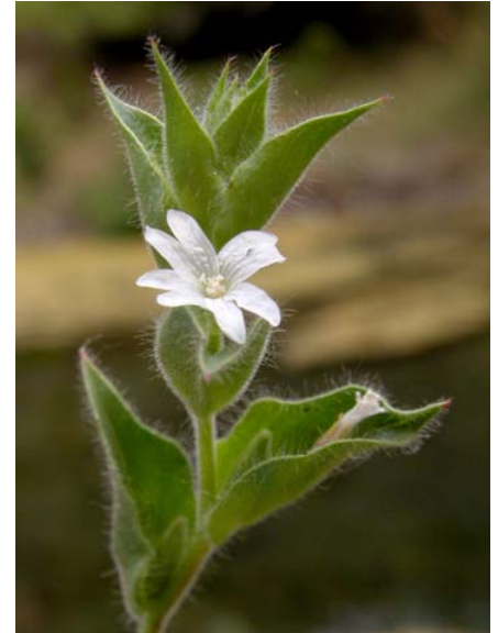
Dense-flower Willowherb Epilobium densiflorum Native Annual Evening Primrose Family