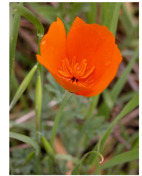
California Poppy Eschscholzia californica Native Perennial Poppy Family