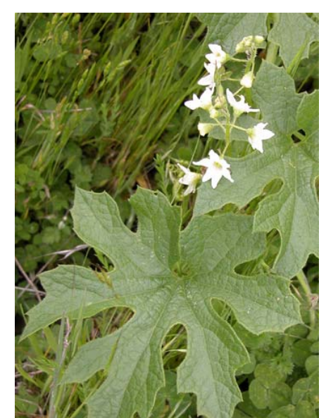
Oregon / Coast Manroot Marah oreganus Native Perennial Gourd Family