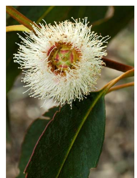
Blue Gum Eucalyptus globulus Introduced Perennial Myrtle Family