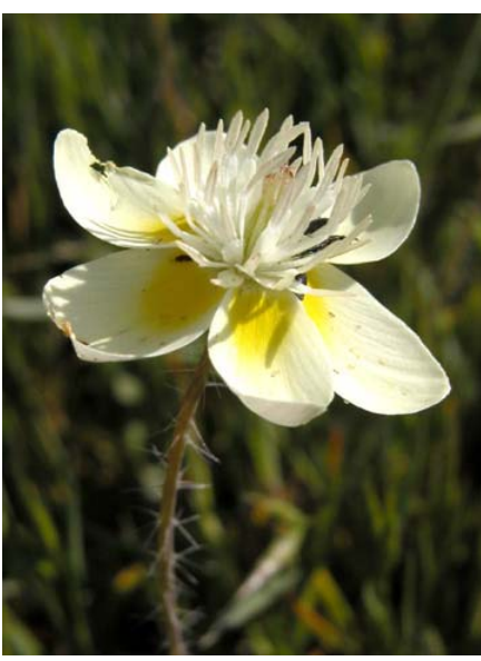
Cream Cups Platystemon californicus Native Annual Poppy Family