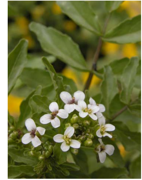
White Water Cress Rorippa nasturtium-aquaticum Native Perennial Mustard Family