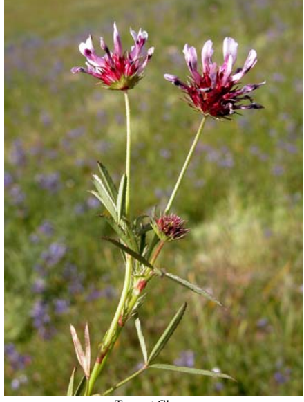
Tomcat Clover Trifolium willdenovii Native Annual Pea Family