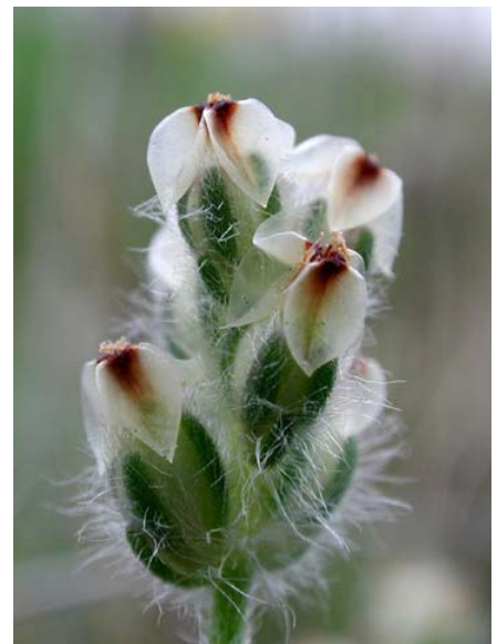
California Dwarf Plantain Plantago erecta Native Annual Plantain Family