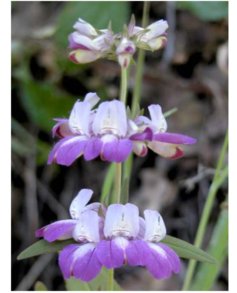
Chinese Houses Collinsia heterophylla Native Annual Snapdragon Family