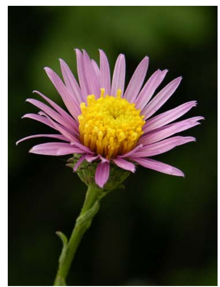
Common Lessingia Lessingia filaginifolia var. filaginifolia Native Perennial Sunflower Family