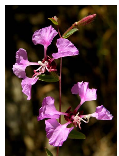
Elegant Clarkia Clarkia unguiculata Native Annual Evening Primrose Family