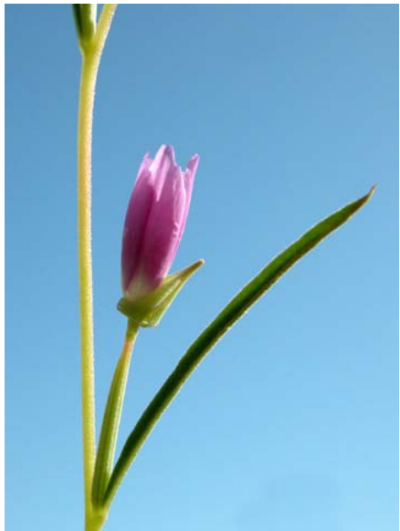
Small Clarkia Clarkia affinis Native Annual Evening Primrose Family