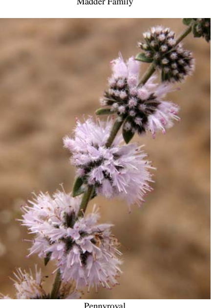
Pennyroyal Mentha pulegium Introduced Perennial Mint Family