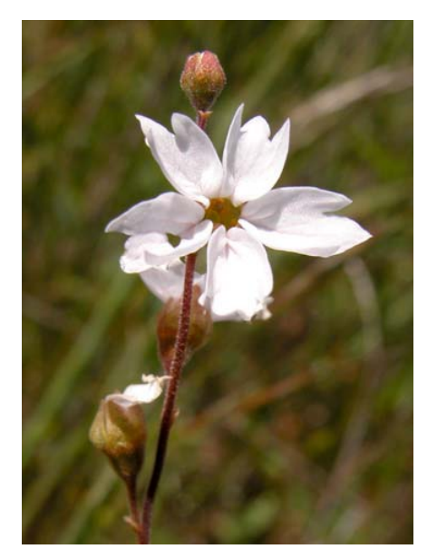
Woodland Star Lithophragma affine Native Perennial Saxifrage Family