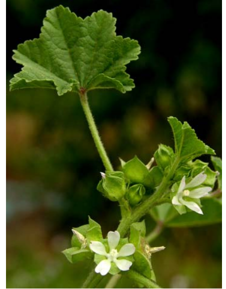
Hidden-flower Cheeseweed Malva parviflora Introduced Annual Mallow Family