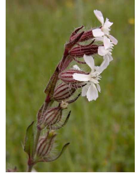
Windmill Pink Silene gallica Introduced Annual Pink Family