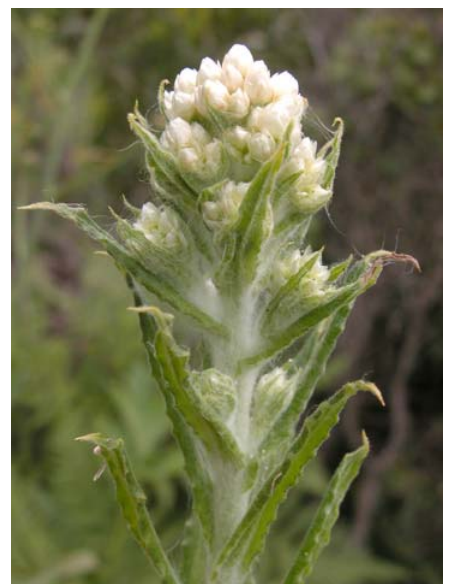
California Everlasting Gnaphalium californicum Native Biennial Sunflower Family