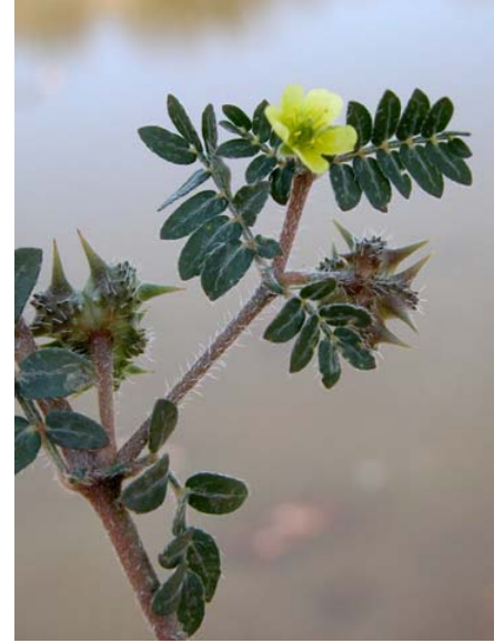
Puncture Vine Tribulus terrestris Introduced Annual Caltrop Family