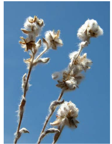
Slender Cottonweed Micropus californicus var. californicus Native Annual Sunflower Family