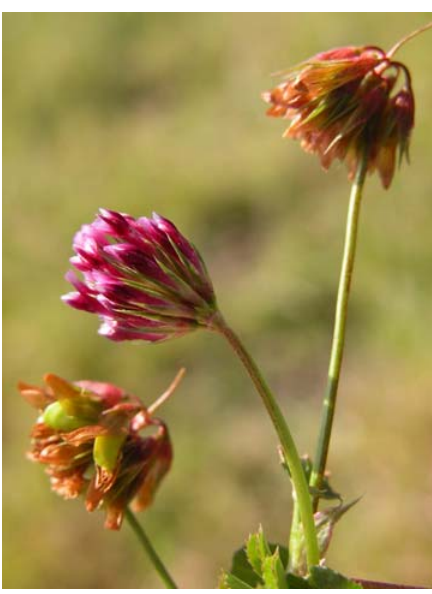
Pinpoint Clover Trifolium gracilentum var. gracilentum Native Annual Pea Family