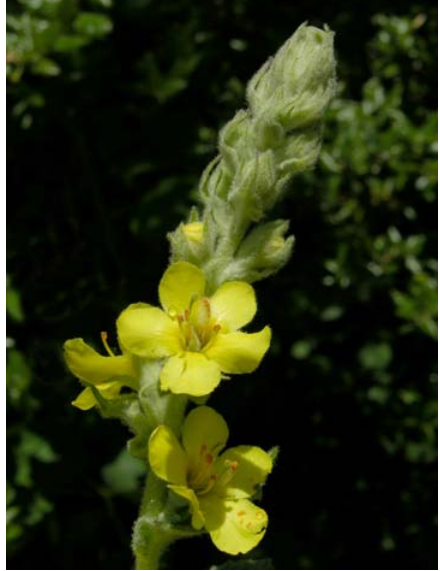
Common Woolly Mullein Verbascum thapsus Introduced Biennial Snapdragon Family