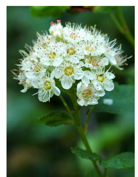
Pacific Ninebark Physocarpus capitatus Native Perennial Rose Family