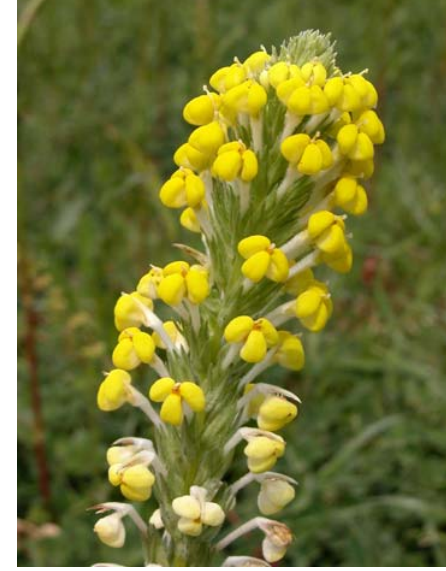
Yellow Johnny-tuck Triphysaria eriantha ssp. eriantha Native Annual Snapdragon Family