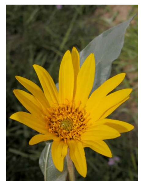
Narrow-leaf Mule's Ear Wyethia angustifolia Native Perennial Sunflower Family