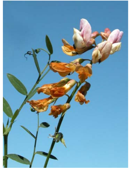
Pale Purple Pacific Pea Lathyrus vestitus var. vestitus Native Perennial Pea Family