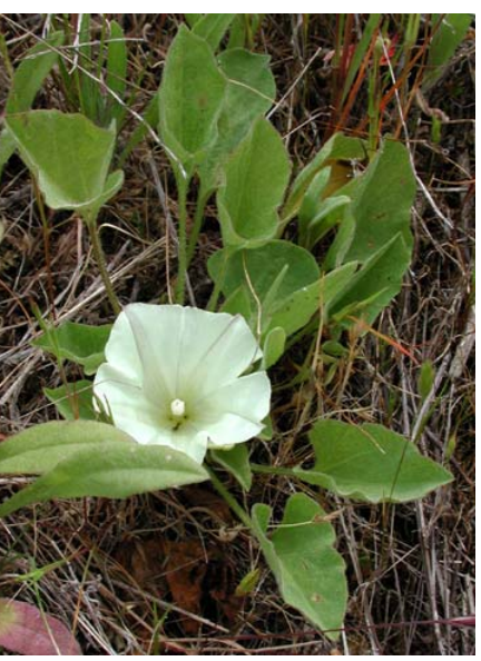
Shortstem Morning Glory Calystegia subacaulis ssp. subacaulis Native Perennial Morning-Glory Family