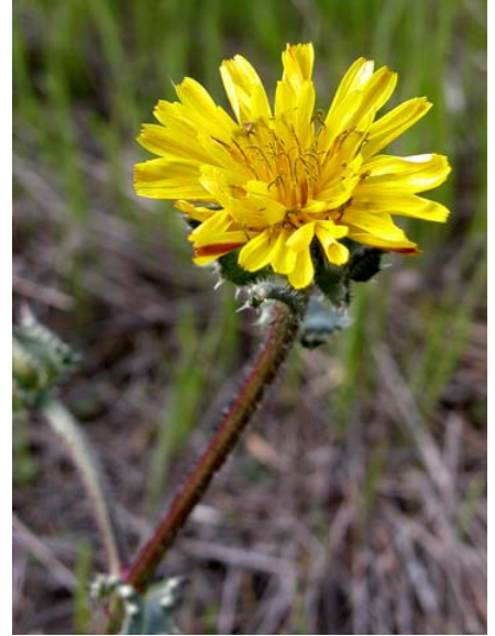
Bristly Ox-tongue Picris echioides Introduced Annual-Biennial Sunflower Family