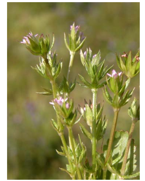
Blue Field Madder Sherardia arvensis Introduced Annual Madder Family