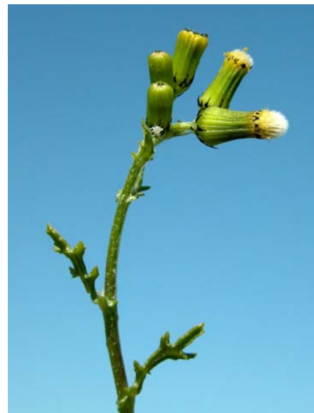
Common Groundsel Senecio vulgaris Introduced Annual Sunflower Family