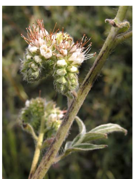
Rock Phacelia Phacelia imbricata ssp. imbricata Native Perennial Waterleaf Family