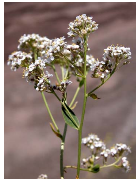
Slender Peren. Peppergrass Lepidium latifolium Introduced Perennial Mustard Family