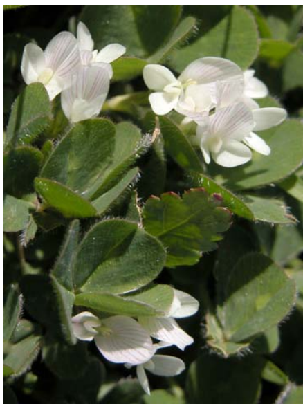
Subterranean Clover Trifolium subterraneum Introduced Annual Pea Family