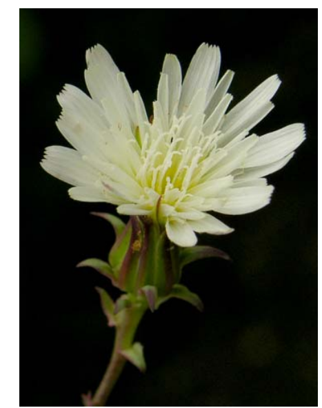
California White Chicory Rafinesquia californica Native Annual Sunflower Family