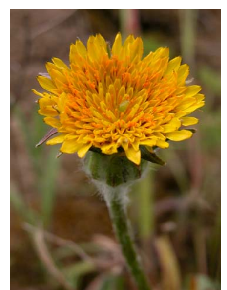
Large-flower Native Dandelion Agoseris grandiflora Native Perennial Sunflower Family