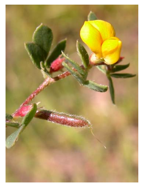
California Lotus Lotus wrangelianus Native Annual Pea Family