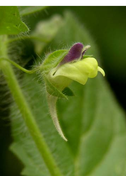
Sharp Point Fluvellin Kickxia elatine Introduced Annual Snapdragon Family