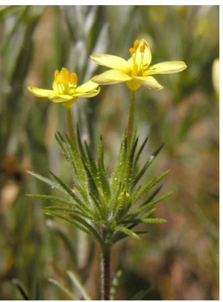
Bristly Linanthus Linanthus acicularis Native Annual Phlox Family