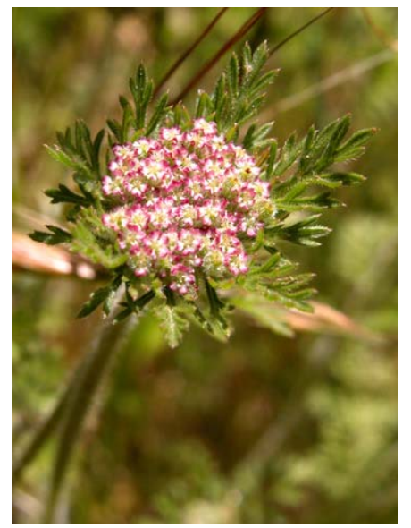
Rattlesnake Weed Daucus pusillus Native Annual Carrot Family