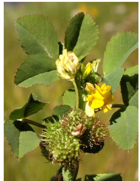
California Bur Clover Medicago polymorpha Introduced Annual Pea Family