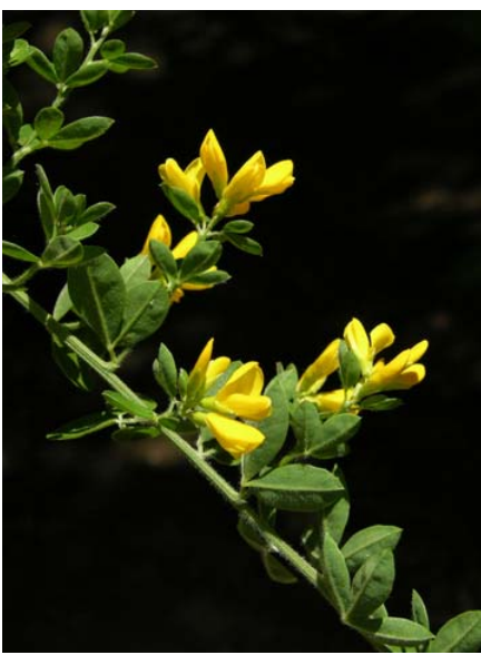
French Broom Genista monspessulana Introduced Perennial Pea Family