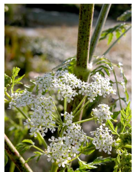
Poison Hemlock Conium maculatum Introduced Biennial Carrot Family