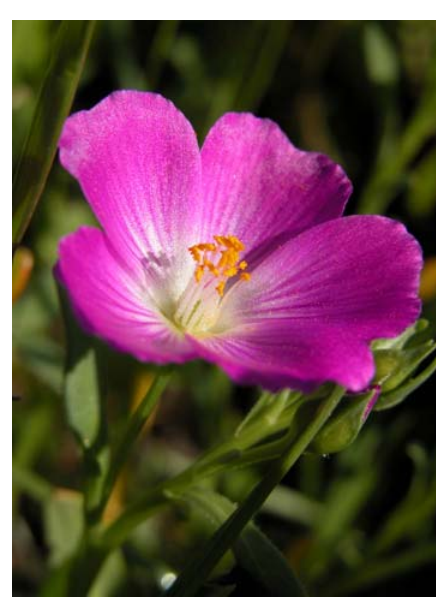
Magenta Red Maids Calandrinia ciliata Native Annual Purslane Family