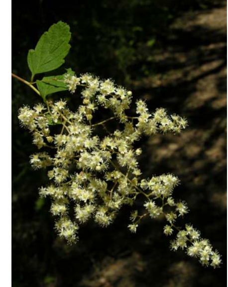
Creambush / Ocean Spray Holodiscus discolor Native Perennial Rose Family