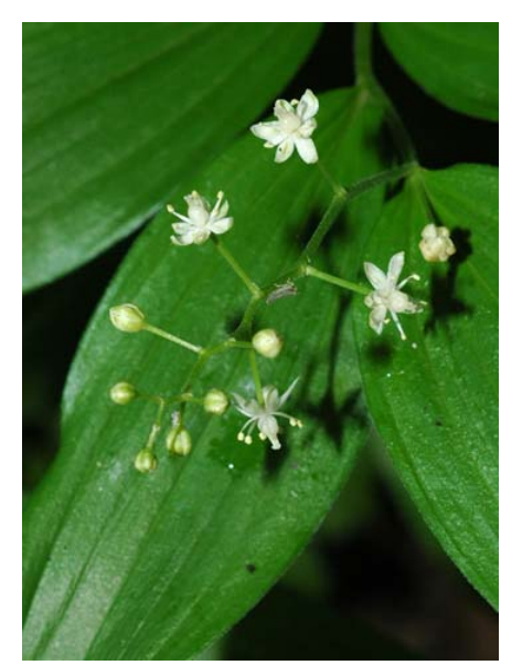
Starry False Solomon's Seal Smilacina stellata Native Perennial Lily Family