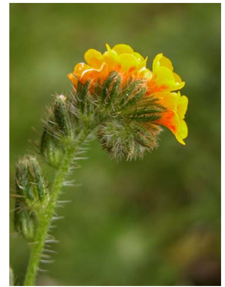
Common Fiddleneck Amsinckia menziesii var. intermedia Native Annual Borage Family