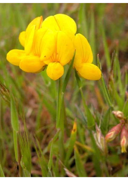
Bird's-foot Deerweed Lotus corniculatus Introduced Perennial Pea Family