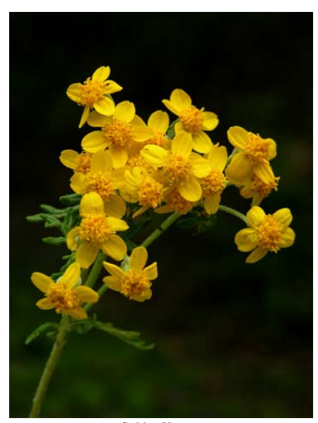
Golden Yarrow Eriophyllum confertiflorum var. confertiflorum Native Perennial Sunflower Family