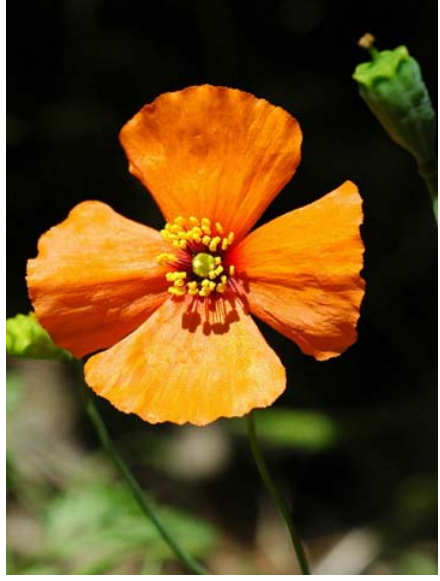
Wind Poppy Stylomecon heterophylla Native Annual Poppy Family