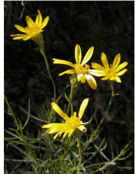
Interior Golden Bush Ericameria linearifolia Native Perennial Sunflower Family