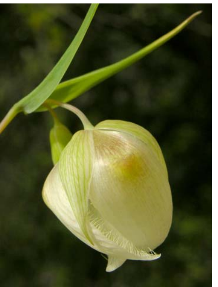
White Fairy Lantern Calochortus albus Native Perennial Lily Family