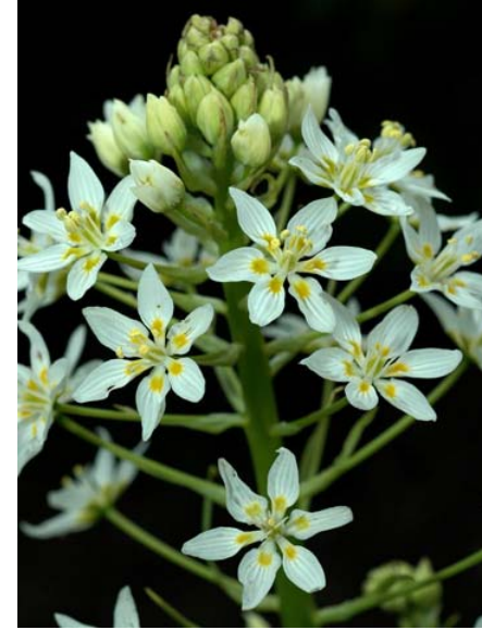
Common Star Lily Zigadenus fremontii Native Perennial Lily Family