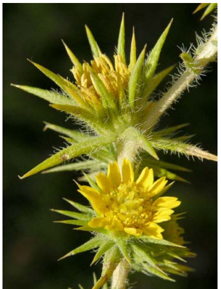
Congdon Spikeweed Hemizonia parryi ssp. congdonii Native Annual Sunflower Family