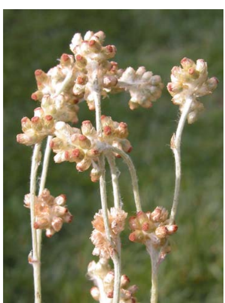
Weedy Cudweed Gnaphalium luteo-album Introduced Annual Sunflower Family