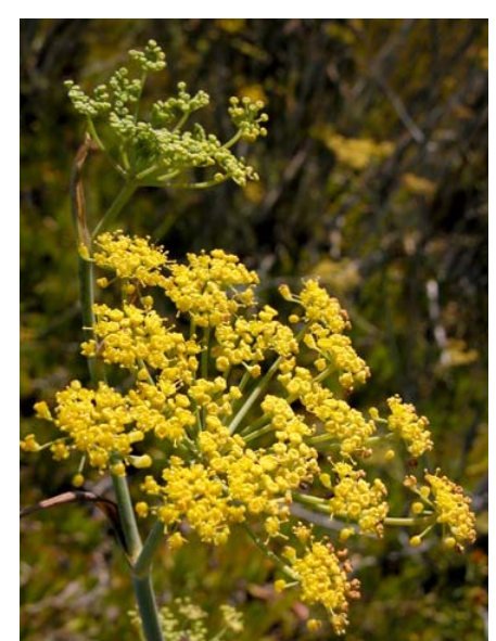
Sweet Fennel Foeniculum vulgare Introduced Perennial Carrot Family