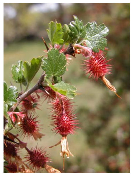
Hillside Gooseberry Ribes californicum var. californicum Native Perennial Gooseberry Family