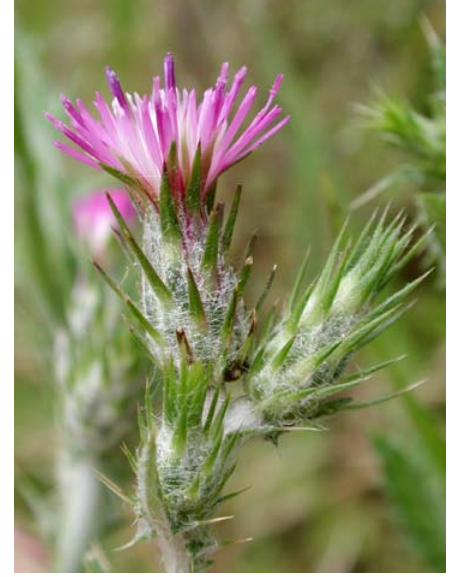
Italian Thistle Carduus pycnocephalus Introduced Annual Sunflower Family