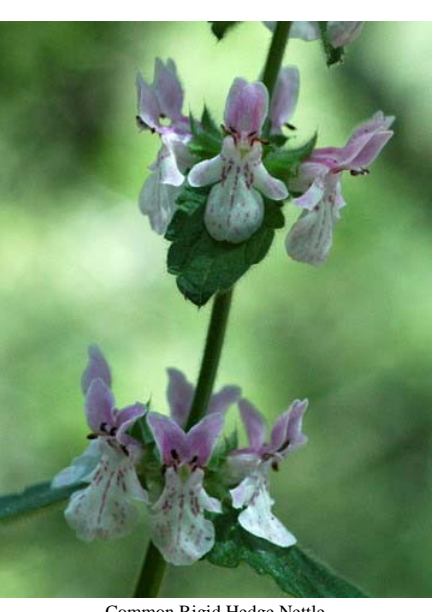
Common Rigid Hedge Nettle Stachys ajugoides var. rigida Native Perennial Mint Family