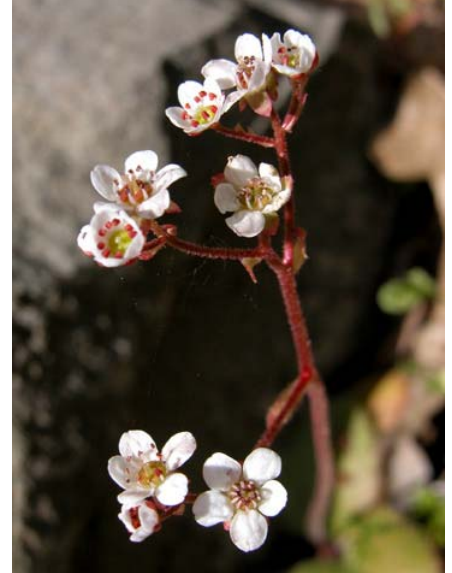
California Saxifrage Saxifraga californica Native Perennial Saxifrage Family