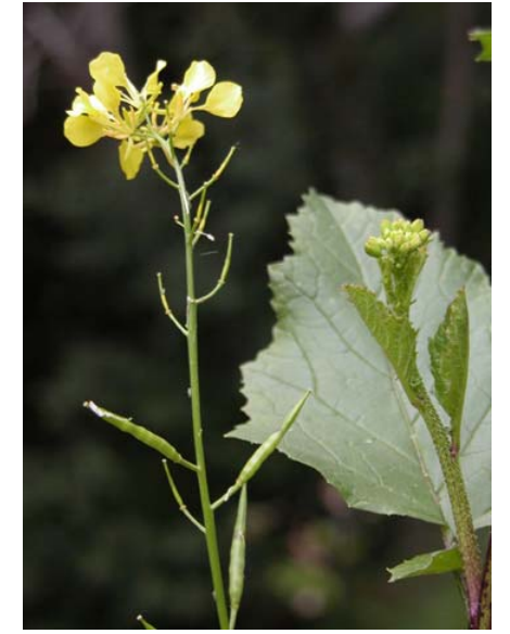
Yellow Charlock Sinapis arvensis Introduced Annual Mustard Family