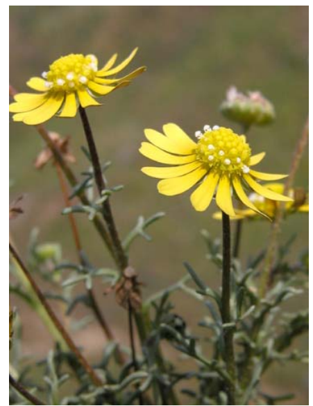
Glue-seed Blennosperma nanum var. nanum Native Annual Sunflower Family