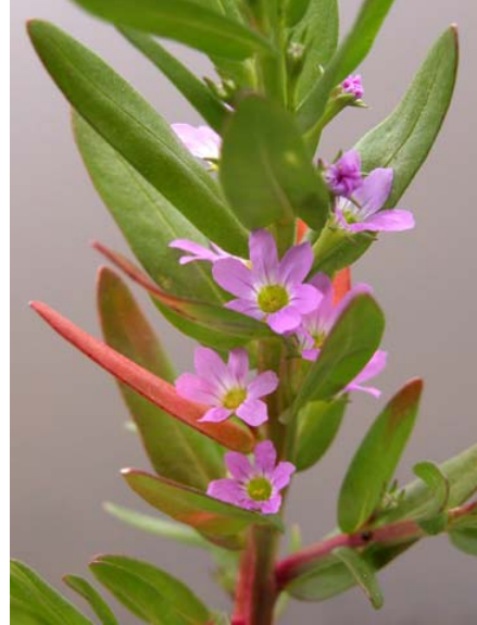
Grass Poly Loosestrife Lythrum hyssopifolium Introduced Annual-Perennial Loosestrife Family