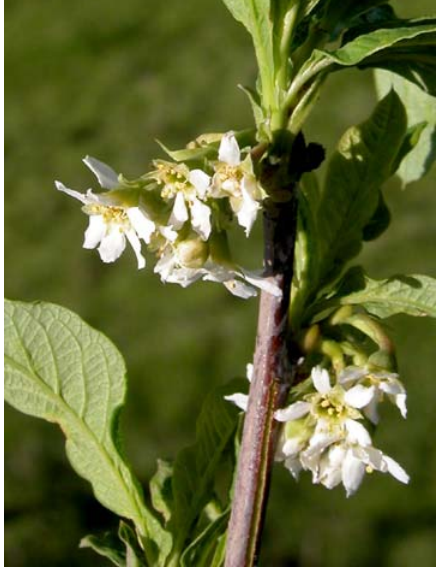
Oso Berry Oemleria cerasiformis Native Perennial Rose Family