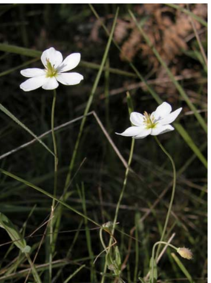
California Meconella Meconella californica Native Annual Poppy Family