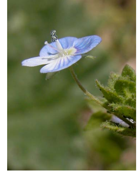
Persian Speedwell Veronica persica Introduced Annual Snapdragon Family