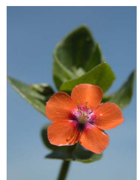
Scarlet Pimpernel Anagallis arvensis Introduced Annual Primrose Family