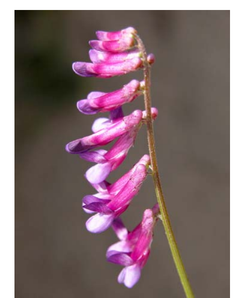
Winter Vetch Vicia villosa ssp. varia Introduced Annual-Biennial Pea Family