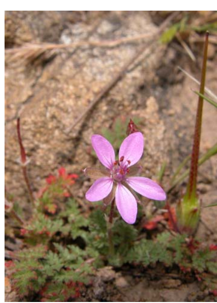
Red-stem Filaree Erodium cicutarium Introduced Annual Geranium Family