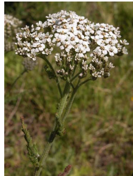
Yarrow Achillea millefolium Native Perennial Sunflower Family