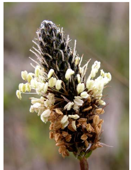
English Plantain Plantago lanceolata Introduced Annual Plantain Family