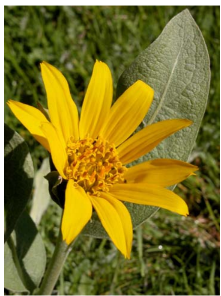
Gray Mule's Ear Wyethia helenioides Native Perennial Sunflower Family