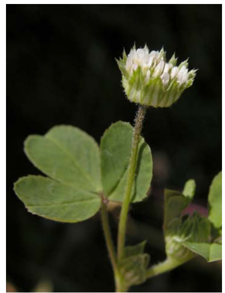
Thimble Clover Trifolium microdon Native Annual Pea Family