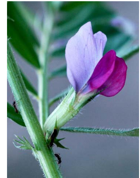
Spring Vetch Vicia sativa ssp. sativa Introduced Annual Pea Family