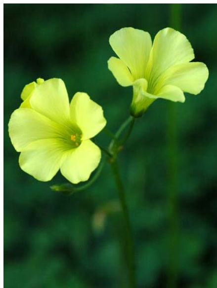
Bermuda Buttercup Oxalis pes-caprae Introduced Perennial Oxalis Family