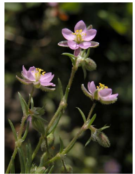
Ruby Sand Spurry Spergularia rubra Introduced Annual-Perennial Pink Family