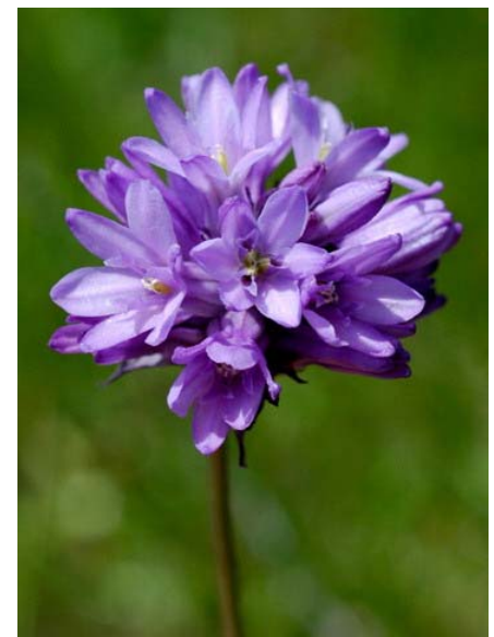
Ookow Dichelostemma congestum Native Perennial Lily Family