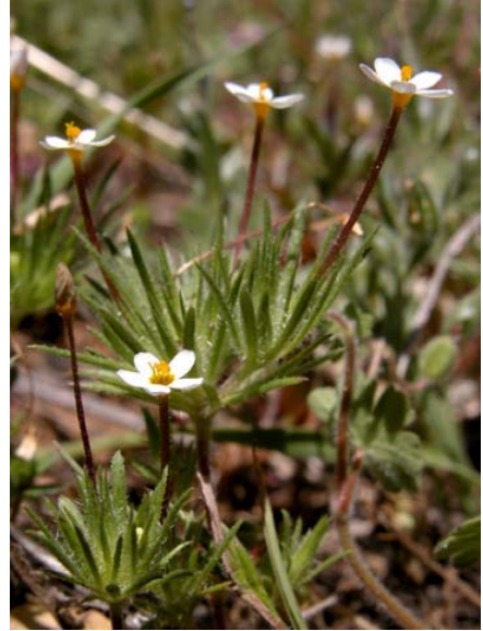
Bicolor Linanthus Linanthus bicolor Native Annual Phlox Family