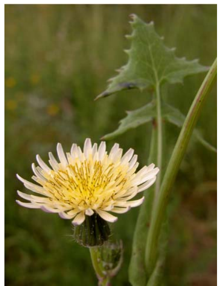
Common Sow Thistle Sonchus oleraceus Introduced Annual Sunflower Family