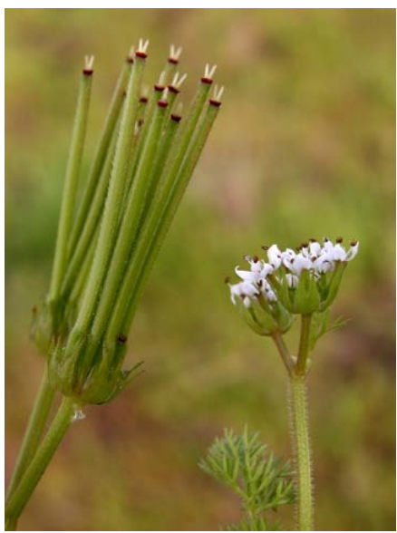
Shepherd's Needle Scandix pecten-veneris Introduced Annual Carrot Family