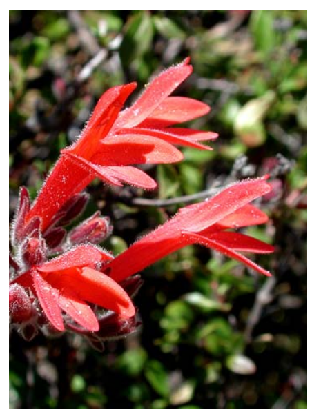
California Fuchsia Epilobium canum ssp. canum Native Perennial Evening Primrose Family