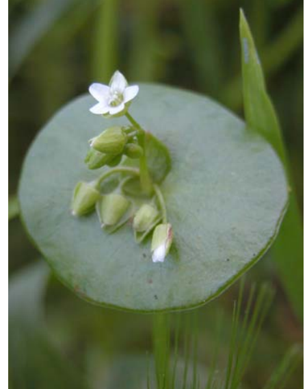
Common Miner's Lettuce Claytonia perfoliata ssp. perfoliata Native Annual Purslane Family