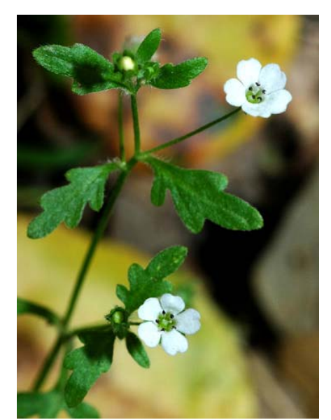
Variable-leaf Nemophila Nemophila heterophylla Native Annual Waterleaf Family