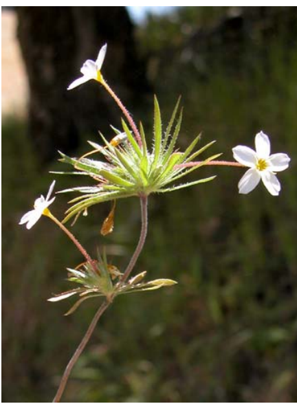
Pinklobe Linanthus Linanthus androsaceus Native Annual Phlox Family