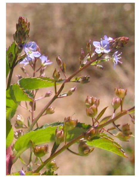
American Brooklime Speedwell Veronica americana Native Perennial Snapdragon Family