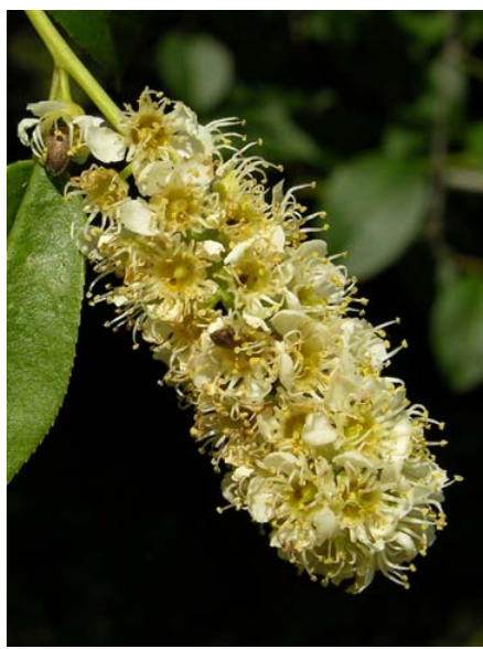
Western Chokecherry Prunus virginiana var. demissa Native Perennial Rose Family