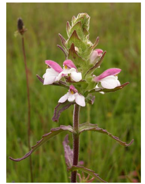
Bellardia Bellardia trixago Introduced Annual Snapdragon Family