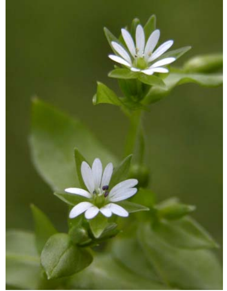
Common Chickweed Stellaria media Introduced Annual Pink Family