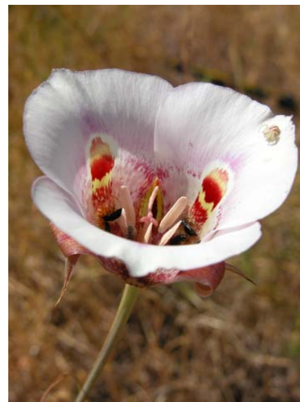
White Butterfly Mariposa Lily Calochortus venustus Native Perennial Lily Family