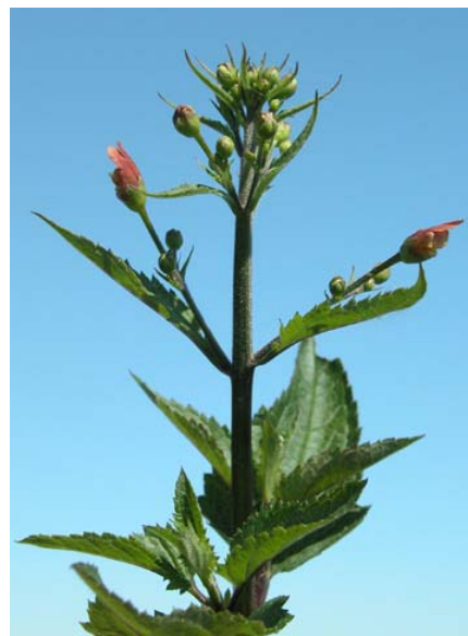
California Figwort Scrophularia californica ssp. californica Native Perennial Snapdragon Family