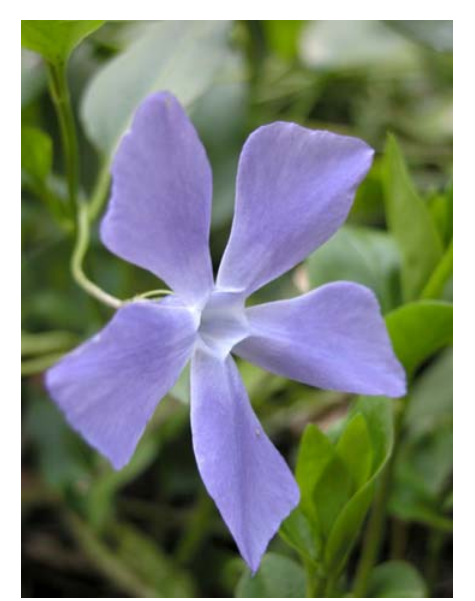
Greater Periwinkle Vinca major Introduced Perennial Dogbane Family