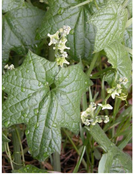
Common / California Manroot Marah fabaceus Native Perennial Gourd Family