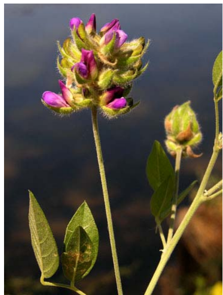
California Tea Rupertia physodes Native Perennial Pea Family