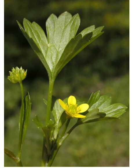
Prickleseed Buttercup Ranunculus muricatus Introduced Annual Buttercup Family