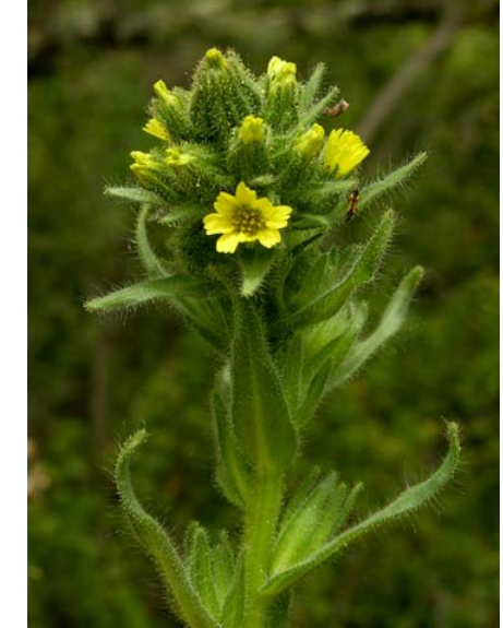
Common / Coast Tarweed Madia sativa Native Annual Sunflower Family