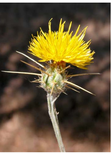
Yellow Star Thistle Centaurea solstitialis Introduced Annual Sunflower Family