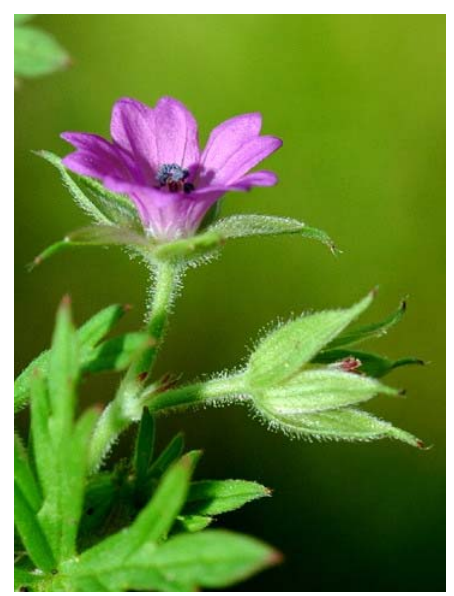
Purpletip Cut-leaf Geranium Geranium dissectum Introduced Annual Geranium Family