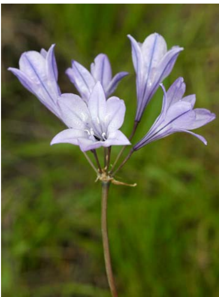
Ithuriel's Spear Triteleia laxa Native Perennial Lily Family