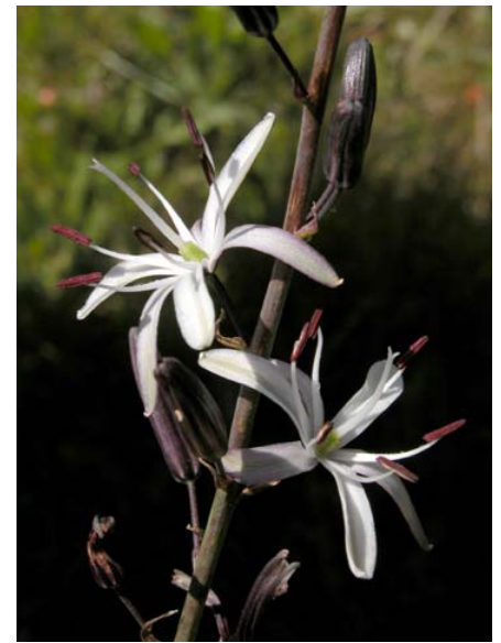
Common Soap Plant Chlorogalum pomeridianum var. pomeridianum Native Perennial Lily Family