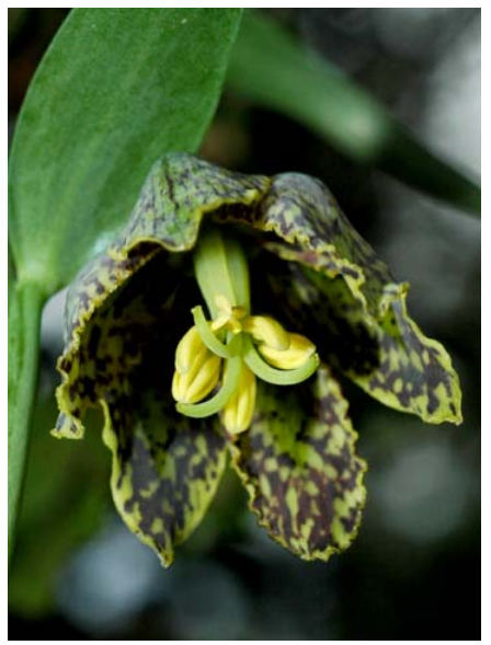
Checker Lily Fritillaria affinis var. affinis Native Perennial Lily Family