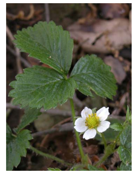
Woodland Strawberry Fragaria vesca Native Perennial Rose Family