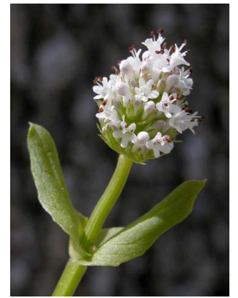
Longhorn Plectritis Plectritis macrocera Native Annual Valerian Family