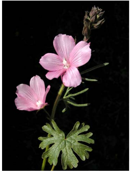
Common Checkerbloom Sidalcea malvaeflora ssp. malvaeflora Native Perennial Mallow Family