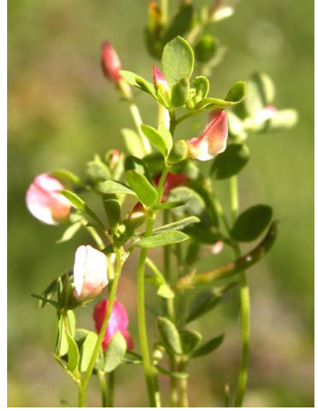
Spanish Clover Lotus purshianus var. purshianus Native Annual Pea Family