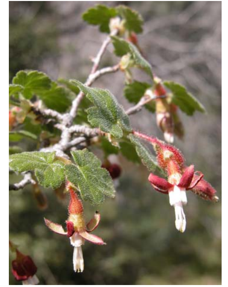
Canyon Gooseberry Ribes menziesii Native Perennial Gooseberry Family