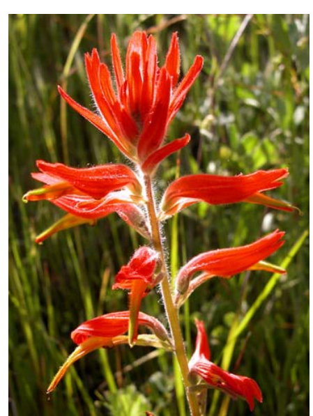
Common Indian Paintbrush Castilleja affinis ssp. affinis Native Perennial Snapdragon Family