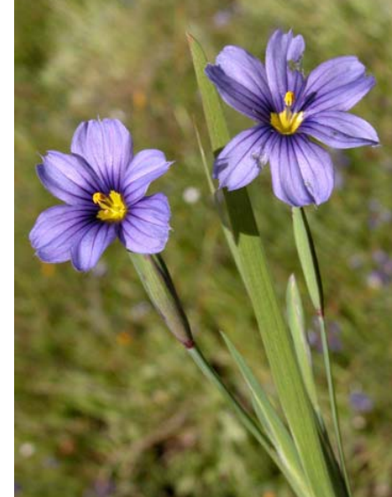
Blue-eyed Grass Sisyrinchium bellum Native Perennial Iris Family