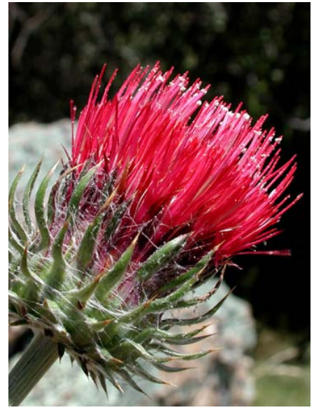
Venus / Cobweb Thistle Cirsium occidentale var. venustum Native Biennial Sunflower Family