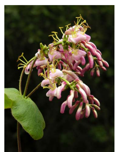
Hairy Vine Honeysuckle Lonicera hispidula var. vacillans Native Perennial Honeysuckle Family