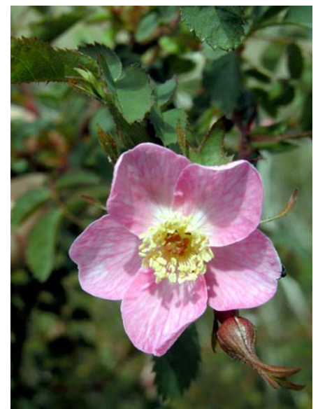
California Wild Rose Rosa californica Native Perennial Rose Family