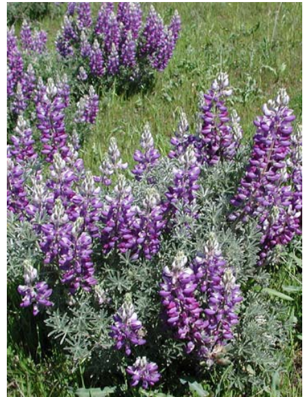
Blue Bush / Silver Lupine Lupinus albifrons var. albifrons Native Perennial Pea Family