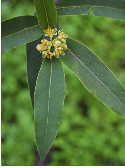
CALIFORNIA BAY (Umbellularia californica) Native Perennial - Laurel Family - (Nov–May) -Common. Canyons, valleys, chaparral - Tree < 150' tall. Leaf 1.2-4", 0.6-1.2" wide, aromatic. Cluster of 5-10 small, yellow or yellow-green flowers. Fruit 0.8-1" diam.