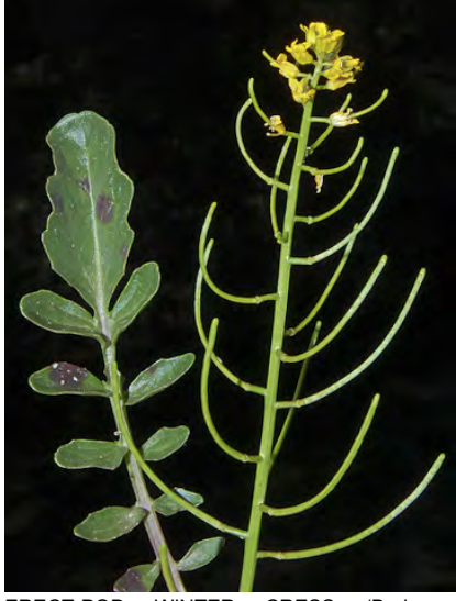
ERECT-POD WINTER CRESS (Barbarea orthoceras) Native Perennial - Mustard Family -(Mar–Jul) - Meadows, streambanks, moist woodland, grassland - Stem 8-24". Lower leaves w/large terminal lobe, upper clasping stem. Petals bright yellow, 0.2-0.3" long.