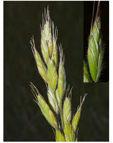
SOFT CHESS (Bromus hordeaceus) Naturalized Annual - Grass Family - (Apr–Jul) - Fields, disturbed areas - Plant 4-26" tall. Leaf hairy. Flower cluster 1-5" long, dense, some stalks > spikelet. Spikelet 0.5-0.9". Lemma 0.26-0.4", awn 0.16-0.4". INVASIVE weed.