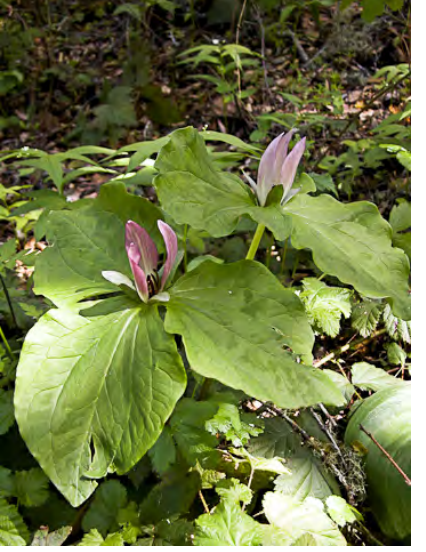
GIANT TRILLIUM (Trillium chloropetalum) Native Perennial - Bunchflower Family - (Apr–May) -Edges of redwood forest, chaparral, gen moist slopes, canyon banks in alluvial soils - Flowers dark purple to white, sessile. Petals 2.6-4" long, odor rose-like or spicy.