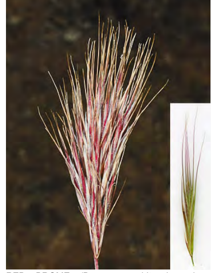
RED BROME (Bromus madritensis subsp. rubens) Naturalized Annual - Grass Family - (Mar–Jun) - Disturbed areas, roadsides - Plant 4-20". Flower cluster condensed, branches obscure, < spikelets. Stem & sheathes hairy. INVASIVE weed.