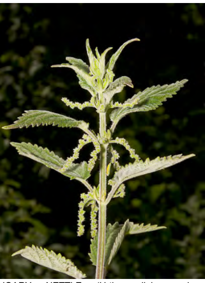
HOARY NETTLE (Urtica dioica subsp. holosericea) Native Perennial - Nettle Family -(Jun-Sep) - Meadows, seeps, springs, margins of marshes, streams, lakes, moist areas in chaparral, coastal scrub - Plant 3.3-9.8' tall, gravish, covered with stinging hairs.