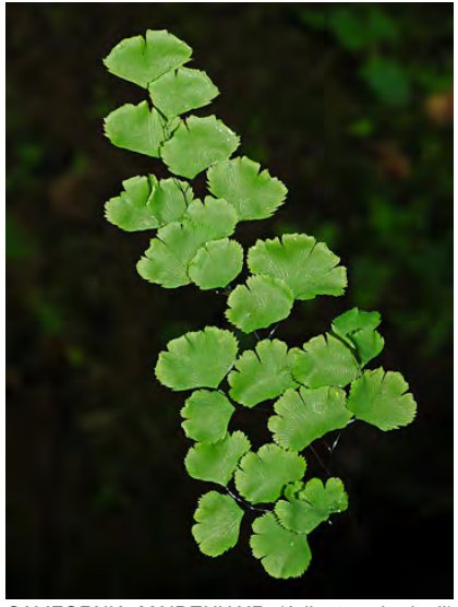
CALIFORNIA MAIDENHAIR (Adiantum jordanii) Native Perennial - Brake Fern Family - - - Shaded hillsides, moist woodland - Leaves 8-28" long with many rounded symmetrical segments, each with < 4 irregular lobes. Cultivated. Sudden Oak Death carrier.