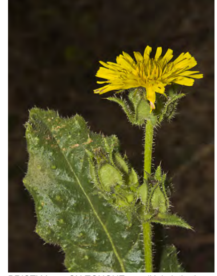
BRISTLY OX-TONGUE (Helminthotheca echioides) Naturalized Annual-Biennial -Sunflower Family - (All year) - Common. Disturbed areas - Stem 1-6.5' tall, bristly. Leaf 2-8" long, covered with prickly bumps. Flower heads 0.8-1.6" wide. INVASIVE weed.