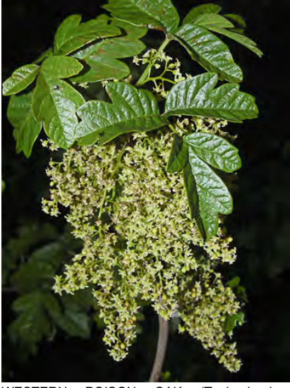
WESTERN POISON OAK (Toxicodendron diversilobum) Native Perennial - Sumac Family - (Apr–Jun) - Canyons, slopes, chaparral, coastal scrub, oak woodland - Shrub or vine. Leaflets 3, red in fall, mid leaflet stalked. Flowers green. Fruits white. TOXIC.