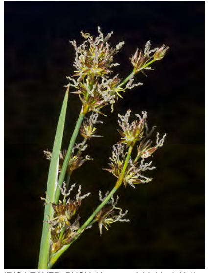
IRIS-LEAVED RUSH (Juncus xiphioides) Native Perennial - Rush Family - (Jul–Oct) - Wet places - Plant 16-32" tall. Leaf blades 0.2-0.5" wide, flat, Iris-like. Heads many, few-flowered. Anthers 6, < filaments, flowers self-pollinating.