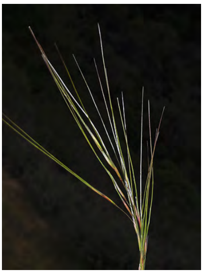
PURPLE NEEDLE GRASS (Stipa pulchra) Native Perennial - Grass Family - (Mar–Jun) - Oak woodland, chaparral, grassland - Stem 14-39" long. Leaf blade 4-8" long, Glumes 0.5-0.8" long, ~equal. Awn 1.6-4" long, last segment straight.