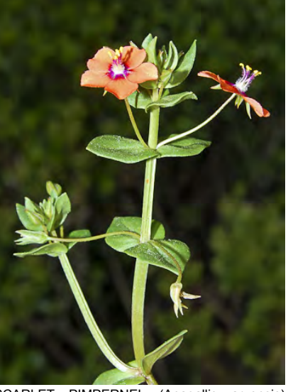
SCARLET PIMPERNEL (Anagallis arvensis) Naturalized Annual - Myrsine Family - (Mar–May) - Common. Disturbed places, ocean beaches -Plants 2-16" tall. Flowers 0.2-0.3" long, salmon or occasionally blue. Leaves TOXIC, can cause dermititis.