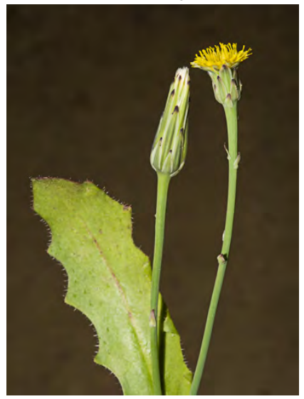
SMOOTH CAT'S-EAR (Hypochaeris glabra) Naturalized Annual - Sunflower Family -(Mar–Jun) - Common. Disturbed areas, grassland, open woodland - Plant 4-24" tall, smooth. Rays 0.2-0.3" long, barely > head bracts. Only inner fruit beaked. INVASIVE.