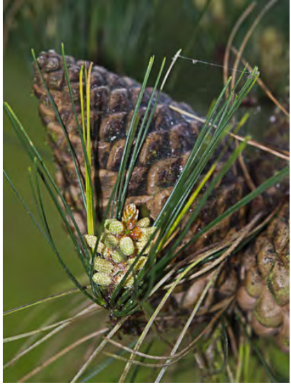
MONTEREY PINE (Pinus radiata) Native Perennial - Pine Family - - - Closed-cone-pine forest, oak woodland - Tree < 125' tall. Mature bark black, deep-grooved. Needles 3 per bundle, 2.4-5.9" long. Seed cone 2.4-6" long, asymmetric, opening 2nd year.