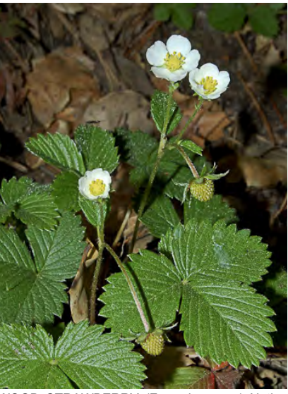
WOOD STRAWBERRY (Fragaria vesca) Native Perennial - Rose Family - (Jan–Jul) - Gen partial shade in forest - Stem gen 1.2-6<sup>°</sup> long. Leaflets 3, thin. Central leaflet gen w/12-21 teeth. Flower white, gen 0.6<sup>°</sup> wide, often above leaves. Fruit a strawberry.