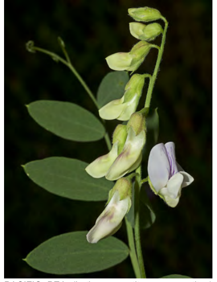
PACIFIC PEA (Lathyrus vestitus var. vestitus) Native Perennial - Pea Family - (Feb–Jul) - North: Conifer forest. South: chaparral & oak woolland -Stem wings to 0.02" wide. Leaves gen elliptic. Flowers 0.5-0.7" long, pale lavender to purple.