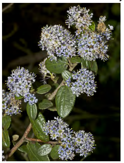
JIM BRUSH (Ceanothus oliganthus var. sorediatus) Native Perennial - Buckthorn Family -(Jan-May) - Slopes, ridges, chaparral, conifer forest - Shrub/tree < 11.5' tall. Twigs red-brown. Leaves alternate, 3 main veins. Flowers blue, purple-blue or whitish.