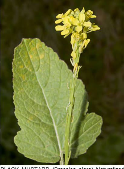
BLACK MUSTARD (Brassica nigra) Naturalized Annual - Mustard Family - (Apr–Sep) - Common. Disturbed areas, fields - Plant 1-6' tall. Petals bright yellow, 0.3-0.4" long. Fruit upright, pressed against stem. INVASIVE weed.