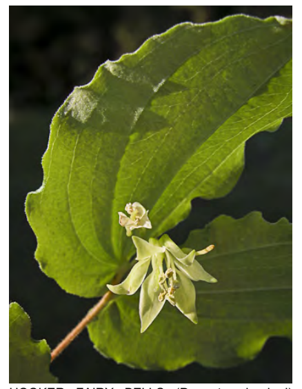
HOOKER FAIRY BELLS (Prosartes hookeri) Native Perennial - Lily Family - (Mar–Jun) -Montane conifer, mixed-evergreen forest, exposed roadside - Stem 12-32" tall. Leaf 1.2-6" long. Flower 0.3-0.6" long, white, hanging below the leaves, stamens > petals.