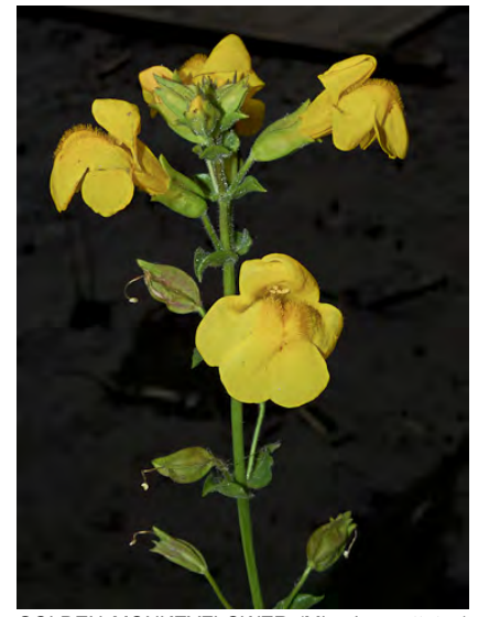
GOLDEN MONKEYFLOWER (Mimulus guttatus) Native Perennial - Lopseed Family - (Mar-Aug) -Common. Wet places, gen terrestrial, occ emergent or floating in mats - Plant 0.8-60". Flower yellow, gen > 0.8" long; mature bracts flattened sideways, inflated in fruit.