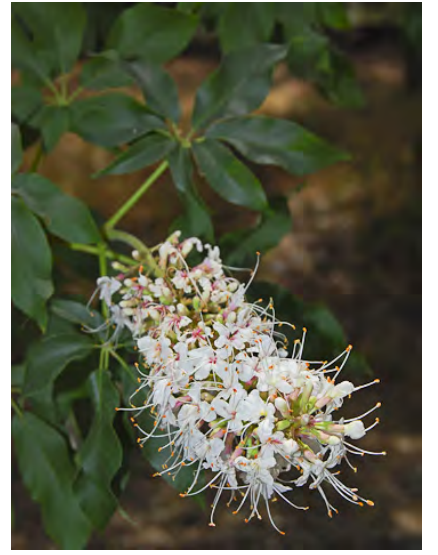
CALIFORNIA BUCKEYE (Aesculus californica) Native Perennial - Soapberry Family - (May–Jun) - Dry slopes, canyons, borders of streams - Large shrub or tree 13-39' tall. 5-7 leaflets. Flowers white to pale rose. Large seeds toxic but edible after leaching out saponins.