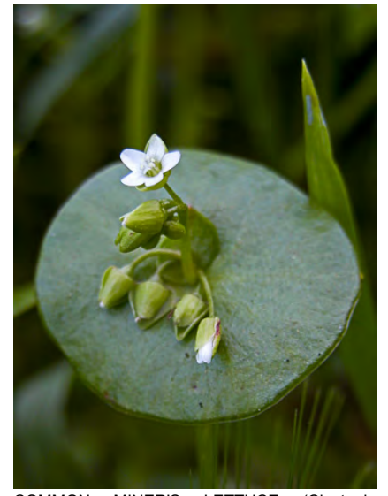
COMMON MINER'S LETTUCE (Claytonia perfoliata subsp. perfoliata) Native Annual - Miner's Lettuce Family - (Jan-May) - Vernally moist, often shady or disturbed sites - Basal leaf length <3x width. Stem leaf gen not angled. Seeds shiny w/large appendage.