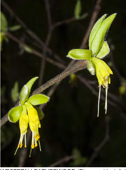
WESTERN LEATHERWOOD (Dirca occidentalis) Native Perennial - Daphne Family - (Nov-Mar) -Gen n facing slopes, mixed-evergreen forest to chaparral, gen fog belt - Shrub 3-10'. Flowers yellow, 1-4 per group, open before/with leaves. CNPS: Fairly ENDANGERED.