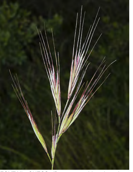
FOXTAIL CHESS (Bromus madritensis subsp. madritensis) Naturalized Annual - Grass Family - (Apr-Jan) - Disturbed areas, roadsides - Plants 4-20" tall. Stem and sheathes smooth. Flower cluster branches visible, lower spikelets erect, > stalk.