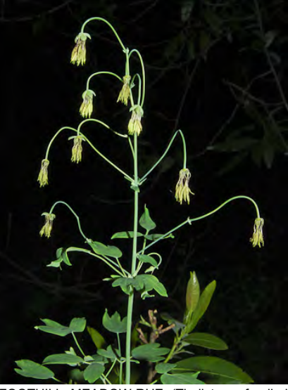
FOOTHILL MEADOW-RUE (Thalictrum fendleri var. polycarpum) Native Perennial - Buttercup Family - (Mar–Jun) - Moist, open to shaded places, woodland, forest - Plant 2-6'+ tall, male or female. Leaf 1-4x divided, 3-18" long, segments 0.3-0.8" long. No petals.