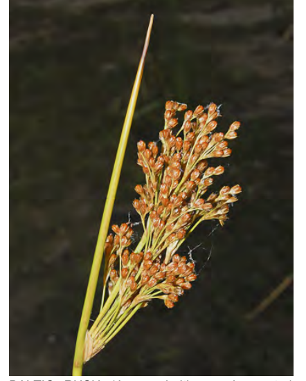
BALTIC RUSH (Juncus balticus subsp. ater) Native Perennial - Rush Family - (Jul–Nov) -Moist to \pm dry sites - Stem 14-43" tall, round, not twisted. No leaf blade. Flowers generally 0.1-0.2" long.