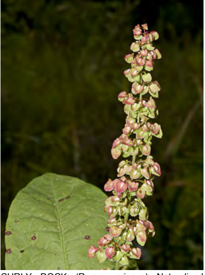
CURLY DOCK (Rumex crispus) Naturalized Perennial - Buckwheat Family - (All year) -Abundant. Disturbed places - Stem 16-39" tall. Flower cluster dense, valves 0.2-0.24", winged around tubercles, smooth edged. 1 tubercle enlarged. INVASIVE.