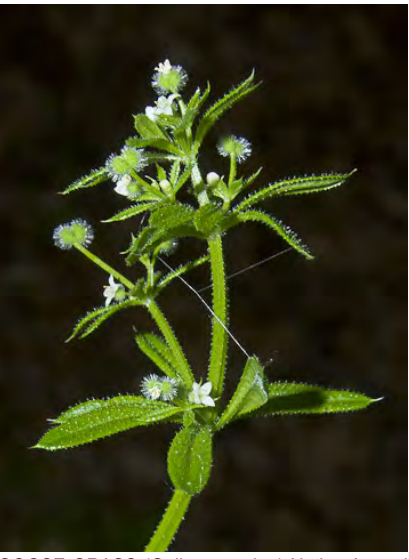
GOOSE GRASS (Galium aparine) Native Annual - Madder Family - (Apr-Jun) - Grassy, ± shady places - Stem 12-35" long, weak, brittle. Leaves 0.5-1.6" long, in whorls of 6-8. Flowers white, 4-lobed. Fruits covered w/short, hooked hairs.