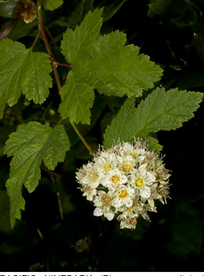
PACIFIC NINEBARK (Physocarpus capitatus) Native Perennial - Rose Family - (May–Jul) -Moist banks, n-facing slopes, mixed-conifer forest - Shrub 3.3-8'. Leaf blades gen < 4" wide, 3-5 lobed. Petals white, ~0.1" long. Fruits reddish, 0.3-0.4" long.