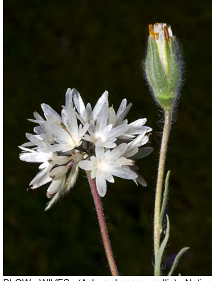
BLOW WIVES (Achyrachaena mollis) Native Annual - Sunflower Family - (Mar–Jun) -Common. Grassy sites, often clay soils - Plant 2-24" tall, soft-hairy. Flowers yellow turning red, 0.1-0.5" wide, extend < 0.1" beyond green bracts. Showy, flat scales attached to seeds.