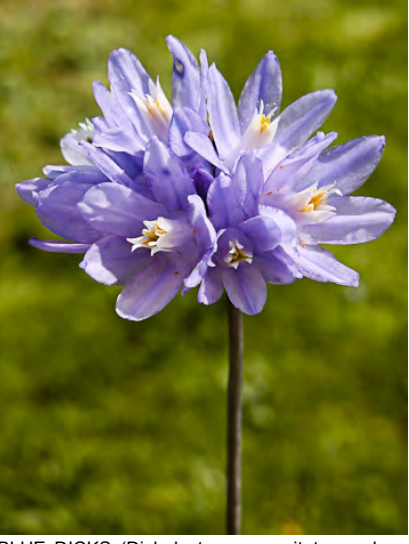
BLUE DICKS (Dichelostemma capitatum subsp. capitatum) Native Perennial - Brodiaea Family -(Mar-Jun) - Open woodland, scrub, desert, grassland - Plant 2-28" tall. Flowers blue-purple, not narrowed in the middle. Stamens 6. Early spring bloomer.