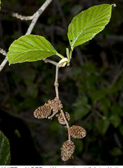
WHITE ALDER (Alnus rhombifolia) Native Perennial - Birch Family - (Apr–Jun) - Along permanent streams - Tree. Leaves flat, not rusty underneath, margins serrate, not rolled under. Female flowers cone-like. Wood used for furniture and for smoking meats.