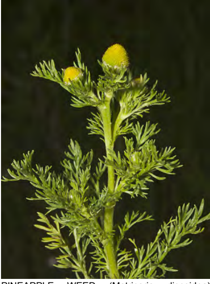
PINEAPPLE WEED (Matricaria discoidea) Naturalized Annual - Sunflower Family -(Feb-Aug) - Abundant. Disturbed sites, riverbanks - Plant 4-12" tall, sweet-scented. Heads pineapple-shaped, ~ 0.4" wide; head stalk to 0.6" long.