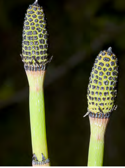
SMOOTH SCOURING RUSH (Equisetum laevigatum) Native Perennial - Horsetail Family - - Moist, sandy or gravelly areas - Stems 1 kind only, 12-71" tall, unbranched. Sheath w/dark band only at the top.