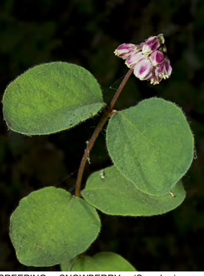
CREEPING SNOWBERRY (Symphoricarpos mollis) Native Perennial - Honeysuckle Family -(Apr–May) - Ridges, slopes, open places in woodland - Shrub 6-24" tall, sprawling. Flowers < 8/cluster, pink + often red outside, 0.16" long, bell-shaped, symetrical.