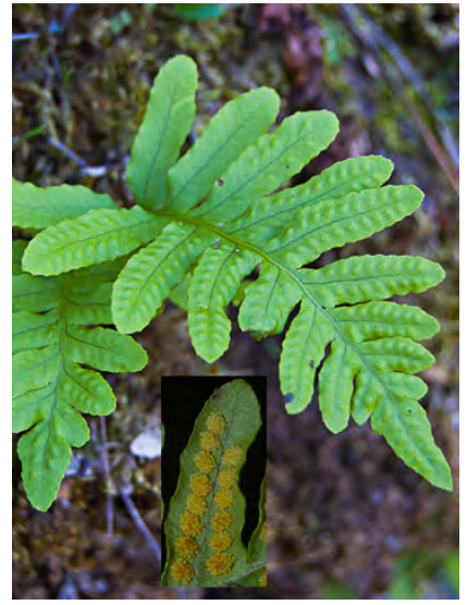
POLYPODY FERN (Polypodium calirhiza) Native Perennial - Polypody Family - - On plants, rocky cliffs or outcrops, roadcuts, often granitic or volcanic, rarely dunes - Leaf blades 4-8" long, often widest above base, deeply lobed.