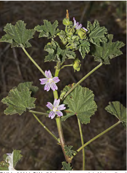
BULL MALLOW (Malva nicaeensis) Naturalized Annual - Mallow Family - (Mar–Jun) - Disturbed places - Stem 0.7-2'. Leaf blade 1.2-4.7" wide, 5-7 shallow lobes. Bractlets egg-shaped,0.16-0.2" long. Petals pink to blue-violet, 0.2-0.5" long.