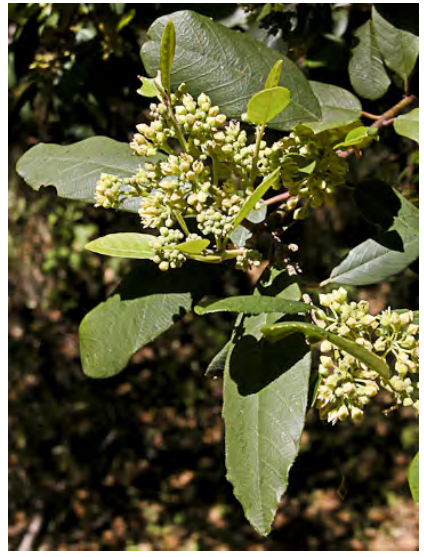
CALIFORNIA COFFEE BERRY (Frangula californica subsp. californica) Native Perennial -Buckthorn Family - (May–Jul) - Coastal-sage scrub, chaparral, forest, woodland - Shrub < 16' tall. Flowers greenish. Leaves smooth beneath.