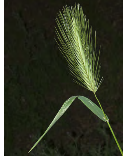
HARE BARLEY (Hordeum murinum subsp. leporinum) Naturalized Annual - Grass Family - (Feb–May) - Moist, gen disturbed sites. Common - Stem 12-43" tall. Central spikelet stalk ~0.06" long. Central floret << lateral florets. INVASIVE weed.