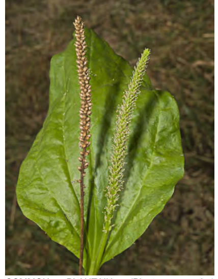
COMMON PLANTAIN (Plantago major) Naturalized Annual-Perennial - Plantain Family -(Apr-Sep) - Disturbed areas - Leaves basal, blades 5-18 cm long, broadly oval, not hairy. Flowers + stem 2-24" tall, flower cluster gen 1.2-8" long.