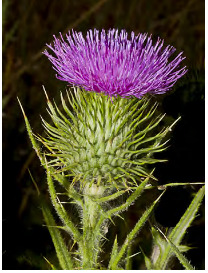
BULL THISTLE (Cirsium vulgare) Naturalized Biennial - Sunflower Family - (May-Oct) -Common. Disturbed areas - Plant 12-79" tall. Top of leaves bristly; leaf base forming decurrent wings on stem. Flowers purple, gen 1-2" wide. NOXIOUS weed.