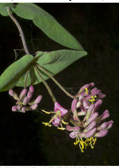
HAIRY VINE HONEYSUCKLE (Lonicera hispidula) Native Perennial - Honeysuckle Family - (May–Jun) - Canyons, streamsides, woodland -Shrub sprawling-climbing, 6-10' long, short-hairy. Flower cluster densely sticky. Flowers pink, 0.5-0.6" long, sticky-hairy.