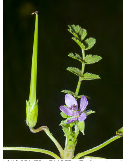
LONG-BEAKED FILAREE (Erodium botrys) Naturalized Annual - Geranium Family -(Mar-Jul) - Dry, open or disturbed sites - Stem 4-35" tall, coarse-hairy. Leaves lobed. Petals pink, 0.3-0.5" long. Sepals w/reddish tip. Fruit beak 2-4.7" long.