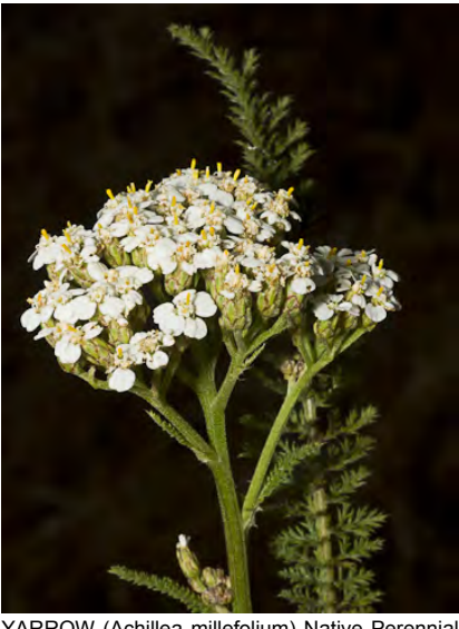
YARROW (Achillea millefolium) Native Perennial - Sunflower Family - (Apr–Sep) - Many habitats -Plant 4"-7' tall. Stem white-hairy. Leaves finely dissected. Flower cluster flat-topped. Flowers white to pink. Widely used in folk medicine.