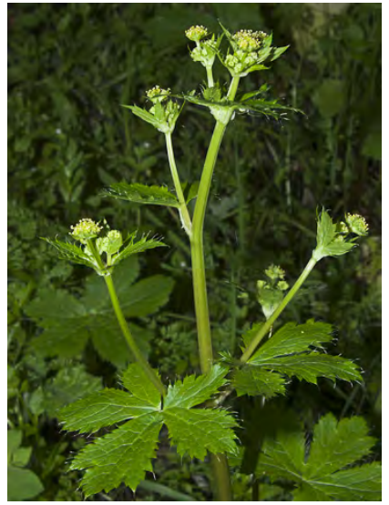
PACIFIC WOODLAND SANICLE (Sanicula crassicaulis) Native Perennial - Carrot Family - (Mar-May) - Open slopes, ravines, woodland - Plants stout, 9-47". Leaves 1-5" across with 3-5 deep, palmate lobes and serrate edges. Flowers yellow.