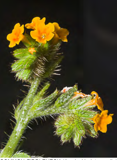
COMMON FIDDLENECK (Amsinckia intermedia) Native Annual - Borage Family - (Mar–Jun) -Abundant. Open, generally disturbed places -Plant 0.5-3' tall. Flowers orange with 5 red spots, 0.3-0.4" long, 0.2-0.4" wide, tube straight.