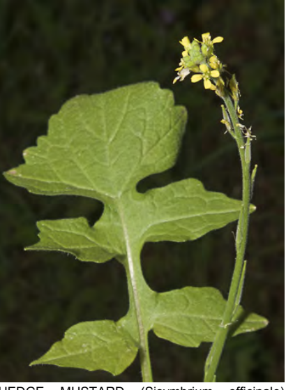
HEDGE MUSTARD (Sisymbrium officinale) Naturalized Annual - Mustard Family - (Apr–Sep) - Disturbed areas, fields, pastures - Stem 10-22" tall, thin, wiry. Petals 0.1-0.16" long, pale yellow. Fruit 0.4-0.55" long, awl-shaped, appressed.