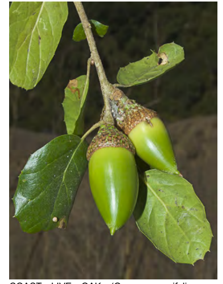
COAST LIVE OAK (Quercus agrifolia var. agrifolia) Native Perennial - Oak Family -(Mar-Apr) - Valleys, slopes, mixed-evergreen forest, woodland - Tree 30-80'. Leaves convex, hair-tuft below in vein axils. Acorns on 1st year twigs, shell glabrous inside.