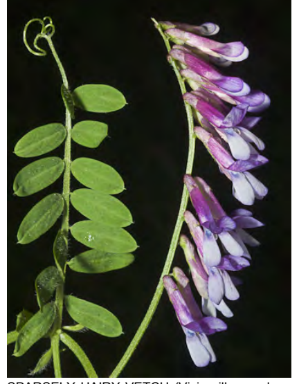
SPARSELY HAIRY VETCH (Vicia villosa subsp. varia) Naturalized Annual-Biennial - Pea Family - (Mar–Jun) - Grassland, roadside, disturbed areas - Stems w/few hairs. Flowers 10-20, blue-purple to white, 0.4-0.5" long. Lower bract lobes 0.04-0.1" long.