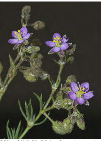
RED SAND-SPURRY (Spergularia rubra) Naturalized Annual-Perennial - Pink Family -(Spring-fall) - Forest, meadows, mud flats, disturbed - Plant 1.6-10". Leaf non-fleshy, whorls w/large white bracts. Petals pink. Stamens 6-10. Sepals < 0.16".