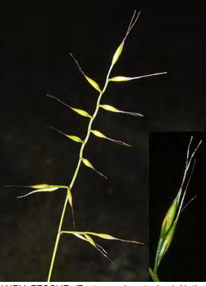
HAIRY FESCUE (Festuca microstachys) Native Annual - Grass Family - (Apr-Jun) - Disturbed, open, gen sandy soils - Stem 6-29". Spikelet 0.2-0.4" long, awn 0.1-0.5" long. Glumes & lemma smooth or hairy.