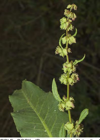
FIDDLE DOCK (Rumex pulcher) Naturalized Perennial - Buckwheat Family - (May–Sep) -Disturbed places, meadows, moist or dry habitats - Stem 8-24" long, branches widely spreading. Leaf blades 1.6-4" long, 1.2-2" wide. Valves w/2-5 teeth.