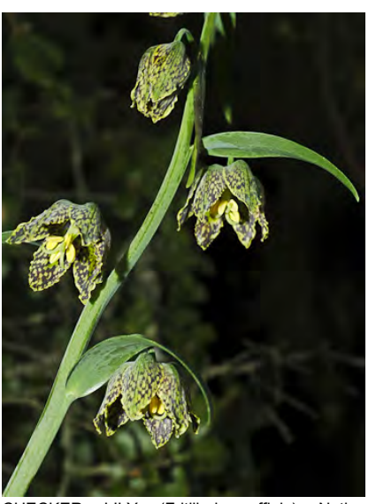
CHECKER LILY (Fritillaria affinis) Native Perennial - Lily Family - (Mar–Jun) - Common. Oak or pine scrub, grassland - Stem 4-47" tall. Leaves 1.6-6.3" long, whorled below. Petals mottled brown-purple and yellow-green, 0.4-1.6" long.