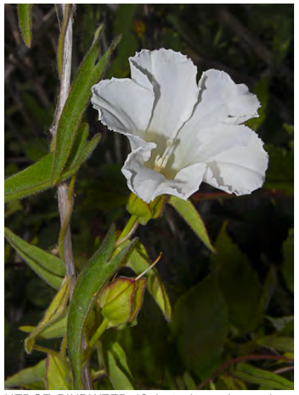
HEDGE BINDWEED (Calystegia sepium subsp. limnophila) Native Perennial - Morning-glory Family - (May–Jul) - Marshes, riverbanks - Stem climbing, < 13', smooth (hairy). Flower 1.2-2.4" long, white to pink-tinged. Bractlets concealing flower bracts.