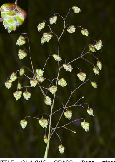
LITTLE QUAKING GRASS (Briza minor) Naturalized Annual - Grass Family - (Apr–Jul) -Shaded or moist, open sites - Stem 3-20" tall. Spikelets 0.1-0.2" long, resemble tiny rattlesnake rattles.