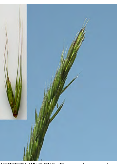
WESTERN WILD-RYE (Elymus glaucus subsp. glaucus) Native Perennial - Grass Family -(Jun-Aug) - Open areas, chaparral, woodland, forest - Tufted. Stem 12-55" tall. Leaf 0.2-0.5" wide, flat. Spikelets0.3-0.6" long, 2-4 per node. Lemma awn 0.4-1.2" long.