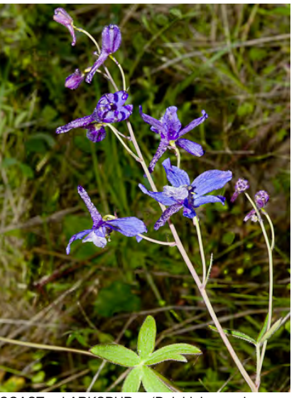
COAST LARKSPUR (Delphinium decorum subsp. decorum) Native Perennial - Buttercup Family - (Mar–May) - Open coastal grassland, chaparral - Stems 3-14" tall. Leaves short-hairy under, with few-toothed lobes. Flowers few, dark blue-purple.