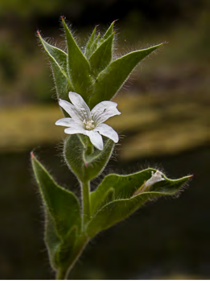
DENSE-FLOWER WILLOWHERB (Epilobium densiflorum) Native Annual - Evening Primrose Family - (May–Oct) - Streambanks, outwashes, seasonal moist flats - Plant 2-60" tall, soft-hairy. Petals 0.1-0.4", rose-purple to white. Fruit not tapered.