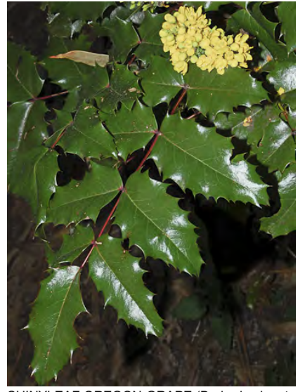
SHINYLEAF OREGON-GRAPE (Berberis pinnata subsp. pinnata) Native Perennial - Barberry Family - (Feb–May) - Rocky slopes, conifer forest, oak woodland, chaparral - Shrub gen < 7'. Leaflets w/15-23 spiny teeth, spines < 0.1" long. Flowers yellow.