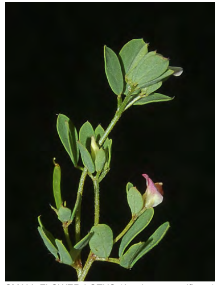
SMALL-FLOWER LOTUS (Acmispon parviflorus) Native Annual - Pea Family - (Mar–May) -Abundant. Coastal bluffs to oak/pine or fir woodland, open or disturbed areas - Flowers pinkish, solitary, 0.2" long, on stalk with bracts. Not hairy.