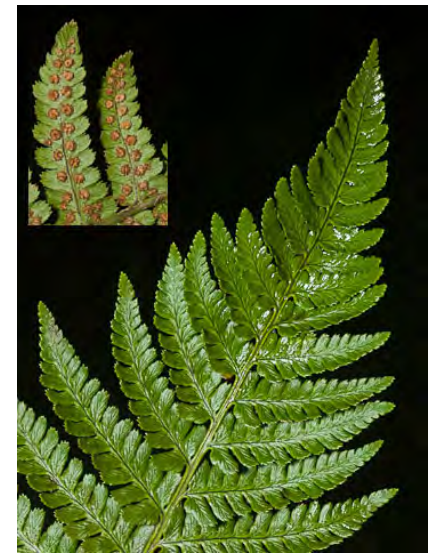
COASTAL WOOD FERN (Dryopteris arguta) Native Perennial - Wood Fern Family - - - Locally common. Open, wooded slopes, caves - Leaf 12-24" long,5-12" wide, divided 1-2 times. Segments generally with spine-tipped teeth.