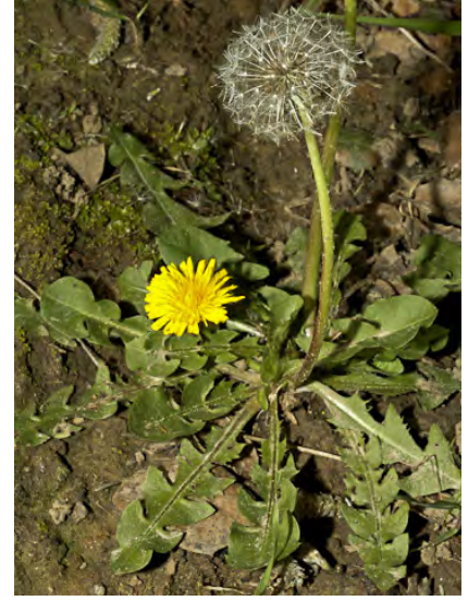
COMMON DANDELION (Taraxacum officinale) Naturalized Biennial-Perennial - Sunflower Family - (All year) - Abundant. Esp disturbed areas -Stem hollow. Leaves bright green with sharp down-pointing lobes. Outer head bracts reflexed. Fruit ~ brown.