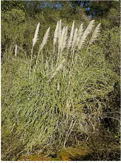
HAIRY PAMPAS GRASS (Cortaderia jubata) Naturalized Perennial - Grass Family - (Sep–Feb) - Disturbed sites, many habitats, esp coastal -Plant 6-23' tall. Leaf blades 0.1-0.5" wide, sheathes hairy. NOXIOUS weed.