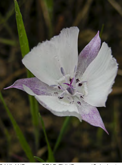
OAKLAND STAR-TULIP (Calochortus umbellatus) Native Perennial - Lily Family -(Mar-May) - Open chaparral or woodland, gen on serpentine - Stem 3-10". Petals white or pink, 0.5-0.7" long, square tip, purple-spotted base. CNPS: FAIRLY ENDANGERED.