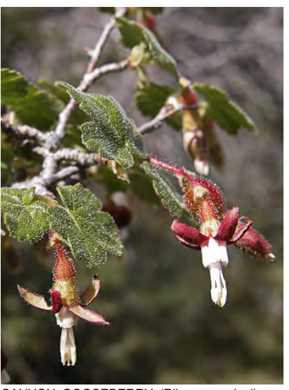
CANYON GOOSEBERRY (Ribes menziesii var. menziesii) Native Perennial - Gooseberry Family - (Feb-Apr) - Common. Forest openings, chaparral - Shrub < 10', prickly. Leaves sticky below. Styles glabrous, anthers exserted, sepals purplish.