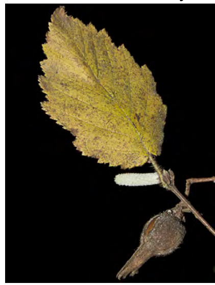
CALIFORNIA HAZELNUT (Corylus cornuta subsp. californica) Native Perennial - Birch Family - (Jan-Mar) - Common. Many habitats, esp moist, shady places - Shrub, small tree < 13' tall. Leaf velvetry-hairy. Fruits 0.8-1.2" long in papery bracts, 1-2/group.