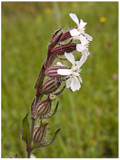
SMALL-FLOWER CATCHFLY (Silene gallica) Naturalized Annual - Pink Family - (Spring-early summer) - Fields, disturbed areas - Plant 4-16". Leaves < 1.4" long. Flower cluster short-hairy, bracts sticky-hairy, petal blade 0.2-0.5" long, smooth to notched, white to pink.