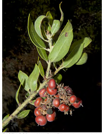
EASTWOOD MANZANITA (Arctostaphylos glandulosa subsp. glandulosa) Native Perennial - Heath Family - (Jan-Apr) - Chaparral, conifer forest - Shrub 3-13' tall. Twigs w/gland-tipped hairs, leafy bracts, 0.1-0.2" leaf stalk, burl. Upper leaf surface not shiny.