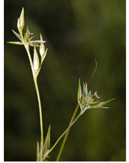
TOAD RUSH (Juncus bufonius var. bufonius) Native Annual - Rush Family - (May–Sep) - Damp sunny ground, gen disturbed - Stem gen 1-4" tall, gen brached from base, ~0.04" wide. Flower cluster open. Flowers 0.16-0.3" long.