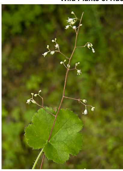
SMALL-FLOWER ALUMROOT (Heuchera micrantha) Native Perennial - Saxifrage Family -(Apr–Jul) - Moist, rocky banks and cliffs - Plant 4-40" tall. Leaf blade 0.8-4.7" long, 5-7 lobed, generally hairy. Petals white, ~ 0.1" long.