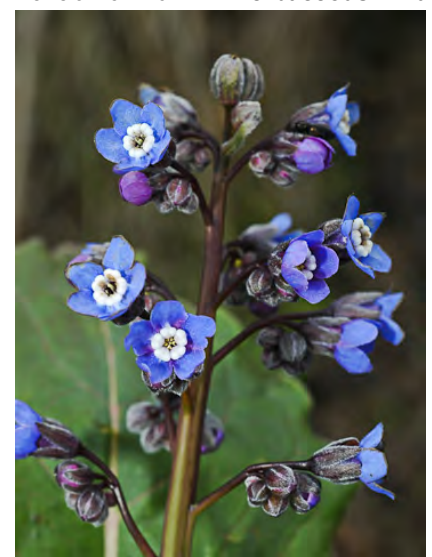
GRAND HOUND'S TONGUE (Cynoglossum grande) Native Perennial - Borage Family - (Feb-May) - Chaparral, woodland - Stem 1-3'. Leaf stalk 3-6". Leaf blade 3-6" cm long, broadly oval. Flowers bright blue w/inner white teeth.