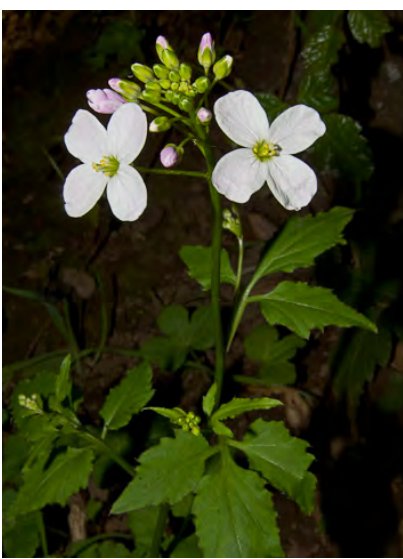
MILK MAIDS (Cardamine californica) Native Perennial - Mustard Family - (Jan-May) - Gen shaded sites, canyons, woodland. One of first spring flowers - Stem 10-24" long. Leaves lobed to compound w/sharp teeth. Petals white or pale rose, 0.3-0.5" long.