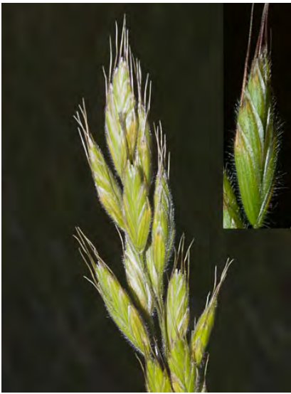
SOFT CHESS (Bromus hordeaceus) Naturalized Annual - Grass Family - (Apr-Jul) - Fields, disturbed areas - Plant 4-26" tall. Leaf hairy. Flower cluster 1-5" long, dense, some stalks > spikelet. Spikelet 0.5-0.9". Lemma 0.26-0.4", awn 0.16-0.4". INVASIVE weed.