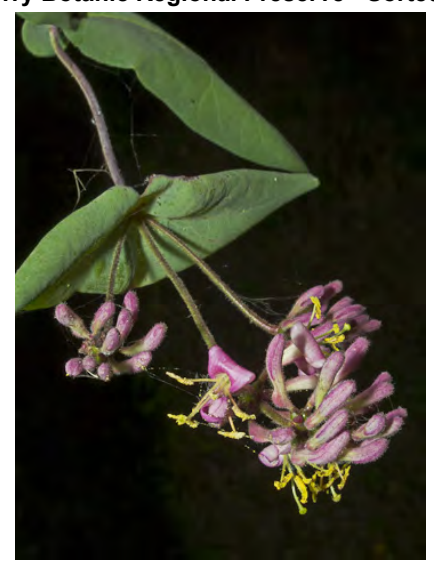
HAIRY VINE HONEYSUCKLE (Lonicera hispidula) Native Perennial - Honeysuckle Family (May–Jun) - Canyons, streamsides, woodland -Shrub sprawling-climbing, 6-10' long, short-hairy. Flower cluster densely sticky. Flowers pink, 0.5-0.6" long, sticky-hairy.