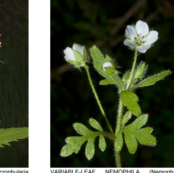
VARIABLE-LEAF NEMOPHILA (Nemophila heterophylla) Native Annual - Borage Family - (Feb-Jun) - Common. Forest, chaparral, roadsides, streambanks - Flower 0.1-0.4" long, unspotted, bract appendages < 0.04" long in fruit.