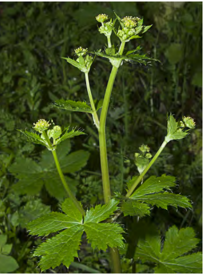
PACIFIC WOODLAND SANICLE (Sanicula crassicaulis) Native Perennial - Carrot Family - (Mar–May) - Open slopes, ravines, woodland - Plants stout, 9-47". Leaves 1-5" across with 3-5 deep, palmate lobes and serrate edges. Flowers yellow.