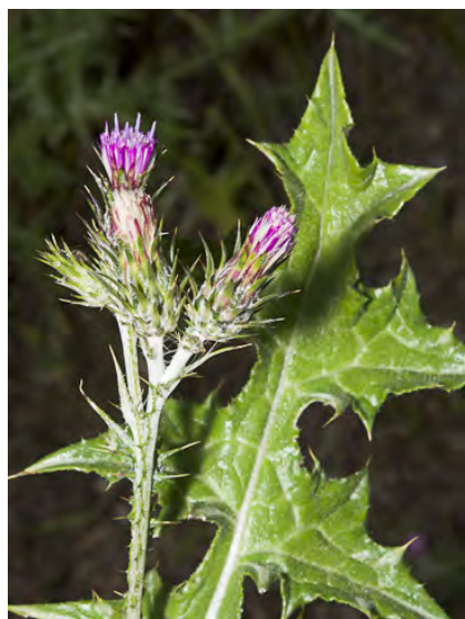
ITALIAN THISTLE (Carduus pycnocephalus subsp. pycnocephalus) Naturalized Annual -Sunflower Family - (Mar–Jul) - Roadsides, pastures, disturbed areas - Stems 8-79", narrow spiny-wings. Lower leaves 4-10 lobed, heads 2-5, flower bracts woolly. NOXIOUS.