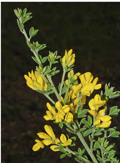
FRENCH BROOM (Genista monspessulana) Naturalized Perennial - Pea Family - (Mar–Jun) -Common. Disturbed places. - Shrub < 10' tall, evergreen. Stems 8-10 ridged, leafy. Flowers yellow, 4-10 at branch tips, banner 0.4-0.6" long. NOXIOUS.