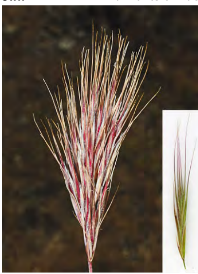
RED BROME (Bromus madritensis subsp. rubens) Naturalized Annual - Grass Family - (Mar–Jun) - Disturbed areas, roadsides - Plant 4-20". Flower cluster condensed, branches obscure, < spikelets. Stem & sheathes hairy. INVASIVE weed.