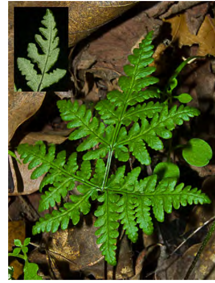
GOLDENBACK FERN (Pentagramma triangularis subsp. triangularis) Native Perennial - Brake Fern Family - - Gen shaded, sometimes rocky or wooded areas - Leaves triangular, 1.2-4" long, undersides either granular green or powdery gold.