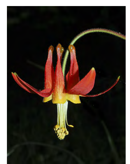
CRIMSON COLUMBINE (Aquilegia formosa) Native Perennial - Buttercup Family - (Apr–Sep) -Streambanks, seeps, moist places, chaparral, oak woodland, mixed-evergreen or conifer forests - Flowers about 2" long, yellow with red sepals & spurs.