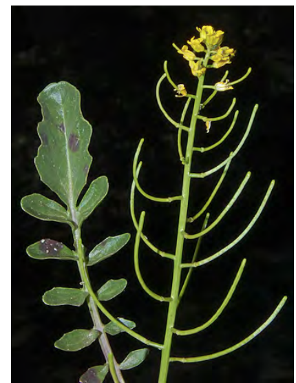
ERECT-POD WINTER CRESS (Barbarea orthoceras) Native Perennial - Mustard Family - (Mar–Jul) - Meadows, streambanks, moist woodland, grassland - Stem 8-24". Lower leaves wlarge terminal lobe, upper clasping stem. Petals bright yellow, 0.2-0.3" long.