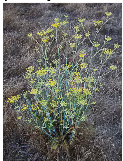
FENNEL (Foeniculum vulgare) Naturalized Perennial - Carrot Family - (May–Sep) - Roadsides, disturbed sites - Plants 3-6.5' tall, anise-scented. Stems waxy-blue, canelike. Flowers yellow. Leaf segments thread-like, edible when young. INVASIVE weed.