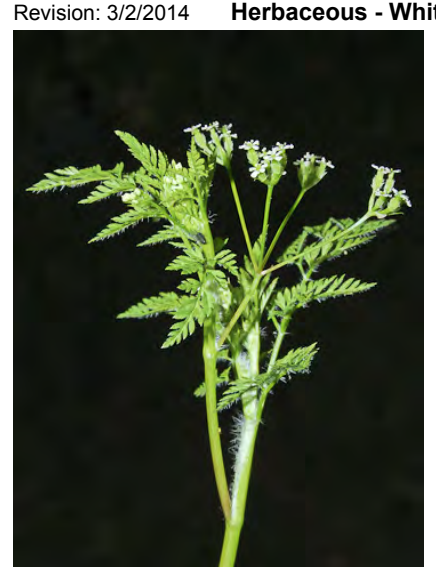
BUR-CHERVIL (Anthriscus caucalis) Naturalized Annual - Carrot Family - (Apr-Jun) - Generally shady places - Plant 18-40" tall. Flowers white; flower stalk >= fruit length. Fruits 0.1-0.2" long with curved "velcro" bristles. Leaves fern-like, triangular outline.