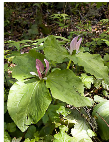
GIANT TRILLIUM (Trillium chloropetalum) Native Perennial - Bunchflower Family - (Apr–May) -Edges of redwood forest, chaparral, gen moist slopes, canyon banks in alluvial soils - Flowers dark purple to white, sessile. Petals 2.6-4" long, odor rose-like or spicy.