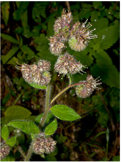
BRISTLY PHACELIA (Phacelia nemoralis subsp. nemoralis) Native Biennial-Perennial - Borage Family - (Apr–Jul) - Moist slopes, streambanks, mixed-evergreen forest - Short-lived. Upper leaves egg-shaped, lower divided. Flowers green-white, 0.16-0.2".