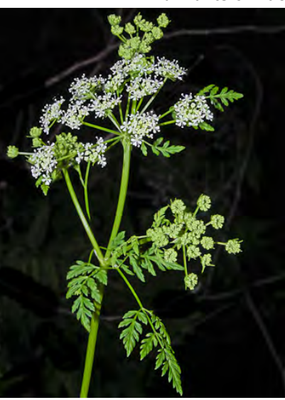
POISON HEMLOCK (Conium maculatum) Naturalized Biennial - Carrot Family - (Apr-Jul) -Common. Moist, esp disturbed places - Plants 2-10' tall. Stems purple-spotted. Leaves fern-like, gen 2x divided. Flowers white. TOXIC. INVASIVE