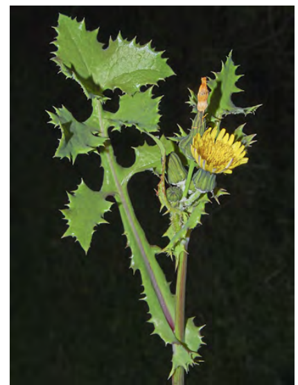
PRICKLY SOW THISTLE (Sonchus asper subsp. asper) Naturalized Annual - Sunflower Family - (All year) - Common. Slightly moist disturbed sites, along streams - Plant 4-48". Leaf teeth prickly. Basal lobes of upper leaves rounded, curving downward.