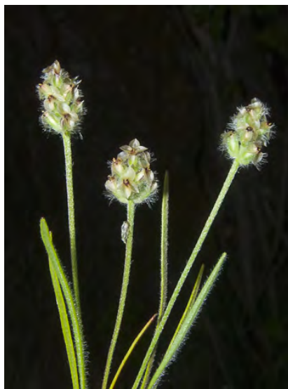
CALIFORNIA DWARF PLANTAIN (Plantago erecta) Native Annual - Plantain Family - (Mar–May) - Sandy, clay, serpentine soil; grassy slopes, flats, open woodland - Leaf 1.2-5" long, linear, hairy. Flowers + stem 1.2-12" tall, cluster 0.2-1.2" long.