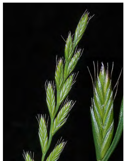
RYE GRASS (Festuca perennis) Naturalized Perennial - Grass Family - (May-Sep) - Dry to moist disturbed sites, abandoned fields - Stem 20-40" tall. Spikelet 0.2-0.9" long, > glume, awned or awnless. Sterile shoots at base. INVASIVE weed.