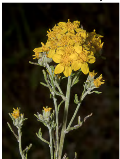
GOLDEN-YARROW (Eriophyllum confertiflorum var. confertiflorum) Native Perennial - Sunflower Family - (Apr-Aug) - Many dry habitats - Shrubby, 8-28" tall. Leaves 0.4-2" long, deeply 3-5 lobed. Flowers yellow; rays 4-6, 0.08-0.2" long; head bracts 4-7.