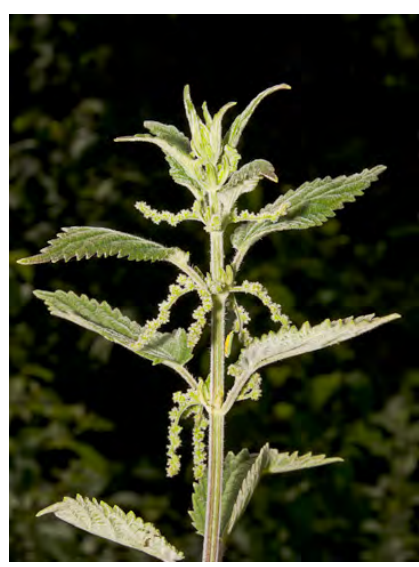
HOARY NETTLE (Urtica dioica subsp. holosericea) Native Perennial - Nettle Family - (Jun-Sep) - Meadows, seeps, springs, margins of marshes, streams, lakes, moist areas in chaparral, coastal scrub - Plant 3.3-9.8' tall, grayish, covered with stinging hairs.