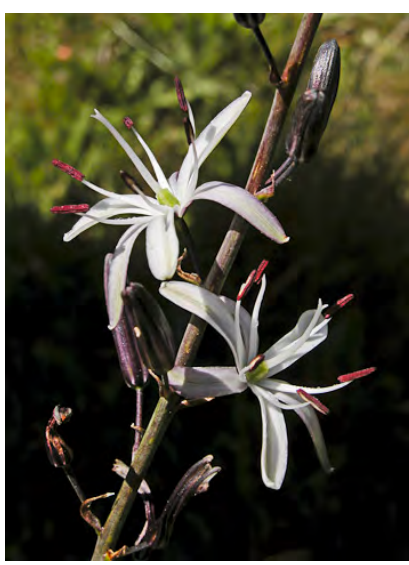
WAVYLEAF SOAP PLANT (Chlorogalum pomeridianum var. pomeridianum) Native Perennial - Century Plant Family - (May-Aug) -Common. Open grassland, chaparral, woodland -Plant 1-8' tall, flowers at night. Bulb juices lather in water