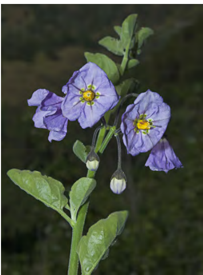
BLUE WITCH (Solanum umbelliferum) Native Perennial - Nightshade Family - (All year) -Shrubland, mixed-evergreen forest, woodland -Plant gen < 39", upper stem hairs branched, dense. Flowers 0.6-1" wide, purple, with green spots at the base.