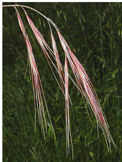
RIPGUT GRASS (Bromus diandrus) Naturalized Annual - Grass Family - (Apr-Jul) - Open, gen disturbed areas - Plant 6-40" tall. Spikelet 1-2.8" long. Lemma body 0.8-1.2" long, awn > 1.2" long. Barbed seeds can stick in flesh of animals. INVASIVE weed.