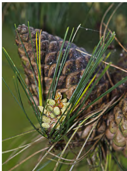
MONTEREY PINE (Pinus radiata) Native Perennial - Pine Family - - - Closed-cone-pine forest, oak woodland - Tree < 125' tall. Mature bark black, deep-grooved. Needles 3 per bundle, 2.4-5.9" long. Seed cone 2.4-6" long, asymmetric, opening 2nd year.