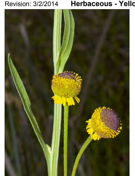
ROSILLA (Helenium puberulum) Native Biennial -Sunflower Family - (Jun-Aug) - Streambanks, seepage areas, lake margins - Plant 20-63". Flower head spherical, disk flowers ~0.1" long, yellow on sides, brown-purple on top; rays 0.15-0.4" long, point down.