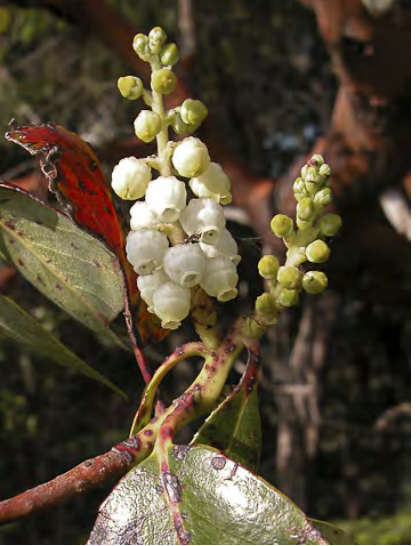
PACIFIC MADRONE (Arbutus menziesii) Native Perennial - Heath Family - (Mar–May) - Conifer, oak forests - Tree < 130' tall, evergreen, peeling red bark. Leaf blades < 5" long. Flowers yellow-white or pink, < 3.1" long. Berries red, < 0.5" diam, round.