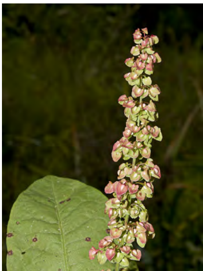
CURLY DOCK (Rumex crispus) Naturalized Perennial - Buckwheat Family - (All year) - Abundant. Disturbed places - Stem 16-39" tall. Flower cluster dense, valves 0.2-0.24", winged around tubercles, smooth edged. 1 tubercle enlarged. INVASIVE.