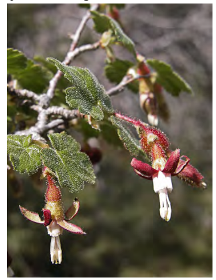
CANYON GOOSEBERRY (Ribes menziesii var. menziesii) Native Perennial - Gooseberry Family - (Feb-Apr) - Common. Forest openings, chaparral - Shrub < 10', prickly. Leaves sticky below. Styles glabrous, anthers exserted, sepals purplish.