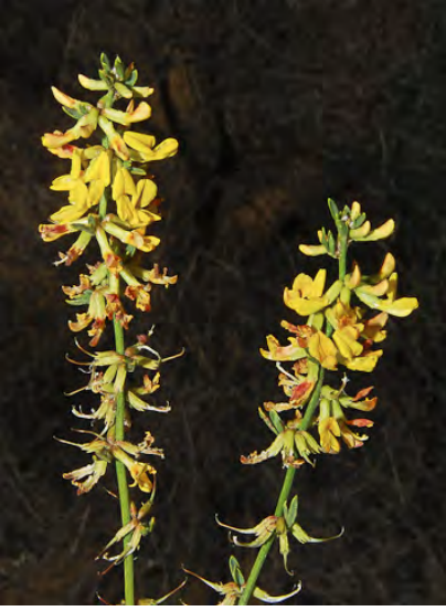
DEERWEED (Acmispon glaber var. glaber) Native Perennial - Pea Family - (Mar–Aug) -Chaparral, roadsides, coastal sands; common -Often shrubby, leaflets 3-6, many clusters of 3-7 stemless flowers, yellow fading to orange-red, 0.3-0.5" long.