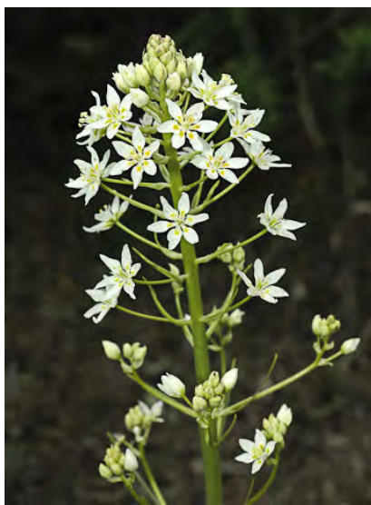
COMMON STAR LILY (Toxicoscordion fremontii) Native Perennial - Bunchflower Family - (Feb-Jun) - Grassy or wooded slopes, outcrops - Stem 16-35" tall. Flower cluster branched or unbranched. Petals 6, white to yellowish, 0.2-0.6" long, > stamens.