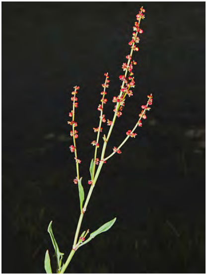
SHEEP SORREL (Rumex acetosella) Naturalized Perennial - Buckwheat Family - (Apr-Jul) - ± Disturbed, often acidic places - Stem < 16". Leaf gen basal, blade 0.8-2.4" long, lower arrowhead-shaped w/2 lobes. Flowers yellowish, turn reddish. INVASIVE.