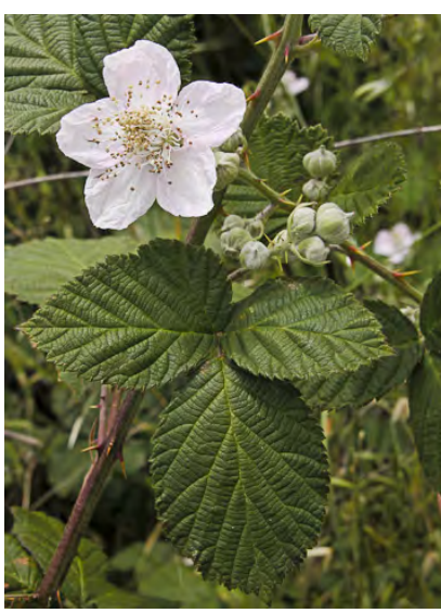
HIMALAYAN BLACKBERRY (Rubus armeniacus) Naturalized Perennial - Rose Family (Mar–Jun) - Common. Disturbed areas, roadsides - Shrub w/thorny 5-angled stem. Leaflets 3-5, white-hairy beneath. Blackberry-type fruit. INVASIVE.