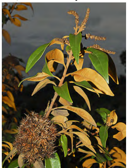
GOLDEN CHINQUAPIN (Chrysolepis chrysophylla var. minor) Native Perennial - Oak Family - (Jun–Sep) - Conifer forest, closed-cone-pine forest, chaparral - Shrub/tree < 16'. Leaf blade 2-6", folded, green above, golden below. Fruit 1.2-2" bur.