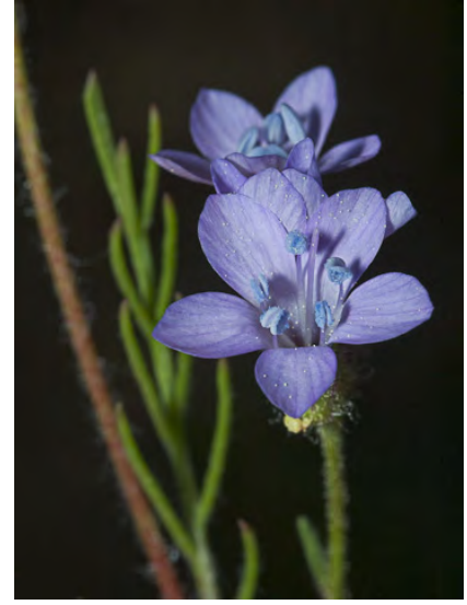
MANY-STEM CALIFORNIA GILIA (Gilia achilleifolia subsp. multicaulis) Native Annual - Phlox Family - (Feb–Jun) - Open or shaded, gen grassy places, sandy or rocky soil - Leaves linear-lobed. Flowers white to lavender, 0.2-0.4" long, not in heads.