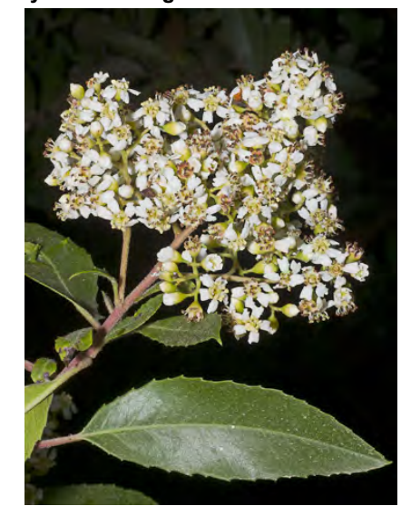
CHRISTMAS BERRY / TOYON (Heteromeles arbutifolia) Native Perennial - Rose Family -((May)Jun–Aug) - Chaparral, oak woodland, mixed-evergreen forest - Shrub-tree < 33' tall, evergreen. Leaf 2-4" long. Petals white, < 0.16" long. Fruit bright red.