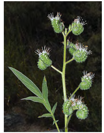
ROCK PHACELIA (Phacelia imbricata subsp. imbricata) Native Perennial - Borage Family - (Apr–Jul) - Slopes, roadsides, flats, canyons, chaparral, woodland - Plant 8-47", tufted. Leaf segments 7-15. Flowers 0.2-0.3", white. Flower bracts often sticky.