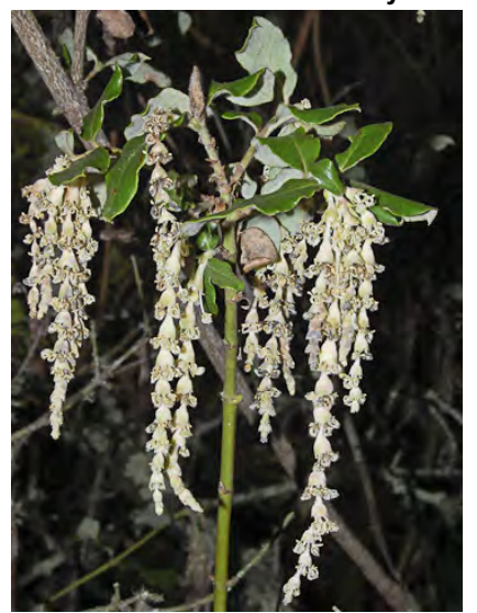
COAST SILK TASSEL (Garrya elliptica) Native Perennial - Silk Tassel Family - (Jan-Mar) - Seacliffs, sand dunes, chaparral, foothill-pine woodland - Shrub or small tree, < 26' tall. Leaves wavy-margined, underside hairs felt-like, interwoven. Fruit hairy.