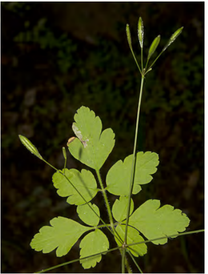
SWEET-CICELY (Osmorhiza berteroi) Native Perennial - Carrot Family - (Apr-Jul) - Conifer forest, woodland, disturbed areas - Plant 12-47". Leaflets in 3s, serrate to irreg lobed. Flower white. Fruit 0.5-1", upward pointing barbs, splitting apart below.