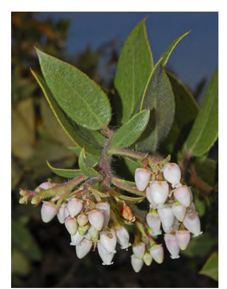
BRITTLE-LEAF MANZANITA (Arctostaphylos crustacea subsp. crustacea) Native Perennial - Heath Family - (Feb-Apr) - Chaparral, conifer forest - Twigs bristly, leaf stalk 0.1-0.2", upper leaf surface shiny.