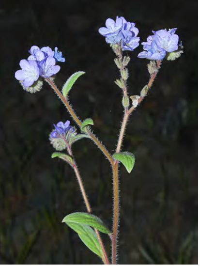
DIVARICATE PHACELIA (Phacelia divaricata) Native Annual - Borage Family - (Apr-Jun) - Open areas, chaparral, woodland, grassland - Plant 3.5-16" tall. Leaves with 0-few lobes. Flowers 0.4-0.6" long, lavender to violet. Seeds