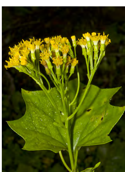
GERMAN IVY (Delairea odorata) Naturalized Perennial - Sunflower Family - (Nov-Mar) - Shady, ± disturbed places, riparian woodland, coastal scrub - Vine stem 3-20' long. Heads ~ 20 per cluster. Disk flowers bright yellow. NOXIOUS weed