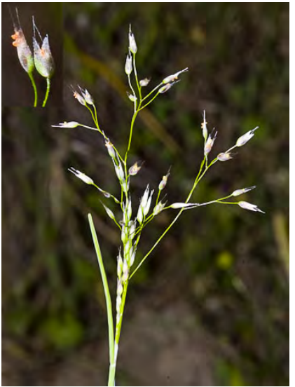
SILVER HAIR GRASS (Aira caryophyllea) Naturalized Annual - Grass Family - (Apr-Jun) - Sandy soils, open or disturbed sites - Flower cluster > 0.6" wide, diffuse with long slender branches. Spikelets about 0.1" long with 2 extended awns.