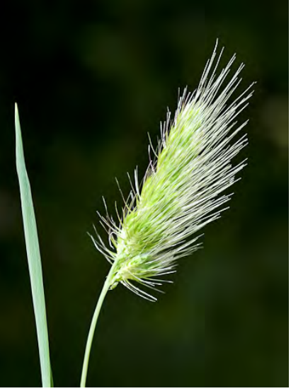
BRISTLY DOGTAIL GRASS (Cynosurus echinatus) Naturalized Annual - Grass Family - (May-Jul) - Open, disturbed sites - Tufted. Stem 4-28" long. Leaf blade 0.1-0.6" wide. Flower cluster 0.4-1.6" long, 1-sided. Fertile and sterile spikelets. INVASIVE weed.