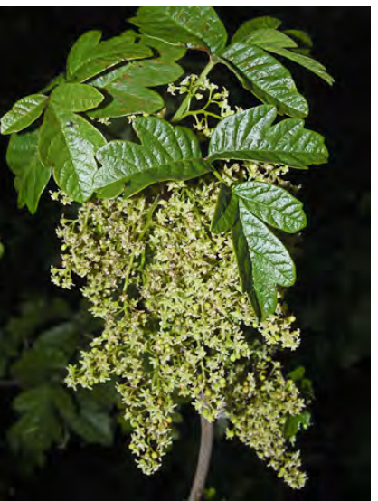
WESTERN POISON OAK (Toxicodendron diversilobum) Native Perennial - Sumac Family - (Apr-Jun) - Canyons, slopes, chaparral, coastal scrub, oak woodland - Shrub or vine. Leaflets 3, red in fall, mid leaflet stalked. Flowers green. Fruits white. TOXIC.