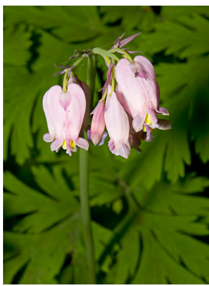
PACIFIC BLEEDING HEART (Dicentra formosa) Native Perennial - Poppy Family - (Mar–Jul) -Damp, shaded areas - Plant 8-18" tall. Leaves dissected, 8-20" long. Flowers heart-shaped, rose-pink, nodding, 2-30 per cluster, 0.5-1.2" long.