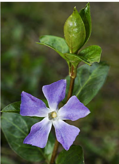
GREATER PERIWINKLE (Vinca major) Naturalized Perennial - Dogbane Family -(Mar-Jun(Jan)) - Coastal bluffs, sheltered places, esp along stream beds - Plant sprawling. Leaf blade ~ 2.8" long, oval. Flower purple-blue, 1.2-2" wide at top. INVASIVE weed.