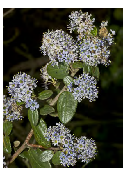
JIM BRUSH (Ceanothus oliganthus var. sorediatus) Native Perennial - Buckthorn Family -(Jan-May) - Slopes, ridges, chaparral, conifer forest - Shrub/tree < 11.5' tall. Twigs red-brown. Leaves alternate, 3 main veins. Flowers blue, purple-blue or whitish.