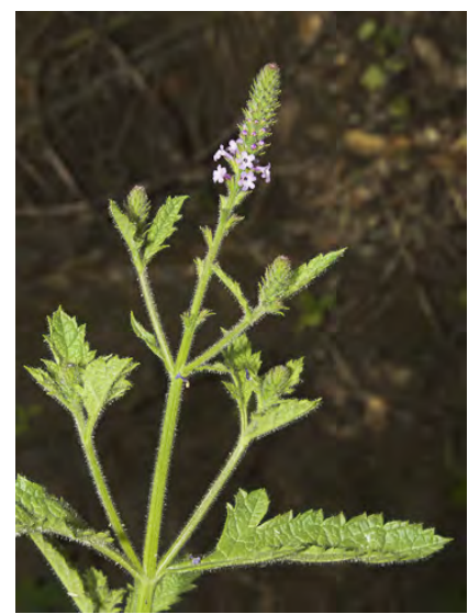
ROBUST VERVAIN (Verbena lasiostachys var. scabrida) Native Perennial - Vervain Family - (May-Sep) - Open, dry to wet places - Plant 14-32" tall. Leaves green, narrow, 3-lobed, stiff-haired above. Flowers blue to purple on long stalk.