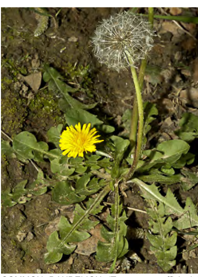
COMMON DANDELION (Taraxacum officinale) Naturalized Biennial-Perennial - Sunflower Family - (All year) - Abundant Esp disturbed areas - Stem hollow. Leaves bright green with sharp down-pointing lobes. Outer head bracts reflexed. Fruit ~ brown.