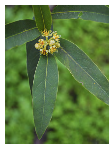
CALIFORNIA BAY (Umbellularia californica) Native Perennial - Laurel Family - (Nov-May) -Common. Canyons, valleys, chaparral - Tree < 150' tall. Leaf 1.2-4", 0.6-1.2" wide, aromatic. Cluster of 5-10 small, yellow or yellow-green flowers. Fruit 0.8-1" diam.