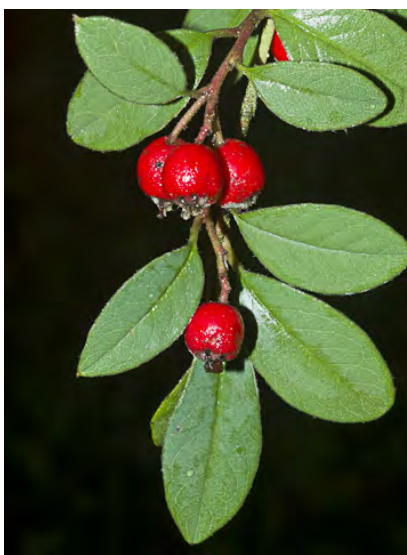
SILVERLEAF COTONEASTER (Cotoneaster pannosus) Naturalized Perennial - Rose Family -(May–Jul) - Disturbed places, mixed-evergreen forest - Leaves 0.8-1.4" long, pointed tip, smooth above. Petals white, spreading. Fruit red. INVASIVE weed.