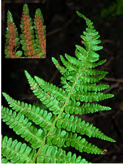
WESTERN LADY FERN (Athyrium filix-femina var. cyclosorum) Native Perennial - Cliff Fern Family - - - Woodland, along streams, seepage area - Leaves gen 12-39" long, broadest near middle, 1-2 divided, ultimate divisions rounded.