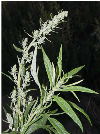
MUGWORT (Artemisia douglasiana) Native Perennial - Sunflower Family - (May-Nov) -Common. Open to shady areas, often in drainages - Plant 20-60" tall. Leaves gen 0.4-4" long, densely hairy below, some 3-5 lobed. Flower bracts hairy.