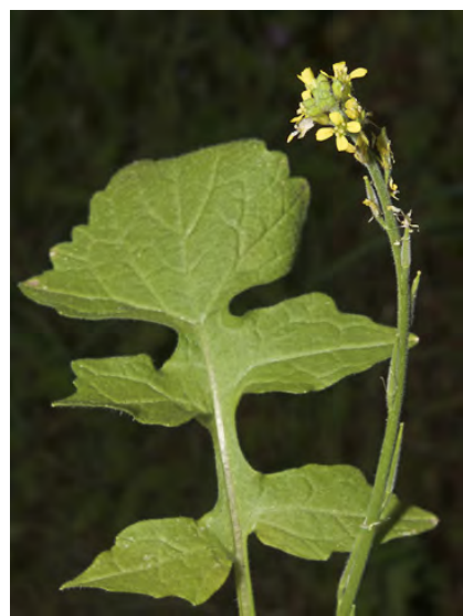
HEDGE MUSTARD (Sisymbrium officinale) Naturalized Annual - Mustard Family - (Apr–Sep) - Disturbed areas, fields, pastures - Stem 10-22" tall, thin, wiry. Petals 0.1-0.16" long, pale yellow. Fruit 0.4-0.55" long, awl-shaped, appressed.