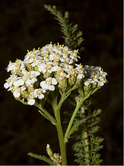
YARROW (Achillea millefolium) Native Perennial - Sunflower Family - (Apr-Sep) - Many habitats -Plant 4"-7' tall. Stem white-hairy. Leaves finely dissected. Flower cluster flat-topped. Flowers white to pink. Widely used in folk medicine.