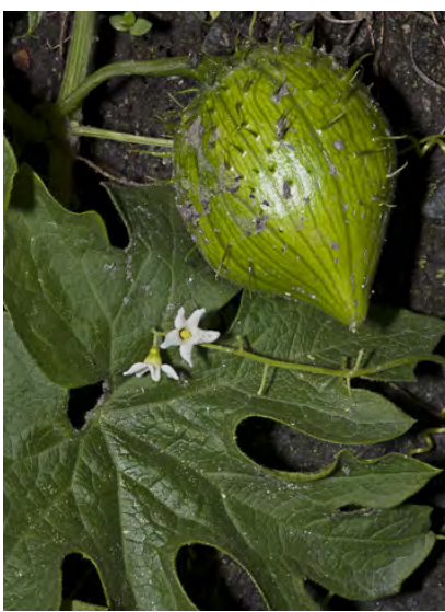
COAST MAN-ROOT (Marah oregana) Native Perennial - Gourd Family - (Mar-May) - Shrubby or open areas, forest edges - Vine 3-20' long. Leaves deeply lobed. Flowers white, deep cup-shaped, > 0.3" wide. Fruit smooth at end.