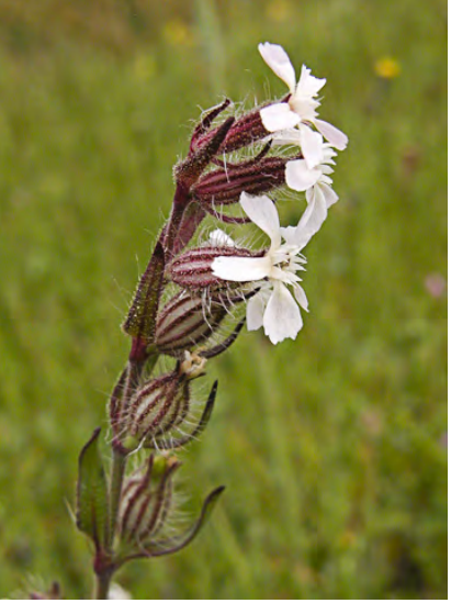
SMALL-FLOWER CATCHFLY (Silene gallica) Naturalized Annual - Pink Family - (Spring-early summer) - Fields, disturbed areas - Plant 4-16". Leaves < 1.4" long. Flower cluster short-hairy, bracts sticky-hairy, petal blade 0.2-0.5" long, smooth to notched, white to pink.