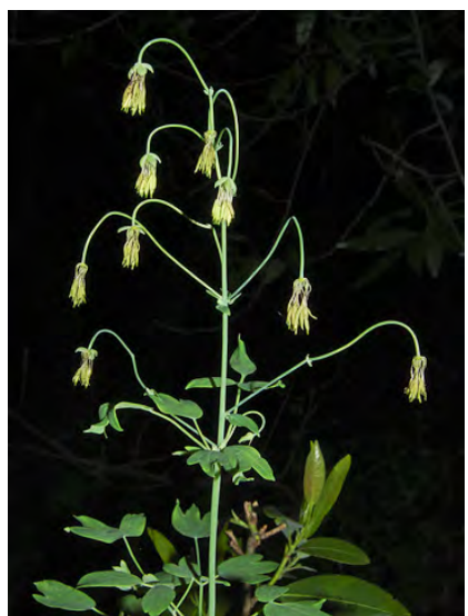
FOOTHILL MEADOW-RUE (Thalictrum fendleri var. polycarpum) Native Perennial - Buttercup Family - (Mar–Jun) - Moist, open to shaded places, woodland, forest - Plant 2-6'+ tall, male or female. Leaf 1-4x divided, 3-18" long, segments 0.3-0.8" long. No petals.