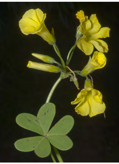
BERMUDA BUTTERCUP (Oxalis pes-caprae) Naturalized Perennial - Oxalis Family (Jan-May) - Disturbed areas, roadsides, grassland, dunes - Flowering stem < 12" tall. Leaflets in 3s, < 1.4" long. Petals yellow, < 1" long. Ornamental. INVASIVE weed.