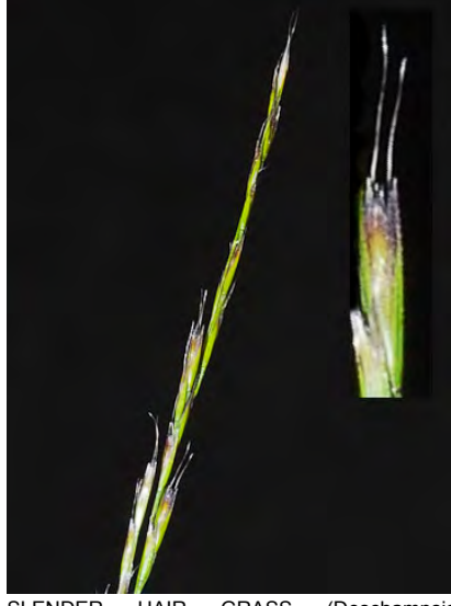
SLENDER HAIR GRASS (Deschampsia elongata) Native Perennial - Grass Family - (May-Sep) - Wet sites, meadows, lakeshores, shaded slopes - Densely clumped. Stem 4-28" long. Glumes =, 0.1-0.2". Lemmas 2, ~0.1", awns from middle 0.04-0.2" & straight.