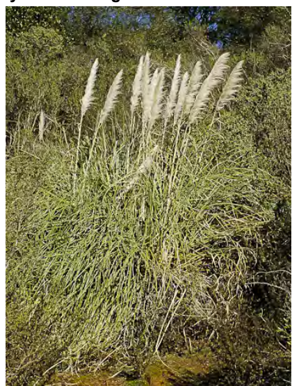
HAIRY PAMPAS GRASS (Cortaderia jubata) Naturalized Perennial - Grass Family - (Sep-Feb) - Disturbed sites, many habitats, esp coastal - Plant 6-23' tall. Leaf blades 0.1-0.5" wide, sheathes hairy. NOXIOUS weed.