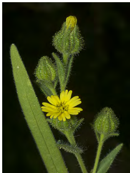
GUMWEED (Madia gracilis) Native Annual -Sunflower Family - (Apr-Aug) - Open, semi-shaded or disturbed sites, many habitats, incl serpentine - Plant 2.4-40" tall, hairy, upper half sticky. Leaf 0.4-4" long. Rays yellow, 3-10, 0.06-0.3" long. Bracts 6-10 mm tall.