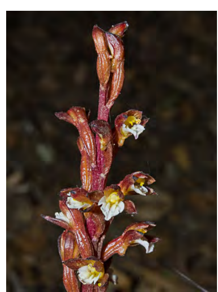
SPOTTED CORALROOT (Corallorhiza maculata var. maculata) Native Perennial - Orchid Family -(May–Aug) - Shaded mixed-evergreen or conifer forest, in decomposing If litter - Flower lip white, not widest at tip, w/2 rounded side lobes.