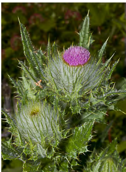
INDIAN THISTLE (Cirsium brevistylum) Native Annual-Biennial - Sunflower Family - (Mar-Aug) - Moist places - Plant 1-11¹. Heads 1-1.6" wide, 1-1.4" long, 1-several clustered at stem tips, below leaf tips. Flowers white to purple, 0.8-1"