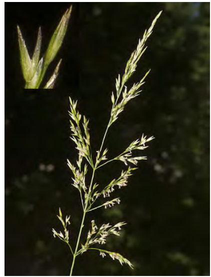
DUNE BENT GRASS (Agrostis pallens) Native Perennial - Grass Family - (Jun–Aug) - Common. Open meadows, woodland, forest, subalpine - Lower leaf blades <= 0.2" wide, flat to inrolled. Flower cluster 2-8" long, < 0.8" wide; narrow and arching when young.