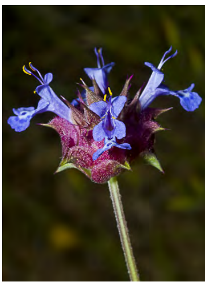
CHIA (Salvia columbariae) Native Annual - Mint Family - (Mar–Jun) - Dry, disturbed sites, chaparral, coastal-sage scrub - Plant 4-20" tall. Leaf 0.8-4" long, many 2x divided. Flower cluster head-like, 1-2 on bare stem. Flowers blue, tubes 6-8 mm long.