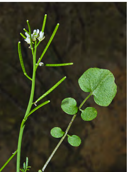
WESTERN BITTER-CRESS (Cardamine oligosperma) Native Annual - Mustard Family -(Cardamine oligosperina Native Amida: A mustaful rainily (Mar–Jul) - Wet meadows, shady banks, damp areas - Plants < 16". Leaves divided into 5-9 leaflets. Flowers white, 0.1-0.2" long. Fruit < 0.1"