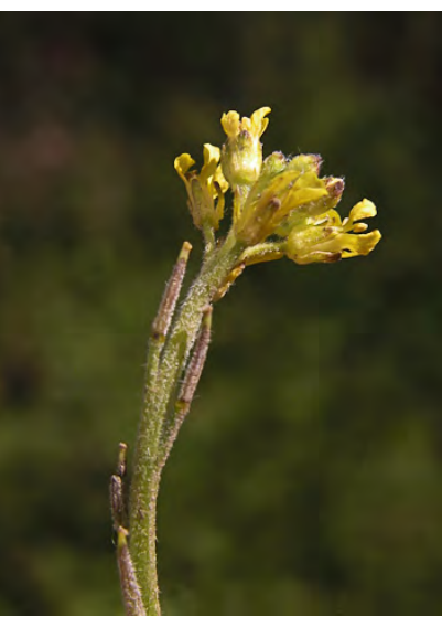
SHORTPOD MUSTARD (Hirschfeldia incana) Naturalized Biennial-Perennial - Mustard Family - (Apr-Oct) - Disturbed areas - Stem 16-60". Longest leaves 1.6-4" long, dense-hairy. Petals pale yellow, ~0.2" long. Fruit appressed. Fall-blooming. INVASIVE.