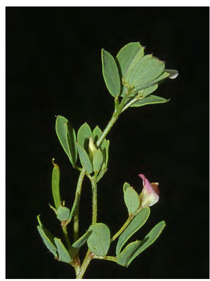
SMALL-FLOWER LOTUS (Acmispon parviflorus) Native Annual - Pea Family - (Mar–May) - Abundant. Coastal bluffs to oak/pine or fir woodland, open or disturbed areas - Flowers pinkish, solitary, 0.2" long, on stalk with bracts. Not hairy.