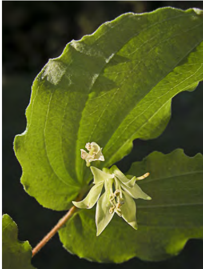
HOOKER FAIRY BELLS (Prosartes hookeri) Native Perennial - Lily Family - (Mar-Jun) -Montane conifer, mixed-evergreen forest, exposed roadside - Stem 12-32" tall. Leaf 1.2-6" long. Flower 0.3-0.6" long, white, hanging below the leaves, stamens > petals.