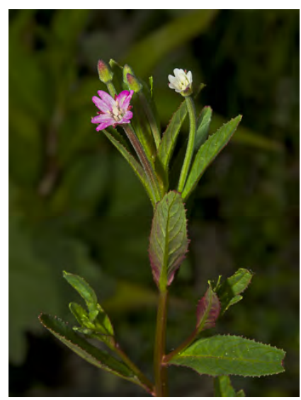
COMMON WILLOWHERB (Epilobium ciliatum subsp. ciliatum) Native Perennial - Evening Primrose Family - (Jun-Oct) - Common. Disturbed places, moist meadows, streambanks, roadsides - Plant 20-48" tall, smooth or short-hairy. Petals 2-6 mm, white to pink.