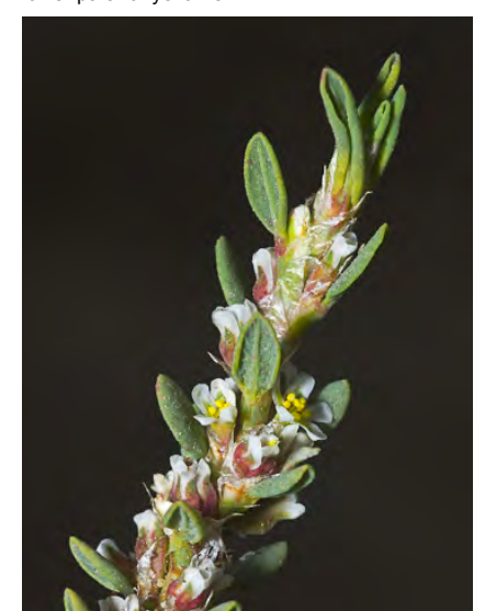
KNOTWEED (Polygonum aviculare subsp. depressum) Naturalized Annual - Buckwheat Family - (May-Nov) - Disturbed places - Stem 4-20", mat-forming, Flowers 2-8/leaf axil, ~0.1" long, fused 1/2 length, w/white or pink margins.