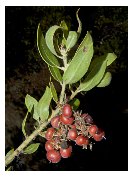
EASTWOOD MANZANITA (Arctostaphylos glandulosa subsp. glandulosa) Native Perennial - Heath Family - (Jan–Apr) - Chaparral, conifer forest - Shrub 3-13' tall. Twigs w/gland-tipped hairs, leafy bracts, 0.1-0.2" leaf stalk, burl. Upper leaf surface not shiny.