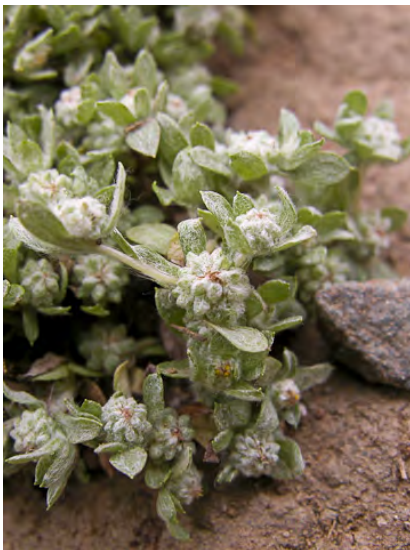
SLENDER WOOLLY-MARBLES (Psilocarphus tenellus) Native Annual - Sunflower Family - (Mar-Jul) - Common. Dry, seasonally moist slopes, flats, burns, trails, rarely vernal pools - Plant hairy. Leaves spoon-shaped. Disk flowers 4-lobed.