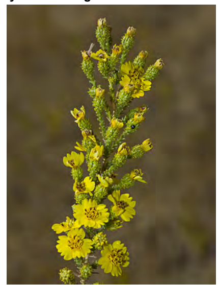
STICKY TARPLANT (Holocarpha virgata subsp. virgata) Native Annual - Sunflower Family - (May-Nov) - Grassland - Plant 8-48" tall, gladular, not very-short-hairy. Heads small, at branch ends. Ray flowers 3-8; disk flowers 9-25, anthers black.