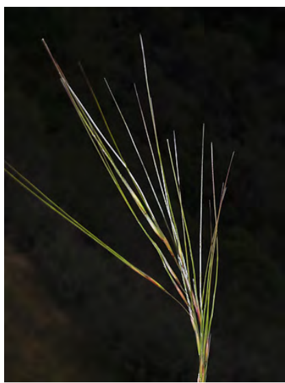
PURPLE NEEDLE GRASS (Stipa pulchra) Native Perennial - Grass Family - (Mar—Jun) - Oak woodland, chaparral, grassland - Stem 14-39" long. Leaf blade 4-8" long. Glumes 0.5-0.8" long, ~equal. Awn 1.6-4" long, last segment straight.