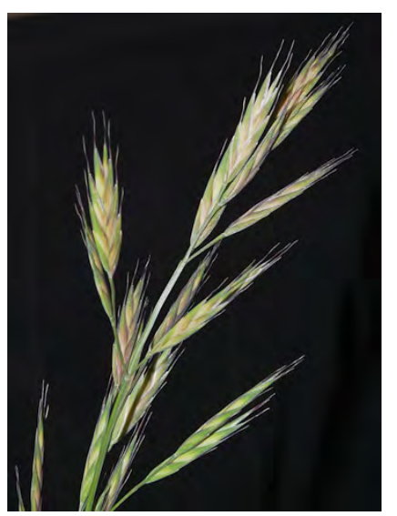
CALIFORNIA BROME (Bromus carinatus var. carinatus) Native Perennial - Grass Family - (Apr-Aug) - Coastal prairies, openings in chaparral, plains, open oak and pine woodland -Plant 20-40" tall. Flower cluster 6-16" long. Spikelet 0.8-1.6" long. Lemma 0.5-0.8" long, hairy, awn 0.3-0.6" long.