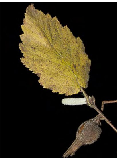
CALIFORNIA HAZELNUT (Corylus cornuta subsp. californica) Native Perennial - Birch Family - (Jan–Mar) - Common. Many habitats, esp moist, shady places - Shrub, small tree < 13' tall. Leaf velvetry-hairy. Fruits 0.8-1.2" long in papery bracts, 1-2/group.