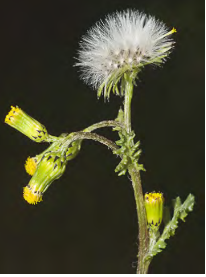
COMMON GROUNDSEL (Senecio vulgaris) Naturalized Annual - Sunflower Family -(Feb-Jul) - Common. Disturbed areas - Plant 4-24" tall, not hairy, w/1-10+ stems. Flower head bracts with black-tips. Milky sap.