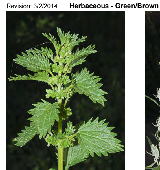
DWARF NETTLE (Urtica urens) Naturalized Annual - Nettle Family - (Jan-Jun) - Disturbed areas, stream banks, shaded areas in grassland, oak woodland, chaparral, coastal-sage scrub, riparian woodland - Leaf teeth sharp. Petals 2 large, 2 small, free to base.