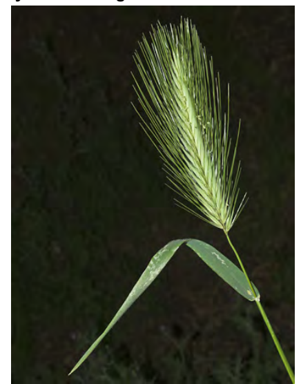
HARE BARLEY (Hordeum murinum subsp. leporinum) Naturalized Annual - Grass Family -(Feb-May) - Moist, gen disturbed sites. Common - Stem 12-43" tall. Central spikelet stalk ~0.06" long. Central floret << lateral florets. INVASIVE weed.