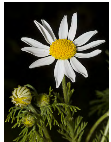
MAYWEED (Anthemis cotula) Naturalized Annual - Sunflower Family - (Apr-Aug) - Common. Disturbed areas, fields, coastal dunes, chaparral, oak woodland - Leaves finely divided into thread-like lobes. Flowers > 0.6" wide, many on top of a well-branched stem.