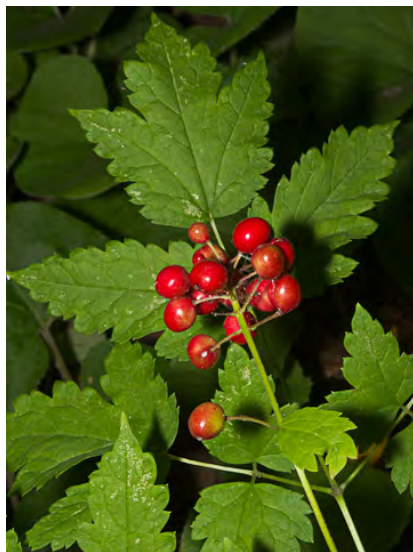
BANEBERRY (Actaea rubra) Native Perennial -Buttercup Family - (May-Sep) - Deep soils, moist, open to shaded sites, mixed-evergreen or conifer forests - Plant 8-40" tall. Flowers white. Fruits shiny red or white, 0.2-0.4" long. All plant parts TOXIC to humans.