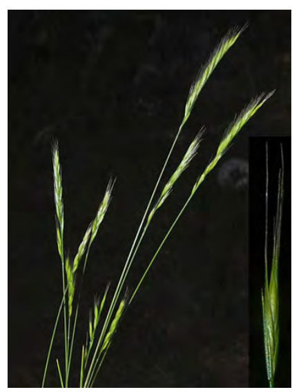
BROME FESCUE (Festuca bromoides) Naturalized Annual - Grass Family - (May–Jun) -Uncommon. Dry, disturbed places, coastal-sage scrub, chaparral - Stem < 20". Inflor 0.6-6" tall, dense, lower branches erect. Spikelet 0.2-0.4" long, awn 0.1-0.3" long.