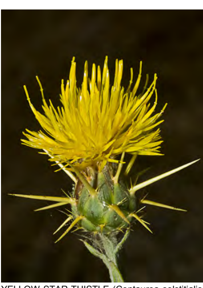
YELLOW STAR-THISTLE (Centaurea solstitialis) Naturalized Annual - Sunflower Family (May-Oct) - Invasive, roadsides, disturbed grassland or woodland - Plant 4-39" tall. Leaves woolly, extend down the stem. Flower bract spines 0.4-1" long. NOXIOUS weed.