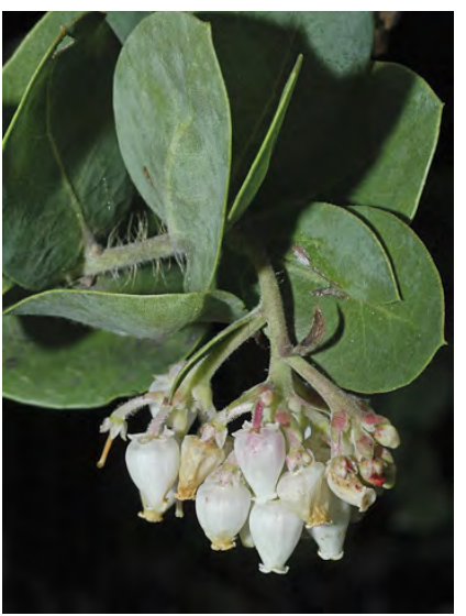
PALLID MANZANITA (Arctostaphylos pallida) Native Perennial - Heath Family - (Jan-Mar) - Siliceous shales, slopes, ridges, chaparral - Leaves clasping, smooth. Flower stalk and fruit W/sticky hairs. Fed: THREATENED, Calif: ENDANGERED.