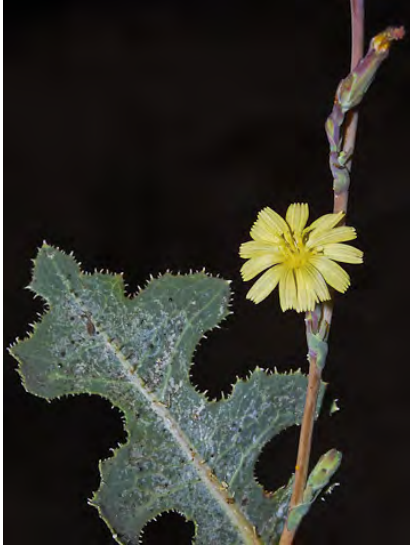
PRICKLY LETTUCE (Lactuca serriola) Naturalized Annual - Sunflower Family (May-Oct) - Abundant. Disturbed places - Stem 1.6-10' tall, prickly-bristly. Leaves deeply-lobed, midvein and edges prickly-bristly. Flowers pale yellow, 0.16-0.2" wide.