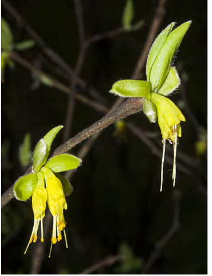
WESTERN LEATHERWOOD (Dirca occidentalis) Native Perennial - Daphne Family - (Nov-Mar) - Gen n facing slopes, mixed-evergreen forest to chaparral, gen fog belt - Shrub 3-10'. Flowers yellow, 1-4 per group, open before/with leaves. CNPS: Fairly ENDANGERED.