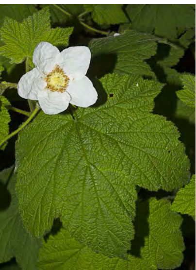
THIMBLEBERRY (Rubus parviflorus) Native Perennial - Rose Family - (Mar-Aug) - Common; moist semi-shaded areas, esp edges of woodland - Shrub 0.5-2 m tall, not prickly. Petals 0.5-0.9" long, white. Leaves simple, 3-5 lobed. Raspberry-type fruit.