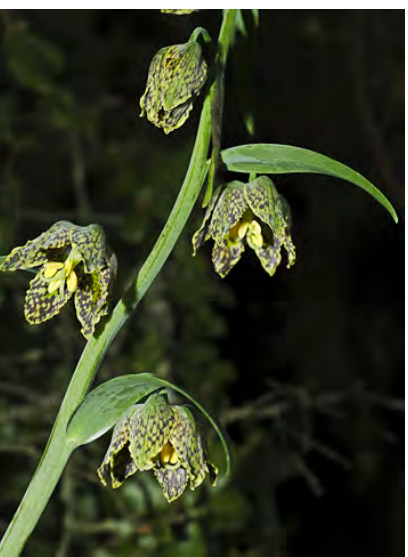
CHECKER LILY (Fritillaria affinis) Native Perennial - Lily Family - (Mar–Jun) - Common. Oak or pine scrub, grassland - Stem 4-47" tall. Leaves 1.6-6.3" long, whorled below. Petals mottled brown-purple and yellow-green, 0.4-1.6"