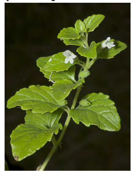
YERBA BUENA (Clinopodium douglasii) Native Perennial - Mint Family - (Apr-Sep) - Shady places, chaparral, woodland - Stem trailing, gen woody, forming mats. Leaves 0.4-1.4" long, oval. Petals white to lavender, 3-8 mm long. Aromatic.