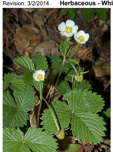
WOOD STRAWBERRY (Fragaria vesca) Native Perennial - Rose Family - (Jan–Jul) - Gen partial shade in forest - Stem gen 1.2-6" long. Leaflets 3, thin. Central leaflet gen w/12-21 teeth. Flower white, gen 0.6" wide, often above leaves. Fruit a strawberry.