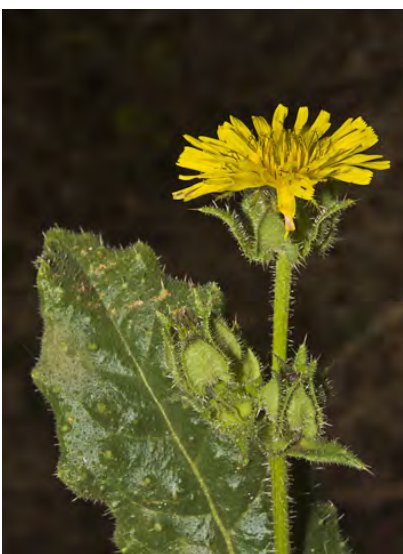
BRISTLY OX-TONGUE (Helminthotheca echioides) Naturalized Annual-Biennial Sunflower Family - (All year) - Common. Disturbed areas - Stem 1-6.5' tall, bristly. Leaf 2-8" long, covered with prickly bumps. Flower heads 0.8-1.6" wide. INVASIVE weed.