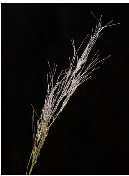
FOOTHILL NEEDLE GRASS (Stipa lepida) Native Perennial - Grass Family - (Mar–Jun) - Dry slopes, chaparral, grassland, savanna, coastal scrub - Stem 14-39" tall. Leaf blade 4.7-9.1" long, narrow. Glumes 0.2-0.6" long. Awn 0.8-2" long.