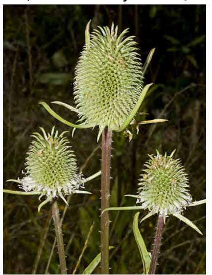
FULLER'S TEASEL (Dipsacus sativus) Naturalized Biennial - Teasel Family - (May–Jul) - Disturbed areas, fields, vacant lots, pastures - Plant gen < 6' tall. Leaf pairs fused around stem. Flower cluster lavender, 5-10 cm long, bracts spreading. INVASIVE weed.