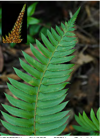
WESTERN SWORD FERN (Polystichum munitum) Native Perennial - Wood Fern Family -- Common. Wooded hillsides, shaded slopes, rarely cliffs, outcrops - Fronds gen 20-48" long, divided once. Segments usually separate, teeth point to tips, scaly rachis.