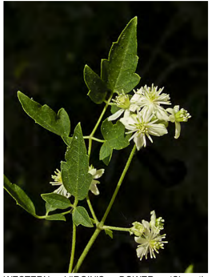
WESTERN VIRGIN'S BOWER (Clematis ligusticifolia) Native Perennial - Buttercup Family - (Jun-Sep) - Along streams, wet places -Leaflets 5-15, irregularly lobed. Flowers many, in fall. Sepals white to cream, 0.2-0.24" long.