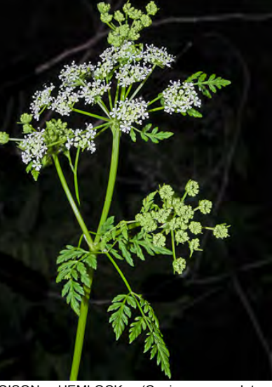
POISON HEMLOCK (Conium maculatum) Naturalized Biennial - Carrot Family - (Apr–Jul) -Common. Moist, esp disturbed places - Plants 2-10' tall. Stems purple-spotted. Leaves fern-like, gen 2x divided. Flowers white. TOXIC. INVASIVE weed.