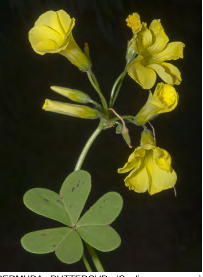
BERMUDA BUTTERCUP (Oxalis pes-caprae) Naturalized Perennial - Oxalis Family -(Jan-May) - Disturbed areas, roadsides, grassland, dunes - Flowering stem < 12" tall. Leaflets in 3s, < 1.4" long. Petals yellow, < 1" long. Ornamental. INVASIVE weed.