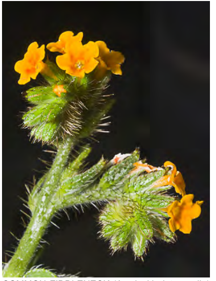
COMMON FIDDLENECK (Amsinckia intermedia) Native Annual - Borage Family - (Mar–Jun) -Abundant. Open, generally disturbed places -Plant 0.5-3' tall. Flowers orange with 5 red spots, 0.3-0.4" long, 0.2-0.4" wide, tube straight.