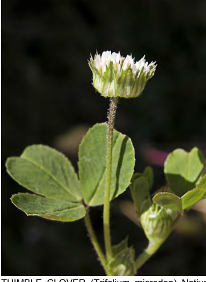
THIMBLE CLOVER (Trifolium microdon) Native Annual - Pea Family - (Mar–Jun) - Common locally. Open, moist or dry, gen disturbed areas -Short-hairy. Head bract w/flat base. Flowers white to pink. Calyx lobes < 1/2 flower tube length, < flowers.