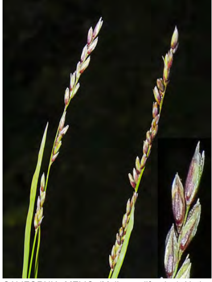
CALIFORNIA MELIC (Melica californica) Native Perennial - Grass Family - (Apr-May) - Open or rocky hillsides, oak woodland, conifer forest -Stem 16-55". Leaf 0.06-0.2" wide. Spiklet 0.2-0.6" long, w/3-7 fertile florets; sterile tip widest above middle, tip squared.