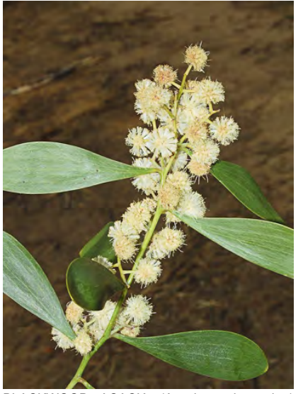
BLACKWOOD ACACIA (Acacia melanoxylon) Naturalized Perennial - Pea Family - (Feb-Mar) -Uncommon. Disturbed areas - Tree < 100' tall. Leaves simple, 0.2-1.2" wide, 3-5 main veins. Flowers pale yellow, 2-8 per head. INVASIVE weed.