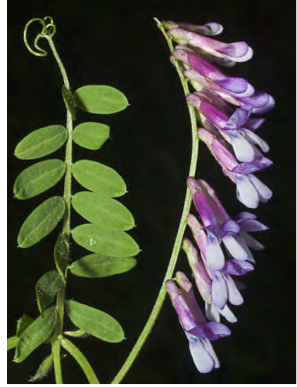
SPARSELY HAIRY VETCH (Vicia villosa subsp. varia) Naturalized Annual-Biennial - Pea Family - (Mar–Jun) - Grassland, roadside, disturbed areas - Stems w/few hairs. Flowers 10-20, blue-purple to white, 0.4-0.55" long. Lower bract lobes 0.04-0.1" long.