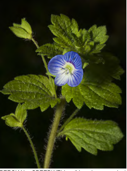
PERSIAN SPEEDWELL (Veronica persica) Naturalized Annual - Plantain Family - (Feb–May) - Wet, disturbed areas, fields - Stem 2-24" long, crawling. Flowers on 0.6-1.2" long stalks. Flowers blue, purple-lined with a white center.