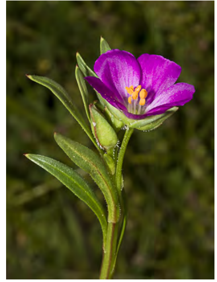
RED MAIDS (Calandrinia ciliata) Native Annual -Miner's Lettuce Family - (Feb-May) - Common. Sandy to loamy soil, grassy areas, cult fields -Petals 0.2-0.6" long, bright pink to red, round-tipped. Fruit < 0.1" longer than bracts.