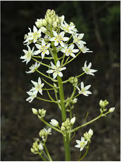
COMMON STAR LILY (Toxicoscordion fremontii) Native Perennial - Bunchflower Family -(Feb–Jun) - Grassy or wooded slopes, outcrops -Stem 16-35" tall. Flower cluster branched or unbranched. Petals 6, white to yellowish, 0.2-0.6" long, > stamens.