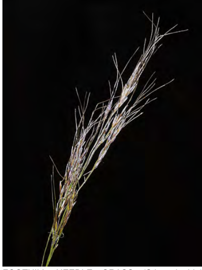
FOOTHILL NEEDLE GRASS (Stipa lepida) Native Perennial - Grass Family - (Mar–Jun) - Dry slopes, chaparral, grassland, savanna, coastal scrub - Stem 14-39" tall. Leaf blade 4.7-9.1" long, narrow. Glumes 0.2-0.6" long. Awn 0.8-2" long.