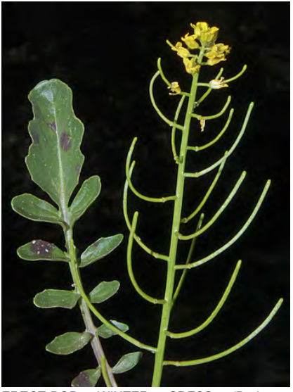
ERECT-POD WINTER CRESS (Barbarea orthoceras) Native Perennial - Mustard Family -(Mar-Jul) - Meadows, streambanks, moist woodland, grassland - Stem 8-24". Lower leaves w/large terminal lobe, upper clasping stem. Petals bright yellow, 0.2-0.3" long.