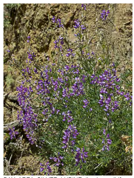
BAY AREA SILVER LUPINE (Lupinus albifrons var. collinus) Native Perennial - Pea Family -(Mar-Jun) - Cliffs, forest openings - Subshrub 8-16" tall, woody only at base, silvery. Flowers 0.35-0.6" long, violet to lavender.