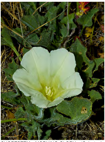
SHORTSTEM MORNING-GLORY (Calystegia subacaulis subsp. subacaulis) Native Perennial - Morning-glory Family - (Apr–Jun) - Dry, open scrub or woodland - Stem gen ~0.8" long. Flowers 1.3-2.4" long, white or cream. Bractlets concealing flower bracts.