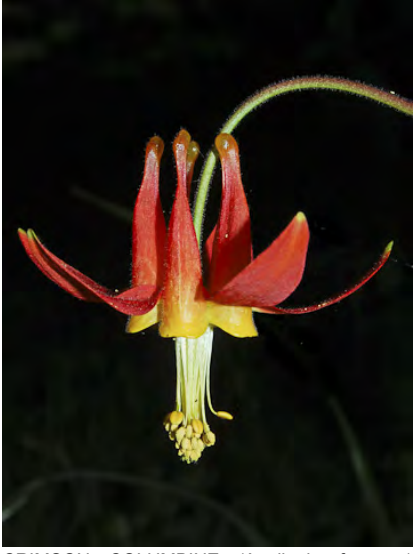
CRIMSON COLUMBINE (Aquilegia formosa) Native Perennial - Buttercup Family - (Apr–Sep) -Streambanks, seeps, moist places, chaparral, oak woodland, mixed-evergreen or conifer forests - Flowers about 2" long, yellow with red sepals & spurs.