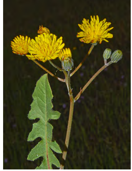
DANDELION-LEAF HAWKSBEARD (Crepis vesicaria subsp. taraxacifolia) Naturalized Annual-Biennial - Sunflower Family - (Feb-Oct) - Sandy clearings, hillsides, disturbed places - Plant 1-47" tall. Leaves dandelion-like. Fruit beak 0.1-0.2" long.