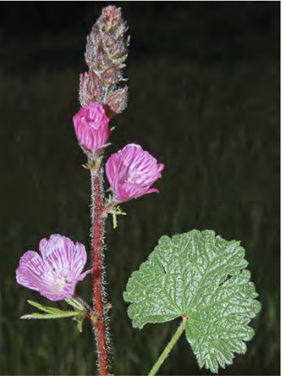
COMMON CHECKERBLOOM (Sidalcea malviflora subsp. malviflora) Native Perennial - Mallow Family - (Mar-Jul) - Coastal prairie, scrub, open forest - Plant 6-24" tall. Middle leaves not linear-lobed. Petals 0.4-1" long, pink to rose, gen white veined.