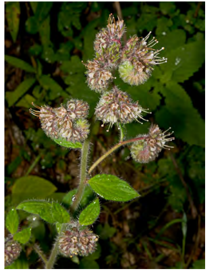
BRISTLY PHACELIA (Phacelia nemoralis subsp. nemoralis) Native Biennial-Perennial - Borage Family - (Apr-Jul) - Moist slopes, streambanks, mixed-evergreen forest - Short-lived. Upper leaves egg-shaped, lower divided. Flowers green-white, 0.16-0.2".