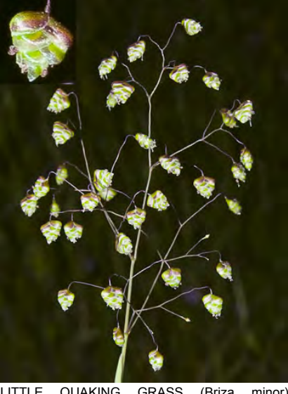
LITTLE QUAKING GRASS (Briza minor) Naturalized Annual - Grass Family - (Apr–Jul) -Shaded or moist, open sites - Stem 3-20" tall. Spikelets 0.1-0.2" long, resemble tiny rattlesnake rattles.