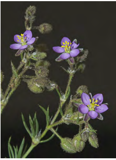
RED SAND-SPURRY (Spergularia rubra) Naturalized Annual-Perennial - Pink Family -(Spring-fall) - Forest, meadows, mud flats, disturbed - Plant 1.6-10". Leaf non-fleshy, whorls w/large white bracts. Petals pink. Stamens 6-10. Sepais < 0.16".