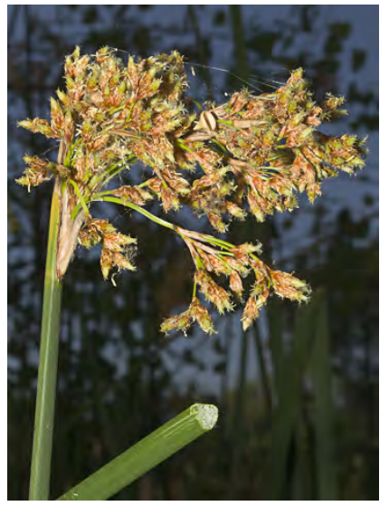
SOUTHERN BULRUSH (Schoenoplectus californicus) Native Perennial - Sedge Family - (Spring–summer) - Common. Brackish to fresh marshes, shores - Stem 3.3-13' tall, slender, bright green, bluntly 3-angled. Flower cluster somewhat open.