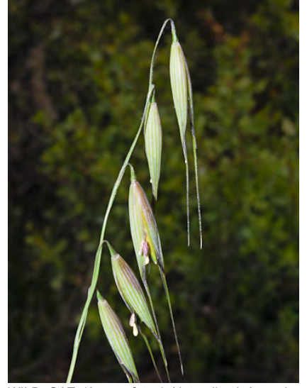
WILD OAT (Avena fatua) Naturalized Annual -Grass Family - (Apr-Jun) - Disturbed sites -Plants 1-5' tall. Spikelets 0.7-1.3" long. Low awn 1-1.6" long. Lemma tip bristles < 0.04" long. Seeds EDIBLE whole or ground for flour. INVASIVE weed.