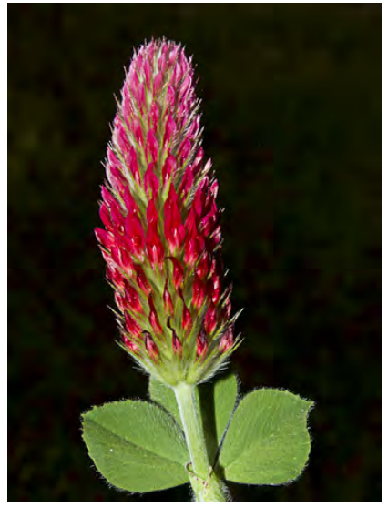
CRIMSON CLOVER (Trifolium incarnatum) Naturalized Annual - Pea Family - (May–Aug) -Uncommon. Disturbed areas - Hairy. Leaflets 0.6-0.8" long, wedge-shaped. Flower cluster 0.8-2.4" long, cylindrical. Flowers crimson or white, 0.4-0.6" long.