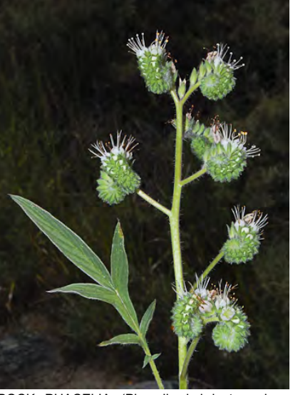
ROCK PHACELIA (Phacelia imbricata subsp. imbricata) Native Perennial - Borage Family -(Apr-Jul) - Slopes, roadsides, flats, canyons, chaparral, woodland - Plant 8-47", tufted. Leaf segments 7-15. Flowers 0.2-0.3", white. Flower bracts often sticky.