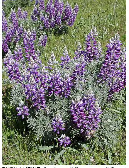
BUSH LUPINE (Lupinus albifrons var. albifrons) Native Perennial - Pea Family - (Mar–Jun) -Common. Chaparral, foothill woodland - Shrub 2-16' tall, gen distinct trunk, green to silvery. Flowers 0.35-0.6" long, purple, banner back hairy, keel top ciliate mid to tip.