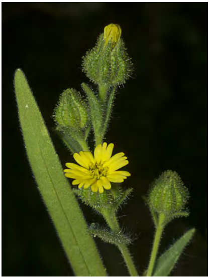
GUMWEED (Madia gracilis) Native Annual -Sunflower Family - (Apr–Aug) - Open, semi-shaded or disturbed sites, many habitats, incl serpentine - Plant 2.4-40" tall, hairy, upper half sticky. Leaf 0.4-4" long. Rays yellow, 3-10, 0.06-0.3" long. Bracts 6-10 mm tall.