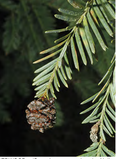
REDWOOD (Sequoia sempervirens) Native Perennial - Cypress Family - - - Redwood forest -Tree to 380' tall, evergreen. Leaves alternate: on rapidly growing stems awl-like, < 0.3" long; others flat, 0.2-1" long. Seed cone 0.5-1.4" diam, woody.