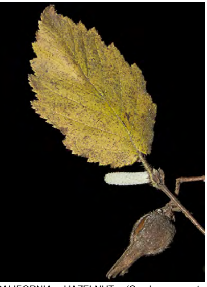
CALIFORNIA HAZELNUT (Corylus cornuta subsp. californica) Native Perennial - Birch Family - (Jan-Mar) - Common. Many habitats, esp moist, shady places - Shrub, small tree < 13' tall. Leaf velvetry-hairy. Fruits 0.8-1.2" long in papery bracts, 1-2/group.