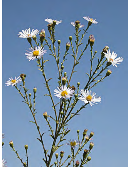
COMMON CALIFORNIA-ASTER (Corethrogyne filaginifolia) Native Perennial - Sunflower Family - (Jul-Nov) - Coastal scrub, chaparral, grassland, foothill woodland, forest - Heads 3-20+, calyx length 2x width. Rays white to pink-purple.