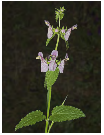
COMMON RIGID HEDGE-NETTLE (Stachys rigida var. quercetorum) Native Perennial - Mint Family - (Mar-Oct) - Moist to ± dry places - Plant gen < 39", hairy, sticky. Leaf 2-3.5" long, egg-shaped w/heart-shaped base. Flowers 6-10/group, pink, 0.24-0.4" long.