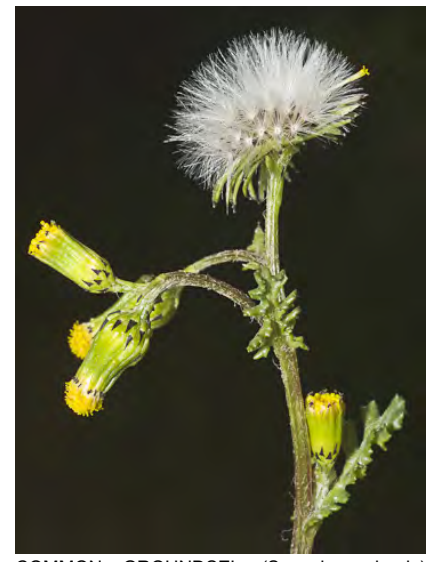
COMMON GROUNDSEL (Senecio vulgaris) Naturalized Annual - Sunflower Family -(Feb-Jul) - Common. Disturbed areas - Plant 4-24" tall, not hairy, w/1-10+ stems. Flower head bracts with black-tips. Milky sap.