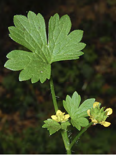
PRICKLESEED BUTTERCUP (Ranunculus muricatus) Naturalized Annual - Buttercup Family - (Apr–Jun) - Stream-banks, drainages, low meadows - Plant 6-20". Leaves gen 3-lobed. Petals yellow, 5, 0.16-0.3" long. Fruits 0.2" long with curved bristles.