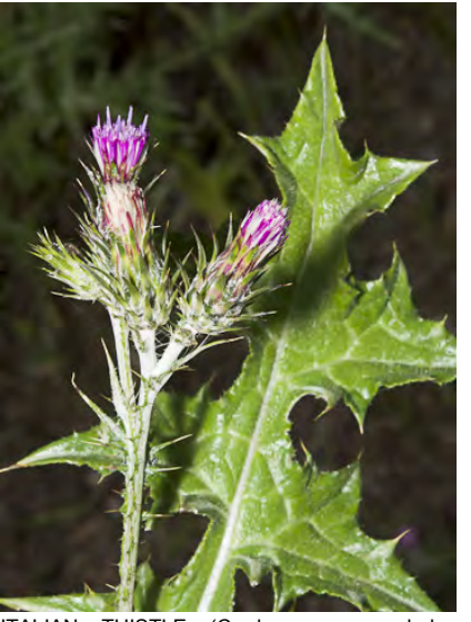
ITALIAN THISTLE (Carduus pycnocephalus subsp. pycnocephalus) Naturalized Annual -Sunflower Family - (Mar–Jul) - Roadsides, pastures, disturbed areas - Stems 8-79", narrow spiny-wings. Lower leaves 4-10 lobed, heads 2-5, flower bracts woolly. NOXIOUS.