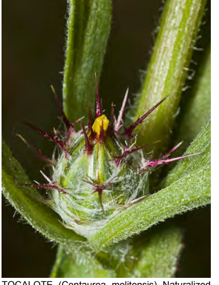
TOCALOTE (Centaurea melitensis) Naturalized Annual - Sunflower Family - (Apr–Jul) - Disturbed fields, open woodland - Plant 4-39", gray-hairy, resinous. Leaves 0.8-6" long. Flowers yellow, 0.4-0.8" long, bracts tipped w/purple spines. NOXIOUS weed.