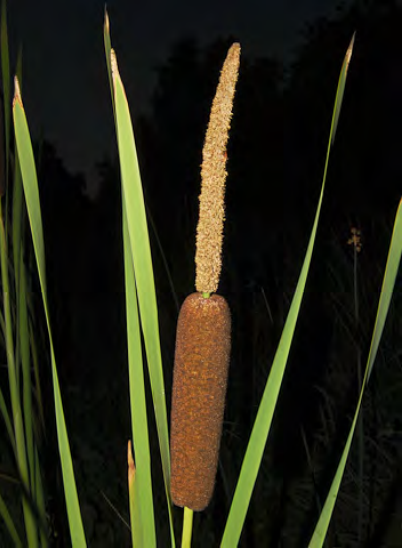
NARROW-LEAVED CATTAIL (Typha angustifolia) Native Perennial - Cattail Family - (May–Aug) - Nutrient-rich freshwater to brackish marshes, wet disturbed places - Plant 4.9-9.8' tall. Leaves gen < 0.4" wide. Flower cluster gap > 0.4".