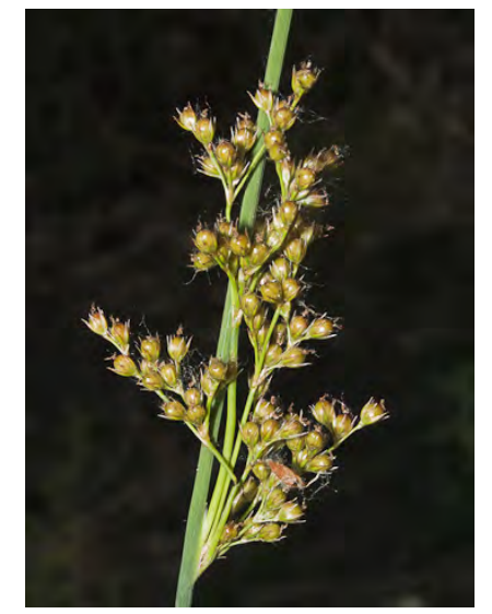
SPREADING RUSH (Juncus patens) Native Perennial - Rush Family - (Jun–Oct) - Marshy places, creeks, seeps - Plant 12-41" tall, densely tufted. Stems blue-gray-green & distinctly grooved when fresh. Stamens 6.