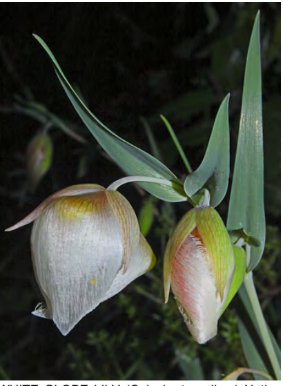
WHITE GLOBE LILY (Calochortus albus) Native Perennial - Lily Family - (Apr–Jun) - Common. Shady to open woodland, scrub - Stem 2-8 dm. Leaves grasslike. Flowers 2-many, hanging, closed at tip. Sepals 10-15 mm. Petals white to pink, 20-25 mm long.