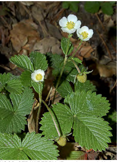
WOOD STRAWBERRY (Fragaria vesca) Native Perennial - Rose Family - (Jan–Jul) - Gen partial shade in forest - Stem gen 1.2-6" long. Leaflets 3, thin. Central leaflet gen w/12-21 teeth. Flower white, gen 0.6" wide, often above leaves. Fruit a strawberry.