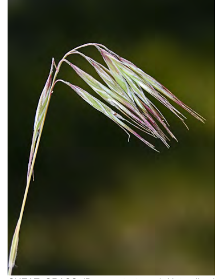
CHEAT GRASS (Bromus tectorum) Naturalized Annual - Grass Family - (May-Aug) - Open, disturbed areas - Plant 2-16" tall. Flower cluster 2-9" long, open, 1-14 spikelets per branch. Spikelet 0.4-0.8". Lemma 0.35-0.5", awn 0.3-0.7". INVASIVE weed.