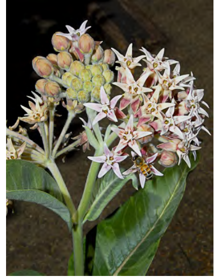
SHOWY MILKWEED (Asclepias speciosa) Native Perennial - Dogbane Family - (May–Sep) - Many habitats incl fields, roadsides - Plants green, hairy. Leaves opposite, ovate. Petals rose-purple, > 0.3" long; curving tooth-like hoods. Monarch butterfly food plant.