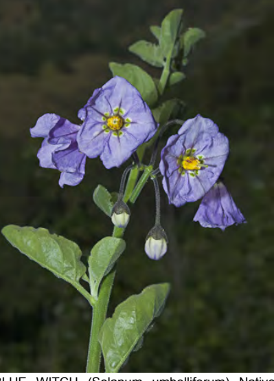
BLUE WITCH (Solanum umbelliferum) Native Perennial - Nightshade Family - (All year) -Shrubland, mixed-evergreen forest, woodland -Plant gen < 39", upper stem hairs branched, dense. Flowers 0.6-1" wide, purple, with green spots at the base.