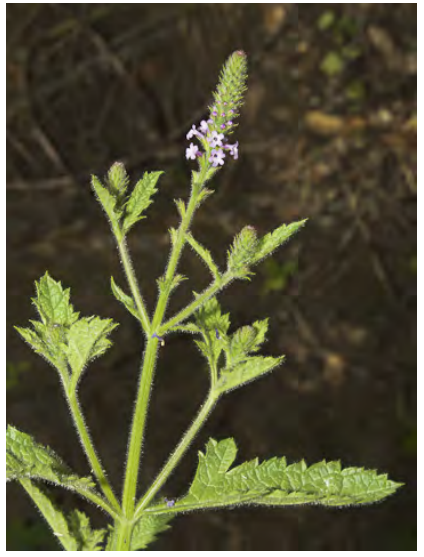
ROBUST VERVAIN (Verbena lasiostachys var. scabrida) Native Perennial - Vervain Family -(May–Sep) - Open, dry to wet places - Plant 14-32" tall. Leaves green, narrow, 3-lobed, stiff-haired above. Flowers blue to purple on long stalk.