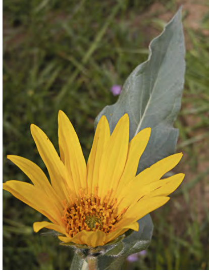
NARROW-LEAVED MULE'S EARS (Wyethia angustifolia) Native Perennial - Sunflower Family - (Apr–Aug) - Grassland - Plant 4-35" tall, rough-hairy. Leaves narrow, veins all similar, base blades 4-20" long. Ray flowers 0.6-1.8" long.