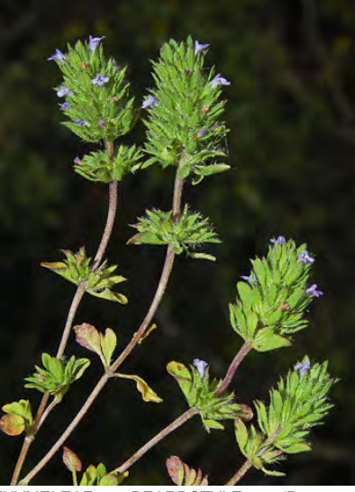
THYMELEAF BEARDSTYLE (Pogogyne serpylloides) Native Annual - Mint Family - (Mar–Jun) - Grassy, brushy areas - Plant inconspicuous. Stem 1-8" long, low-growing. Flowers 0.1-0.2" long, lavender, in dense clusters.