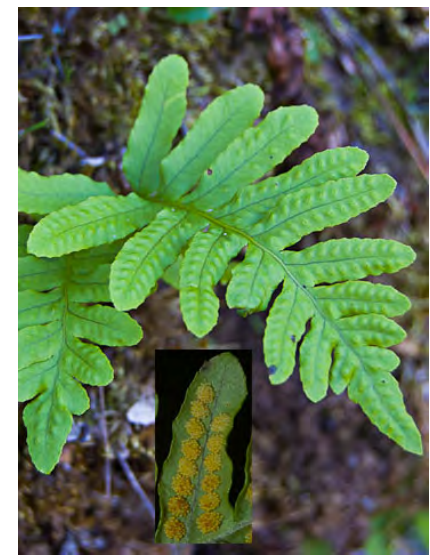
POLYPODY FERN (Polypodium calirhiza) Native Perennial - Polypody Family - - On plants, rocky cliffs or outcrops, roadcuts, often granitic or volcanic, rarely dunes - Leaf blades 4-8" long, often widest above base, deeply lobed.