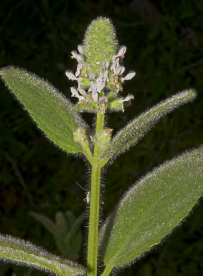
SHORT-SPIKED HEDGE-NETTLE (Stachys pycnantha) Native Perennial - Mint Family - (Jun-Oct) - Streambanks, springs, pine/oak forest - Plant 12-39", densely glandular, aromatic. Flower cluster < 2", no spaces. Petals white to pink, ~0.3" long.