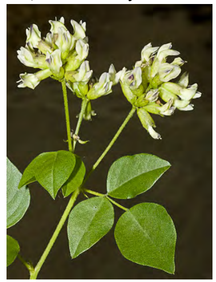
CALIFORNIA TEA (Rupertia physodes) Native Perennial - Pea Family - (May–Sep) - Woodland -Stem ~1.6'. Leaflets 3, triangular to lance-shaped, 1.4-2.8" long, sticky. Flower bracts not hairy, lobes =. Flowers white or yellow, banner 0.4-0.55" long.