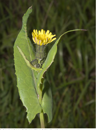
COMMON SOW THISTLE (Sonchus oleraceus) Naturalized Annual - Sunflower Family - (All year) - Abundant. Disturbed places - Plant 4-55" tall. Leaf teeth soft to touch. Basal lobes of upper leaves sharply pointed, straight to curving upward.