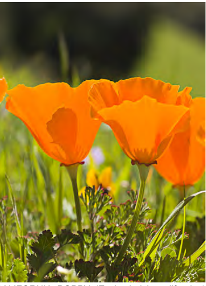
CALIFORNIA POPPY (Eschscholzia californica) Native Perennial - Poppy Family - (Feb–Sep) -Grassy, open areas - Plant 2-24" tall. Flower w/spreading rim <= 0.2". Petals 0.8-2.4" long, early spring = large and orange, fall = smaller and yellow.