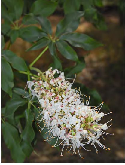
CALIFORNIA BUCKEYE (Aesculus californica) Native Perennial - Soapberry Family - (May–Jun) - Dry slopes, canyons, borders of streams - Large shrub or tree 13-39' tall. 5-7 leaflets. Flowers white to pale rose. Large seeds toxic but edible after leaching out saponins.