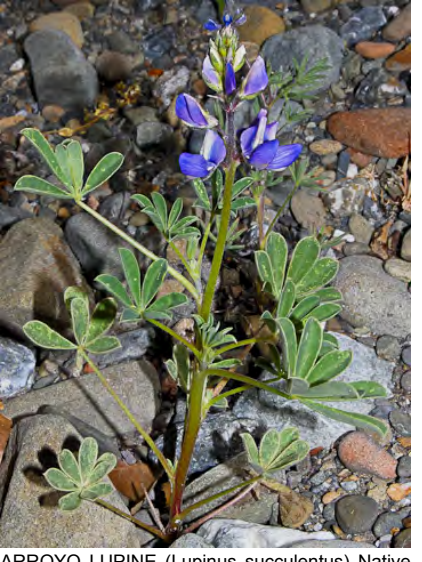
ARROYO LUPINE (Lupinus succulentus) Native Annual - Pea Family - (Feb–May) - Abundant. Open or disturbed areas, often seeded on roadbanks - Plant 8-40" tall, fleshy, sparsely hairy. Flowers 0.5-0.7" long, whorled, gen blue-purple, petal claws short-hairy.