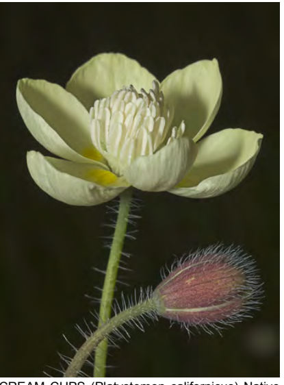
CREAM CUPS (Platystemon californicus) Native Annual - Poppy Family - (Mar–May) - Open grassland, sandy soil, burns - Plant 1.2-12" tall, shaggy-hairy. Leaves 0.4-3.5" long, narrow. Flowers solitary. Stamens > 12. Petals 6, gen cream with yellow base.