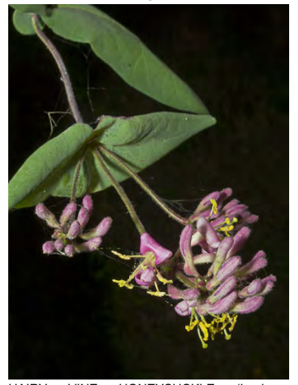
HAIRY VINE HONEYSUCKLE (Lonicera hispidula) Native Perennial - Honeysuckle Family - (May–Jun) - Canyons, streamsides, woodland -Shrub sprawling-climbing, 6-10' long, short-hairy. Flower cluster densely sticky. Flowers pink, 0.5-0.6" long, sticky-hairy.