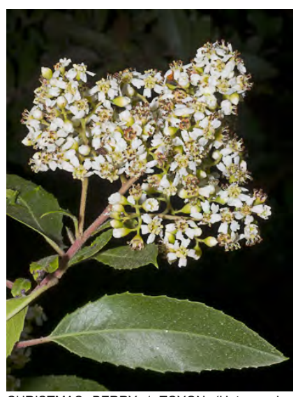
CHRISTMAS BERRY / TOYON (Heteromeles arbutifolia) Native Perennial - Rose Family -((May)Jun-Aug) - Chaparral, oak woodland, mixed-evergreen forest - Shrub-tree < 33' tall, evergreen. Leaf 2-4" long. Petals white, < 0.16" long. Fruit bright red.