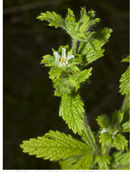
UNLOBED CALIFORNIA HORKELIA (Horkelia californica var. frondosa) Native Perennial - Rose Family - (May–Oct) - Coastal scrub, canyons, poison-oak thickets - Plant 4-48". Leaflets 0.6-2.4" long, 3-5 per side, cut < 1/4 to base.