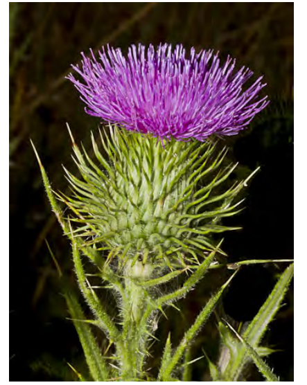
BULL THISTLE (Cirsium vulgare) Naturalized Biennial - Sunflower Family - (May–Oct) -Common. Disturbed areas - Plant 12-79" tall. Top of leaves bristly; leaf base forming decurrent wings on stem. Flowers purple, gen 1-2" wide. NOXIOUS weed.