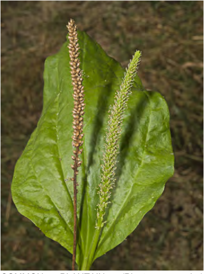
COMMON PLANTAIN (Plantago major) Naturalized Annual-Perennial - Plantain Family -(Apr-Sep) - Disturbed areas - Leaves basal, blades 5-18 cm long, broadly oval, not hairy. Flowers + stem 2-24" tall, flower cluster gen 1.2-8" long.