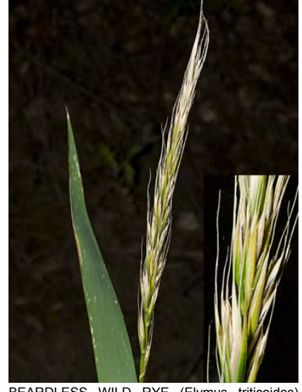
BEARDLESS WILD RYE (Elymus triticoides) Native Perennial - Grass Family - (Jun–Jul) - Dry to moist, often saline, meadows - Plant 18-50" tall, from rhizomes. Flower cluster 2-8" long. Spikelets generally 2/node. Lemmas 3-7, 0.2-0.5" long, awn to 0.12" long.