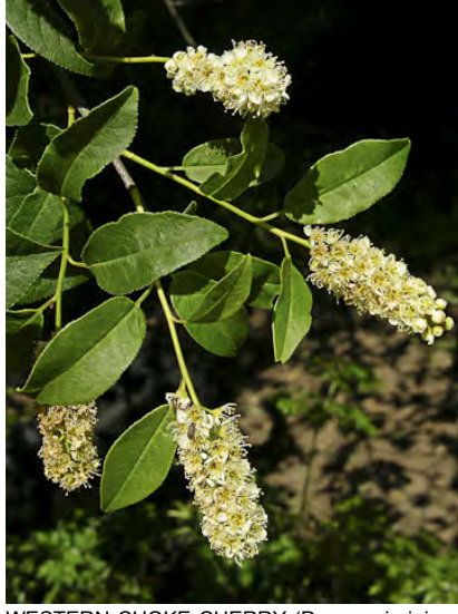
WESTERN CHOKE CHERRY (Prunus virginiana var. demissa) Native Perennial - Rose Family -(May-Jun) - Rocky slopes, canyons, scrubland, oak/pine woodland - Shrub/tree < 20'. Leaf blade 1.2-4" long. Flowers 18+, petals white, 0.16-0.3" long.