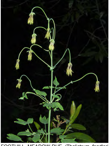
FOOTHILL MEADOW-RUE (Thalictrum fendleri var. polycarpum) Native Perennial - Buttercup Family - (Mar–Jun) - Moist, open to shaded places, woodland, forest - Plant 2-6'+ tall, male or female. Leaf 1-4x divided, 3-18" long, segments 0.3-0.8" long. No petals.