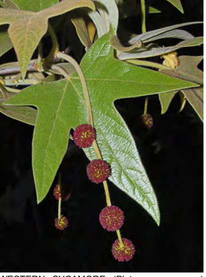
WESTERN SYCAMORE (Platanus racemosa) Native Perennial - Sycamore Family - (Feb–Apr) -Common. Streamsides, canyons, arroyos - Tree 33-115' tall. Bark peeling pale. Leaf blades 4-10" long, palmately lobed, smooth to hairy above, short-woolly under.