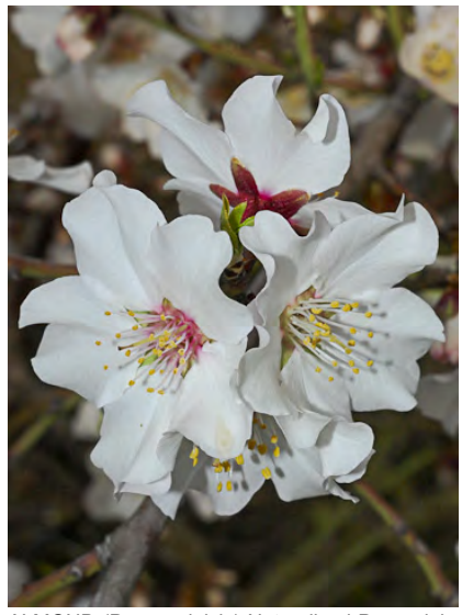
ALMOND (Prunus dulcis) Naturalized Perennial -Rose Family - (Feb–Mar) - Canyons, roadsides, grassland (as waif) - Tree 16-26' tall. Leaf blades 1-4" long. Flowers 1-3/cluster. Petals pink to nearly white, 0.5-1" long. Fruit 1-1.6" long, hairy. Cultivar.