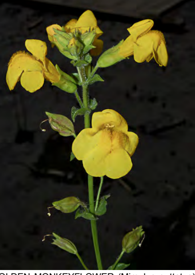
GOLDEN MONKEYFLOWER (Mimulus guttatus) Native Perennial - Lopseed Family - (Mar–Aug) -Common. Wet places, gen terrestrial, occ emergent or floating in mats - Plant 0.8-60". Flower yellow, gen > 0.8" long; mature bracts flattened sideways, inflated in fruit.