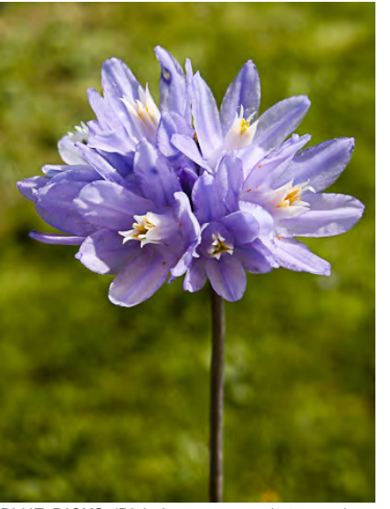
BLUE DICKS (Dichelostemma capitatum subsp. capitatum) Native Perennial - Brodiaea Family -(Mar–Jun) - Open woodland, scrub, desert, grassland - Plant 2-28" tall. Flowers blue-purple, not narrowed in the middle. Stamens 6. Early spring bloomer.