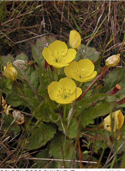
GOLDEN EGGS SUNCUP (Taraxia ovata) Native Perennial - Evening Primrose Family - (Mar–Jun) - Grassy fields, gen clay soil - Stemless. Leaf blade oval, 1.2-6" long w/long stalks. Flower stalks leafless. Petals yellow, 0.3-0.9" long. Ovary hidden.