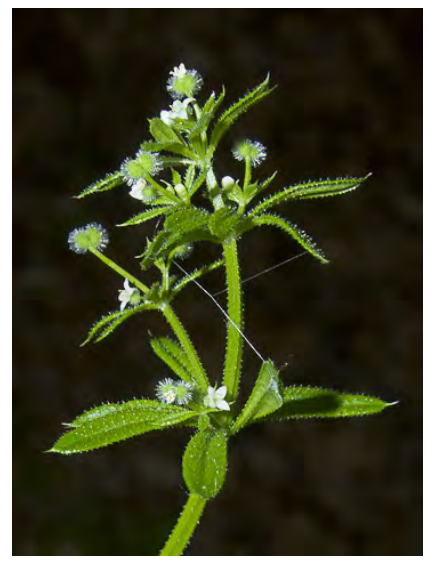
GOOSE GRASS (Galium aparine) Native Annual - Madder Family - (Apr-Jun) - Grassy, ± shady places - Stem 12-35" long, weak, brittle. Leaves 0.5-1.6" long, in whorls of 6-8. Flowers white, 4-lobed. Fruits covered w/short, hooked hairs.