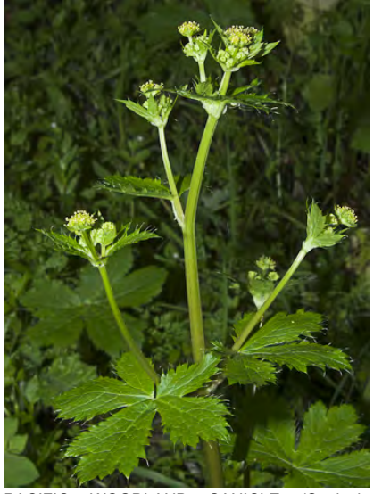
PACIFIC WOODLAND SANICLE (Sanicula crassicaulis) Native Perennial - Carrot Family - (Mar-May) - Open slopes, ravines, woodland - Plants stout, 9-47". Leaves 1-5" across with 3-5 deep, palmate lobes and serrate edges. Flowers yellow.