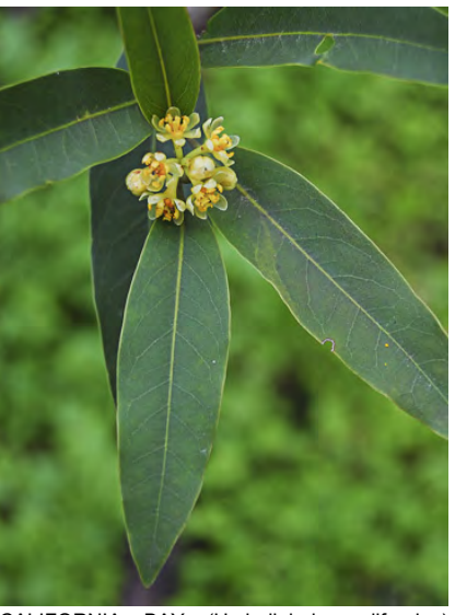
CALIFORNIA BAY (Umbellularia californica) Native Perennial - Laurel Family - (Nov–May) -Common. Canyons, valleys, chaparral - Tree < 150' tall. Leaf 1.2-4", 0.6-1.2" wide, aromatic. Cluster of 5-10 small, yellow or yellow-green flowers. Fruit 0.8-1" diam.