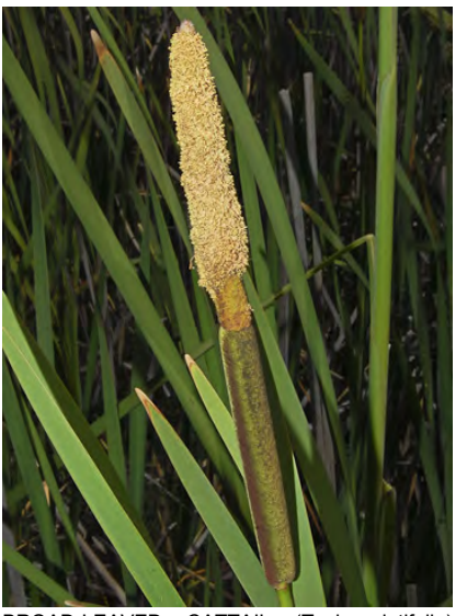
BROAD-LEAVED CATTAIL (Typha latifolia) Native Perennial - Cattail Family - (Jun–Jul) -Unpolluted to nutrient-rich freshwater (brackish) marshes - Plant 4.9-9.8' tall. Widest leaves 0.4-1.1" wide. Flower cluster with no gap between flower types.