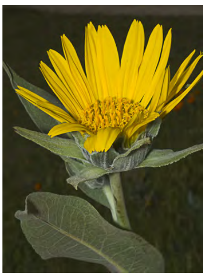
GRAY MULE'S EARS (Wyethia helenioides) Native Perennial - Sunflower Family -(Mar-May(Aug)) - Open grassland, woodland, scrub - Plant 8-28" tall, densely woolly, often becoming smooth. Some woolly hairs remain on leaf stalks and floral bracts.