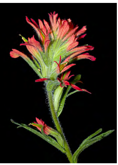
COMMON INDIAN PAINTBRUSH (Castilleja affinis subsp. affinis) Native Perennial -Broom-rape Family - (Mar–Jun) - Chaparral, coastal scrub - Plants 6-24" tall, gen bristly, non-sticky. Leaves 1-3", lance-shaped, 0-5 lobes. Flower cluster open, red to orange-red.