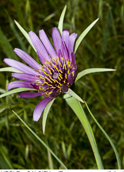
PURPLE SALSIFY (Tragopogon porrifolius) Naturalized Biennial-Perennial - Sunflower Family - (Mar–Nov) - Common. Disturbed places - Plant 16-39" tall, milky sap. Leaves 0.8-1.6" long, very narrow, waxy blue. Flowers purple.