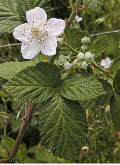
HIMALAYAN BLACKBERRY (Rubus armeniacus) Naturalized Perennial - Rose Family - (Mar–Jun) - Common. Disturbed areas, roadsides - Shrub w/thorny 5-angled stem. Leaflets 3-5, white-hairy beneath. Blackberry-type fruit. INVASIVE.