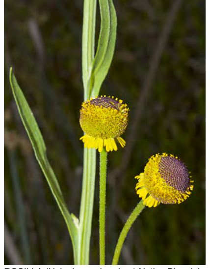
ROSILLA (Helenium puberulum) Native Biennial -Sunflower Family - (Jun-Aug) - Streambanks, seepage areas, lake margins - Plant 20-63". Flower head spherical, disk flowers ~0.1" long, yellow on sides, brown-purple on top; rays 0.15-0.4" long, point down.