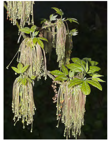
BOX ELDER (Acer negundo) Native Perennial -Soapberry Family - (Mar–Apr) - Streamsides, bottomland. - Tree < 66' tall. Leaflets in 3s. Group of 10-250 hanging flowers appear with leaves. Winged fruits. Widely planted ornamental.