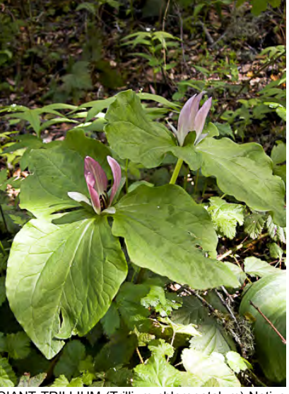
GIANT TRILLIUM (Trillium chloropetalum) Native Perennial - Bunchflower Family - (Apr–May) -Edges of redwood forest, chaparral, gen moist slopes, canyon banks in alluvial soils - Flowers dark purple to white, sessile. Petals 2.6-4" long, odor rose-like or spicy.