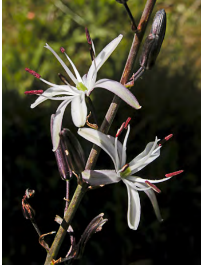
WAVYLEAF SOAP PLANT (Chlorogalum pomeridianum var. pomeridianum) Native Perennial - Century Plant Family - (May–Aug) - Common. Open grassland, chaparral, woodland - Plant 1-8' tall, flowers at night. Bulb juices lather in water.