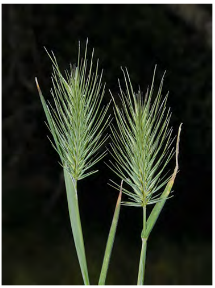
MEDITERRANEAN BARLEY (Hordeum marinum subsp. gussoneanum) Naturalized Annual -Grass Family - (Apr-Jun) - Dry to moist, disturbed sites - Stem 4-20". Leaf blades to 32" long, auricles < 0.08". Central lemma awn 0.25-0.7" long. INVASIVE weed.