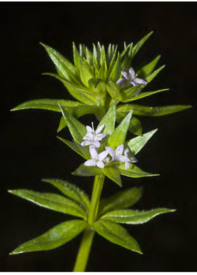
FIELD MADDER (Sherardia arvensis) Naturalized Annual - Madder Family - (Mar–Jul) -Pastures, disturbed areas, grassland, dry meadows, oak woodland - Stem 2.8-6.3" long. Leaves in whorls of 5-6, 0.2-0.5" long. Flowers pink or lavender, the 4 lobes < tube.