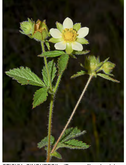
STICKY CINQUEFOIL (Drymocallis glandulosa var. wrangelliana) Native Perennial - Rose Family - (May–Jul) - Gen ± shady or moist areas - Stem 8-28". Flower 0.2-0.25" long, pale yellow to cream. Terminal leaflet distinct, unlobed.