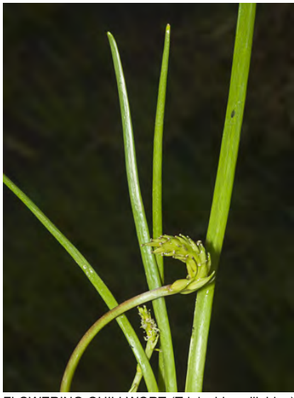
FLOWERING-QUILLWORT (Triglochin scilloides) Native Annual - Arrow-grass Family - (Mar–Oct) -Vernal pools, streams, ponds, lake margins -Emergent aquatic. Leaves 2-8", 0.04-0.2" wide, round to elliptic x-section. Flower cluster 6-20 cm long.