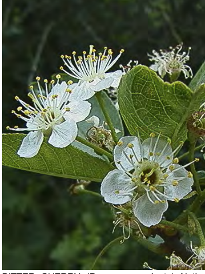
BITTER CHERRY (Prunus emarginata) Native Perennial - Rose Family - (Apr–Jun) - Rocky slopes, canyons, chaparral, mixed-evergreen, conifer forest - Shrub/tree < 50'. Leaf: stem 0.1-0.5", blade 0.6-2.4" long. Petals white, 0.12-0.3" long. Fruit red to purple.