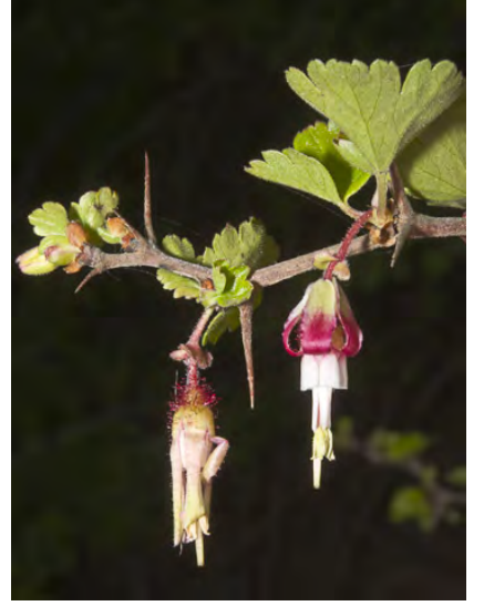
HILLSIDE GOOSEBERRY (Ribes californicum var. californicum) Native Perennial - Gooseberry Family - (Feb–Mar) - Forest openings, woodland -Shrub < 5' tall. Leaf blades 0.4-1.2" long, not sticky. Sepals greenish, petals 0.12" long, white.