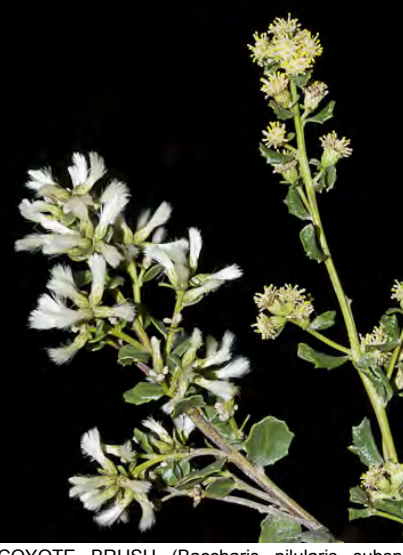
COYOTE BRUSH (Baccharis pilularis subsp. consanguinea) Native Perennial - Sunflower Family - (Jul-Dec) - Coastal bluffs, woodland, grassland, disturbed sites, occ on serpentine - Shrub < 15' tall, brittle, common. Leaves gen 0.6-1.6" long.