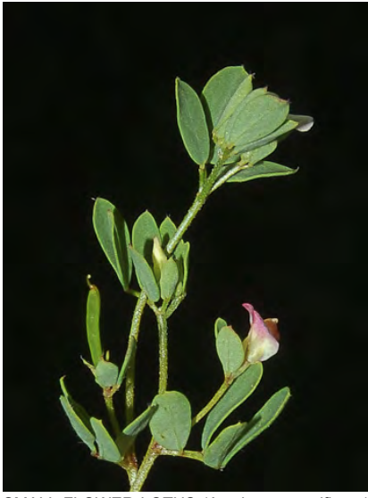
SMALL-FLOWER LOTUS (Acmispon parviflorus) Native Annual - Pea Family - (Mar–May) -Abundant. Coastal bluffs to oak/pine or fir woodland, open or disturbed areas - Flowers pinkish, solitary, 0.2" long, on stalk with bracts. Not hairy.