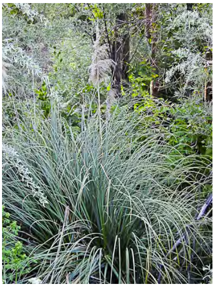
SMOOTH PAMPAS GRASS (Cortaderia selloana) Naturalized Perennial - Grass Family - (Sep-Mar) - Disturbed sites - Plant 6-13' tall. Leaf blades 0.1-0.5" wide, sheathes smooth. Cultivar, rarely escaped. INVASIVE weed.