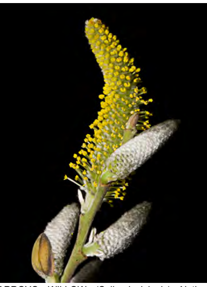
ARROYO WILLOW (Salix lasiolepis) Native Perennial - Willow Family - (Jan–Jun) - Common. Shores, marshes, meadows, etc - Shrub-tree, bark smooth. Leaf-like stipules. Leaf egg-shaped, waxy below. Fruit smooth, bract persistent, dark, stamens 2.