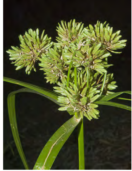
TALL NUTSEDGE (Cyperus eragrostis) Native Perennial - Sedge Family - (May–Nov) - Vernal pools, streambanks - Leaves basal. Flower cluster bracts 4-8. Spikelets 0.2-0.8" long, oblong, in heads to 1.6" wide. Seeds short-stalked.