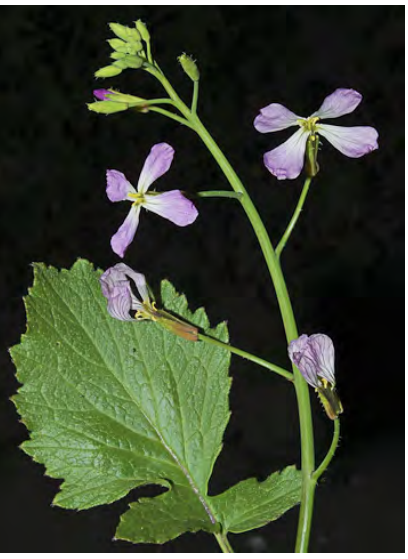
RADISH (Raphanus sativus) Naturalized Annual-Mustard Family - (May–Jul) - Disturbed areas, fields - Stem 16-51" long. Petals 0.6-1" long, white to purple. Fruit a fat cylinder w/constrictions between seeds. INVASIVE weed.