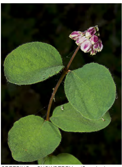
CREEPING SNOWBERRY (Symphoricarpos mollis) Native Perennial - Honeysuckle Family -(Apr-May) - Ridges, slopes, open places in woodland - Shrub 6-24" tall, sprawling. Flowers < 8/cluster, pink + often red outside, 0.16" long, bell-shaped, symetrical.