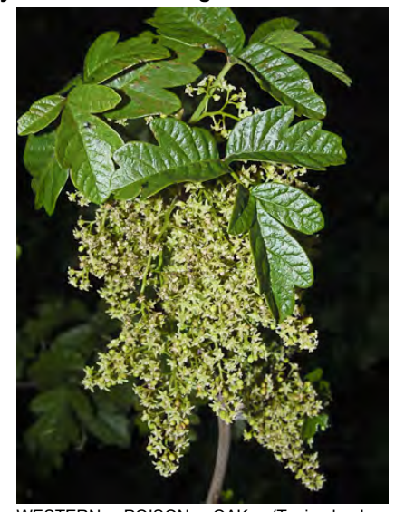
WESTERN POISON OAK (Toxicodendron diversilobum) Native Perennial - Sumac Family - (Apr-Jun) - Canyons, slopes, chaparral, coastal scrub, oak woodland - Shrub or vine. Leaflets 3, red in fall, mid leaflet stalked. Flowers green. Fruits white. TOXIC.