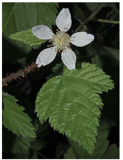
CALIFORNIA BLACKBERRY (Rubus ursinus) Native Perennial - Rose Family - (Mar–Jul) -Open, disturbed areas - Stem round, bristly/prickly. Leaves simple to 3 leaflets, underside green. Plants unisexual. Petals 0.24-0.6" long, white. Blackberry-type fruit.