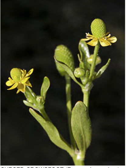
CURSED CROWSFOOT (Ranunculus sceleratus var. sceleratus) Native Annual - Buttercup Family - (Apr–Jun,Oct) - Ponds, riverbanks - Basal leaves not fully divided. Petals 5-6, yellow, 0.2-0.4" long. Fruit w/short bristles.