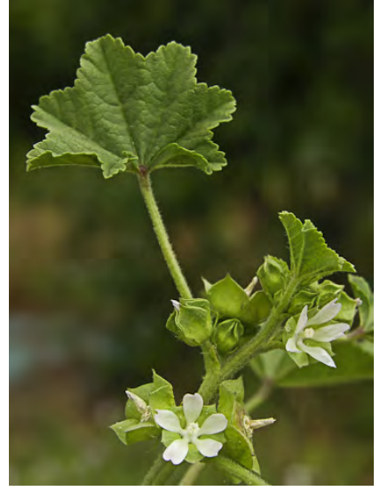
CHEESEWEED (Malva parviflora) Naturalized Annual - Mallow Family - (Mar–May) - Common. Disturbed places - Stem 8-32" long, gen erect, widely branched. Flower bractlets linear. Petals 0.1-0.2" long, pink to gen white. Fruit with flange from flower bracts.