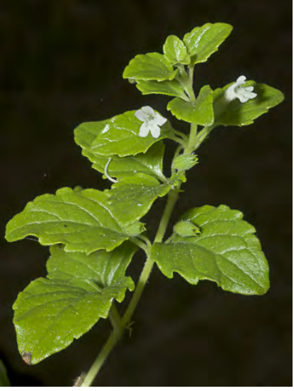
YERBA BUENA (Clinopodium douglasii) Native Perennial - Mint Family - (Apr–Sep) - Shady places, chaparral, woodland - Stem trailing, gen woody, forming mats. Leaves 0.4-1.4" long, oval. Petals white to lavender, 3-8 mm long. Aromatic.