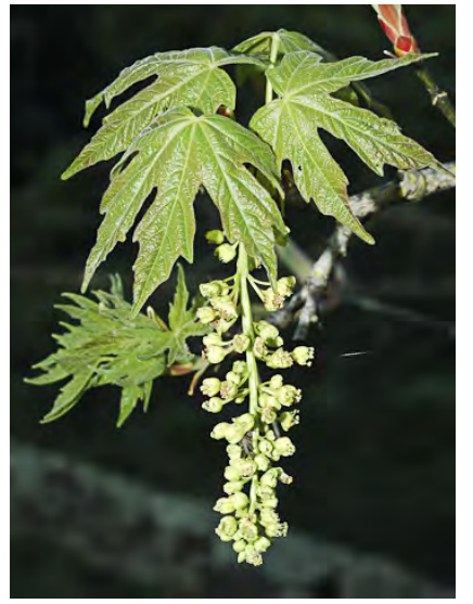
BIG-LEAF MAPLE (Acer macrophyllum) Native Perennial - Soapberry Family - (Mar–Jun) -Common. Streambanks, canyons - Tree < 100'. Leaves 5-lobed, 3-6" long, 4-10" wide. Group of 20-90 hanging flowers appear after leaves. Winged seeds.