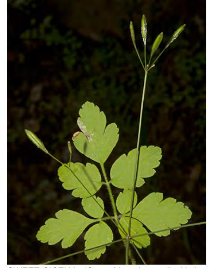
SWEET-CICELY (Osmorhiza berteroi) Native Perennial - Carrot Family - (Apr–Jul) - Conifer forest, woodland, disturbed areas - Plant 12-47". Leaflets in 3s, serrate to irreg lobed. Flower white. Fruit 0.5-1", upward pointing barbs, splitting apart below.