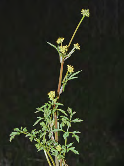
POISON SANICLE (Sanicula bipinnata) Native Perennial - Carrot Family - (Apr-May) - Open grassland or pine/oak woodland - Plants 5-24" tall. Leaves 2x pinnate. Flowers yellow, male flower stalk < fruit. Reported to be slightly TOXIC.