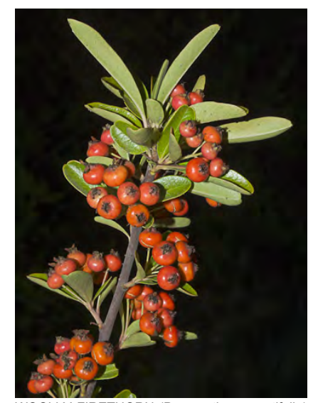
WOOLLY FIRETHORN (Pyracantha angustifolia) Naturalized Perennial - Rose Family - (Feb–Jun) - Disturbed areas, fencerows, abandoned fields, roadsides - Plant < 13', gray-hairy. Leaves narrow, entire. Calyx and below leaves often woolly. INVASIVE.