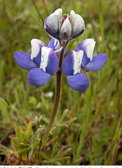
SKY LUPINE (Lupinus nanus) Native Annual -Pea Family - (Mar–Jun) - Abundant. Open or disturbed areas - Plant 4-24" tall, hairy. Flowers blue to pink to white, 0.2-0.6" long; banner as wide as long. Flower stalk gen > 0.12" long.