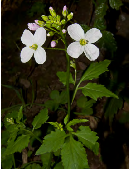
MILK MAIDS (Cardamine californica) Native Perennial - Mustard Family - (Jan–May) - Gen shaded sites, canyons, woodland. One of first spring flowers - Stem 10-24" long. Leaves lobed to compound w/sharp teeth. Petals white or pale rose, 0.3-0.5" long.