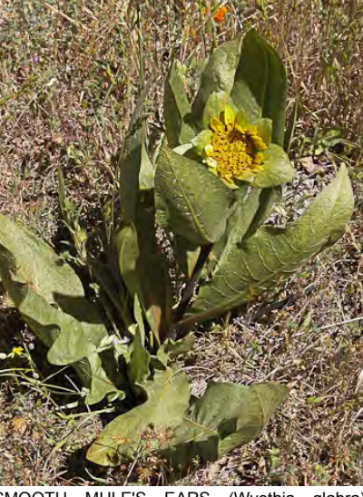
SMOOTH MULE'S EARS (Wyethia glabra) Native Perennial - Sunflower Family - (Mar–Jun) -Gen shady sites - Plant 4-16" tall, shiny green, no woolly hairs. Leaf basal blades 10-18" long, lance-shaped to oval, shiny. Ray flowers 1-2" long.