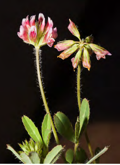
DECEIVING CLOVER (Trifolium bifidum var. decipiens) Native Annual - Pea Family - (Apr-Jun) - Open, grassy areas, forest - Leaflet tip square/notched. Flower small, yellow to pink-purple, soon reflex. Flower stalk top sparsely hairy.