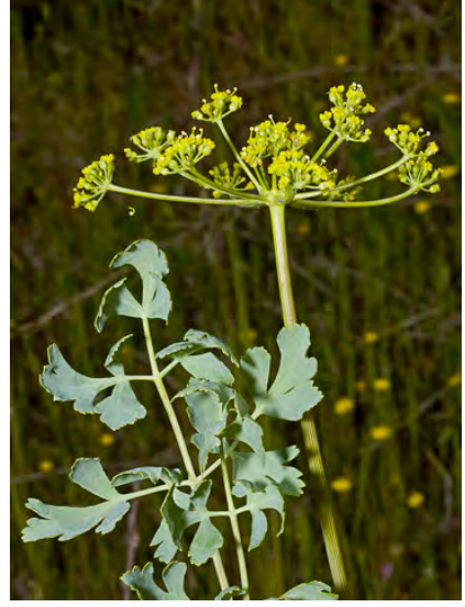
CELERY WEED (Lomatium californicum) Native Perennial - Carrot Family - (Apr–Jun) -Woodland, brushy slopes - Plant 12-48" tall, smooth, waxy. Leaf segments wedge-shaped, celery-like. Flowers yellow. Used medicinally by Native Americans.