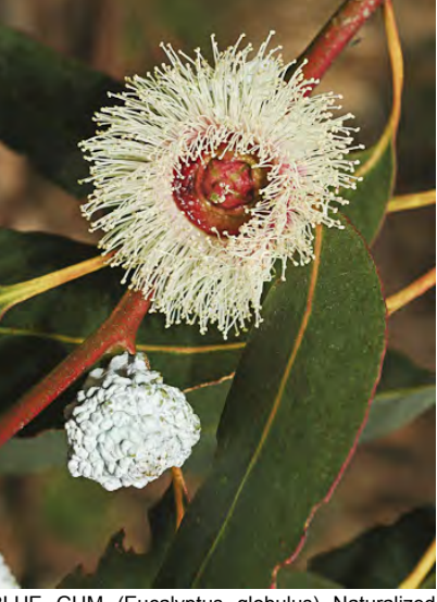
BLUE GUM (Eucalyptus globulus) Naturalized Perennial - Myrtle Family - (Oct–Jan) - Common. Disturbed areas - Tree < 200' tall. Flowers single, large, gen stemless. Leaves 4-12" long, 1-1.6" wide; used medicinally by Aboriginals. INVASIVE weed.