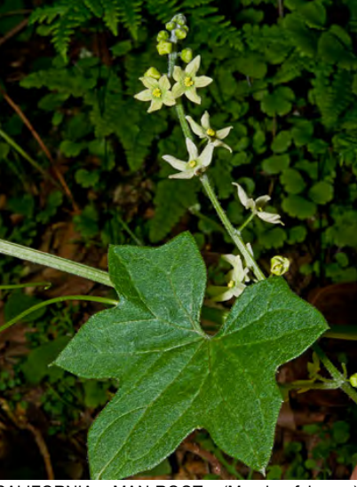
CALIFORNIA MAN-ROOT (Marah fabacea) Native Perennial - Gourd Family - (Feb-Apr) -Streamsides, washes, shrubby open areas - Vine 6-20' long. Leaves moderately lobed. Flowers cream or white, < 0.3" wide. Fruit spiny all over.