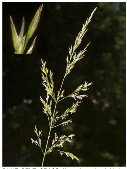
DUNE BENT GRASS (Agrostis pallens) Native Perennial - Grass Family - (Jun-Aug) - Common. Open meadows, woodland, forest, subalpine -Lower leaf blades <= 0.2" wide, flat to inrolled. Flower cluster 2-8" long, < 0.8" wide; narrow and arching when young.