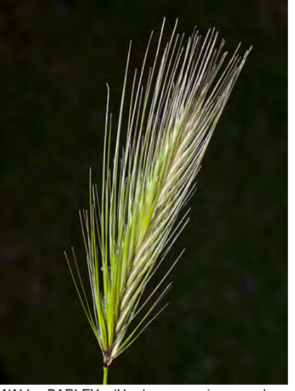
WALL BARLEY (Hordeum murinum subsp. murinum) Naturalized Annual - Grass Family -(Feb-May) - Moist, gen disturbed sites - Stem 1-2'. Leaf auricles notable. Central spikelet stalk 0-0.02". Central floret gen = lateral florets. INVASIVE weed.