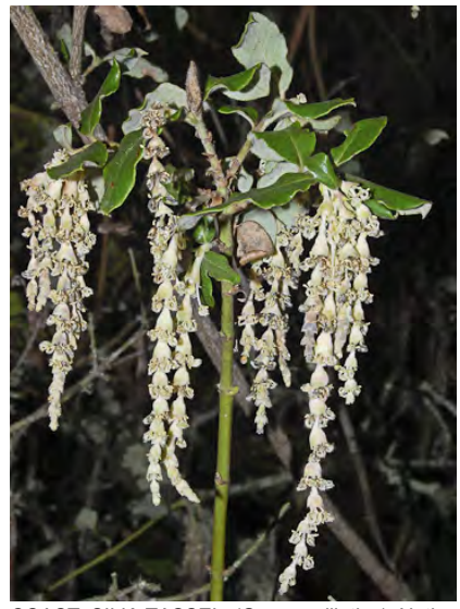
COAST SILK TASSEL (Garrya elliptica) Native Perennial - Silk Tassel Family - (Jan-Mar) -Seacliffs, sand dunes, chaparral, foothill-pine woodland - Shrub or small tree, < 26' tall. Leaves wavy-margined, underside hairs felt-like, interwoven. Fruit hairy.