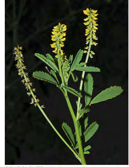
SOURCLOVER (Melilotus indicus) Naturalized Annual-Biennial - Pea Family - (Apr-Oct) - Open, disturbed areas - Stem 4-24" long. Leaflets 3, 0.4-1" long. Flowers yellow, ~0.1" long.