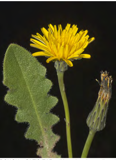
ROUGH CAT'S-EAR (Hypochaeris radicata) Naturalized Perennial - Sunflower Family -(Apr–Jul) - Disturbed areas, grassland, open woodland - Plant 4-32" tall, rough-hairy. Rays 0.4-0.6" long, well exceeding head bracts. Fruits all beaked. INVASIVE weed.