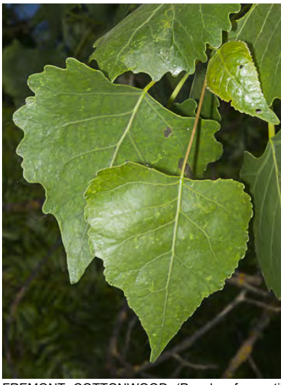
FREMONT COTTONWOOD (Populus fremontii subsp. fremontii) Native Perennial - Willow Family - (Mar–Apr) - Scattered. Alluvial bottomland, streamsides - Tree < 66' tall. Leaves heart-shaped to triangular, coarsely scalloped, blade 1.2-2.8" long.