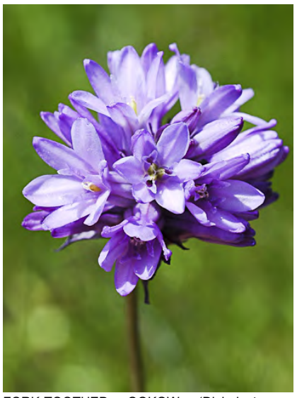
FORK-TOOTHED OOKOW (Dichelostemma congestum) Native Perennial - Brodiaea Family - (Apr–Jun) - Open wooldand, grassland - Plant 12-35" tall. Flowers blue-purple, narrowed above ovary. Stamens 3. Late spring bloomer.