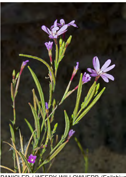
PANICLED / WEEDY WILLOWHERB (Epilobium brachycarpum) Native Annual - Evening Primrose Family - (Jun-Sep) - Common. Dry open or disturbed woodland, grassland, roadsides - Plant 8-79" tall, diffuse. Petals 2-15 mm long, white to rose-purple.