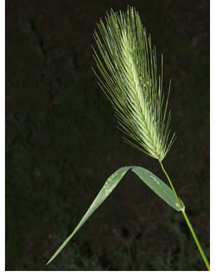
HARE BARLEY (Hordeum murinum subsp. leporinum) Naturalized Annual - Grass Family -(Feb–May) - Moist, gen disturbed sites. Common - Stem 12-43" tall. Central spikelet stalk ~0.06" long. Central floret << lateral florets. INVASIVE weed.