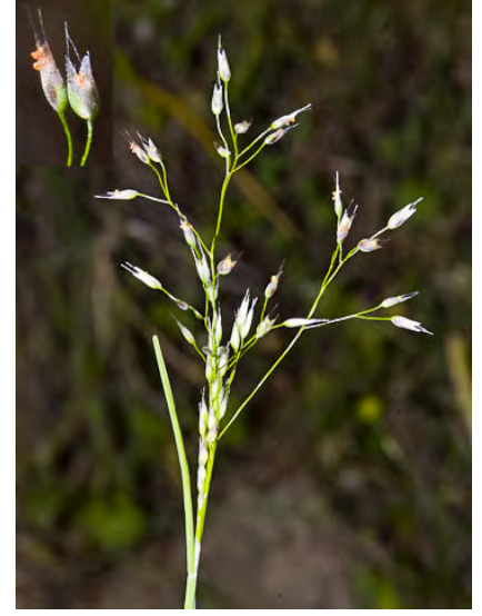
SILVER HAIR GRASS (Aira caryophyllea) Naturalized Annual - Grass Family - (Apr–Jun) -Sandy soils, open or disturbed sites - Flower cluster > 0.6" wide, diffuse with long slender branches. Spikelets about 0.1" long with 2 extended awns.