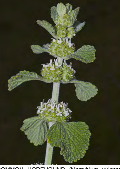
COMMON HOREHOUND (Marrubium vulgare) Naturalized Perennial - Mint Family - (Mar-Nov) -Disturbed sites, gen overgrazed pastures - Stem 4-24" long. Leaf blades 0.6-2.2" long. Flower bract w/10 hook-tipped teeth. Flowers white, ~0.2" long. INVASIVE.