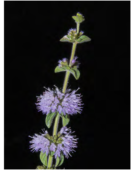
PENNYROYAL (Mentha pulegium) Naturalized Perennial - Mint Family - (Jul-Oct) - Moist places, fields - Stem 4-12" tall, short-hairy. Leaves 0.2-1" long, upper stalkless. Flowers 0.2-0.3" long, violet to lavender. Aromatic. INVASIVE weed.