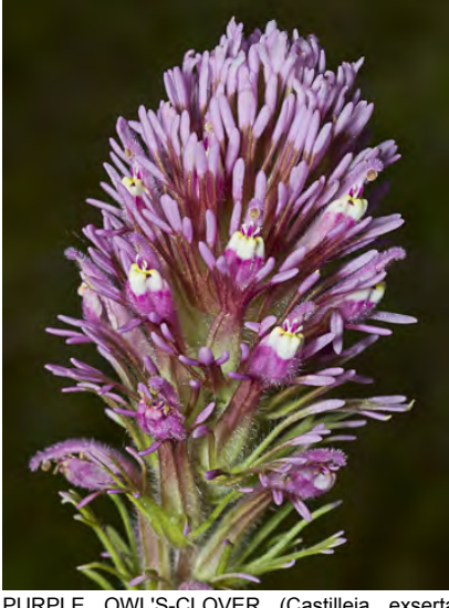
PURPLE OWL'S-CLOVER (Castilleja exserta subsp. exserta) Native Annual - Broom-rape Family - (Mar-May) - Open fields, grassland -Plant sticky, short-hairy. Flower cluster tipped white, pale yellow or rose. Flower upper lip hooked, fuzzy.