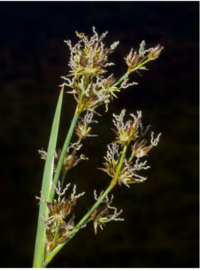
IRIS-LEAVED RUSH (Juncus xiphioides) Native Perennial - Rush Family - (Jul–Oct) - Wet places - Plant 16-32" tall. Leaf blades 0.2-0.5" wide, flat, Iris-like. Heads many, few-flowered. Anthers 6, < filaments, flowers self-pollinating.