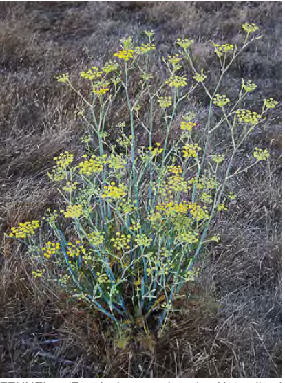
FENNEL (Foeniculum vulgare) Naturalized Perennial - Carrot Family - (May–Sep) -Roadsides, disturbed sites - Plants 3-6.5' tall, anise-scented. Stems waxy-blue, canelike. Flowers yellow. Leaf segments thread-like, edible when young. INVASIVE weed.