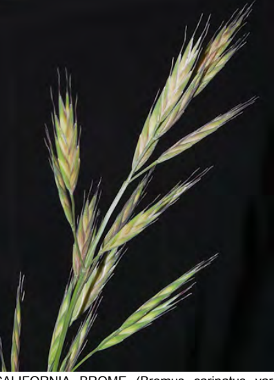
CALIFORNIA BROME (Bromus carinatus var. carinatus) Native Perennial - Grass Family -(Apr-Aug) - Coastal prairies, openings in chaparral, plains, open oak and pine woodland -Plant 20-40" tall. Flower cluster 6-16" long. Spikelet 0.8-1.6" long. Lemma 0.5-0.8" long, hairy, awn 0.3-0.6" long.