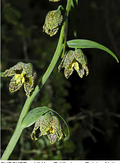
CHECKER LILY (Fritillaria affinis) Native Perennial - Lily Family - (Mar–Jun) - Common. Oak or pine scrub, grassland - Stem 4-47" tall. Leaves 1.6-6.3" long, whorled below. Petals mottled brown-purple and yellow-green, 0.4-1.6" long.