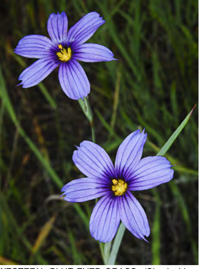
WESTERN BLUE-EYED-GRASS (Sisyrinchium bellum) Native Perennial - Iris Family - (Mar-May) - Common. Open, gen moist, grassy areas, woodland - Stem < 25" tall. Leaves iris-like. Petals 6, blue-purple with dark veins, 0.4-0.7" long.