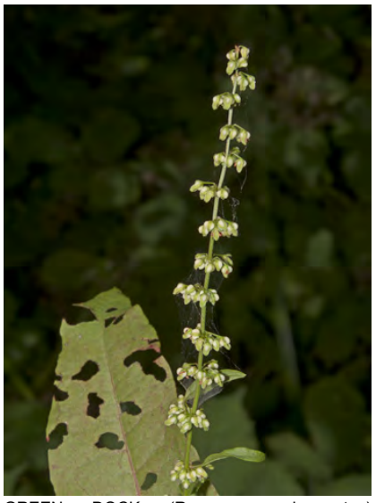
GREEN DOCK (Rumex conglomeratus) Naturalized Perennial - Buckwheat Family -(May–Aug) - Common. Moist places - Stem 12-32" tall, unbranched below. Flower cluster open. Fruit valves ~0.1" long, scarcely winged around the 3 tubercles, smooth edged.