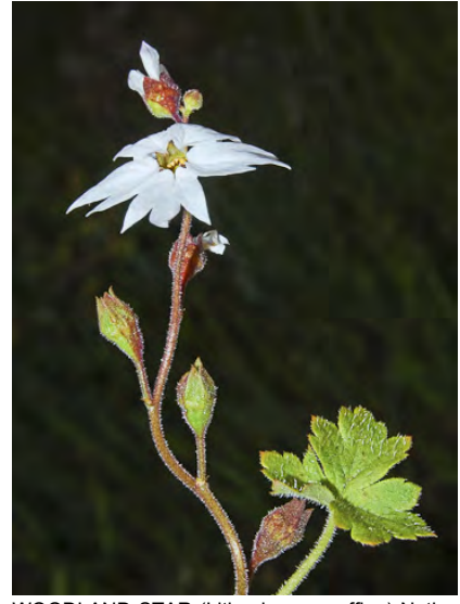
WOODLAND STAR (Lithophragma affine) Native Perennial - Saxifrage Family - (Mar-Apr) - Open, grassy slopes - Plant 4-24" tall. Leaves w/3-5 sharp-toothed shallow lobes, stem leaves alternate. Petals 0.2-0.5" long, white. Hypanthium funnel-shaped.