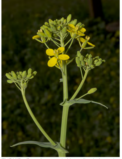
TURNIP (Brassica rapa) Naturalized Annual -Mustard Family - (Jan-May) - Disturbed areas -Stem 8-40" tall. Leaves clasping, upper smooth-edged & waxy. Petals yellow, 0.2-0.4" long, stalk 0.3-1"; fruit beak > 0.4". INVASIVE weed.