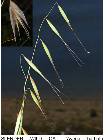
SLENDER WILD OAT (Avena barbata) Naturalized Annual - Grass Family - (Mar–Jun) -Disturbed sites - Plants gen 24-32". Spikelets 0.8-1.2" long. Awns 0.8-1.8" long. Lemma tip bristles >= 0.1" long. Seeds EDIBLE whole or ground for flour. INVASIVE weed.