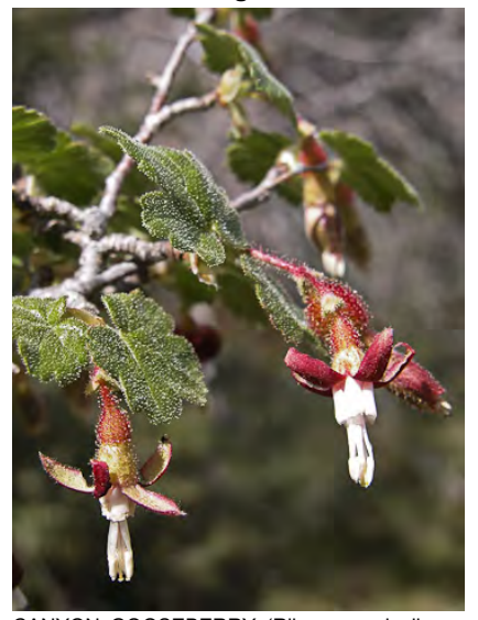
CANYON GOOSEBERRY (Ribes menziesii var. menziesii) Native Perennial - Gooseberry Family - (Feb-Apr) - Common. Forest openings, chaparral - Shrub < 10', prickly. Leaves sticky below. Styles glabrous, anthers exserted, sepals purplish.