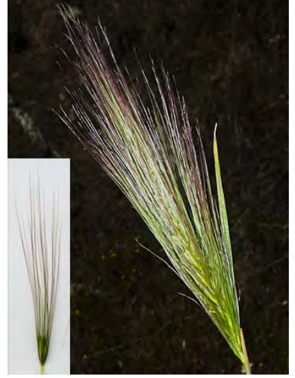
BIG SQUIRRELTAIL (Elymus multisetus) Native Perennial - Grass Family - (May–Jul) - Open, sandy to rocky areas - Tufted. Stem 6-24" tall. Leaf 0.06-0.2" wide. Spikelet 0.4-0.6" long. Glume divisions needle-shaped, lemma awn 1-4" long.