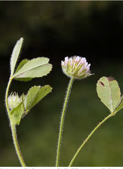
SMALL-HEAD CLOVER (Trifolium microcephalum) Native Annual - Pea Family - (Apr-Aug) - Streambanks, moist, disturbed areas, roadsides, serpentine, conifer forest - Hairy. Head bract cup-like. Flowers pink to lavender, calyx lobes smooth-edged, > flowers.