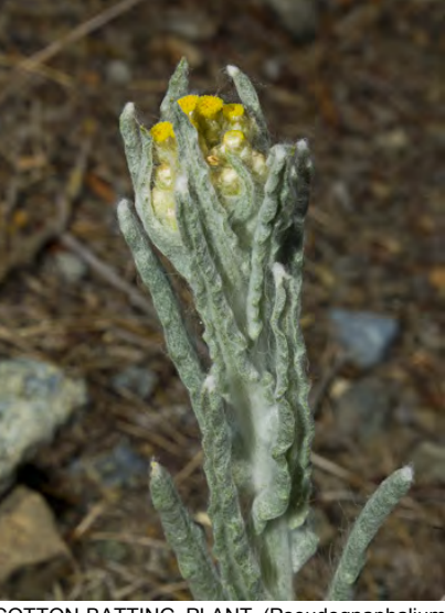
COTTON-BATTING PLANT (Pseudognaphalium stramineum) Native Annual - Sunflower Family - (Mar–Aug) - Many habitats, dunes, chaparral slopes, roadsides - Heads 0.16-0.2" long, female flowers > 0.08" long, pappus bristles free.