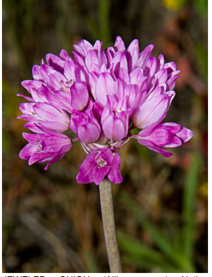
JEWELED ONION (Allium serra) Native Perennial - Onion or Garlic Family - (Apr–May) -Common. Grassy slopes - Flowers pink to rose, crowded, 10-40. "Petals" about 0.2" long, ± erect, ± lance-shaped, papery and folded over fruit when in fruit.