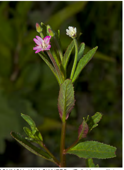
COMMON WILLOWHERB (Epilobium ciliatum subsp. ciliatum) Native Perennial - Evening Primrose Family - (Jun-Oct) - Common. Disturbed places, moist meadows, streambanks, roadsides - Plant 20-48" tall, smooth or short-hairy. Petals 2-6 mm, white to pink.