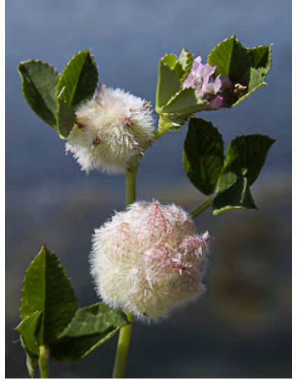
STRAWBERRY CLOVER (Trifolium fragiferum) Naturalized Perennial - Pea Family - (Late spring) - Roadsides, gen in saline soil - Head bracts 0.08" long, green. Flowers pink, 0.2-0.24" long, quickly hidden by hairy inflated flower bracts.