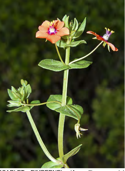
SCARLET PIMPERNEL (Anagallis arvensis) Naturalized Annual - Myrsine Family - (Mar-May) - Common. Disturbed places, ocean beaches -Plants 2-16" tall. Flowers 0.2-0.3" long, salmon or occasionally blue. Leaves TOXIC, can cause dermittis.