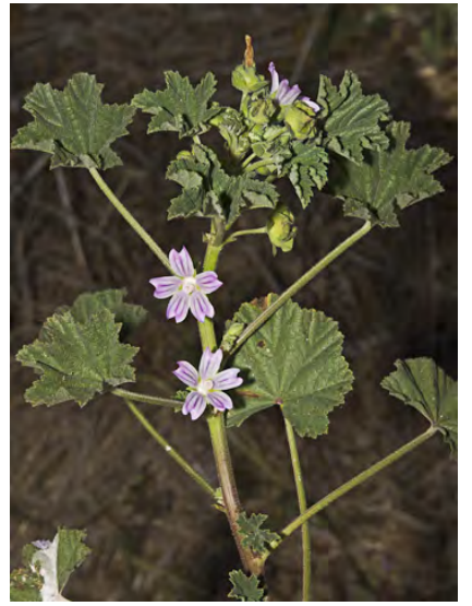
BULL MALLOW (Malva nicaeensis) Naturalized Annual - Mallow Family - (Mar–Jun) - Disturbed places - Stem 0.7-2'. Leaf blade 1.2-4.7" wide, 5-7 shallow lobes. Bractlets egg-shaped,0.16-0.2" long. Petals pink to blue-violet, 0.2-0.5" long.