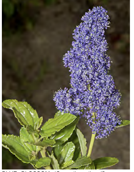
BLUE BLOSSOM (Ceanothus thyrsiflorus var. thyrsiflorus) Native Perennial - Buckthorn Family - (Mar-Jun) - Bluffs, slopes, canyons, chaparral, coastal scrub, closed-cone-pine forest - Leaves alternate, 3 main veins. Twigs angled, ridged lengthwise.