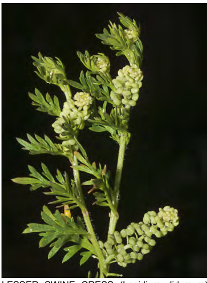
LESSER SWINE CRESS (Lepidium didymum) Naturalized Annual - Mustard Family - (Mar–Jul) -Common. Disturbed areas, fields, pastures -Stem 4-18" tall. Petals white, ~0.02" long. Fruit wrinkled, style < notch.