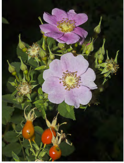
CALIFORNIA ROSE (Rosa californica) Native Perennial - Rose Family - (Feb-Nov) - Gen ± moist areas in sun, esp streambanks - Shrub 2.6-8.2' tall withick curved spines, forming thickets. Petals pink, 0.6-1" long; sepals unlobed.