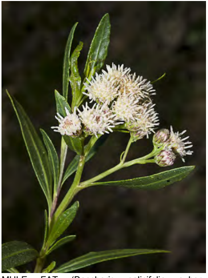
MULE FAT (Baccharis salicifolia subsp. salicifolia) Native Perennial - Sunflower Family - (All year) - Riparian woodland, canyon bottoms, disturbed sites, often forming thickets - Shrub < 13' tall, often sticky. Leaves to 6" long, with 1-3 main veins.