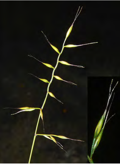
HAIRY FESCUE (Festuca microstachys) Native Annual - Grass Family - (Apr–Jun) - Disturbed, open, gen sandy soils - Stem 6-29". Spikelet 0.2-0.4" long, awn 0.1-0.5" long. Glumes & lemma smooth or hairy.