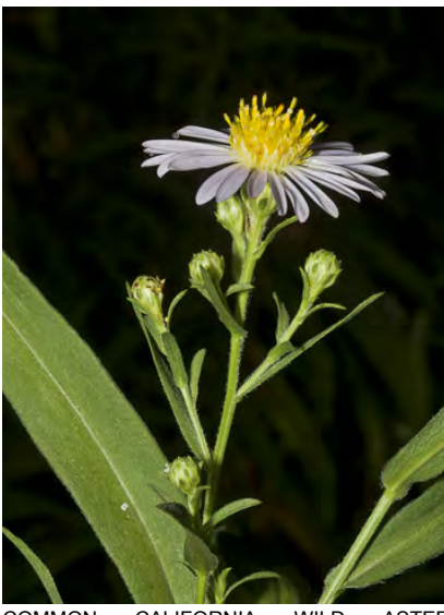
COMMON CALIFORNIA WILD ASTER (Symphyotrichum chilense) Native Perennial -Sunflower Family - (Jun-Oct) - Grassland, salt marshes, disturbed places - Plant 16-39", partly hairy. Leaf 1.6-6", 0.2-1.2" wide. Rays violet, 0.3-0.5" long.