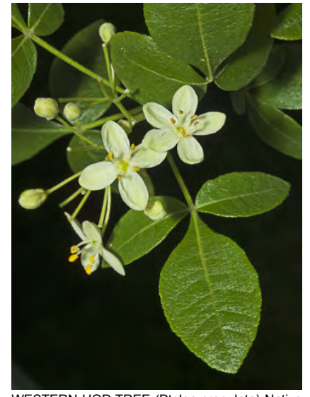
WESTERN HOP TREE (Ptelea crenulata) Native Perennial - Rue Family - (Apr–May) - Scrub, woodland - Shrub/tree < 16' tall. Leaflets 3, 0.8-2.8" long, citrus odor when crushed. Petals green-white, 0.16-0.2" long, fragrant. Fruits 1-2 cm long.