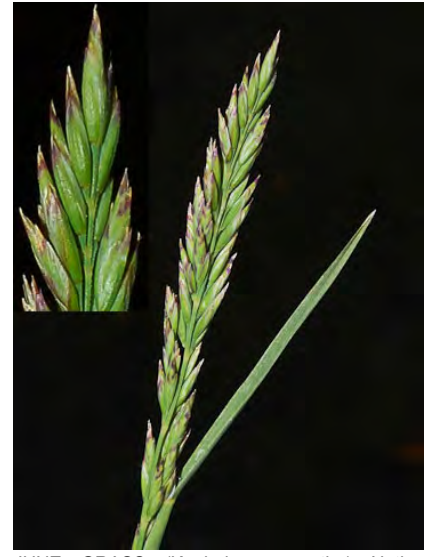
JUNE GRASS (Koeleria macrantha) Native Perennial - Grass Family - (May–Jul) - Dry, open sites, clay to rocky soils, shrubland, woodland, conifer forest - Stem 8-32" long. Flower cluster condensed, shiny, branches short-hairy. Spikelet ~0.2" long, no awns.