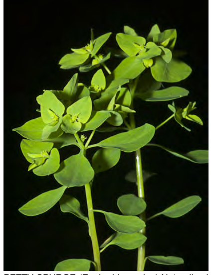
PETTY SPURGE (Euphorbia peplus) Naturalized Annual - Spurge Family - (Feb–Aug) - Common. Disturbed areas - Stem 4-18" cm tall, smooth. Leaves 0.4-1.4" long, entire. Gland crescent-shaped. Seeds dotted. Fruit 2-keeled on angles.