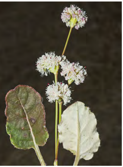
EAR-SHAPED WILD BUCKWHEAT (Eriogonum nudum var. auriculatum) Native Perennial - Buckwheat Family - (May-Oct) - Common. Sand or gravel - Plant 5-15 dm. Leaves on stem, curled. Inflor smooth. Flowers white to pink, smooth.