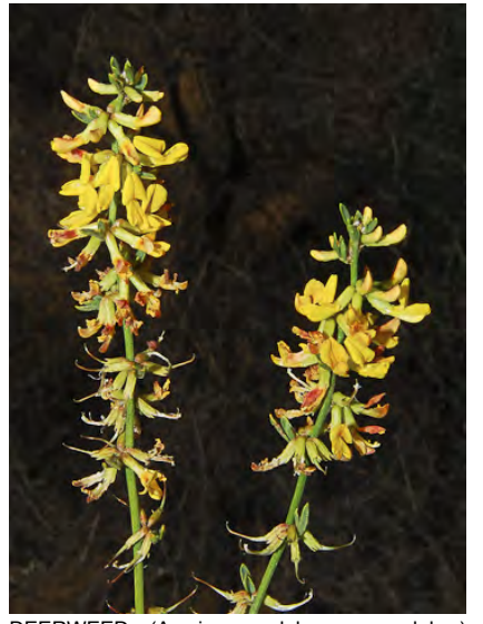
DEERWEED (Acmispon glaber var. glaber) Native Perennial - Pea Family - (Mar–Aug) -Chaparral, roadsides, coastal sands; common -Often shrubby, leaflets 3-6, many clusters of 3-7 stemless flowers, yellow fading to orange-red, 0.3-0.5" long.