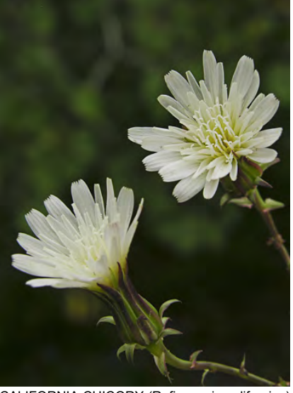
CALIFORNIA CHICORY (Rafinesquia californica) Native Annual - Sunflower Family - (Apr–Jul) -Open sites in scrub, woodland; often common after fire - Stem 2-15+ dm. Flower heads 0.8-1.2" wide, solitary. Rays white or cream, extend 0.2-0.3" beyond bracts.