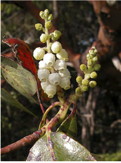
PACIFIC MADRONE (Arbutus menziesii) Native Perennial - Heath Family - (Mar–May) - Conifer, oak forests - Tree < 130' tall, evergreen, peeling red bark. Leaf blades < 5" long. Flowers yellow-white or pink, < 3.1" long. Berries red, < 0.5" diam, round.