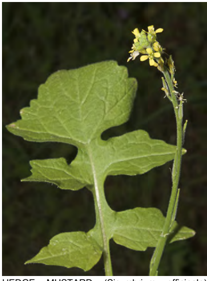
HEDGE MUSTARD (Sisymbrium officinale) Naturalized Annual - Mustard Family - (Apr–Sep) - Disturbed areas, fields, pastures - Stem 10-22" tall, thin, wiry. Petals 0.1-0.16" long, pale yellow. Fruit 0.4-0.55" long, awl-shaped, appressed.