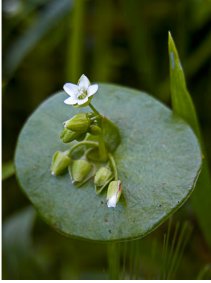
COMMON MINER'S LETTUCE (Claytonia perfoliata subsp. perfoliata) Native Annual -Miner's Lettuce Family - (Jan-May) - Vernally moist, often shady or disturbed sites - Basal leaf length <3x width. Stem leaf gen not angled. Seeds shiny w/large appendage.