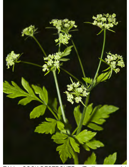
TALL SOCK-DESTROYER (Torilis arvensis) Naturalized Annual - Carrot Family - (Apr–Jul) -Disturbed places - Plant erect, 12-40". Flower clusters open, > leaf. Fruits 0.1-0.2" long, covered with uncurved bristles. Flowers white or pinkish. INVASIVE weed.