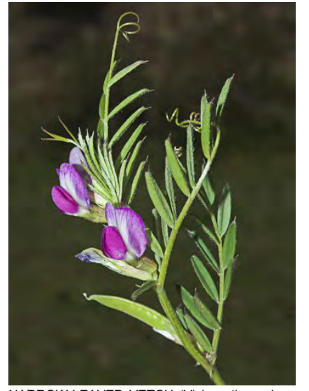
NARROW-LEAVED VETCH (Vicia sativa subsp. nigra) Naturalized Annual - Pea Family -(Mar–Jun) - Roadsides, disturbed areas, grassland, open areas in oak and riparian woodlands - Flowers 1-2 at leaf bases, pink-purple to white, 0.4-0.7" long. Leaflets 0.2-0.3" wide.