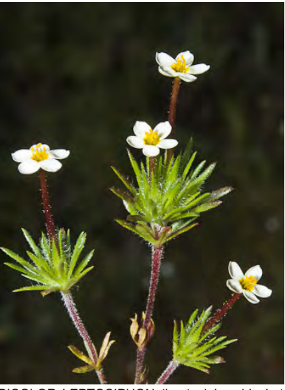
BICOLOR LEPTOSIPHON (Leptosiphon bicolor) Native Annual - Phlox Family - (Mar–Jun) -Common. Open, grassy areas, chaparral, woodland - Plant 0.8-8.3" tall, hairy. Flower lobes ~0.1" long, pink or white; tube red; stigma <=0.02" long.