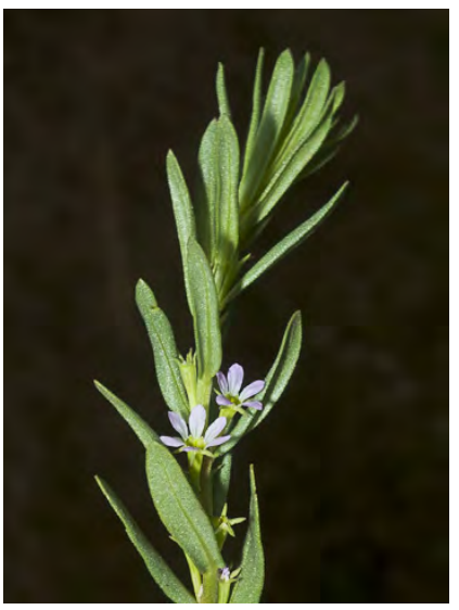
GRASS-POLY (Lythrum hyssopifolia) Naturalized Annual-Perennial - Loosestrife Family - (Apr–Oct) - Marshes, drying pond margins, disturbed ground - Stem 4-24". Leaves 0.2-1.2" long, ~ elliptical. Petals pink, 0.1-0.2" long. 2 awl-like appendages. INVASIVE weed.