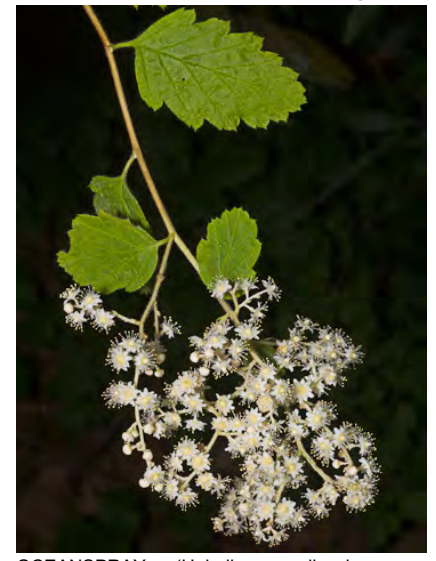
OCEANSPRAY (Holodiscus discolor var. discolor) Native Perennial - Rose Family -(May-Aug) - Moist woodland edges, rocky slopes - Shrub 5-20' tall. Leaf blade 0.6-3.1" long, toothed at end. Flower cluster 0.8-10" long. Petals white, ~0.07" long.