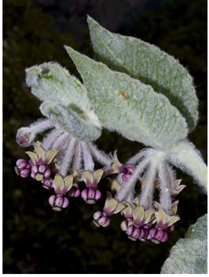
CALIFORNIA MILKWEED (Asclepias californica) Native Perennial - Dogbane Family - (Apr–Jul) -Flats, grassy or brushy hillsides - Plant densly white-woolly. Leaves oval. Flowers dark purple, ~ 0.5" long, petals bent back. Food plant for Monarch butterflies.