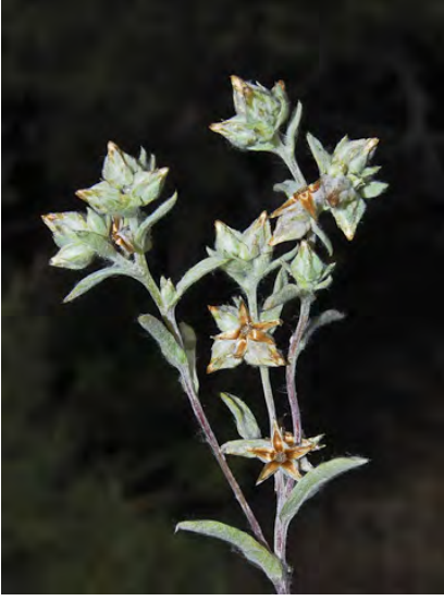
DAGGERLEAF COTTONROSE (Logfia gallica) Naturalized Annual - Sunflower Family -(Mar–Jul) - Bare or grassy openings, burns -Plant 1-20" tall, gen cobwebby. Leaves awl-shaped, stiff, > flower heads. Flowers brown to yellow.