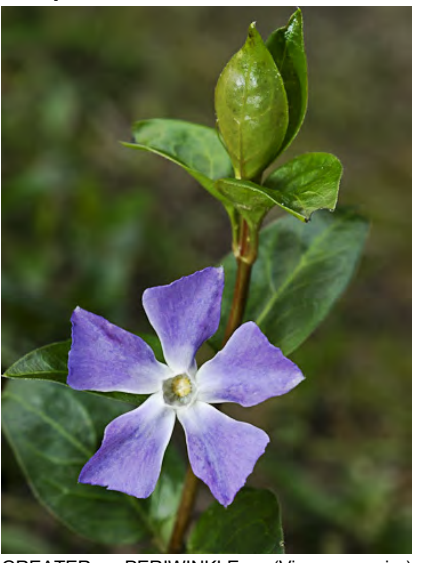
GREATER PERIWINKLE (Vinca major) Naturalized Perennial - Dogbane Family -(Mar-Jun(Jan)) - Coastal bluffs, sheltered places, esp along stream beds - Plant sprawling. Leaf blade ~ 2.8" long, oval. Flower purple-blue, 1.2-2" wide at top. INVASIVE weed.