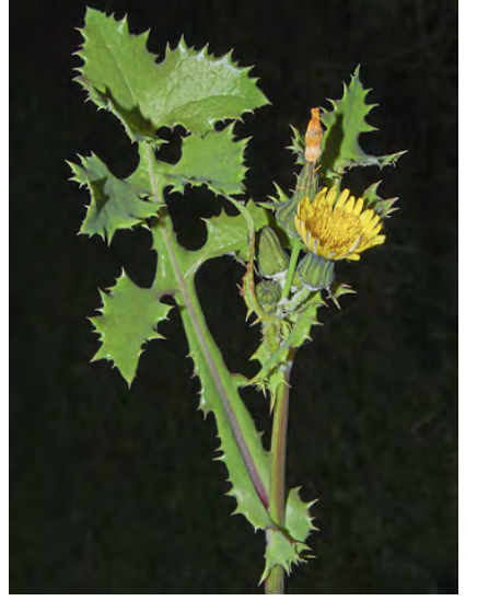
PRICKLY SOW THISTLE (Sonchus asper subsp. asper) Naturalized Annual - Sunflower Family -(All year) - Common. Slightly moist disturbed sites, along streams - Plant 4-48". Leaf teeth prickly. Basal lobes of upper leaves rounded, curving downward.