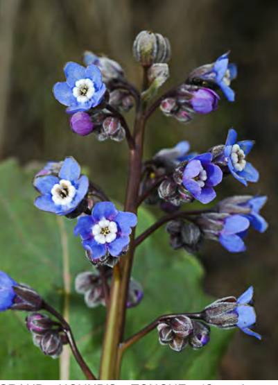
GRAND HOUND'S TONGUE (Cynoglossum grande) Native Perennial - Borage Family -(Feb–May) - Chaparral, woodland - Stem 1-3'. Leaf stalk 3-6". Leaf blade 3-6" cm long, broadly oval. Flowers bright blue w/inner white teeth.