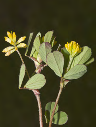
LITTLE HOP CLOVER (Trifolium dubium) Naturalized Annual - Pea Family - (Spring) -Agricultural, disturbed areas, lawns - Heads 0.16-0.3" wide. Flowers bright yellow, age brown, quickly reflex, smooth.