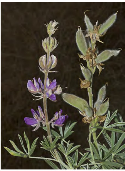
SUMMER LUPINE (Lupinus formosus var. formosus) Native Perennial - Pea Family -(Apr-Sep) - Dry clay soils, grassland, open areas under pines, gen in valleys - Plant 8-32", low growing. Leaves hairy. Flowers purple, hairless, summer/fall blooming.