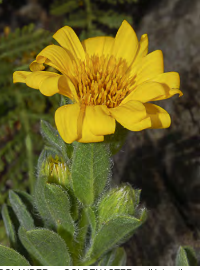
BOLANDER GOLDENASTER (Heterotheca sessiliflora subsp. bolanderi) Native Perennial -Sunflower Family - (Jun–Sep) - Dunes, headlands, grassy coastal slopes - Plant gen 8-28", unbranched. Leaves wide, soft-hairy. Heads clustered, rays 0.3-0.6".