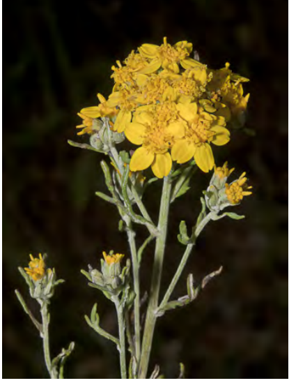
GOLDEN-YARROW (Eriophyllum confertiflorum var. confertiflorum) Native Perennial - Sunflower Family - (Apr-Aug) - Many dry habitats -Shrubby, 8-28" tall. Leaves 0.4-2" long, deeply 3-5 lobed. Flowers yellow; rays 4-6, 0.08-0.2" long; head bracts 4-7.