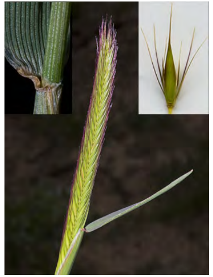
NORTHERN BARLEY (Hordeum brachyantherum subsp. brachyantherum) Native Perennial - Grass Family - (May–Aug) - Meadows, pastures, streambanks - Stem 1-3' tall, gen robust. Leaf sheaths gen smooth, blade < 7.5" long. Lemma awn < 0.25".