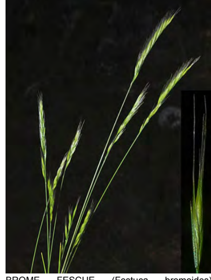
BROME FESCUE (Festuca bromoides) Naturalized Annual - Grass Family - (May–Jun) -Uncommon. Dry, disturbed places, coastal-sage scrub, chaparral - Stem < 20". Inflor 0.6-6" tall, dense, lower branches erect. Spikelet 0.2-0.4" long, awn 0.1-0.3" long.