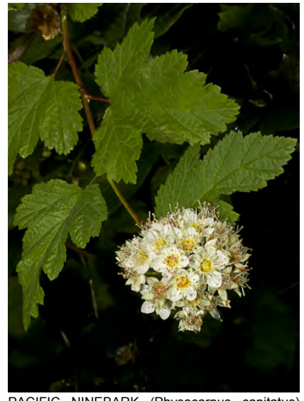
PACIFIC NINEBARK (Physocarpus capitatus) Native Perennial - Rose Family - (May–Jul) -Moist banks, n-facing slopes, mixed-conifer forest - Shrub 3.3-8'. Leaf blades gen < 4" wide, 3-5 lobed. Petals white, ~0.1" long. Fruits reddish, 0.3-0.4" long.