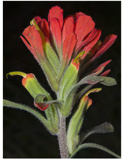
WOOLLY PAINTBRUSH (Castilleja foliolosa) Native Perennial - Broom-rape Family -(Mar–Jun) - Dry, open, rocky slopes, edges of chaparral - Plant 1-2' tall, base slightly woody, much branched, woolly. Flower cluster orange-red (occas. yellow-green).