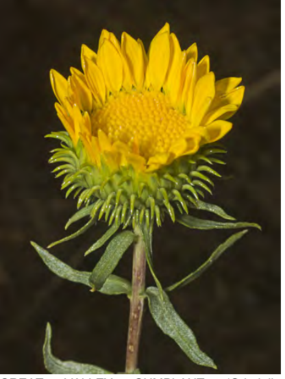
GREAT VALLEY GUMPLANT (Grindelia camporum) Native Perennial - Sunflower Family - (May–Nov) - Sandy or saline bottomland, roadsides - Stem non-woody, 2-8' tall, whitish. Leaves gen resinous. Head to 1.2" wide, bracts bend downward.