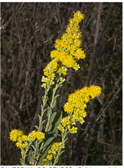
CALIFORNIA GOLDENROD (Solidago velutina subsp. californica) Native Perennial - Sunflower Family - (May-Nov) - Woodland margins, grassland, disturbed soils - Stem 8-60" tall. Gen densely short-soft-hairy. Flower cluster height 2-4x width.