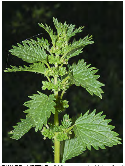
DWARF NETTLE (Urtica urens) Naturalized Annual - Nettle Family - (Jan–Jun) - Disturbed areas, stream banks, shaded areas in grassland, oak woodland, chaparral, coastal-sage scrub, riparian woodland - Leaf teeth sharp. Petals 2 large, 2 small, free to base.