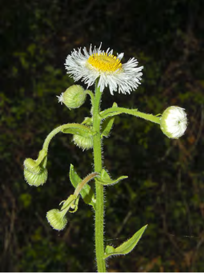
PHILADELPHIA FLEABANE (Erigeron philadelphicus var. philadelphicus) Native Biennial-Perennial - Sunflower Family -(May–Jun) - Streamsides, other moist habitats -Plant 10-32" tall. Disk yellow. Rays 150-400, narrow, white to pink. Leaves clasping.