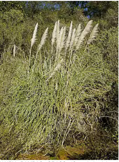
HAIRY PAMPAS GRASS (Cortaderia jubata) Naturalized Perennial - Grass Family - (Sep–Feb) - Disturbed sites, many habitats, esp coastal -Plant 6-23' tall. Leaf blades 0.1-0.5" wide, sheathes hairy. NOXIOUS weed.