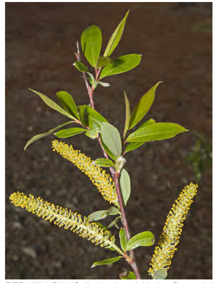
RED WILLOW (Salix laevigata) Native Perennial - Willow Family - (Dec–Jun) - Common. Riverbanks, seepage areas, lakeshores, canyons - Tree bark fissured. Leaf lanceolate, glaucous below, gen w/stalk glands. Stamens 5. Fruit glabrous.