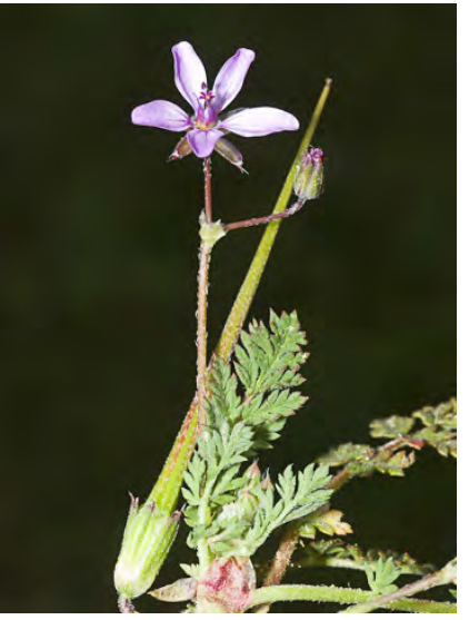
REDSTEM FILAREE (Erodium cicutarium) Naturalized Annual - Geranium Family -(Feb-Sep) - Open, disturbed sites, grassland, scrub - Stem 4-20". Leaves compound, leaflets dissected. Sepal tip bristly. Petal pink to purple. Fruit beak 0.8-2". INVASIVE.