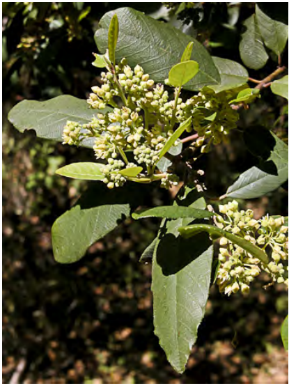
CALIFORNIA COFFEE BERRY (Frangula californica subsp. californica) Native Perennial -Buckthorn Family - (May–Jul) - Coastal-sage scrub, chaparral, forest, woodland - Shrub < 16' tall. Flowers greenish. Leaves smooth beneath.