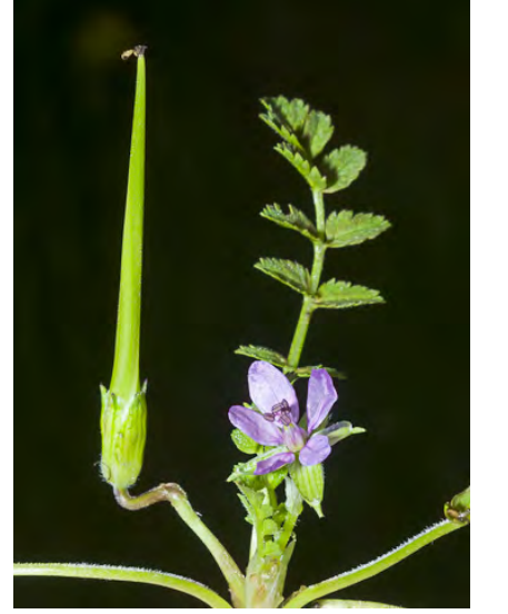
LONG-BEAKED FILAREE (Erodium botrys) Naturalized Annual - Geranium Family -(Mar-Jul) - Dry, open or disturbed sites - Stem 4-35" tall, coarse-hairy. Leaves lobed. Petals pink, 0.3-0.5" long. Sepals w/reddish tip. Fruit beak 2-4.7" long.