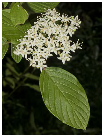
WESTERN AMERICAN DOGWOOD (Cornus sericea subsp. occidentalis) Native Perennial -Dogwood Family - (May–Jul) - Generally moist places - Shrub 5-13' tall. Leaf blades gen 2-4" long, rough-hairy below, veins in 4-7 pairs. Petals white, 0.1-0.2" long.