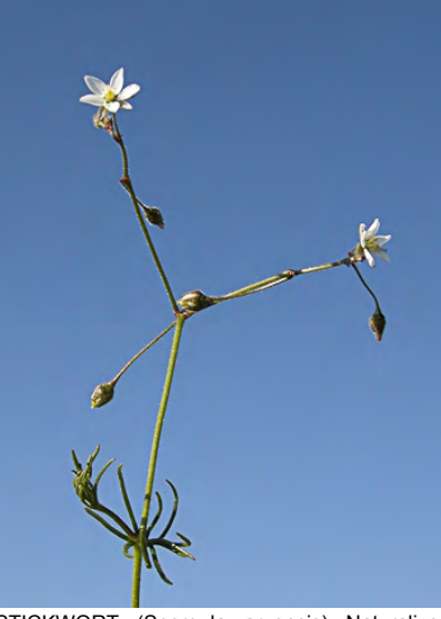
STICKWORT (Spergula arvensis) Naturalized Annual - Pink Family - (Spring–early summer) -Open slopes, pine woodland, sand dunes, fields, disturbed areas - Stem 4-16"+. Leaves 0.4-2" long, linear, in whorls.