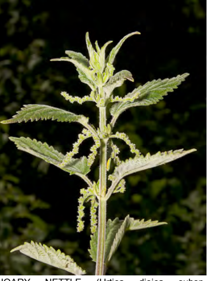
HOARY NETTLE (Urtica dioica subsp. holosericea) Native Perennial - Nettle Family -(Jun-Sep) - Meadows, seeps, springs, margins of marshes, streams, lakes, moist areas in chaparral, coastal scrub - Plant 3.3-9.8' tall, grayish, covered with stinging hairs.