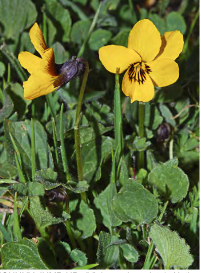
JOHNNY-JUMP-UP (Viola pedunculata) Native Perennial - Violet Family - (Feb–Apr) - Open, grassy slopes, hillsides, chaparral, oak woodland, gen full sun - Plant 2-15" tall. No basal leaves. Petals gold-yellow, lower 3 brown-veined, upper 2 red-brown on back.