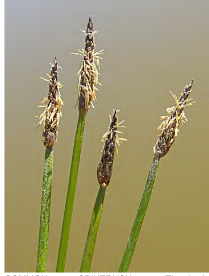
COMMON SPIKERUSH (Eleocharis macrostachya) Native Perennial - Sedge Family -(Spring-summer) - Common. Fresh to brackish wetland - Stem 8-39" tall, 0.06-0.1" wide. Spikelet 0.2-1.6" long, 0.08-0.2" wide, style 2-branched.