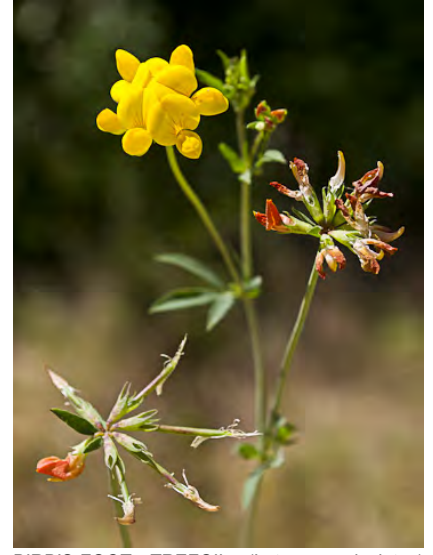
BIRD'S-FOOT TREFOIL (Lotus corniculatus) Naturalized Perennial - Pea Family - (Jun-Sep) -Open, disturbed areas - Leaflets 5, 0.16-0.9" long. Flower cluster 3-7 flowered on0.6-4.7" stalk. Flowers bright yellow, 0.4-0.55" long, banner often reddish.