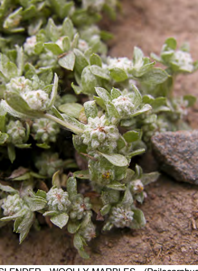
SLENDER WOOLLY-MARBLES (Psilocarphus tenellus) Native Annual - Sunflower Family -(Mar–Jul) - Common. Dry, seasonally moist slopes, flats, burns, trails, rarely vernal pools -Plant hairy. Leaves spoon-shaped. Disk flowers 4-lobed.