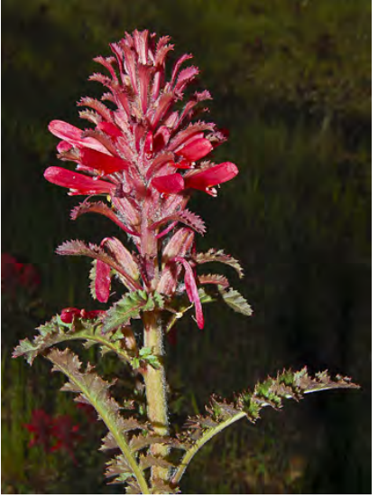
WARRIOR'S PLUME (Pedicularis densiflora) Native Perennial - Broom-rape Family -(Mar-May) - Dry chaparral, oak/pine forest -Hairy. Stem 2.4-22". Basal leaves 5-28 cm long, 13-41 segments. Flowers deep-red to red-purple, 0.9-1.4" long, lower lip 1/8th upper.