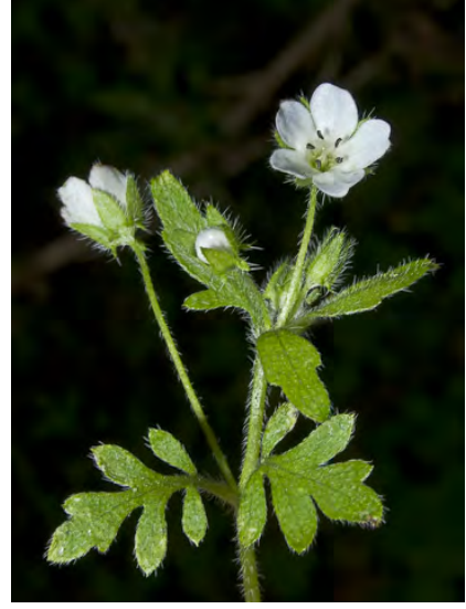
VARIABLE-LEAF NEMOPHILA (Nemophila heterophylla) Native Annual - Borage Family -(Feb-Jun) - Common. Forest, chaparral, roadsides, streambanks - Flower 0.1-0.4" long, unspotted, bract appendages < 0.04" long in fruit.