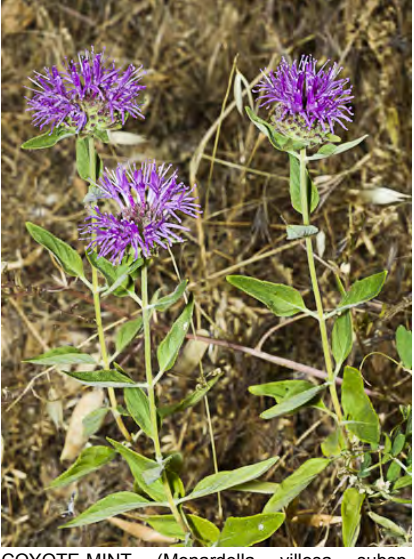
COYOTE-MINT (Monardella villosa subsp. villosa) Native Perennial - Mint Family -(May-Aug) - Dry rocky slopes, oak woods, chaparral - Plant < 20" tall. Leaves ovate, 0.4-0.9" mm long. Flower head 0.4-1.2" wide. Flowers pink to purple.