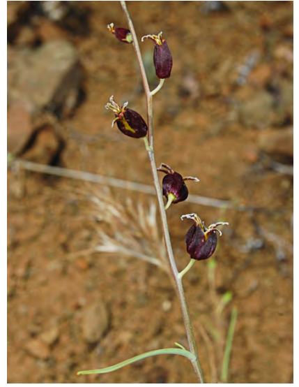
BRISTLY JEWEL FLOWER (Streptanthus glandulosus subsp. glandulosus) Native Annual - Mustard Family - (Apr–Jul) - Serpentine, bare slopes, chaparral & woodland openings - Flower lavender or purple-brown.