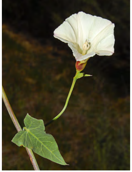
CLIMBING MORNING-GLORY (Calystegia purpurata subsp. purpurata) Native Perennial -Morning-glory Family - (May–Jun) - Chaparral, coastal scrub - Stem strongly climbing. Leaf triangular, lobes strongly angled. Bractlets smooth, small, distant.