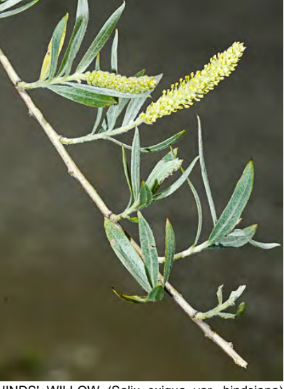
HINDS' WILLOW (Salix exigua var. hindsiana) Native Perennial - Willow Family - (Apr–May) -Common. Floodplains, sandy gravel - Shrub or tree < 17' tall. Leaf blades 1.2-6" long, linear, mature dense soft-hairy below. Ovary hairy.