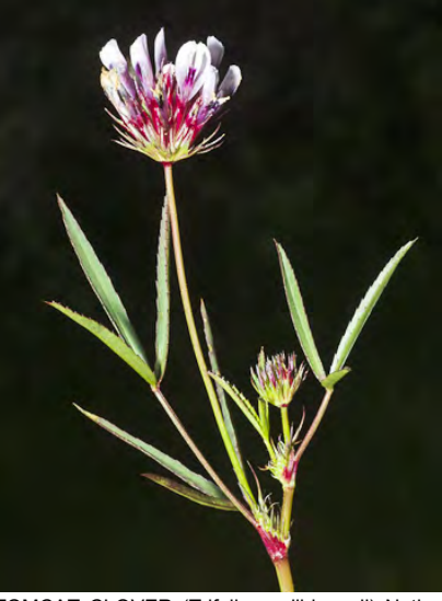
TOMCAT CLOVER (Trifolium willdenovii) Native Annual - Pea Family - (Mar–Jun) - Abundant. Disturbed, gen spring-moist, heavy soils, occas serpentine - Head bract wheel-shaped, sharp-lobed. Leaf narrow. Flowers purple w/white tip, 0.3-0.6" long.