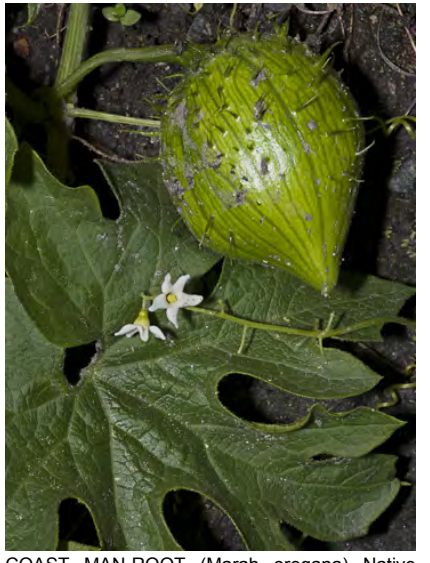
COAST MAN-ROOT (Marah oregana) Native Perennial - Gourd Family - (Mar–May) - Shrubby or open areas, forest edges - Vine 3-20' long. Leaves deeply lobed. Flowers white, deep cup-shaped, > 0.3" wide. Fruit smooth at end.