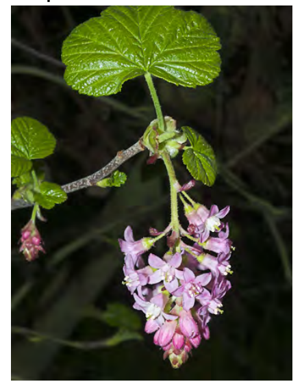
RED-FLOWERING CURRANT (Ribes sanguineum var. glutinosum) Native Perennial -Gooseberry Family - (Feb-Apr) - Many habitats -Shrub < 13' tall, no prickles. Sepals pink to white. Petals white to red, ~0.1" long. Styles smooth.