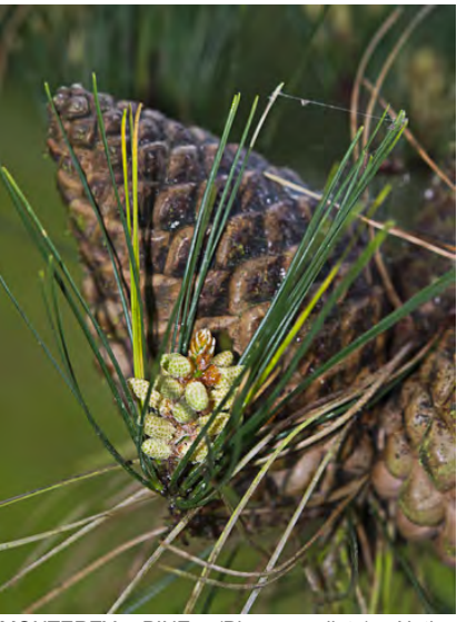
MONTEREY PINE (Pinus radiata) Native Perennial - Pine Family - - - Closed-cone-pine forest, oak woodland - Tree < 125' tall. Mature bark black, deep-grooved. Needles 3 per bundle, 2.4-5.9" long. Seed cone 2.4-6" long, asymmetric, opening 2nd year.