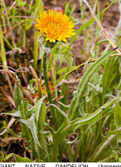
GIANT NATIVE DANDELION (Agoseris grandiflora var. grandiflora) Native Perennial -Sunflower Family - (Apr–Jul) - Grassland, scrub, woodland - Plant 10-40". Leaf lobes point up. Flower rosy-purple, variable-sized bracts. Seed tapers to beak > 2x body length. Leaf lobes point upward.