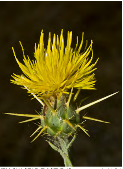
YELLOW STAR-THISTLE (Centaurea solstitialis) Naturalized Annual - Sunflower Family -(May–Oct) - Invasive, roadsides, disturbed grassland or woodland - Plant 4-39" tall. Leaves woolly, extend down the stem. Flower bract spines 0.4-1" long. NOXIOUS weed.