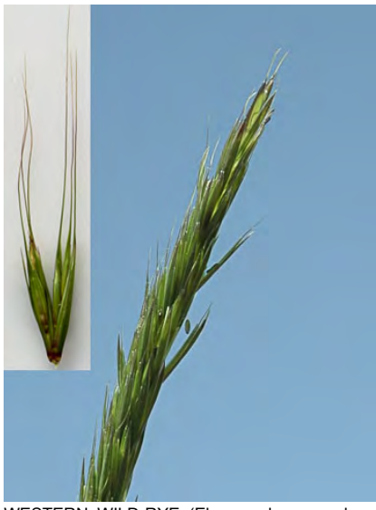
WESTERN WILD-RYE (Elymus glaucus subsp. glaucus) Native Perennial - Grass Family - (Jun-Aug) - Open areas, chaparral, woodland, forest - Tufted. Stem 12-55" tall. Leaf 0.2-0.5" wide, flat. Spikelets0.3-0.6" long, 2-4 per node. Lemma awn 0.4-1.2" long.