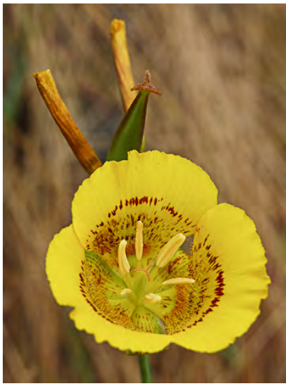
YELLOW MARIPOSA LILY (Calochortus luteus) Native Perennial - Lily Family - (Apr–Jun) - Heavy soils in grassland, woodland, mixed-evergreen forest - Stem 8-20" long. Flowers bell-shaped, deep yellow, 0.8-1.6" long, gen w/inner central red-brown spot.