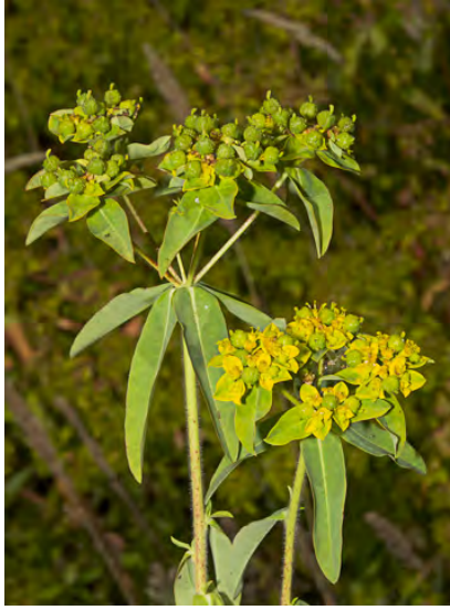
EUROPEAN SPURGE (Euphorbia oblongata) Naturalized Perennial - Spurge Family -(Jun-Aug) - Disturbed areas - Stem 20-32" tall, densely hairy. Leaves 1.6-2.4" long, alternate, oblong. Flower cluster umbrella-like, gland <0.1", elliptic. NOXIOUS weed.