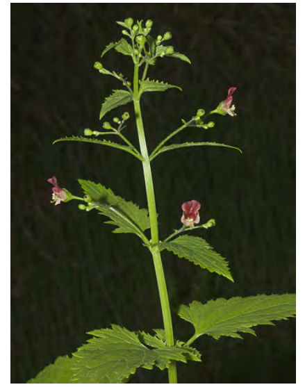
CALIFORNIA FIGWORT (Scrophularia californica) Native Perennial - Snapdragon Family - (Mar-Jul) - Common; damp places, chaparral, roadsides - Stem 2.6-4' tall, square x-section. Leaves opposite, to 7" long, triangular, toothed. Flowers 0.3-0.5" long, upper lips red to maroon, lower paler or yellowish.