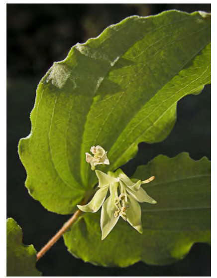
HOOKER FAIRY BELLS (Prosartes hookeri) Native Perennial - Lily Family - (Mar–Jun) -Montane conifer, mixed-evergreen forest, exposed roadside - Stem 12-32" tall. Leaf 1.2-6" long. Flower 0.3-0.6" long, white, hanging below the leaves, stamens > petals.