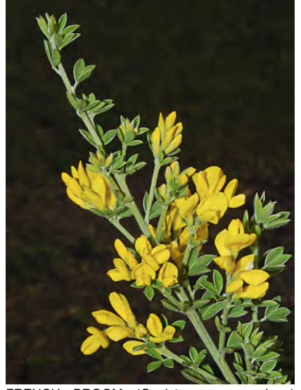
FRENCH BROOM (Genista monspessulana) Naturalized Perennial - Pea Family - (Mar–Jun) -Common. Disturbed places. - Shrub < 10' tall, evergreen. Stems 8-10 ridged, leafy. Flowers yellow, 4-10 at branch tips, banner 0.4-0.6" long. NOXIOUS.