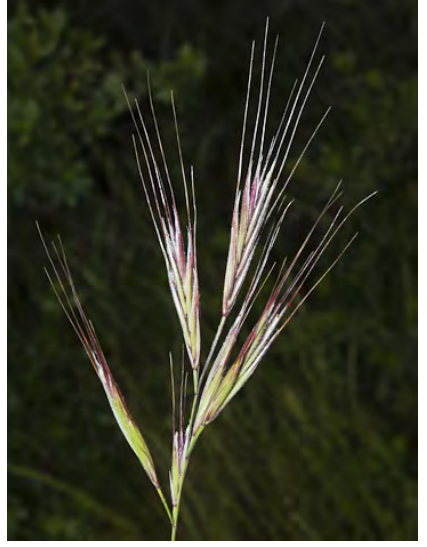
FOXTAIL CHESS (Bromus madritensis subsp. madritensis) Naturalized Annual - Grass Family - (Apr–Jan) - Disturbed areas, roadsides - Plants 4-20" tall. Stem and sheathes smooth. Flower cluster branches visible, lower spikelets erect, > stalk.