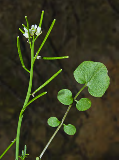
WESTERN BITTER-CRESS (Cardamine oligosperma) Native Annual - Mustard Family - (Mar–Jul) - Wet meadows, shady banks, damp areas - Plants < 16". Leaves divided into 5-9 leaflets. Flowers white, 0.1-0.2" long. Fruit < 0.1" wide.