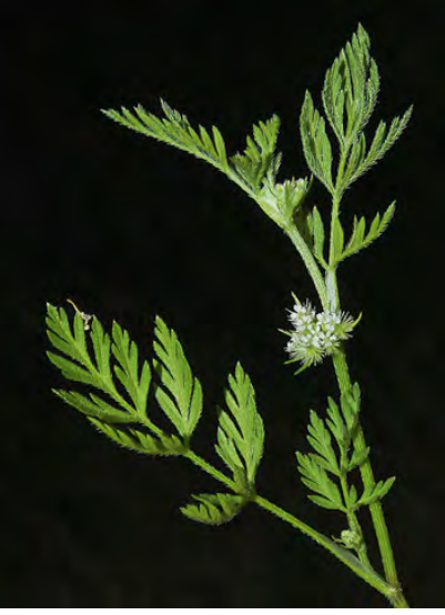
SHORT SOCK-DESTROYER (Torilis nodosa) Naturalized Annual - Carrot Family - (Apr–Jun) -Disturbed places - Plant spreading, 4-20" tall. Flowers white to red, clusters dense, < leaf. Fruit ~ 0.1" long, uncurved bristles on outer surface, bumps inside.