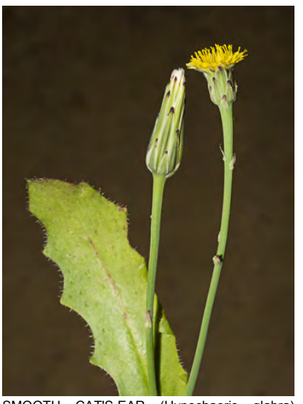
SMOOTH CAT'S-EAR (Hypochaeris glabra) Naturalized Annual - Sunflower Family -(Mar–Jun) - Common. Disturbed areas, grassland, open woodland - Plant 4-24" tall, smooth. Rays 0.2-0.3" long, barely > head bracts. Only inner fruit beaked. INVASIVE.