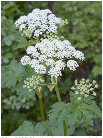
COW PARSNIP (Heracleum maximum) Native Perennial - Carrot Family - (Apr–Jul) - Moist places, wooded or open - Plants 1-3 m tall, woolly-hairy. Leaflets 3, maple-lobed, 4-16" wide. Petals white, outermost longest. Juice causes dermatitis.