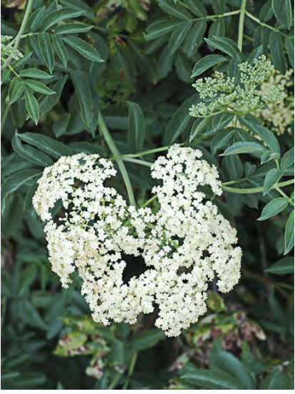
BLUE ELDERBERRY (Sambucus nigra subsp. caerulea) Native Perennial - Muskroot Family -(Mar–Sep) - Common. Streambanks, open places in forest - Shrub 7-26' tall. Flower cluster flat-topped, 1.6-13" diam, petals spreading. Fruits waxy blue-black.