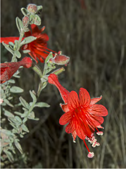
CALIFORNIA FUCHSIA (Epilobium canum subsp. canum) Native Perennial - Evening Primrose Family - (Jun-Dec) - Dry slopes, ridges - Plant hairy, gen sticky with a woody base. Leaf 0.3-2.8" long, gray to green. Flowers red-orange, floral tube 0.8-1.2" long.