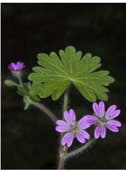
HAIRY DOVE'S FOOT GERANIUM (Geranium molle) Naturalized Annual - Geranium Family -(Feb-Aug) - Open to shaded sites, disturbed ground - Stem 4-17" tall. Petals red-purple, 0.1-0.4" long, notched. Sepals awnless. Fruit smooth, wrinkled.