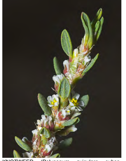
KNOTWEED (Polygonum aviculare subsp. depressum) Naturalized Annual - Buckwheat Family - (May–Nov) - Disturbed places - Stem 4-20", mat-forming. Flowers 2-8/leaf axil, ~0.1" long, fused 1/2 length, w/white or pink margins.