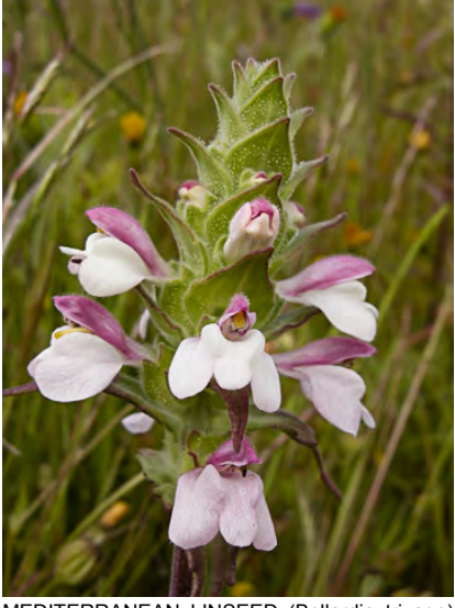
MEDITERRANEAN LINSEED (Bellardia trixago) Naturalized Annual - Broom-rape Family -(Apr-Jun) - Disturbed grassland. - Plant sticky-hairy. Stem 6-32" tall. Leaves lance-shaped, toothed. Flowers 0.8-1" long, 2-lipped: upper lip pink, lower lip white. INVASIVE.