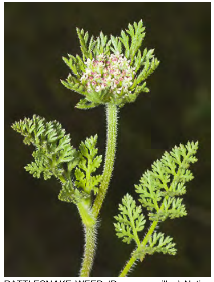
RATTLESNAKE WEED (Daucus pusillus) Native Annual - Carrot Family - (Apr–Jun) - Rocky or sandy places - Plant 1-35" tall, usually < 20". Flower clusters with < 13 flowers, all white. Young roots edible. Sap TOXIC to some people, causing dermittis.