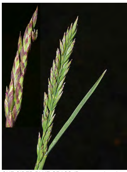
ONE-SIDED BLUE GRASS (Poa secunda subsp. secunda) Native Perennial - Grass Family -(Mar-Aug) - Common. Dry slopes to saline/alkaline meadows to alpine - Plant 6-40" tall, densely tufted. Flower clusters congested. Spikelets gen 0.3-0.4" long. Lemmas 0.16-0.2" long, backs rounded.