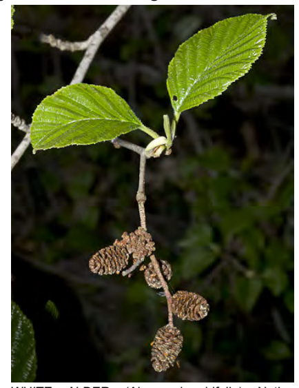
WHITE ALDER (Alnus rhombifolia) Native Perennial - Birch Family - (Apr–Jun) - Along permanent streams - Tree. Leaves flat, not rusty underneath, margins serrate, not rolled under. Female flowers cone-like. Wood used for furniture and for smoking meats.