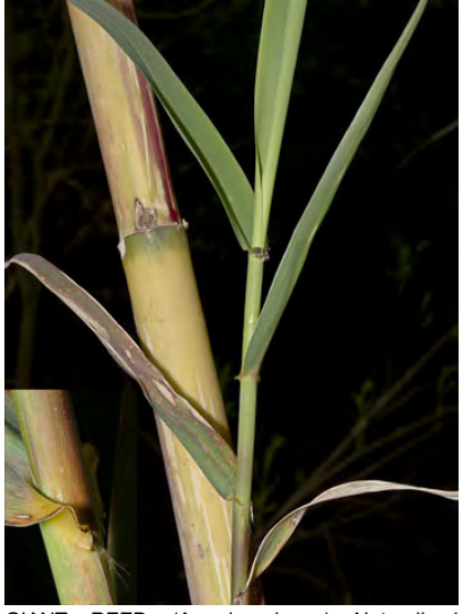
GIANT REED (Arundo donax) Naturalized Perennial - Grass Family - (Mar–Sep) - Moist places, seeps, ditchbanks - Stem 6-33' tall, matures woody. Leaves evenly spaced on stem. Flower cluster 8-28" tall, up to 5" wide. Spikelet ~0.5" long. NOXIOUS weed.