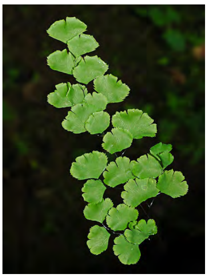
CALIFORNIA MAIDENHAIR (Adiantum jordanii) Native Perennial - Brake Fern Family - - - Shaded hillsides, moist woodland - Leaves 8-28" long with many rounded symmetrical segments, each with < 4 irregular lobes. Cultivated. Sudden Oak Death carrier.