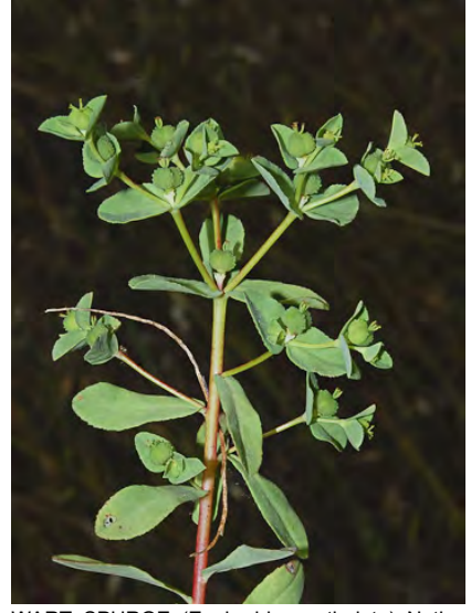
WART SPURGE (Euphorbia spathulata) Native Annual - Spurge Family - (Mar–Jun) - Open, gen disturbed places - Stem 6-17" tall, smooth. Leaves spoon-shaped, 0.4-1.2" long, finely toothed. Gland oblong.