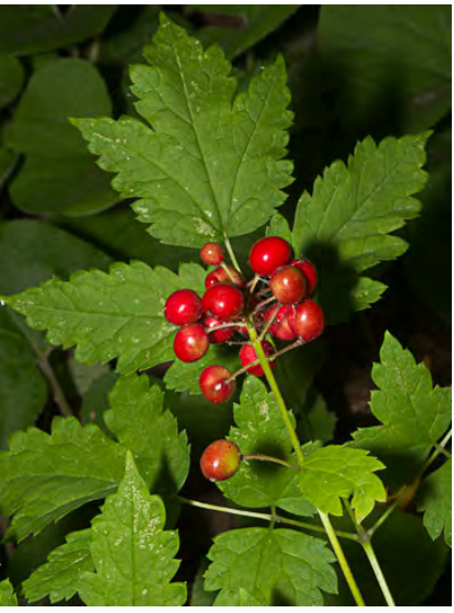
BANEBERRY (Actaea rubra) Native Perennial -Buttercup Family - (May–Sep) - Deep soils, moist, open to shaded sites, mixed-evergreen or conifer forests - Plant 8-40" tall. Flowers white. Fruits shiny red or white, 0.2-0.4" long. All plant parts TOXIC to humans.