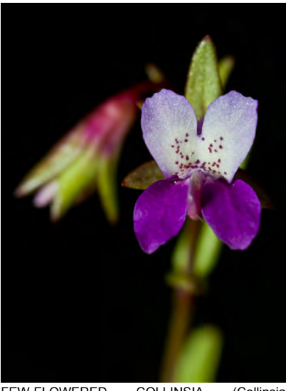
FEW-FLOWERED COLLINSIA (Collinsia sparsiflora var. collina) Native Annual - Plantain Family - (Mar–Apr) - Disturbed grassy fields, roadbanks, open chaparral, open oak and dry mixed woodland - Flowers 0.2-0.3" long, purple, pouch hidden by calyx.