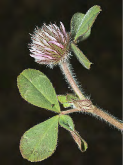
ROSE CLOVER (Trifolium hirtum) Naturalized Annual - Pea Family - (Apr-May) - Disturbed areas, roadsides - Head with 1-2 bract-like leaves immed below. Flowers pink, 0.4-0.6" long, densely-bristly in fruit. INVASIVE weed.