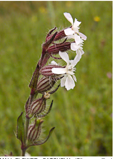
SMALL-FLOWER CATCHFLY (Silene gallica) Naturalized Annual - Pink Family - (Spring-early summer) - Fields, disturbed areas - Plant 4-16". Leaves < 1.4" long. Flower cluster short-hairy, bracts sticky-hairy, petal blade 0.2-0.5" long, smooth to notched, white to pink.