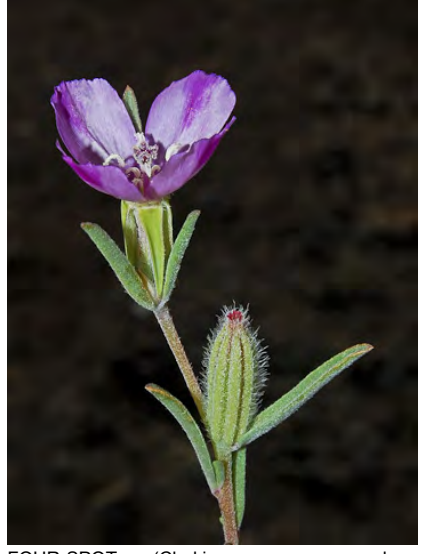
FOUR-SPOT (Clarkia purpurea subsp. quadrivulnera) Native Annual - Evening Primrose Family - (Apr–Aug) - Common. Open, grassy or shrubby places - Buds erect. Petals < 0.6", lavender to dark red. Ovary 8-grooved. Sepals 1's or 2's.