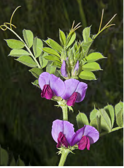
SPRING VETCH (Vicia sativa subsp. sativa) Naturalized Annual - Pea Family - (Mar–Jun) -Roadsides, disturbed areas, grassland, open areas in oak and riparian woodlands - Flowers 1-2 at leaf bases, pink-purple to white, 0.7-1.2" long. Leaflets 0.16-0.4" wide.