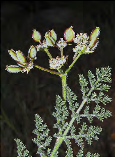
WOOLLY FRUITED DESERTPARSLEY (Lomatium dasycarpum subsp. dasycarpum) Native Perennial - Carrot Family - (Mar–Jun) -Rocky (gen serpentine), chaparral, woodland -Plant 4-20", short-hairy. Flowers greenish-white, petals and fruit hairy.