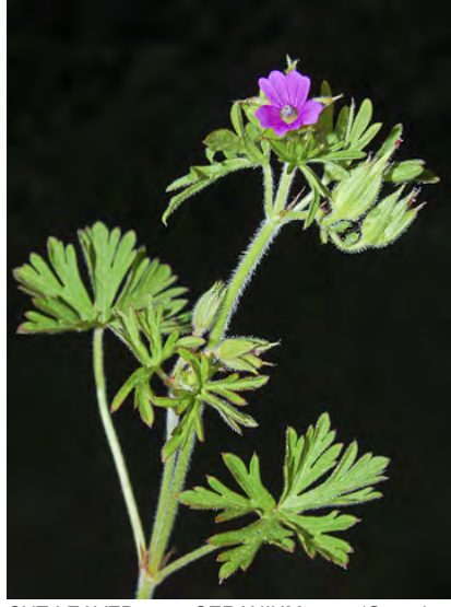
CUT-LEAVED GERANIUM (Geranium dissectum) Naturalized Annual - Geranium Family - (Mar–Jul) - Open, disturbed sites - Stem 3-28" tall, rough-hairy. Leaf blades deeply divided. Petals violet-red, 0.1-0.25" long w/notched tips. Flower stalk sticky. INVASIVE.