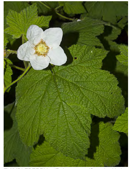
THIMBLEBERRY (Rubus parviflorus) Native Perennial - Rose Family - (Mar–Aug) - Common; moist semi-shaded areas, esp edges of woodland - Shrub 0.5-2 m tall, not prickly. Petals 0.5-0.9" long, white. Leaves simple, 3-5 lobed. Raspberry-type fruit.