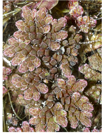
MOSQUITO FERN (Azolla filiculoides) Native Perennial - Mosquito Fern Family - - - Common. Ponds, slow streams - Floating aquatic fern, green to red. Stem gen 0.4-1.2" long. Leaves oval, gen ~0.06" long by 0.04" wide. NITROGEN fixing.