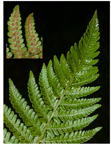
COASTAL WOOD FERN (Dryopteris arguta) Native Perennial - Wood Fern Family - - - Locally common. Open, wooded slopes, caves - Leaf 12-24" long,5-12" wide, divided 1-2 times. Segments generally with spine-tipped teeth.