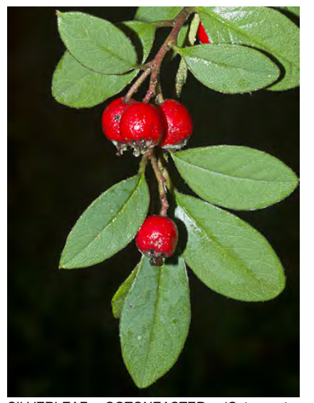
SILVERLEAF COTONEASTER (Cotoneaster pannosus) Naturalized Perennial - Rose Family -(May–Jul) - Disturbed places, mixed-evergreen forest - Leaves 0.8-1.4" long, pointed tip, smooth above. Petals white, spreading. Fruit red. INVASIVE weed.