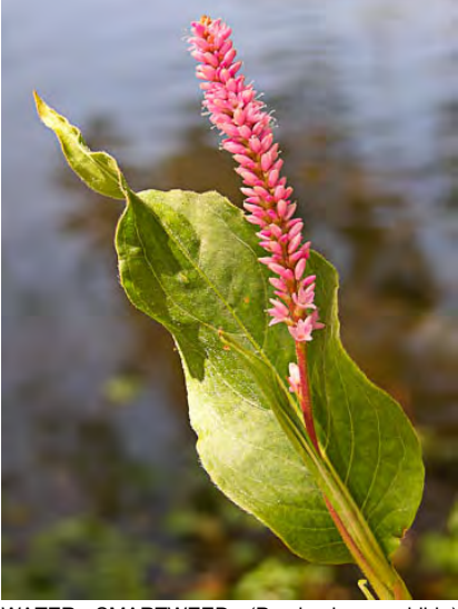
WATER SMARTWEED (Persicaria amphibia) Native Perennial - Buckwheat Family - (Jun-Nov) - Shallow lakes, streams, shores - Aquatic (floating leaves) or terrestrial. Flower clusters 0.4-6" long, 0.3-0.8" wide, pink to red.