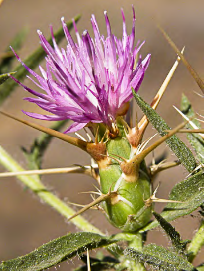
PURPLE STAR-THISTLE (Centaurea calcitrapa) Naturalized Annual-Biennial - Sunflower Family -(Apr–Nov) - Pastures, disturbed places - Plant 8-40"+. Basal leaves 1-2x divided into narrow lobes. Flowers purple with spiny bracts. NOXIOUS weed.