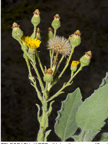
TELEGRAPH WEED (Heterotheca grandiflora) Native Annual - Sunflower Family - (Jun–Oct(± all year)) - Disturbed areas, dry streambeds, sand dunes - Plant 0.3-8' tall, bristly, sticky, branched above. Leaf 0.8-2.8" long, lower clasp stem. Rays 25-40, 0.2-0.3" long.