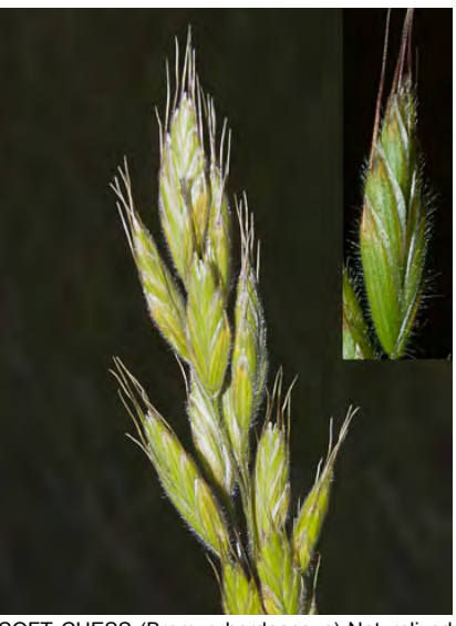
SOFT CHESS (Bromus hordeaceus) Naturalized Annual - Grass Family - (Apr–Jul) - Fields, disturbed areas - Plant 4-26" tall. Leaf hairy. Flower cluster 1-5" long, dense, some stalks > spikelet. Spikelet 0.5-0.9". Lemma 0.26-0.4", awn 0.16-0.4". INVASIVE weed.