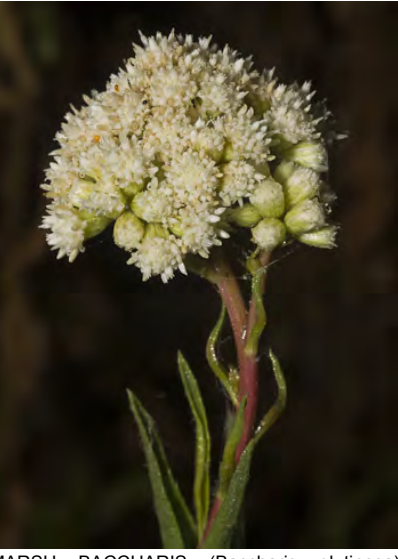
MARSH BACCHARIS (Baccharis glutinosa) Native Perennial - Sunflower Family - (Jul–Oct) -Coastal freshwater and saltwater marshes, streambanks - Plant herbaceous, sticky, 3-6' tall. Leaf blades lance-shaped, < 5" long, 0.5-1.2" wide.