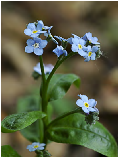
BROADLEAVED FORGET-ME-NOT (Myosotis latifolia) Naturalized Perennial - Borage Family -(Feb-Jul) - Moist, disturbed, shady places - Stem < 28" long, base woody. Leaves to 0.8" wide. Flowers light blue, 0.2-0.4" wide. INVASIVE weed.