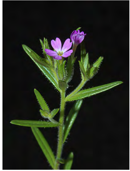
SLENDER ANNUAL PHLOX (Microsteris gracilis) Native Annual - Phlox Family - (Mar–Aug) - Dry to moist areas - Plant < 8" tall, glandualr-hairy. Leaves 0.4-1.2" long. Flowers 0.3-0.5" long, tubes yellow, lobes bright pink to white.