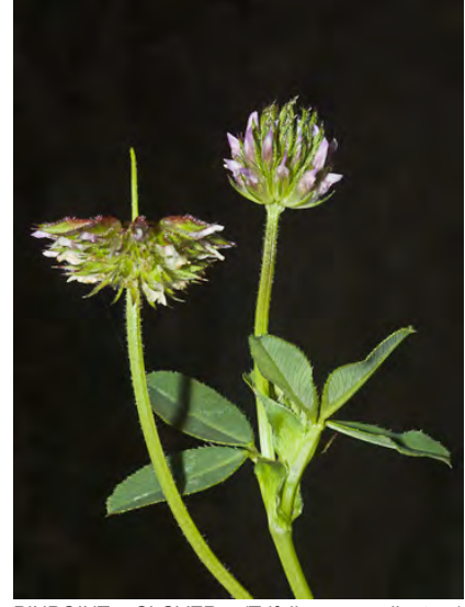
PINPOINT CLOVER (Trifolium gracilentum) Native Annual - Pea Family - (Mar–Jun) - Open, disturbed places, occas serpentine - Leaflet tips not deep-notched. Reflexed pink-purple flowers w/point. Flower bracts completely smooth.