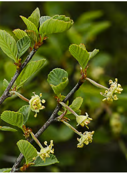
BIRCH-LEAF MOUNTAIN-MAHOGANY (Cerocarpus betuloides var. betuloides) Native Perennial - Rose Family - (Mar–May) - Dry, rocky slopes, chaparral - Shrub 3-10'. Leaf 0.4-1" long, end toothed. Flower 0.16-0.3" wide. Hairy fruit styles 2-3.5" long.