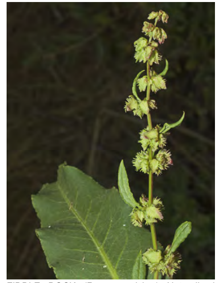
FIDDLE DOCK (Rumex pulcher) Naturalized Perennial - Buckwheat Family - (May–Sep) -Disturbed places, meadows, moist or dry habitats - Stem 8-24" long, branches widely spreading. Leaf blades 1.6-4" long, 1.2-2" wide. Valves w/2-5 teeth.