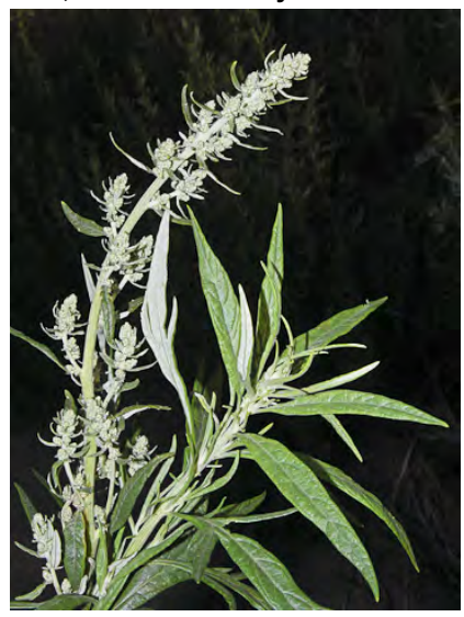
MUGWORT (Artemisia douglasiana) Native Perennial - Sunflower Family - (May–Nov) -Common. Open to shady areas, often in drainages - Plant 20-60" tall. Leaves gen 0.4-4" long, densely hairy below, some 3-5 lobed. Flower bracts hairy.