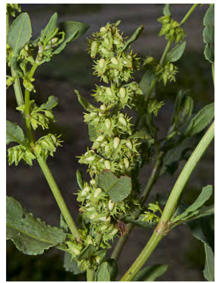
GOLDEN DOCK (Rumex fueginus) Native Annual-Biennial - Buckwheat Family - (May–Aug) - Riparian, disturbed places, shores, marshes, bogs, wet meadows - Stem 6-24" tall, gen branched. Leaf blades 2-10" long 0.6-1.2" wide. Valves w/2-3 teeth.