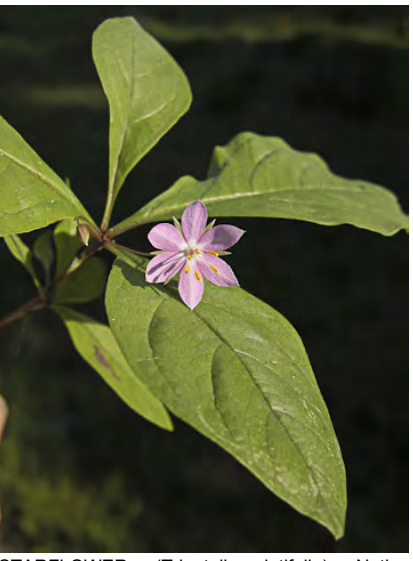
STARFLOWER (Trientalis latifolia) Native Perennial - Myrsine Family - (Apr–Jul) - Shaded places, esp woodland - Stem 2-12". Leaves 1-3.5" long, 0.4-2" wide, egg-shaped; stem leaves in 1 whorl near stem tip. Flower gen pink to rose, 0.3-0.6" wide.