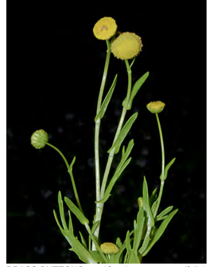
BRASS-BUTTONS (Cotula coronopifolia) Naturalized Perennial - Sunflower Family -(Mar-Dec) - Common. Saline and freshwater marshes, mud flats - Plant 2-16"+ tall, smooth, ± fleshy. Leaves linear to lance-shaped w/linear teeth or lobes. INVASIVE.