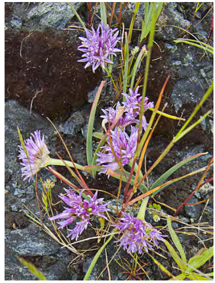
SICKLE LEAF ONION (Allium falcifolium) Native Perennial - Onion or Garlic Family - (Apr–Jun) -Common. Heavy clays including serpentine Leaves 2, flat, curved. Stem flat, winged. Flowers rose-purple or dingy white, 10-30, 0.4-0.6" long.