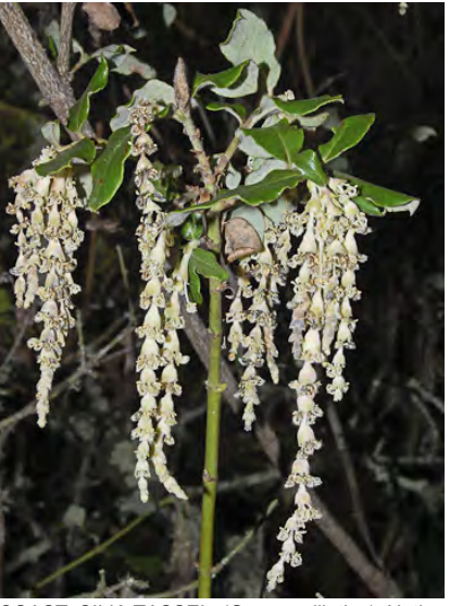
COAST SILK TASSEL (Garrya elliptica) Native Perennial - Silk Tassel Family - (Jan-Mar) -Seacliffs, sand dunes, chaparral, foothill-pine woodland - Shrub or small tree, < 26' tall. Leaves wavy-margined, underside hairs felt-like, interwoven. Fruit hairy.