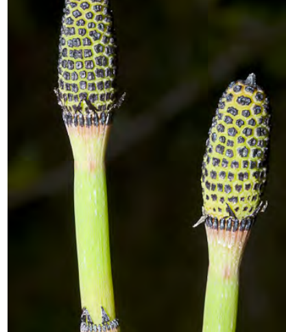
SMOOTH SCOURING RUSH (Equisetum laevigatum) Native Perennial - Horsetail Family - - Moist, sandy or gravelly areas - Stems 1 kind only, 12-71" tall, unbranched. Sheath w/dark band only at the top.