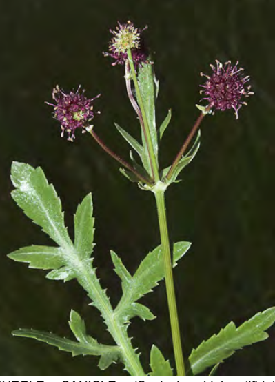
PURPLE SANICLE (Sanicula bipinnatifida) Native Perennial - Carrot Family - (Mar–May) -Open grassland, gen on serpentine, or pine/oak woodland - Plant 5-24" tall. Leaves 1.6-7.5" long, 1-2x divided on a winged central axis. Flowers dark purple. Fruits prickly.