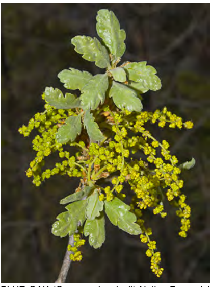
BLUE OAK (Quercus douglasii) Native Perennial - Oak Family - (Apr–May) - Dry slopes, interior foothills, woodland - Tree 20-66', deciduous. Bark checkered into scales. Leaves 1.2-2.4" long, bluish green, unlobed to shallowly lobed, lacking bristles.