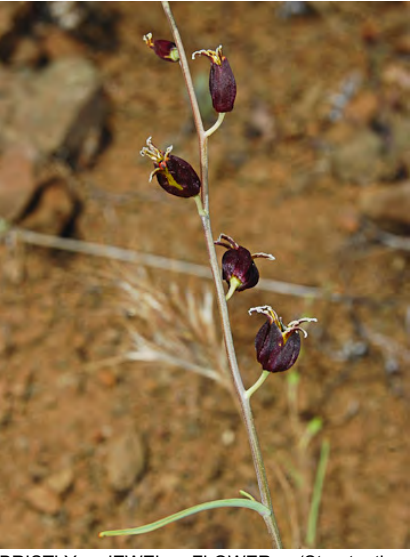
BRISTLY JEWEL FLOWER (Streptanthus glandulosus subsp. glandulosus) Native Annual - Mustard Family - (Apr-Jul) - Serpentine, bare slopes, chaparral & woodland openings - Flower lavender or purple-brown.