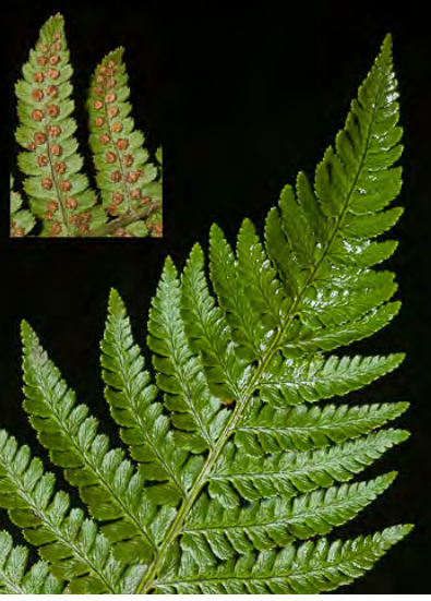
COASTAL WOOD FERN (Dryopteris arguta) Native Perennial - Wood Fern Family - - - Locally common. Open, wooded slopes, caves - Leaf 12-24" long,5-12" wide, divided 1-2 times. Segments generally with spine-tipped teeth.