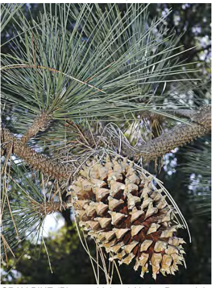
GRAY PINE (Pinus sabiniana) Native Perennial -Pine Family - - - Foothill woodland, n oak woodland, chaparral, infertile soils in mixed-conifer and hardwood forests - Tree < 125' tall. Needles in 3s, 3.5-15" long, gray-green. Cone brownish, seed > wing.