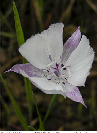
OAKLAND STAR-TULIP (Calochortus umbellatus) Native Perennial - Lily Family -(Mar-May) - Open chaparral or woodland, gen on serpentine - Stem 3-10". Petals white or pink, 0.5-0.7" long, square tip, purple-spotted base. CNPS: FAIRLY ENDANGERED.