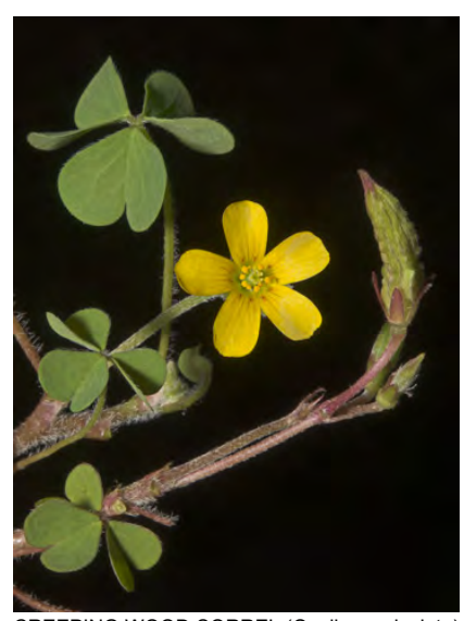
CREEPING WOOD SORREL (Oxalis corniculata) Naturalized Perennial - Oxalis Family - (Most of Year) - Disturbed areas - Plant < 20" tall, rooting at nodes. Leaflets < 0.8" long, in 3s. Petals yellow, < 8 mm long. Fruit 0.24-1" long. Possibly TOXIC to sheep.