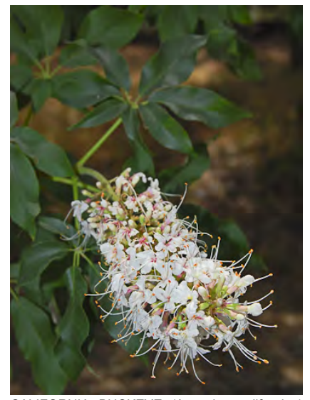
CALIFORNIA BUCKEYE (Aesculus californica) Native Perennial - Soapberry Family - (May–Jun) - Dry slopes, canyons, borders of streams - Large shrub or tree 13-39' tall. 5-7 leaflets. Flowers white to pale rose. Large seeds toxic but edible after leaching out saponins.