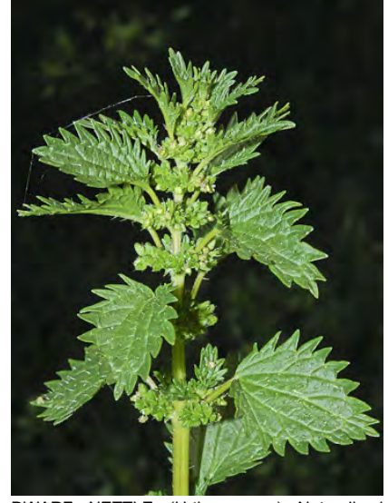
DWARF NETTLE (Urtica urens) Naturalized Annual - Nettle Family - (Jan–Jun) - Disturbed areas, stream banks, shaded areas in grassland, oak woodland, chaparral, coastal-sage scrub, riparian woodland - Leaf teeth sharp. Petals 2 large, 2 small, free to base.