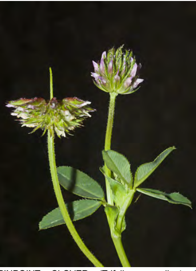
PINPOINT CLOVER (Trifolium gracilentum) Native Annual - Pea Family - (Mar–Jun) - Open, disturbed places, occas serpentine - Leaflet tips not deep-notched. Reflexed pink-purple flowers w/point. Flower bracts completely smooth.