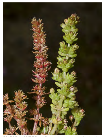
PYGMY WEED (Crassula connata) Native Annual - Stonecrop Family - (Feb–May) - Open areas - Plants 0.8-2.4"+ tall, red in age. Flowers < 0.1" long, 2 per node; Sepals 4, pointed end. Petals generally < sepals.