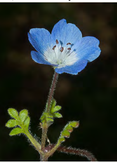
BABY BLUE-EYES (Nemophila menziesii var. menziesii) Native Annual - Borage Family -(Feb-May) - Meadows, grassland, chaparral, woodland, slopes - Plant 4-12". Lower leaves w/6-13 lobes. Flowers bright blue w/white center, 0.2-1.6" wide.