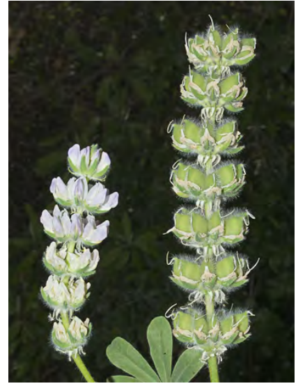
CHICK LUPINE (Lupinus microcarpus var. microcarpus) Native Annual - Pea Family -(Mar-Jun) - Abundant. Open or disturbed areas, occ seeded on roadbanks - Plant 4-32", hairy. Leaves smooth above. Flowers gen pink to purple. Flower bracts shaggy.