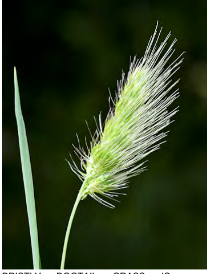
BRISTLY DOGTAIL GRASS (Cynosurus echinatus) Naturalized Annual - Grass Family - (May–Jul) - Open, disturbed sites - Tufted. Stem 4-28" long. Leaf blade 0.1-0.6" wide. Flower cluster 0.4-1.6" long, 1-sided. Fertile and sterile spikelets. INVASIVE weed.