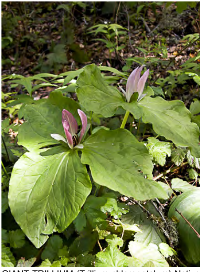
GIANT TRILLIUM (Trillium chloropetalum) Native Perennial - Bunchflower Family - (Apr–May) -Edges of redwood forest, chaparral, gen moist slopes, canyon banks in alluvial soils - Flowers dark purple to white, sessile. Petals 2.6-4" long, odor rose-like or spicy.