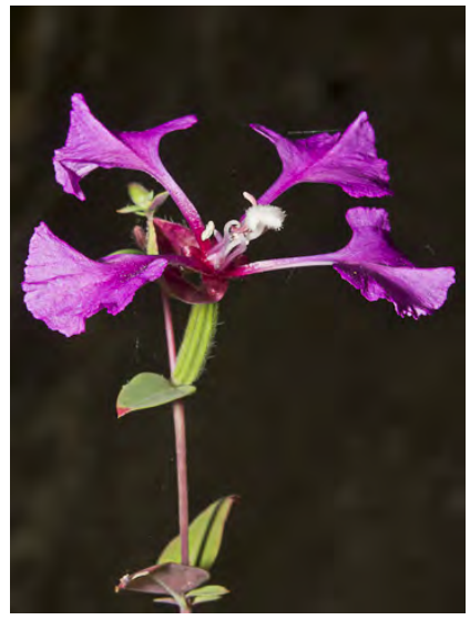
ELEGANT CLARKIA (Clarkia unguiculata) Native Annual - Evening Primrose Family - (Apr-Sep) -Common. Woodland - Buds nodding. Axis erect. Petals 0.4-1" long, pink to dark-red, clawed. Sepals united; sepals & ovary w/spreading hairs to 0.1".