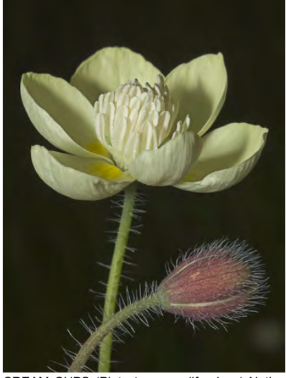
CREAM CUPS (Platystemon californicus) Native Annual - Poppy Family - (Mar–May) - Open grassland, sandy soil, burns - Plant 1.2-12" tall, shaggy-hairy. Leaves 0.4-3.5" long, narrow. Flowers solitary. Stamens > 12. Petals 6, gen cream with yellow base.