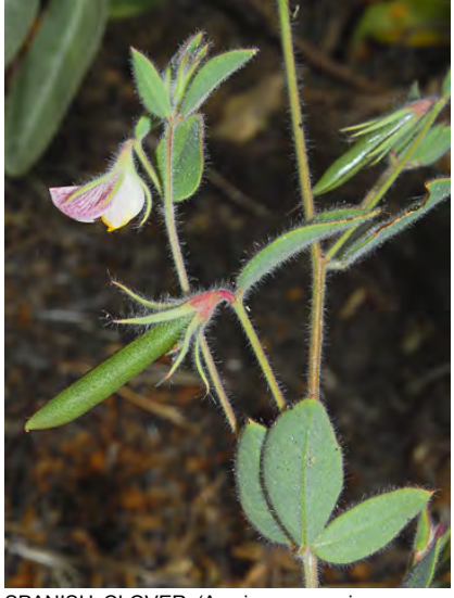
SPANISH CLOVER (Acmispon americanus var. americanus) Native Annual - Pea Family -(May-Oct) - Coast, chaparral, waterways, roadsides, disturbed areas - Plant 2-24", hairy. Flowers white to pink, solitary, bract lobes >> flower tube.