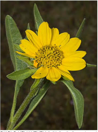
DIABLO HELIANTHELLA (Helianthella castanea) Native Perennial - Sunflower Family - (Apr–Jun) -Open, grassy sites - Stem 4-20" tall. Leaves w/ 1 pair of veins more distinct. Outer head bracts leaf-like, curl around head. CNPS: FAIRLY ENDANGERED.