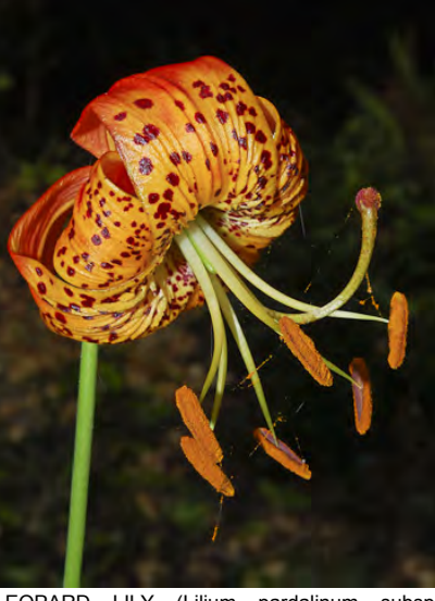
LEOPARD LILY (Lilium pardalinum subsp. pardalinum) Native Perennial - Lily Family -(May–Aug) - Moist places (drier along coast) -Plant < 9' tall. Leaves whorled. Flowers orange with some red, many maroon spots, petals 2.4-4" long.