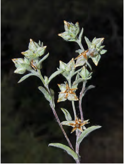
DAGGERLEAF COTTONROSE (Logfia gallica) Naturalized Annual - Sunflower Family -(Mar-Jul) - Bare or grassy openings, burns -Plant 1-20" tall, gen cobwebby. Leaves awl-shaped, stiff, > flower heads. Flowers brown to yellow.