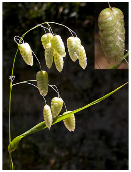
RATTLESNAKE GRASS (Briza maxima) Naturalized Annual - Grass Family - (Apr-Jul) -Shaded sites, roadsides, pastures, weedy on coastal dunes - Stem 8-35" tall. Spikelets 0.4-0.75" long, resemble rattlesnake rattles. INVASIVE weed.