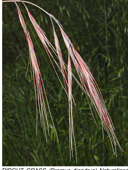
RIPGUT GRASS (Bromus diandrus) Naturalized Annual - Grass Family - (Apr–Jul) - Open, gen disturbed areas - Plant 6-40" tall. Spikelet 1-2.8" long. Lemma body 0.8-1.2" long, awn > 1.2" long. Barbed seeds can stick in flesh of animals. INVASIVE weed.