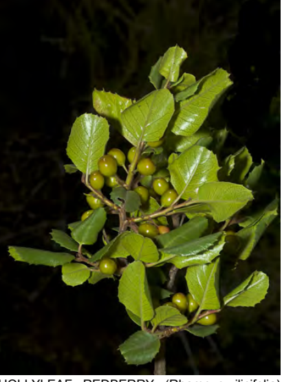
HOLLYLEAF REDBERRY (Rhamnus ilicifolia) Native Perennial - Buckthorn Family - (Mar–Jun) -Chaparral, montane forest - Shrub < 13' tall, evergreen w/stiff branches. Leaf blades 0.8-1.6" long, toothed. Fruits 0.2-0.3" wide, red.