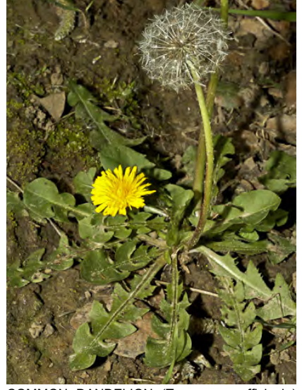
COMMON DANDELION (Taraxacum officinale) Naturalized Biennial-Perennial - Sunflower Family - (All year) - Abundant. Esp disturbed areas -Stem hollow. Leaves bright green with sharp down-pointing lobes. Outer head bracts reflexed. Fruit ~ brown.