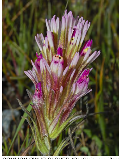
COMMON OWL'S-CLOVER (Castilleja densiflora subsp. densiflora) Native Annual - Broom-rape Family - (Mar–May) - Grassland - Plant 4-16" tall. Leaves 0.8-3.1" long, narrow-lobed. Flower cluster gen rose-purple. Flower upper lip straight.