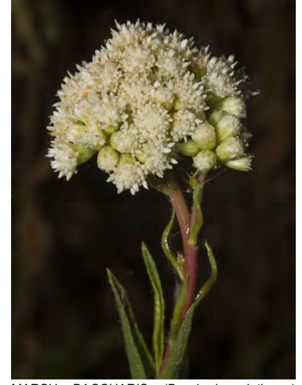
MARSH BACCHARIS (Baccharis glutinosa) Native Perennial - Sunflower Family - (Jul–Oct) -Coastal freshwater and saltwater marshes, streambanks - Plant herbaceous, sticky, 3-6' tall. Leaf blades lance-shaped, < 5" long, 0.5-1.2" wide.