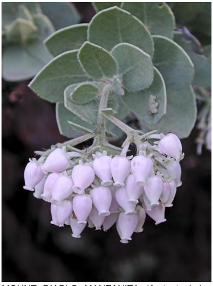
MOUNT DIABLO MANZANITA (Arctostaphylos auriculata) Native Perennial - Heath Family -(Feb-Mar) - Sandstone, upland chaparral near coast. Mount Diablo and vicinity - Leaves clasping. Densely fine-hairy leaves, twigs & fruit. CNPS: ENDANGERED.