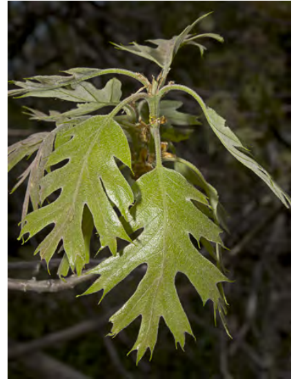
CALIFORNIA BLACK OAK (Quercus kelloggii) Native Perennial - Oak Family - (Apr-May) -Slopes, valleys, woodland, conifer forest - Tree < 80', deciduous. Leaves 3.5-8" long, supple, deeply-lobed, lobes bristle-tipped.