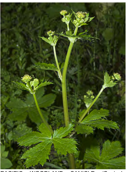
PACIFIC WOODLAND SANICLE (Sanicula crassicaulis) Native Perennial - Carrot Family - (Mar–May) - Open slopes, ravines, woodland - Plants stout, 9-47". Leaves 1-5" across with 3-5 deep, palmate lobes and serrate edges. Flowers yellow.