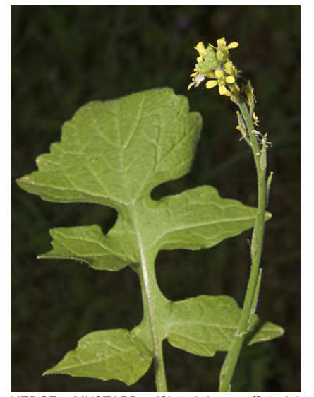
HEDGE MUSTARD (Sisymbrium officinale) Naturalized Annual - Mustard Family - (Apr–Sep) - Disturbed areas, fields, pastures - Stem 10-22" tall, thin, wiry. Petals 0.1-0.16" long, pale yellow. Fruit 0.4-0.55" long, awl-shaped, appressed.