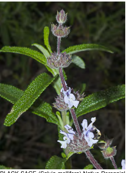
BLACK SAGE (Salvia mellifera) Native Perennial - Mint Family - (Mar–Jun) - Coastal-sage scrub, lower chaparral - Shrub 3.3-6' tall. Leaf 1-2.8" long, toothed, hairy underneath. Flowers blue, white or lavender, tube 0.2-0.4" long, in clusters 0.6-1.6" wide.