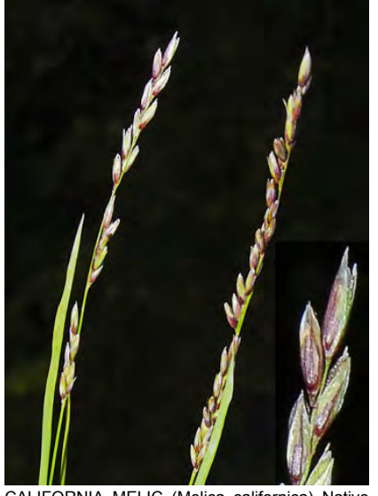
CALIFORNIA MELIC (Melica californica) Native Perennial - Grass Family - (Apr–May) - Open or rocky hillsides, oak woodland, conifer forest -Stem 16-55". Leaf 0.06-0.2" wide. Spiklet 0.2-0.6" long, w/3-7 fertile florets; sterile tip widest above middle, tip squared.