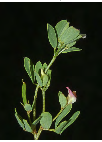
SMALL-FLOWER LOTUS (Acmispon parviflorus) Native Annual - Pea Family - (Mar–May) -Abundant. Coastal bluffs to oak/pine or fir woodland, open or disturbed areas - Flowers pinkish, solitary, 0.2" long, on stalk with bracts. Not hairy.