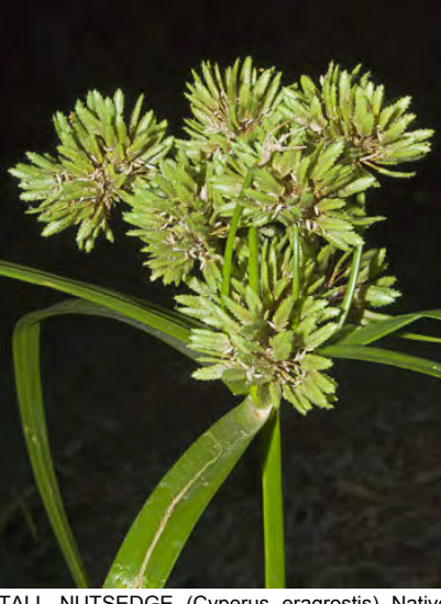
TALL NUTSEDGE (Cyperus eragrostis) Native Perennial - Sedge Family - (May–Nov) - Vernal pools, streambanks - Leaves basal. Flower cluster bracts 4-8. Spikelets 0.2-0.8" long, oblong, in heads to 1.6" wide. Seeds short-stalked.