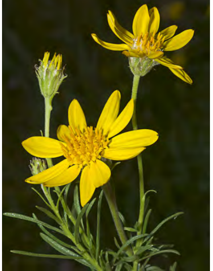
INTERIOR GOLDENBUSH (Ericameria linearifolia) Native Perennial - Sunflower Family -(Mar-May) - Dry slopes, valleys, foothill and desert woodland, saltbush and creosote-bush scrub - Shrub/subshrub, 16-60". Heads large, yellow, solitary; rays 0.3-0.8" long.