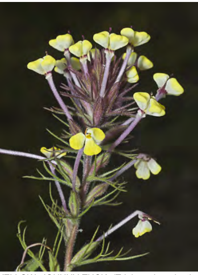
YELLOW JOHNNY-TUCK (Triphysaria eriantha subsp. eriantha) Native Annual - Broom-rape Family - (Mar–May) - Grassland, foothills - Plant 4-14" tall, purple. Leaves 0.4-2" long, 3-7 lobed. Flowers yellow with dark purple beak, 0.4-1" long.