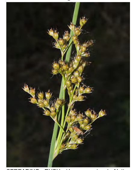
SPREADING RUSH (Juncus patens) Native Perennial - Rush Family - (Jun–Oct) - Marshy places, creeks, seeps - Plant 12-41" tall, densely tufted. Stems blue-gray-green & distinctly grooved when fresh. Stamens 6.