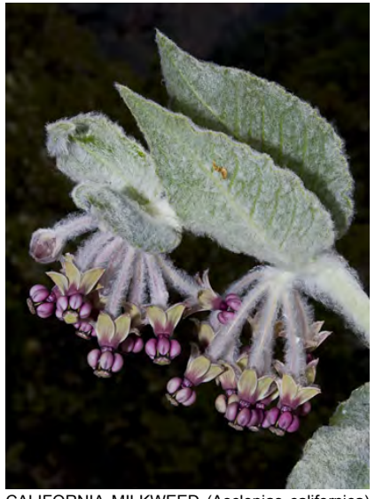
CALIFORNIA MILKWEED (Asclepias californica) Native Perennial - Dogbane Family - (Apr–Jul) -Flats, grassy or brushy hillsides - Plant densly white-woolly. Leaves oval. Flowers dark purple, ~ 0.5" long, petals bent back. Food plant for Monarch butterflies.