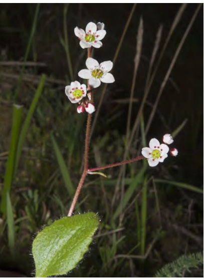
CALIFORNIA SAXIFRAGE (Micranthes californica) Native Perennial - Saxifrage Family - (Feb-May(Jun)) - Moist, shady places - Plant 6-14" tall. Leaves 1.6-4" long, at base, egg-shaped, >= 0.08" wide, toothed. Petals white, 0.1-0.18" long.