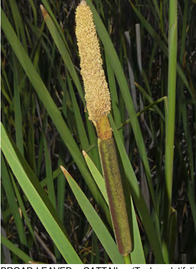
BROAD-LEAVED CATTAIL (Typha latifolia) Native Perennial - Cattail Family - (Jun–Jul) -Unpolluted to nutrient-rich freshwater (brackish) marshes - Plant 4.9-9.8' tall. Widest leaves 0.4-1.1" wide. Flower cluster with no gap between flower types.