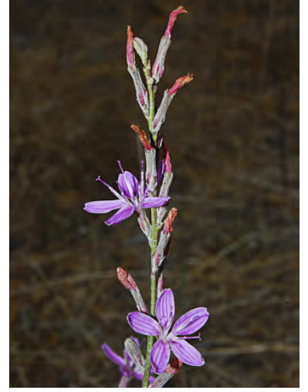
TWIGGY WREATH PLANT (Stephanomeria virgata subsp. pleurocarpa) Native Annual -Sunflower Family - (Jun-Nov) - Chaparral openings, grassland - Plant 20-79". Stem leaves oblong, bract-like. Flower bracts not spreading. Flowers 5-6, white to dark pink.