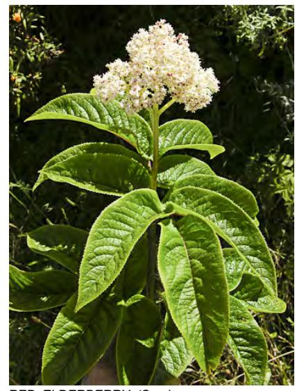
RED ELDERBERRY (Sambucus racemosa var. racemosa) Native Perennial - Muskroot Family -(May-Jul) - Moist places - Shrub/tree 3-20' tall. Leaflets 5-7, 1.6-6.3" long. Flower cluster dome-shaped, gen 6-12 cm diam, petals often reflexed. Fruits red.