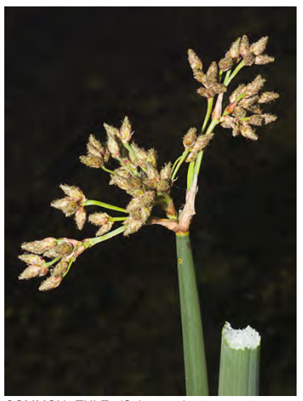
COMMON TULE (Schoenoplectus acutus var. occidentalis) Native Perennial - Sedge Family -(Summer) - Common. Marshes, shores, fens, shallow lakes, often emergent - Stem 3.3-13' tall, fat, round x-section, blue-green.