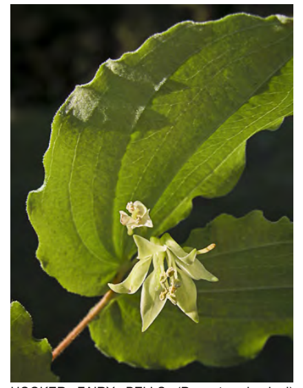
HOOKER FAIRY BELLS (Prosartes hookeri) Native Perennial - Lily Family - (Mar–Jun) -Montane conifer, mixed-evergreen forest, exposed roadside - Stem 12-32" tall. Leaf 1.2-6" long. Flower 0.3-0.6" long, white, hanging below the leaves, stamens > petals.