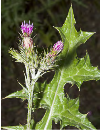
ITALIAN THISTLE (Carduus pycnocephalus subsp. pycnocephalus) Naturalized Annual -Sunflower Family - (Mar–Jul) - Roadsides, pastures, disturbed areas - Stems 8-79", narrow spiny-wings. Lower leaves 4-10 lobed, heads 2-5, flower bracts woolly. NOXIOUS.