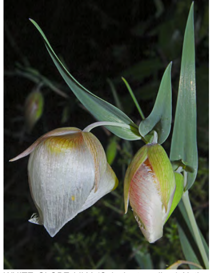
WHITE GLOBE LILY (Calochortus albus) Native Perennial - Lily Family - (Apr–Jun) - Common. Shady to open woodland, scrub - Stem 2-8 dm. Leaves grasslike. Flowers 2-many, hanging, closed at tip. Sepals 10-15 mm. Petals white to pink, 20-25 mm long.