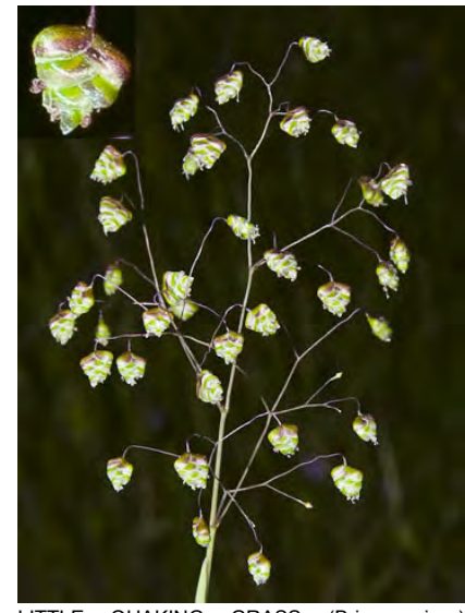
LITTLE QUAKING GRASS (Briza minor) Naturalized Annual - Grass Family - (Apr–Jul) -Shaded or moist, open sites - Stem 3-20" tall. Spikelets 0.1-0.2" long, resemble tiny rattlesnake rattles.