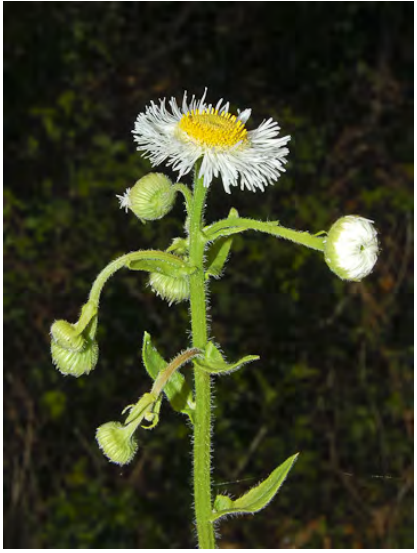
PHILADELPHIA FLEABANE (Erigeron philadelphicus var. philadelphicus) Native Biennial-Perennial - Sunflower Family -(May-Jun) - Streamsides, other moist habitats -Plant 10-32" tall. Disk yellow. Rays 150-400, narrow, white to pink. Leaves clasping.