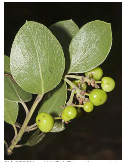
BIG-BERRY MANZANITA (Arctostaphylos glauca) Native Perennial - Heath Family - (Dec-Mar) - Rocky slopes, chaparral, woodland - Shrub-small tree, 3-26' tall. Twigs glabrous. Leaves smooth, waxy-white. Flower stalk 0.3-0.4" long, sticky-hairy.