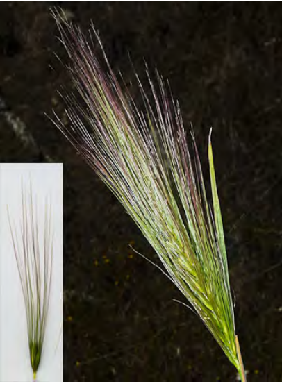
BIG SQUIRRELTAIL (Elymus multisetus) Native Perennial - Grass Family - (May–Jul) - Open, sandy to rocky areas - Tufted. Stem 6-24" tall. Leaf 0.06-0.2" wide. Spikelet 0.4-0.6" long. Glume divisions needle-shaped, lemma awn 1-4" long.