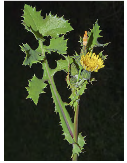
PRICKLY SOW THISTLE (Sonchus asper subsp. asper) Naturalized Annual - Sunflower Family -(All year) - Common. Slightly moist disturbed sites, along streams - Plant 4-48". Leaf teeth prickly. Basal lobes of upper leaves rounded, curving downward.