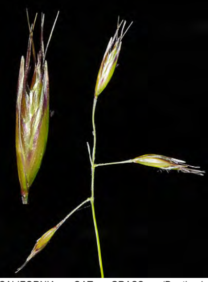
CALIFORNIA OAT GRASS (Danthonia californica) Native Perennial - Grass Family - (Apr-Aug) - Gen moist meadows, open woodland - Stem 12-52" tall. Flower cluster 0.8-2.4" long. Spikelets 3-6, 0.5-1" long, awn 0.16-0.5" long.