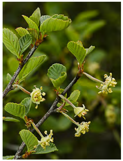
BIRCH-LEAF MOUNTAIN-MAHOGANY (Cercocarpus betuloides var. betuloides) Native Perennial - Rose Family - (Mar-May) - Dry, rocky slopes, chaparral - Shrub 3-10'. Leaf 0.4-1" long, end toothed. Flower 0.16-0.3" wide. Hairy fruit styles 2-3.5" long.