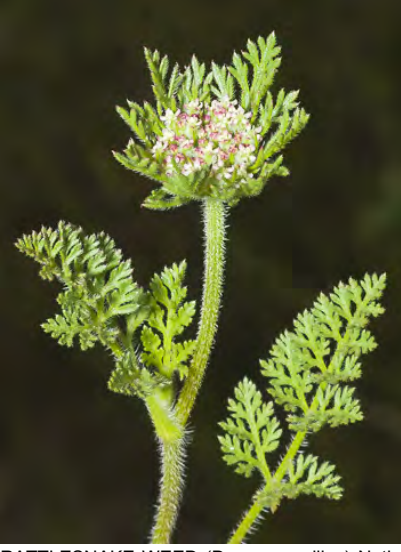
RATTLESNAKE WEED (Daucus pusillus) Native Annual - Carrot Family - (Apr–Jun) - Rocky or sandy places - Plant 1-35" tall, usually < 20". Flower clusters with < 13 flowers, all white. Young roots edible. Sap TOXIC to some people, causing dermittis.