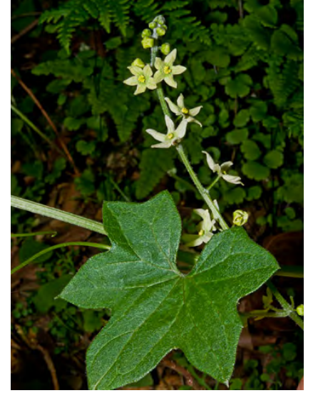
CALIFORNIA MAN-ROOT (Marah fabacea) Native Perennial - Gourd Family - (Feb-Apr) -Streamsides, washes, shrubby open areas - Vine 6-20' long. Leaves moderately lobed. Flowers cream or white, < 0.3" wide. Fruit spiny all over.