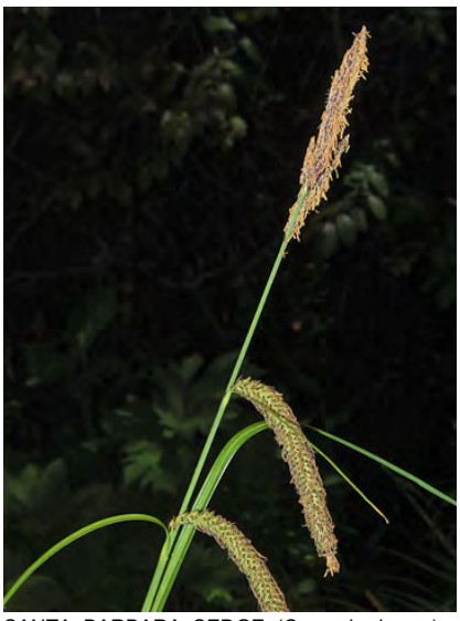
SANTA BARBARA SEDGE (Carex barbarae) -Native Perennial - Sedge Family - (May-Aug) -Seasonally wet places - Stem 6-36" tall, base brown to purple. Lowest flower cluster "leaves" < 4" long. Spikelets brown, 1-3" long, 0.2-0.3" wide.