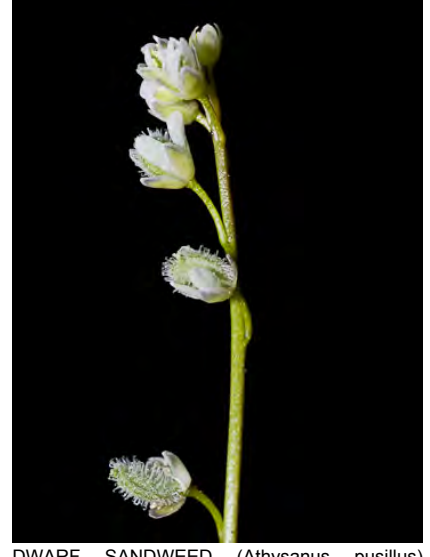
DWARF SANDWEED (Athysanus pusillus) Native Annual - Mustard Family - (Feb–Jun) -Grassy, open slopes, rocky outcrops, chaparral, flats, floodplains, cliffs, ledges - Stem 2-12" long, spindly. Flower cluster 1-sided. Petals white, ~0.1" long. Fruits round, hairy.