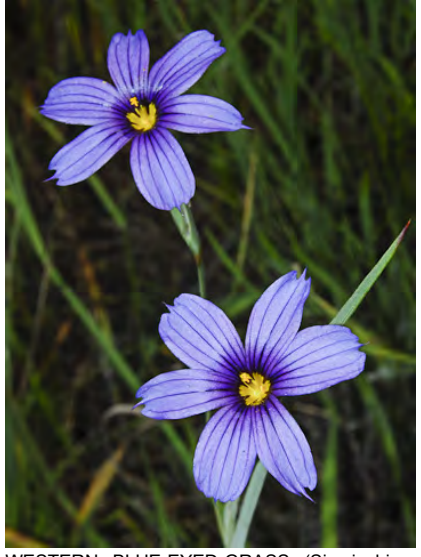
WESTERN BLUE-EYED-GRASS (Sisyrinchium bellum) Native Perennial - Iris Family - (Mar-May) - Common. Open, gen moist, grassy areas, woodland - Stem < 25" tall. Leaves iris-like. Petals 6, blue-purple with dark veins, 0.4-0.7" long.