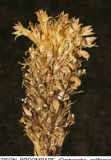
JEPSON BROOMRAPE (Orobanche californica subsp. jepsonii) Native Perennial - Broom-rape Family - (Jul-Sep) - Uncommon. Gen dry flats, slopes. Root parasite on sunflower family - Plant 4-14" tall. Flowers > 20, stalkless, lips 0.4-0.55" long, buff-colored.