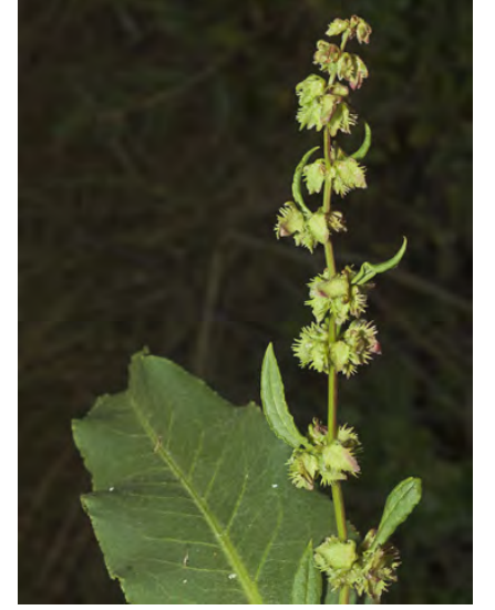
FIDDLE DOCK (Rumex pulcher) Naturalized Perennial - Buckwheat Family - (May–Sep) -Disturbed places, meadows, moist or dry habitats - Stem 8-24" long, branches widely spreading. Leaf blades 1.6-4" long, 1.2-2" wide. Valves w/2-5 teeth.