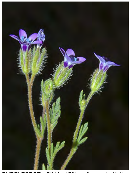
PURPLESPOT GILIA (Gilia clivorum) Native Annual - Phlox Family - (Feb–Jun) - Common. Open, grassy areas - Stem 2-12" tall, hairy, branched. Leaves narrowly linear-lobed. Flowers 0.25-0.3" long, tube yellow, purple-spotted. Flowering stem sticky.