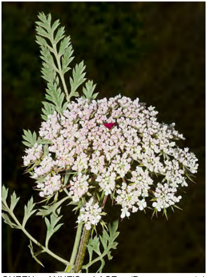
QUEEN ANNE'S LACE (Daucus carota) Naturalized Biennial - Carrot Family - (May–Sep) - Roadsides, disturbed places - Plant 6-48" tall. Umbels white to pinkish with central purple flower, stiff 3-forked bracts below. Strong carrot odor.