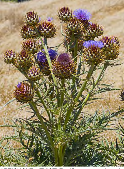
ARTICHOKE THISTLE (Cynara cardunculus subsp. flavescens) Naturalized Perennial -Sunflower Family - (Apr–Jul) - Disturbed places -Plant 1.6-8' tall. Artichoke head 1.6-6" diam, spine-tipped. Flowers blue or purple, 1.2-2" long. NOXIOUS weed.