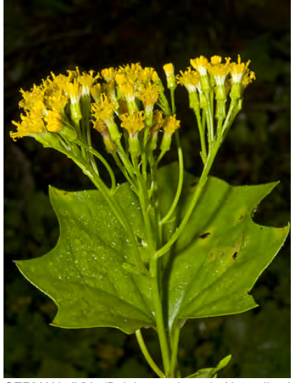
GERMAN IVY (Delairea odorata) Naturalized Perennial - Sunflower Family - (Nov-Mar) -Shady, ± disturbed places, riparian woodland, coastal scrub - Vine stem 3-20' long. Heads ~ 20 per cluster. Disk flowers bright yellow. NOXIOUS weed.