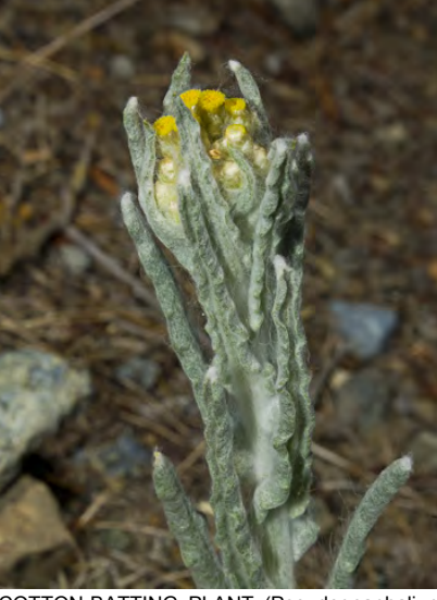
COTTON-BATTING PLANT (Pseudognaphalium stramineum) Native Annual - Sunflower Family - (Mar–Aug) - Many habitats, dunes, chaparral slopes, roadsides - Heads 0.16-0.2" long, female flowers > 0.08" long, pappus bristles free.