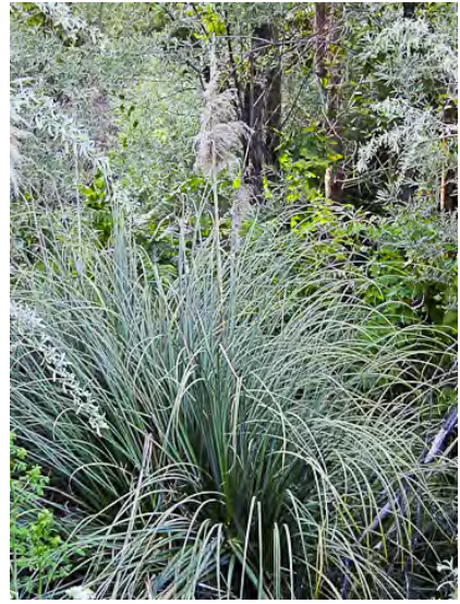
SMOOTH PAMPAS GRASS (Cortaderia selloana) Naturalized Perennial - Grass Family - (Sep–Mar) - Disturbed sites - Plant 6-13' tall. Leaf blades 0.1-0.5" wide, sheathes smooth. Cultivar, rarely escaped. INVASIVE weed.