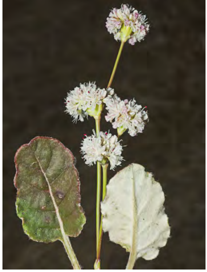
EAR-SHAPED WILD BUCKWHEAT (Eriogonum nudum var. auriculatum) Native Perennial - Buckwheat Family - (May-Oct) - Common. Sand or gravel - Plant 5-15 dm. Leaves on stem, curled. Inflor smooth. Flowers white to pink, smooth.