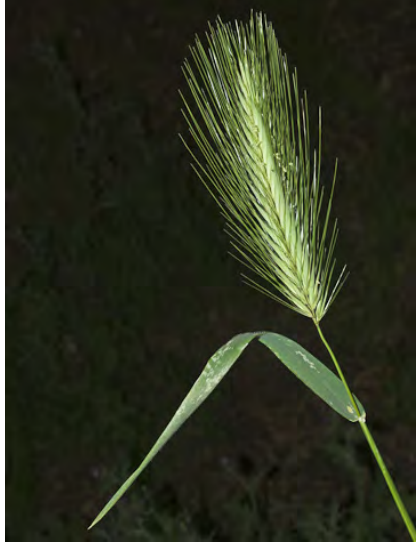
HARE BARLEY (Hordeum murinum subsp. leporinum) Naturalized Annual - Grass Family -(Feb–May) - Moist, gen disturbed sites. Common - Stem 12-43" tall. Central spikelet stalk ~0.06" long. Central floret << lateral florets. INVASIVE weed.