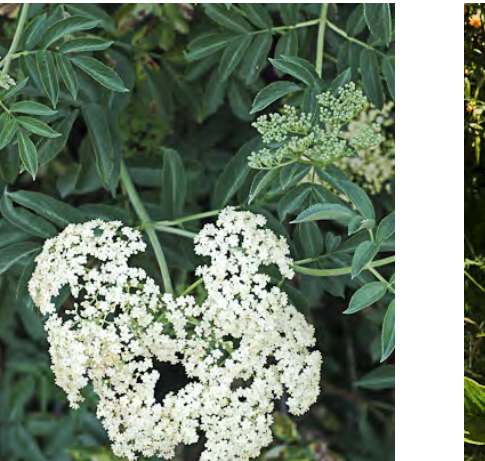
BLUE ELDERBERRY (Sambucus nigra subsp. caerulea) Native Perennial - Muskroot Family - (Mar–Sep) - Common. Streambanks, open places in forest - Shrub 7-26' tall. Flower cluster flat-topped, 1.6-13" diam, petals spreading. Fruits waxy blue-black.