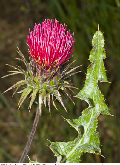
VENUS THISTLE (Cirsium occidentale var. venustum) Native Biennial - Sunflower Family -(May–Jul) - Disturbed areas, grassland, woodland - Plant 1.6-9.8' tall. Head bract cluster 0.6-2" tall, 0.6-3" diam. Flowers gen bright red-pink to red, 0.9-1.4" long.