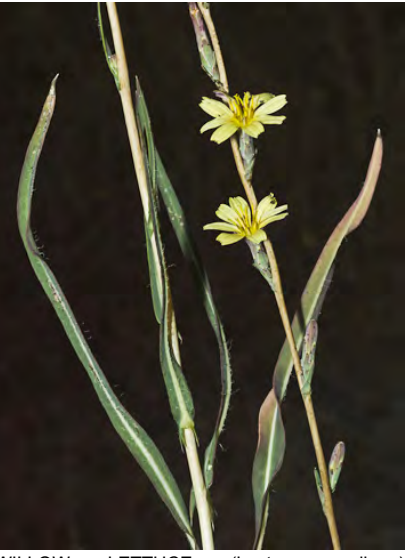
WILLOW LETTUCE (Lactuca saligna) Naturalized Annual - Sunflower Family -(Jul–Nov) - Roadsides, grassland - Stem 12-39" tall. Leaf lobes entire or few-toothed, no prickles underneath. Flowers 5-12, pale yellow, open in morning.