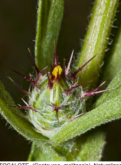
TOCALOTE (Centaurea melitensis) Naturalized Annual - Sunflower Family - (Apr–Jul) - Disturbed fields, open woodland - Plant 4-39", gray-hairy, resinous. Leaves 0.8-6" long. Flowers yellow, 0.4-0.8" long, bracts tipped w/purple spines. NOXIOUS weed.