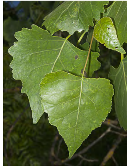
FREMONT COTTONWOOD (Populus fremontii subsp. fremontii) Native Perennial - Willow Family - (Mar–Apr) - Scattered. Alluvial bottomland, streamsides - Tree < 66' tall. Leaves heart-shaped to triangular, coarsely scalloped, blade 1.2-2.8" long.