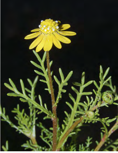
GLUE-SEED (Blennosperma nanum var. nanum) Native Annual - Sunflower Family - (Jan-May) -Open, grassy areas, often margins of seeps or vernal pools - Plant 1.2-5"+, succulent, branched. Leaf 1.2-2.4"+ long, 5-15 lobed. Flower bracts purple-tipped w/tuft of hairs.