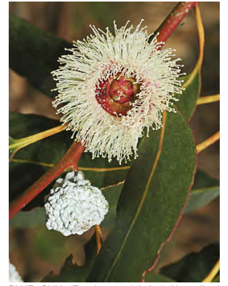
BLUE GUM (Eucalyptus globulus) Naturalized Perennial - Myrtle Family - (Oct–Jan) - Common. Disturbed areas - Tree < 200' tall. Flowers single, large, gen stemless. Leaves 4-12" long, 1-1.6" wide; used medicinally by Aboriginals. INVASIVE weed.