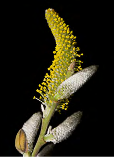
ARROYO WILLOW (Salix lasiolepis) Native Perennial - Willow Family - (Jan–Jun) - Common. Shores, marshes, meadows, etc - Shrub-tree, bark smooth. Leaf-like stipules. Leaf egg-shaped, waxy below. Fruit smooth, bract persistent, dark, stamens 2.