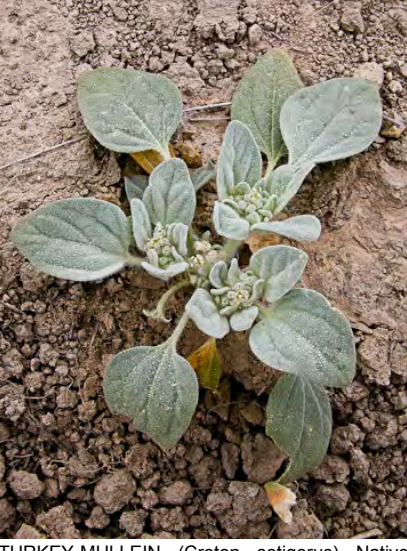
TURKEY-MULLEIN (Croton setigerus) Native Annual - Spurge Family - (May–Oct) - Dry, open, often disturbed areas - Plant < 8" tall, moundlike, covered w/long stiff hairs. Leaf blade 0.4-2" long, oval. TOXIC to livestock.