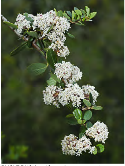
BUCKBRUSH (Ceanothus cuneatus var. cuneatus) Native Perennial - Buckthorn Family -(Feb-May) - Sandy to rocky flats, slopes, ridges -Shrub/tree < 10' tall. Leaves opposite on rigid twigs, w/single main vein. Flowers gen white.