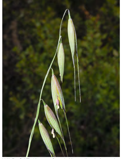
WILD OAT (Avena fatua) Naturalized Annual -Grass Family - (Apr-Jun) - Disturbed sites -Plants 1-5' tall. Spikelets 0.7-1.3" long. Low awn 1-1.6" long. Lemma tip bristles < 0.04" long. Seeds EDIBLE whole or ground for flour. INVASIVE weed.