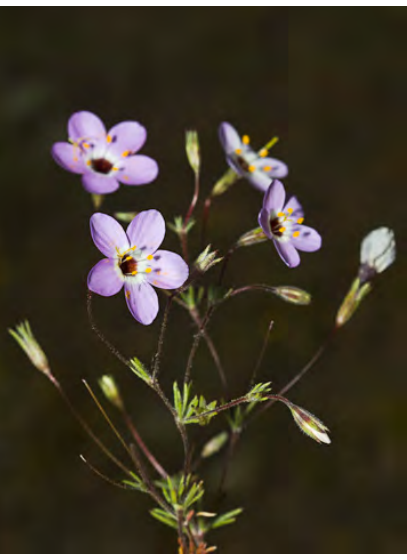
SERPENTINE LEPTOSIPHON (Leptosiphon ambiguus) Native Annual - Phlox Family -(Apr-May) - Grassy areas gen serpentine - Stem 0.4-0.8", thread-like. Diffuse. Corolla throat widely-widened. CNPS: FAIRLY ENDANGERED.