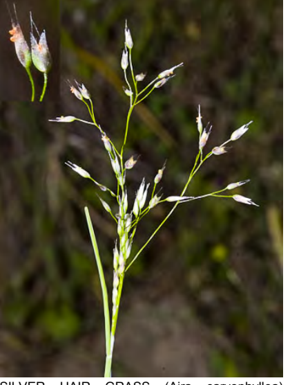
SILVER HAIR GRASS (Aira caryophyllea) Naturalized Annual - Grass Family - (Apr–Jun) -Sandy soils, open or disturbed sites - Flower cluster > 0.6" wide, diffuse with long slender branches. Spikelets about 0.1" long with 2 extended awns.