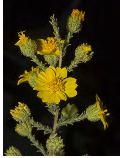
HEERMANN TARPLANT (Holocarpha heermannii) Native Annual - Sunflower Family -(May–Nov) - Grassland - Plant 0.2-1.2 m tall, densely very-short-hairy, glandular. Ray flowers 3-13, yellow. Disk flowers yellow to brown. Yellow anthers.