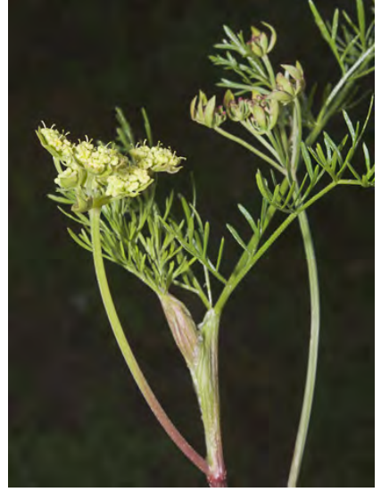
ALKALI DESERTPARSLEY (Lomatium caruifolium var. caruifolium) Native Perennial -Carrot Family - (Mar–May) - Wet, clay depressions, open grassland - Plant 6-18' tall, gen stemless. Leaves from base, linear segments, no swollen sheathes. Flowers bright yellow.