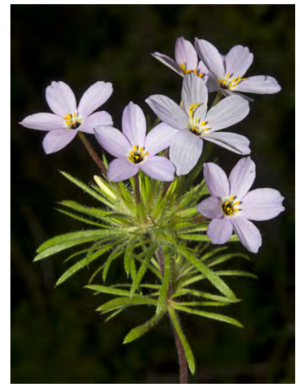
PINKLOBE LEPTOSIPHON (Leptosiphon androsaceus) Native Annual - Phlox Family -(Apr-Jun) - Open or shaded areas in woodland, chaparral - Plant 2-18", hairy. Flowers pink, bracted group, tube 0.4-1.3" long, lobes gen > 0.3" long.