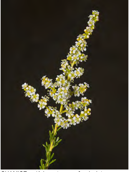
CHAMISE (Adenostoma fasciculatum var. fasciculatum) Native Perennial - Rose Family - (May–Jun) - Dry slopes, ridges, chaparral - Shrub or small tree < 13' tall. Flowers cream to white. Leaves narrow, shiny with flammable oils in warm weather.