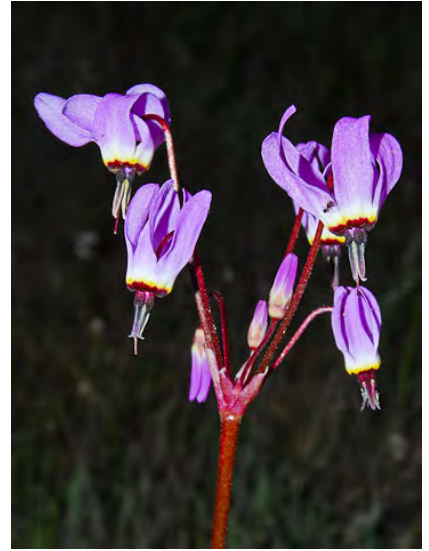
MOSQUITOBILLS SHOOTING STAR (Dodecatheon hendersonii) Native Perennial -Primrose Family - (Mar–Jul) - Gen in shady sites - Leaf blade length generally <2x width. Flower parts 4s or 5s. Filament tube solid black.