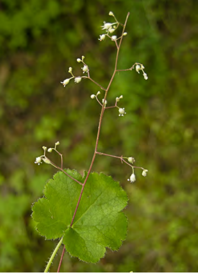
SMALL-FLOWER ALUMROOT (Heuchera micrantha) Native Perennial - Saxifrage Family - (Apr–Jul) - Moist, rocky banks and cliffs - Plant 4-40" tall. Leaf blade 0.8-4.7" long, 5-7 lobed, generally hairy. Petals white, ~ 0.1" long.