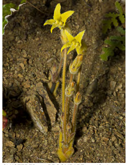
CLUSTERED BROOMRAPE (Orobanche fasciculata) Native Perennial - Broom-rape Family - (Apr–Jul) - Dry, gen bare places. Root parasite on various shrubs - Plant 2-8" tall. Flowers pink or yellow, 5-20 on long stems.