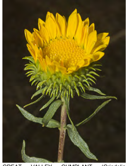
GREAT VALLEY GUMPLANT (Grindelia camporum) Native Perennial - Sunflower Family - (May–Nov) - Sandy or saline bottomland, roadsides - Stem non-woody, 2-8' tall, whitish. Leaves gen resinous. Head to 1.2" wide, bracts bend downward.