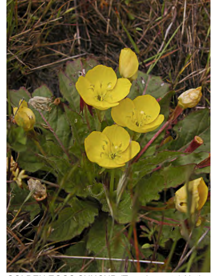
GOLDEN EGGS SUNCUP (Taraxia ovata) Native Perennial - Evening Primrose Family - (Mar–Jun) - Grassy fields, gen clay soil - Stemless. Leaf blade oval, 1.2-6" long w/long stalks. Flower stalks leafless. Petals yellow, 0.3-0.9" long. Ovary hidden.