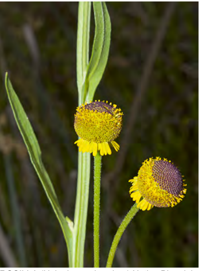
ROSILLA (Helenium puberulum) Native Biennial -Sunflower Family - (Jun-Aug) - Streambanks, seepage areas, lake margins - Plant 20-63". Flower head spherical, disk flowers ~0.1" long, yellow on sides, brown-purple on top; rays 0.15-0.4" long, point down.