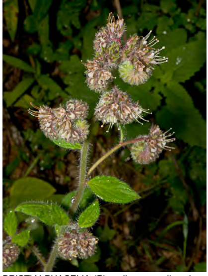
BRISTLY PHACELIA (Phacelia nemoralis subsp. nemoralis) Native Biennial-Perennial - Borage Family - (Apr-Jul) - Moist slopes, streambanks, mixed-evergreen forest - Short-lived. Upper leaves egg-shaped, lower divided. Flowers green-white, 0.16-0.2".