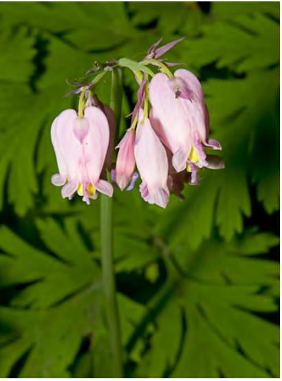
PACIFIC BLEEDING HEART (Dicentra formosa) Native Perennial - Poppy Family - (Mar–Jul) -Damp, shaded areas - Plant 8-18" tall. Leaves dissected, 8-20" long. Flowers heart-shaped, rose-pink, nodding, 2-30 per cluster, 0.5-1.2" long.