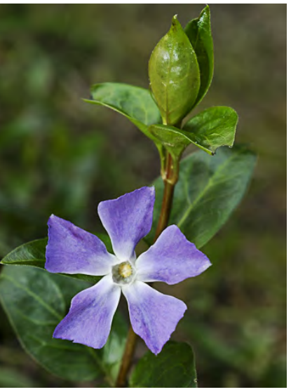
GREATER PERIWINKLE (Vinca major) Naturalized Perennial - Dogbane Family -(Mar-Jun(Jan)) - Coastal bluffs, sheltered places, esp along stream beds - Plant sprawling. Leaf blade ~ 2.8" long, oval. Flower purple-blue, 1.2-2" wide at top. INVASIVE weed.