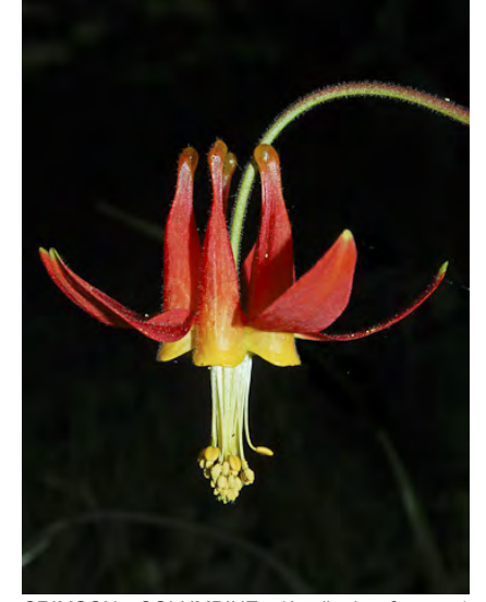
CRIMSON COLUMBINE (Aquilegia formosa) Native Perennial - Buttercup Family - (Apr–Sep) -Streambanks, seeps, moist places, chaparral, oak woodland, mixed-evergreen or conifer forests - Flowers about 2" long, yellow with red sepals & spurs.