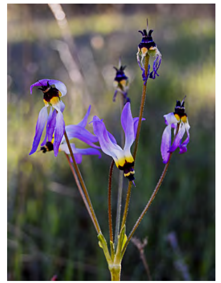
PADRE SHOOTING STAR (Dodecatheon clevelandii subsp. patulum) Native Perennial - Primrose Family - (Mar–May) - Moist places, often on serpentine or in ± alkaline sites - Leaf blade length >2x width. Flowers often white. Filiment tube wlight spots below anthers.