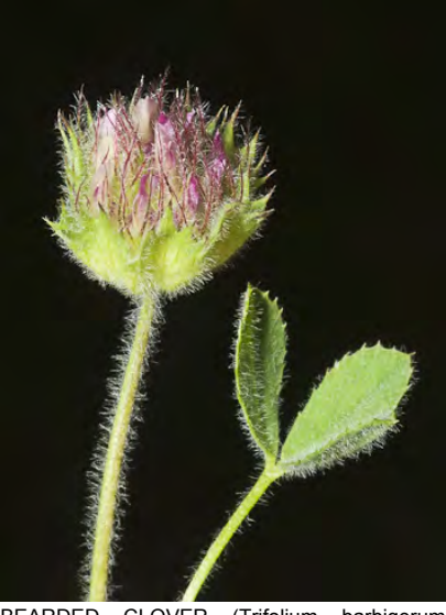
BEARDED CLOVER (Trifolium barbigerum) Native Perennial - Pea Family - (Apr–Jun) - Wet meadows, open, disturbed areas - Leaflets 0.6-1" long. Head 0.2-1" wide, gen bristly. Flowers pink-purple, 0.2-0.4" long.