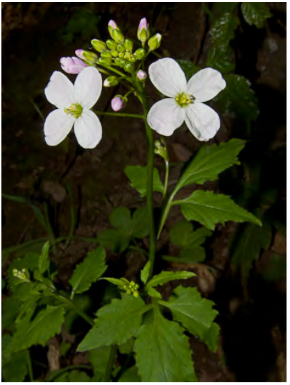
MILK MAIDS (Cardamine californica) Native Perennial - Mustard Family - (Jan–May) - Gen shaded sites, canyons, woodland. One of first spring flowers - Stem 10-24" long. Leaves lobed to compound w/sharp teeth. Petals white or pale rose, 0.3-0.5" long.