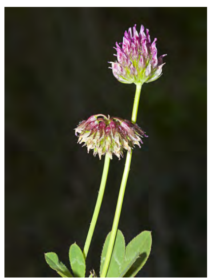
FOOTHILL CLOVER (Trifolium ciliolatum) Native Annual - Pea Family - (Mar–Jun) - Locally common. Grassland, chaparral, disturbed areas -Flower head 0.3-0.8" wide w/vestigial bract. Flowers pink to purple, soon reflexed, bracts w/short, flat bristles.