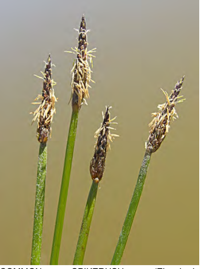
COMMON SPIKERUSH (Eleocharis macrostachya) Native Perennial - Sedge Family -(Spring-summer) - Common. Fresh to brackish wetland - Stem 8-39" tall, 0.06-0.1" wide. Spikelet 0.2-1.6" long, 0.08-0.2" wide, style 2-branched.