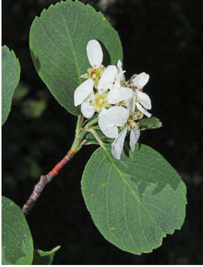
UTAH SERVICE-BERRY (Amelanchier utahensis) Native Perennial - Rose Family -(Apr–Jun) - Open, rocky slopes, canyons, banks of creeks, deserts, conifer forest - Shrub-small tree 2-16'. Leaves deciduous, toothed along outer half of blade.