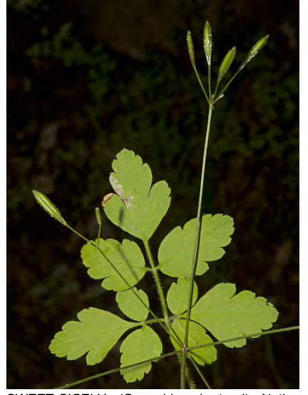
SWEET-CICELY (Osmorhiza berteroi) Native Perennial - Carrot Family - (Apr–Jul) - Conifer forest, woodland, disturbed areas - Plant 12-47". Leaflets in 3s, serrate to irreg lobed. Flower white. Fruit 0.5-1", upward pointing barbs, splitting apart below.