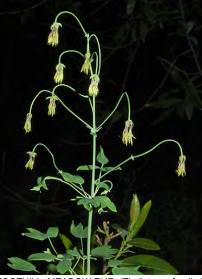
FOOTHILL MEADOW-RUE (Thalictrum fendleri var. polycarpum) Native Perennial - Buttercup Family - (Mar–Jun) - Moist, open to shaded places, woodland, forest - Plant 2-6'+ tall, male or female. Leaf 1-4x divided, 3-18" long, segments 0.3-0.8" long. No petals.