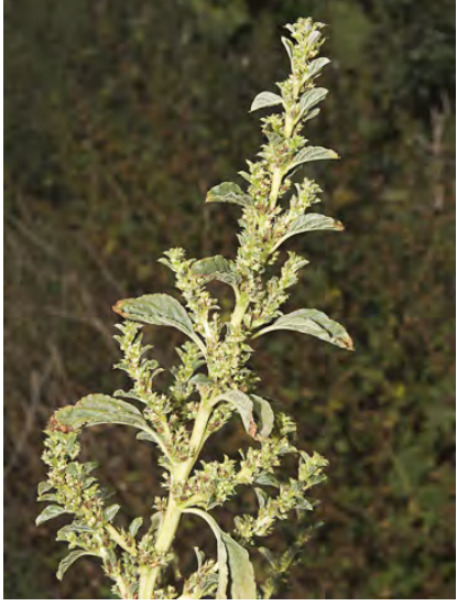
TUMBLEWEED (Amaranthus albus) Naturalized Annual - Amaranth Family - (Jun–Oct) - Disturbed areas, roadsides, riverbanks, sandy places, agricultural fields - Plant upright, bushy. Stem pale. Flower clusters <= 0.6^{\circ} long, at base of leaves. Flowers with 3 "petals".