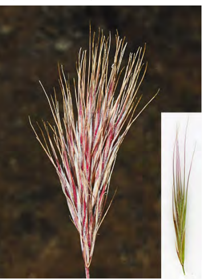
RED BROME (Bromus madritensis subsp. rubens) Naturalized Annual - Grass Family -(Mar-Jun) - Disturbed areas, roadsides - Plant 4-20". Flower cluster condensed, branches obscure, < spikelets. Stem & sheathes hairy. INVASIVE weed.