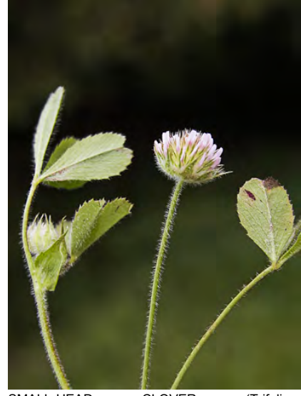
SMALL-HEAD CLOVER (Trifolium microcephalum) Native Annual - Pea Family - (Apr-Aug) - Streambanks, moist, disturbed areas, roadsides, serpentine, conifer forest - Hairy. Head bract cup-like. Flowers pink to lavender, calyx lobes smooth-edged, > flowers.