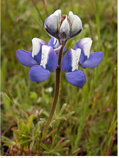
SKY LUPINE (Lupinus nanus) Native Annual -Pea Family - (Mar–Jun) - Abundant. Open or disturbed areas - Plant 4-24" tall, hairy. Flowers blue to pink to white, 0.2-0.6" long; banner as wide as long. Flower stalk gen > 0.12" long.