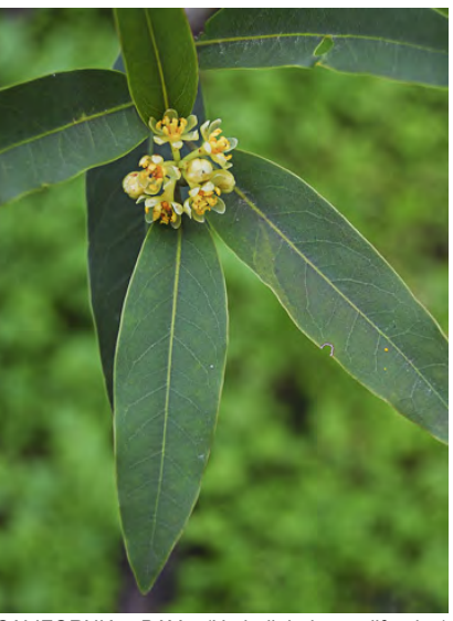
CALIFORNIA BAY (Umbellularia californica) Native Perennial - Laurel Family - (Nov–May) -Common. Canyons, valleys, chaparral - Tree < 150' tall. Leaf 1.2-4", 0.6-1.2" wide, aromatic. Cluster of 5-10 small, yellow or yellow-green flowers. Fruit 0.8-1" diam.