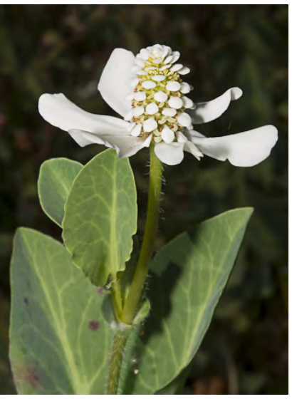
YERBA MANSA (Anemopsis californica) Native Perennial - Lizard's-tail Family - (Mar–Sep) -Common. Saline or alkaline soil, wet or moist areas, seeps, springs - Stems 3-32" long. 4-9 petal-like bracts 0.2-1.4" long, white often tinged red. Was used medicinally.