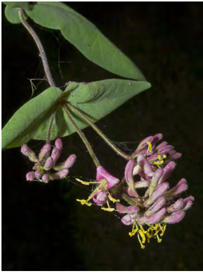
HAIRY VINE HONEYSUCKLE (Lonicera hispidula) Native Perennial - Honeysuckle Family - (May–Jun) - Canyons, streamsides, woodland -Shrub sprawling-climbing, 6-10' long, short-hairy. Flower cluster densely sticky. Flowers pink, 0.5-0.6" long, sticky-hairy.