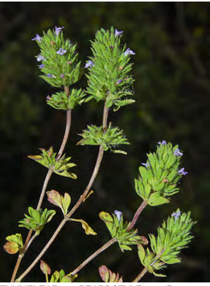
THYMELEAF BEARDSTYLE (Pogogyne serpylloides) Native Annual - Mint Family -(Mar–Jun) - Grassy, brushy areas - Plant inconspicuous. Stem 1-8" long, low-growing. Flowers 0.1-0.2" long, lavender, in dense clusters.