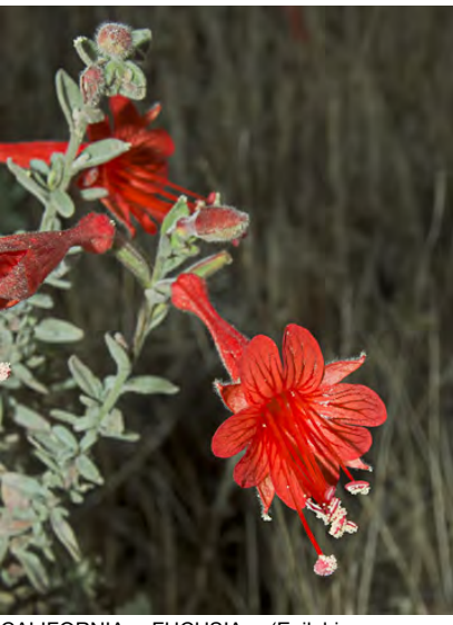
CALIFORNIA FUCHSIA (Epilobium canum subsp. canum) Native Perennial - Evening Primrose Family - (Jun-Dec) - Dry slopes, ridges - Plant hairy, gen sticky with a woody base. Leaf 0.3-2.8" long, gray to green. Flowers red-orange, floral tube 0.8-1.2" long.