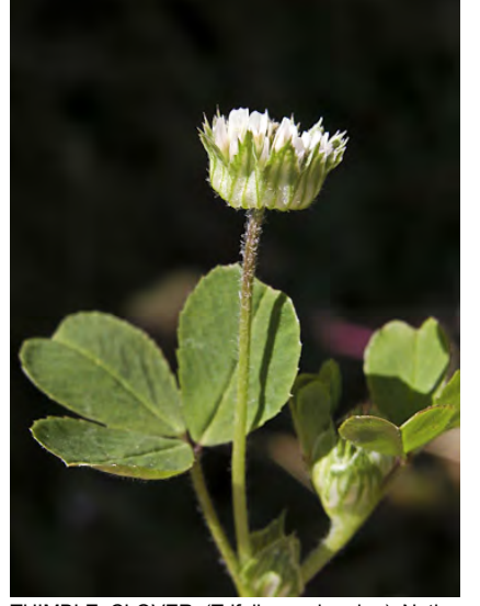
THIMBLE CLOVER (Trifolium microdon) Native Annual - Pea Family - (Mar–Jun) - Common locally. Open, moist or dry, gen disturbed areas -Short-hairy. Head bract w/flat base. Flowers white to pink. Calyx lobes < 1/2 flower tube length, < flowers.