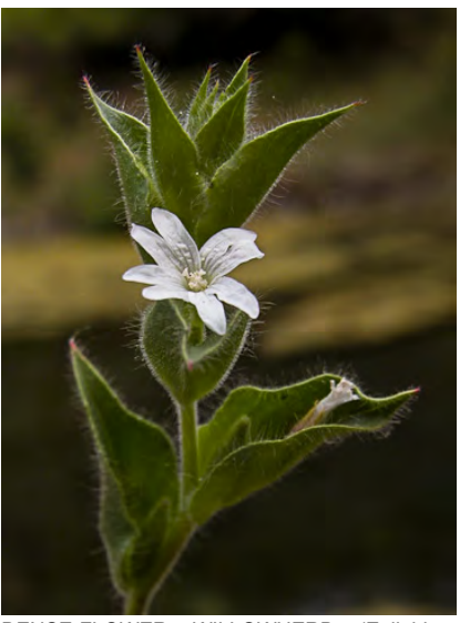
DENSE-FLOWER WILLOWHERB (Epilobium densiflorum) Native Annual - Evening Primrose Family - (May–Oct) - Streambanks, outwashes, seasonal moist flats - Plant 2-60" tall, soft-hairy. Petals 0.1-0.4", rose-purple to white. Fruit not tapered.