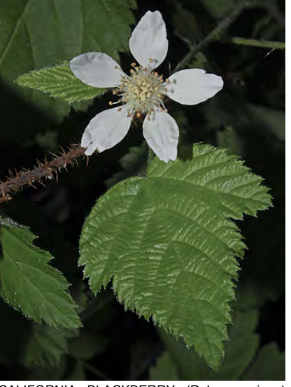
CALIFORNIA BLACKBERRY (Rubus ursinus) Native Perennial - Rose Family - (Mar–Jul) -Open, disturbed areas - Stem round, bristly/prickly. Leaves simple to 3 leaflets, underside green. Plants unisexual. Petals 0.24-0.6" long, white. Blackberry-type fruit.