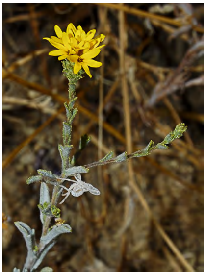
VALLEY LESSINGIA (Lessingia pectinata var. tenuipes) Native Annual - Sunflower Family -(May-Oct) - Coastal scrub, woodland, pine forest, chaparral, occ sandy soil - Plant 2-28", sticky. Flowers yellow w/purple-brown band, rayless.