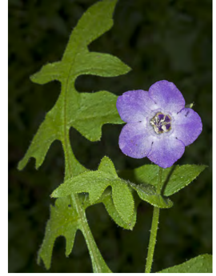
FIESTA FLOWER (Pholistoma auritum var. auritum) Native Annual - Borage Family -(Mar–Jun) - Ocean bluffs, talus slopes, woodland, streambanks, canyons - Stem 8-47" tall. Leaf lobes 7-13. Flowers 0.3-0.6" long, 0.4-1.2" wide, purple, with bractlets.