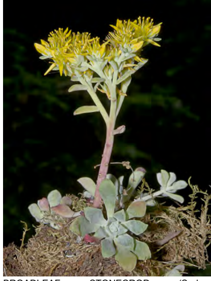
BROADLEAF STONECROP (Sedum spathulifolium) Native Perennial - Stonecrop Family - (Apr-Aug) - Outcrops, often in shade - Plant mat-forming. Basal leaves spoon-shaped, forming persistent rosettes. Petals ~0.3" long, yellow.