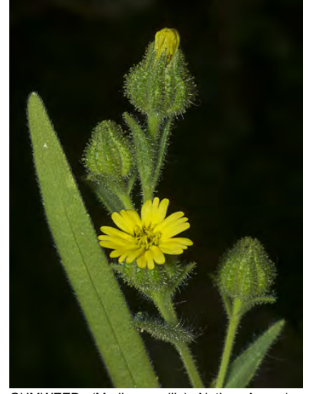
GUMWEED (Madia gracilis) Native Annual -Sunflower Family - (Apr-Aug) - Open, semi-shaded or disturbed sites, many habitats, incl serpentine - Plant 2.4-40" tall, hairy, upper half sticky. Leaf 0.4-4" long. Rays yellow, 3-10, 0.06-0.3" long. Bracts 6-10 mm tall.