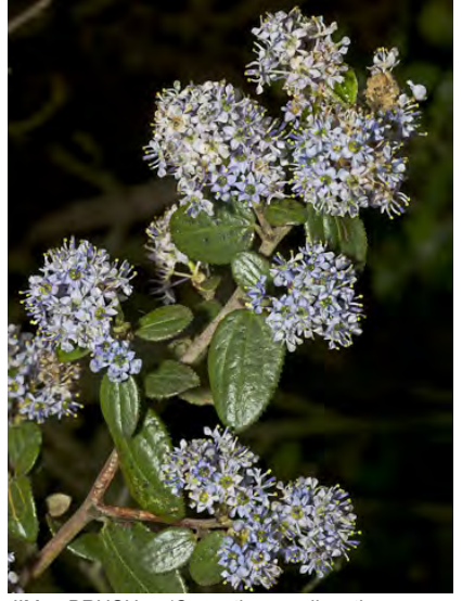
JIM BRUSH (Ceanothus oliganthus var. sorediatus) Native Perennial - Buckthorn Family -(Jan–May) - Slopes, ridges, chaparral, conifer forest - Shrub/tree < 11.5' tall. Twigs red-brown. Leaves alternate, 3 main veins. Flowers blue, purple-blue or whitish.