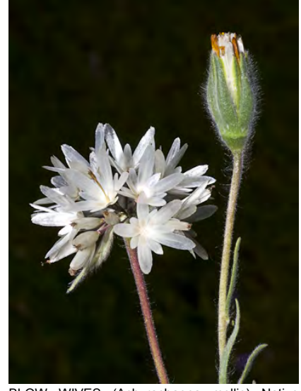
BLOW WIVES (Achyrachaena mollis) Native Annual - Sunflower Family - (Mar–Jun) -Common. Grassy sites, often clay soils - Plant 2-24" tall, soft-hairy. Flowers yellow turning red, 0.1-0.5" wide, extend < 0.1" beyond green bracts. Showy, flat scales attached to seeds.