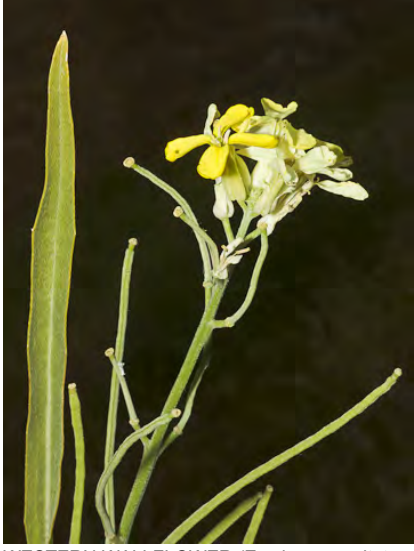
WESTERN WALLFLOWER (Erysimum capitatum var. capitatum) Native Biennial - Mustard Family - (Mar–Sep) - Common. Open areas, woodland, sandy areas, chaparral - Petals orange to yellow, fruit 1-4.3" long.