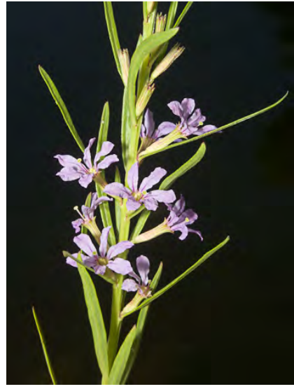
CALIFORNIA LOOSESTRIFE (Lythrum californicum) Native Perennial - Loosestrife Family - (Apr–Sep) - Marshes, pond and stream margins - Stem 8-24" tall. Leaves 0.4-2.8" long, gray-smooth, linear. Petals purple, 0.2-0.3" long; 2 style forms.