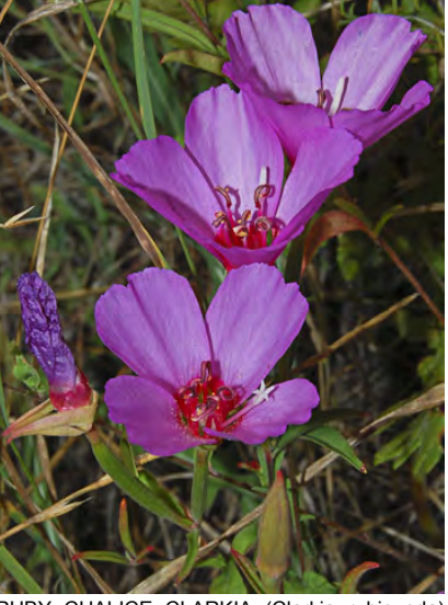
RUBY CHALICE CLARKIA (Clarkia rubicunda) Native Annual - Evening Primrose Family -(May-Aug) - Openings in woodland, forest, chaparral near coast - Stem < 5' long. Buds erect. Petals 0.4-1.2", rose w/red base. Sepals united. Stigma > anthers.