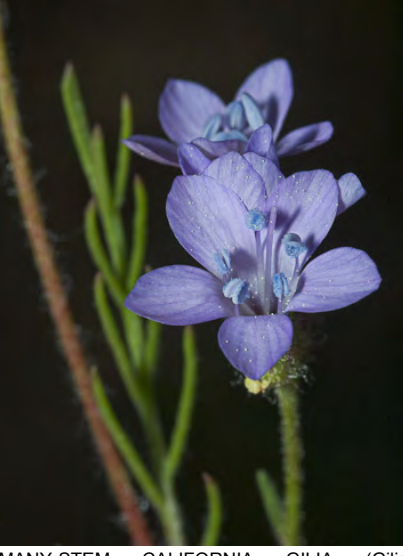
MANY-STEM CALIFORNIA GILIA (Gilia achilleifolia subsp. multicaulis) Native Annual - Phlox Family - (Feb–Jun) - Open or shaded, gen grassy places, sandy or rocky soil - Leaves linear-lobed. Flowers white to lavender, 0.2-0.4" long, not in heads.