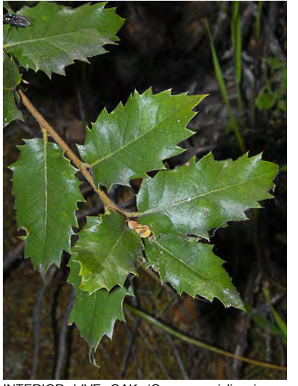
INTERIOR LIVE OAK (Quercus wislizeni var. wislizeni) Native Perennial - Oak Family -(Mar-May) - Interior canyons, slopes, pine/oak woodland - Tree < 75'. Leaf blades 0.8-2" long, hairless, flat. Acorns on 2nd year twigs, shell woolly inside.