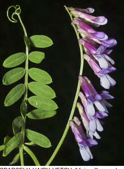
SPARSELY HAIRY VETCH (Vicia villosa subsp. varia) Naturalized Annual-Biennial - Pea Family - (Mar–Jun) - Grassland, roadside, disturbed areas - Stems Wfew hairs. Flowers 10-20, blue-purple to white, 0.4-0.55" long. Lower bract lobes 0.04-0.1" long.