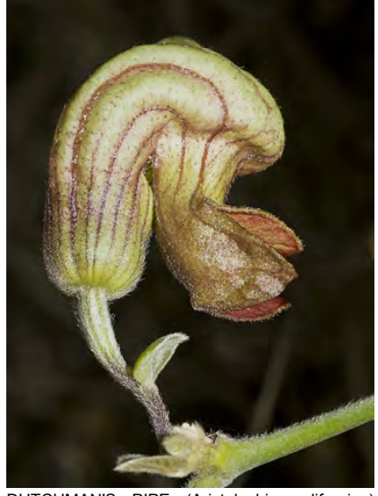
DUTCHMAN'S PIPE (Aristolochia californica) Native Perennial - Pipevine Family - (Jan–Apr) -Streamsides, forest, chaparral - Soft-hairy vine. Stem < 16' long. Leaf blades 1.2-5.9" long. Flower green to pale brown with purple veins, 0.8-1.6" long, U-shaped.