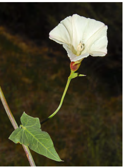
CLIMBING MORNING-GLORY (Calystegia purpurata subsp. purpurata) Native Perennial -Morning-glory Family - (May–Jun) - Chaparral, coastal scrub - Stem strongly climbing. Leaf triangular, lobes strongly angled. Bractlets smooth, small, distant.