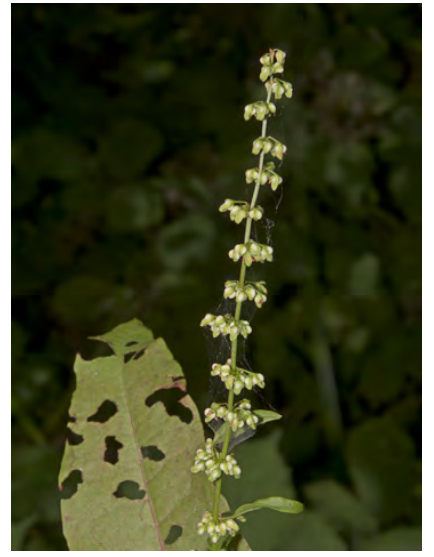
GREEN DOCK (Rumex conglomeratus) Naturalized Perennial - Buckwheat Family -(May–Aug) - Common. Moist places - Stem 12-32" tall, unbranched below. Flower cluster open. Fruit valves ~0.1" long, scarcely winged around the 3 tubercles, smooth edged.