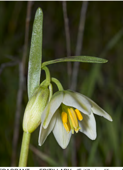
FRAGRANT FRITILLARY (Fritillaria liliacea) Native Perennial - Lily Family - (Feb–Apr) -Heavy soil, open hills, fields near coast - Stem 4-14" tall. Leaves 2-20, 1.4-4.7" long. Petals white, striped green, 0.4-0.6" long. CNPS: FAIRLY ENDANGERED.