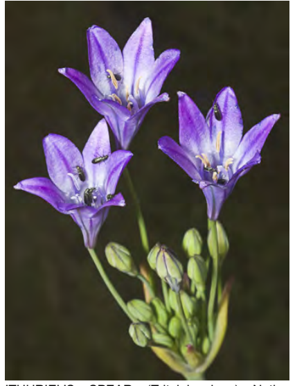
ITHURIEL'S SPEAR (Triteleia laxa) Native Perennial - Brodiaea Family - (Apr–Jun) -Common. Open forest, conifer or foothill woodland, grassland on clay soil - Flower stem 4-28". Leaves 8-16", 0.16-1" wide. Flowers blue, blue-purple or white, 0.7-1.9" long.