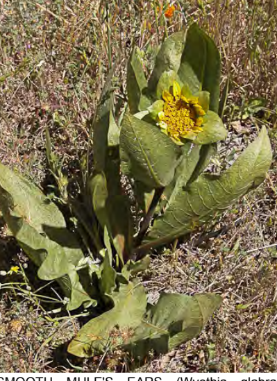
SMOOTH MULE'S EARS (Wyethia glabra) Native Perennial - Sunflower Family - (Mar–Jun) -Gen shady sites - Plant 4-16" tall, shiny green, no woolly hairs. Leaf basal blades 10-18" long, lance-shaped to oval, shiny. Ray flowers 1-2" long.