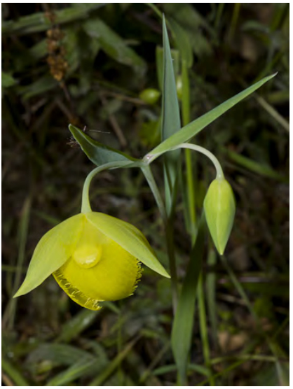
MOUNT DIABLO FAIRY-LANTERN (Calochortus pulchellus) Native Perennial - Lily Family -(Apr-Jun) - Wooded slopes, rarely chaparral, gen n aspect - Stem 4-12", gen branched. Petals light yellow, 1-1.3", sparsely hairy inside. CNPS: FAIRLY ENDANGERED.