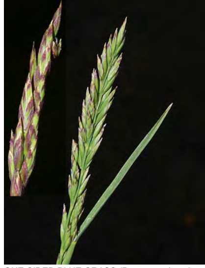
ONE-SIDED BLUE GRASS (Poa secunda subsp. secunda) Native Perennial - Grass Family - (Mar-Aug) - Common. Dry slopes to saline/alkaline meadows to alpine - Plant 6-40" tall, densely tufted. Flower clusters congested. Spikelets gen 0.3-0.4" long. Lemmas 0.16-0.2" long, backs rounded.