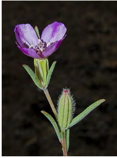
FOUR-SPOT (Clarkia purpurea subsp. quadrivulnera) Native Annual - Evening Primrose Family - (Apr–Aug) - Common. Open, grassy or shrubby places - Buds erect. Petals < 0.6", lavender to dark red. Ovary 8-grooved. Sepals 1's or 2's.