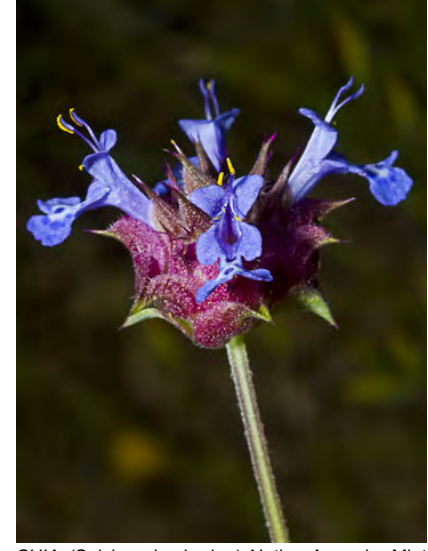
CHIA (Salvia columbariae) Native Annual - Mint Family - (Mar–Jun) - Dry, disturbed sites, chaparral, coastal-sage scrub - Plant 4-20" tall. Leaf 0.8-4" long, many 2x divided. Flower cluster head-like, 1-2 on bare stem. Flowers blue, tubes 6-8 mm long.