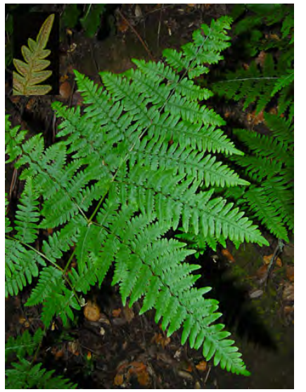
BRACKEN FERN (Pteridium aquilinum var. pubescens) Native Perennial - Bracken Family - -- Pastures, woodland, meadows, hillsides, partial to full sun - Leaf blades widely-triangular, gen 0.5-5' long, gen 3x divided, hairy underneath.