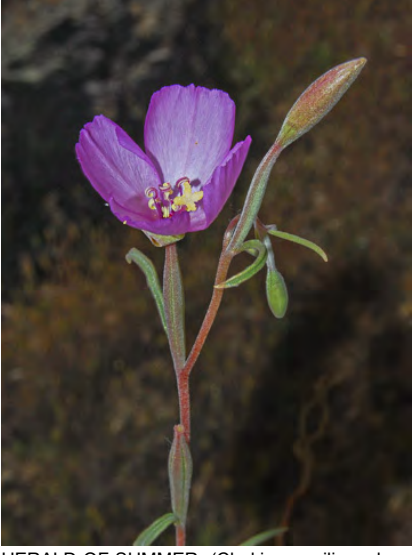
HERALD-OF-SUMMER (Clarkia gracilis subsp. gracilis) Native Annual - Evening Primrose Family - (Apr–Jul) - Common. Openings in woodland, forest - Plant < 35". Buds nodding. Petals 0.2-0.9" long, pink. Stigma = anthers. Ovary 4-grooved. Sepals united.