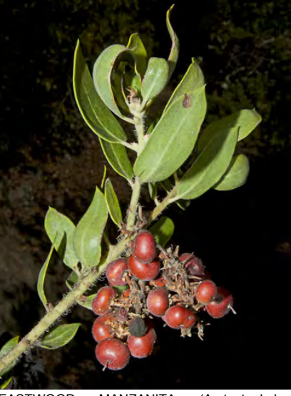
EASTWOOD MANZANITA (Arctostaphylos glandulosa subsp. glandulosa) Native Perennial - Heath Family - (Jan-Apr) - Chaparral, conifer forest - Shrub 3-13' tall. Twigs w/gland-tipped hairs, leafy bracts, 0.1-0.2" leaf stalk, burl. Upper leaf surface not shiny.