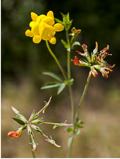
BIRD'S-FOOT TREFOIL (Lotus corniculatus) Naturalized Perennial - Pea Family - (Jun–Sep) -Open, disturbed areas - Leaflets 5, 0.16-0.9" long. Flower cluster 3-7 flowered on0.6-4.7" stalk. Flowers bright yellow, 0.4-0.55" long, banner often reddish.