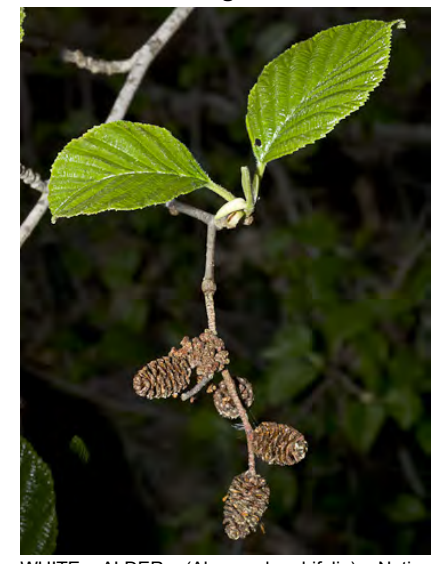
WHITE ALDER (Alnus rhombifolia) Native Perennial - Birch Family - (Apr–Jun) - Along permanent streams - Tree. Leaves flat, not rusty underneath, margins serrate, not rolled under. Female flowers cone-like. Wood used for furniture and for smoking meats.