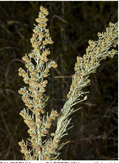
CALIFORNIA SAGEBRUSH (Artemisia californica) Native Perennial - Sunflower Family - (Aug-Nov) - Coastal scrub, chaparral, open woodland - Shrub 2-8.5' tall, rounded. Leaves 0.4-4", hairy, thread-like, It green to gray. Flower heads < 5 mm wide. Sage-scented.