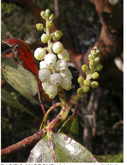
PACIFIC MADRONE (Arbutus menziesii) Native Perennial - Heath Family - (Mar–May) - Conifer, oak forests - Tree < 130' tall, evergreen, peeling red bark. Leaf blades < 5" long. Flowers yellow-white or pink, < 3.1" long. Berries red, < 0.5" diam, round.