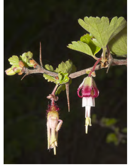
HILLSIDE GOOSEBERRY (Ribes californicum var. californicum) Native Perennial - Gooseberry Family - (Feb–Mar) - Forest openings, woodland - Shrub < 5' tall. Leaf blades 0.4-1.2" long, not sticky. Sepals greenish, petals 0.12" long, white.