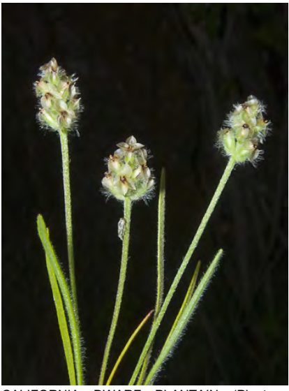
CALIFORNIA DWARF PLANTAIN (Plantago erecta) Native Annual - Plantain Family - (Mar-May) - Sandy, clay, serpentine soil; grassy slopes, flats, open woodland - Leaf 1.2-5" long, linear, hairy. Flowers + stem 1.2-12" tall, cluster 0.2-1.2" long.