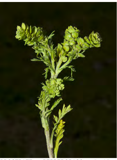
PROSTRATE PEPPERGRASS (Lepidium strictum) Naturalized Annual - Mustard Family - (Apr–Jun) - Uncommon. Disturbed areas, woodland, slopes - Stem 2.8-6.7", gen crawling. Leaves pinnately lobed. Flower cluster crowded, stallk < fruit, sepals stay.