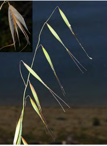
SLENDER WILD OAT (Avena barbata) Naturalized Annual - Grass Family - (Mar–Jun) -Disturbed sites - Plants gen 24-32". Spikelets 0.8-1.2" long. Awns 0.8-1.8" long. Lemma tip bristles >= 0.1" long. Seeds EDIBLE whole or ground for flour. INVASIVE weed.