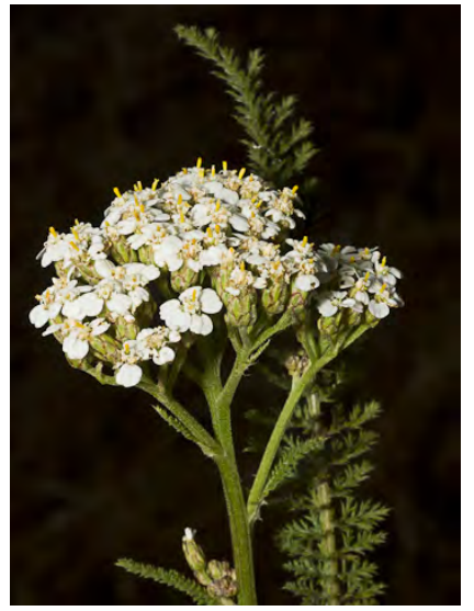
YARROW (Achillea millefolium) Native Perennial - Sunflower Family - (Apr–Sep) - Many habitats -Plant 4"-7' tall. Stem white-hairy. Leaves finely dissected. Flower cluster flat-topped. Flowers white to pink. Widely used in folk medicine.