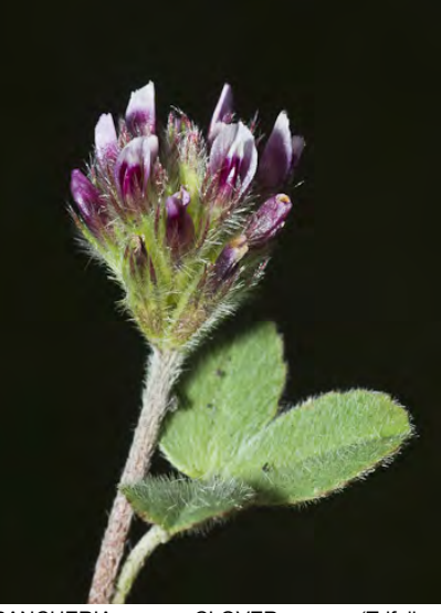
RANCHERIA CLOVER (Trifolium albopurpureum) Native Annual - Pea Family -(Mar–Jun) - Abundant. Dunes, grassland, wet meadows, slopes, disturbed areas, etc - No head bract. Flowers purple + white, 0.2-0.3", no stalk. Flower bracts hairy, teeth linear, = flowers.