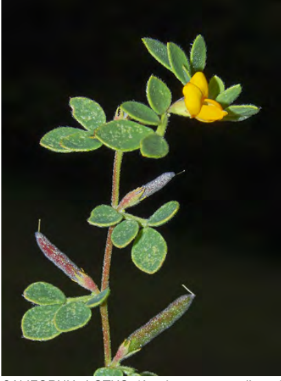
CALIFORNIA LOTUS (Acmispon wrangelianus) Native Annual - Pea Family - (Mar–Jun) -Abundant. Coastal bluffs, chaparral, disturbed areas - Low growing. Flowers yellow aging red, 0.2-0.4" long, almost stemless. Bract lobes same length as flower tube.