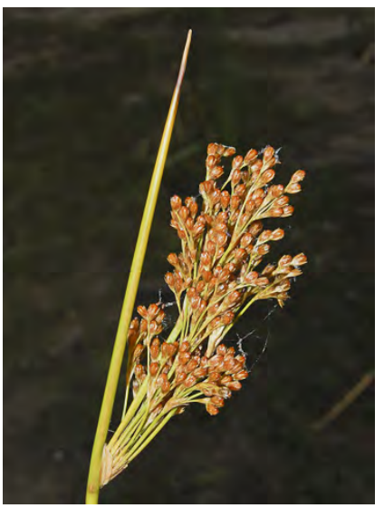
BALTIC RUSH (Juncus balticus subsp. ater) Native Perennial - Rush Family - (Jul-Nov) -Moist to \pm dry sites - Stem 14-43" tall, round, not twisted. No leaf blade. Flowers generally 0.1-0.2" long.