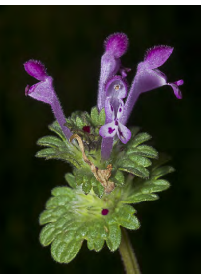
CLASPING HENBIT (Lamium amplexicaule) Naturalized Annual-Biennial - Mint Family -(Apr-Sep) - Disturbed sites, cult or abandoned fields - Stem 4-16" long. Leaf blades 0.4-1" long, upper stalkless. Flowers red-purple, gen 0.4-0.7" long.