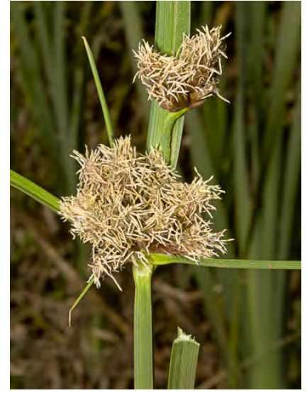
OLNEY'S THREE-SQUARE BULRUSH (Schoenoplectus americanus) Native Perennial -Sedge Family - (Summer) - Mineral-rich or brackish marshes, shores, fens, springs - Stem 1.2-8.2' tall, sharply 3-angled, not leafy. Flower cluster head-like.