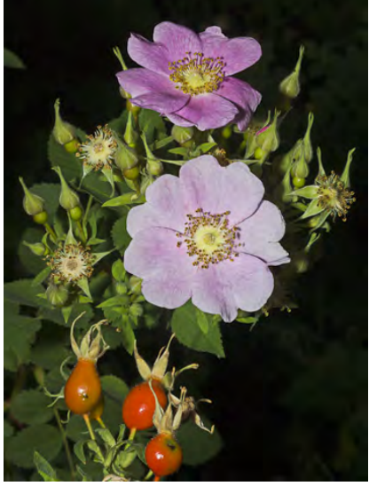
CALIFORNIA ROSE (Rosa californica) Native Perennial - Rose Family - (Feb–Nov) - Gen ± moist areas in sun, esp streambanks - Shrub 2.6-8.2' tall withick curved spines, forming thickets. Petals pink, 0.6-1" long; sepals unlobed.