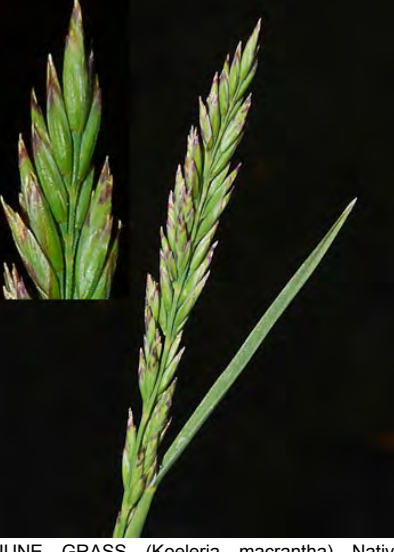
JUNE GRASS (Koeleria macrantha) Native Perennial - Grass Family - (May–Jul) - Dry, open sites, clay to rocky soils, shrubland, woodland, conifer forest - Stem 8-32" long. Flower cluster condensed, shiny, branches short-hairy. Spikelet ~0.2" long, no awns.