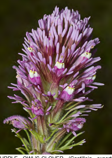
PURPLE OWL'S-CLOVER (Castilleja exserta subsp. exserta) Native Annual - Broom-rape Family - (Mar–May) - Open fields, grassland -Plant sticky, short-hairy. Flower cluster tipped white, pale yellow or rose. Flower upper lip hooked, fuzzy.