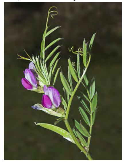
NARROW-LEAVED VETCH (Vicia sativa subsp. nigra) Naturalized Annual - Pea Family -(Mar–Jun) - Roadsides, disturbed areas, grassland, open areas in oak and riparian woodlands - Flowers 1-2 at leaf bases, pink-purple to white, 0.4-0.7" long. Leaflets 0.2-0.3" wide.