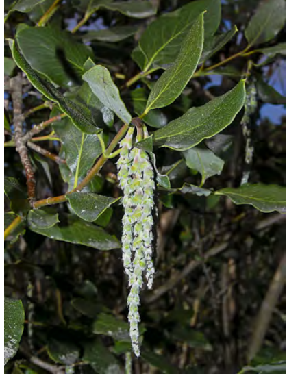
GREEN-LEAF SILK TASSEL (Garrya fremontii) Native Perennial - Silk Tassel Family - (Jan-Apr) - Chaparral, foothill woodland, montane forest -Shrub < 10' tall. Leaves gen hairless below, not wavy-margined. Fruit smooth or w/hairy tip.