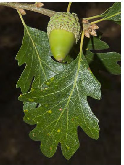
VALLEY OAK (Quercus lobata) Native Perennial - Oak Family - (Mar–Apr) - Slopes, valleys, savanna - Tree < 115' tall, deciduous. Leaves 2-5" long, not leathery, deeply lobed, lobes without bristles. Acorns 1.2-2" long, slender, cup 0.4-1.2" deep.