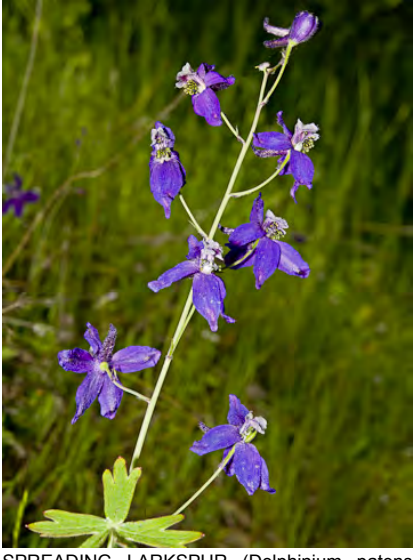
SPREADING LARKSPUR (Delphinium patens subsp. patens) Native Perennial - Buttercup Family - (Mar–Jun) - Grassland, open woodland -Stem 4-35" long. Leaves glabrous, divided into few-toothed lobes. Flowers few, bright or dark blue-purple.