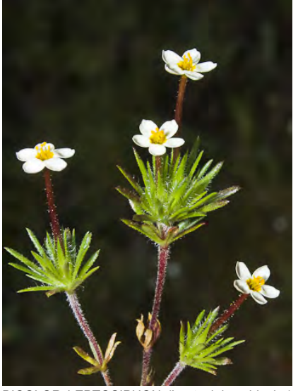
BICOLOR LEPTOSIPHON (Leptosiphon bicolor) Native Annual - Phlox Family - (Mar–Jun) -Common. Open, grassy areas, chaparral, woodland - Plant 0.8-8.3" tall, hairy. Flower lobes ~0.1" long, pink or white; tube red; stigma <=0.02" long.