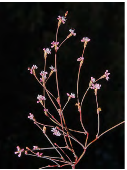
TIBURON BUCKWHEAT (Eriogonum luteolum var. caninum) Native Annual - Buckwheat Family - (May–Oct) - Serpentine - Plant 2-12" tall. Leaf blades wide. Flowers <= 0.1" long, reddish, mostly terminal. CNPS: FAIRLY ENDANGERED.