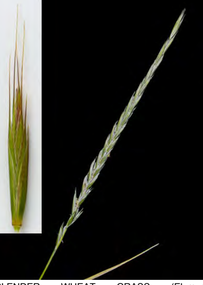
SLENDER WHEAT GRASS (Elymus trachycaulus subsp. trachycaulus) Native Perennial - Grass Family - (Jun-Aug) - Dry to moist, open areas, forest, woodland - Tufted. Stem 1-5' tall. Spikelet 0.4-0.8" long, 1 per node. Lemma awn < 0.3" long.