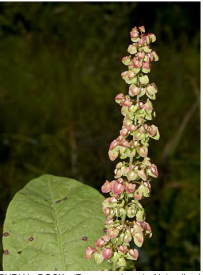
CURLY DOCK (Rumex crispus) Naturalized Perennial - Buckwheat Family - (All year) -Abundant. Disturbed places - Stem 16-39" tall. Flower cluster dense, valves 0.2-0.24", winged around tubercles, smooth edged. 1 tubercle enlarged. INVASIVE.