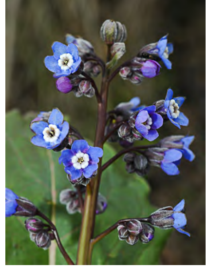
GRAND HOUND'S TONGUE (Cynoglossum grande) Native Perennial - Borage Family -(Feb–May) - Chaparral, woodland - Stem 1-3'. Leaf stalk 3-6". Leaf blade 3-6" cm long, broadly oval. Flowers bright blue w/inner white teeth.