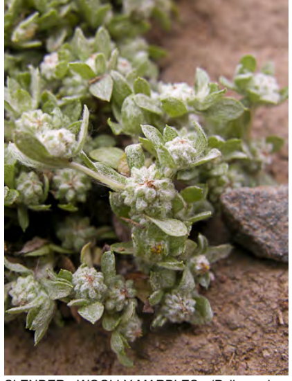
SLENDER WOOLLY-MARBLES (Psilocarphus tenellus) Native Annual - Sunflower Family - (Mar–Jul) - Common. Dry, seasonally moist slopes, flats, burns, trails, rarely vernal pools - Plant hairy. Leaves spoon-shaped. Disk flowers 4-lobed.