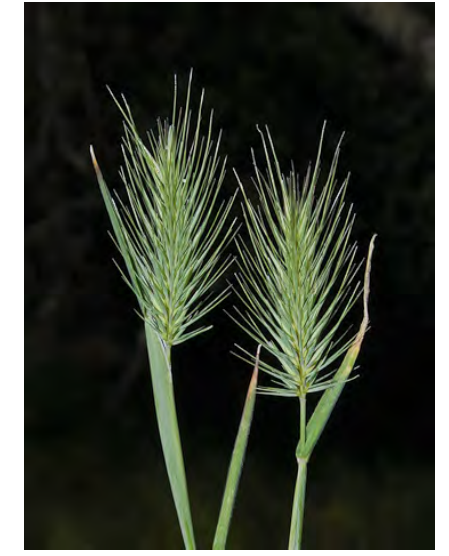
MEDITERRANEAN BARLEY (Hordeum marinum subsp. gussoneanum) Naturalized Annual -Grass Family - (Apr-Jun) - Dry to moist, disturbed sites - Stem 4-20". Leaf blades to 32" long, auricles < 0.08". Central lemma awn 0.25-0.7" long. INVASIVE weed.