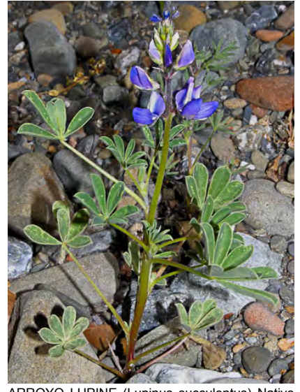
ARROYO LUPINE (Lupinus succulentus) Native Annual - Pea Family - (Feb–May) - Abundant. Open or disturbed areas, often seeded on roadbanks - Plant 8-40" tall, fleshy, sparsely hairy. Flowers 0.5-0.7" long, whorled, gen blue-purple, petal claws short-hairy.