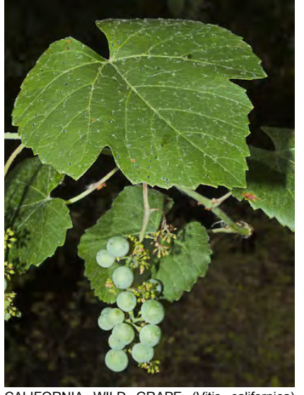
CALIFORNIA WILD GRAPE (Vitis californica) Native Perennial - Grape Family - (May–Jun) -Streamsides, springs, canyons - Woody vine to 33'+long. Leaves deciduous, heart-shaped to kidney-shaped. Fruit purple when mature, gen > 0.3" wide.