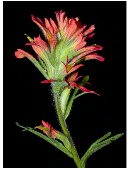
COMMON INDIAN PAINTBRUSH (Castilleja affinis subsp. affinis) Native Perennial -Broom-rape Family - (Mar–Jun) - Chaparral, coastal scrub - Plants 6-24" tall, gen bristly, non-sticky. Leaves 1-3", lance-shaped, 0-5 lobes. Flower cluster open, red to orange-red.