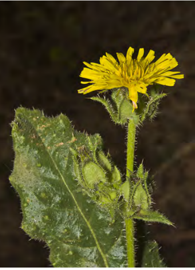
BRISTLY OX-TONGUE (Helminthotheca echioides) Naturalized Annual-Biennial -Sunflower Family - (All year) - Common. Disturbed areas - Stem 1-6.5' tall, bristly. Leaf 2-8" long, covered with prickly bumps. Flower heads 0.8-1.6" wide. INVASIVE weed.