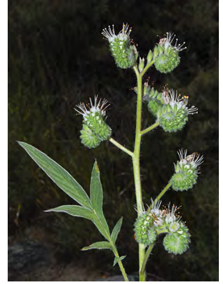
ROCK PHACELIA (Phacelia imbricata subsp. imbricata) Native Perennial - Borage Family -(Apr-Jul) - Slopes, roadsides, flats, canyons, chaparral, woodland - Plant 8-47", tufted. Leaf segments 7-15. Flowers 0.2-0.3", white. Flower bracts often sticky.