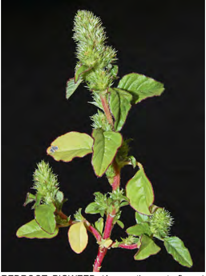
REDROOT PIGWEED (Amaranthus retroflexus) Naturalized Annual - Amaranth Family -(Jun-Nov) - Common. Wet fields, roadside ditches, waste places, agricultural fields - Stem upright, 0.5-6' tall. Flower clusters green, dense, at leaf bases and stem tips.