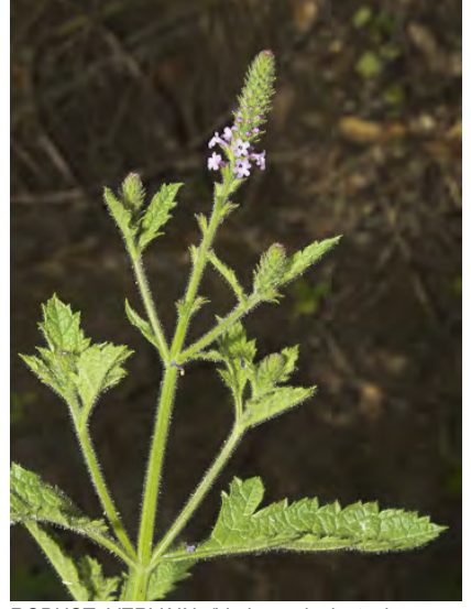
ROBUST VERVAIN (Verbena lasiostachys var. scabrida) Native Perennial - Vervain Family -(May–Sep) - Open, dry to wet places - Plant 14-32" tall. Leaves green, narrow, 3-lobed, stiff-haired above. Flowers blue to purple on long stalk.