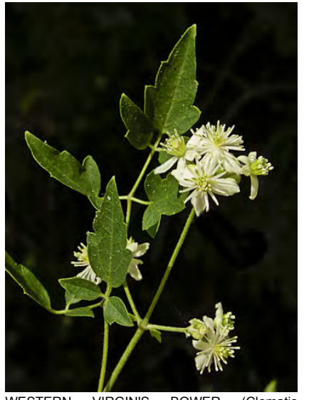
WESTERN VIRGIN'S BOWER (Clematis ligusticifolia) Native Perennial - Buttercup Family - (Jun-Sep) - Along streams, wet places -Leaflets 5-15, irregularly lobed. Flowers many, in fall. Sepals white to cream, 0.2-0.24" long.