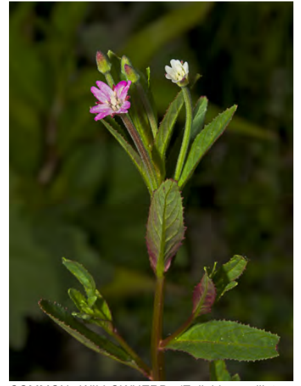
COMMON WILLOWHERB (Epilobium ciliatum subsp. ciliatum) Native Perennial - Evening Primrose Family - (Jun-Oct) - Common. Disturbed places, moist meadows, streambanks, roadsides - Plant 20-48" tall, smooth or short-hairy. Petals 2-6 mm, white to pink.