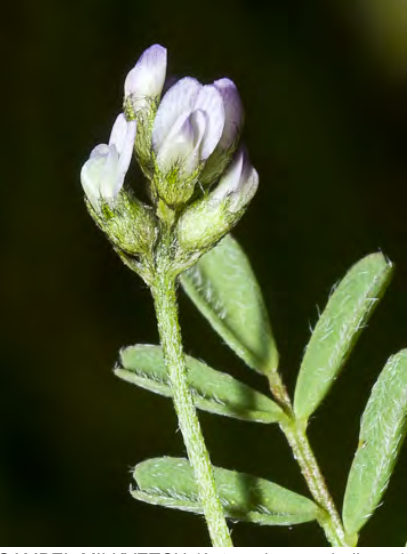
GAMBEL MILKVETCH (Astragalus gambelianus) Native Annual - Pea Family - (Mar–Jul) - Open, grassy areas, scrub - Plant 8-12" tall, slender. Leaflets square-tipped. Flowers 4-15/cluster, white w/purple-tinge, ~0.1" long. Fruits ~0.15" long, reflexed.