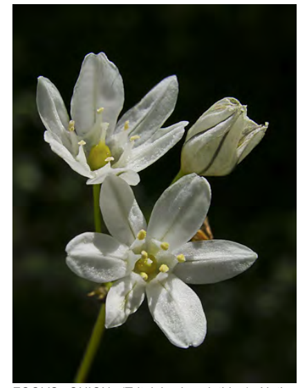
FOOL'S ONION (Triteleia hyacinthina) Native Perennial - Brodiaea Family - (Mar–Jul) -Grassland, vernally wet meadows, occ drier slopes - Flowering stem 1-2' tall. Leaves 4-16", 0.16-0.9" wide. Flower stalks 0.2-0.6" long. Flowers white, 0.35-0.6" long.