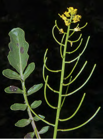
ERECT-POD WINTER CRESS (Barbarea orthoceras) Native Perennial - Mustard Family -(Mar-Jul) - Meadows, streambanks, moist woodland, grassland - Stem 8-24". Lower leaves w/large terminal lobe, upper clasping stem. Petals bright yellow, 0.2-0.3" long.