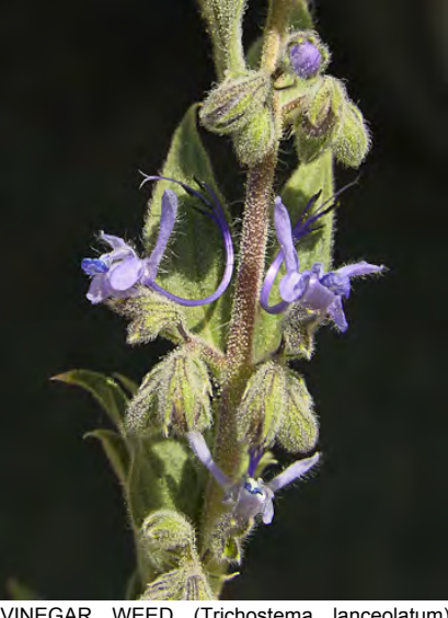
VINEGAR WEED (Trichostema lanceolatum) Native Annual - Mint Family - (Jun-Nov) - Dry, open, gen disturbed habitats - Plant < 39" tall. Leaf blades 0.8-2.8" long, leaf stalk, ~ stalkless. Flowers purple-blue, tube 0.2-0.4" long, curving up. Vinegar scent.