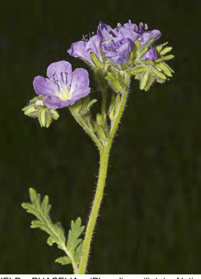
FIELD PHACELIA (Phacelia ciliata) Native Annual - Borage Family - (Feb–Jun) - Clay or gravelly slopes in grassland, fields - Plant 4-22" tall. Leaves deeply lobed to divided. Flowers 0.3-0.4" long, purple. Flower bracts large w/raised veins. Seeds 4.