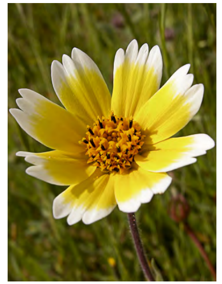
TIDY-TIPS (Layia platyglossa) Native Annual -Sunflower Family - (Feb–Jul) - Many habitats -Plant 1-28" tall, sticky. Leaves narrow. Ray flowers 0.1-0.8" long, yellow w/white tips. Disk anthers gen dark purple.