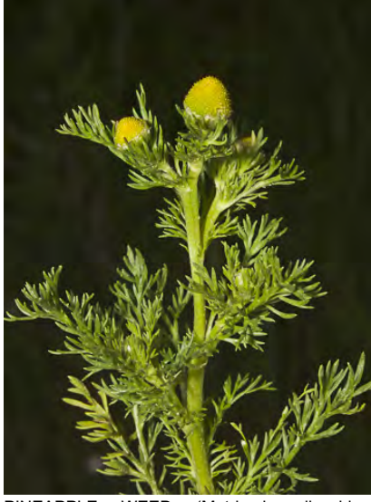
PINEAPPLE WEED (Matricaria discoidea) Naturalized Annual - Sunflower Family -(Feb-Aug) - Abundant. Disturbed sites, riverbanks - Plant 4-12" tall, sweet-scented. Heads pineapple-shaped, ~ 0.4" wide; head stalk to 0.6" long.