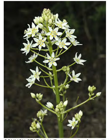
COMMON STAR LILY (Toxicoscordion fremontii) Native Perennial - Bunchflower Family -(Feb-Jun) - Grassy or wooded slopes, outcrops -Stem 16-35" tall. Flower cluster branched or unbranched. Petals 6, white to yellowish, 0.2-0.6" long, > stamens.