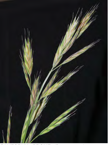
CALIFORNIA BROME (Bromus carinatus var. carinatus) Native Perennial - Grass Family -(Apr-Aug) - Coastal prairies, openings in chaparral, plains, open oak and pine woodland -Plant 20-40" tall. Flower cluster 6-16" long. Spikelet 0.8-1.6" long. Lemma 0.5-0.8" long, hairy, awn 0.3-0.6" long.