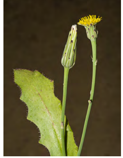
SMOOTH CAT'S-EAR (Hypochaeris glabra) Naturalized Annual - Sunflower Family -(Mar–Jun) - Common. Disturbed areas, grassland, open woodland - Plant 4-24" tall, smooth. Rays 0.2-0.3" long, barely > head bracts. Only inner fruit beaked. INVASIVE.