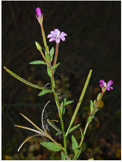
CHAPARRAL WILLOWHERB (Epilobium minutum) Native Annual - Evening Primrose Family - (Apr-Sep) - Dry, open, disturbed areas, vernal pools, often after fire - Plant < 16" tall. Flower cluster open. Petals 0.1-0.2" long, white or pink. Leaves flat, not clustered.