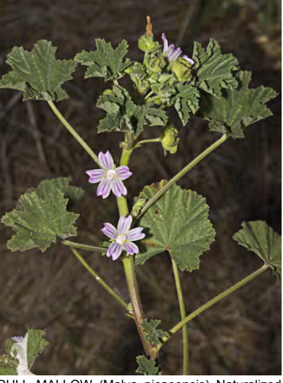
BULL MALLOW (Malva nicaeensis) Naturalized Annual - Mallow Family - (Mar–Jun) - Disturbed places - Stem 0.7-2'. Leaf blade 1.2-4.7" wide, 5-7 shallow lobes. Bractlets egg-shaped,0.16-0.2" long. Petals pink to blue-violet, 0.2-0.5" long.