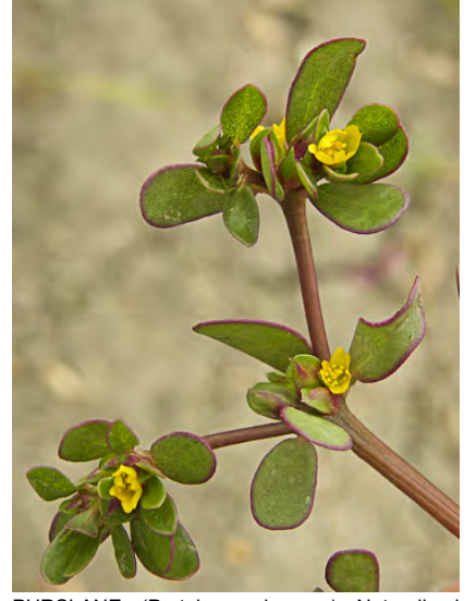
PURSLANE (Portulaca oleracea) Naturalized Perennial - Purslane Family - (Late spring-early fall) - Disturbed soil - Stem 1.2-16" long, spreading. Leaves 0.12-1.2" long, ~ spoon-shaped, flat. Flowers solitary. Petals yellow, 4-6, 0.12-0.2" long.