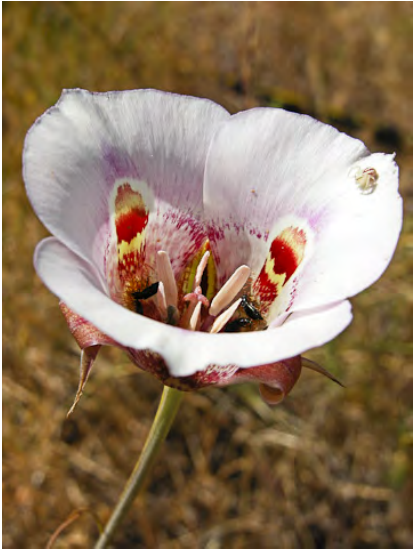
WHITE BUTTERFLY MARIPOSA LILY (Calochortus venustus) Native Perennial - Lily Family - (May–Jul) - Sandy (often granitic) soil in grassland, woodland, yellow-pine forest - Flowers white w/square yellow nectary; 2 red patches above. Petals 1.2-2" long.