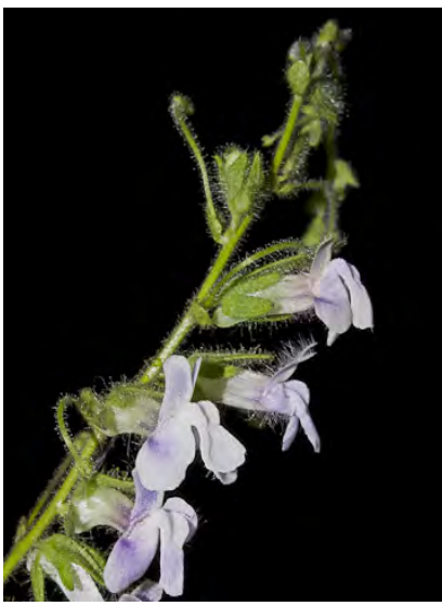
WIRY SNAPDRAGON (Antirrhinum vexillocalyculatum subsp. vexillocalyculatum) Native Annual - Plantain Family - (Jun-Aug) Disturbed areas - Stem 3-67" long, often clinging to other plants. Flowers lavender, 0.4-0.7" long.