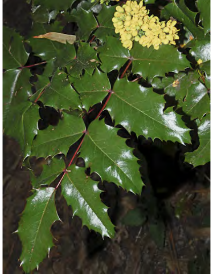
SHINYLEAF OREGON-GRAPE (Berberis pinnata subsp. pinnata) Native Perennial - Barberry Family - (Feb–May) - Rocky slopes, conifer forest, oak woodland, chaparral - Shrub gen < 7'. Leaflets w/15-23 spiny teeth, spines < 0.1" long. Flowers yellow.