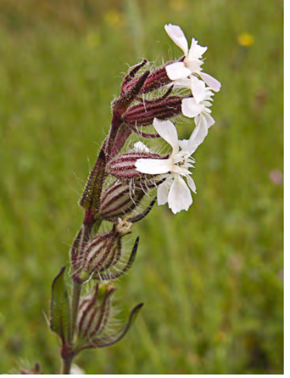
SMALL-FLOWER CATCHFLY (Silene gallica) Naturalized Annual - Pink Family - (Spring-early summer) - Fields, disturbed areas - Plant 4-16". Leaves < 1.4" long. Flower cluster short-hairy, bracts sticky-hairy, petal blade 0.2-0.5" long, smooth to notched, white to pink.