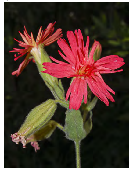
CALIFORNIA PINK (Silene laciniata subsp. californica) Native Perennial - Pink Family -(Spring–summer) - Chaparral, oak woodland, conifer forest, serpentine or not - Plant 8-28" tall. Petals 0.5-1" long, bright red.