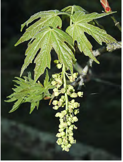
BIG-LEAF MAPLE (Acer macrophyllum) Native Perennial - Soapberry Family - (Mar–Jun) -Common. Streambanks, canyons - Tree < 100'. Leaves 5-lobed, 3-6" long, 4-10" wide. Group of 20-90 hanging flowers appear after leaves. Winged seeds.