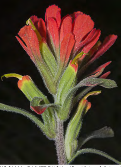
WOOLLY PAINTBRUSH (Castilleja foliolosa) Native Perennial - Broom-rape Family -(Mar–Jun) - Dry, open, rocky slopes, edges of chaparral - Plant 1-2' tall, base slightly woody, much branched, woolly. Flower cluster orange-red (occas. yellow-green).