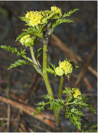
TURKEY PEA SANICLE (Sanicula tuberosa) Native Perennial - Carrot Family - (Mar–Jul) -Open gravelly meadows, chaparral, woodland, pine forest - Plant 2-32" tall, slender. Leaves finely dissected. Flowers bright yellow, male flower stalks > bumpy fruit.