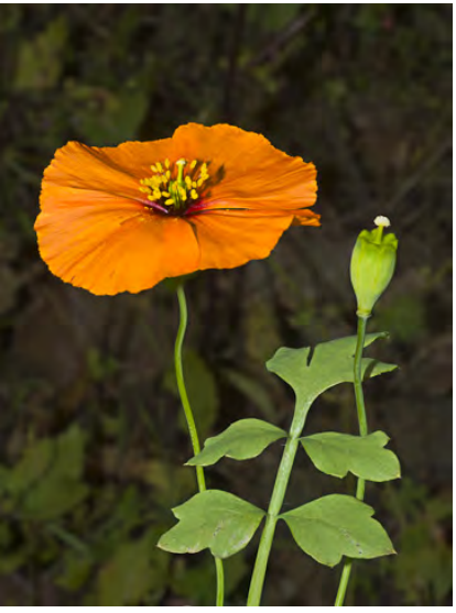
WIND POPPY (Papaver heterophyllum) Native Annual - Poppy Family - (Apr–May) - Grassy areas, openings in chaparral - Plant 1-2', yellow sap. Petals orange-red, 0.4-0.8" long. Stigma spherical on slender style.