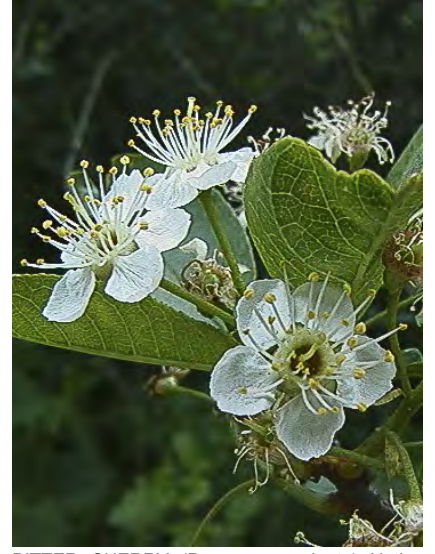
BITTER CHERRY (Prunus emarginata) Native Perennial - Rose Family - (Apr–Jun) - Rocky slopes, canyons, chaparral, mixed-evergreen, conifer forest - Shrub/tree < 50'. Leaf: stem 0.1-0.5", blade 0.6-2.4" long. Petals white, 0.12-0.3" long. Fruit red to purple.