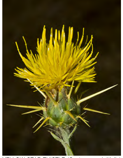
YELLOW STAR-THISTLE (Centaurea solstitialis) Naturalized Annual - Sunflower Family -(May–Oct) - Invasive, roadsides, disturbed grassland or woodland - Plant 4-39" tall. Leaves woolly, extend down the stem. Flower bract spines 0.4-1" long. NOXIOUS weed.