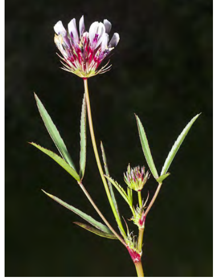
TOMCAT CLOVER (Trifolium willdenovii) Native Annual - Pea Family - (Mar–Jun) - Abundant. Disturbed, gen spring-moist, heavy soils, occas serpentine - Head bract wheel-shaped, sharp-lobed. Leaf narrow. Flowers purple w/white tip, 0.3-0.6" long.