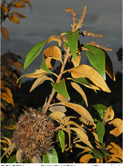
GOLDEN CHINQUAPIN (Chrysolepis chrysophylla var. minor) Native Perennial - Oak Family - (Jun–Sep) - Conifer forest, closed-cone-pine forest, chaparral - Shrub/tree < 16'. Leaf blade 2-6'', folded, green above, golden below. Fruit 1.2-2'' bur.