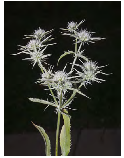
BUTTON CELERY (Eryngium jepsonii) Native Perennial - Carrot Family - (Apr–Aug) - Moist clay soil, vernal pools, lake shores, drying lakes, wet depressions - Leaf blade toothed-irreg lobed. Sepals 0.1", smooth-edged. Flowers white to blue or purple.