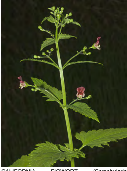
CALIFORNIA FIGWORT (Scrophularia californica) Native Perennial - Snapdragon Family - (Mar–Jul) - Common; damp places, chaparral, roadsides - Stem 2.6-4' tall, square x-section. Leaves opposite, to 7" long, triangular, toothed. Flowers 0.3-0.5" long, upper lips red to maroon, lower paler or yellowish.