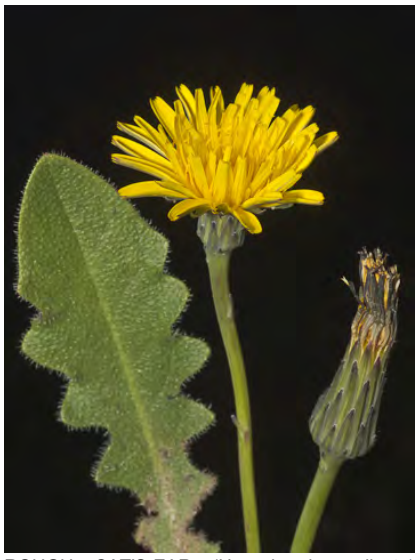
ROUGH CAT'S-EAR (Hypochaeris radicata) Naturalized Perennial - Sunflower Family -(Apr-Jul) - Disturbed areas, grassland, open woodland - Plant 4-32" tall, rough-hairy. Rays 0.4-0.6" long, well exceeding head bracts. Fruits all beaked. INVASIVE weed.