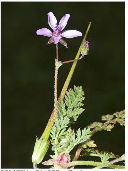
REDSTEM FILAREE (Erodium cicutarium) Naturalized Annual - Geranium Family -(Feb-Sep) - Open, disturbed sites, grassland, scrub - Stem 4-20". Leaves compound, leaflets dissected. Sepal tip bristly. Petal pink to purple. Fruit beak 0.8-2". INVASIVE.