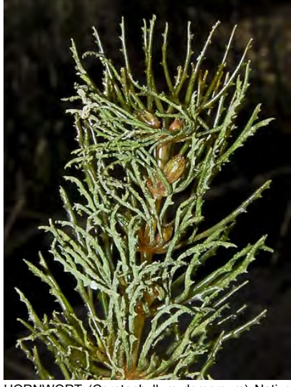
HORNWORT (Ceratophyllum demersum) Native Annual - Hornwort Family - (Jun-Aug) - Common. Ditches, lakes, ponds, pools, slow watercourses; water 0.1–4 m deep, fresh to \pm brackish, medium to high nutrient levels. - Leaves forked, serrate, stiff.