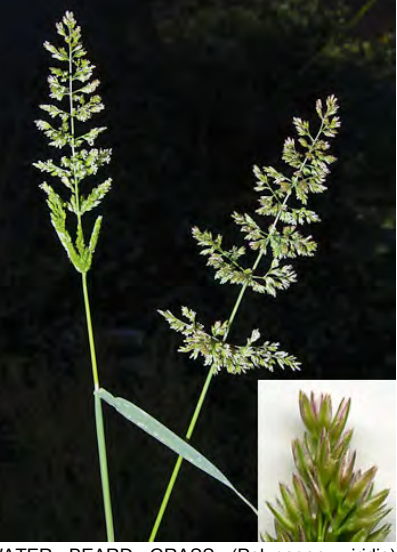
WATER BEARD GRASS (Polypogon viridis) Naturalized Perennial - Grass Family - (May–Jun) - Common. Disturbed areas, wet areas, ponds, streambanks -Stem 4-40" long, trails. Leaf blades flat, 0.08-0.4" wide. Spikelet ~ 0.1" long, no awn, whorled clusters.