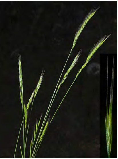
BROME FESCUE (Festuca bromoides) Naturalized Annual - Grass Family - (May–Jun) -Uncommon. Dry, disturbed places, coastal-sage scrub, chaparral - Stem < 20". Inflor 0.6-6" tall, dense, lower branches erect. Spikelet 0.2-0.4" long, awn 0.1-0.3" long.