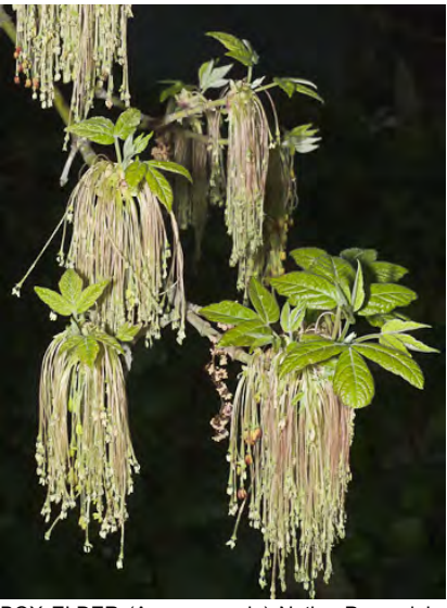
BOX ELDER (Acer negundo) Native Perennial -Soapberry Family - (Mar–Apr) - Streamsides, bottomland. - Tree < 66' tall. Leaflets in 3s. Group of 10-250 hanging flowers appear with leaves. Winged fruits. Widely planted ornamental.