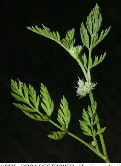
SHORT SOCK-DESTROYER (Torilis nodosa) Naturalized Annual - Carrot Family - (Apr–Jun) -Disturbed places - Plant spreading, 4-20" tall. Flowers white to red, clusters dense, < leaf. Fruit ~ 0.1" long, uncurved bristles on outer surface, bumps inside.