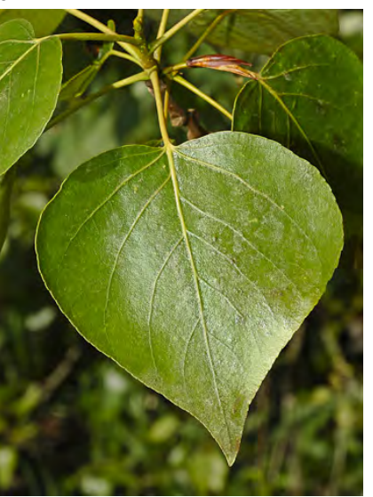
BLACK COTTONWOOD (Populus trichocarpa) Native Perennial - Willow Family - (Feb–Apr) -Alluvial bottomland, streamsides - Tree < 100' tall. Leaves egg-shaped, finely-scalloped edge, blade 1.2-2.8" long.