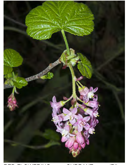
RED-FLOWERING CURRANT (Ribes sanguineum var. glutinosum) Native Perennial -Gooseberry Family - (Feb-Apr) - Many habitats Shrub < 13' tall, no prickles. Sepals pink to white. Petals white to red, ~0.1" long. Styles smooth.