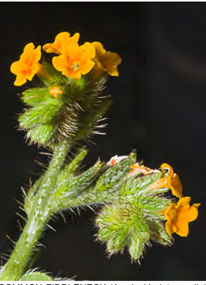
COMMON FIDDLENECK (Amsinckia intermedia) Native Annual - Borage Family - (Mar–Jun) -Abundant. Open, generally disturbed places -Plant 0.5-3' tall. Flowers orange with 5 red spots, 0.3-0.4" long, 0.2-0.4" wide, tube straight.