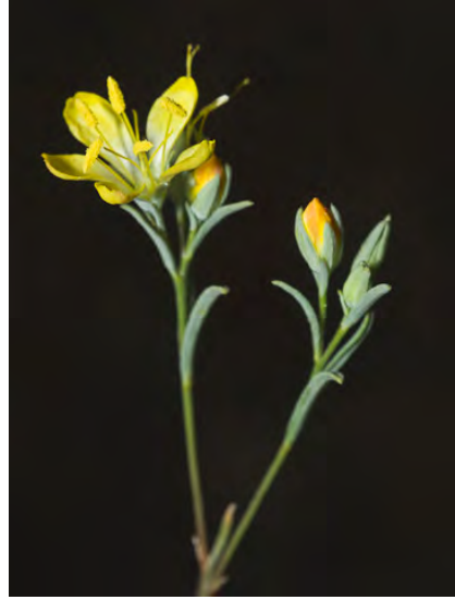
BREWER'S WESTERN FLAX (Hesperolinon breweri) Native Annual - Flax Family - (May–Jun) - Chaparral or grassland, occ on serpentine -Plant 2-8". Flower cluster congested, pedicels < 3 mm. Petals yellow, 0.2-0.4", > sepals. CNPS: FAIRLY ENDANGERED.