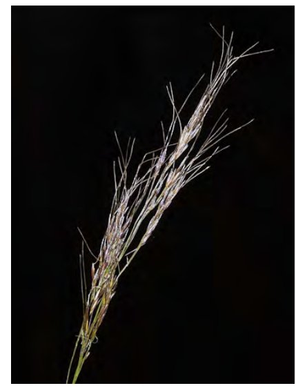
FOOTHILL NEEDLE GRASS (Stipa lepida) Native Perennial - Grass Family - (Mar–Jun) - Dry slopes, chaparral, grassland, savanna, coastal scrub - Stem 14-39" tall. Leaf blade 4.7-9.1" long, narrow. Glumes 0.2-0.6" long. Awn 0.8-2" long.