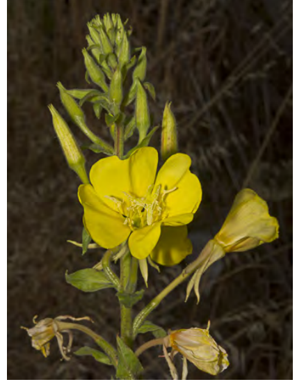
HOOKER EVENING-PRIMROSE (Oenothera elata subsp. hookeri) Native Biennial - Evening Primrose Family - (Jun-Sep) - Moist, coastal, slightly inland, sandy bluffs - Plant 16-32", sticky-hairy. Leaves 1.6-10" long, flat. Petals yellow, 1-2" long. Seeds all fertile.