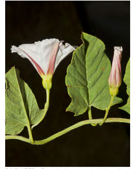
BINDWEED (Convolvulus arvensis) Naturalized Perennial - Morning-glory Family - (Mar–Oct) -Roadsides, open areas in many pl communities -Trailing. Leaf 0.8-1.2" long, w/round tip, pointed lobes. Flowers white to pink, 0.8-1" long. NOXIOUS.