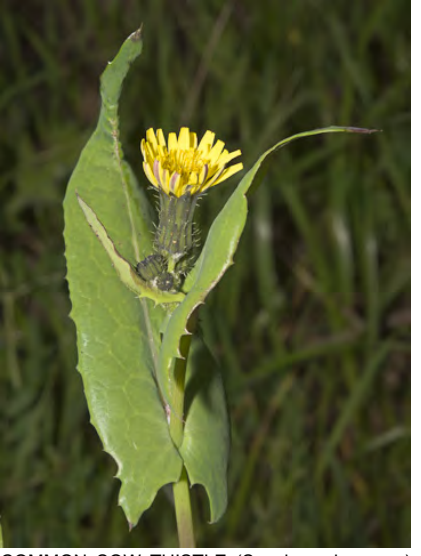
COMMON SOW THISTLE (Sonchus oleraceus) Naturalized Annual - Sunflower Family - (All year) - Abundant. Disturbed places - Plant 4-55" tall. Leaf teeth soft to touch. Basal lobes of upper leaves sharply pointed, straight to curving upward.