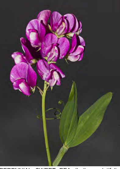
PERENNIAL SWEET PEA (Lathyrus latifolius) Naturalized Perennial - Pea Family - (Apr–May) -Disturbed areas, esp roadsides - Stem smooth, robust, broadly winged. Leaflets in 2's. Flowers 0.8-1.2" long, bright pink. Escaped ornamental.