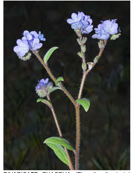
DIVARICATE PHACELIA (Phacelia divaricata) Native Annual - Borage Family - (Apr-Jun) -Open areas, chaparral, woodland, grassland -Plant 3.5-16" tall. Leaves with 0-few lobes. Flowers 0.4-0.6" long, lavender to violet. Seeds 8-16.