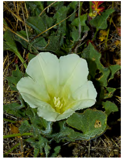
SHORTSTEM MORNING-GLORY (Calystegia subacaulis subsp. subacaulis) Native Perennial - Morning-glory Family - (Apr–Jun) - Dry, open scrub or woodland - Stem gen ~0.8" long. Flowers 1.3-2.4" long, white or cream. Bractlets concealing flower bracts.