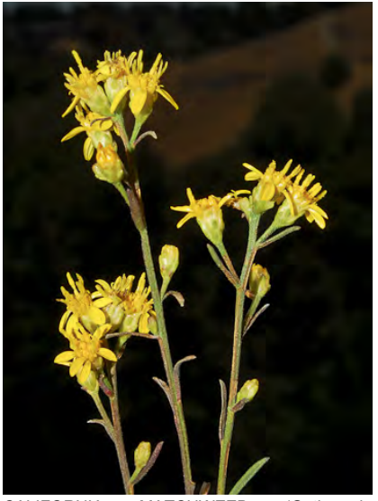
CALIFORNIA MATCHWEED (Gutierrezia californica) Native Perennial - Sunflower Family - (Jul-Nov) - Grassland, arid woodland and shrubland, serpentine - Stem 8-40" long, woody base. Leaf narrow, flat, <= 2" long. Ray flowers 4-13, 0.1-0.3" long.