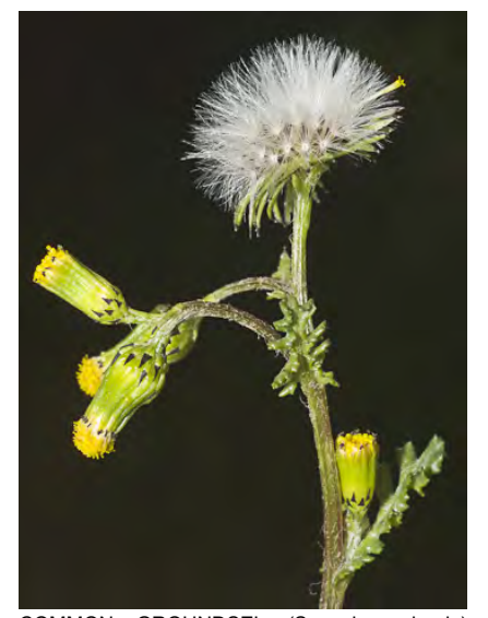
COMMON GROUNDSEL (Senecio vulgaris) Naturalized Annual - Sunflower Family -(Feb-Jul) - Common. Disturbed areas - Plant 4-24" tall, not hairy, w/1-10+ stems. Flower head bracts with black-tips. Milky sap.