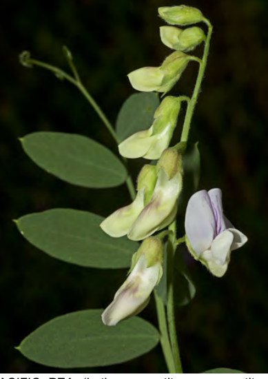
PACIFIC PEA (Lathyrus vestitus var. vestitus) Native Perennial - Pea Family - (Feb–Jul) - North: Conifer forest. South: chaparral & oak woodland -Stem wings to 0.02" wide. Leaves gen elliptic. Flowers 0.5-0.7" long, pale lavender to purple.