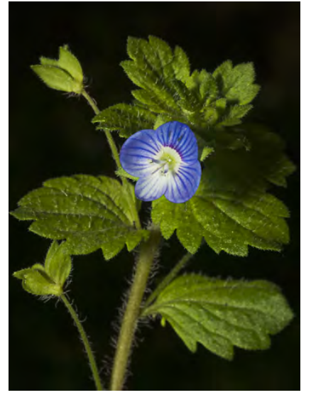
PERSIAN SPEEDWELL (Veronica persica) Naturalized Annual - Plantain Family - (Feb–May) - Wet, disturbed areas, fields - Stem 2-24" long, crawling. Flowers on 0.6-1.2" long stalks. Flowers blue, purple-lined with a white center.