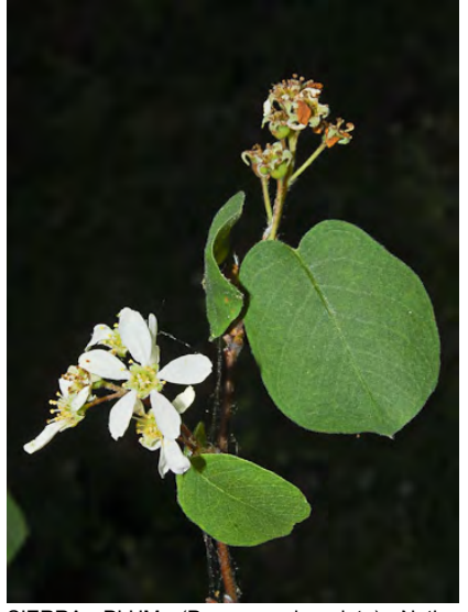
SIERRA PLUM (Prunus subcordata) Native Perennial - Rose Family - (Mar–May) -Mixed-evergreen or conifer forest - Shrub < 10'. Leaf: stem 0.16-0.6", blade 1-2", elliptic to wide egg-shaped, base round heart-shaped, tip round. Petals 0.2-0.4" long, white.