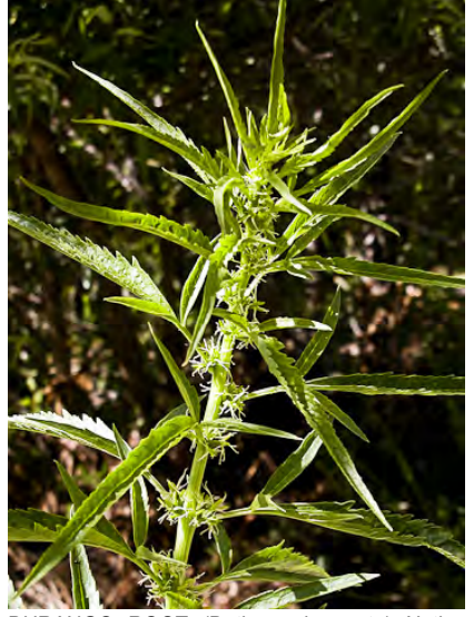
DURANGO ROOT (Datisca glomerata) Native Perennial - Datisca Family - (May–Jul) - Dry streambeds or washes - Stem 3.3-6.6' tall. Leaves ~ 6" long, lance-shaped, alternate above, opposite/whorled below. Flowers small with no petals.