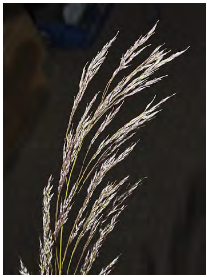
SMILO GRASS (Stipa miliacea var. miliacea) Naturalized Perennial - Grass Family - (Mar–Sep) - Salt marshes, streambanks, chaparral, open woodland, disturbed - Stems green, large tufts, sheaths It. Inflor arching. INVASIVE weed.