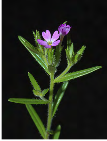
SLENDER ANNUAL PHLOX (Microsteris gracilis) Native Annual - Phlox Family - (Mar–Aug) - Dry to moist areas - Plant < 8" tall, glandualr-hairy. Leaves 0.4-1.2" long. Flowers 0.3-0.5" long, tubes yellow, lobes bright pink to white.