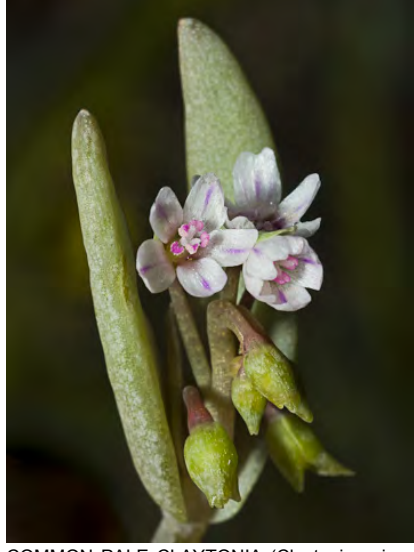
COMMON PALE CLAYTONIA (Claytonia exigua subsp. exigua) Native Annual - Miner's Lettuce Family - (Apr-Jul) - Dry or moist, disturbed bare clay to sandy soils, often serpentine - Stem leaf free or fused. Petals 0.1-0.2", white or pink. Seeds dull w/appendage.