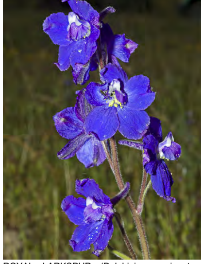
ROYAL LARKSPUR (Delphinium variegatum subsp. variegatum) Native Perennial - Buttercup Family - (Mar–May) - Grassland, open oak woodland - Stem < 24" w/spreading hairs. Leaves w/finger-like segments. Flowers dark royal blue, large and few.