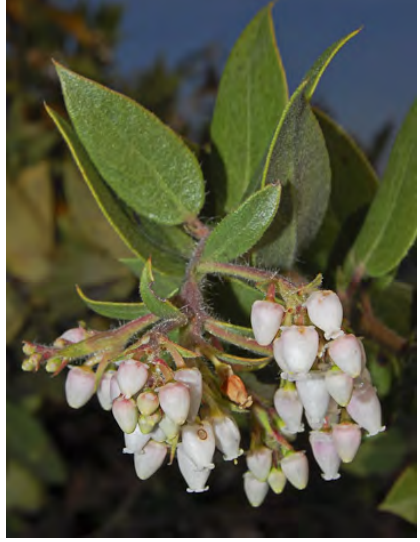
BRITTLE-LEAF MANZANITA (Arctostaphylos crustacea subsp. crustacea) Native Perennial - Heath Family - (Feb-Apr) - Chaparral, conifer forest - Twigs bristly, leaf stalk 0.1-0.2", upper leaf surface shiny.