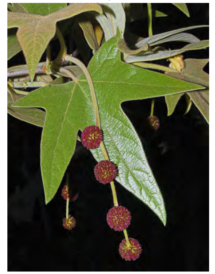
WESTERN SYCAMORE (Platanus racemosa) Native Perennial - Sycamore Family - (Feb–Apr) -Common. Streamsides, canyons, arroyos - Tree 33-115' tall. Bark peeling pale. Leaf blades 4-10" long, palmately lobed, smooth to hairy above, short-woolly under.