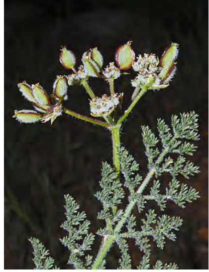
WOOLLY FRUITED DESERTPARSLEY (Lomatium dasycarpum subsp. dasycarpum) Native Perennial - Carrot Family - (Mar–Jun) -Rocky (gen serpentine), chaparral, woodland -Plant 4-20", short-hairy. Flowers greenish-white, petals and fruit hairy.