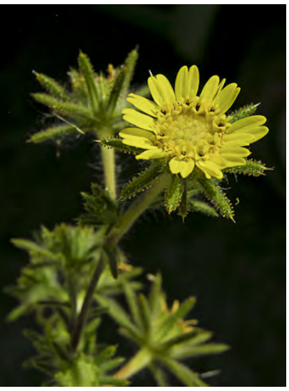
FITCH SPIKEWEED (Centromadia fitchii) Native Perennial - Sunflower Family - (May–Nov) -Grassland, ± alkaline flats, vernal pools, woodland, disturbed sites, serpentine - Plant 2-20" tall. Leaves below flowers spiny, sticky.