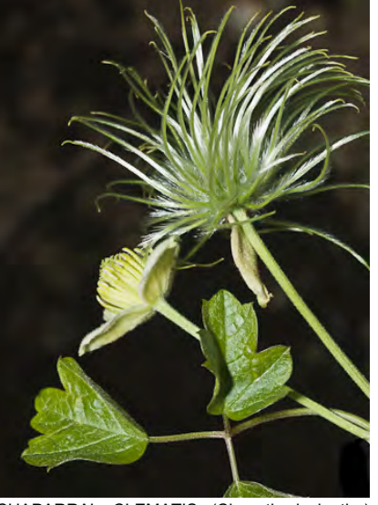
CHAPARRAL CLEMATIS (Clematis lasiantha) Native Perennial - Buttercup Family - (Jan–Jun) -Hillsides, chaparral, open woodland - Woody vine. Leaflets 3-5, +-3-lobed. Flowers gen 1, in spring; sepals white to cream, 0.4-0.8" long.