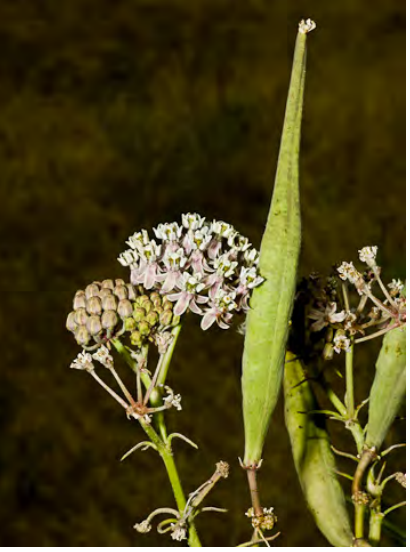
NARROW-LEAF MILKWEED (Asclepias fascicularis) Native Perennial - Dogbane Family - (May–Oct) - Dry ground, valleys, foothills - Plant gen hairless. Stem leaves narrow, 3-5 in whorls. Flowers green-white to purple-tinged, ~0.25" long.