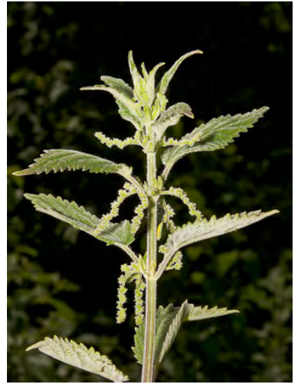
HOARY NETTLE (Urtica dioica subsp. holosericea) Native Perennial - Nettle Family -(Jun-Sep) - Meadows, seeps, springs, margins of marshes, streams, lakes, moist areas in chaparral, coastal scrub - Plant 3.3-9.8' tall, grayish, covered with stinging hairs.