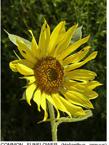
COMMON SUNFLOWER (Helianthus annuus) Native Perennial - Sunflower Family - (Jun–Oct) -Disturbed areas, scrub, grassland, many other habitats - Plant < 10'. Leaf blades 4-16" long, <= 2x width. Rays 0.2-2" long, disks reddish. Head bracts 0.2-0.3" wide.