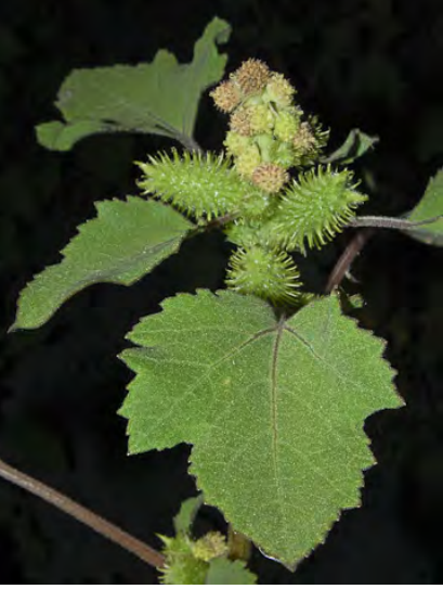
COCKLEBUR (Xanthium strumarium) Native Annual - Sunflower Family - (Jul–Oct) -Disturbed, seasonally wet, often alkaline sites, in grassland, marshes, watercourses - Plant 4-32" tall. Stem spineless. Bur 0.4-1.2"+ long.