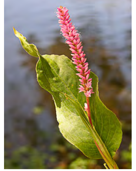
WATER SMARTWEED (Persicaria amphibia) Native Perennial - Buckwheat Family - (Jun-Nov) - Shallow lakes, streams, shores - Aquatic (floating leaves) or terrestrial. Flower clusters 0.4-6" long, 0.3-0.8" wide, pink to red.