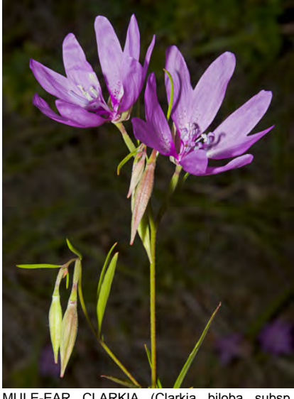
MULE-EAR CLARKIA (Clarkia biloba subsp. biloba) Native Annual - Evening Primrose Family - (May-Aug) - Foothill woodland, serpentine or not - Stem < 3.3'. Petals purple-pink, 2-lobed, 0.4-0.6" long, gen 1.5x width. Axis and buds pendant, sepals fused.