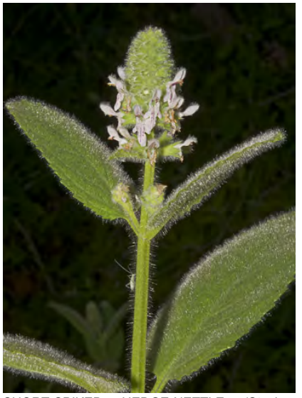
SHORT-SPIKED HEDGE-NETTLE (Stachys pycnantha) Native Perennial - Mint Family - (Jun–Oct) - Streambanks, springs, pine/oak forest - Plant 12-39", densely glandular, aromatic. Flower cluster < 2", no spaces. Petals white to pink, ~0.3" long.