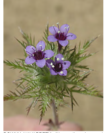
DOWNY NAVARRETIA (Navarretia pubescens) Native Annual - Phlox Family - (May–Jul) - Open, slopes, gravel, clay - Stem 5.5-13", tan to red-brown. Bracts irregularly toothed. Calyx lobes often toothed. Flowers 0.4-0.6" long, bright blue-purple.