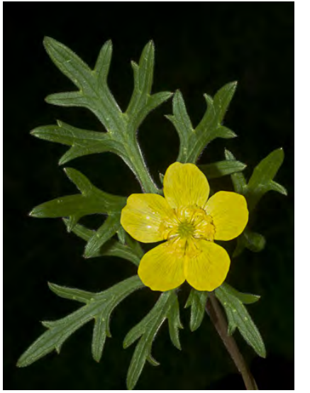
WESTERN BUTTERCUP (Ranunculus occidentalis var. occidentalis) Native Perennial -Buttercup Family - (Mar–Jul) - Grassy slopes in meadows or open woodland - Plant 4-24". Basal leaves partly divided. Petals 5-6, 0.2-0.4" long. Fruit w/short bristles.