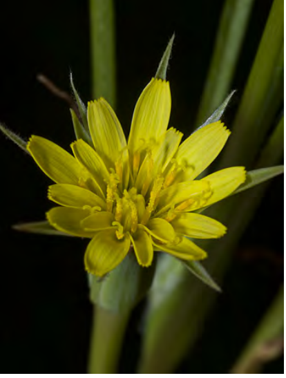
SILVERPUFFS (Uropappus lindleyi) Native Annual - Sunflower Family - (Mar–May) -Common. Open grassland, woodland, chaparral, deserts, gen in loose soils - Heads pale yellow, never nod. Outer head bracts always > 1/4 inner length. Pappus scale notched.