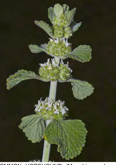
COMMON HOREHOUND (Marrubium vulgare) Naturalized Perennial - Mint Family - (Mar-Nov) -Disturbed sites, gen overgrazed pastures - Stem 4-24" long. Leaf blades 0.6-2.2" long. Flower bract w/10 hook-tipped teeth. Flowers white, ~0.2" long. INVASIVE.