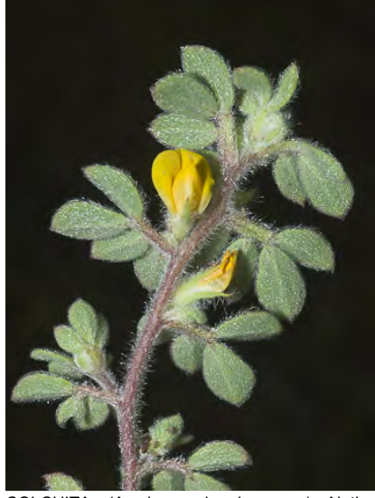
COLCHITA (Acmispon brachycarpus) Native Annual - Pea Family - (Mar–Jun) - Abundant. Grassland, oak and pine woodland, desert flats and mtns, roadsides - Soft, densely hairy, < 16" tall. Flower yellow, almost stemless, bract lobes 1-2x flower tube.