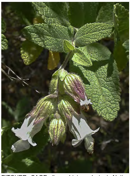
PITCHER SAGE (Lepechinia calycina) Native Perennial - Mint Family - (Apr–Jun) - Common. Rocky slopes; chaparral, woodland - Shrub 3.3-6.6' tall. Leaf blade gen 1.6-4.7" long. Flowers white to lavender tinged, 1-1.2" long, 5-lobed, 2-lipped.