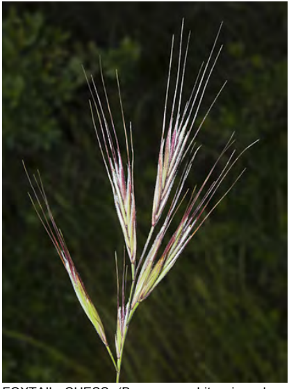
FOXTAIL CHESS (Bromus madritensis subsp. madritensis) Naturalized Annual - Grass Family -(Apr-Jan) - Disturbed areas, roadsides - Plants 4-20" tall. Stem and sheathes smooth. Flower cluster branches visible, lower spikelets erect, > stalk.