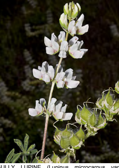
GULLY LUPINE (Lupinus microcarpus var. densiflorus) Native Annual - Pea Family -(Apr–Jun) - Abundant. Open or disturbed areas, occ seeded on roadbanks - Plant 4-32" tall, hairy. Flowers 0.3-0.7" long, white to yellow. Flower bract hairs few, short.