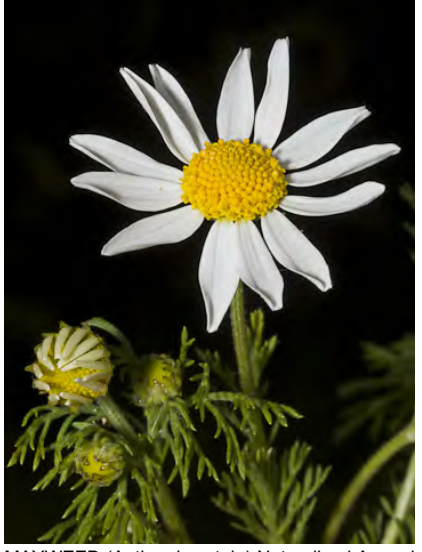
MAYWEED (Anthemis cotula) Naturalized Annual - Sunflower Family - (Apr-Aug) - Common. Disturbed areas, fields, coastal dunes, chaparral, oak woodland - Leaves finely divided into thread-like lobes. Flowers > 0.6" wide, many on top of a well-branched stem.