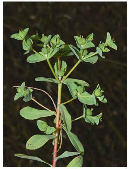
WART SPURGE (Euphorbia spathulata) Native Annual - Spurge Family - (Mar–Jun) - Open, gen disturbed places - Stem 6-17" tall, smooth. Leaves spoon-shaped, 0.4-1.2" long, finely toothed. Gland oblong.