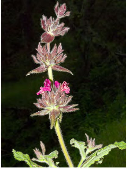
CALIFORNIA HUMMINGBIRD SAGE (Salvia spathacea) Native Perennial - Mint Family - (Mar-May) - Common, oak woodland, chaparral, coastal-sage scrub, slopes - Plant 1-5' tall, woody base. Leaf 3-8" long. Flowers red-purple, 1-1.4" long.