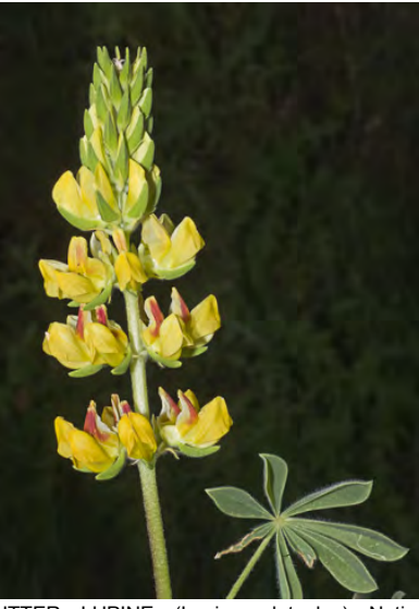
BUTTER LUPINE (Lupinus luteolus) Native Annual - Pea Family - (May–Aug) - Clearings, open or disturbed areas - Plant 12-30" tall. Leaves hairy above. Flowers 0.4-0.6" long, gen pale yellow, upper and lower keel equally short-hairy.