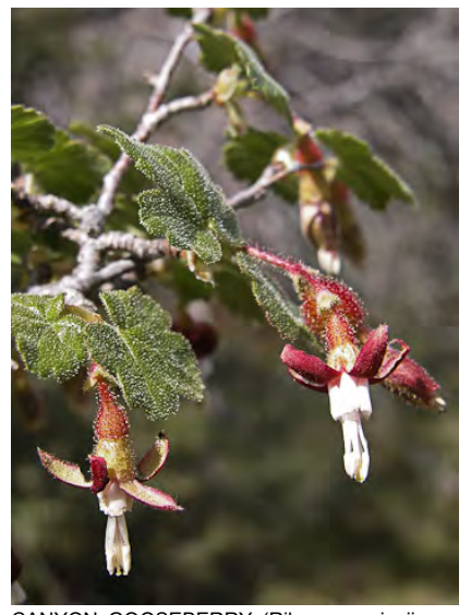
CANYON GOOSEBERRY (Ribes menziesii var. menziesii) Native Perennial - Gooseberry Family - (Feb–Apr) - Common. Forest openings, chaparral - Shrub < 10', prickly. Leaves sticky below. Styles glabrous, anthers exserted, sepals purplish.