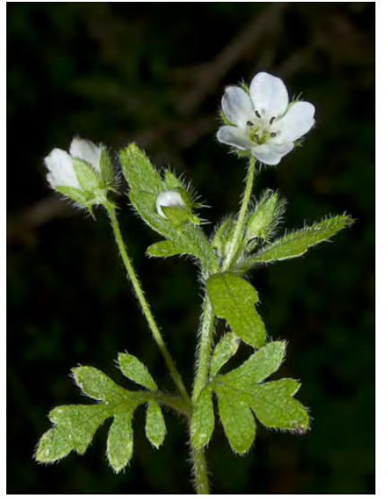
VARIABLE-LEAF NEMOPHILA (Nemophila heterophylla) Native Annual - Borage Family -(Feb-Jun) - Common. Forest, chaparral, roadsides, streambanks - Flower 0.1-0.4" long, unspotted, bract appendages < 0.04" long in fruit.