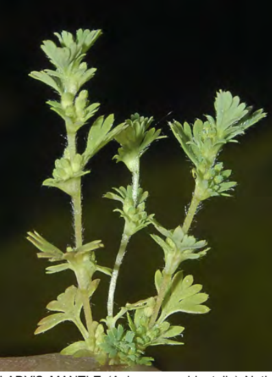
LADY'S MANTLE (Aphanes occidentalis) Native Annual - Rose Family - (Mar–May) - Seasonally moist grassland, chaparral, woodland - Plant inconspicuous, soft hairy, < 4" tall. Leaves 0.1-0.5" long, deeply lobed. Flowers yellow-green, < 0.1" long.