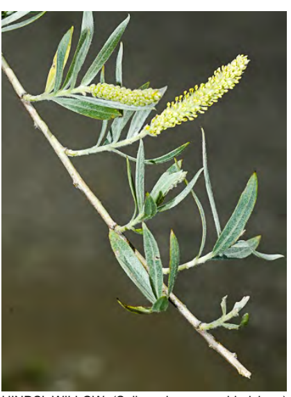
HINDS' WILLOW (Salix exigua var. hindsiana) Native Perennial - Willow Family - (Apr-May) -Common. Floodplains, sandy gravel - Shrub or tree < 17' tall. Leaf blades 1.2-6" long, linear, mature dense soft-hairy below. Ovary hairy.