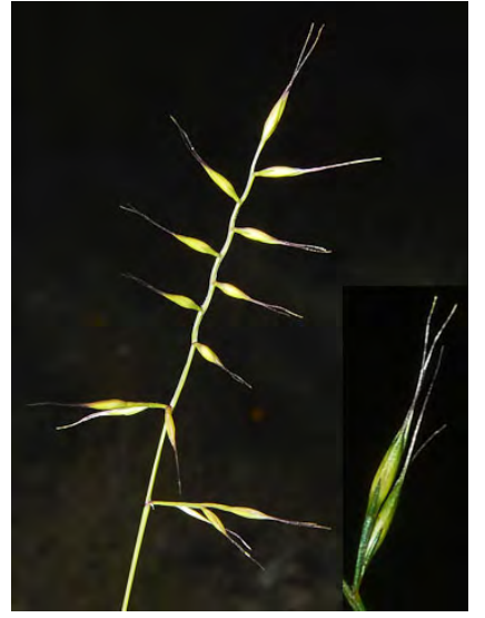
HAIRY FESCUE (Festuca microstachys) Native Annual - Grass Family - (Apr–Jun) - Disturbed, open, gen sandy soils - Stem 6-29". Spikelet 0.2-0.4" long, awn 0.1-0.5" long. Glumes & lemma smooth or hairy.