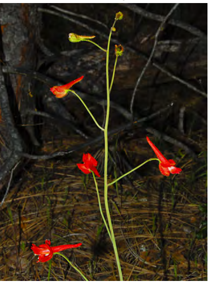
RED OR ORANGE LARKSPUR (Delphinium nudicaule) Native Perennial - Buttercup Family -(Mar–Jun) - Moist talus, wooded, rocky slopes -Stem gen 6-20" tall, usually hairless. Flowers scarlet to orange-red. Hummingbird pollinated.