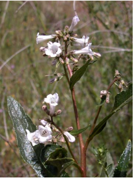
Yerba Santa Eriodictyon californicum Native Perennial Waterleaf Family

Longhorn Plectritis Plectritis macrocera Native Annual Valerian Family