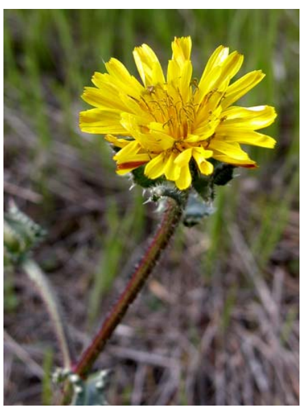
Bristly Ox-tongue Picris echioides Introduced Annual-Biennial Sunflower Family