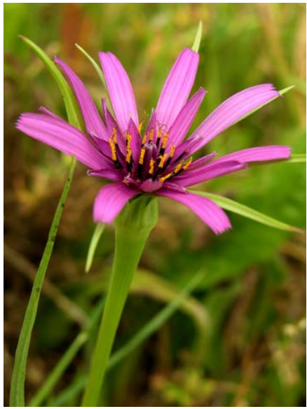
Purple Salsify Tragopogon porrifolius Introduced Biennial-Perennial Sunflower Family