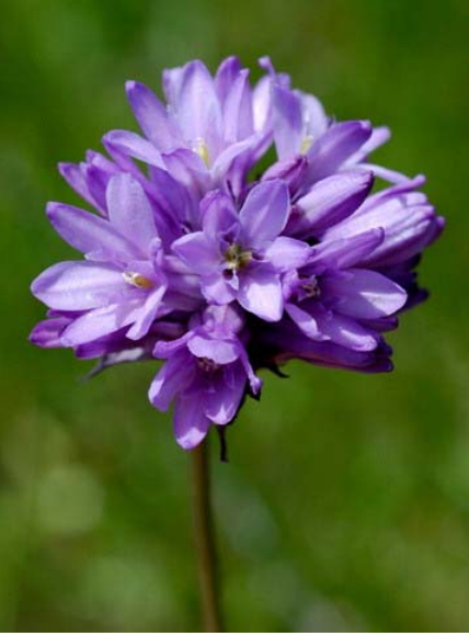
Ookow Dichelostemma congestum Native Perennial Lily Family