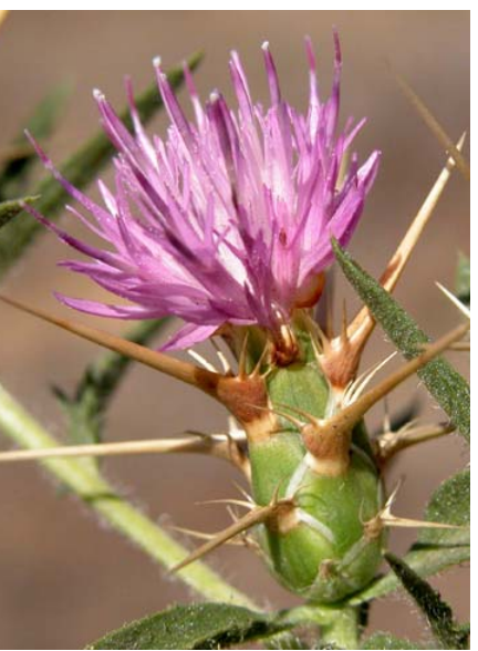
Purple Star Thistle Centaurea calcitrapa Introduced Annual-Biennial Sunflower Family