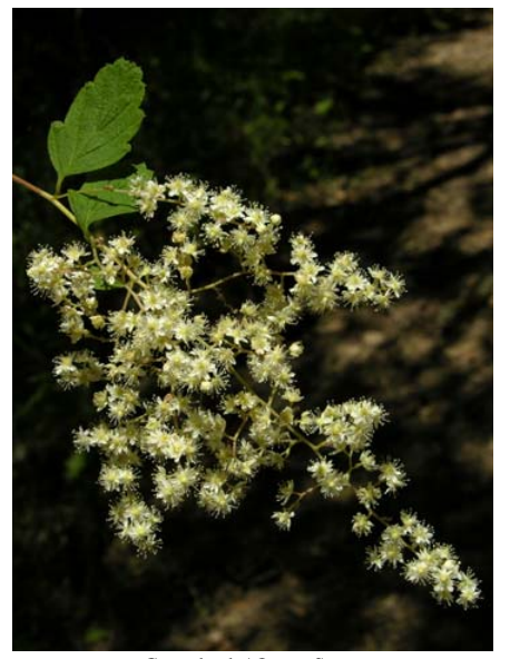
Creambush / Ocean Spray Holodiscus discolor Native Perennial Rose Family