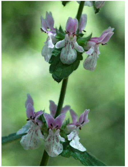
Common Rigid Hedge Nettle Stachys ajugoides var. rigida Native Perennial Mint Family