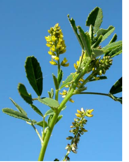
Sour Clover Melilotus indica Introduced Annual-Biennial Pea Family