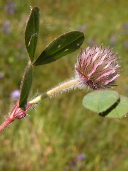
Rose Clover Trifolium hirtum Introduced Annual Pea Family