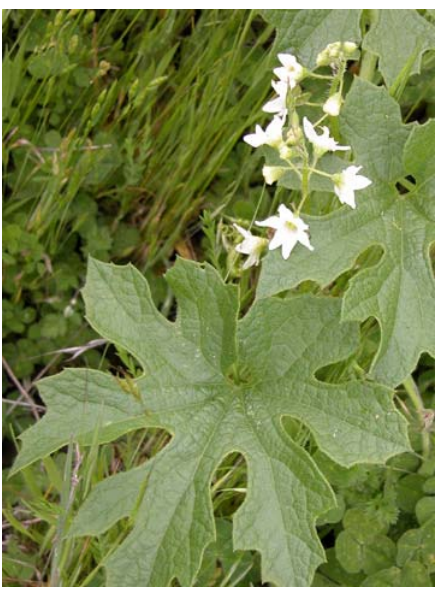
Oregon / Coast Manroot Marah oreganus Native Perennial Gourd Family