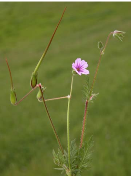
Long-beaked Filaree Erodium botrys Introduced Annual Geranium Family