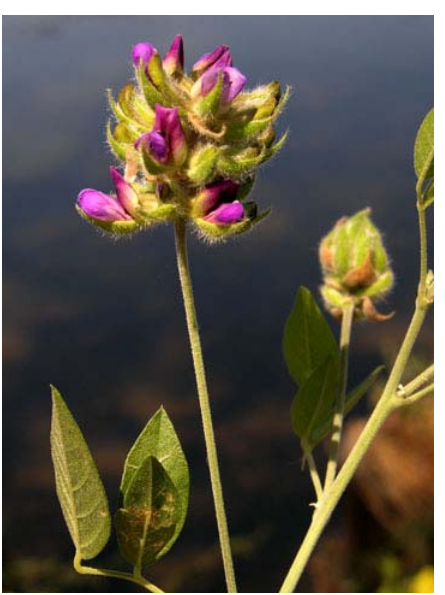
California Tea Rupertia physodes Native Perennial Pea Family