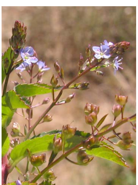
American Brooklime Speedwell Veronica americana Native Perennial Snapdragon Family