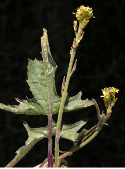
Black Mustard Brassica nigra Introduced Annual Mustard Family