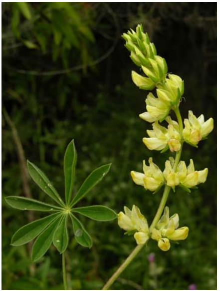
Gully Lupine Lupinus microcarpus var. densiflorus Native Annual Pea Family