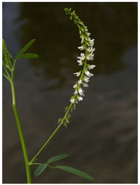
White Sweet Clover Melilotus alba Introduced Annual-Biennial Pea Family