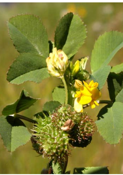
California Bur Clover Medicago polymorpha Introduced Annual Pea Family