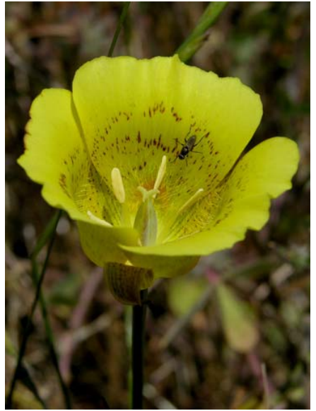
Yellow Mariposa Lily Calochortus luteus Native Perennial Lily Family