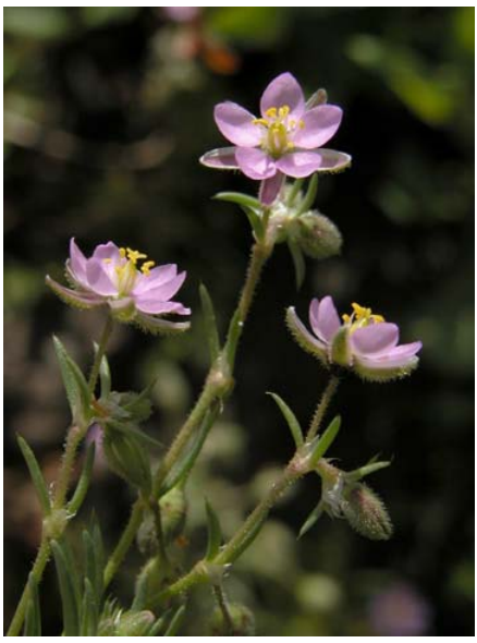
Ruby Sand Spurry Spergularia rubra Introduced Annual-Perennial Pink Family

Winter Vetch Vicia villosa ssp. varia Introduced Annual-Biennial Pea Family