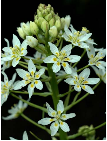
Common Star Lily Zigadenus fremontii Native Perennial Lily Family