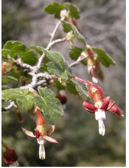
Canyon Gooseberry Ribes menziesii Native Perennial Gooseberry Family