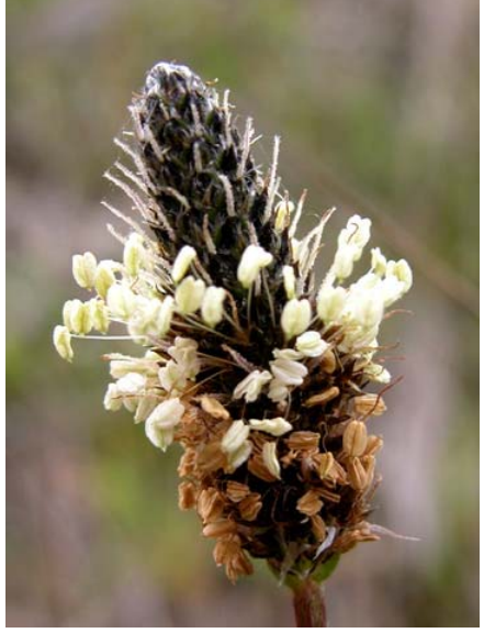
English Plantain Plantago lanceolata Introduced Annual Plantain Family