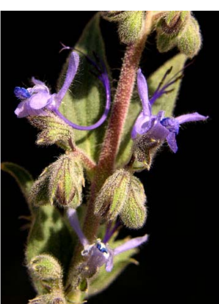
Vinegar Weed Trichostema lanceolatum Native Annual Mint Family