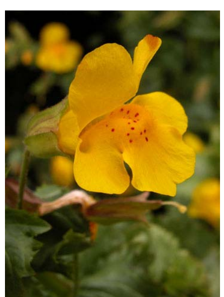
Golden Monkey Flower Mimulus guttatus Native Perennial Snapdragon Family