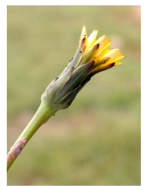
Smooth Cat's-ear Hypochaeris glabra Introduced Annual Sunflower Family

Rosilla Helenium puberulum Native Biennial Sunflower Family