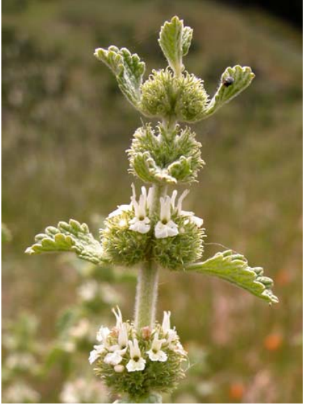
Common Horehound Marrubium vulgare Introduced Perennial Mint Family