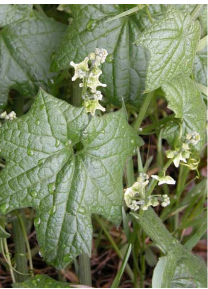
Common / California Manroot Marah fabaceus Native Perennial Gourd Family