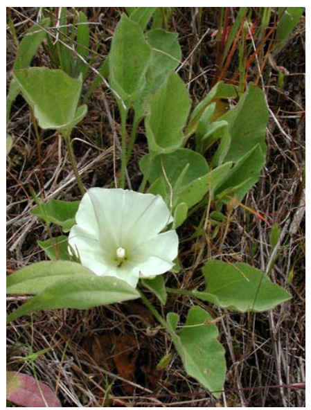
Shortstem Morning Glory Calystegia subacaulis ssp. subacaulis Native Perennial Morning-Glory Family