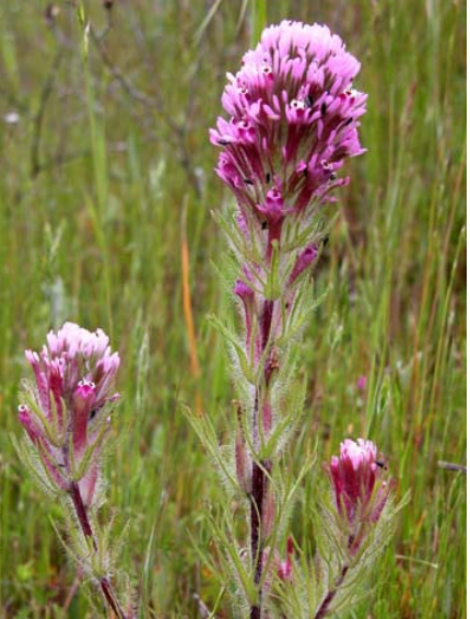
Purple Owl's Clover Castilleja exserta ssp. exserta Native Annual Snapdragon Family

Bellardia Bellardia trixago Introduced Annual Snapdragon Family