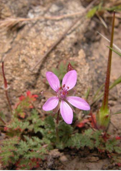
Red-stem Filaree Erodium cicutarium Introduced Annual Geranium Family