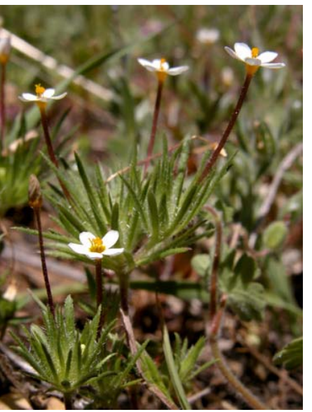
Bicolor Linanthus Linanthus bicolor Native Annual Phlox Family