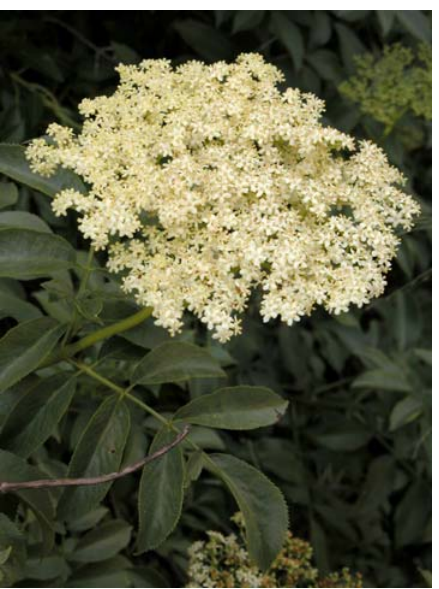
Blue Elderberry Sambucus mexicana Native Perennial Honeysuckle Family