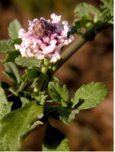
Lemon Verbena Phyla nodiflora var. nodiflora Native Perennial Vervain Family