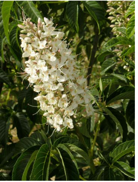
California Buckeye Aesculus californica Native Perennial Buckeye Family