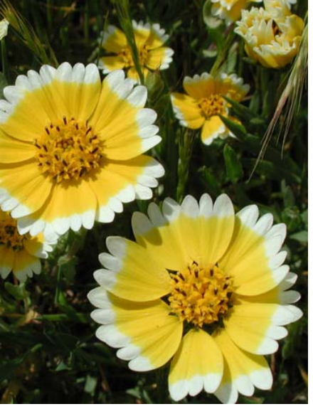
Common Tidytips Layia platyglossa Native Annual Sunflower Family

Goldfields Lasthenia californica Native Annual Sunflower Family