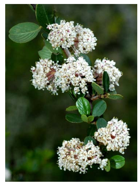
Buckbrush Ceanothus cuneatus var. cuneatus Native Perennial Buckthorn Family