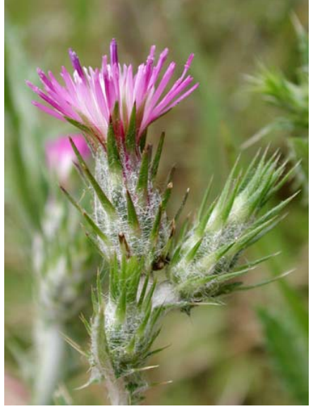
Italian Thistle Carduus pycnocephalus Introduced Annual Sunflower Family