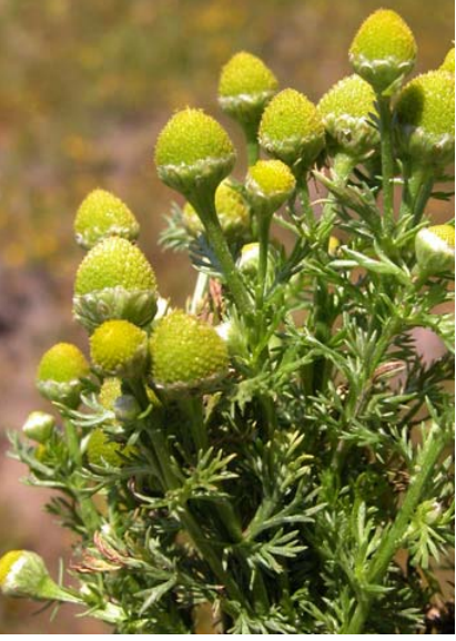
Pineapple Weed Chamomilla suaveolens Introduced Annual Sunflower Family