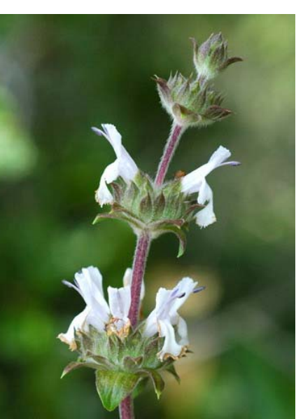
Black Sage Salvia mellifera Native Perennial Mint Family