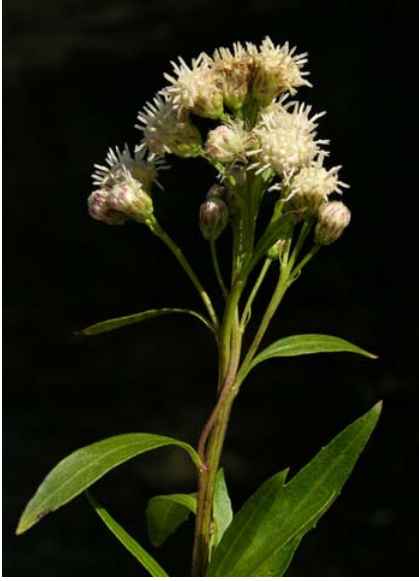
Mulefat Baccharis salicifolia Native Perennial Sunflower Family