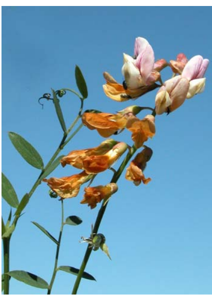
Pale Purple Pacific Pea Lathyrus vestitus var. vestitus Native Perennial Pea Family