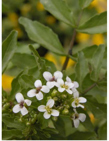
White Water Cress Rorippa nasturtium-aquaticum Native Perennial Mustard Family

Milkmaids Cardamine californica Native Perennial Mustard Family