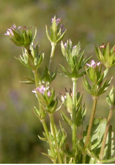
Blue Field Madder Sherardia arvensis Introduced Annual Madder Family