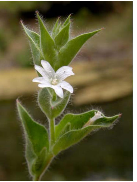
Dense-flower Willowherb Epilobium densiflorum Native Annual Evening Primrose Family