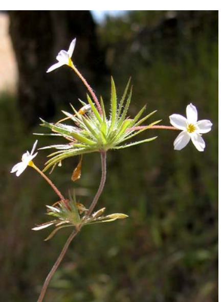
Pinklobe Linanthus Linanthus androsaceus Native Annual Phlox Family