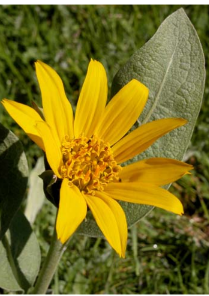
Gray Mule's Ear Wyethia helenioides Native Perennial Sunflower Family