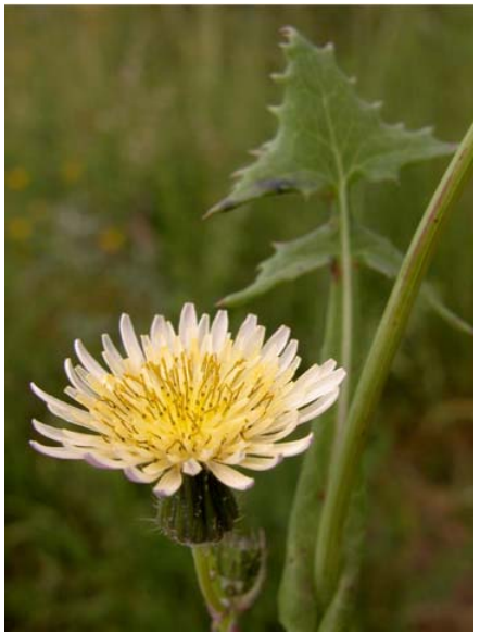
Common Sow Thistle Sonchus oleraceus Introduced Annual Sunflower Family