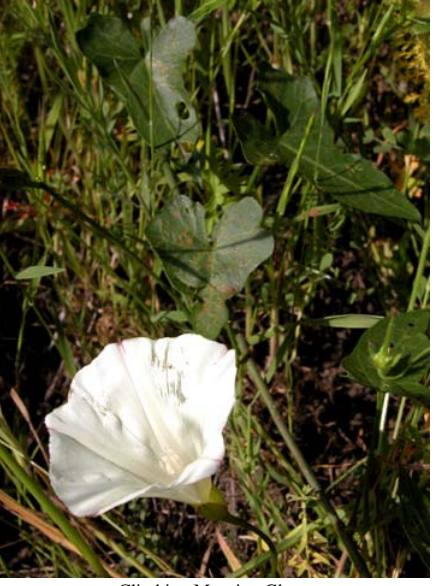
Climbing Morning Glory Calystegia purpurata ssp. purpurata Native Perennial Morning-Glory Family