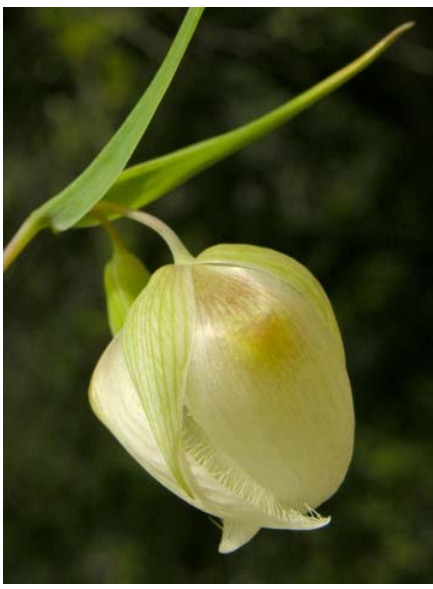
White Fairy Lantern Calochortus albus Native Perennial Lily Family