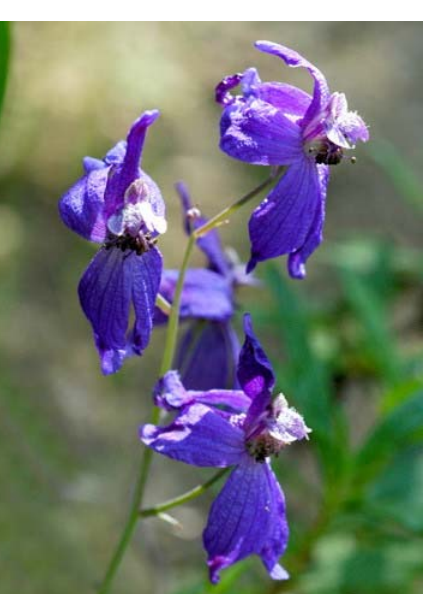
Royal Larkspur Delphinium variegatum ssp. variegatum Native Perennial Buttercup Family