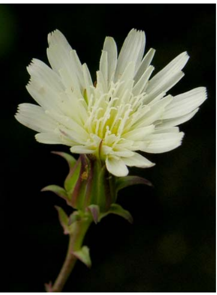
California White Chicory Rafinesquia californica Native Annual Sunflower Family