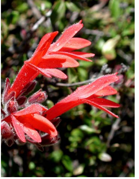
California Fuchsia Epilobium canum ssp. canum Native Perennial Evening Primrose Family