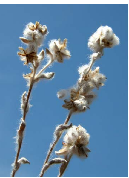
Slender Cottonweed Micropus californicus var. californicus Native Annual Sunflower Family