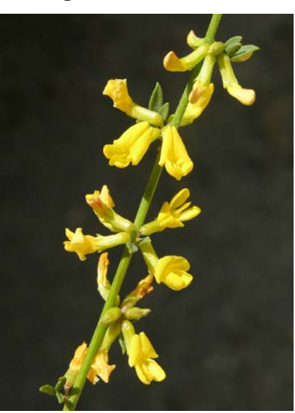
Deerweed Lotus scoparius var. scoparius Native Perennial Pea Family