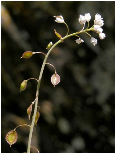
Hairy Fringepod Thysanocarpus curvipes Native Annual Mustard Family