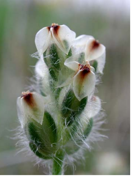
California Dwarf Plantain Plantago erecta Native Annual Plantain Family

Common Chickweed Stellaria media Introduced Annual Pink Family