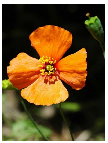
Wind Poppy Stylomecon heterophylla Native Annual Poppy Family