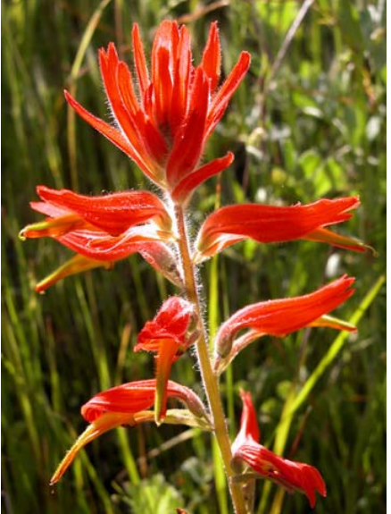
Common Indian Paintbrush Castilleja affinis ssp. affinis Native Perennial Snapdragon Family