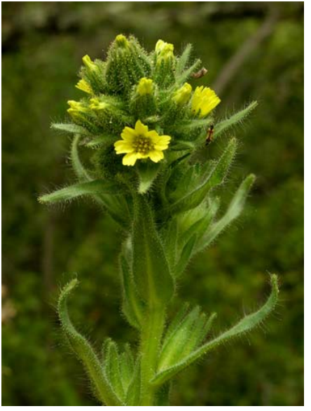
Common / Coast Tarweed Madia sativa Native Annual Sunflower Family