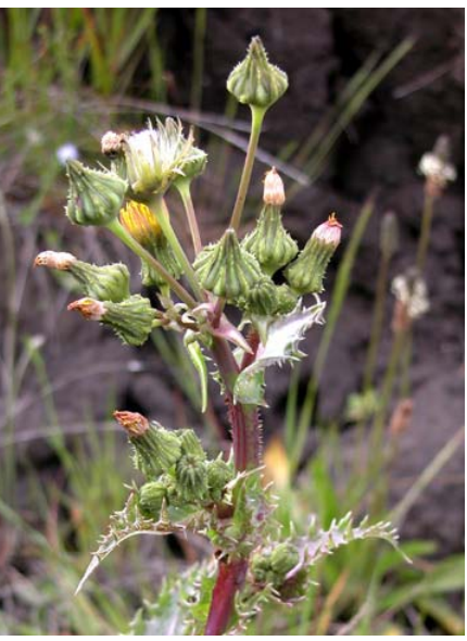
Prickly Sow Thistle Sonchus asper ssp. asper Introduced Annual Sunflower Family