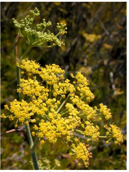
Sweet Fennel Foeniculum vulgare Introduced Perennial Carrot Family