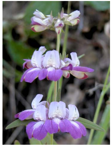
Chinese Houses Collinsia heterophylla Native Annual Snapdragon Family