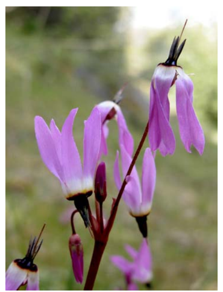
Mosquitobills Shooting Star Dodecatheon hendersonii Native Perennial Primrose Family