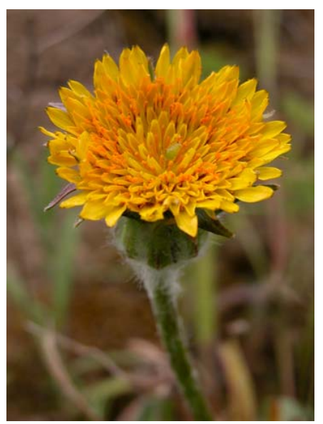
Large-flower Native Dandelion Agoseris grandiflora Native Perennial Sunflower Family