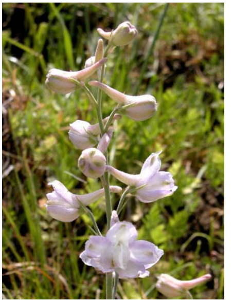
Pale Western Larkspur Delphinium hesperium ssp. pallescens Native Perennial Buttercup Family