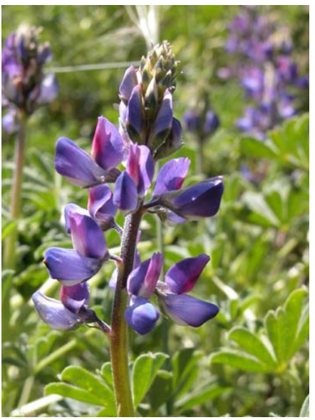
Arroyo Lupine Lupinus succulentus Native Annual Pea Family