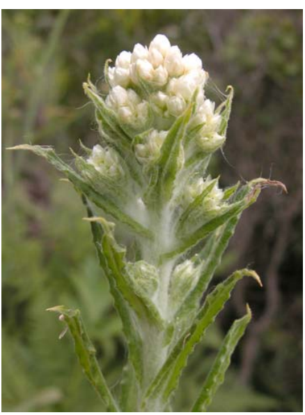
California Everlasting Gnaphalium californicum Native Biennial Sunflower Family