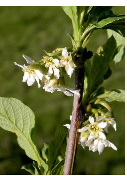
Oso Berry Oemleria cerasiformis Native Perennial Rose Family