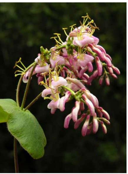
Hairy Vine Honeysuckle Lonicera hispidula var. vacillans Native Perennial Honeysuckle Family