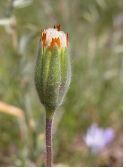
Blow Wives Achyrachaena mollis Native Annual Sunflower Family