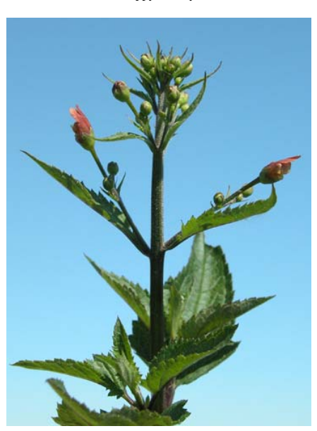
California Figwort Scrophularia californica ssp. californica Native Perennial Snapdragon Family