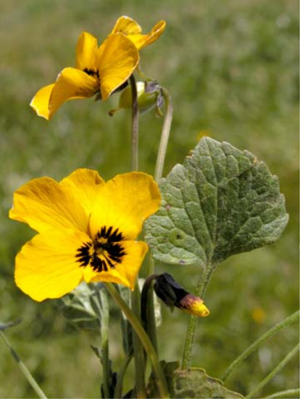
Johnny-Jump-Up / Wild Pansy Viola pedunculata Native Perennial Violet Family