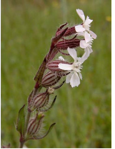
Windmill Pink Silene gallica Introduced Annual Pink Family