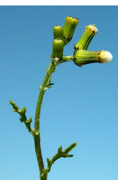
Common Groundsel Senecio vulgaris Introduced Annual Sunflower Family