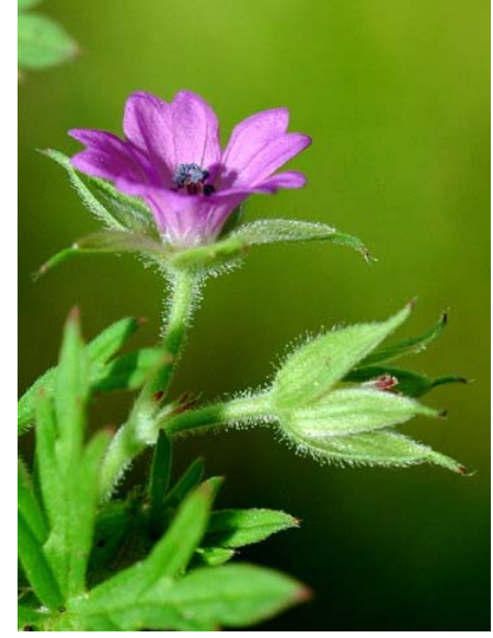
Purpletip Cut-leaf Geranium Geranium dissectum Introduced Annual Geranium Family