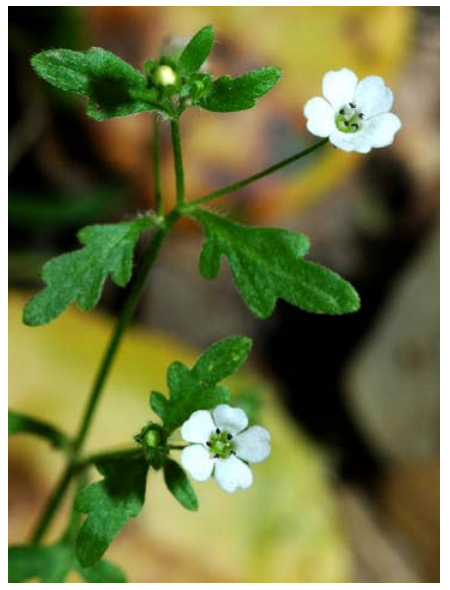
Variable-leaf Nemophila Nemophila heterophylla Native Annual Waterleaf Family