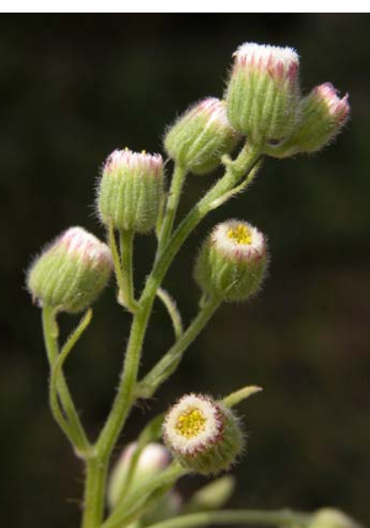
South American Horseweed Conyza bonariensis Introduced Annual Sunflower Family