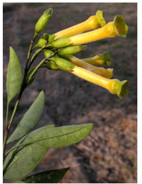
Tree Tobacco Nicotiana glauca Introduced Perennial Nightshade Family