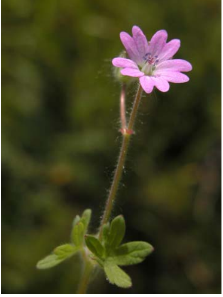
Hairy Dove's Foot Geranium Geranium molle Introduced Annual Geranium Family