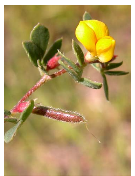
California Lotus Lotus wrangelianus Native Annual Pea Family