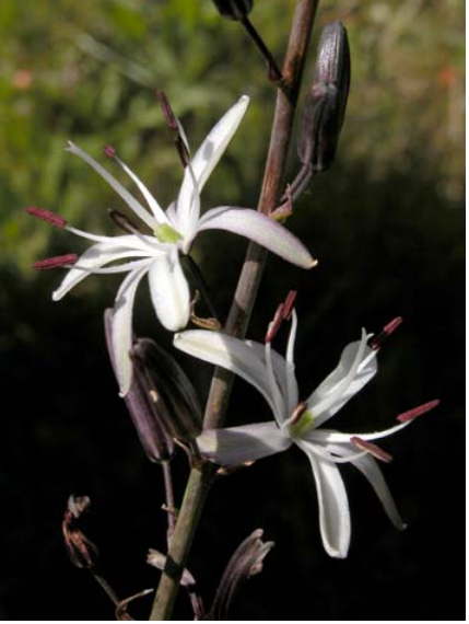
Common Soap Plant Chlorogalum pomeridianum var. pomeridianum Native Perennial Lily Family