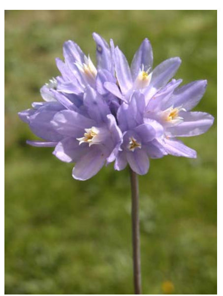
Blue Dicks Dichelostemma capitatum ssp. capitatum Native Perennial Lily Family