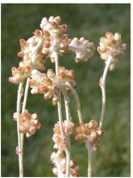
Weedy Cudweed Gnaphalium luteo-album Introduced Annual Sunflower Family