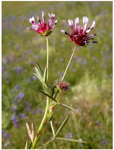
Tomcat Clover Trifolium willdenovii Native Annual Pea Family