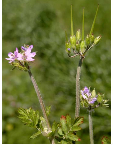
White-stem Filaree Erodium moschatum Introduced Annual Geranium Family