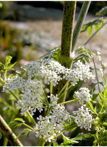
Poison Hemlock Conium maculatum Introduced Biennial Carrot Family