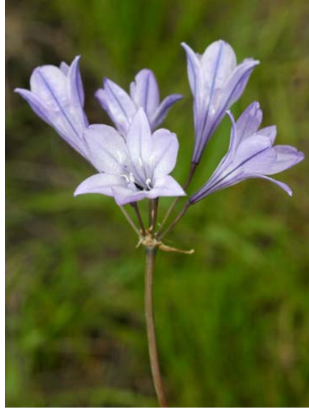
Ithuriel's Spear Triteleia laxa Native Perennial Lily Family