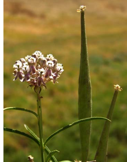
Whorled/Narrow-leaf Milkweed Asclepias fascicularis Native Perennial Milkweed Family