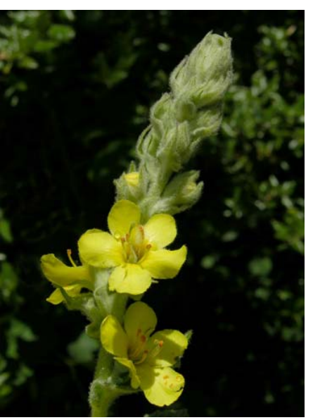
Common Woolly Mullein Verbascum thapsus Introduced Biennial Snapdragon Family