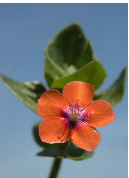
Scarlet Pimpernel Anagallis arvensis Introduced Annual Primrose Family