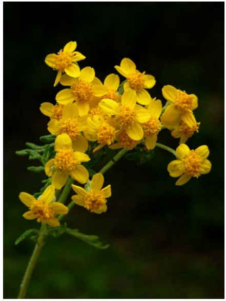
Golden Yarrow Eriophyllum confertiflorum var. confertiflorum Native Perennial Sunflower Family