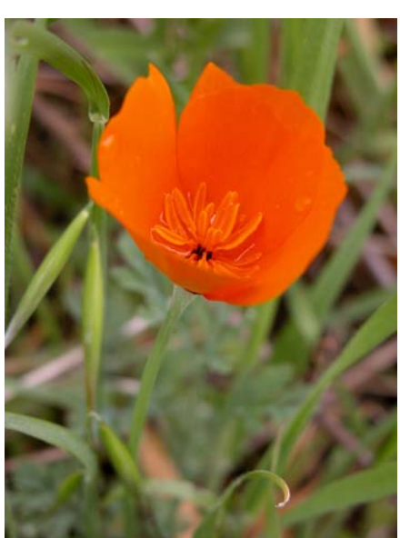
California Poppy Eschscholzia californica Native Perennial Poppy Family