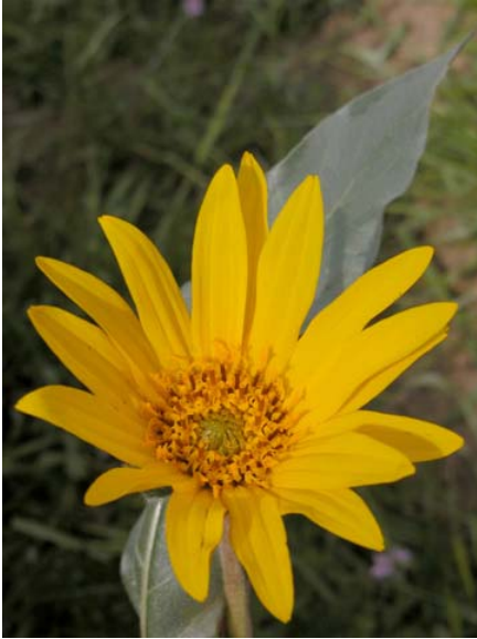
Narrow-leaf Mule's Ear Wyethia angustifolia Native Perennial Sunflower Family