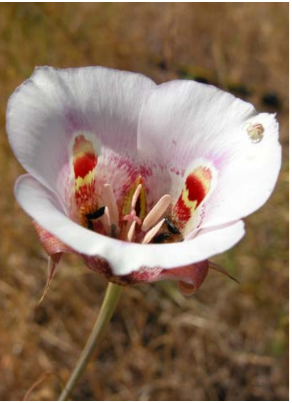
White Butterfly Mariposa Lily Calochortus venustus Native Perennial Lily Family