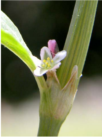
Common Yard Knotweed Polygonum arenastrum Introduced Annual Buckwheat Family