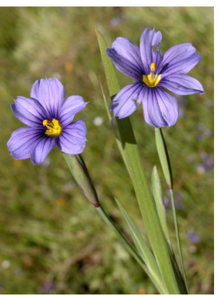
Blue-eyed Grass Sisyrinchium bellum Native Perennial Iris Family