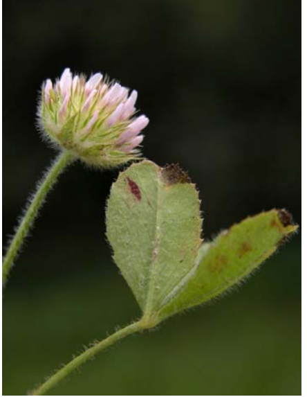
Small-head Clover Trifolium microcephalum Native Annual Pea Family