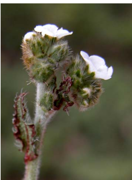
Nievitas Popcorn Flower Plagiobothrys nothofulvus Native Annual Borage Family