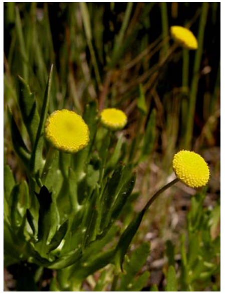
Brass Buttons Cotula coronopifolia Introduced Perennial Sunflower Family