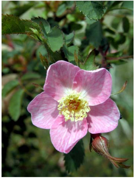
California Wild Rose Rosa californica Native Perennial Rose Family