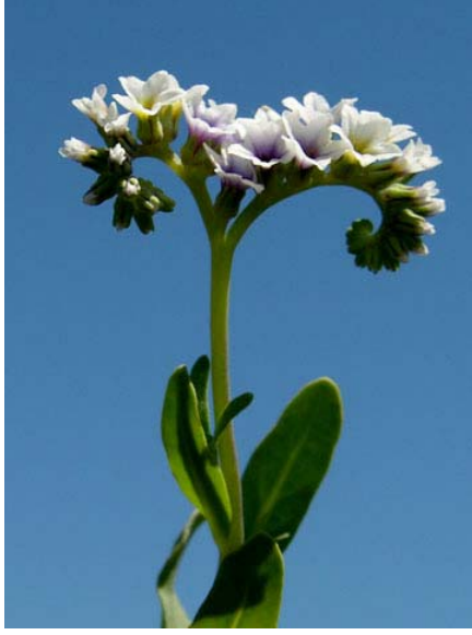
Seaside Heliotrope Heliotropium curassavicum Native Perennial Borage Family