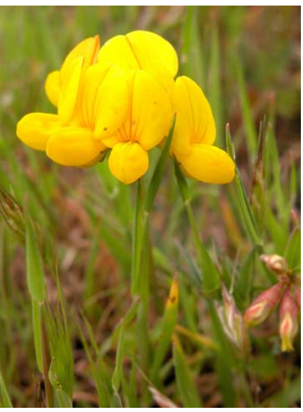
Bird's-foot Deerweed Lotus corniculatus Introduced Perennial Pea Family