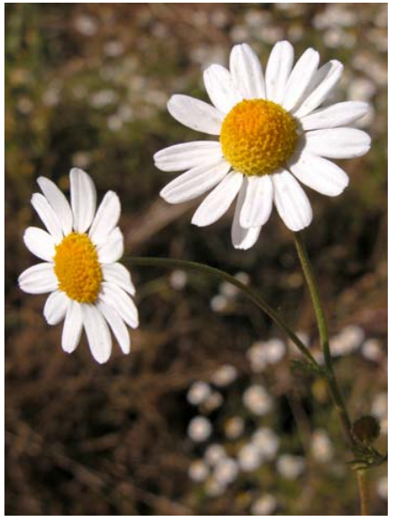
Mayweed Anthemis cotula Introduced Annual Sunflower Family