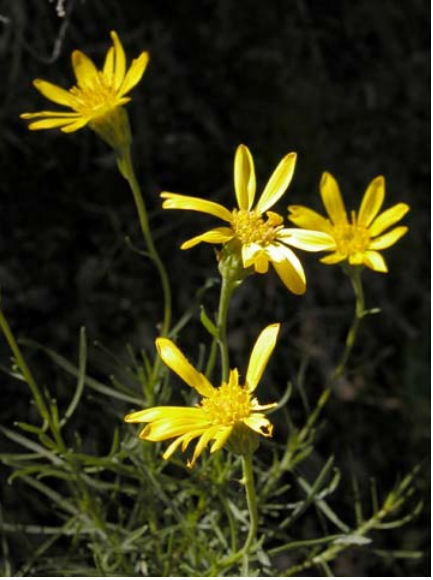
Interior Golden Bush Ericameria linearifolia Native Perennial Sunflower Family