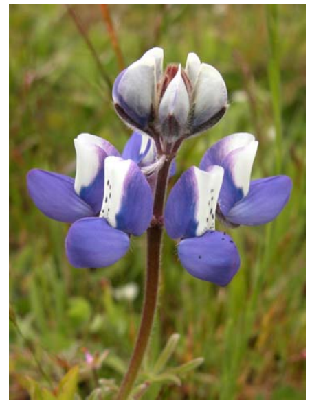
Douglas Sky Lupine Lupinus nanus Native Annual Pea Family