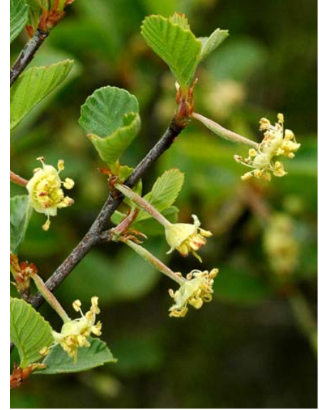
Birch-leaf Mt. Mahogany Cercocarpus betuloides var. betuloides Native Perennial Rose Family