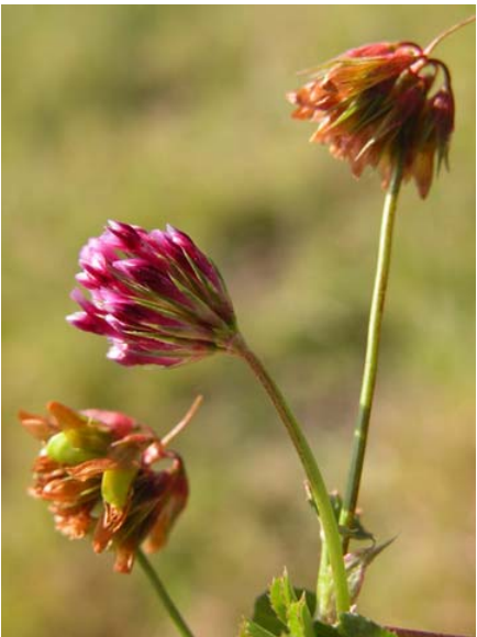
Pinpoint Clover Trifolium gracilentum var. gracilentum Native Annual Pea Family