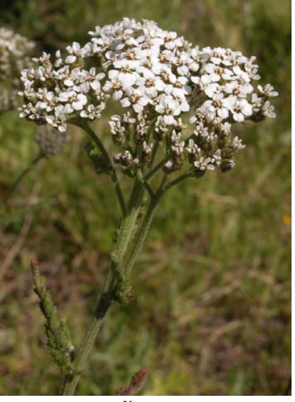
Yarrow Achillea millefolium Native Perennial Sunflower Family