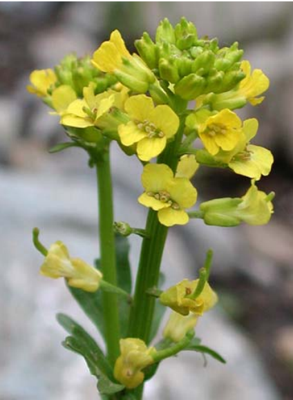
Erect-pod Winter Cress Barbarea orthoceras Native Perennial Mustard Family