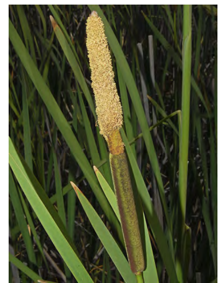
BROAD-LEAVED CATTAIL (Typha latifolia) Native Perennial - Cattail Family - (Jun-Jul) - Unpolluted to nutrient-rich freshwater (brackish) marshes - Plant 4.9-9.8' tall. Widest leaves 0.4-1.1" wide. Flower cluster with no gap between flower types.