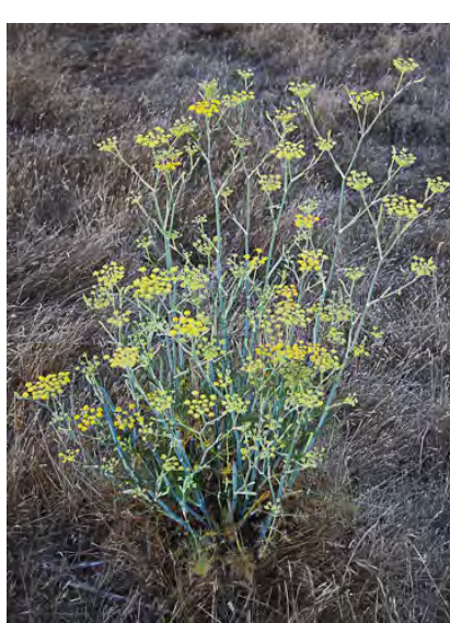
FENNEL (Foeniculum vulgare) Naturalized Perennial - Carrot Family - (May–Sep) - Roadsides, disturbed sites - Plants 3-6.5' tall, anise-scented. Stems waxy-blue, canelike. Flowers yellow. Leaf segments thread-like, edible when young. INVASIVE weed.