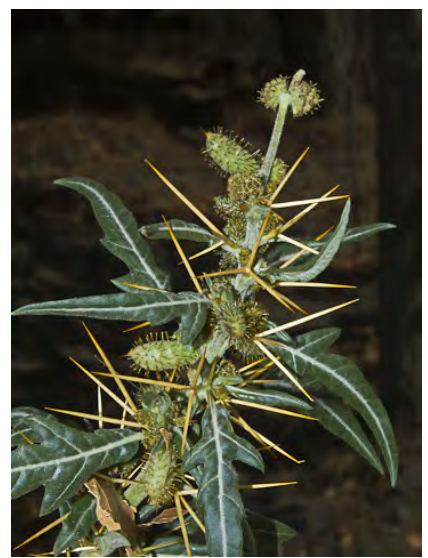
SPINY COCKLEBUR (Xanthium spinosum) Native Annual - Sunflower Family - (Jul-Oct) - Disturbed, seasonally wet, often alkaline sites, in grassland, marshes, watercourses - Plant 4-24". Stem node spines 0.6-1.2" long, golden, gen 3-lobed. Bur 0.4-0.5" long.