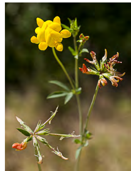
BIRD'S-FOOT TREFOIL (Lotus corniculatus) Naturalized Perennial - Pea Family - (Jun-Sep) -Open, disturbed areas - Leaflets 5, 0.16-0.9" long. Flower cluster 3-7 flowered on 0.6-4.7" stalk. Flowers bright yellow, 0.4-0.55" long, banner often reddish.