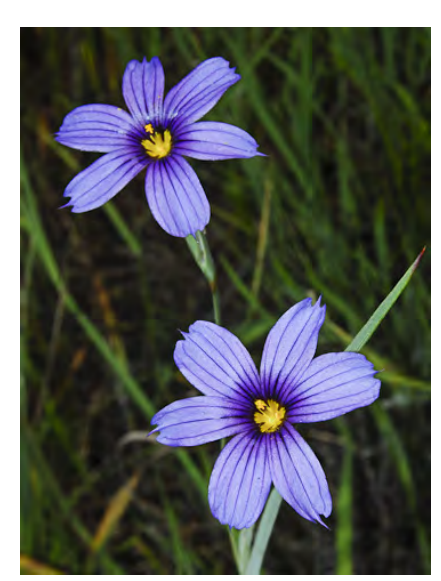
WESTERN BLUE-EYED-GRASS (Sisyrinchium bellum) Native Perennial - Iris Family - (Mar-May) - Common. Open, gen moist, grassy areas, woodland - Stem < 25" tall. Leaves iris-like. Petals 6, blue-purple with dark veins, 0.4-0.7" long.