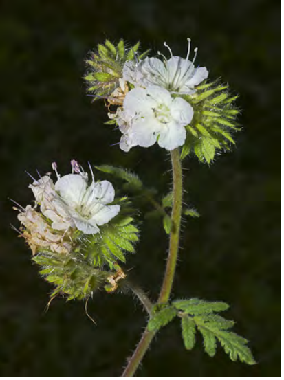
BRANCHED PHACELIA (Phacelia ramosissima) Native Perennial - Borage Family - (Apr-Oct) -Diverse habitats incl salt marshes, canyons -Plant 1-5' tall. Leaves divided. Flowers 0.2-0.3" long, white to lavender. Seeds 2-4.