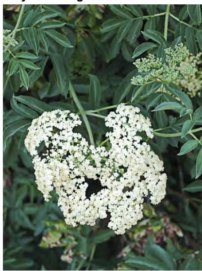
BLUE ELDERBERRY (Sambucus nigra subsp. caerulea) Native Perennial - Muskroot Family - (Mar-Sep) - Common. Streambanks, open places in forest - Shrub 7-26' tall. Flower cluster flat-topped, 1.6-13" diam, petals spreading. Fruits waxy blue-black.