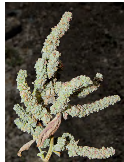
SAN JOAQUIN SPEARSCALE (Atriplex joaquinana) Native Annual - Goosefoot Family - (Apr–Sep) - Alkaline soils - Plant 4-40" tall, upright. Leaf w/stalk, blade 0.4-2.8" long, oval to triangular. Flower clusters at top of the stem, dense