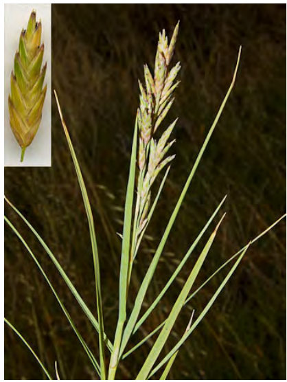
SALT GRASS (Distichlis spicata) Native Perennial - Grass Family - (Apr-Sep) - Salt marshes, coastal dunes, moist, alkaline areas - Stem 4-20" long. Leaves 0.8-4" long, flat, stiff. Flower cluster 0.8-3" long, narrow. Spikelets straw-colored to purple, 2-20/group, 0.24-0.8" long