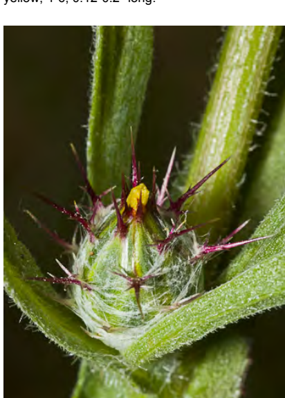
TOCALOTE (Centaurea melitensis) Naturalized Annual - Sunflower Family - (Apr–Jul) - Disturbed fields, open woodland - Plant 4-39", gray-hairy, resinous. Leaves 0.8-6" long. Flowers yellow, 0.4-0.8" long, bracts tipped w/purple spines. NOXIOUS weed.