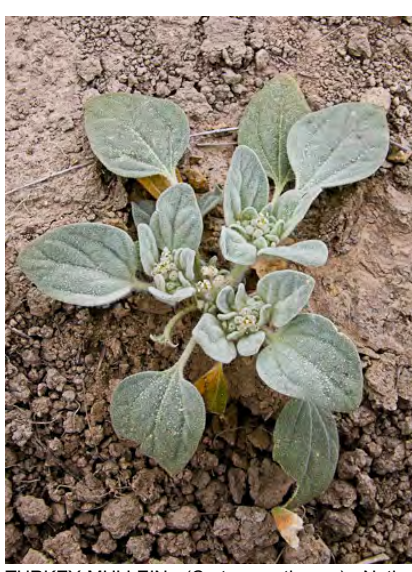
TURKEY-MULLEIN (Croton setigerus) Native Annual - Spurge Family - (May-Oct) - Dry, open, often disturbed areas - Plant < 8" tall, moundlike, covered w/long stiff hairs. Leaf blade 0.4-2" long, oval. TOXIC to livestock.