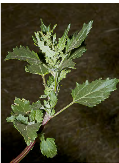
WALL GOOSEFOOT (Chenopodium murale) Naturalized Annual - Goosefoot Family - (All year) - Common. Disturbed areas, fields - Plant 6-24" tall. Leaves dark green, shiny, broad, toothed. Seeds horizontal, bumpy, rim angled.