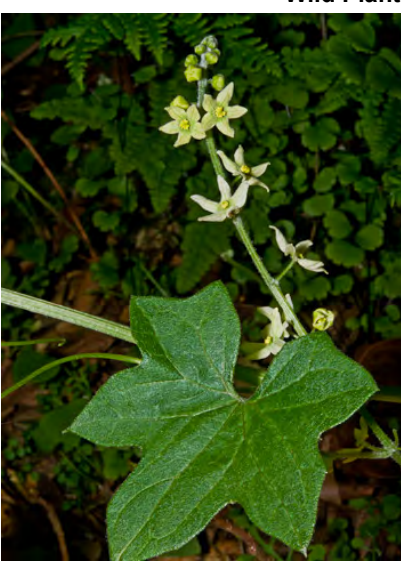
CALIFORNIA MAN-ROOT (Marah fabacea) Native Perennial - Gourd Family - (Feb-Apr) - Streamsides, washes, shrubby open areas - Vine 6-20' long. Leaves moderately lobed. Flowers cream or white, < 0.3" wide. Fruit spiny all over.