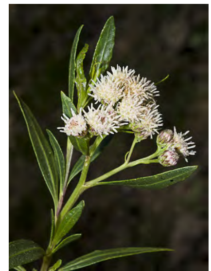
MULE FAT (Baccharis salicifolia subsp. salicifolia) Native Perennial - Sunflower Family - (All year) - Riparian woodland, canyon bottoms, disturbed sites, often forming thickets - Shrub < 13' tall, often sticky. Leaves to 6" long, with 1-3 main veins.