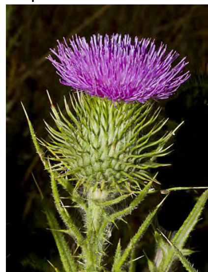
BULL THISTLE (Cirsium vulgare) Naturalized Biennial - Sunflower Family - (May–Oct) -Common. Disturbed areas - Plant 12-79" tall. Top of leaves bristly; leaf base forming decurrent wings on stem. Flowers purple, gen 1-2" wide. NOXIOUS weed.