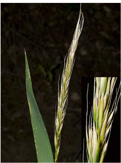
BEARDLESS WILD RYE (Elymus triticoides) Native Perennial - Grass Family - (Jun-Jul) - Dry to moist, often saline, meadows - Plant 18-50" tall, from rhizomes. Flower cluster 2-8" long. Spikelets generally 2/node. Lemmas 3-7, 0.2-0.5" long, awn to 0.12" long.