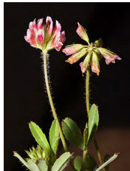
DECEIVING CLOVER (Trifolium bifidum var. decipiens) Native Annual - Pea Family (Apr–Jun) - Open, grassy areas, forest - Leaflet tip square/notched. Flower small, yellow to pink-purple, soon reflex. Flower stalk top sparsely hairy.