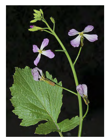
RADISH (Raphanus sativus) Naturalized Annual - Mustard Family - (May–Jul) - Disturbed areas, fields - Stem 16-51" long. Petals 0.6-1" long, white to purple. Fruit a fat cylinder w/constrictions between seeds. INVASIVE weed.