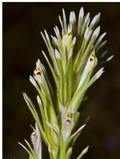
VALLEY TASSELS (Castilleja attenuata) Native Annual - Broom-rape Family - (Mar–May) - Grassland - Plant 4-20" tall, hairy, non-sticky. Leaves 0.8-3.1" long, narrow, 0-3 lobes. Flower cluster 1-12" long, narrow, tips white or pale yellow.