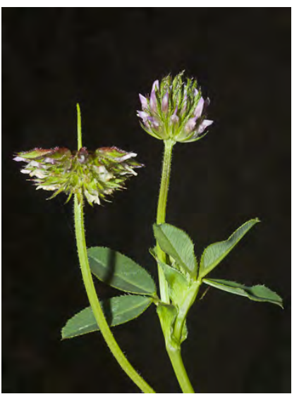
PINPOINT CLOVER (Trifolium gracilentum) Native Annual - Pea Family - (Mar–Jun) - Open, disturbed places, occas serpentine - Leaflet tips not deep-notched. Reflexed pink-purple flowers w/point. Flower bracts completely smooth.