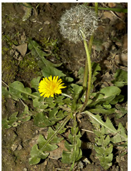
COMMON DANDELION (Taraxacum officinale) Naturalized Biennial-Perennial - Sunflower Family - (All year) - Abundant. Esp disturbed areas - Stem hollow. Leaves bright green with sharp down-pointing lobes. Outer head bracts reflexed. Fruit ~ brown.