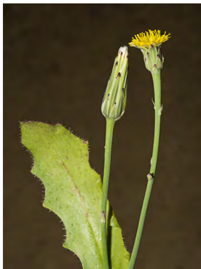
SMOOTH CAT'S-EAR (Hypochaeris glabra) Naturalized Annual - Sunflower Family -(Mar-Jun) - Common. Disturbed areas, grassland, open woodland - Plant 4-24" tall, smooth. Rays 0.2-0.3" long, barely > head bracts. Only inner fruit beaked. INVASIVE.