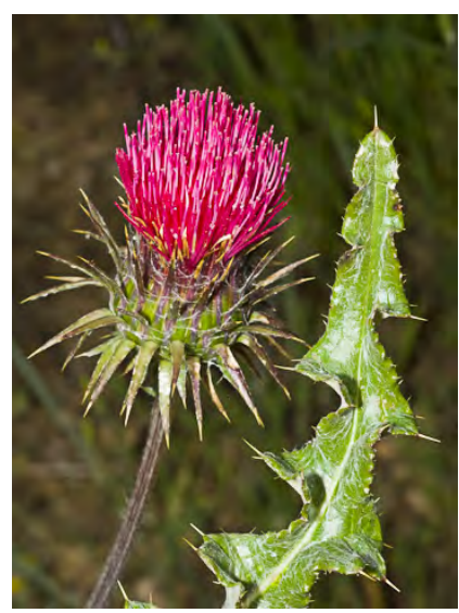
VENUS THISTLE (Cirsium occidentale var. venustum) Native Biennial - Sunflower Family - (May-Jul) - Disturbed areas, grassland, woodland - Plant 1.6-9.8' tall. Head bract cluster 0.6-2" tall, 0.6-3" diam. Flowers gen bright red-pink to red, 0.9-1.4" long.