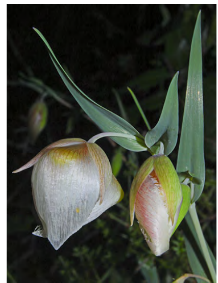
WHITE GLOBE LILY (Calochortus albus) Native Perennial - Lily Family - (Apr-Jun) - Common. Shady to open woodland, scrub - Stem 2-8 dm. Leaves grasslike. Flowers 2-many, hanging, closed at tip. Sepals 10-15 mm. Petals white to pink, 20-25 mm long.