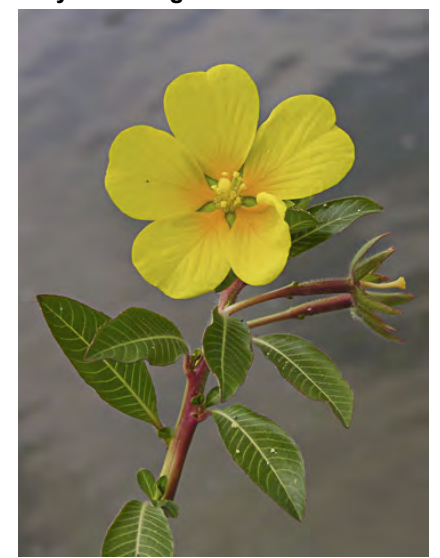
YELLOW WATER PRIMROSE (Ludwigia peploides subsp. peploides) Native Perennial - Evening Primrose Family - (May-Oct) - Lakeshores, streambanks, seasonal wetlands - Aquatic w/floating-creeping stems. Leaves alternate. Sepals 0.25-0.4", petals 0.35-0.5".