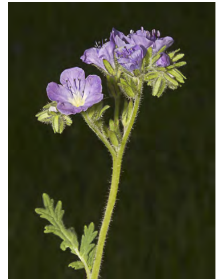
FIELD PHACELIA (Phacelia ciliata) Native Annual - Borage Family - (Feb–Jun) - Clay or gravelly slopes in grassland, fields - Plant 4-22" tall. Leaves deeply lobed to divided. Flowers 0.3-0.4" long, purple. Flower bracts large w/raised veins. Seeds 4.