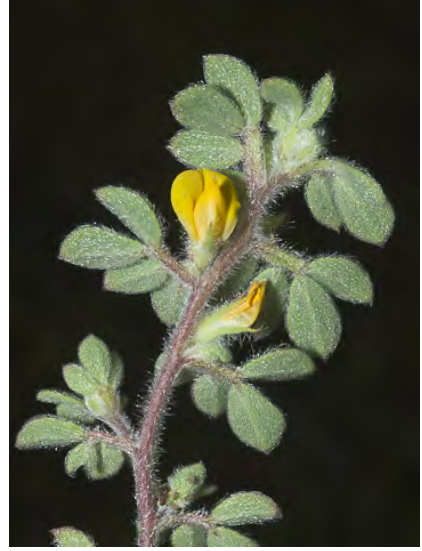
COLCHITA (Acmispon brachycarpus) Native Annual - Pea Family - (Mar–Jun) - Abundant. Grassland, oak and pine woodland, desert flats and mtns, roadsides - Soft, densely hairy, < 16" tall. Flower yellow, almost stemless, bract lobes 1-2x flower tube.