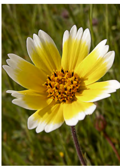
TIDY-TIPS (Layia platyglossa) Native Annual - Sunflower Family - (Feb–Jul) - Many habitats - Plant 1-28" tall, sticky. Leaves narrow. Ray flowers 0.1-0.8" long, yellow w/white tips. Disk anthers gen dark purple.