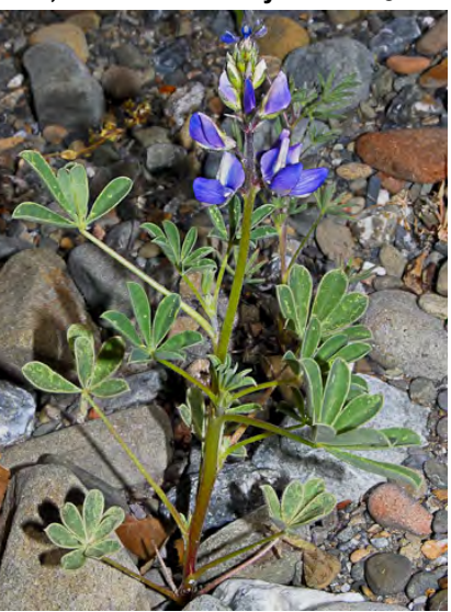
ARROYO LUPINE (Lupinus succulentus) Native Annual - Pea Family - (Feb-May) - Abundant. Open or disturbed areas, often seeded on roadbanks - Plant 8-40" tall, fleshy, sparsely hairy. Flowers 0.5-0.7" long, whorled, gen blue-purple, petal claws short-hairy.