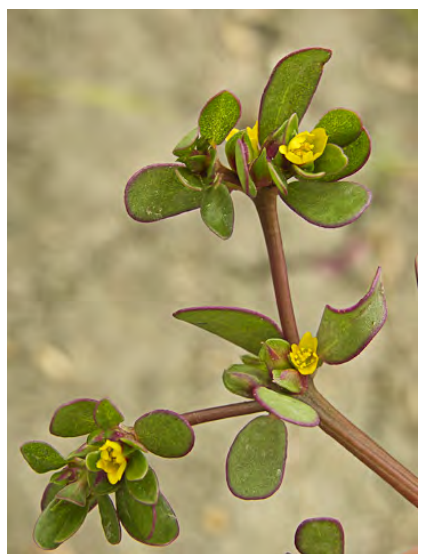
PURSLANE (Portulaca oleracea) Naturalized Perennial - Purslane Family - (Late spring-early fall) - Disturbed soil - Stem 1.2-16" long, spreading. Leaves 0.12-1.2" long, ~ spoon-shaped, flat. Flowers solitary. Petals yellow, 4-6, 0.12-0.2" long.