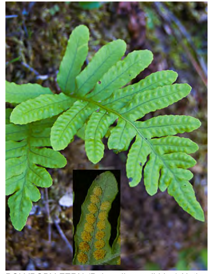
POLYPODY FERN (Polypodium calirhiza) Native Perennial - Polypody Family - - - On plants, rocky cliffs or outcrops, roadcuts, often granitic or volcanic, rarely dunes - Leaf blades 4-8" long, often widest above base, deeply lobed.