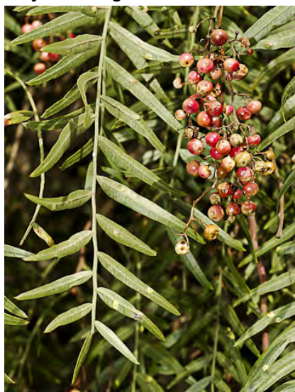
PEPPER TREE (Schinus molle) Naturalized Perennial - Sumac Family - (Jun-Aug) - Washes, slopes, abandoned fields - Tree 16-60' tall. Flowers white to yellow. Leaves compound, leaflets stemless. Fruits pink to red, 0.2-0.3"