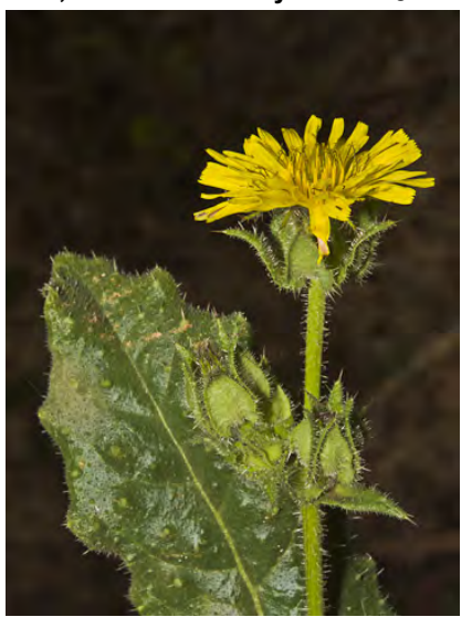
BRISTLY oX-TONGUE (Helminthotheca echioides) Naturalized Annual-Biennial - Sunflower Family - (All year) - Common. Disturbed areas - Stem 1-6.5' tall, bristly. Leaf 2-8" long, covered with prickly bumps. Flower heads 0.8-1.6" wide. INVASIVE weed.