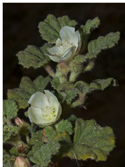
ALKAL-MALLOW (Malvella leprosa) Native Perennial - Mallow Family - (Apr-Nov) - Valleys, gen saline - Stem 4-16" long. Leaf blade 04.-1.4" long, toothed, densely short-hairy. Petals cream-white to yellow, 0.4-0.6" long.