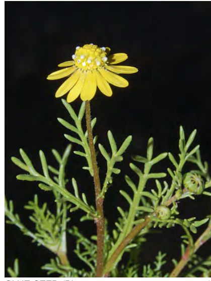
GLUE-SEED (Blennosperma nanum var. nanum) Native Annual - Sunflower Family - (Jan-May) - Open, grassy areas, often margins of seeps or vernal pools - Plant 1.2-5"+, succulent, branched. Leaf 1.2-2.4"+ long, 5-15 lobed. Flower bracts purple-tipped w/tuft of hairs.