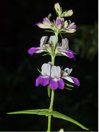
CHINESE-HOUSES (Collinsia heterophylla var. heterophylla) Native Annual - Plantain Family - (Mar–Jun) - Shady places in chaparral, open mixed woodland, oak woodland - Plant 4-20" tall. Flowers 0.6-0.8" long, upper lip whitish.