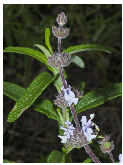
BLACK SAGE (Salvia mellifera) Native Perennial - Mint Family - (Mar–Jun) - Coastal-sage scrub, lower chaparral - Shrub 3.3-6' tall. Leaf 1-2.8" long, toothed, hairy underneath. Flowers blue, white or lavender, tube 0.2-0.4" long, in clusters 0.6-1.6" wide.