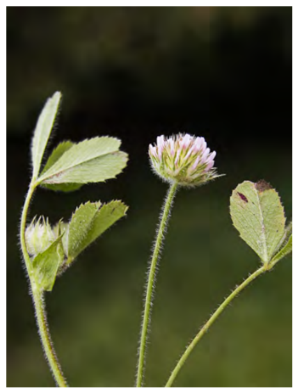
SMALL-HEAD CLOVER (Trifolium microcephalum) Native Annual - Pea Family - (Apr–Aug) - Streambanks, moist, disturbed areas, roadsides, serpentine, conifer forest - Hairy. Head bract cup-like. Flowers pink to lavender, calyx lobes smooth-edged, > flowers.