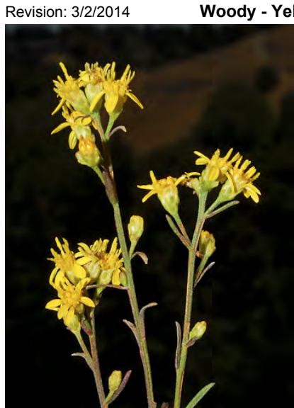
CALIFORNIA MATCHWEED (Gutierrezia californica) Native Perennial - Sunflower Family -(Jul–Nov) - Grassland, arid woodland and shrubland, serpentine - Stem 8-40" long, woodly base. Leaf narrow, flat, <= 2" long. Ray flowers 4-13, 0.1-0.3" long.