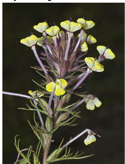
YELLOW JOHNNY-TUCK (Triphysaria eriantha subsp. eriantha) Native Annual - Broom-rape Family - (Mar–May) - Grassland, foothills - Plant 4-14" tall, purple. Leaves 0.4-2" long, 3-7 lobed. Flowers yellow with dark purple beak, 0.4-1" long.