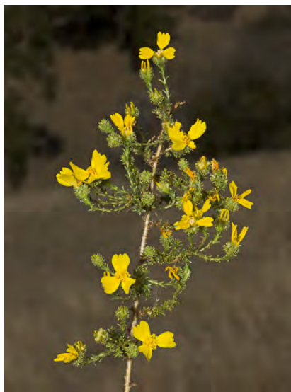
SAN JOAQUIN TARPLANT (Holocarpha obconica) Native Annual - Sunflower Family - (Apr-Nov) - Grassland - Plant 4-32" tall, outer portion sticky. Flower heads in flat-topped or open clusters. Ray flowers 4-9; disk flowers 11-21, anthers yellow to brown.