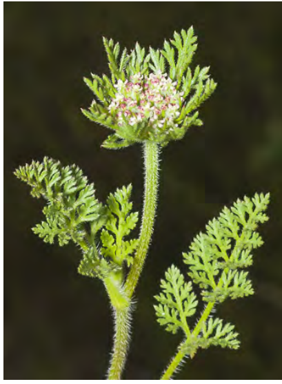
RATTLESNAKE WEED (Daucus pusillus) Native Annual - Carrot Family - (Apr-Jun) - Rocky or sandy places - Plant 1-35" tall, usually < 20". Flower clusters with < 13 flowers, all white. Young roots edible. Sap TOXIC to some people, causing dermittis.