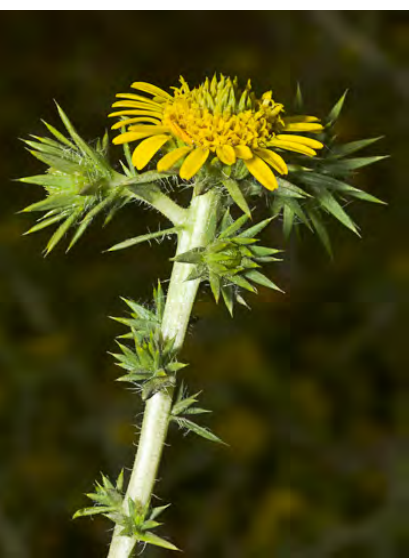
COMMON SPIKEWEED (Centromadia pungens subsp. pungens) Native Annual - Sunflower Family - (Apr-Nov) - Grassland, saltbush scrub, disturbed sites - Spiny. Leaves smooth or rough to the touch.