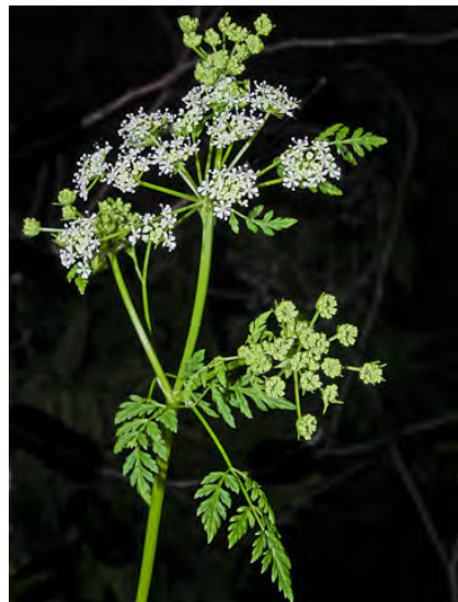
POISON HEMLOCK (Conium maculatum) Naturalized Biennial - Carrot Family - (Apr-Jul) -Common. Moist, esp disturbed places - Plants 2-10' tall. Stems purple-spotted. Leaves fern-like, gen 2x divided. Flowers white. TOXIC. INVASIVE weed.