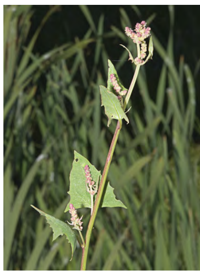
FAT-HEN (Atriplex prostrata) Native Annual -Goosefoot Family - (Apr-Oct) - Wet places, marshes - Plant 4-48" tall, branched at base. Leaves alternate, blades 0.4-3.5" long, triangular, green, not dense-scaly underneath.