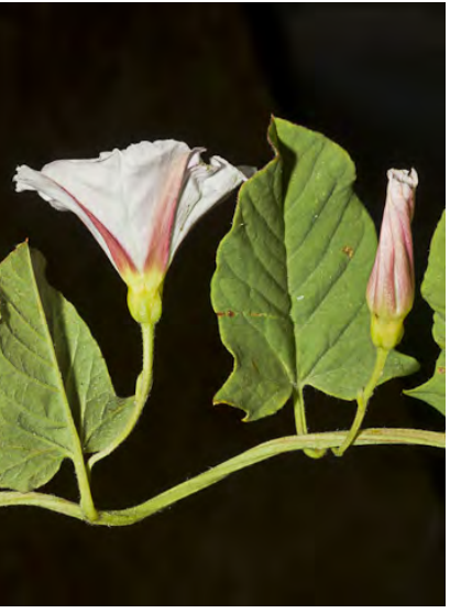
BINDWEED (Convolvulus arvensis) Naturalized Perennial - Morning-glory Family - (Mar–Oct) - Roadsides, open areas in many pl communities - Trailing. Leaf 0.8-1.2" long, w/round tip, pointed lobes. Flowers white to pink, 0.8-1" long. NOXIOUS.