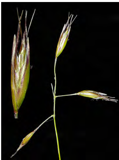
CALIFORNIA OAT GRASS (Danthonia californica) Native Perennial - Grass Family - (Apr-Aug) - Gen moist meadows, open woodland - Stem 12-52" tall. Flower cluster 0.8-2.4" long. Spikelets 3-6, 0.5-1" long, awn 0.16-0.5" long.