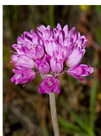
JEWELED ONION (Allium serra) Native Perennial - Onion or Garlic Family - (Apr–May) - Common. Grassy slopes - Flowers pink to rose, crowded, 10-40. "Petals" about 0.2" long, ± erect, ± lance-shaped, papery and folded over fruit when in fruit.