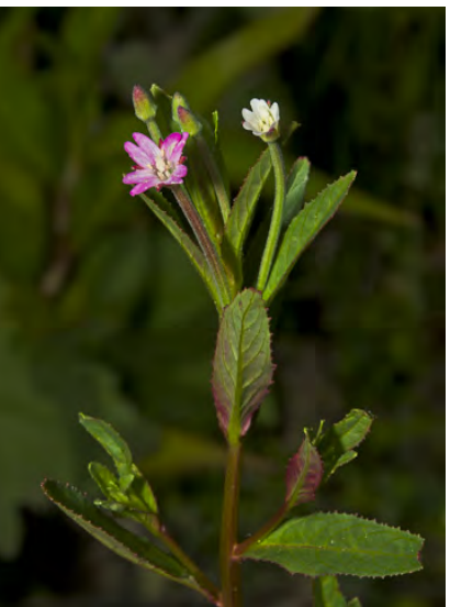
COMMON WILLOWHERB (Epilobium ciliatum subsp. ciliatum) Native Perennial - Evening Primrose Family - (Jun-Oct) - Common. Disturbed places, moist meadows, streambanks, roadsides - Plant 20-48" tall, smooth or short-hairy. Petals 2-6 mm, white to pink.