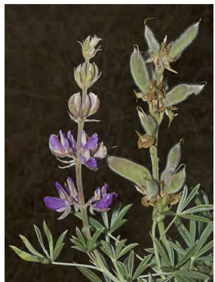
SUMMER LUPINE (Lupinus formosus var. formosus) Native Perennial - Pea Family -(Apr–Sep) - Dry clay soils, grassland, open areas under pines, gen in valleys - Plant 8-32", low growing. Leaves hairy. Flowers purple, hairless, summer/fall blooming.