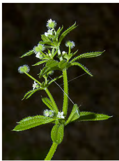
GOOSE GRASS (Galium aparine) Native Annual - Madder Family - (Apr-Jun) - Grassy, ± shady places - Stem 12-35" long, weak, brittle. Leaves 0.5-1.6" long, in whorls of 6-8. Flowers white, 4-lobed. Fruits covered w/short, hooked hairs.