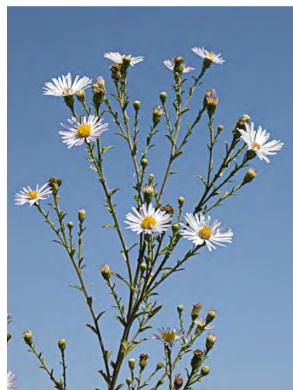
COMMON CALIFORNIA-ASTER (Corethrogyne filaginifolia) Native Perennial - Sunflower Family - (Jul-Nov) - Coastal scrub, chaparral, grassland, foothill woodland, forest - Heads 3-20+, calyx length 2x width. Rays white to pink-purple.