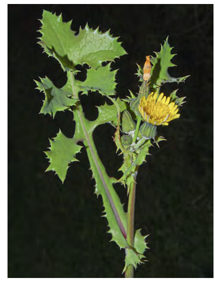
PRICKLY SOW THISTLE (Sonchus asper subsp. asper) Naturalized Annual - Sunflower Family - (All year) - Common. Slightly moist disturbed sites, along streams - Plant 4-48". Leaf teeth prickly. Basal lobes of upper leaves rounded, curving downward.