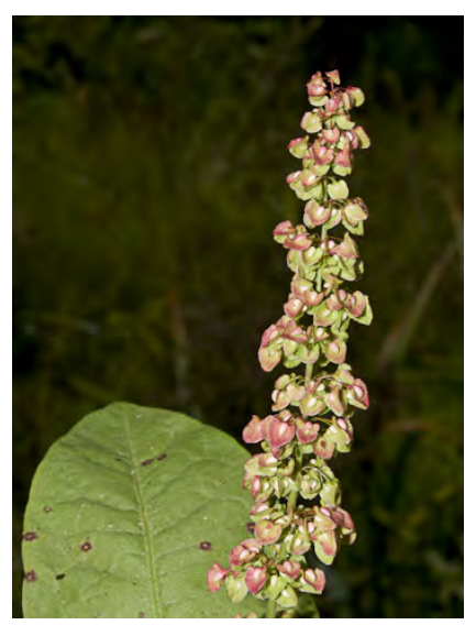
CURLY DOCK (Rumex crispus) Naturalized Perennial - Buckwheat Family - (All year) - Abundant. Disturbed places - Stem 16-39" tall. Flower cluster dense, valves 0.2-0.24", winged around tubercles, smooth edged. 1 tubercle enlarged. INVASIVE.