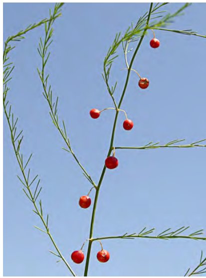
GARDEN ASPARAGUS (Asparagus officinalis subsp. officinalis) Naturalized Perennial - Lily Family - (Mar–Sep) - Disturbed places, roadsides, fields - Stem 3-10' tall. Flowers green-white, 3-7 mm long. Fruits red, ~0.3" long. Escaped garden vegetable.