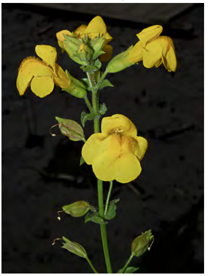
GOLDEN MONKEYFLOWER (Mimulus guttatus) Native Perennial - Lopseed Family - (Mar-Aug) - Common. Wet places, gen terrestrial, occ emergent or floating in mats - Plant 0.8-60". Flower yellow, gen > 0.8" long; mature bracts flattened sideways, inflated in fruit.