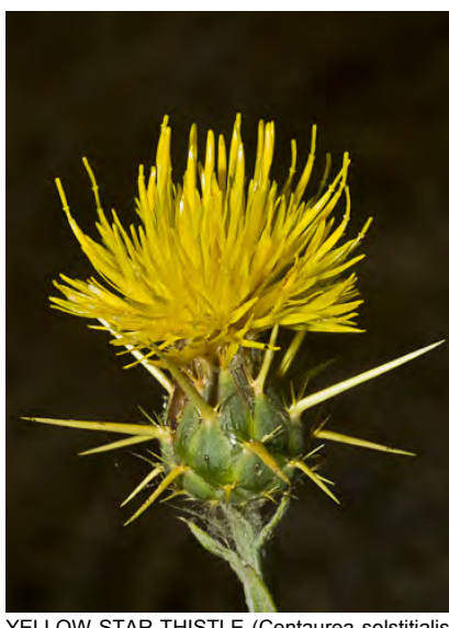
YELLOW STAR-THISTLE (Centaurea solstitialis) Naturalized Annual - Sunflower Family -(May-Oct) - Invasive, roadsides, disturbed grassland or woodland - Plant 4-39" tall. Leaves woolly, extend down the stem. Flower bract spines 0.4-1" long. NOXIOUS weed.