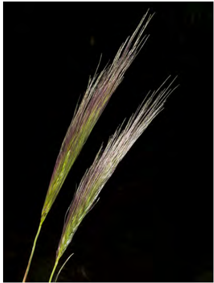
FOXTAIL BARLEY (Hordeum jubatum subsp. jubatum) Native Annual-Perennial - Grass Family - (May–Jul) - Roadsides, disturbed areas, meadows, marshes - Stem 8-32", densely tufted. Leaf blades to 6" long. Central lemma awn 1-3.5" long.