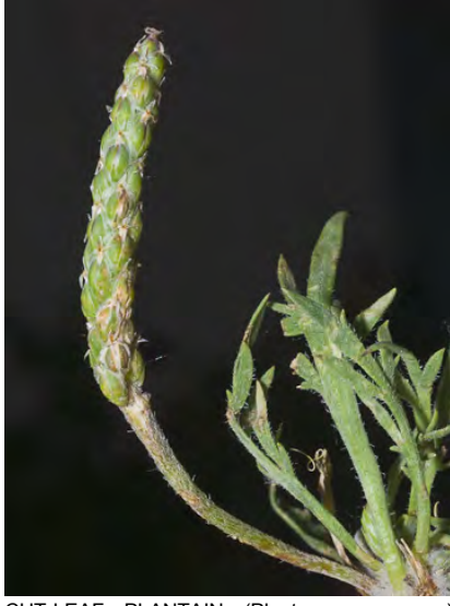
CUT-LEAF PLANTAIN (Plantago coronopus) Native Annual-Biennial - Plantain Family (Apr-Jul) - Coastal bluffs, salt marshes, trampled places, chaparral, grassy flats - Leaves 1.6-10" long, tooth-like lobes. Flower: stems 1-6, 2-20" tall, cluster 0.8-8" long.