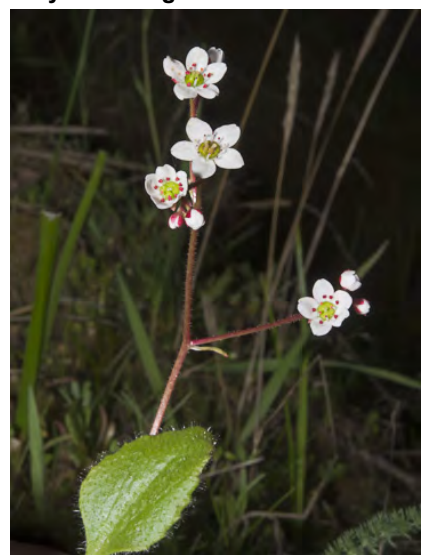
CALIFORNIA SAXIFRAGE (Micranthes californica) Native Perennial - Saxifrage Family - (Feb-May(Jun)) - Moist, shady places - Plant 6-14" tall. Leaves 1.6-4" long, at base, egg-shaped, >= 0.08" wide, toothed. Petals white, 0.1-0.18" long.