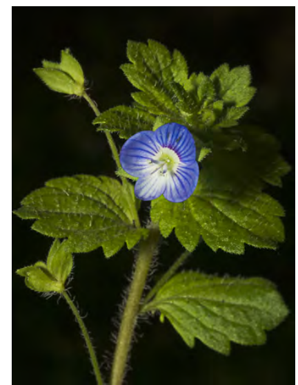
PERSIAN SPEEDWELL (Veronica persica) Naturalized Annual - Plantain Family - (Feb-May) - Wet, disturbed areas, fields - Stem 2-24" long, crawling. Flowers on 0.6-1.2" long stalks. Flowers blue, purple-lined with a white center.