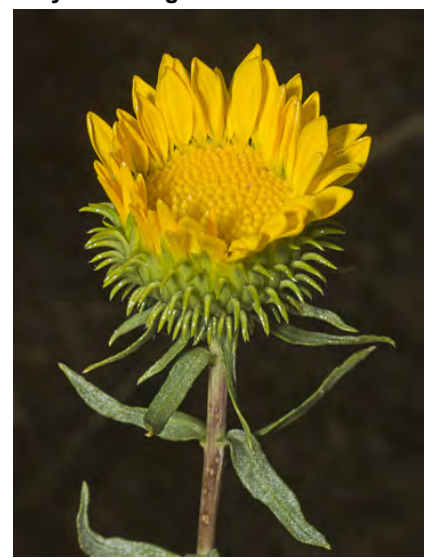
GREAT VALLEY GUMPLANT (Grindelia camporum) Native Perennial - Sunflower Family - (May-Nov) - Sandy or saline bottomland, roadsides - Stem non-woody, 2-8' tall, whitish. Leaves gen resinous. Head to 1.2" wide, bracts bend downward.