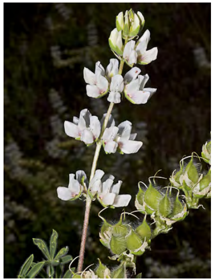
GULLY LUPINE (Lupinus microcarpus var. densiflorus) Native Annual - Pea Family - (Apr–Jun) - Abundant. Open or disturbed areas, occ seeded on roadbanks - Plant 4-32" tall, hairy. Flowers 0.3-0.7" long, white to yellow. Flower bract hairs few, short.