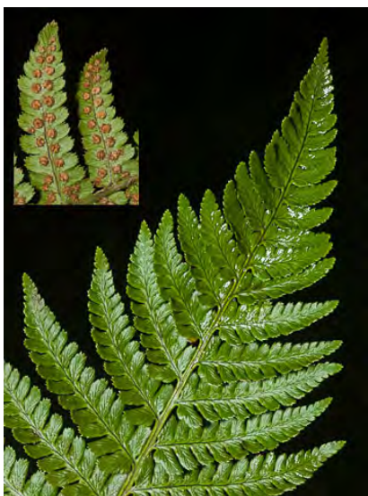
COASTAL WOOD FERN (Dryopteris arguta) Native Perennial - Wood Fern Family - - - Locally common. Open, wooded slopes, caves - Leaf 12-24" long,5-12" wide, divided 1-2 times. Segments generally with spine-tipped teeth.