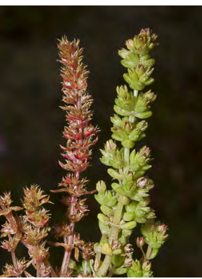
PYGMY WEED (Crassula connata) Native Annual - Stonecrop Family - (Feb–May) - Open areas - Plants 0.8-2.4"+ tall, red in age. Flowers < 0.1" long, 2 per node; Sepals 4, pointed end. Petals generally < sepals.