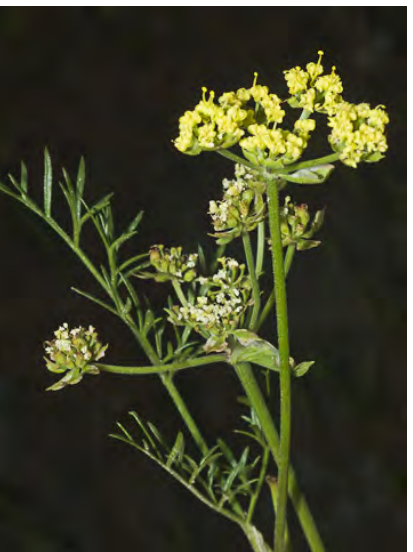
BLADDER PARSNIP (Lomatium utriculatum) Native Perennial - Carrot Family - (Feb-May) -Open grassy slopes, meadows, woodland - Plant 4-20" tall, leafy stem. Leaf lobes linear, bases broad. Flowers bright yellow above unfused, round bractlets. Fruit winged.