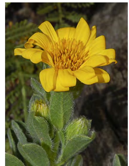
BOLANDER GOLDENASTER (Heterotheca sessiliflora subsp. bolanderi) Native Perennial - Sunflower Family - (Jun-Sep) - Dunes, headlands, grassy coastal slopes - Plant gen 8-28", unbranched. Leaves wide, soft-hairy. Heads clustered, rays 0.3-0.6".