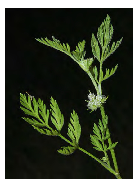
SHORT SOCK-DESTROYER (Torilis nodosa) Naturalized Annual - Carrot Family - (Apr—Jun) - Disturbed places - Plant spreading, 4-20" tall. Flowers white to red, clusters dense, < leaf. Fruit ~ 0.1" long, uncurved bristles on outer surface, bumps inside.