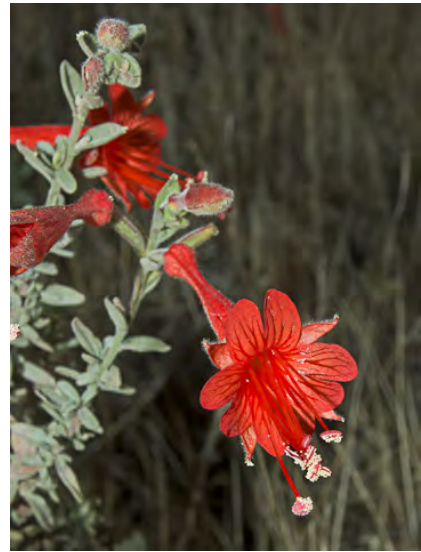
CALIFORNIA FUCHSIA (Epilobium canum subsp. canum) Native Perennial - Evening Primrose Family - (Jun-Dec) - Dry slopes, ridges - Plant hairy, gen sticky with a woody base. Leaf 0.3-2.8" long, gray to green. Flowers red-orange, floral tube 0.8-1.2" long.