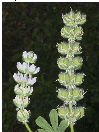
CHICK LUPINE (Lupinus microcarpus var. microcarpus) Native Annual - Pea Family -(Mar–Jun) - Abundant. Open or disturbed areas, occ seeded on roadbanks - Plant 4-32", hairy. Leaves smooth above. Flowers gen pink to purple. Flower bracts shaggy.