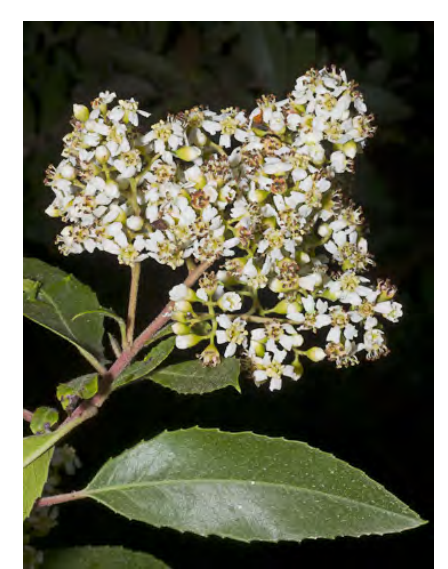
CHRISTMAS BERRY / TOYON (Heteromeles arbutifolia) Native Perennial - Rose Family - ((May)Jun-Aug) - Chaparral, oak woodland, mixed-evergreen forest - Shrub-tree < 33' tall, evergreen. Leaf 2-4" long. Petals white, < 0.16" long. Fruit bright red.