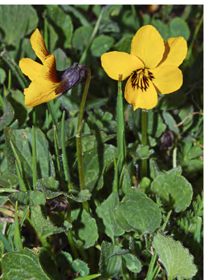
JOHNNY-JUMP-UP (Viola pedunculata) Native Perennial - Violet Family - (Feb-Apr) - Open, grassy slopes, hillsides, chaparral, oak woodland, gen full sun - Plant 2-15" tall. No basal leaves. Petals gold-yellow, lower 3 brown-veined, upper 2 red-brown on back.