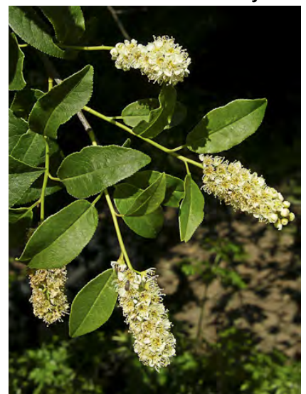
WESTERN CHOKE CHERRY (Prunus virginiana var. demissa) Native Perennial - Rose Family - (May–Jun) - Rocky slopes, canyons, scrubland, oak/pine woodland - Shrub/tree < 20'. Leaf blade 1.2-4" long. Flowers 18+, petals white, 0.16-0.3"