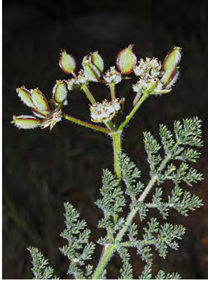
WOOLLY FRUITED DESERTPARSLEY (Lomatium dasycarpum subsp. dasycarpum) Native Perennial - Carrot Family - (Mar–Jun) - Rocky (gen serpentine), chaparral, woodland - Plant 4-20", short-hairy. Flowers greenish-white, petals and fruit hairy.