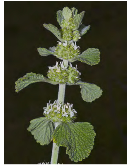
COMMON HOREHOUND (Marrubium vulgare) Naturalized Perennial - Mint Family - (Mar-Nov) - Disturbed sites, gen overgrazed pastures - Stem 4-24" long. Leaf blades 0.6-2.2" long. Flower bract w/10 hook-tipped teeth. Flowers white, ~0.2" long. INVASIVE.