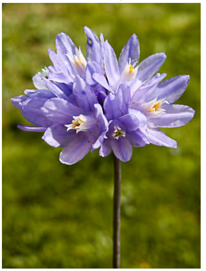
BLUE DICKS (Dichelostemma capitatum subsp. capitatum) Native Perennial - Brodiaea Family - (Mar-Jun) - Open woodland, scrub, desert, grassland - Plant 2-28" tall. Flowers blue-purple, not narrowed in the middle. Stamens 6. Early spring bloomer.