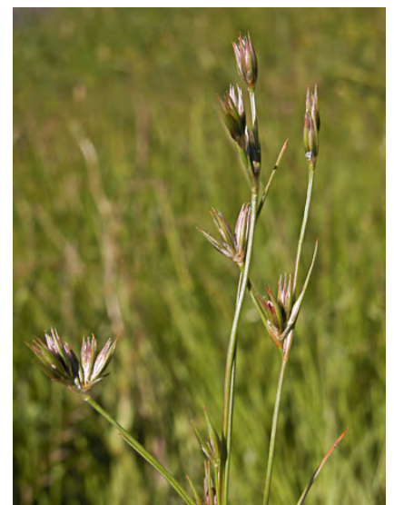
CLUSTERED TOAD RUSH (Juncus bufonius var. congestus) Native Annual - Rush Family - (Apr-Aug) - Drying pools, shores, disturbed ground, gen saline - Stem 1-4" tall, gen brached from base, ~0.04" wide. Flower cluster crowded. Flowers 0.2-0.3" long.