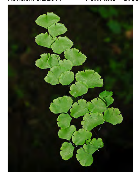
CALIFORNIA MAIDENHAIR (Adiantum jordanii) Native Perennial - Brake Fern Family - - shaded hillsides, moist woodland - Leaves 8-28" long with many rounded symmetrical segments, each with < 4 irregular lobes. Cultivated. Sudden Oak Death carrier.