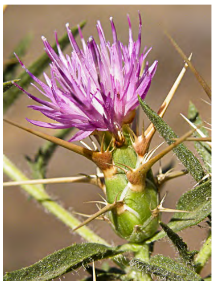
PURPLE STAR-THISTLE (Centaurea calcitrapa) Naturalized Annual-Biennial - Sunflower Family -(Apr-Nov) - Pastures, disturbed places - Plant 8-40"+. Basal leaves 1-2x divided into narrow lobes. Flowers purple with spiny bracts. NOXIOUS weed.