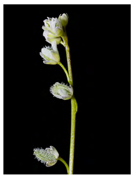
DWARF SANDWEED (Athysanus pusillus) Native Annual - Mustard Family - (Feb-Jun) - Grassy, open slopes, rocky outcrops, chaparral, flats, floodplains, cliffs, ledges - Stem 2-12" long, spindly. Flower cluster 1-sided. Petals white, ~0.1" long. Fruits round, hairy.