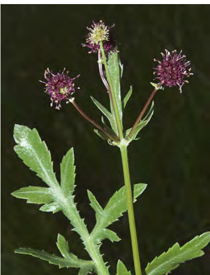
PURPLE SANICLE (Sanicula bipinnatifida) Native Perennial - Carrot Family - (Mar–May) - Open grassland, gen on serpentine, or pine/oak woodland - Plant 5-24" tall. Leaves 1.6-7.5" long, 1-2x divided on a winged central axis. Flowers dark purple. Fruits prickly.