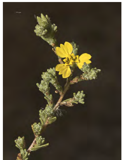
LOBB TARWEED (Deinandra lobbii) Native Annual - Sunflower Family - (May–Dec) - Grassland, open woodland, sagebrush scrub, disturbed areas - Flowers yellow, rays 3, 0.1-0.2" long; disks 3, anthers dark, pappus present.