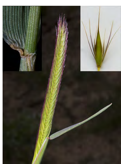
NORTHERN BARLEY (Hordeum brachyantherum subsp. brachyantherum) Native Perennial - Grass Family - (May–Aug) - Meadows, pastures, streambanks - Stem 1-3' tall, gen robust. Leaf sheaths gen smooth, blade < 7.5" long. Lemma awn < 0.25".