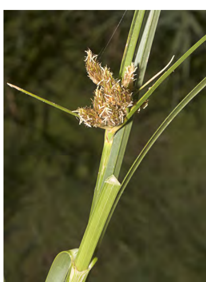
SEACOAST BULRUSH (Bolboschoenus robustus) Native Perennial - Sedge Family - (Summer) - Brackish to saline coastal marshes - Plant 20-60" tall. Stem sharply triangular. Flower cluster dense, stemless, just above bracts. Spikelets 5-25, 0.4-1.2" long.