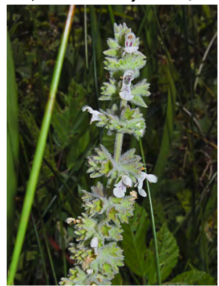
WHITE-STEM HEDGE-NETTLEE (Stachys albens) Native Perennial - Mint Family - (May-Oct) - Swamps, seeps - Plant 1.6-8' tall, densely cobwebby-hairy. Leaf felty, blade 1.2-6" long. Flowers white to pink; tube 0.2-0.4" long, hidden in bracts.