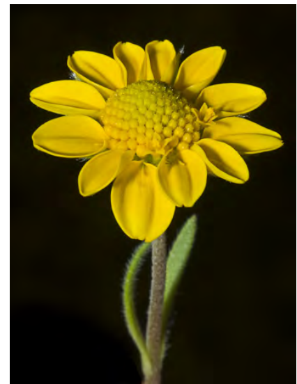
CALIFORNIA GOLDFIELDS (Lasthenia californica subsp. californica) Native Annual - Sunflower Family - (Feb-Jun) - Many habitats - Stem < 16" tall, hairy. Leaves 0.3-2.8" long, <0.25" wide, smooth edged. Head bracts 4-13, not joined. Rays 0.2-0.7" long.