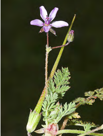
REDSTEM FILAREE (Erodium cicutarium) Naturalized Annual - Geranium Family (Feb-Sep) - Open, disturbed sites, grassland, scrub - Stem 4-20". Leaves compound, leaflets dissected. Sepal tip bristly. Petal pink to purple. Fruit beak 0.8-2". INVASIVE.