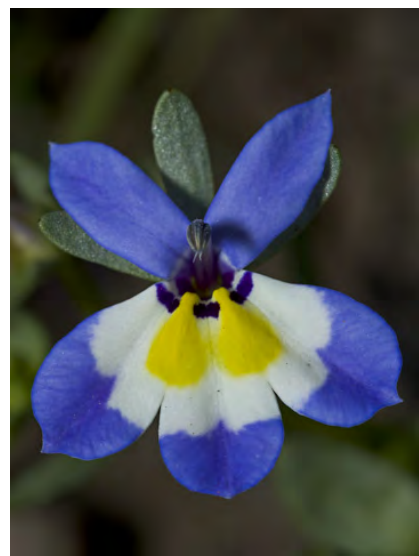
FLATFACE DOWNINGIA (Downingia pulchella) Native Annual - Bellflower Family - (Apr–Jun) -Vernal pools, roadside ditches - Plant 8-16". Flower 0.3-0.8" long, 2 yellow patches alternate w/3 purple patches. Anthers 0.1"+, exserted.