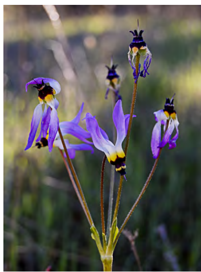
PADRE SHOOTING STAR (Dodecatheon clevelandii subsp. patulum) Native Perennial - Primrose Family - (Mar-May) - Moist places, often on serpentine or in ± alkaline sites - Leaf blade length >2x width. Flowers often white. Filiment tube w/light spots below anthers.