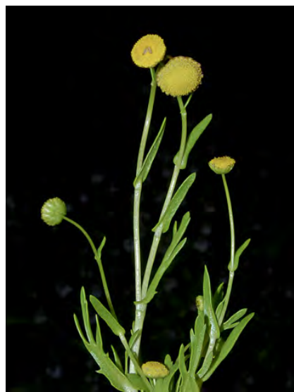
BRASS-BUTTONS (Cotula coronopifolia) Naturalized Perennial - Sunflower Family -(Mar-Dec) - Common. Saline and freshwater marshes, mud flats - Plant 2-16"+ tall, smooth, ± fleshy. Leaves linear to lance-shaped w/linear teeth or lobes. INVASIVE.