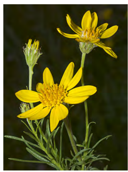
INTERIOR GOLDENBUSH (Ericameria linearifolia) Native Perennial - Sunflower Family - (Mar–May) - Dry slopes, valleys, foothill and desert woodland, saltbush and creosote-bush scrub - Shrub/subshrub, 16-60". Heads large, yellow, solitary; rays 0.3-0.8" long.