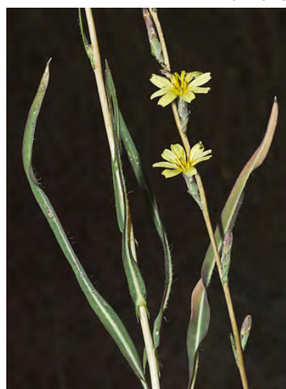
WILLOW LETTUCE (Lactuca saligna) Naturalized Annual - Sunflower Family - (Jul-Nov) - Roadsides, grassland - Stem 12-39" tall. Leaf lobes entire or few-toothed, no prickles underneath. Flowers 5-12, pale yellow, open in morning.