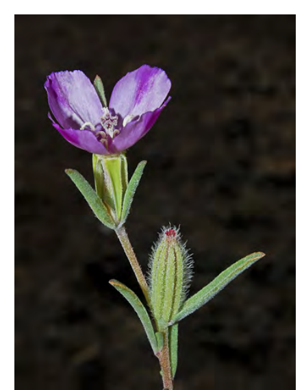
FOUR-SPOT (Clarkia purpurea subsp. quadrivulnera) Native Annual - Evening Primrose Family - (Apr-Aug) - Common. Open, grassy or shrubby places - Buds erect. Petals < 0.6", lavender to dark red. Ovary 8-grooved. Sepals 1's or 2's.