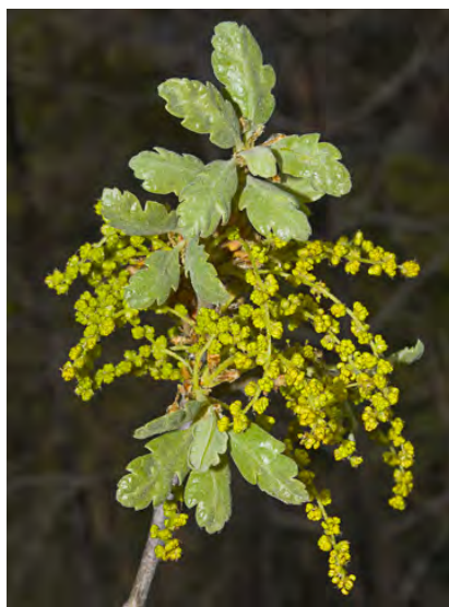
BLUE OAK (Quercus douglasii) Native Perennial - Oak Family - (Apr-May) - Dry slopes, interior foothills, woodland - Tree 20-66', deciduous. Bark checkered into scales. Leaves 1.2-2.4" long, bluish green, unlobed to shallowly lobed, lacking brieflers.