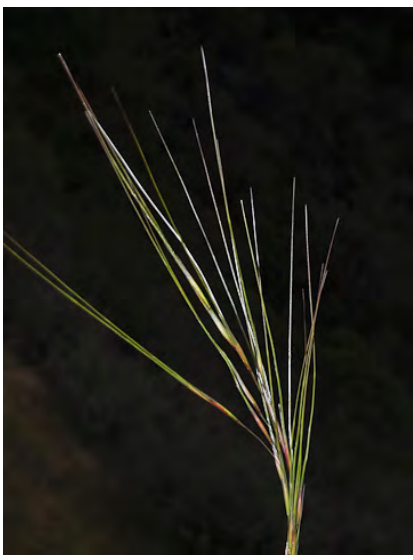
PURPLE NEEDLE GRASS (Stipa pulchra) Native Perennial - Grass Family - (Mar–Jun) - Oak woodland, chaparral, grassland - Stem 14-39" long. Leaf blade 4-8" long. Glumes 0.5-0.8" long, ~equal. Awn 1.6-4" long, last segment straight.