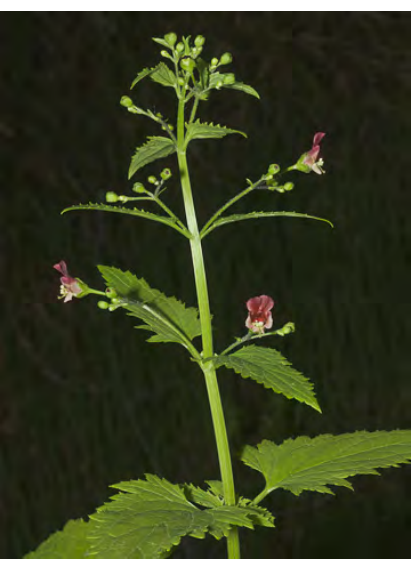
CALIFORNIA FIGWORT (Scrophularia californica) Native Perennial - Snapdragon Family - (Mar-Jul) - Common; damp places, chaparral, roadsides - Stem 2.6-4' tall, square x-section. Leaves opposite, to 7" long, triangular, toothed. Flowers 0.3-0.5" long, upper lips red to maroon, lower paler or yellowish.