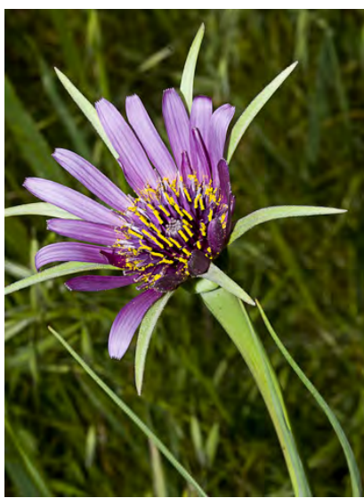
PURPLE SALSIFY (Tragopogon porrifolius) Naturalized Biennial-Perennial - Sunflower Family - (Mar-Nov) - Common. Disturbed places - Plant 16-39" tall, milky sap. Leaves 0.8-1.6" long, very narrow, waxy blue. Flowers purple.