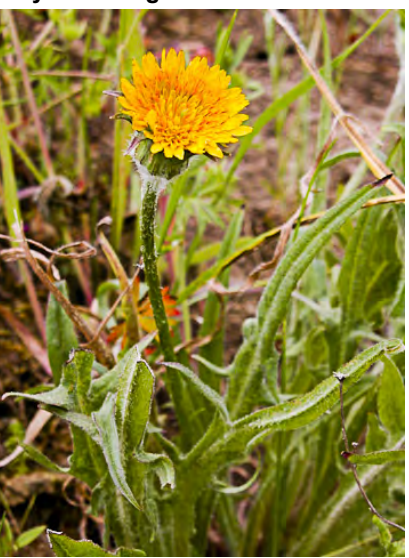
GIANT NATIVE DANDELION (Agoseris grandiflora var. grandiflora) Native Perennial - Sunflower Family - (Apr-Jul) - Grassland, scrub, woodland - Plant 10-40". Leaf lobes point up. Flower rosy-purple, variable-sized bracts. Seed tapers to beak > 2x body length. Leaf lobes point upward.