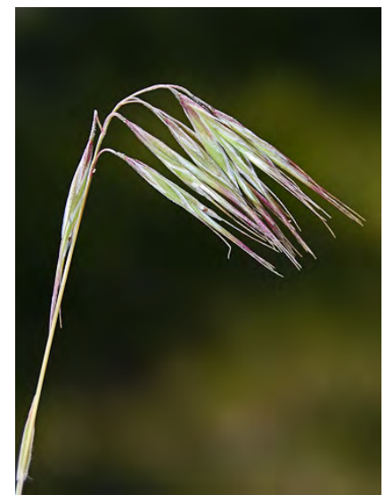
CHEAT GRASS (Bromus tectorum) Naturalized Annual - Grass Family - (May-Aug) - Open, disturbed areas - Plant 2-16" tall. Flower cluster 2-9" long, open, 1-14 spikelets per branch. Spikelet 0.4-0.8". Lemma 0.35-0.5", awn 0.3-0.7". INVASIVE weed.