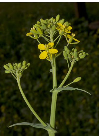
TURNIP (Brassica rapa) Naturalized Annual - Mustard Family - (Jan-May) - Disturbed areas - Stem 8-40" tall. Leaves clasping, upper smooth-edged & waxy. Petals yellow, 0.2-0.4" long, stalk 0.3-1"; fruit beak > 0.4". INVASIVE