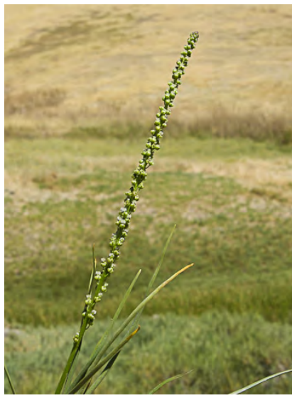
COMMON ARROW-GRASS (Triglochin maritima) Native Perennial - Arrow-grass Family - (Apr–Aug) - Coastal salt marshes, interior saline, brackish, alkaline marshes - Plant 16-43" tall, dense-tufted. Leaves 4-32" long, 0.08-0.2" wide. Leaf ligule tip entire to notched.