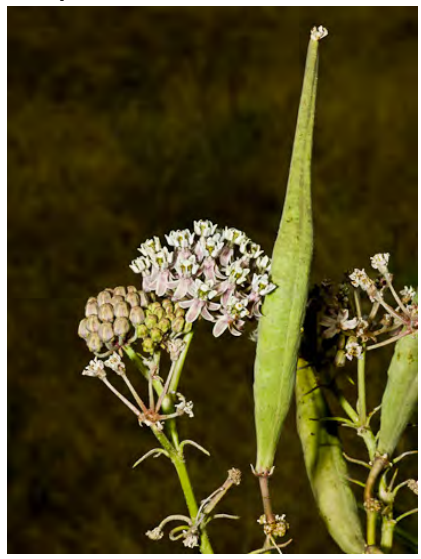
NARROW-LEAF MILKWEED (Asclepias fascicularis) Native Perennial - Dogbane Family - (May-Oct) - Dry ground, valleys, foothills - Plant gen hairless. Stem leaves narrow, 3-5 in whorls. Flowers green-white to purple-tinged, ~0.25" long.