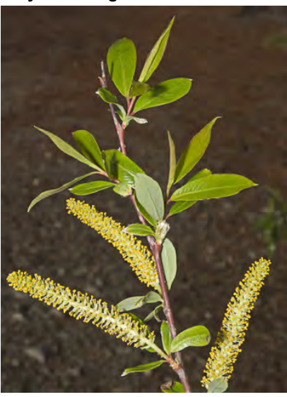
RED WILLOW (Salix laevigata) Native Perennial - Willow Family - (Dec-Jun) - Common. Riverbanks, seepage areas, lakeshores, canyons - Tree bark fissured. Leaf lanceolate, glaucous below, gen w/stalk glands. Stamens 5. Fruit glabrous.