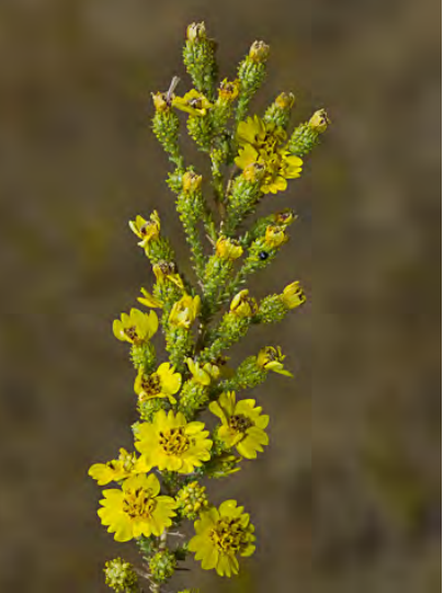
STICKY TARPLANT (Holocarpha virgata subsp. virgata) Native Annual - Sunflower Family - (May-Nov) - Grassland - Plant 8-48" tall, gladular, not very-short-hairy. Heads small, at branch ends. Ray flowers 3-8; disk flowers 9-25, anthers black.