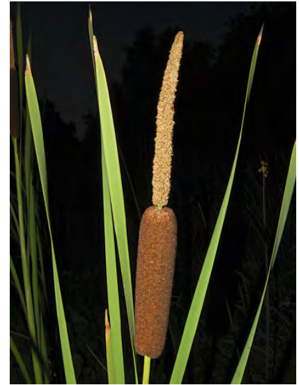
NARROW-LEAVED CATTAIL (Typha angustifolia) Native Perennial - Cattail Family - (May–Aug) - Nutrient-rich freshwater to brackish marshes, wet disturbed places - Plant 4.9-9.8' tall. Leaves gen < 0.4" wide. Flower cluster gap > 0.4".