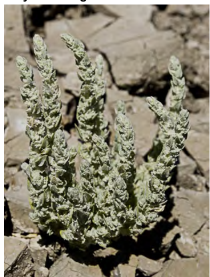
CROWNSCALE (Atriplex coronata var. coronata) Native Annual - Goosefoot Family - (Mar–Oct) - Fine, alkaline soils - Plant 4-12" tall. Stems 1-few. Leaf blades 0.3-0.8" long, gray-scaly. Fruit bracts ~0.2" long, ~0.16" wide.