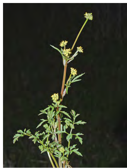
POISON SANICLE (Sanicula bipinnata) Native Perennial - Carrot Family - (Apr-May) - Open grassland or pine/oak woodland - Plants 5-24" tall. Leaves 2x pinnate. Flowers yellow, male flower stalk < fruit. Reported to be slightly TOXIC.