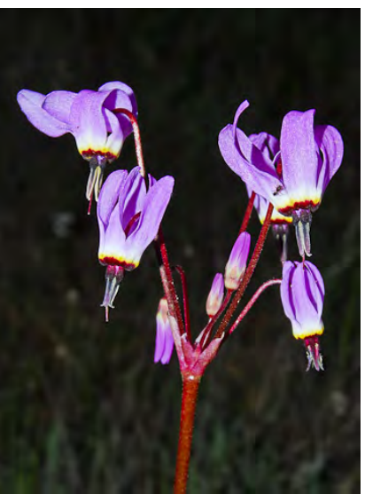
MOSQUITOBILLS SHOOTING STAR (Dodecatheon hendersonii) Native Perennial - Primrose Family - (Mar—Jul) - Gen in shady sites - Leaf blade length generally <2x width. Flower parts 4s or 5s. Filament tube solid black.