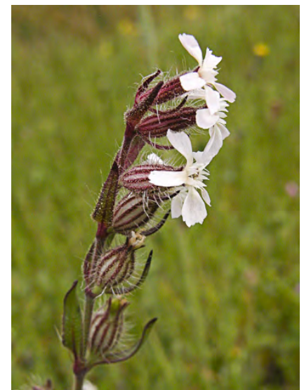
SMALL-FLOWER CATCHFLY (Silene gallica) Naturalized Annual - Pink Family - (Spring-early summer) - Fields, disturbed areas - Plant 4-16". Leaves < 1.4" long. Flower cluster short-hairy, practs sticky-hairy, petal blade 0.2-0.5" long, smooth to notched, white to pink.