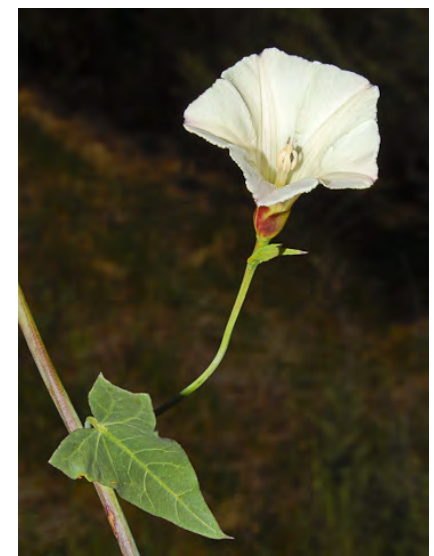
CLIMBING MORNING-GLORY (Calystegia purpurata subsp. purpurata) Native Perennial - Morning-glory Family - (May–Jun) - Chaparral, coastal scrub - Stem strongly climbing. Leaf triangular, lobes strongly angled. Bractlets smooth, small, distant.