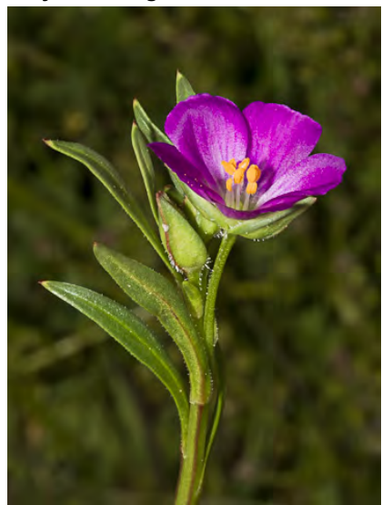
RED MAIDS (Calandrinia ciliata) Native Annual - Miner's Lettuce Family - (Feb-May) - Common. Sandy to loamy soil, grassy areas, cult fields - Petals 0.2-0.6" long, bright pink to red, round-tipped. Fruit < 0.1" longer than bracts.