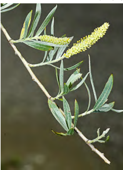
HINDS' WILLOW (Salix exigua var. hindsiana) Native Perennial - Willow Family - (Apr–May) -Common. Floodplains, sandy gravel - Shrub or tree < 17' tall. Leaf blades 1.2-6" long, linear, mature dense soft-hairy below. Ovary hairy.