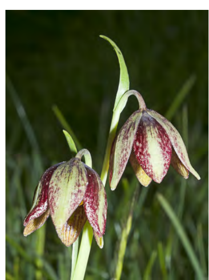
STINKBELLS (Fritillaria agrestis) Native Perennial - Lily Family - (Mar–Jun) - Clay (gen serpentine) banks, depressions - Stem 1-2' tall. Leaves crowded below, 2-6" long, narrow. Petals greenish-white outside, purple-brown inside, 0.7-1.4" long. CNPS: WATCH LIST.