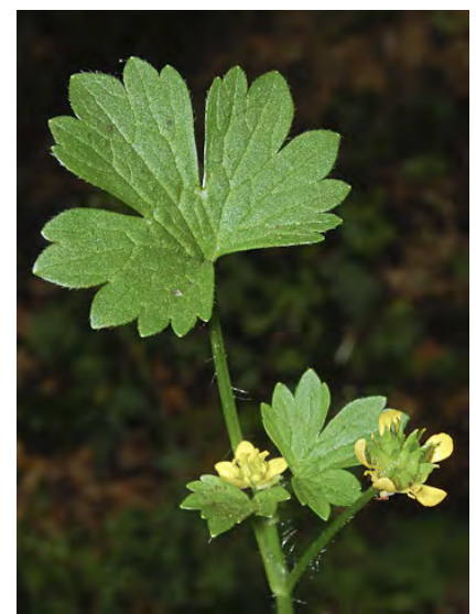
PRICKLESEED BUTTERCUP (Ranunculus muricatus) Naturalized Annual - Buttercup Family - (Apr-Jun) - Stream-banks, drainages, low meadows - Plant 6-20". Leaves gen 3-lobed. Petals yellow, 5, 0.16-0.3" long. Fruits 0.2" long with curved bristles.