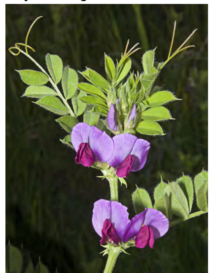
SPRING VETCH (Vicia sativa subsp. sativa) Naturalized Annual - Pea Family - (Mar–Jun) - Roadsides, disturbed areas, grassland, open areas in oak and riparian woodlands - Flowers 1-2 at leaf bases, pink-purple to white, 0.7-1.2" long. Leaflets 0.16-0.4" wide.