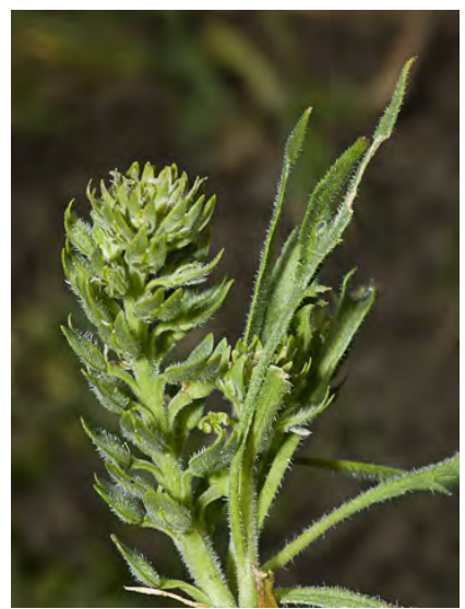
DWARF PEPPERGRASS (Lepidium latipes) Native Annual - Mustard Family - (Mar–Jun) -Alkaline soils, vernal pool margins, salt marsh edges, pastures - Stem 0.8-6" long. Leaves 0.8-4" long. Flower cluster distinctly compacted.