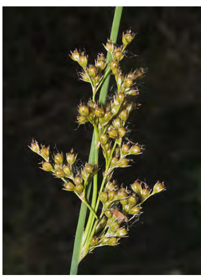
SPREADING RUSH (Juncus patens) Native Perennial - Rush Family - (Jun-Oct) - Marshy places, creeks, seeps - Plant 12-41" tall, densely tufted. Stems blue-gray-green & distinctly grooved when fresh. Stamens 6.