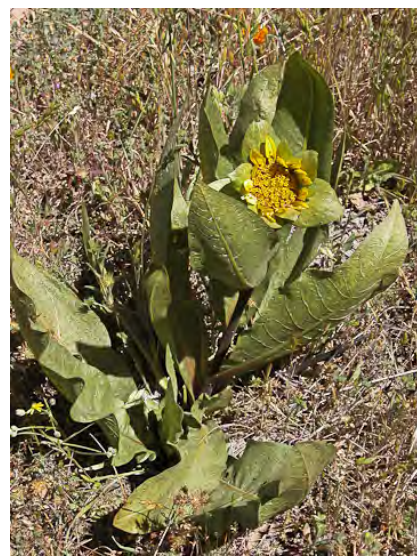
SMOOTH MULE'S EARS (Wyethia glabra) Native Perennial - Sunflower Family - (Mar–Jun) - Gen shady sites - Plant 4-16" tall, shiny green, no woolly hairs. Leaf basal blades 10-18" long, lance-shaped to oval, shiny. Ray flowers 1-2" long.