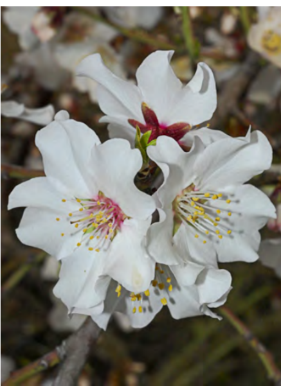
ALMOND (Prunus dulcis) Naturalized Perennial - Rose Family - (Feb–Mar) - Canyons, roadsides, grassland (as waif) - Tree 16-26' tall. Leaf blades 1-4" long. Flowers 1-3/cluster. Petals pink to nearly white, 0.5-1" long. Fruit 1-1.6" long, hairy. Cultivar.