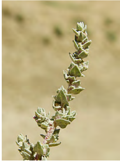
BRITTLESCALE (Atriplex depressa) Native Annual - Goosefoot Family - (Jun-Oct) - Alkaline or clay soils - Plant < 12" tall. Stem gen brittle, red, peeling. Leaves 0.1-0.3" long, oval to heart-shaped, densely white-scaly. Flower bracts gen bumpy on stem-facing side.