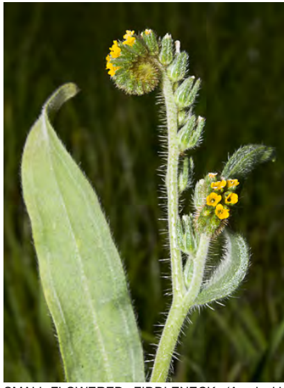
SMALL-FLOWERED FIDDLENECK (Amsinckia menziesii) Native Annual - Borage Family - (May-Jul) - Shade-tolerant, open, disturbed areas at forest/woodland edges - Flowers yellow to orange-yellow, generally spotted, 0.2-0.3" long, 0.1" wide. Leaves coarse-hairy.