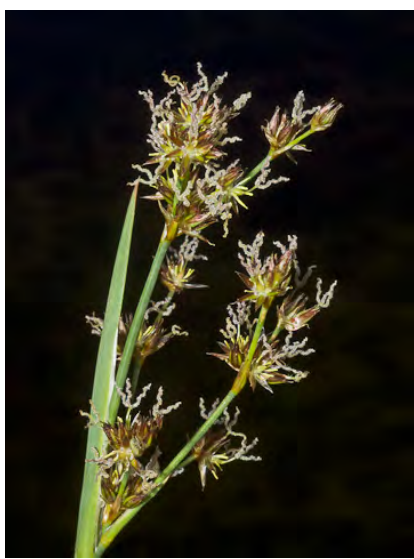
IRIS-LEAVED RUSH (Juncus xiphioides) Native Perennial - Rush Family - (Jul-Oct) - Wet places - Plant 16-32" tall. Leaf blades 0.2-0.5" wide, flat, Iris-like. Heads many, few-flowered. Anthers 6, < filaments, flowers self-pollinating.