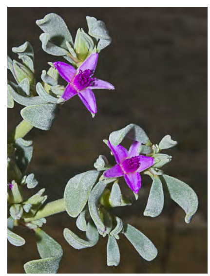
WESTERN SEA-PURSLANE (Sesuvium verrucosum) Native Perennial - Fig-marigold Family - (Apr-Nov) - Uncommon. Moist or seasonally dry flats, margins of generally saline wetlands - Flowers solitary, bright pink to reddish or orange, about 0.4" wide.