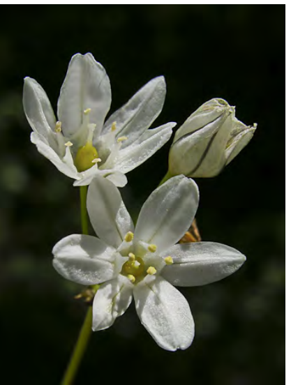
FOOL'S ONION (Triteleia hyacinthina) Native Perennial - Brodiaea Family - (Mar–Jul) - Grassland, vernally wet meadows, occ drier slopes - Flowering stem 1-2' tall. Leaves 4-16", 0.16-0.9" wide. Flower stalks 0.2-0.6" long. Flowers white, 0.35-0.6" long.