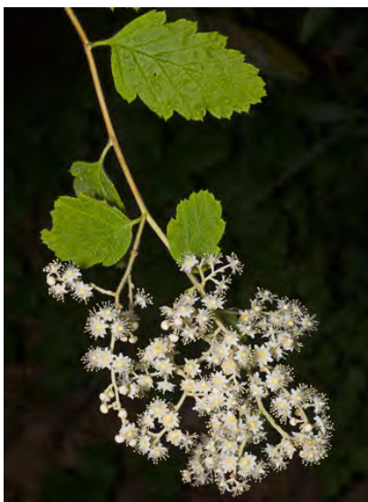
OCEANSPRAY (Holodiscus discolor var. discolor) Native Perennial - Rose Family - (May-Aug) - Moist woodland edges, rocky slopes - Shrub 5-20' tall. Leaf blade 0.6-3.1" long, toothed at end. Flower cluster 0.8-10" long. Petals white, ~0.07" long.