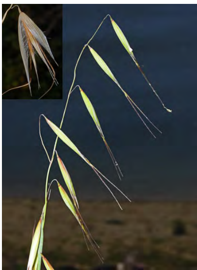
SLENDER WILD OAT (Avena barbata) Naturalized Annual - Grass Family - (Mar–Jun) - Disturbed sites - Plants gen 24-32". Spikelets 0.8-1.2" long. Awns 0.8-1.8" long. Lemma tip bristles >= 0.1" long. Seeds EDIBLE whole or ground for flour. INVASIVE weed.