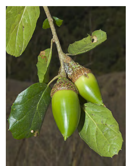
COAST LIVE OAK (Quercus agrifolia var. agrifolia) Native Perennial - Oak Family - (Mar-Apr) - Valleys, slopes, mixed-evergreen forest, woodland - Tree 30-80'. Leaves convex, hair-tuft below in vein axils. Acorns on 1st year twigs, shell glabrous inside.