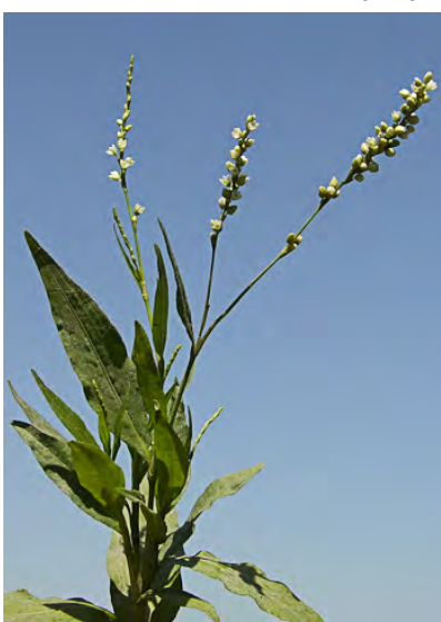
WATER SMARTWEED (Persicaria punctata) Native Annual-Perennial - Buckwheat Family - (Jun-Nov) - Shallow water, shores, marshes, floodplain forest - Flowers ~0.15" long, 5-lobed, white margins, gland-dotted. Fruit black, shiny.