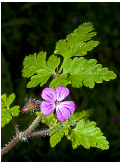
HERB ROBERT (Geranium robertianum) Naturalized Annual-Biennial - Geranium Family -(Apr-Sep) - Open to shaded sites - Stem 4-20" long. Leaflets in 3s, deeply lobed. Petals pink to red-purple, 0.4-0.55" long.