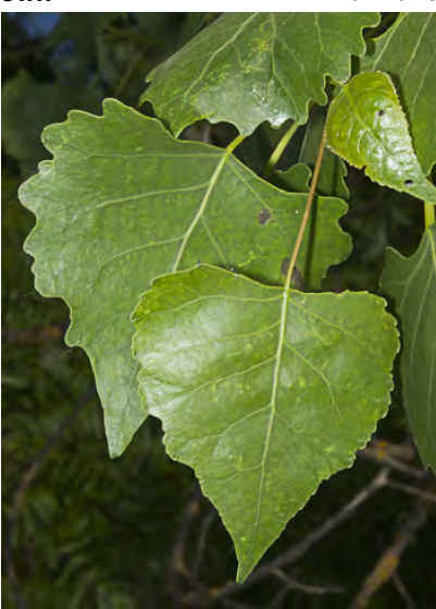
FREMONT COTTONWOOD (Populus fremontii subsp. fremontii) Native Perennial - Willow Family - (Mar–Apr) - Scattered. Alluvial bottomland, streamsides - Tree < 66' tall. Leaves heart-shaped to triangular, coarsely scalloped, blade 1.2-2.8" long.