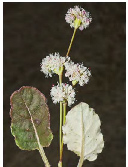
EAR-SHAPED WILD BUCKWHEAT (Eriogonum nudum var. auriculatum) Native Perennial - Buckwheat Family - (May-Oct) - Common. Sand or gravel - Plant 5-15 dm. Leaves on stem, curled. Inflor smooth. Flowers white to pink, smooth.