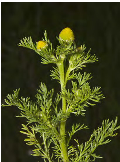
PINEAPPLE WEED (Matricaria discoidea) Naturalized Annual - Sunflower Family -(Feb-Aug) - Abundant. Disturbed sites, riverbanks - Plant 4-12" tall, sweet-scented. Heads pineapple-shaped, ~ 0.4" wide; head stalk to 0.6" long.