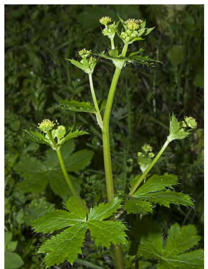
PACIFIC WOODLAND SANICLE (Sanicula crassicaulis) Native Perennial - Carrot Family - (Mar–May) - Open slopes, ravines, woodland - Plants stout, 9-47". Leaves 1-5" across with 3-5 deep, palmate lobes and serrate edges. Flowers yellow.