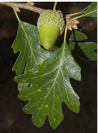
VALLEY OAK (Quercus lobata) Native Perennial - Oak Family - (Mar–Apr) - Slopes, valleys, savanna - Tree < 115' tall, deciduous. Leaves 2-5" long, not leathery, deeply lobed, lobes without bristles. Acorns 1.2-2" long, slender, cup 0.4-1.2" deep.