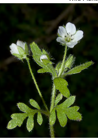
VARIABLE-LEAF NEMOPHILA (Nemophila heterophylla) Native Annual - Borage Family - (Feb-Jun) - Common. Forest, chaparral, roadsides, streambanks - Flower 0.1-0.4" long, unspotted, bract appendages < 0.04" long in fruit.