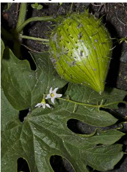
COAST MAN-ROOT (Marah oregana) Native Perennial - Gourd Family - (Mar–May) - Shrubby or open areas, forest edges - Vine 3-20' long. Leaves deeply lobed. Flowers white, deep cup-shaped, > 0.3" wide. Fruit smooth at end.