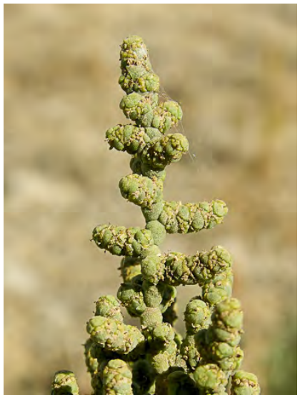
IODINE BUSH (Allenrolfea occidentalis) Native Perennial - Goosefoot Family - (Jun–Aug) - Flats, hummocks, in alkaline soils - Succulent shrub 1-5' tall. Jointed stem, each green joint 0.1-0.4" long by 0.1-0.2" wide. Leaves alternate, scale-like, 0.1-0.2" long.