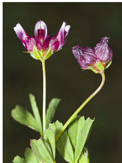
TRUNCATE SACK CLOVER (Trifolium depauperatum var. truncatum) Native Annual -Pea Family - (Apr–Jun) - Grassy flats, disturbed slopes, openings in woodland - Head bracts <= 0.1" long. Flowers pink-purple. Fruit ~0.1" long, inflated, stalked.