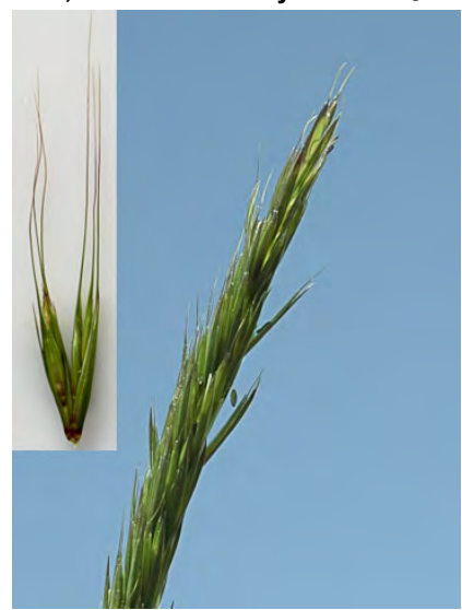
WESTERN WILD-RYE (Elymus glaucus subsp. glaucus) Native Perennial - Grass Family - (Jun-Aug) - Open areas, chaparral, woodland, forest - Tufted. Stem 12-55" tall. Leaf 0.2-0.5" wide, flat. Spikelets0.3-0.6" long, 2-4 per node. Lemma awn 0.4-1.2" long.