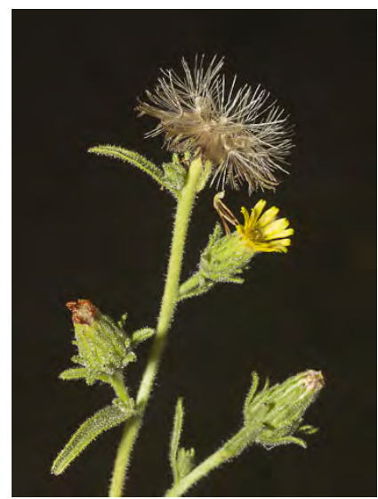
STINKWORT (Dittrichia graveolens) Naturalized Annual - Sunflower Family - (Sep-Nov) - Disturbed areas - Plant 8-24" tall, camphor-scented, glandular. Flowers yellow. Flower-head bracts Aster-like. Fall bloomer. INVASIVE weed.