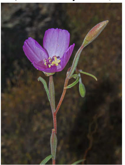
HERALD-OF-SUMMER (Clarkia gracilis subsp. gracilis) Native Annual - Evening Primrose Family - (Apr-Jul) - Common. Openings in woodland, forest - Plant < 35". Buds nodding. Petals 0.2-0.9" long, pink. Stigma = anthers. Ovary 4-grooved. Sepals united.