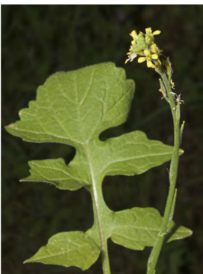
HEDGE MUSTARD (Sisymbrium officinale) Naturalized Annual - Mustard Family - (Apr-Sep) - Disturbed areas, fields, pastures - Stem 10-22" tall, thin, wiry. Petals 0.1-0.16" long, pale yellow. Fruit 0.4-0.55" long, awl-shaped, appressed.