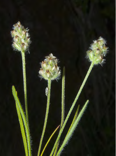
CALIFORNIA DWARF PLANTAIN (Plantago erecta) Native Annual - Plantain Family - (Mar–May) - Sandy, clay, serpentine soil; grassy slopes, flats, open woodland - Leaf 1.2-5" long, linear, hairy. Flowers + stem 1.2-12" tall, cluster 0.2-1.2" long.