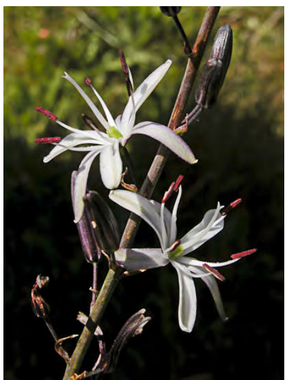
WAVYLEAF SOAP PLANT (Chlorogalum pomeridianum var. pomeridianum) Native Perennial - Century Plant Family - (May-Aug) - Common. Open grassland, chaparral, woodland - Plant 1-8' tall, flowers at night. Bulb juices lather in water.