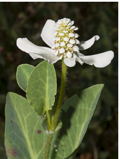
YERBA MANSA (Anemopsis californica) Native Perennial - Lizard's-tail Family - (Mar–Sep) - Common. Saline or alkaline soil, wet or moist areas, seeps, springs - Stems 3-32" long. 4-9 petal-like bracts 0.2-1.4" long, white often tinged red. Was used medicinally.