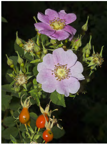
CALIFORNIA ROSE (Rosa californica) Native Perennial - Rose Family - (Feb-Nov) - Gen ± moist areas in sun, esp streambanks - Shrub 2.6-8.2' tall withick curved spines, forming thickets. Petals pink, 0.6-1" long; sepals unlobed.