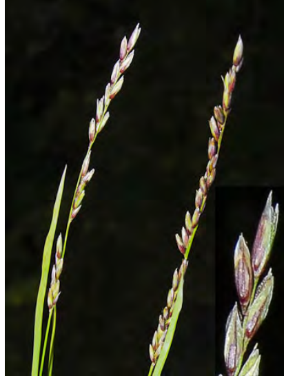
CALIFORNIA MELIC (Melica californica) Native Perennial - Grass Family - (Apr-May) - Open or rocky hillsides, oak woodland, conifer forest - Stem 16-55". Leaf 0.06-0.2" wide. Spiklet 0.2-0.6" long, w/3-7 fertile florets; sterile tip widest above middle, tip squared.