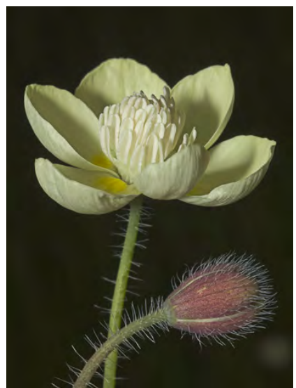
CREAM CUPS (Platystemon californicus) Native Annual - Poppy Family - (Mar–May) - Open grassland, sandy soil, burns - Plant 1.2-12" tall, shaggy-hairy. Leaves 0.4-3.5" long, narrow. Flowers solitary. Stamens > 12. Petals 6, gen cream with yellow base.