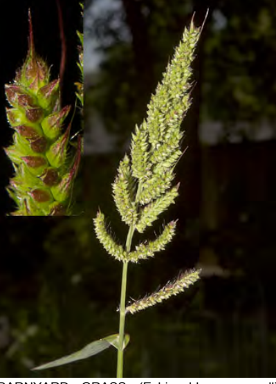
BARNYARD GRASS (Echinochloa crus-galli) Naturalized Annual - Grass Family - (Jun-Oct) - Gen wet, disturbed sites, fields, roadsides - Stem 12-39" long. Leaf blades to 25" long, 0.2-1.2" wide. Spikelet 0.1-0.16" long, floret ~0.14" long, 1 per node. Awns 0-2" long on same plant.