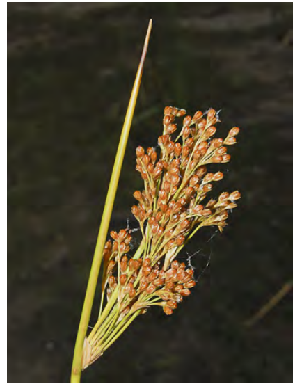
BALTIC RUSH (Juncus balticus subsp. ater) Native Perennial - Rush Family - (Jul-Nov) -Moist to ± dry sites - Stem 14-43" tall, round, not twisted. No leaf blade. Flowers generally 0.1-0.2" lond.