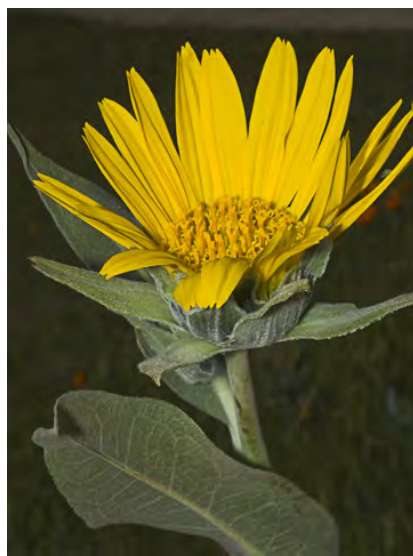
GRAY MULE'S EARS (Wyethia helenioides) Native Perennial - Sunflower Family (Mar-May(Aug)) - Open grassland, woodland, scrub - Plant 8-28" tall, densely woolly, often becoming smooth. Some woolly hairs remain on leaf stalks and floral bracts.