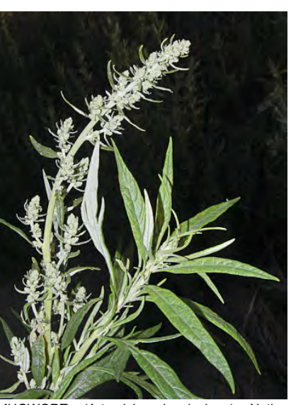
MUGWORT (Artemisia douglasiana) Native Perennial - Sunflower Family - (May–Nov) - Common. Open to shady areas, often in drainages - Plant 20-60" tall. Leaves gen 0.4-4" long, densely hairy below, some 3-5 lobed. Flower bracts hairy.