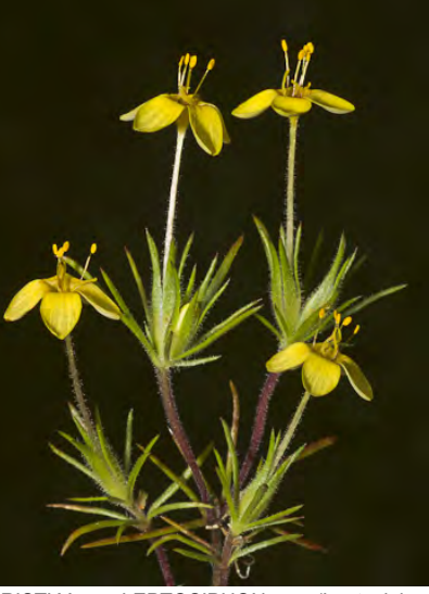
BRISTLY LEPTOSIPHON (Leptosiphon acicularis) Native Annual - Phlox Family -(Apr-May) - Grassy areas, woodland, chaparral -Plant 1-6" tall, hairy. Leaf lobes 0.1-0.4", needle-like. Flowers yellow. CNPS: FAIRLY ENDANGERED.