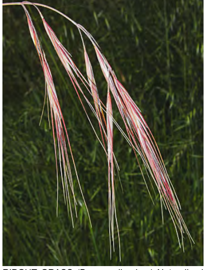
RIPGUT GRASS (Bromus diandrus) Naturalized Annual - Grass Family - (Apr–Jul) - Open, gen disturbed areas - Plant 6-40" tall. Spikelet 1-2.8" long. Lemma body 0.8-1.2" long, awn > 1.2" long. Barbed seeds can stick in flesh of animals. INVASIVE weed.