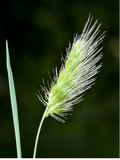
BRISTLY DOGTAIL GRASS (Cynosurus echinatus) Naturalized Annual - Grass Family - (May-Jul) - Open, disturbed sites - Tufted. Stem 4-28" long. Leaf blade 0.1-0.6" wide. Flower cluster 0.4-1.6" long, 1-sided. Fertile and sterile spikelets. INVASIVE weed.