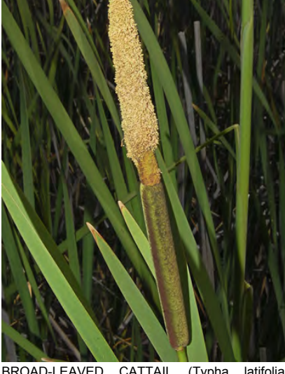
BROAD-LEAVED CATTAIL (Typha latifolia) Native Perennial - Cattail Family - (Jun–Jul) -Unpolluted to nutrient-rich freshwater (brackish) marshes - Plant 4.9-9.8' tall. Widest leaves 0.4-1.1" wide. Flower cluster with no gap between flower types.