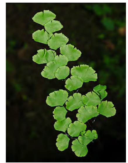
CALIFORNIA MAIDENHAIR (Adiantum jordanii) Native Perennial - Brake Fern Family - - - Shaded hillsides, moist woodland - Leaves 8-28" long with many rounded symmetrical segments, each with < 4 irregular lobes. Cultivated. Sudden Oak Death carrier.