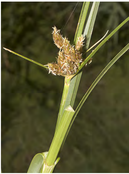
SEACOAST BULRUSH (Bolboschoenus robustus) Native Perennial - Sedge Family -(Summer) - Brackish to saline coastal marshes -Plant 20-60" tall. Stem sharply triangular. Flower cluster dense, stemless, just above bracts. Spikelets 5-25, 0.4-1.2" long.