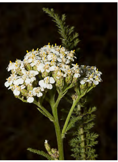
YARROW (Achillea millefolium) Native Perennial - Sunflower Family - (Apr-Sep) - Many habitats -Plant 4"-7' tall. Stem white-hairy. Leaves finely dissected. Flower cluster flat-topped. Flowers white to pink. Widely used in folk medicine.