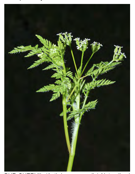
BUR-CHERVIL (Anthriscus caucalis) Naturalized Annual - Carrot Family - (Apr–Jun) - Generally shady places - Plant 18-40" tall. Flowers white; flower stalk >= fruit length. Fruits 0.1-0.2" long with curved "velcro" bristles. Leaves fern-like, triangular outline.