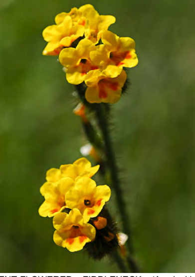
BENT-FLOWERED FIDDLENECK (Amsinckia lunaris) Native Annual - Borage Family -(Mar-Jun) - Gravelly slopes, grassland, openings in woodland - Flowers orange, 0.3-0.4" long, slightly 2-lipped with bent tube, 2 red marks. CNPS: ENDANGERED.