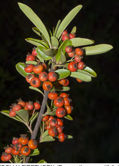
WOOLLY FIRETHORN (Pyracantha angustifolia) Naturalized Perennial - Rose Family - (Feb–Jun) - Disturbed areas, fencerows, abandoned fields, roadsides - Plant < 13', gray-hairy. Leaves narrow, entire. Calyx and below leaves often woolly. INVASIVE.