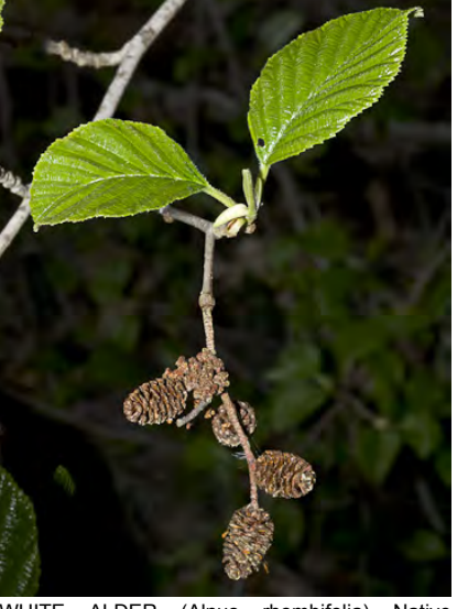
WHITE ALDER (Alnus rhombifolia) Native Perennial - Birch Family - (Apr–Jun) - Along permanent streams - Tree. Leaves flat, not rusty underneath, margins serrate, not rolled under. Female flowers cone-like. Wood used for furniture and for smoking meats.