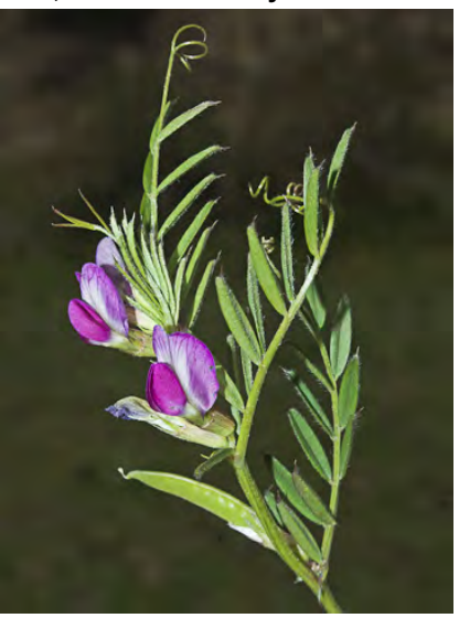
NARROW-LEAVED VETCH (Vicia sativa subsp. nigra) Naturalized Annual - Pea Family -(Mar–Jun) - Roadsides, disturbed areas, grassland, open areas in oak and riparian woodlands - Flowers 1-2 at leaf bases, pink-purple to white, 0.4-0.7" long. Leaflets 0.2-0.3" wide.