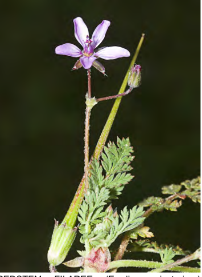
REDSTEM FILAREE (Erodium cicutarium) Naturalized Annual - Geranium Family -(Feb-Sep) - Open, disturbed sites, grassland, scrub - Stem 4-20". Leaves compound, leaflets dissected. Sepal tip bristly. Petal pink to purple. Fruit beak 0.8-2". INVASIVE.