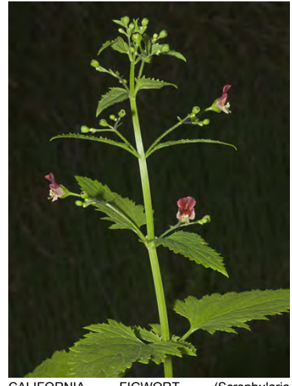
CALIFORNIA FIGWORT (Scrophularia californica) Native Perennial - Snapdragon Family - (Mar-Jul) - Common; damp places, chaparral, roadsides - Stem 2.6-4' tall, square x-section. Leaves opposite, to 7" long, triangular, toothed. Flowers 0.3-0.5" long, upper lips red to maroon, lower paler or yellowish.