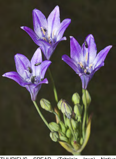
ITHURIEL'S SPEAR (Triteleia laxa) Native Perennial - Brodiaea Family - (Apr–Jun) -Common. Open forest, conifer or foothill woodland, grassland on clay soil - Flower stem 4-28". Leaves 8-16", 0.16-1" wide. Flowers blue, blue-purple or white, 0.7-1.9" long.