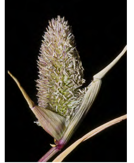
SWAMP PRICKLE GRASS (Crypsis schoenoides) Naturalized Annual - Grass Family - (Jun–Oct) - Wet places - Plant mat-like. Stem 2-30" long. Leaf blade 1-4" long. Flower cluster 0.1-3" long, 0.2-0.6" wide. Spikelet ~0.1" long.