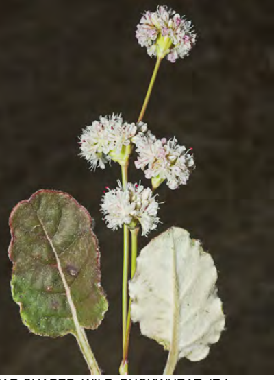
EAR-SHAPED WILD BUCKWHEAT (Eriogonum nudum var. auriculatum) Native Perennial - Buckwheat Family - (May–Oct) - Common. Sand or gravel - Plant 5-15 dm. Leaves on stem, curled. Inflor smooth. Flowers white to pink, smooth.