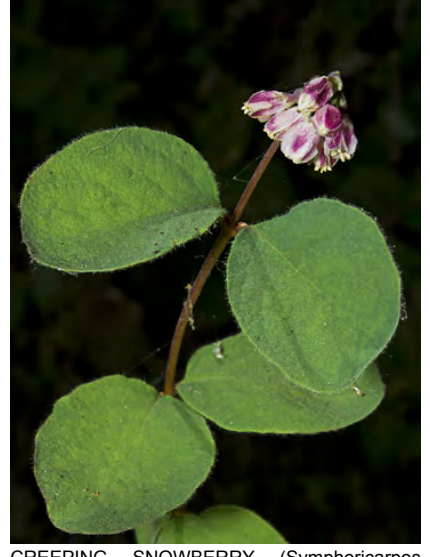
CREEPING SNOWBERRY (Symphoricarpos mollis) Native Perennial - Honeysuckle Family -(Apr–May) - Ridges, slopes, open places in woodland - Shrub 6-24" tall, sprawling. Flowers < 8/cluster, pink + often red outside, 0.16" long, bell-shaped, symetrical.