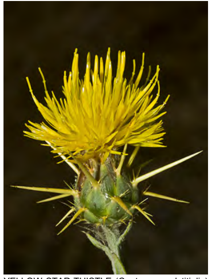
YELLOW STAR-THISTLE (Centaurea solstitialis) Naturalized Annual - Sunflower Family -(May–Oct) - Invasive, roadsides, disturbed grassland or woodland - Plant 4-39" tall. Leaves woolly, extend down the stem. Flower bract spines 0.4-1" long. NOXIOUS weed.