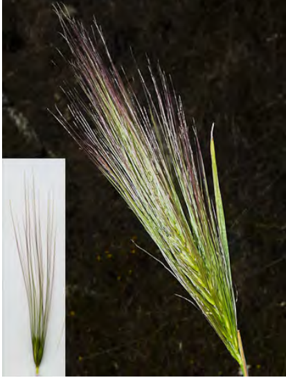
BIG SQUIRRELTAIL (Elymus multisetus) Native Perennial - Grass Family - (May–Jul) - Open, sandy to rocky areas - Tufted. Stem 6-24" tall. Leaf 0.06-0.2" wide. Spikelet 0.4-0.6" long. Glume divisions needle-shaped, lemma awn 1-4" long.