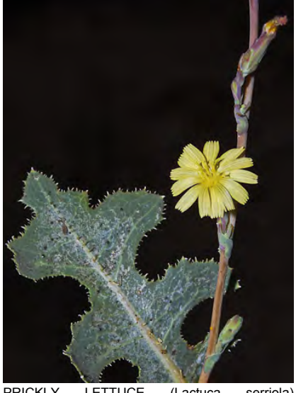
PRICKLY LETTUCE (Lactuca serriola) Naturalized Annual - Sunflower Family -(May–Oct) - Abundant. Disturbed places - Stem 1.6-10' tall, prickly-bristly. Leaves deeply-lobed, midvein and edges prickly-bristly. Flowers pale yellow, 0.16-0.2" wide.