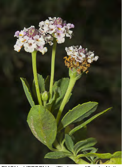
LEMON VERBENA (Phyla nodiflora) Native Perennial - Vervain Family - (May–Nov) - Wet places, pond margins - Mat-like. Leaf blade 0.2-1.2" long, < 0.4" wide, 5-11 teeth. Flowers white to red. Flower stem 0.6-3.5" tall. Ornamental.