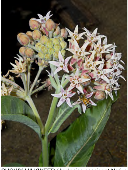
SHOWY MILKWEED (Asclepias speciosa) Native Perennial - Dogbane Family - (May–Sep) - Many habitats incl fields, roadsides - Plants green, hairy. Leaves opposite, ovate. Petals rose-purple, > 0.3" long; curving tooth-like hoods. Monarch butterfly food plant.