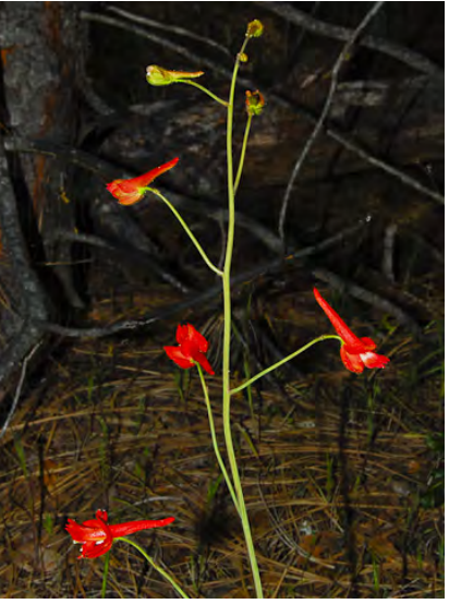
RED OR ORANGE LARKSPUR (Delphinium nudicaule) Native Perennial - Buttercup Family -(Mar-Jun) - Moist talus, wooded, rocky slopes -Stem gen 6-20" tall, usually hairless. Flowers scarlet to orange-red. Hummingbird pollinated.