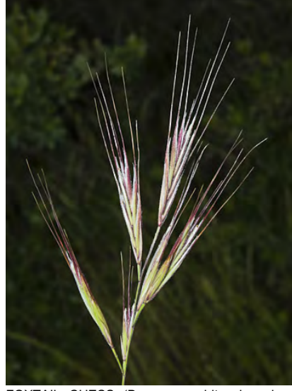
FOXTAIL CHESS (Bromus madritensis subsp. madritensis) Naturalized Annual - Grass Family -(Apr-Jan) - Disturbed areas, roadsides - Plants 4-20" tall. Stem and sheathes smooth. Flower cluster branches visible, lower spikelets erect, > stalk.