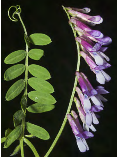
SPARSELY HAIRY VETCH (Vicia villosa subsp. varia) Naturalized Annual-Biennial - Pea Family - (Mar–Jun) - Grassland, roadside, disturbed areas - Stems w/few hairs. Flowers 10-20, blue-purple to white, 0.4-0.55" long. Lower bract lobes 0.04-0.1" long.