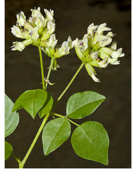
CALIFORNIA TEA (Rupertia physodes) Native Perennial - Pea Family - (May–Sep) - Woodland -Stem ~1.6'. Leaflets 3, triangular to lance-shaped, 1.4-2.8" long, sticky. Flower bracts not hairy, lobes =. Flowers white or yellow, banner 0.4-0.55" long.

Wild Plants of Briones Regional Park - Sorted by Form, Color and Family