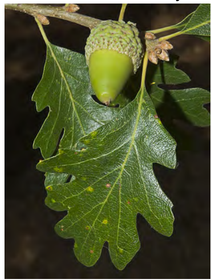
VALLEY OAK (Quercus lobata) Native Perennial - Oak Family - (Mar–Apr) - Slopes, valleys, savanna - Tree < 115' tall, deciduous. Leaves 2-5" long, not leathery, deeply lobed, lobes without bristles. Acorns 1.2-2" long, slender, cup 0.4-1.2" deep.