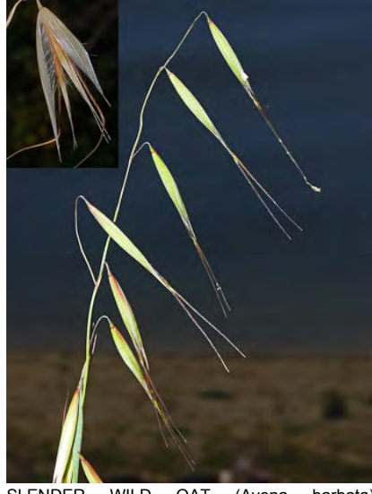
SLENDER WILD OAT (Avena barbata) Naturalized Annual - Grass Family - (Mar–Jun) -Disturbed sites - Plants gen 24-32". Spikelets 0.8-1.2" long. Awns 0.8-1.8" long. Lemma tip bristles >= 0.1" long. Seeds EDIBLE whole or ground for flour. INVASIVE weed.