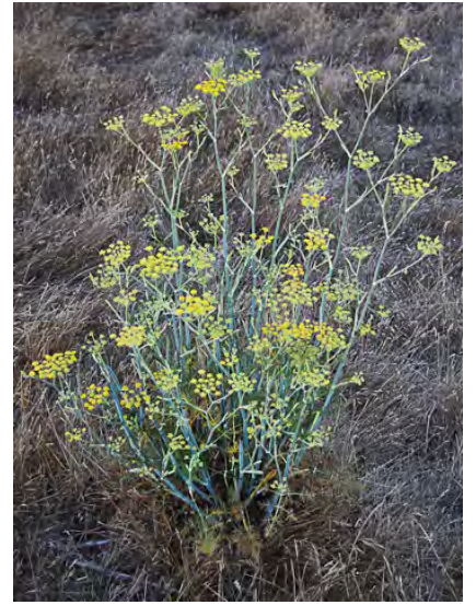
FENNEL (Foeniculum vulgare) Naturalized Perennial - Carrot Family - (May–Sep) -Roadsides, disturbed sites - Plants 3-6.5' tall, anise-scented. Stems waxy-blue, canelike. Flowers yellow. Leaf segments thread-like, edible when young. INVASIVE weed.