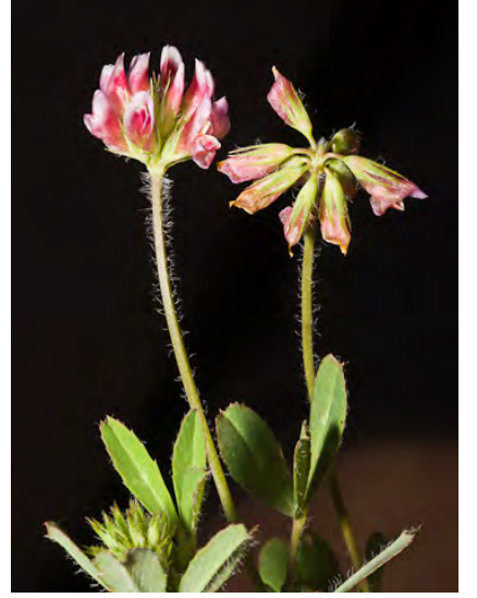
DECEIVING CLOVER (Trifolium bifidum var. decipiens) Native Annual - Pea Family -(Apr–Jun) - Open, grassy areas, forest - Leaflet tip square/notched. Flower small, yellow to pink-purple, soon reflex. Flower stalk top sparsely hairy.