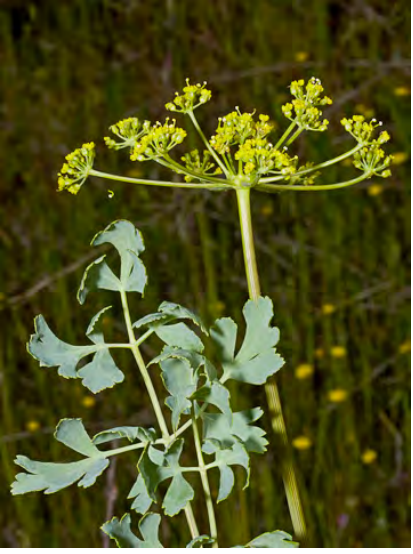
CELERY WEED (Lomatium californicum) Native Perennial - Carrot Family - (Apr-Jun) -Woodland, brushy slopes - Plant 12-48" tall, smooth, waxy. Leaf segments wedge-shaped, celery-like. Flowers yellow. Used medicinally by Native Americans.