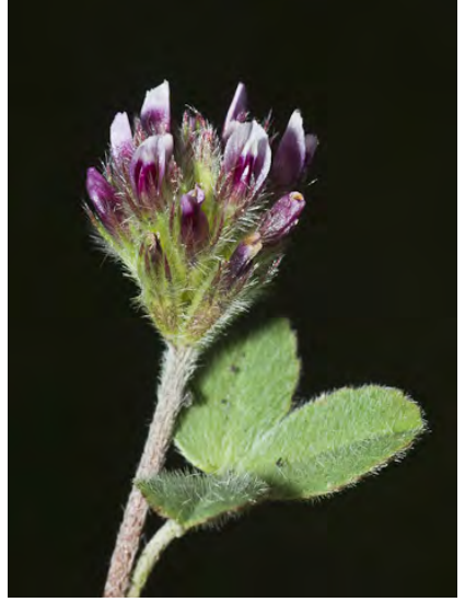
RANCHERIA CLOVER (Trifolium albopurpureum) Native Annual - Pea Family -(Mar-Jun) - Abundant. Dunes, grassland, wet meadows, slopes, disturbed areas, etc - No head bract. Flowers purple + white, 0.2-0.3", no stalk. Flower bracts hairy, teeth linear, = flowers.