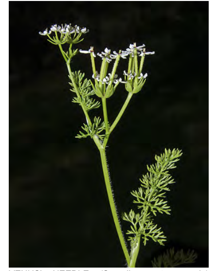
VENUS' NEEDLE (Scandix pecten-veneris) Naturalized Annual - Carrot Family - (Apr–Jun) -Grassy slopes, roadsides - Plant 6-20" tall. Leaf segments finely divided, linear. Flowers white, outer petals larger. Fruit 0.2-1" long with a beak 0.8-2.8" long.