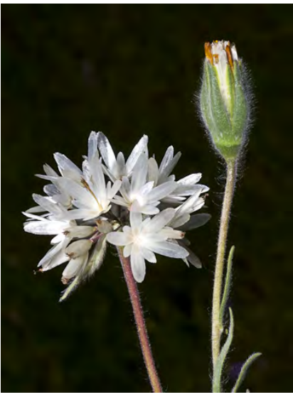
BLOW WIVES (Achyrachaena mollis) Native Annual - Sunflower Family - (Mar–Jun) -Common. Grassy sites, often clay soils - Plant 2-24" tall, soft-hairy. Flowers yellow turning red, 0.1-0.5" wide, extend < 0.1" beyond green bracts. Showy, flat scales attached to seeds.