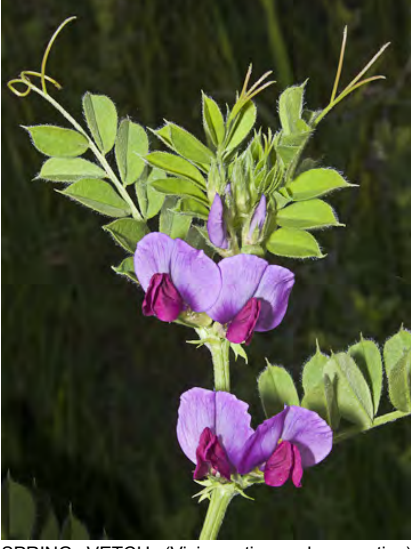
SPRING VETCH (Vicia sativa subsp. sativa) Naturalized Annual - Pea Family - (Mar–Jun) -Roadsides, disturbed areas, grassland, open areas in oak and riparian woodlands - Flowers 1-2 at leaf bases, pink-purple to white, 0.7-1.2" long. Leaflets 0.16-0.4" wide.