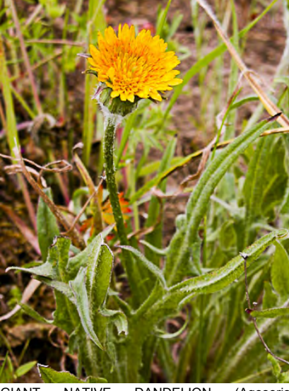
GIANT NATIVE DANDELION (Agoseris grandiflora var. grandiflora) Native Perennial -Sunflower Family - (Apr–Jul) - Grassland, scrub, woodland - Plant 10-40". Leaf lobes point up. Flower rosy-purple, variable-sized bracts. Seed tapers to beak > 2x body length. Leaf lobes point upward.