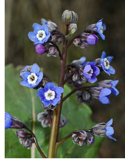
GRAND HOUND'S TONGUE (Cynoglossum grande) Native Perennial - Borage Family -(Feb-May) - Chaparral, woodland - Stem 1-3'. Leaf stafk 3-6". Leaf blade 3-6" cm long, broadly oval. Flowers bright blue w/inner white teeth.