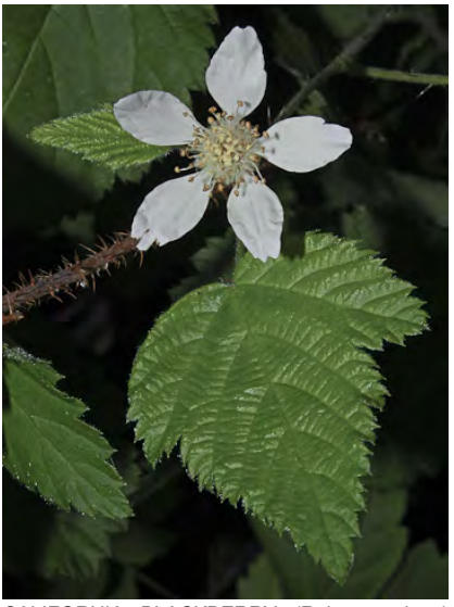
CALIFORNIA BLACKBERRY (Rubus ursinus) Native Perennial - Rose Family - (Mar–Jul) -Open, disturbed areas - Stem round, bristly/prickly. Leaves simple to 3 leaflets, underside green. Plants unisexual. Petals 0.24-0.6" long, white. Blackberry-type fruit.