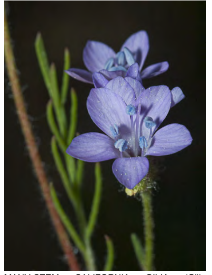
MANY-STEM CALIFORNIA GILIA (Gilia achilleifolia subsp. multicaulis) Native Annual - Phlox Family - (Feb–Jun) - Open or shaded, gen grassy places, sandy or rocky soil - Leaves linear-lobed. Flowers white to lavender, 0.2-0.4" long, not in heads.