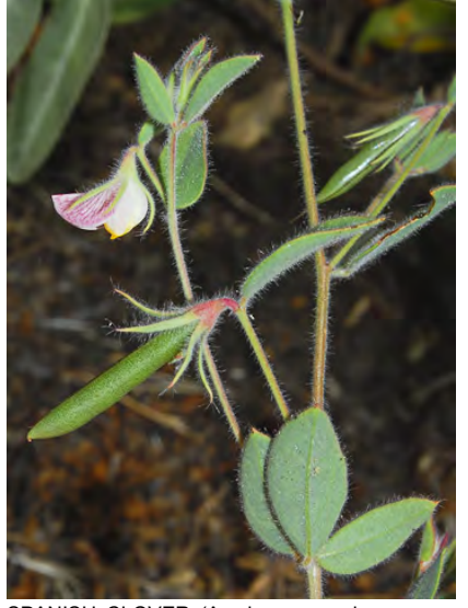
SPANISH CLOVER (Acmispon americanus var. americanus) Native Annual - Pea Family -(May-Oct) - Coast, chaparral, waterways, roadsides, disturbed areas - Plant 2-24", hairy. Flowers white to pink, solitary, bract lobes >> flower tube.