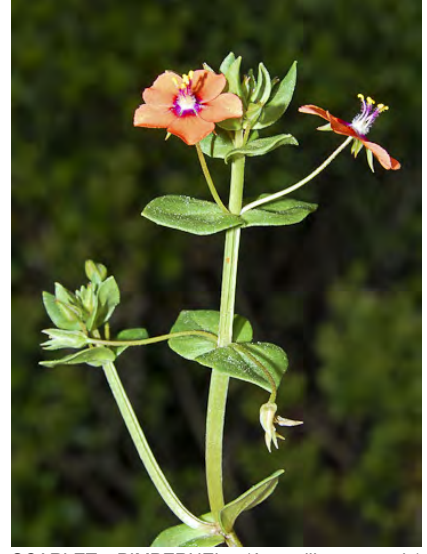
SCARLET PIMPERNEL (Anagallis arvensis) Naturalized Annual - Myrsine Family - (Mar–May) - Common. Disturbed places, ocean beaches -Plants 2-16" tall. Flowers 0.2-0.3" long, salmon or occasionally blue. Leaves TOXIC, can cause dermititis.