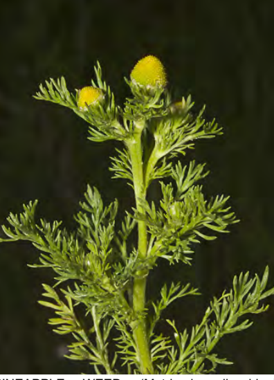
PINEAPPLE WEED (Matricaria discoidea) Naturalized Annual - Sunflower Family -(Feb-Aug) - Abundant. Disturbed sites, riverbanks - Plant 4-12" tall, sweet-scented. Heads pineapple-shaped, ~ 0.4" wide; head stalk to 0.6" long.