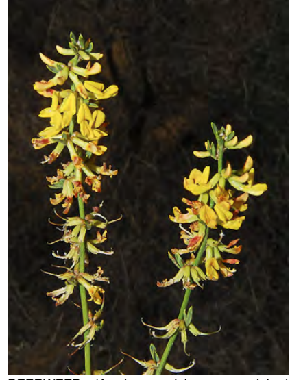
DEERWEED (Acmispon glaber var. glaber) Native Perennial - Pea Family - (Mar–Aug) -Chaparral, roadsides, coastal sands; common -Often shrubby, leaflets 3-6, many clusters of 3-7 stemless flowers, yellow fading to orange-red, 0.3-0.5" long.