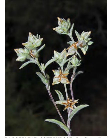
DAGGERLEAF COTTONROSE (Logfia gallica) Naturalized Annual - Sunflower Family -(Mar–Jul) - Bare or grassy openings, burns -Plant 1-20" tall, gen cobwebby. Leaves awl-shaped, stiff, > flower heads. Flowers brown to yellow.