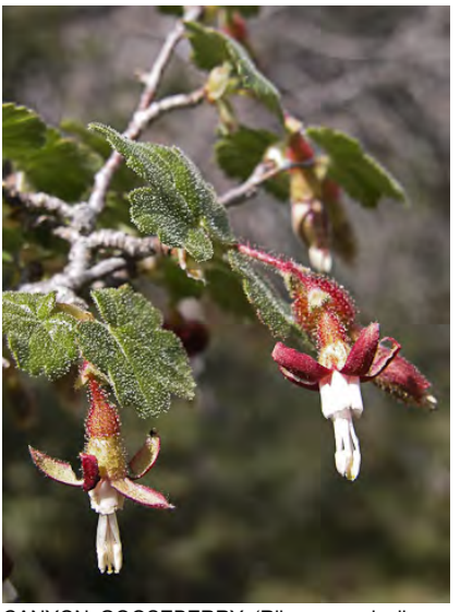
CANYON GOOSEBERRY (Ribes menziesii var. menziesii) Native Perennial - Gooseberry Family - (Feb-Apr) - Common. Forest openings, chaparral - Shrub < 10', prickly. Leaves sticky below. Styles glabrous, anthers exserted, sepals purplish.