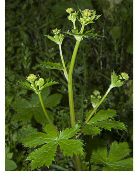
PACIFIC WOODLAND SANICLE (Sanicula crassicaulis) Native Perennial - Carrot Family - (Mar-May) - Open slopes, ravines, woodland - Plants stout, 9-47". Leaves 1-5" across with 3-5 deep, palmate lobes and serrate edges. Flowers yellow.