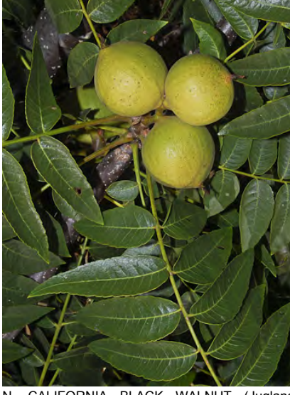
N. CALIFORNIA BLACK WALNUT (Juglans hindsii) Native Perennial - Walnut Family -(Apr-May) - Along streams, disturbed slopes -Tree 20-75'. Leaflets 13-21, 3-5". Fruit 1.4-2" wide. CNPS: SERIOUSLY ENDANGERED (unplanted).