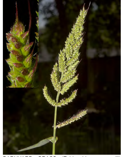
BARNYARD GRASS (Echinochloa crus-galli) Naturalized Annual - Grass Family - (Jun-Oct) -Gen wet, disturbed sites, fields, roadsides - Stem 12-39" long. Leaf blades to 25" long, 0.2-1.2" wide. Spikelet 0.1-0.16" long, floret ~0.14" long, 1 per node. Awns 0-2" long on same plant.