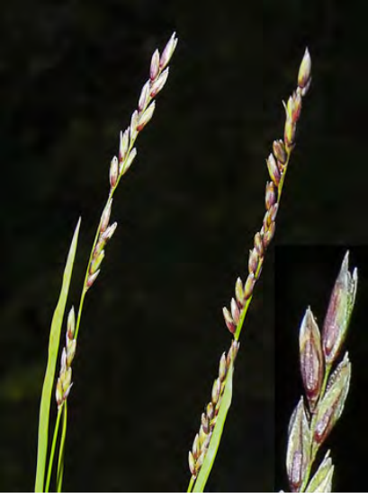
CALIFORNIA MELIC (Melica californica) Native Perennial - Grass Family - (Apr–May) - Open or rocky hillsides, oak woodland, conifer forest -Stem 16-55". Leaf 0.06-0.2" wide. Spiklet 0.2-0.6" long, w/3-7 fertile florets; sterile tip widest above middle, tip squared.