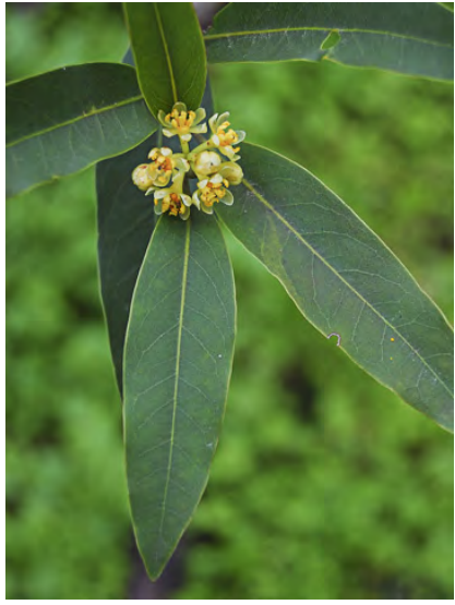
CALIFORNIA BAY (Umbellularia californica) Native Perennial - Laurel Family - (Nov–May) -Common. Canyons, valleys, chaparral - Tree < 150' tall. Leaf 1.2-4", 0.6-1.2" wide, aromatic. Cluster of 5-10 small, yellow or yellow-green flowers. Fruit 0.8-1" diam.