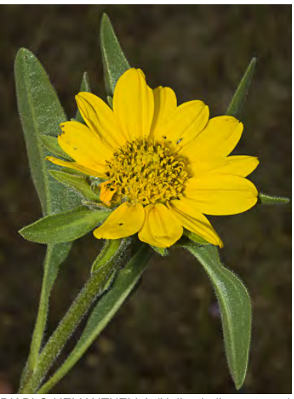
DIABLO HELIANTHELLA (Helianthella castanea) Native Perennial - Sunflower Family - (Apr–Jun) -Open, grassy sites - Stem 4-20" tall. Leaves w/ 1 pair of veins more distinct. Outer head bracts leaf-like, curl around head. CNPS: FAIRLY ENDANGERED.