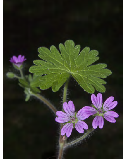
HAIRY DOVE'S FOOT GERANIUM (Geranium molle) Naturalized Annual - Geranium Family -(Feb-Aug) - Open to shaded sites, disturbed ground - Stem 4-17" tall. Petals red-purple, 0.1-0.4" long, notched. Sepals awnless. Fruit grouth wrighted smooth, wrinkled.

Wild Plants of Briones Regional Park - Sorted by Form, Color and Family