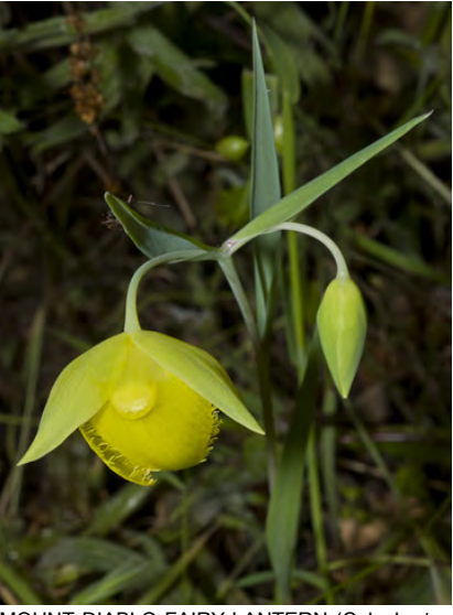
MOUNT DIABLO FAIRY-LANTERN (Calochortus pulchellus) Native Perennial - Lily Family -(Apr-Jun) - Wooded slopes, rarely chaparral, gen n aspect - Stem 4-12", gen branched. Petals light yellow, 1-1.3", sparsely hairy inside. CNPS: FAIRLY ENDANGERED.