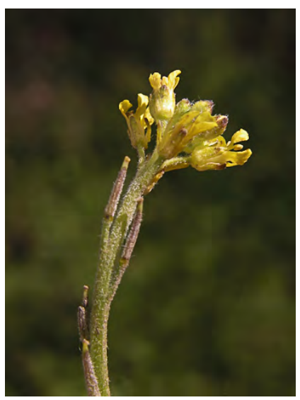
SHORTPOD MUSTARD (Hirschfeldia incana) Naturalized Biennial-Perennial - Mustard Family -(Apr–Oct) - Disturbed areas - Stem 16-60". Longest leaves 1.6-4" long, dense-hairy. Petals pale yellow, ~0.2" long. Fruit appressed. Fall-blooming. INVASIVE.