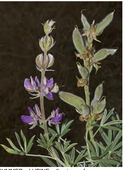
SUMMER LUPINE (Lupinus formosus var. formosus) Native Perennial - Pea Family -(Apr–Sep) - Dry clay soils, grassland, open areas under pines, gen in valleys - Plant 8-32", low growing. Leaves hairy. Flowers purple, hairless, summer/fall blooming.