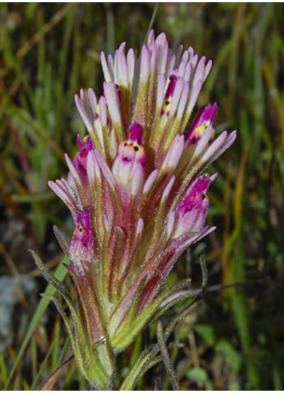
COMMON OWL'S-CLOVER (Castilleja densiflora subsp. densiflora) Native Annual – Broom-rape Family - (Mar–May) - Grassland - Plant 4-16" tall. Leaves 0.8-3.1" long, narrow-lobed. Flower cluster gen rose-purple. Flower upper lip straight.