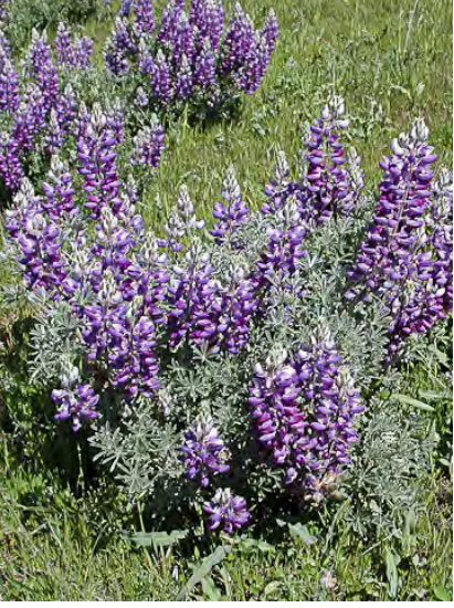
BUSH LUPINE (Lupinus albifrons var. albifrons) Native Perennial - Pea Family - (Mar–Jun) -Common. Chaparral, foothill woodland - Shrub 2-16' tall, gen distinct trunk, green to silvery. Flowers 0.35-0.6" long, purple, banner back hairy, keel top ciliate mid to tip.