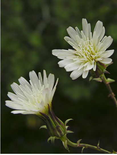
CALIFORNIA CHICORY (Rafinesquia californica) Native Annual - Sunflower Family - (Apr–Jul) -Open sites in scrub, woodland; often common after fire - Stem 2-15+ dm. Flower heads 0.8-1.2" wide, solitary. Rays white or cream, extend 0.2-0.3" beyond bracts.