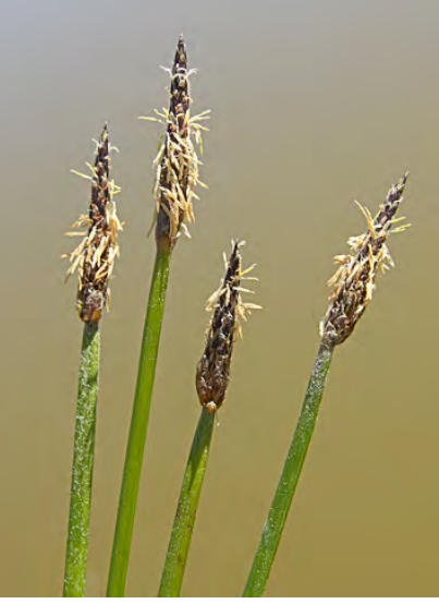
COMMON SPIKERUSH (Eleocharis macrostachya) Native Perennial - Sedge Family -(Spring-summer) - Common. Fresh to brackish wetland - Stem 8-39" tall, 0.06-0.1" wide. Spikelet 0.2-1.6" long, 0.08-0.2" wide, style 2-branched.