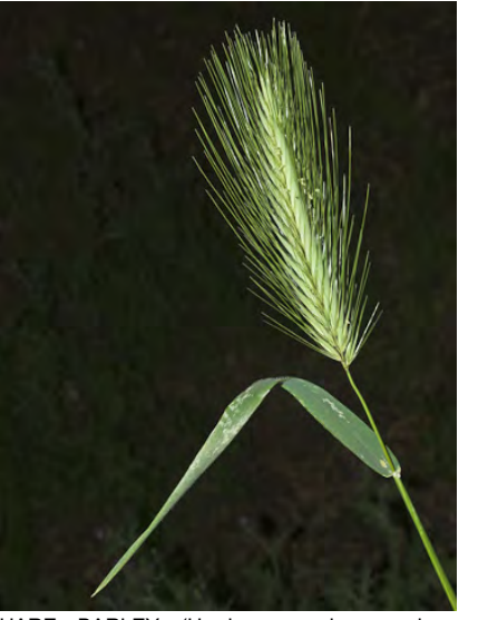
HARE BARLEY (Hordeum murinum subsp. leporinum) Naturalized Annual - Grass Family -(Feb-May) - Moist, gen disturbed sites. Common - Stem 12-43" tall. Central spikelet stalk ~0.06" long. Central floret << lateral florets. INVASIVE weed.