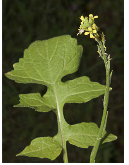
HEDGE MUSTARD (Sisymbrium officinale) Naturalized Annual - Mustard Family - (Apr–Sep) - Disturbed areas, fields, pastures - Stem 10-22" tall, thin, wiry. Petals 0.1-0.16" long, pale yellow. Fruit 0.4-0.55" long, awl-shaped, appressed.