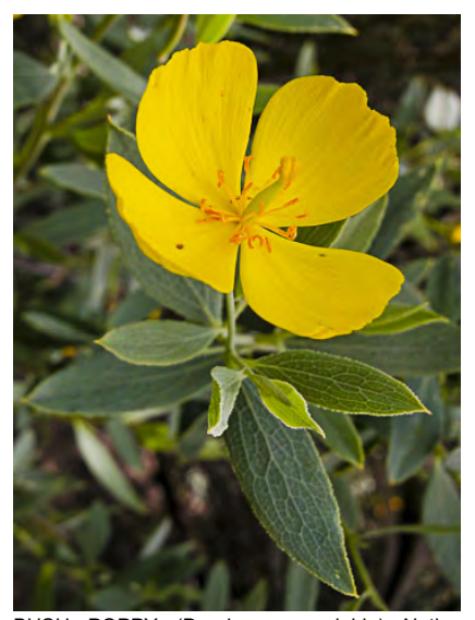
BUSH POPPY (Dendromecon rigida) Native Perennial - Poppy Family - (Apr-Jun) - Dry slopes, washes, esp recent burns - Shrub 3.3-10' tall. Leaves 1-4" long, 0.3-1" wide. Petals 4, yellow, 0.8-1.2" long. Many stamens.