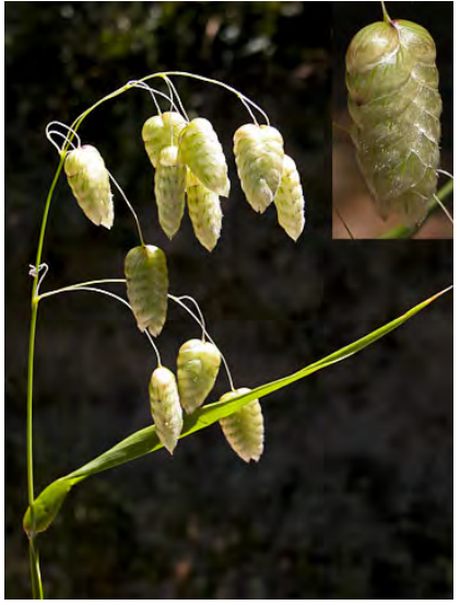
RATTLESNAKE GRASS (Briza maxima) Naturalized Annual - Grass Family - (Apr–Jul) -Shaded sites, roadsides, pastures, weedy on coastal dunes - Stem 8-35" tall. Spikelets 0.4-0.75" long, resemble rattlesnake rattles. INVASIVE weed.