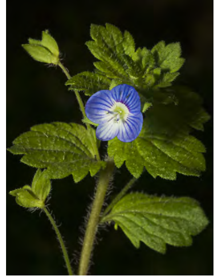
PERSIAN SPEEDWELL (Veronica persica) Naturalized Annual - Plantain Family - (Feb–May) - Wet, disturbed areas, fields - Stem 2-24" long, crawling. Flowers on 0.6-1.2" long stalks. Flowers blue, purple-lined with a white center.