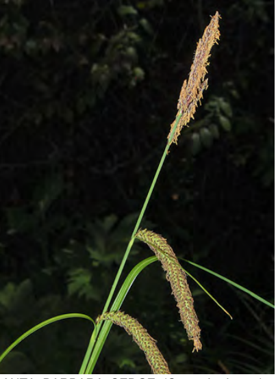
SANTA BARBARA SEDGE (Carex barbarae) - Native Perennial - Sedge Family - (May-Aug) - Seasonally wet places - Stem 6-36" tall, base brown to purple. Lowest flower cluster "leaves" < 4" long. Spikelets brown, 1-3" long, 0.2-0.3" wide.