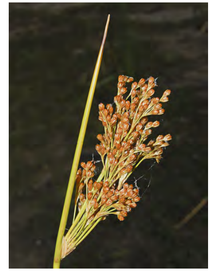
BALTIC RUSH (Juncus balticus subsp. ater) Native Perennial - Rush Family - (Jul-Nov) -Moist to \pm dry sites - Stem 14-43" tall, round, not twisted. No leaf blade. Flowers generally 0.1-0.2" long.