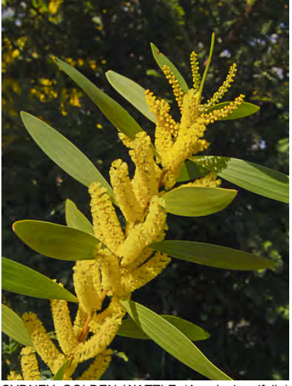
SYDNEY GOLDEN WATTLE (Acacia longifolia) Naturalized Perennial - Pea Family - (Jan-Apr) -Uncommon. Disturbed places, especially sandy coastal areas - Shrub-small tree, spineless. Leaves simple, 2-6" long with 2-4 main veins. Flowers bright yellow.