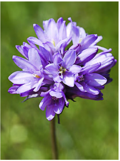
FORK-TOOTHED OOKOW (Dichelostemma congestum) Native Perennial - Brodiaea Family - (Apr–Jun) - Open woodland, grassland - Plant 12-35" tall. Flowers blue-purple, narrowed above ovary. Stamens 3. Late spring bloomer.