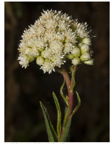
MARSH BACCHARIS (Baccharis glutinosa) Native Perennial - Sunflower Family - (Jul–Oct) -Coastal freshwater and saltwater marshes, streambanks - Plant herbaceous, sticky, 3-6' tall. Leaf blades lance-shaped, < 5" long, 0.5-1.2" wide.