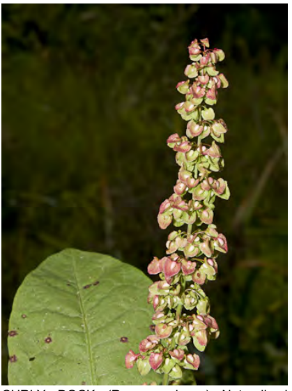
CURLY DOCK (Rumex crispus) Naturalized Perennial - Buckwheat Family - (All year) -Abundant. Disturbed places - Stem 16-39" tall. Flower cluster dense, valves 0.2-0.24", winged around tubercles, smooth edged. 1 tubercle enlarged. INVASIVE.