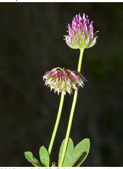
FOOTHILL CLOVER (Trifolium ciliolatum) Native Annual - Pea Family - (Mar–Jun) - Locally common. Grassland, chaparral, disturbed areas -Flower head 0.3-0.8" wide w/vestigial bract. Flowers pink to purple, soon reflexed, bracts w/short, flat bristles.