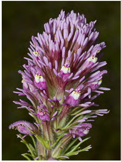
PURPLE OWL'S-CLOVER (Castilleja exserta subsp. exserta) Native Annual - Broom-rape Family - (Mar-May) - Open fields, grassland -Plant sticky, short-hairy. Flower cluster tipped white, pale yellow or rose. Flower upper lip hooked, fuzzy.

Wild Plants of Briones Regional Park - Sorted by Form, Color and Family