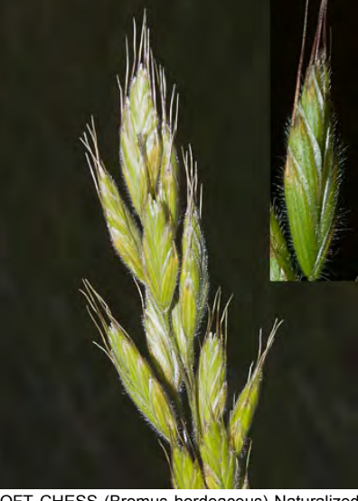
SOFT CHESS (Bromus hordeaceus) Naturalized Annual - Grass Family - (Apr-Jul) - Fields, disturbed areas - Plant 4-26" tall. Leaf hairy. Flower cluster 1-5" long, dense, some stalks > spikelet. Spikelet 0.5-0.9". Lemma 0.26-0.4", awn 0.16-0.4". INVASIVE weed.