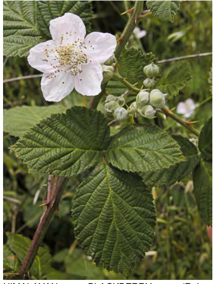
HIMALAYAN BLACKBERRY (Rubus armeniacus) Naturalized Perennial - Rose Family - (Mar–Jun) - Common. Disturbed areas, roadsides - Shrub w/thorny 5-angled stem. Leaflets 3-5, white-hairy beneath. Blackberry-type fruit. INVASIVE.