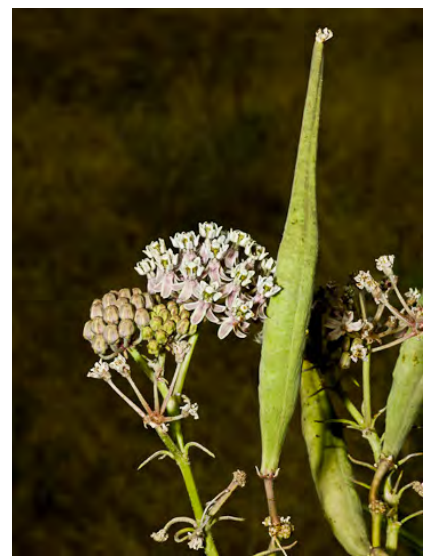
NARROW-LEAF MILKWEED (Asclepias fascicularis) Native Perennial - Dogbane Family - (May-Oct) - Dry ground, valleys, foothills - Plant gen hairless. Stem leaves narrow, 3-5 in whorls. Flowers green-white to purple-tinged, ~0.25" long.