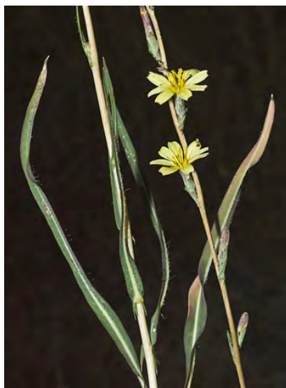
WILLOW LETTUCE (Lactuca saligna) Naturalized Annual - Sunflower Family -(Jul-Nov) - Roadsides, grassland - Stem 12-39" tall. Leaf lobes entire or few-toothed, no prickles underneath. Flowers 5-12, pale yellow, open in morning.