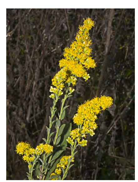
CALIFORNIA GOLDENROD (Solidago velutina subsp. californica) Native Perennial - Sunflower Family - (May–Nov) - Woodland margins, grassland, disturbed soils - Stem 8-60" tall. Gen densely short-soft-hairy. Flower cluster height 2-4x width.