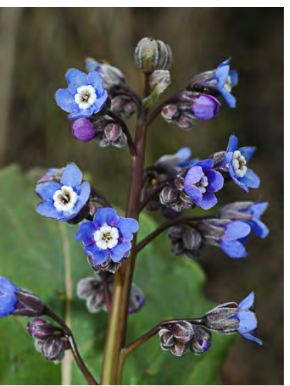
GRAND HOUND'S TONGUE (Cynoglossum grande) Native Perennial - Borage Family - (Feb-May) - Chaparral, woodland - Stem 1-3'. Leaf stalk 3-6". Leaf blade 3-6" cm long, broadly oval. Flowers bright blue w/inner white teeth.