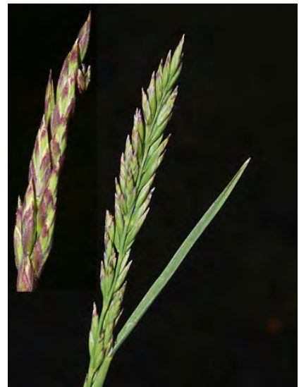
ONE-SIDED BLUE GRASS (Poa secunda subsp. secunda) Native Perennial - Grass Family - (Mar-Aug) - Common. Dry slopes to saline/alkaline meadows to alpine - Plant 6-40" tall, densely tufted. Flower clusters congested. Spikelets gen 0.3-0.4" long. Lemmas 0.16-0.2" long, backs rounded.