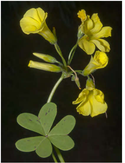
BERMUDA BUTTERCUP (Oxalis pes-caprae) Naturalized Perennial - Oxalis Family (Jan-May) - Disturbed areas, roadsides, grassland, dunes - Flowering stem < 12" tall. Leaflets in 3s, < 1.4" long. Petals yellow, < 1" long. Ornamental. INVASIVE weed.