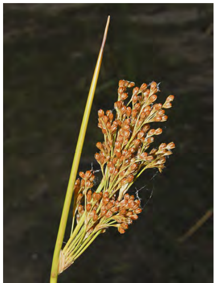
BALTIC RUSH (Juncus balticus subsp. ater) Native Perennial - Rush Family - (Jul-Nov) -Moist to ± dry sites - Stem 14-43" tall, round, not twisted. No leaf blade. Flowers generally 0.1-0.2" long.