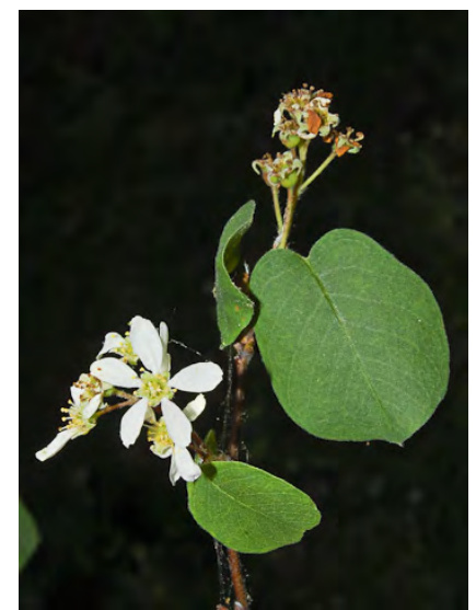
SIERRA PLUM (Prunus subcordata) Native Perennial - Rose Family - (Mar–May) - Mixed-evergreen or conifer forest - Shrub < 10'. Leaf: stem 0.16-0.6", blade 1-2", elliptic to wide egg-shaped, base round heart-shaped, tip round. Petals 0.2-0.4" long, white.