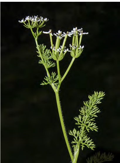
VENUS' NEEDLE (Scandix pecten-veneris) Naturalized Annual - Carrot Family - (Apr-Jun) - Grassy slopes, roadsides - Plant 6-20" tall. Leaf segments finely divided, linear. Flowers white, outer petals larger. Fruit 0.2-1" long with a beak 0.8-2.8" long.