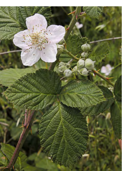
HIMALAYAN BLACKBERRY (Rubus armeniacus) Naturalized Perennial - Rose Family - (Mar–Jun) - Common. Disturbed areas, roadsides - Shrub w/thorny 5-angled stem. Leaflets 3-5, white-hairy beneath. Blackberry-type fruit. INVASIVE.