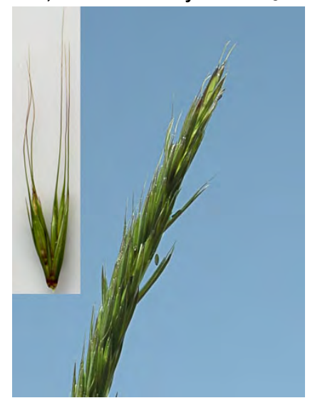
WESTERN WILD-RYE (Elymus glaucus subsp. glaucus) Native Perennial - Grass Family - (Jun-Aug) - Open areas, chaparral, woodland, forest - Tufted. Stem 12-55" tall. Leaf 0.2-0.5" wide, flat. Spikelets0.3-0.6" long, 2-4 per node. Lemma awn 0.4-1.2" long.