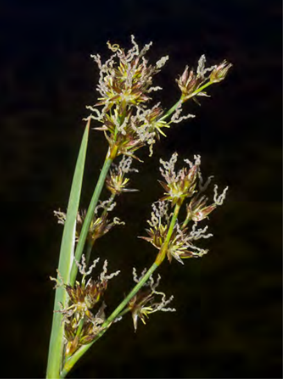
IRIS-LEAVED RUSH (Juncus xiphioides) Native Perennial - Rush Family - (Jul-Oct) - Wet places - Plant 16-32" tall. Leaf blades 0.2-0.5" wide, flat, Iris-like. Heads many, few-flowered. Anthers 6, < filaments, flowers self-pollinating.