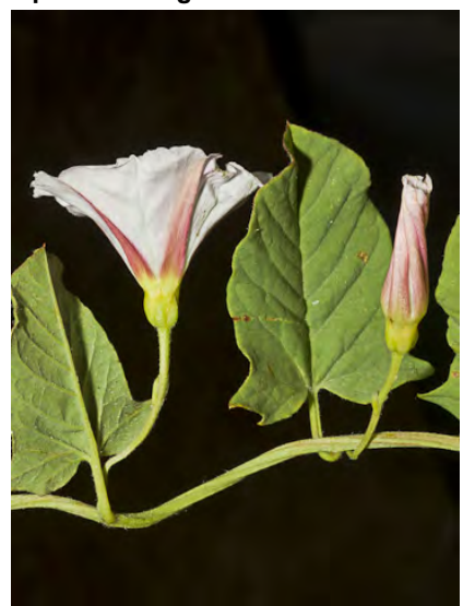
BINDWEED (Convolvulus arvensis) Naturalized Perennial - Morning-glory Family - (Mar—Oct) - Roadsides, open areas in many pl communities - Trailing. Leaf 0.8-1.2" long, w/round tip, pointed lobes. Flowers white to pink, 0.8-1" long. NOXIOUS.