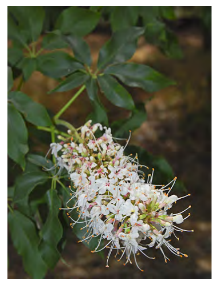
CALIFORNIA BUCKEYE (Aesculus californica) Native Perennial - Soapberry Family - (May–Jun) - Dry slopes, canyons, borders of streams - Large shrub or tree 13-39' tall. 5-7 leaflets. Flowers white to pale rose. Large seeds toxic but edible after leaching out saponins.