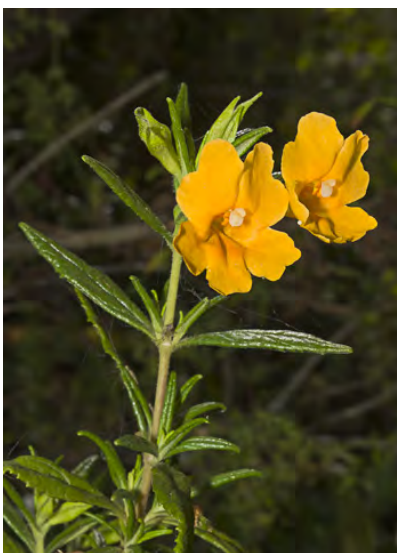
BUSH MONKEYFLOWER (Mimulus aurantiacus var. aurantiacus) Native Perennial - Lopseed Family - (Mar-Jun) - Disturbed areas, coastal cliffs, canyon sides - Shrub 4-60". Flowers yellow, orange or red; 1-2.3" long; bract tube glabrous.