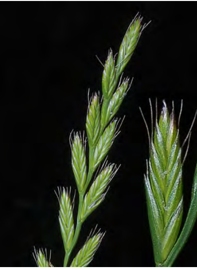
RYE GRASS (Festuca perennis) Naturalized Perennial - Grass Family - (May-Sep) - Dry to moist disturbed sites, abandoned fields - Stem 20-40" tall. Spikelet 0.2-0.9" long, > glume, awned or awnless. Sterile shoots at base. INVASIVE weed.