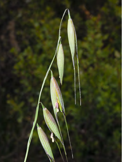
WILD OAT (Avena fatua) Naturalized Annual - Grass Family - (Apr-Jun) - Disturbed sites - Plants 1-5' tall. Spikelets 0.7-1.3" long. Low awn 1-1.6" long. Lemma tip bristles < 0.04" long. Seeds EDIBLE whole or ground for flour. INVASIVE weed.