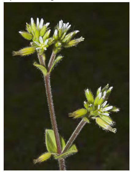
STICKY MOUSE-EAR CHICKWEED (Cerastium glomeratum) Naturalized Annual - Pink Family -(Spring) - Dry hillsides, grassland, chaparral, disturbed areas - Flowers 0.1-02" long, white, sticky-hairy. Flower bract hairs extend beyond tip; bracts herbaceous.