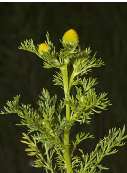
PINEAPPLE WEED (Matricaria discoidea) Naturalized Annual - Sunflower Family - (Feb-Aug) - Abundant. Disturbed sites, riverbanks - Plant 4-12" tall, sweet-scented. Heads pineapple-shaped, ~ 0.4" wide; head stalk to 0.6" long.