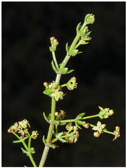
CLIMBING BEDSTRAW (Galium porrigens var. porrigens) Native Perennial - Madder Family - (May-Aug) - Among shrubs in chaparral, forest - Stem 4-59" long. Leaves 0.1-0.7" long, oval to egg-shaped, in whorls of 4. Flowers yellow to red, 4-lobed.