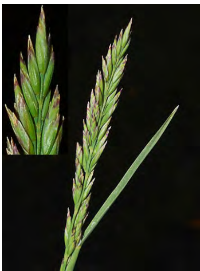
JUNE GRASS (Koeleria macrantha) Native Perennial - Grass Family - (May–Jul) - Dry, open sites, clay to rocky soils, shrubland, woodland, conifer forest - Stem 8-32" long. Flower cluster condensed, shiny, branches short-hairy. Spikelet ~0.2" long, no awns.