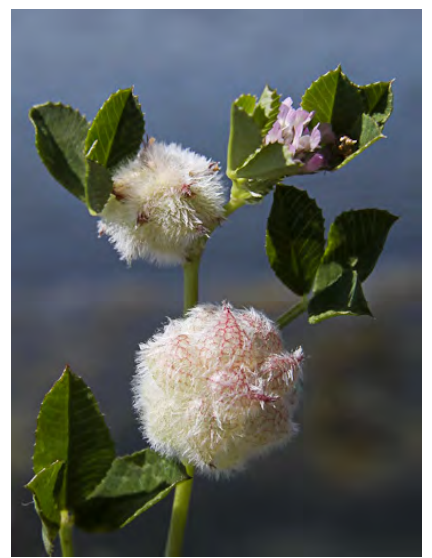
STRAWBERRY CLOVER (Trifolium fragiferum) Naturalized Perennial - Pea Family - (Late spring) - Roadsides, gen in saline soil - Head bracts 0.08" long, green. Flowers pink, 0.2-0.24" long, quickly hidden by hairy inflated flower bracts.