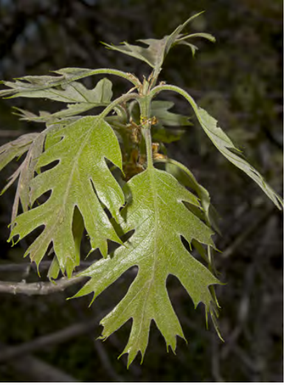
CALIFORNIA BLACK OAK (Quercus kelloggii) Native Perennial - Oak Family - (Apr-May) -Slopes, valleys, woodland, conifer forest - Tree < 80', deciduous. Leaves 3.5-8" long, supple, deeply-lobed, lobes bristle-tipped.