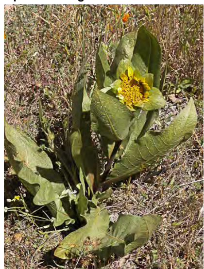
SMOOTH MULE'S EARS (Wyethia glabra) Native Perennial - Sunflower Family - (Mar–Jun) - Gen shady sites - Plant 4-16" tall, shiny green, no woolly hairs. Leaf basal blades 10-18" long, lance-shaped to oval, shiny. Ray flowers 1-2" long.