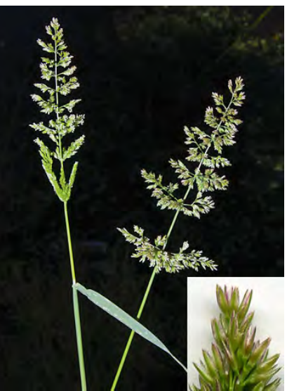
WATER BEARD GRASS (Polypogon viridis) Naturalized Perennial - Grass Family - (May–Jun) - Common. Disturbed areas, wet areas, ponds, streambanks -Stem 4-40" long, trails. Leaf blades flat, 0.08-0.4" wide. Spikelet ~ 0.1" long, no awn, whorled clusters.