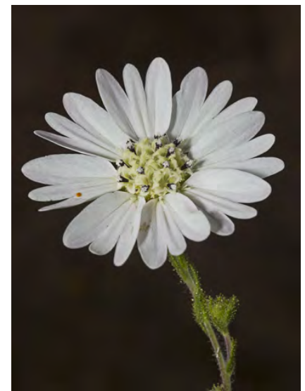
HAYFIELD TARWEED (Hemizonia congesta subsp. luzulifolia) Native Perennial - Sunflower Family - (Mar-Dec) - Disturbed, open, or grassy sites, often clayey soils, serpentine - Plant 2-32" tall. Flowers white, rays 0.2-0.5" long; head bract tips < body.