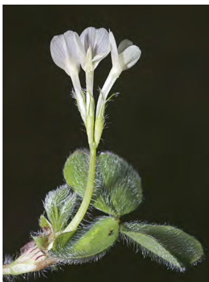
SUBTERRANEAN CLOVER (Trifolium subterraneum) Naturalized Annual - Pea Family -(Mar–Apr) - Meadows, roadsides, disturbed areas - Plant hairy, creeping. Leaflets 0.4-0.6" long. Head 0.4" wide. Flowers white, 0.3-0.55" long, fruit in a bur.