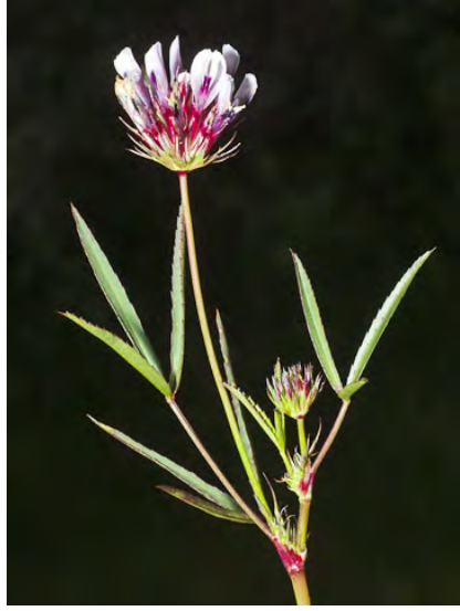
TOMCAT CLOVER (Trifolium willdenovii) Native Annual - Pea Family - (Mar–Jun) - Abundant. Disturbed, gen spring-moist, heavy soils, occas serpentine - Head bract wheel-shaped, sharp-lobed. Leaf narrow. Flowers purple w/white tip, 0.3-0.6" long.