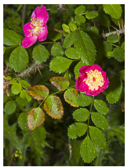
WOOD ROSE (Rosa gymnocarpa var. gymnocarpa) Native Perennial - Rose Family - ((Feb)Apr-Jul) - Common. Gen in shade of forest, scrub - Shrub w/straight thorns. Flowers gen solitary, stalks sticky, fruit smooth, sepals deciduous.