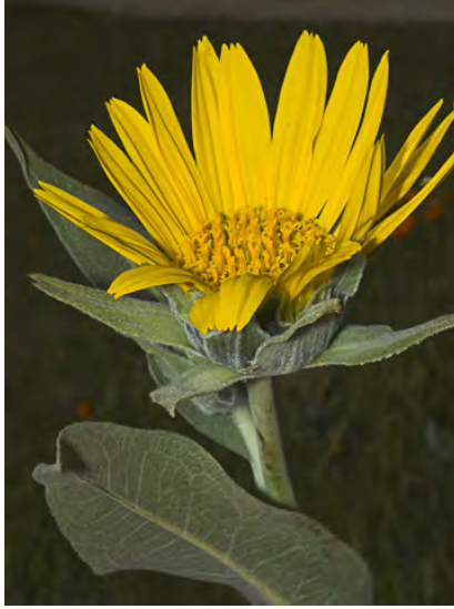
GRAY MULE'S EARS (Wyethia helenioides) Native Perennial - Sunflower Family -(Mar–May(Aug)) - Open grassland, woodland, scrub - Plant 8-28" tall, densely woolly, often becoming smooth. Some woolly hairs remain on leaf stalks and floral bracts.