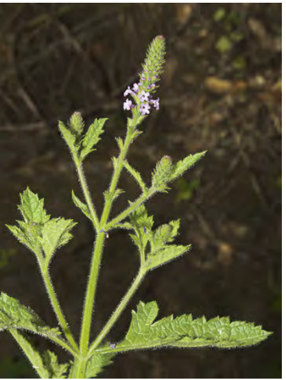
ROBUST VERVAIN (Verbena lasiostachys var. scabrida) Native Perennial - Vervain Family - (May–Sep) - Open, dry to wet places - Plant 14-32" tall. Leaves green, narrow, 3-lobed, stiff-haired above. Flowers blue to purple on long stalk