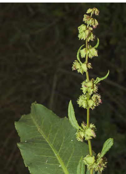
FIDDLE DOCK (Rumex pulcher) Naturalized Perennial - Buckwheat Family - (May–Sep) - Disturbed places, meadows, moist or dry habitats - Stem 8-24" long, branches widely spreading. Leaf blades 1.6-4" long, 1.2-2" wide. Valves w/2-5 teeth.