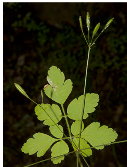
SWEET-CICELY (Osmorhiza berteroi) Native Perennial - Carrot Family - (Apr–Jul) - Conifer forest, woodland, disturbed areas - Plant 12-47". Leaflets in 3s, serrate to irreg lobed. Flower white. Fruit 0.5-1", upward pointing barbs, splitting apart below.