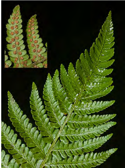
COASTAL WOOD FERN (Dryopteris arguta) Native Perennial - Wood Fern Family - - - Locally common. Open, wooded slopes, caves - Leaf 12-24" long,5-12" wide, divided 1-2 times. Segments generally with spine-tipped teeth.