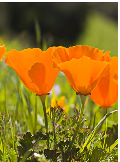
CALIFORNIA POPPY (Eschscholzia californica) Native Perennial - Poppy Family - (Feb-Sep) - Grassy, open areas - Plant 2-24" tall. Flower w/spreading rim <= 0.2". Petals 0.8-2.4" long, early spring = large and orange, fall = smaller and yellow.