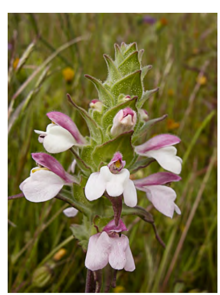
MEDITERRANEAN LINSEED (Bellardia trixago) Naturalized Annual - Broom-rape Family - (Apr-Jun) - Disturbed grassland. - Plant sticky-hairy. Stem 6-32" tall. Leaves lance-shaped, toothed. Flowers 0.8-1" long, 2-lipped: upper lip pink, lower lip white. INVASIVE.