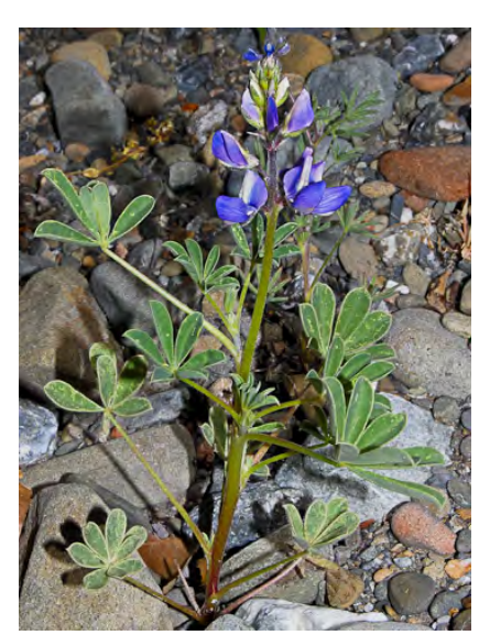
ARROYO LUPINE (Lupinus succulentus) Native Annual - Pea Family - (Feb-May) - Abundant. Open or disturbed areas, often seeded on roadbanks - Plant 8-40" tall, fleshy, sparsely hairy. Flowers 0.5-0.7" long, whorled, gen blue-purple, petal claws short-hairy.