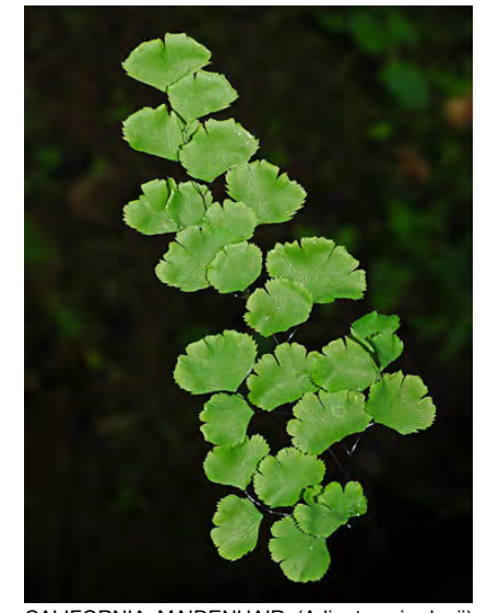
CALIFORNIA MAIDENHAIR (Adiantum jordanii) Native Perennial - Brake Fern Family - - - Shaded hillsides, moist woodland - Leaves 8-28" long with many rounded symmetrical segments, each with < 4 irregular lobes. Cultivated. Sudden Oak Death carrier.