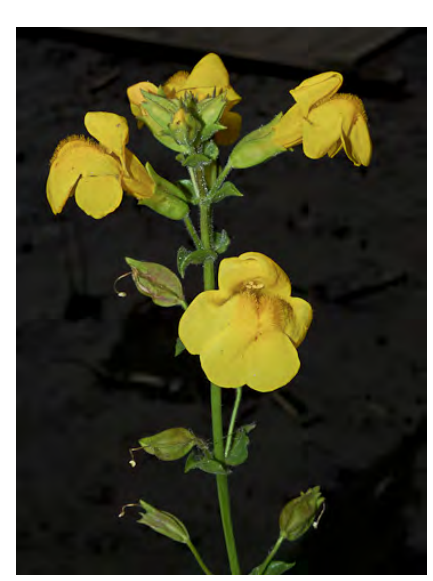
GOLDEN MONKEYFLOWER (Mimulus guttatus) Native Perennial - Lopseed Family - (Mar–Aug) - Common. Wet places, gen terrestrial, occ emergent or floating in mats - Plant 0.8-60". Flower yellow, gen > 0.8" long; mature bracts flattened sideways, inflated in fruit.