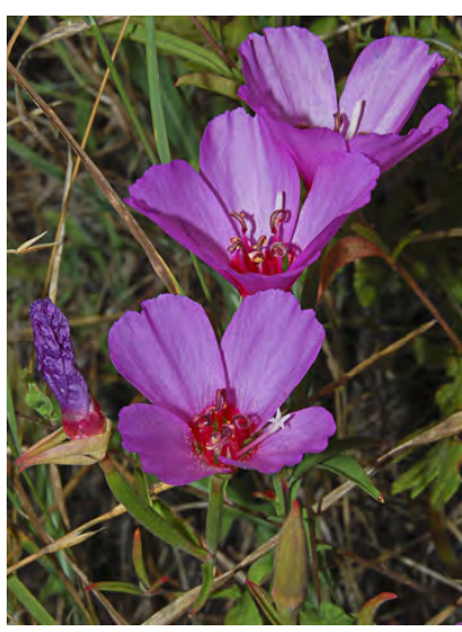
RUBY CHALICE CLARKIA (Clarkia rubicunda) Native Annual - Evening Primrose Family - (May-Aug) - Openings in woodland, forest, chaparral near coast - Stem < 5' long. Buds erect. Petals 0.4-1.2", rose w/red base. Sepals united. Stigma > anthers.