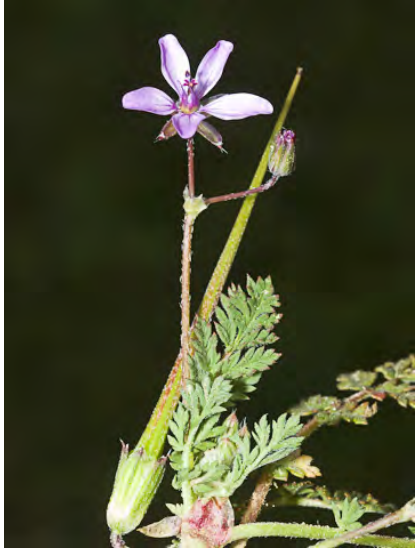
REDSTEM FILAREE (Erodium cicutarium) Naturalized Annual - Geranium Family (Feb-Sep) - Open, disturbed sites, grassland, scrub - Stem 4-20". Leaves compound, leaflets dissected. Sepal tip bristly. Petal pink to purple. Fruit beak 0.8-2". INVASIVE.