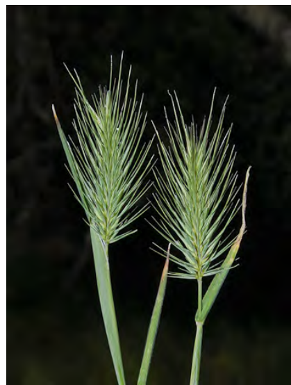
MEDITERRANEAN BARLEY (Hordeum marinum subsp. gussoneanum) Naturalized Annual - Grass Family - (Apr-Jun) - Dry to moist, disturbed sites - Stem 4-20". Leaf blades to 32" long, auricles < 0.08". Central lemma awn 0.25-0.7" long. INVASIVE weed.