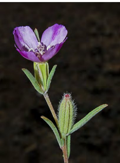
FOUR-SPOT (Clarkia purpurea subsp. quadrivulnera) Native Annual - Evening Primrose Family - (Apr–Aug) - Common. Open, grassy or shrubby places - Buds erect. Petals < 0.6", lavender to dark red. Ovary 8-grooved. Sepals 1's or 2's.