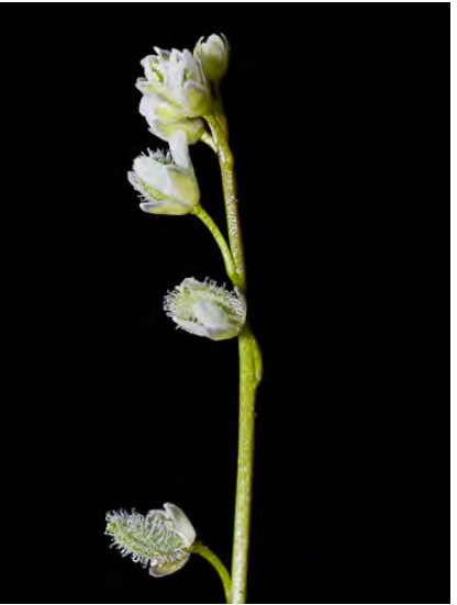
DWARF SANDWEED (Athysanus pusillus) Native Annual - Mustard Family - (Feb–Jun) -Grassy, open slopes, rocky outcrops, chaparral, flats, floodplains, cliffs, ledges - Stem 2-12" long, spindly. Flower cluster 1-sided. Petals white, ~0.1" long. Fruits round, hairy.