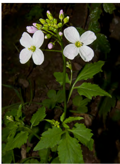
MILK MAIDS (Cardamine californica) Native Perennial - Mustard Family - (Jan-May) - Gen shaded sites, canyons, woodland. One of first spring flowers - Stem 10-24" long. Leaves lobed to compound w/sharp teeth. Petals white or pale rose, 0.3-0.5" long.