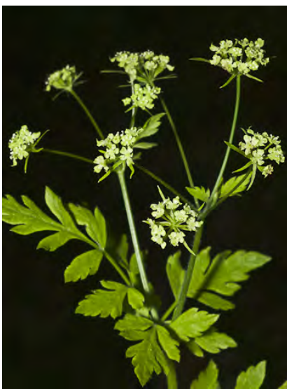
TALL SOCK-DESTROYER (Torilis arvensis) Naturalized Annual - Carrot Family - (Apr–Jul) - Disturbed places - Plant erect, 12-40". Flower clusters open, > leaf. Fruits 0.1-0.2" long, covered with uncurved bristles. Flowers white or pinkish. INVASIVE weed.