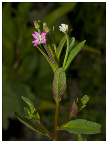
COMMON WILLOWHERB (Epilobium ciliatum subsp. ciliatum) Native Perennial - Evening Primrose Family - (Jun-Oct) - Common. Disturbed places, moist meadows, streambanks, roadsides - Plant 20-48" tall, smooth or short-hairy. Petals 2-6 mm, white to pink.