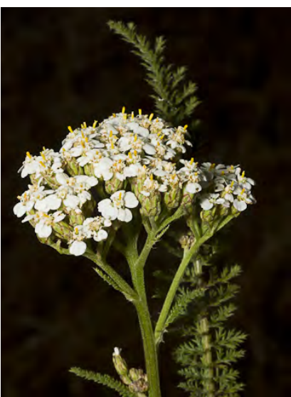
YARROW (Achillea millefolium) Native Perennial - Sunflower Family - (Apr-Sep) - Many habitats - Plant 4"-7' tall. Stem white-hairy. Leaves finely dissected. Flower cluster flat-topped. Flowers white to pink. Widely used in folk medicine.