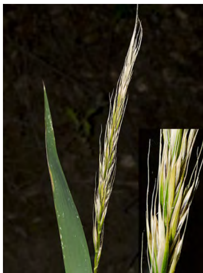
BEARDLESS WILD RYE (Elymus triticoides) Native Perennial - Grass Family - ( Jun-Jul) - Dry to moist, often saline, meadows - Plant 18-50" tall, from rhizomes. Flower cluster 2-8" long. Spikelets generally 2/node. Lemmas 3-7, 0.2-0.5" long, awn to 0.12" long.