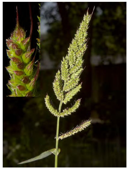
BARNYARD GRASS (Echinochloa crus-galli) Naturalized Annual - Grass Family - (Jun–Oct) - Gen wet, disturbed sites, fields, roadsides - Stem 12-39" long. Leaf blades to 25" long, 0.2-1.2" wide. Spikelet 0.1-0.16" long, floret ~0.14" long, 1 per node. Awns 0-2" long on same plant.