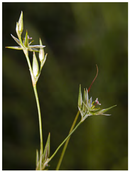
TOAD RUSH (Juncus bufonius var. bufonius) Native Annual - Rush Family - (May—Sep) - Damp sunny ground, gen disturbed - Stem gen 1-4" tall, gen brached from base, ~0.04" wide. Flower cluster open. Flowers 0.16-0.3" long.