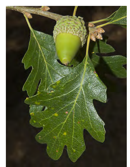
VALLEY OAK (Quercus lobata) Native Perennial - Oak Family - (Mar–Apr) - Slopes, valleys, savanna - Tree < 115' tall, deciduous. Leaves 2-5" long, not leathery, deeply lobed, lobes without bristles. Acorns 1.2-2" long, slender, cup 0.4-1.2" deep.