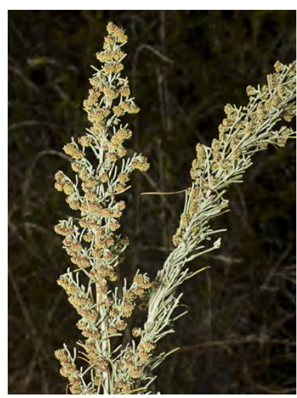
CALIFORNIA SAGEBRUSH (Artemisia californica) Native Perennial - Sunflower Family -(Aug-Nov) - Coastal scrub, chaparral, open woodland - Shrub 2-8.5' tall, rounded. Leaves 0.4-4", hairy, thread-like, It green to gray. Flower heads < 5 mm wide. Sage-scented.