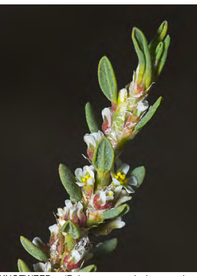
KNOTWEED (Polygonum aviculare subsp. depressum) Naturalized Annual - Buckwheat Family - (May–Nov) - Disturbed places - Stem 4-20", mat-forming. Flowers 2-8/leaf axil, ~0.1" long, fused 1/2 length, w/white or pink margins.