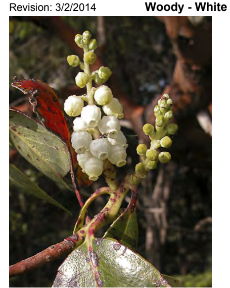
PACIFIC MADRONE (Arbutus menziesii) Native Perennial - Heath Family - (Mar–May) - Conifer, oak forests - Tree < 130' tall, evergreen, peeling red bark. Leaf blades < 5" long. Flowers yellow-white or pink, < 3.1" long. Berries red, < 0.5" diam, round.