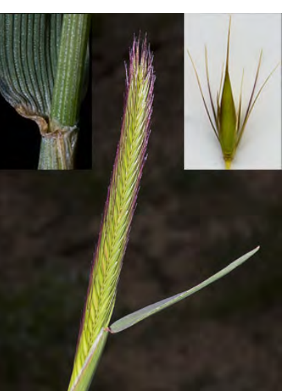
NORTHERN BARLEY (Hordeum brachyantherum subsp. brachyantherum) Native Perennial - Grass Family - (May–Aug) - Meadows, pastures, streambanks - Stem 1-3' tall, gen robust. Leaf sheaths gen smooth, blade < 7.5" long. Lemma awn < 0.25".