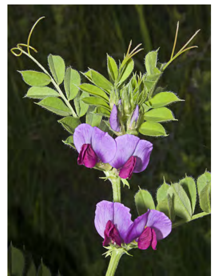
SPRING VETCH (Vicia sativa subsp. sativa) Naturalized Annual - Pea Family - (Mar–Jun) - Roadsides, disturbed areas, grassland, open areas in oak and riparian woodlands - Flowers 1-2 at leaf bases, pink-purple to white, 0.7-1.2" long. Leaflets 0.16-0.4" wide.