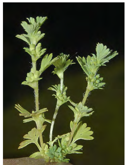
LADY'S MANTLE (Aphanes occidentalis) Native Annual - Rose Family - (Mar–May) - Seasonally moist grassland, chaparral, woodland - Plant inconspicuous, soft hairy, < 4" tall. Leaves 0.1-0.5" long, deeply lobed. Flowers yellow-green, < 0.1" long.