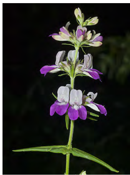
CHINESE-HOUSES (Collinsia heterophylla var. heterophylla) Native Annual - Plantain Family - (Mar–Jun) - Shady places in chaparral, open mixed woodland, oak woodland - Plant 4-20" tall. Flowers 0.6-0.8" long, upper lip whitish.