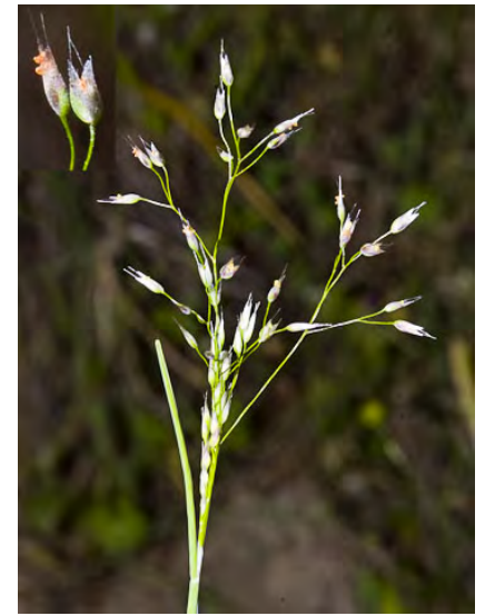
SILVER HAIR GRASS (Aira caryophyllea) Naturalized Annual - Grass Family - (Apr–Jun) - Sandy soils, open or disturbed sites - Flower cluster > 0.6" wide, diffuse with long slender branches. Spikelets about 0.1" long with 2 extended awns.