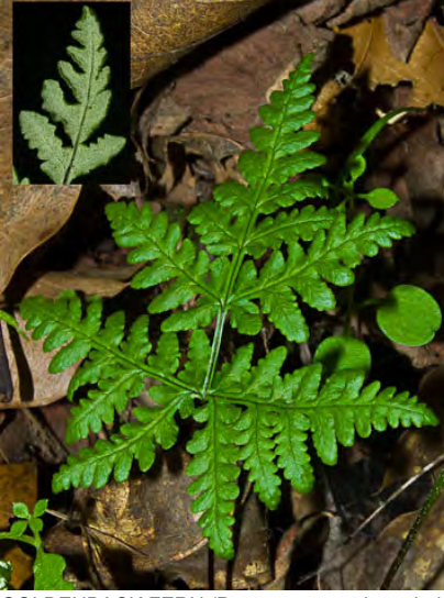
GOLDENBACK FERN (Pentagramma triangularis subsp. triangularis) Native Perennial - Brake Fern Family - - - Gen shaded, sometimes rocky or wooded areas - Leaves triangular, 1.2-4" long, undersides either granular green or powdery gold.