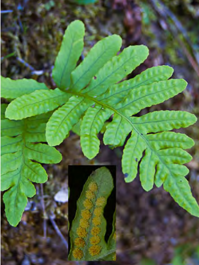
POLYPODY FERN (Polypodium calirhiza) Native Perennial - Polypody Family - - - On plants, rocky cliffs or outcrops, roadcuts, often granitic or volcanic, rarely dunes - Leaf blades 4-8" long, often widest above base, deeply lobed.