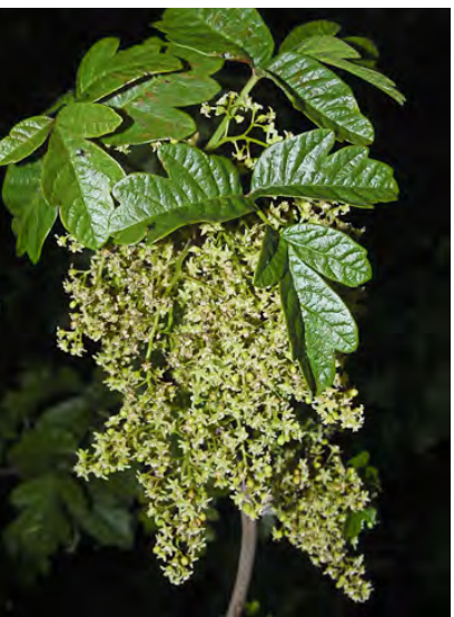
WESTERN POISON OAK (Toxicodendron diversilobum) Native Perennial - Sumac Family -(Apr–Jun) - Canyons, slopes, chaparral, coastal scrub, oak woodland - Shrub or vine. Leaflets 3, red in fall, mid leaflet stalked. Flowers green. Fruits white. TOXIC.