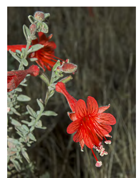
CALIFORNIA FUCHSIA (Epilobium canum subsp. canum) Native Perennial - Evening Primrose Family - (Jun-Dec) - Dry slopes, ridges - Plant hairy, gen sticky with a woody base. Leaf 0.3-2.8" long, gray to green. Flowers red-orange, floral tube 0.8-1.2" long.