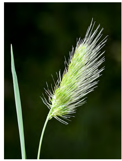
BRISTLY DOGTAIL GRASS (Cynosurus echinatus) Naturalized Annual - Grass Family - (May-Jul) - Open, disturbed sites - Tufted. Stem 4-28" long. Leaf blade 0.1-0.6" wide. Flower cluster 0.4-1.6" long, 1-sided. Fertile and sterile spikelets. INVASIVE weed.