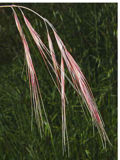
RIPGUT GRASS (Bromus diandrus) Naturalized Annual - Grass Family - (Apr-Jul) - Open, gen disturbed areas - Plant 6-40" tall. Spikelet 1-2.8" long. Lemma body 0.8-1.2" long, awn > 1.2" long. Barbed seeds can stick in flesh of animals. INVASIVE weed.