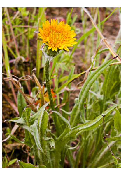
GIANT NATIVE DANDELION (Agoseris grandiflora var. grandiflora) Native Perennial - Sunflower Family - (Apr-Jul) - Grassland, scrub, woodland - Plant 10-40". Leaf lobes point up. Flower rosy-purple, variable-sized bracts. Seed tapers to beak > 2x body length. Leaf lobes point upward.