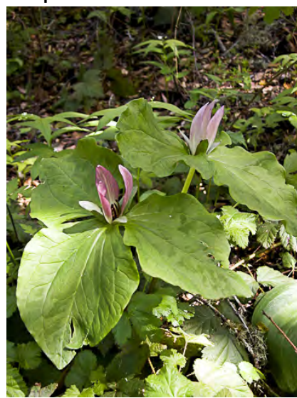
GIANT TRILLIUM (Trillium chloropetalum) Native Perennial - Bunchflower Family - (Apr–May) - Edges of redwood forest, chaparral, gen moist slopes, canyon banks in alluvial soils - Flowers dark purple to white, sessile. Petals 2.6-4" long, odor rose-like or spicy.