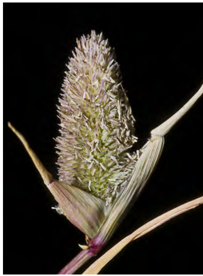
SWAMP PRICKLE GRASS (Crypsis schoenoides) Naturalized Annual - Grass Family - (Jun–Oct) - Wet places - Plant mat-like. Stem 2-30" long. Leaf blade 1-4" long. Flower cluster 0.1-3" long, 0.2-0.6" wide. Spikelet ~0.1" long.