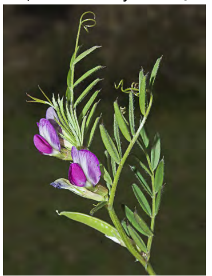
NARROW-LEAVED VETCH (Vicia sativa subsp. nigra) Naturalized Annual - Pea Family - (Mar–Jun) - Roadsides, disturbed areas, grassland, open areas in oak and riparian woodlands - Flowers 1-2 at leaf bases, pink-purple to white, 0.4-0.7" long. Leaflets 0.2-0.3" wide.