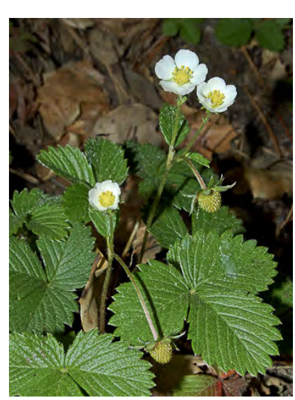
WOOD STRAWBERRY (Fragaria vesca) Native Perennial - Rose Family - (Jan–Jul) - Gen partial shade in forest - Stem gen 1.2-6" long. Leaflets 3, thin. Central leaflet gen w/12-21 teeth. Flower the the contral leaflet gen w/12-21 teeth. white, gen 0.6" wide, often above leaves. Fruit a strawberry.