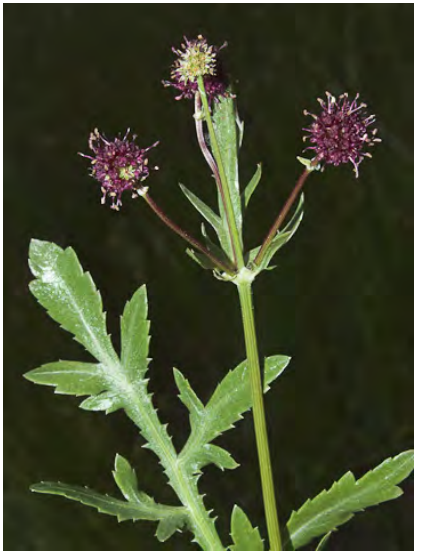
PURPLE SANICLE (Sanicula bipinnatifida) Native Perennial - Carrot Family - (Mar-May) - Open grassland, gen on serpentine, or pine/oak woodland - Plant 5-24" tall. Leaves 1.6-7.5" long, 1-2x divided on a winged central axis. Flowers dark purple. Fruits prickly.