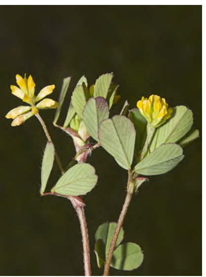
LITTLE HOP CLOVER (Trifolium dubium) Naturalized Annual - Pea Family - (Spring) -Agricultural, disturbed areas, lawns - Heads 0.16-0.3" wide. Flowers bright yellow, age brown, quickly reflex, smooth.