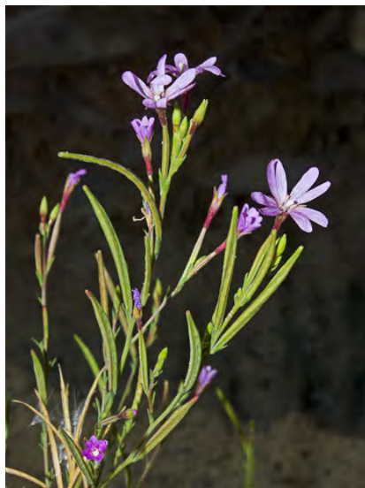
PANICLED / WEEDY WILLOWHERB (Epilobium brachycarpum) Native Annual - Evening Primrose Family - (Jun-Sep) - Common. Dry open or disturbed woodland, grassland, roadsides - Plant 8-79" tall, diffuse. Petals 2-15 mm long, white to rose-purple.