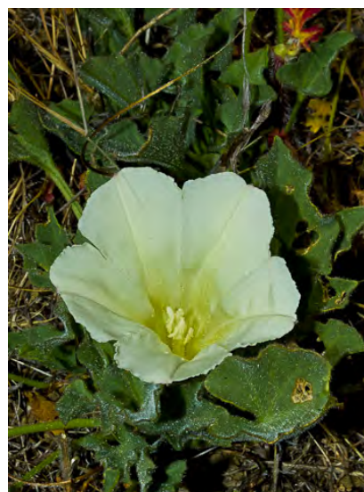
SHORTSTEM MORNING-GLORY (Calystegia subacaulis subsp. subacaulis) Native Perennial - Morning-glory Family - (Apr–Jun) - Dry, open scrub or woodland - Stem gen ~0.8" long. Flowers 1.3-2.4" long, white or cream. Bractlets concealing flower bracts.