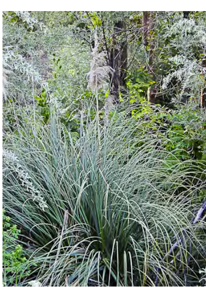
SMOOTH PAMPAS GRASS (Cortaderia selloana) Naturalized Perennial - Grass Family - (Sep-Mar) - Disturbed sites - Plant 6-13' tall. Leaf blades 0.1-0.5" wide, sheathes smooth. Cultivar, rarely escaped. INVASIVE weed.