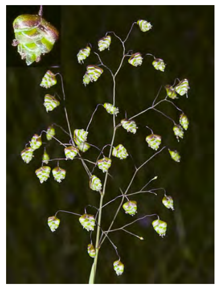
LITTLE QUAKING GRASS (Briza minor) Naturalized Annual - Grass Family - (Apr–Jul) - Shaded or moist, open sites - Stem 3-20" tall. Spikelets 0.1-0.2" long, resemble tiny rattlesnake rattles