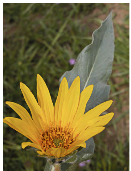
NARROW-LEAVED MULE'S EARS (Wyethia angustifolia) Native Perennial - Sunflower Family - (Apr-Aug) - Grassland - Plant 4-35" tall, rough-hairy. Leaves narrow, veins all similar, base blades 4-20" long. Ray flowers 0.6-1.8" long.