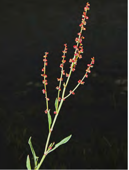
SHEEP SORREL (Rumex acetosella) Naturalized Perennial - Buckwheat Family - (Apr–Jul) - ± Disturbed, often acidic places - Stem < 16". Leaf gen basal, blade 0.8-2.4" long, lower arrowhead-shaped w/2 lobes. Flowers yellowish, turn reddish. INVASIVE.