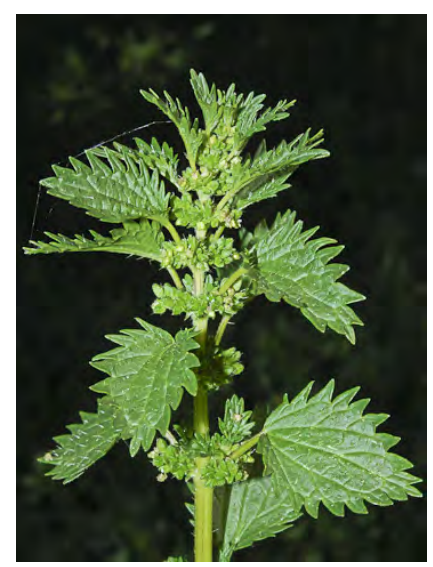
DWARF NETTLE (Urtica urens) Naturalized Annual - Nettle Family - (Jan-Jun) - Disturbed areas, stream banks, shaded areas in grassland, oak woodland, chaparral, coastal-sage scrub, riparian woodland - Leaf teeth sharp. Petals 2 large, 2 small, free to base.