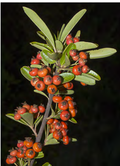
WOOLLY FIRETHORN (Pyracantha angustifolia) Naturalized Perennial - Rose Family - (Feb–Jun) - Disturbed areas, fencerows, abandoned fields, roadsides - Plant < 13', gray-hairy. Leaves narrow, entire. Calyx and below leaves often woolly. INVASIVE.