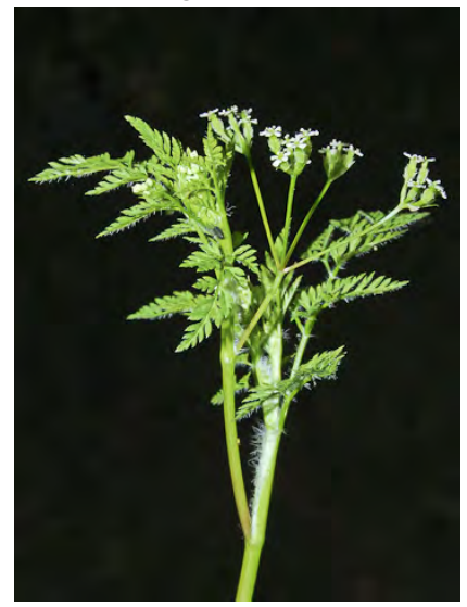
BUR-CHERVIL (Anthriscus caucalis) Naturalized Annual - Carrot Family - (Apr-Jun) - Generally shady places - Plant 18-40" tall. Flowers white; flower stalk >= fruit length. Fruits 0.1-0.2" long with curved "velcro" bristles. Leaves fern-like, triangular outline.