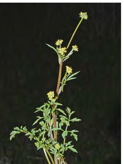
POISON SANICLE (Sanicula bipinnata) Native Perennial - Carrot Family - (Apr-May) - Open grassland or pine/oak woodland - Plants 5-24" tall. Leaves 2x pinnate. Flowers yellow, male flower stalk < fruit. Reported to be slightly TOXIC.