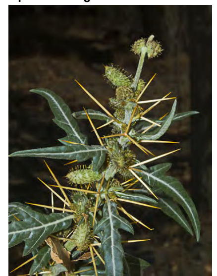
SPINY COCKLEBUR (Xanthium spinosum) Native Annual - Sunflower Family - (Jul-Oct) - Disturbed, seasonally wet, often alkaline sites, in grassland, marshes, watercourses - Plant 4-24". Stem node spines 0.6-1.2" long, golden, gen 3-lobed. Bur 0.4-0.5" long.