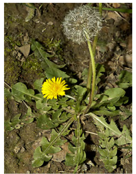
COMMON DANDELION (Taraxacum officinale) Naturalized Biennial-Perennial - Sunflower Family - (All year) - Abundant. Esp disturbed areas - Stem hollow. Leaves bright green with sharp down-pointing lobes. Outer head bracts reflexed. Fruit ~ brown.