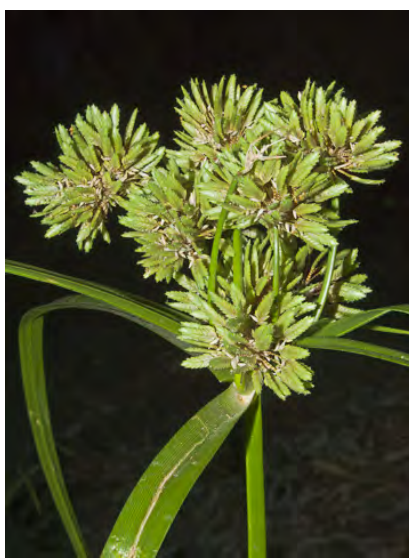
TALL NUTSEDGE (Cyperus eragrostis) Native Perennial - Sedge Family - (May-Nov) - Vernal pools, streambanks - Leaves basal. Flower cluster bracts 4-8. Spikelets 0.2-0.8" long, oblong, in heads to 1.6" wide. Seeds short-stalked.