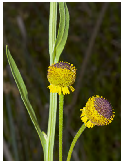
ROSILLA (Helenium puberulum) Native Biennial - Sunflower Family - (Jun-Aug) - Streambanks, seepage areas, lake margins - Plant 20-63". Flower head spherical, disk flowers ~0.1" long, yellow on sides, brown-purple on top; rays 0.15-0.4" long, point down.