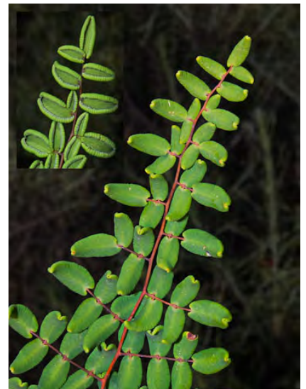
COFFEE FERN (Pellaea andromedifolia) Native Perennial - Brake Fern Family - - - Generally rocky or dry areas - Fronds 6-30" long, stem light brown. Leaf segments blunt, 0.24-0.6" long, 0.12-0.4" wide.