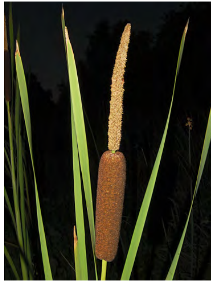
NARROW-LEAVED CATTAIL (Typha angustifolia) Native Perennial - Cattail Family - (May-Aug) - Nutrient-rich freshwater to brackish marshes, wet disturbed places - Plant 4.9-9.8' tall. Leaves gen < 0.4" wide. Flower cluster gap > 0.4"