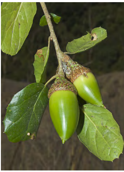
COAST LIVE OAK (Quercus agrifolia var. agrifolia) Native Perennial - Oak Family - (Mar-Apr) - Valleys, slopes, mixed-evergreen forest, woodland - Tree 30-80'. Leaves convex, hair-tuft below in vein axils. Acorns on 1st year twigs, shell glabrous inside.