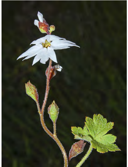
WOODLAND STAR (Lithophragma affine) Native Perennial - Saxifrage Family - (Mar–Apr) - Open, grassy slopes - Plant 4-24" tall. Leaves w/3-5 sharp-toothed shallow lobes, stem leaves alternate. Petals 0.2-0.5" long, white. Hypanthium funnel-shaped.