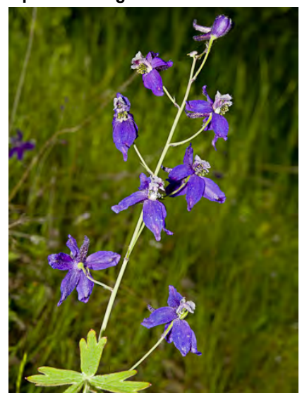
SPREADING LARKSPUR (Delphinium patens subsp. patens) Native Perennial - Buttercup Family - (Mar–Jun) - Grassland, open woodland - Stem 4-35" long. Leaves glabrous, divided into few-toothed lobes. Flowers few, bright or dark blue-purple.