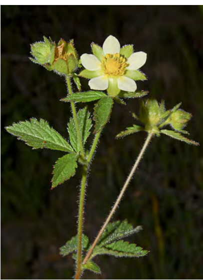
STICKY CINQUEFOIL (Drymocallis glandulosa var. wrangelliana) Native Perennial - Rose Family - (May–Jul) - Gen ± shady or moist areas - Stem 8-28". Flower 0.2-0.25" long, pale yellow to cream. Terminal leaflet distinct, unlobed.