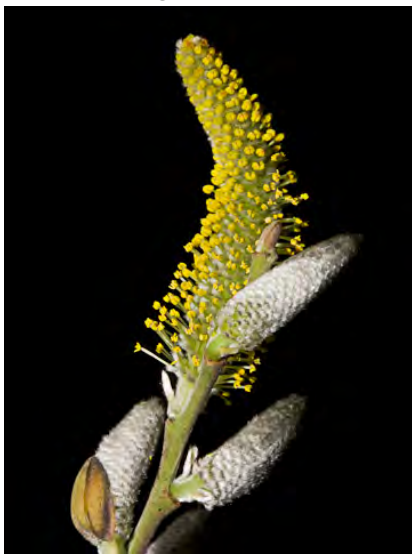
ARROYO WILLOW (Salix lasiolepis) Native Perennial - Willow Family - (Jan–Jun) - Common. Shores, marshes, meadows, etc - Shrub-tree, bark smooth. Leaf-like stipules. Leaf egg-shaped, waxy below. Fruit smooth, bract persistent, dark, stamens 2.