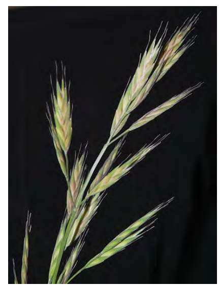
CALIFORNIA BROME (Bromus carinatus var. carinatus) Native Perennial - Grass Family - (Apr-Aug) - Coastal prairies, openings in chaparral, plains, open oak and pine woodland -Plant 20-40" tall. Flower cluster 6-16" long. Spikelet 0.8-1.6" long. Lemma 0.5-0.8" long, hairy, awn 0.3-0.6" long.