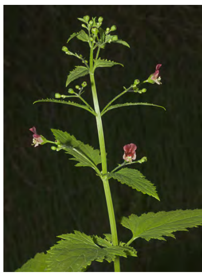
CALIFORNIA FIGWORT (Scrophularia californica) Native Perennial - Snapdragon Family - (Mar-Jul) - Common; damp places, chaparral, roadsides - Stem 2.6-4' tall, square x-section. Leaves opposite, to 7" long, triangular, toothed. Flowers 0.3-0.5" long, upper lips red to maroon, lower paler or yellowish.