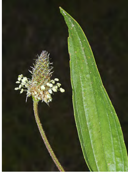
ENGLISH PLANTAIN (Plantago lanceolata) Naturalized Annual - Plantain Family - (Apr-Aug) - Common. Disturbed areas - Leaves basal, hairy, 2-10" long, <= 1" wide. Flowers + stem 8-31" tall, flower cluster 0.8-3" long. INVASIVE, lawn weed.