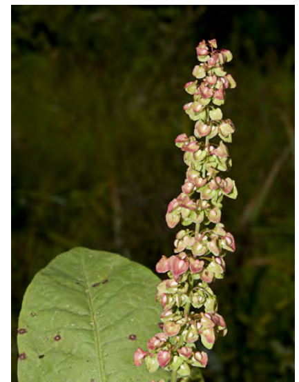
CURLY DOCK (Rumex crispus) Naturalized Perennial - Buckwheat Family - (All year) - Abundant. Disturbed places - Stem 16-39" tall. Flower cluster dense, valves 0.2-0.24", winged around tubercles, smooth edged. 1 tubercle enlarged. INVASIVE.