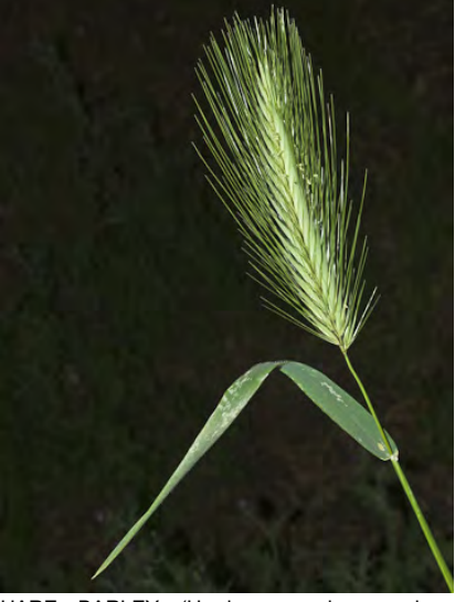
HARE BARLEY (Hordeum murinum subsp. leporinum) Naturalized Annual - Grass Family - (Feb–May) - Moist, gen disturbed sites. Common - Stem 12-43" tall. Central spikelet stalk ~0.06" long. Central floret << lateral florets. INVASIVE weed.