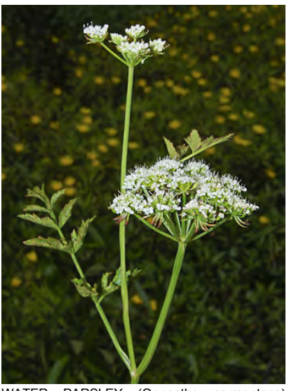
WATER PARSLEY (Oenanthe sarmentosa) Native Perennial - Carrot Family - (Jun-Oct) -Streams, marshes, ponds, gen aquatic - Plant 20-60" tall. Young shoots curled, tendril-like. Leaves twice-pinnate, leaflets alike, broad, serrate to lobed. Flowers white.