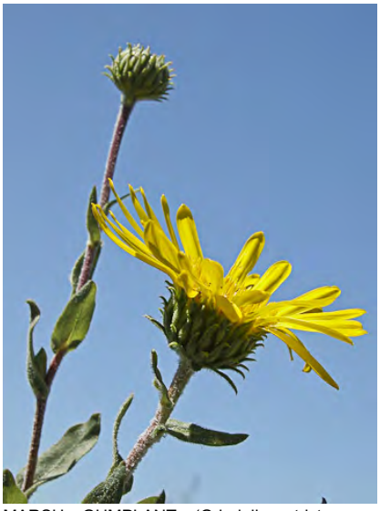
MARSH GUMPLANT (Grindelia stricta var. angustifolia) Native Perennial - Sunflower Family - (May–Dec) - Tidal wetlands - Plant 3.3-6.6' tall, woody base, evergreen. Leaves 0.4-6" long, fleshy, not resinous. Flower rays yellow, 16-56, 0.5-0.7" long.