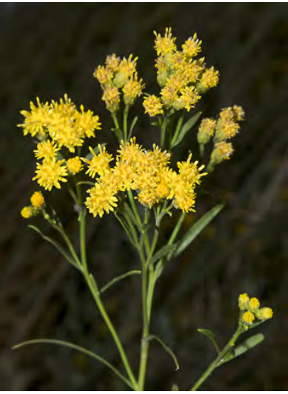
WESTERN GOLDENROD (Euthamia occidentalis) Native Perennial - Sunflower Family - (Jul-Nov) - Marshes, streambanks, meadows - Stem < 6.6', smooth. Leaves < 4" long, <= 0.24" wide, w/dark glandular pits. Flowers yellow, rays 0.06-0.1" long.