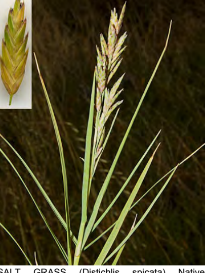
SALT GRASS (Distichlis spicata) Native Perennial - Grass Family - (Apr-Sep) - Salt marshes, coastal dunes, moist, alkaline areas -Stem 4-20" long. Leaves 0.8-4" long, flat, stiff. Flower cluster 0.8-3" long, narrow. Spikelets straw-colored to purple, 2-20/group, 0.24-0.8" long.

Wild Plants of Bay Point Regional Shoreline - Sorted by Form, Color and Family Page 1