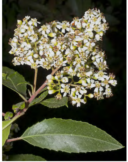
CHRISTMAS BERRY / TOYON (Heteromeles arbutifolia) Native Perennial - Rose Family -((May)Jun-Aug) - Chaparral, oak woodland, mixed-evergreen forest - Shrub-tree < 33' tall, evergreen. Leaf 2-4" long. Petals white, < 0.16" long. Fruit bright red.