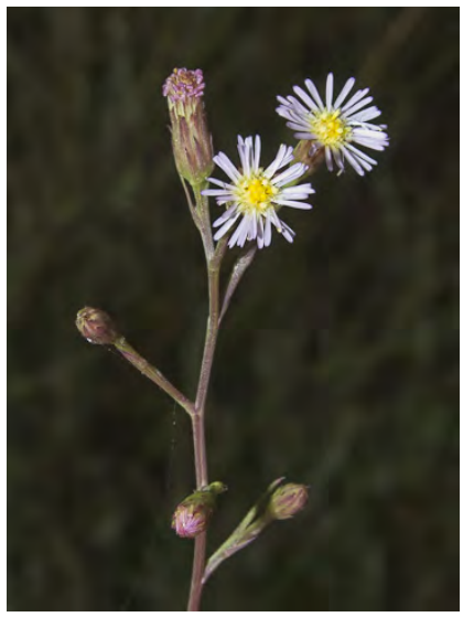
ANNUAL SALTMARSH ASTER (Symphyotrichum subulatum var. parviflorum) Native Annual - Sunflower Family - (Jul–Oct) -Marshes, disturbed places - Heads white to pink, solitary, in leaf axils and stem ends, <50 rays. Flower head bracts sharp-tipped.