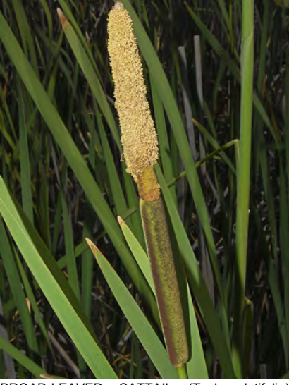
BROAD-LEAVED CATTAIL (Typha latifolia) Native Perennial - Cattail Family - (Jun–Jul) -Unpolluted to nutrient-rich freshwater (brackish) marshes - Plant 4.9-9.8' tall. Widest leaves 0.4-1.1" wide. Flower cluster with no gap between flower types.