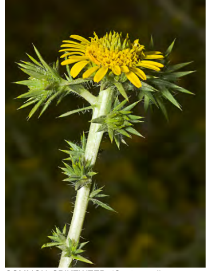
COMMON SPIKEWEED (Centromadia pungens subsp. pungens) Native Annual - Sunflower Family - (Apr-Nov) - Grassland, saltbush scrub, disturbed sites - Spiny. Leaves smooth or rough to the touch.