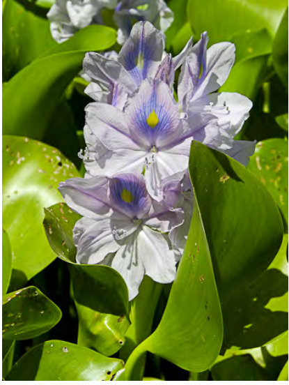
WATER HYACINTH (Eichhornia crassipes) Naturalized Perennial - Pickerel-weed Family -(Jun-Oct) - Locally abundant. Ponds, sloughs, waterways - Aquatic. Leaf < 4" wide, inflated leaf stalk base. Flower lilac or pale blue to white. NOXIOUS.