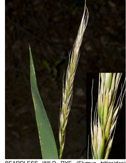
BEARDLESS WILD RYE (Elymus triticoides) Native Perennial - Grass Family - (Jun–Jul) - Dry to moist, often saline, meadows - Plant 18-50" tall, from rhizomes. Flower cluster 2-8" long. Spikelets generally 2/node. Lemmas 3-7, 0.2-0.5" long, awn to 0.12" long.