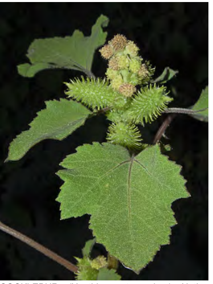
COCKLEBUR (Xanthium strumarium) Native Annual - Sunflower Family - (Jul-Oct) -Disturbed, seasonally wet, often alkaline sites, in grassland, marshes, watercourses - Plant 4-32" tall. Stem spineless. Bur 0.4-1.2"+ long.