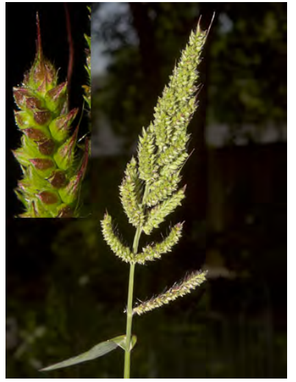
BARNYARD GRASS (Echinochloa crus-galli) Naturalized Annual - Grass Family - (Jun-Oct) -Gen wet, disturbed sites, fields, roadsides - Stem 12-39" long. Leaf blades to 25" long, 0.2-1.2" wide. Spikelet 0.1-0.16" long, floret -0.14" long, 1 per node. Awns 0-2" long on same plant.