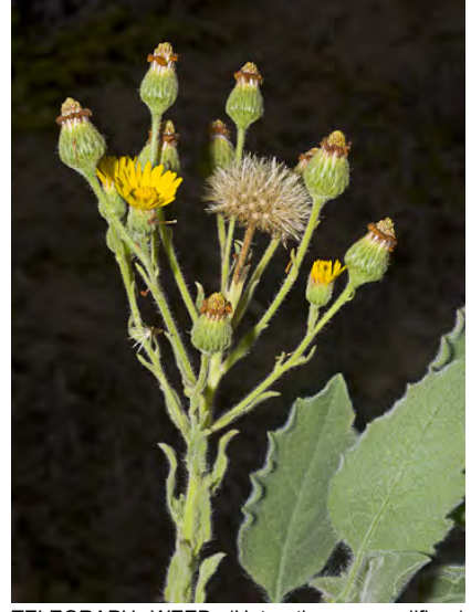
TELEGRAPH WEED (Heterotheca grandiflora) Native Annual - Sunflower Family - (Jun-Oct(± all year)) - Disturbed areas, dry streambeds, sand dunes - Plant 0.3-8' tall, bristly, sticky, branched above. Leaf 0.8-2.8" long, lower clasp stem. Rays 25-40, 0.2-0.3" long.