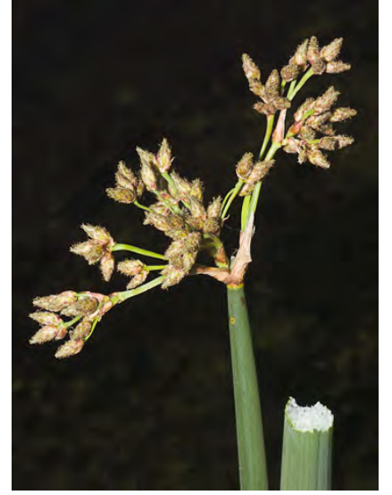
COMMON TULE (Schoenoplectus acutus var. occidentalis) Native Perennial - Sedge Family - (Summer) - Common. Marshes, shores, fens, shallow lakes, often emergent - Stem 3.3-13' tall, fat, round x-section, blue-green.