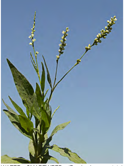
WATER SMARTWEED (Persicaria punctata) Native Annual-Perennial - Buckwheat Family -(Jun-Nov) - Shallow water, shores, marshes, floodplain forest - Flowers ~0.15" long, 5-lobed, white margins, gland-dotted. Fruit black, shiny.