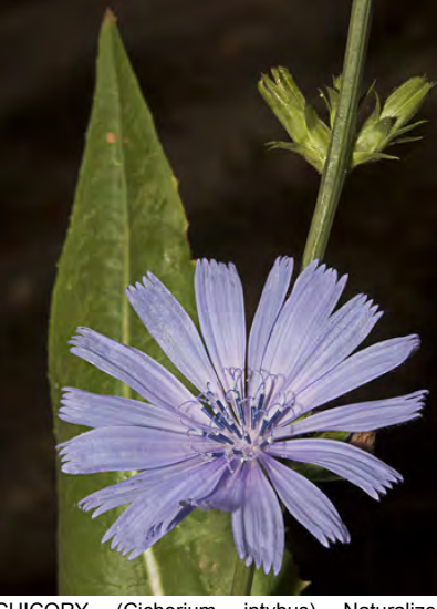
CHICORY (Cichorium intybus) Naturalized Perennial - Sunflower Family - (Apr-Oct) -Common. Roadsides, disturbed places - Plants 16-78" tall. Stems leafless. Leaves dandelion-like. Flowers pale blue, 0.8-1.6" wide. Roots roasted as coffee substitute.