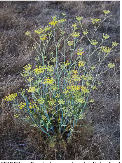
FENNEL (Foeniculum vulgare) Naturalized Perennial - Carrot Family - (May–Sep) -Roadsides, disturbed sites - Plants 3-6.5' tall, anise-scented. Stems waxy-blue, canelike. Flowers yellow. Leaf segments thread-like, edible when young. INVASIVE weed.