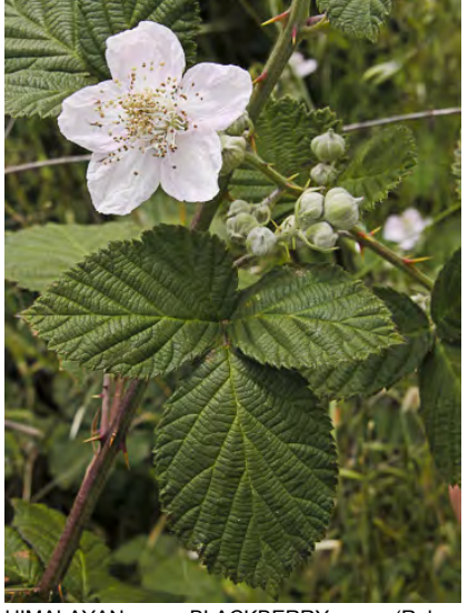
HIMALAYAN BLACKBERRY (Rubus armeniacus) Naturalized Perennial - Rose Family (Mar–Jun) - Common. Disturbed areas, roadsides - Shrub w/thorny 5-angled stem. Leaflets 3-5, white-hairy beneath. Blackberry-type fruit. INVASIVE.