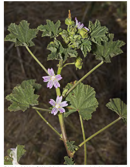
BULL MALLOW (Malva nicaeensis) Naturalized Annual - Mallow Family - (Mar–Jun) - Disturbed places - Stem 0.7-2'. Leaf blade 1.2-4.7" wide, 5-7 shallow lobes. Bractlets egg-shaped,0.16-0.2" long. Petals pink to blue-violet, 0.2-0.5" long.