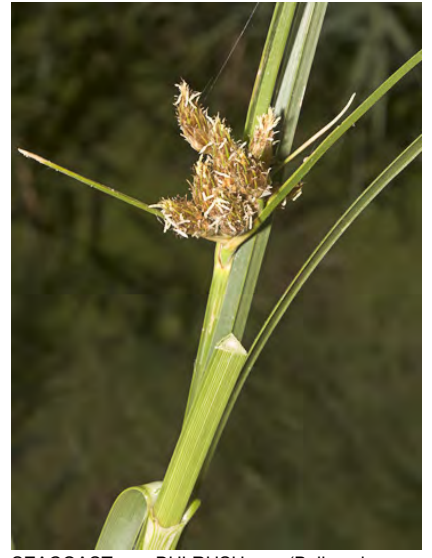
SEACOAST BULRUSH (Bolboschoenus robustus) Native Perennial - Sedge Family -(Summer) - Brackish to saline coastal marshes -Plant 20-60" tall. Stem sharply triangular. Flower cluster dense, stemless, just above bracts. Spikelets 5-25, 0.4-1.2" long.