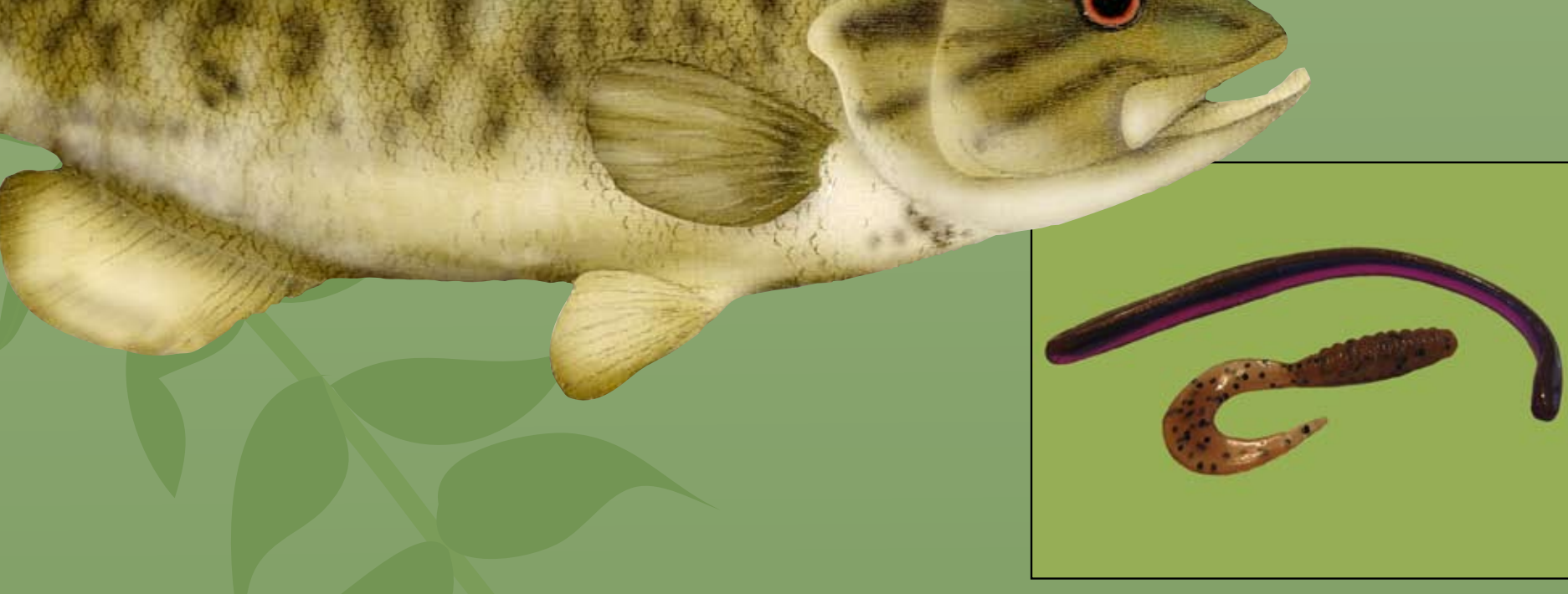
plastic worms or grubs

This large open water predator is found near the surface to 40 feet and can reach 40 pounds! Stripers actually feed on shad and trout and can be caught on lures cast or trolled from a boat.