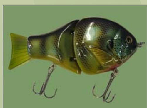
Black Dog Shell