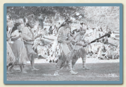
Contemporary dancers at the Gathering of Ohlone People held at Coyote Hills Regional Park.