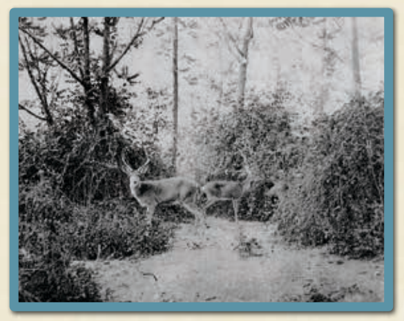
"Its dense undergrowth and generally wild appearance make it an ideal home for the handsome animals. They are captives with none of the elements of captivity." Washington Press, September 1898.