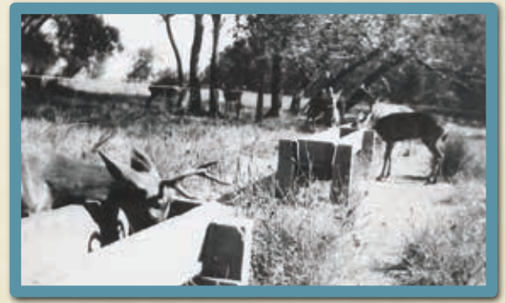
The deer were fed every day between 4:00pm and 6:00pm.