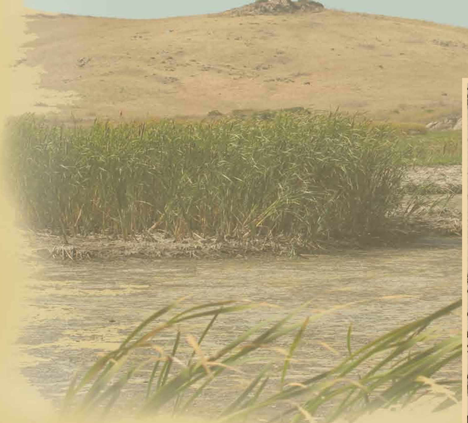
Dates and stories taken from the diaries of Anza and Font, courtesy of the Center for Advanced Technology in Education, University of Oregon, www.anza.uoregon.edu.

Successfully arriving in Monterey after a long and adventurous journey, Anza then led a much smaller expedition to explore San Francisco and the East Bay. They traveled close to this very spot on March 31, 1776 on their way to investigate the source of the water in the area we now know as the San Francisco Delta.