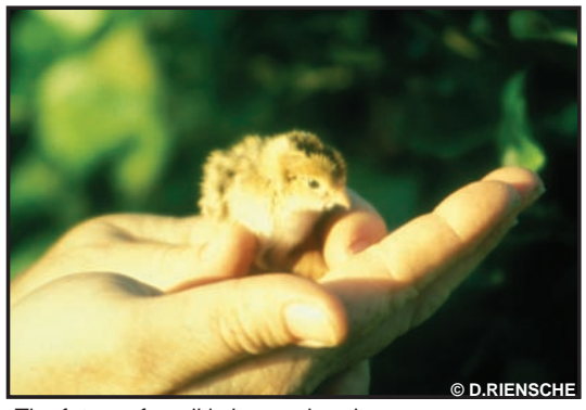
The future of quail is in your hand.

"Quail Rangers" of all ages are planting bird friendly vegetation, building brush piles, and conducting field surveys to aid quail and other treasured wildlife. In our area the ideal quail habitat is composed of quail bush, blackberry, chemise, California sage, and various oak tree species. Quail eat insects, seeds, leaves and berries. When visiting our parks, watch for quail as they scurry between protective bushes.