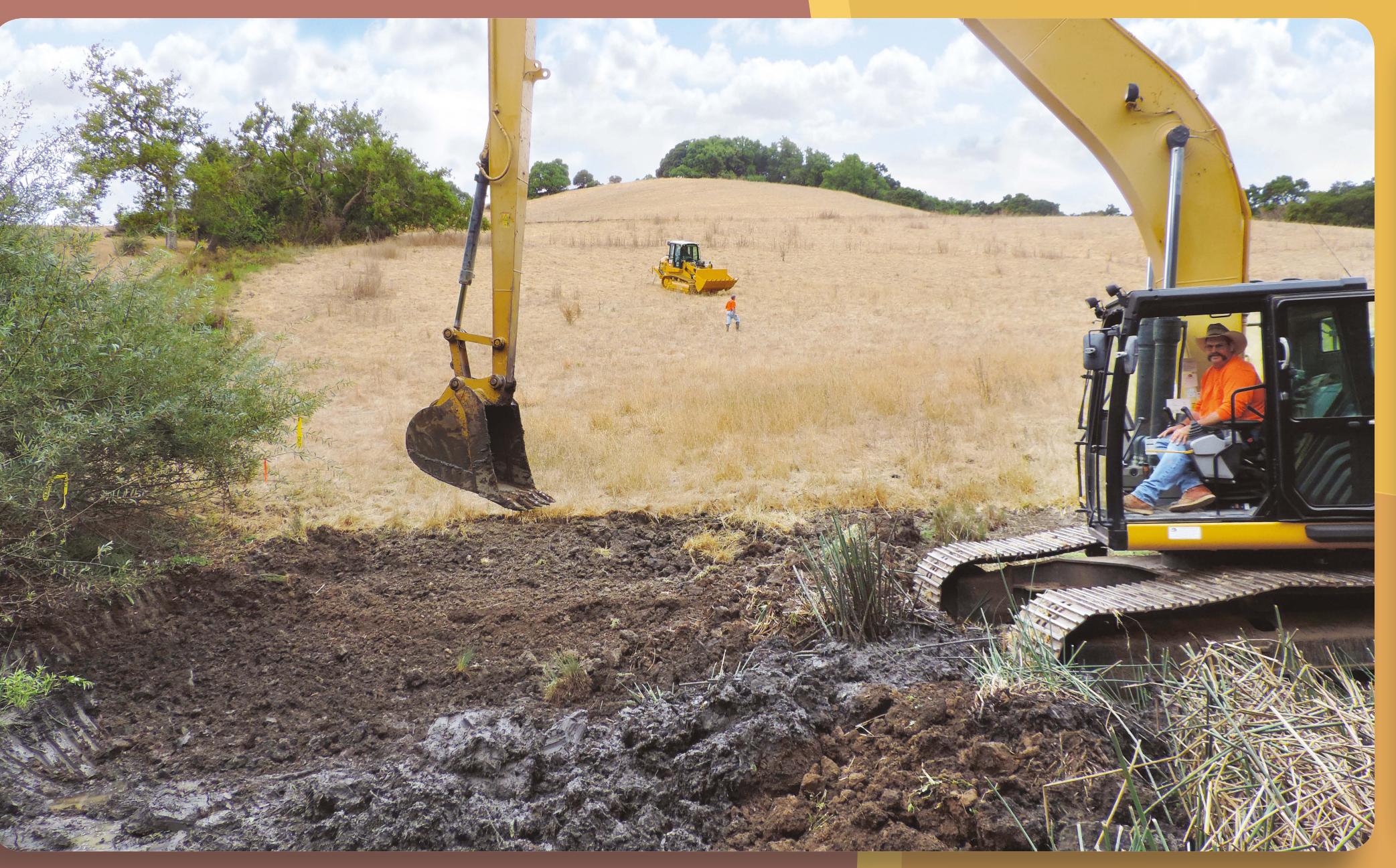
Figure 2. Pond restoration efforts using an excavator and Loader.