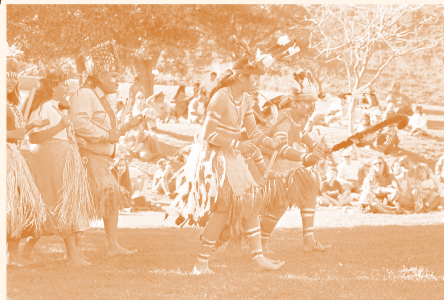
Contemporary dancers at The Gathering of Ohlone People held at Coyote Hills Regional Park.