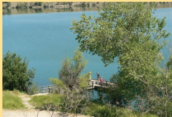
Anglers at Shadow Cliffs can fish from shore, dock, or boat. The lake is seasonally planted with catfish and trout.

BMX PARK This popular 2.75-acre City of Pleasanton facility is located at 3320 Stanley Boulevard at the west end of Shadow Cliffs Regional Recreation Area. The park has a large riding area, a bike repair/work table, viewing area, restrooms, and picnic tables. The park serves all riding levels, with a track for beginners and young children and a mountain bike area and challenging jumps and banked turns for more experienced riders. The park is open during daylight hours throughout the year, weather permitting. All riders must wear helmets. Younger children should always be under adult supervision.