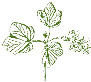
Pink flowering currant Ribes glutinosum