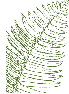
Western sword fern Polystichum munitum