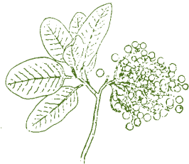
Pacific madrone Arbutus menziesii