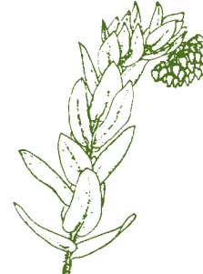
Pallid manzanita Arctostaphylos pallida