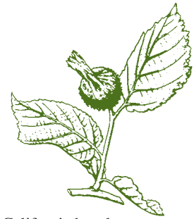
California hazel nut Corylus californica