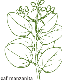
Brittleleaf manzanita Arctostaphylos crustacea