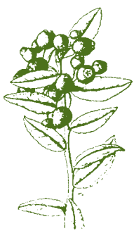
Coast huckleberry Vaccinium ovatum