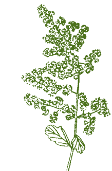
Ocean spray Holodiscus discolor