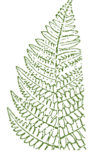
Wood fern Dryopteris arguta