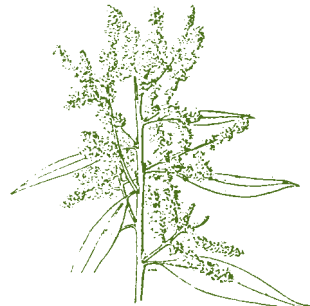
Dwarf chinquapin Castanopsis chrysophylla