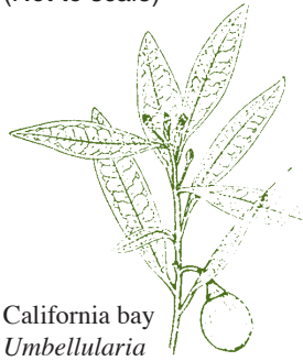
California bay Umbellularia californica