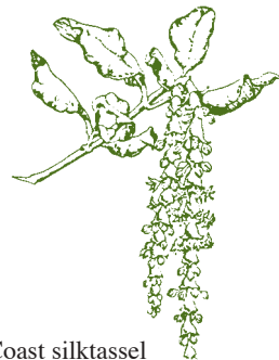
Coast siltassel Garrya elliptica