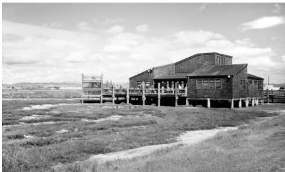
Hayward Shoreline Interpretive Center is accessible from Breakwater Avenue at the shoreline park's south end.

In order to protect wildlife, dogs are not allowed south of the West Winton Avenue flood control channel.