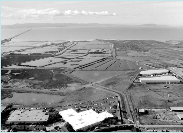
The Hayward Marsh expansion project created fresh and brackish water marsh basins that include wildlife islands for waterbirds and a pickleweed marsh for the endangered salt marsh harvest mouse. The marsh system utilizes secondary treated wastewater and storm runoff.