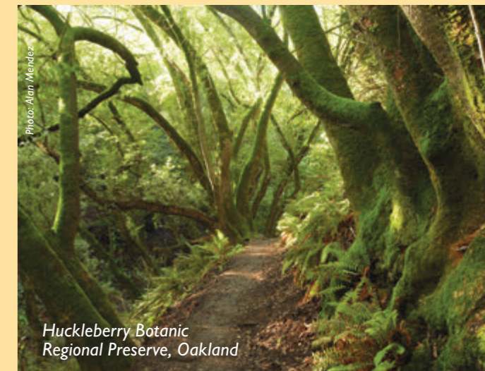
Huckleberry Botanic Regional Preserve, Oakland