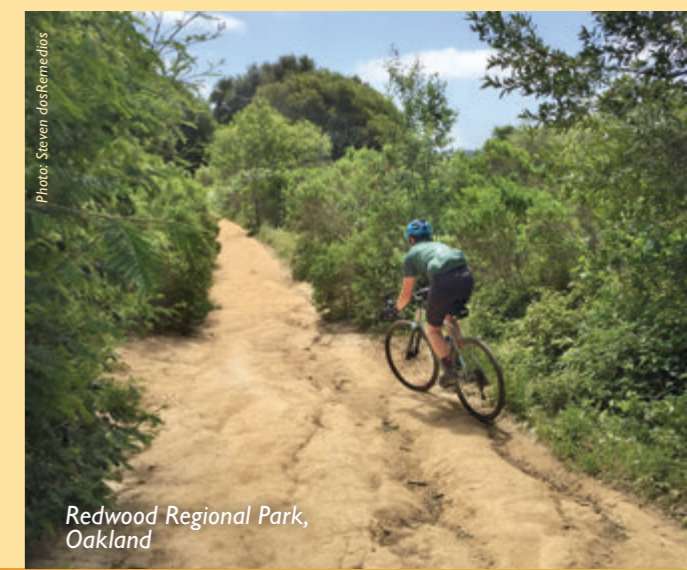
Redwood Regional Park, Oakland