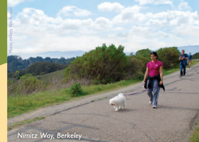
Nimitz Way, Berkeley