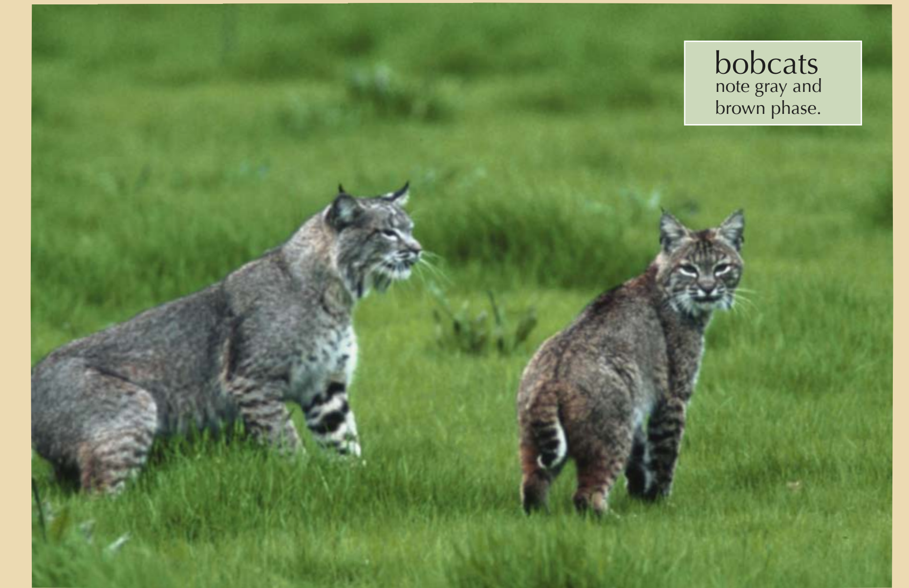
bobcats note gray and brown phase.