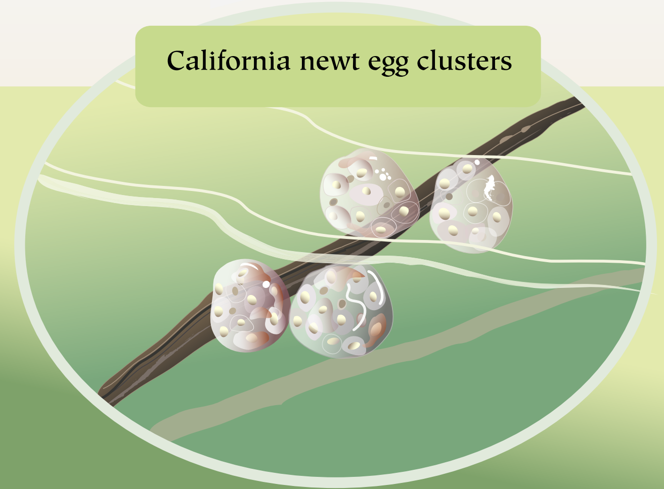
California newt egg clusters

PLEASE HELP US restore this important habitat.