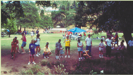
Lake Temescal is a popular venue for Regional Parks-sponsored fishing derbies. Inner-city kids enjoy a day of fishing, picnicking, and enjoying the day with volunteers.

MEMBERSHIPS The Regional Parks Foundation offers Memberships to park users. For more information, call (510) 544-2220.