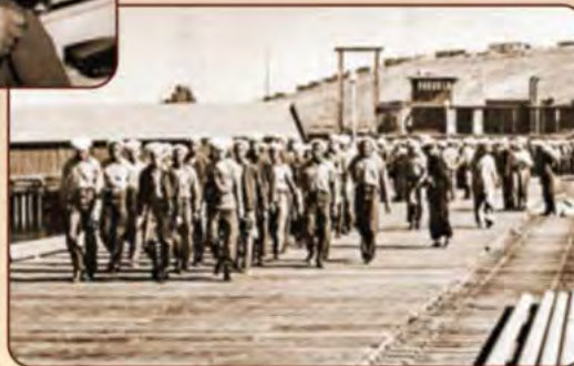
Sailors marching at Mare Island.

16 PEACE, JUSTICE AND STRONG INSTITUTIONS