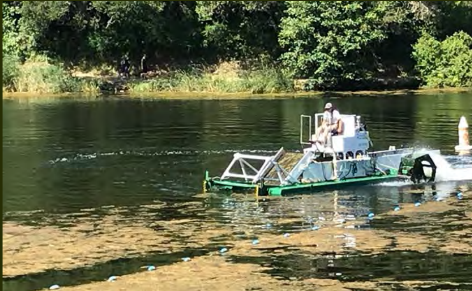
Lake Temescal, Oakland