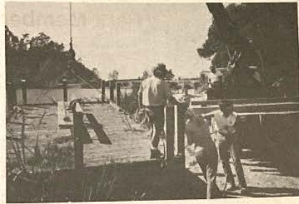
EBRPD Construction crew lowers Temescal pier into place.

Park District design projects have received widespread recognition. Most recently the District's barrier-