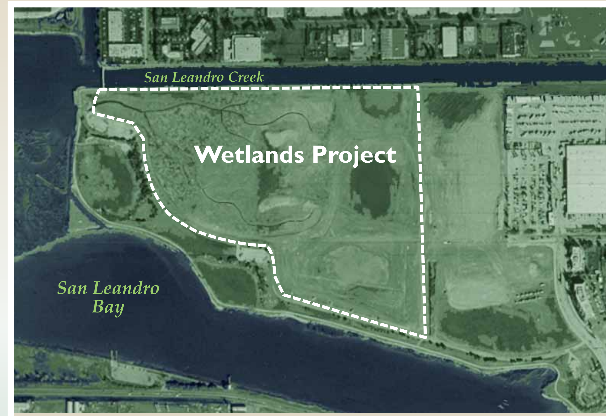
Aerial photo of the wetlands project taken in 1998.

Special thanks to: Port of Oakland, The Golden Gate Audubon Society, Save San Francisco Bay Association, Sierra Club, Inc., Citizens for Alameda's Last Marshlands, Regional Water Quality Control Board, and U.S. Army Corps of Engineers for their dedication and efforts to restore this site.