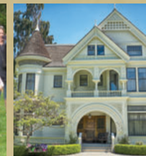
Patterson House tours