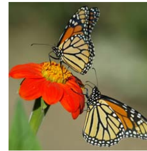
Monarch butterflies nectaring on Mexican sunflower.