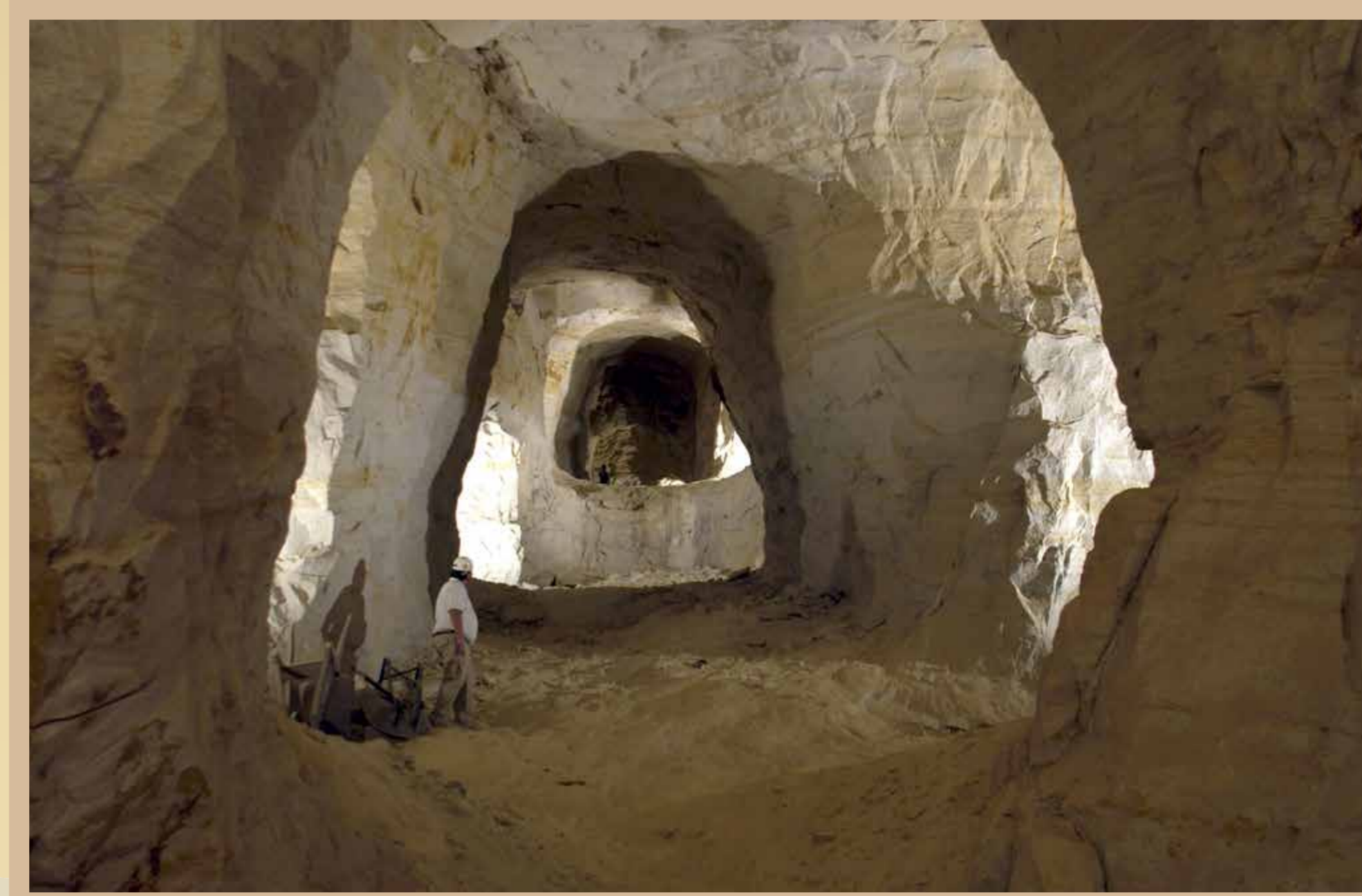
Miners toiled to remove silica sand, leaving behind nearly eight miles of underground workings.