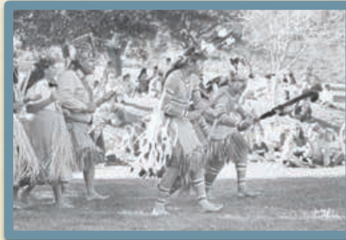
Contemporary dancers at the Gathering of Ohlone People held at Coyote Hills Regional Park.