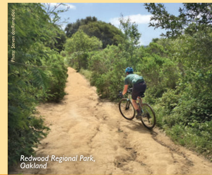
Redwood Regional Park, Oakland