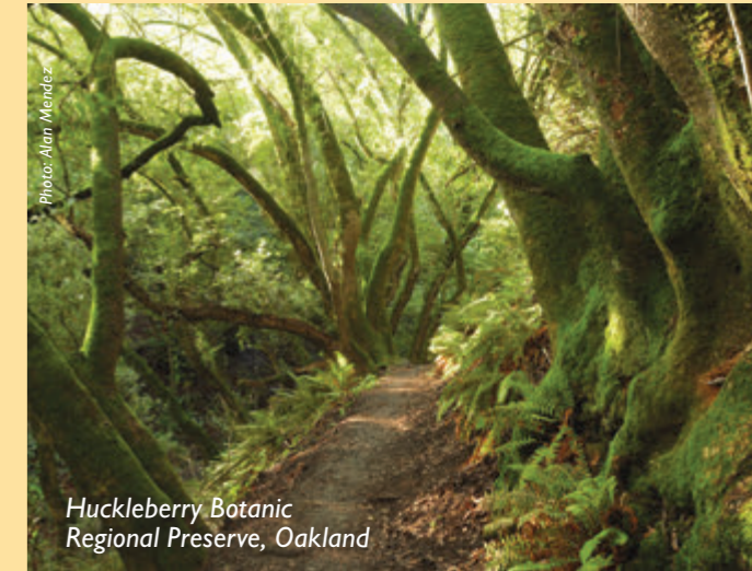
Huckleberry Botanic Regional Preserve, Oakland