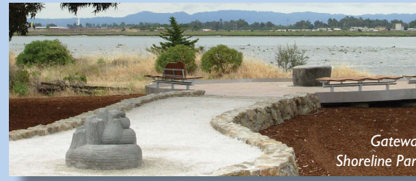
Gateway Shoreline Park