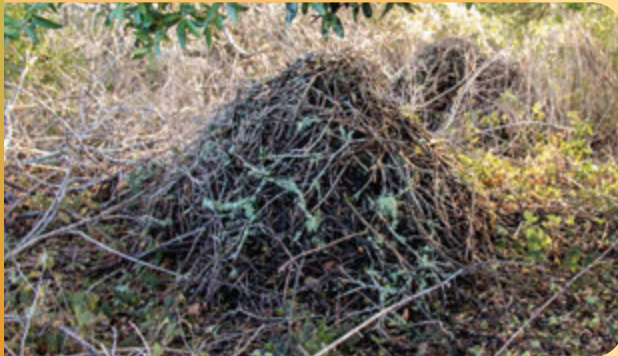
A woodrat stick nest.