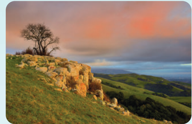
Views from Dry Creek Pioneer Regional Park

from Dry Creek Pioneer park to Five Canyons Open Space in Castro Valley, through Garin Regional Park. More information and a current map to the Bay Area Ridge Trail can be found at ridgetrail.org .