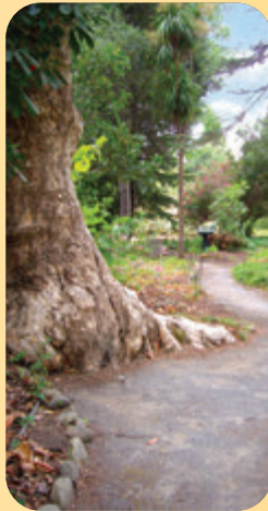
Dry Creek Garden