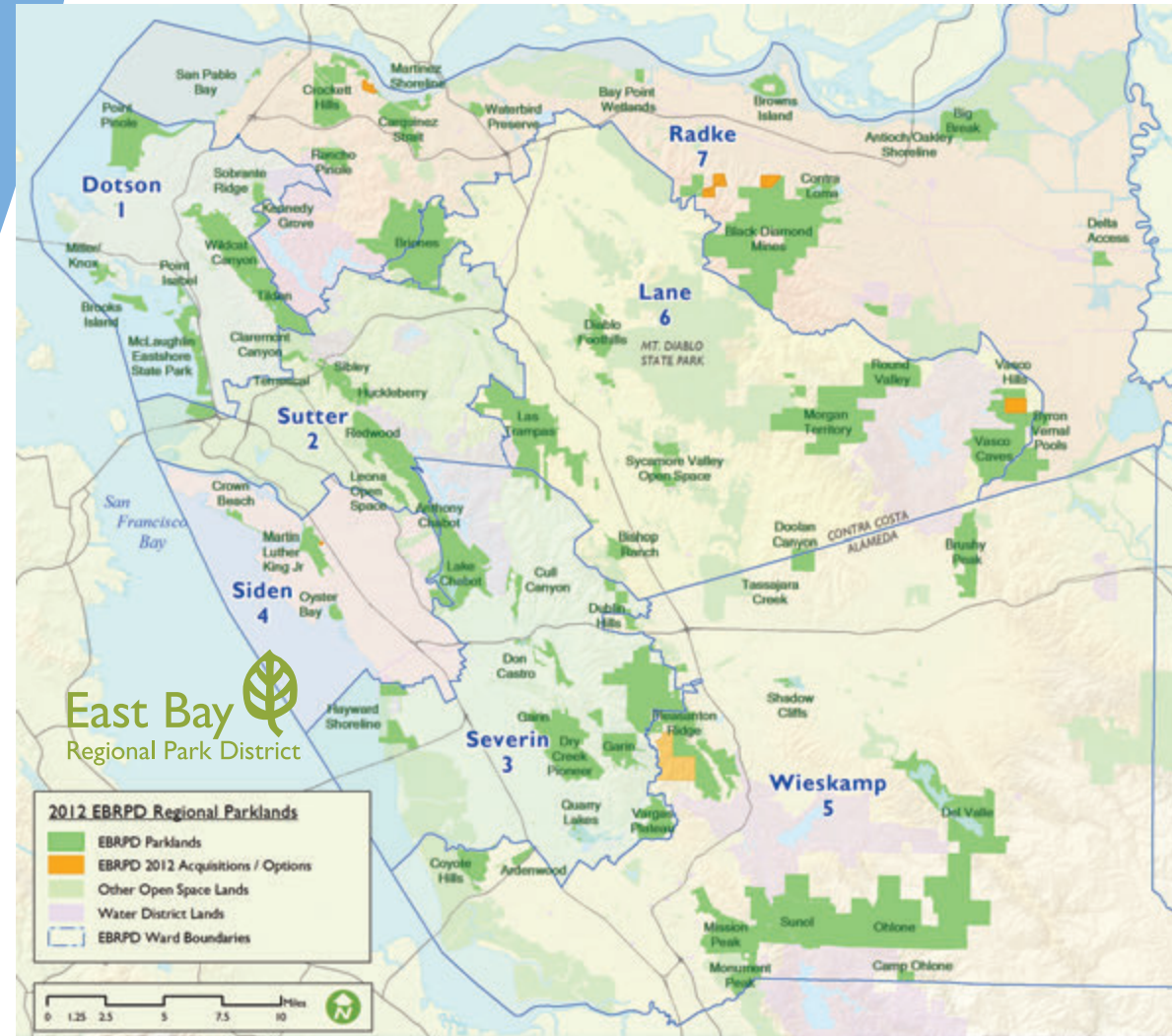
East Bay Regional Park District Annual Community Report

A special acknowledgement goes to these grant funders: City of Livermore Dougherty Valley Settlement Agreement Fund; Alameda County Altamont Landfill and Resource Open Space Advisory Council; East Contra Costa Habitat Conservation Plan; San Francisco Bay Area Conservancy Program (Coastal Conservancy); and California State Lands Commission.