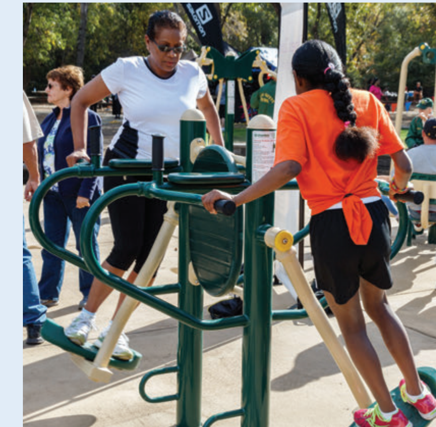
Fitness Zone, Lake Chabot Regional Park