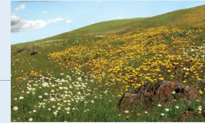
Serpentine Prairie Restoration, Redwood Regional Park