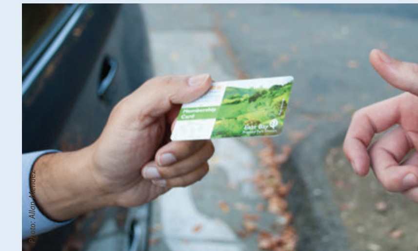
A Regional Parks Membership Card