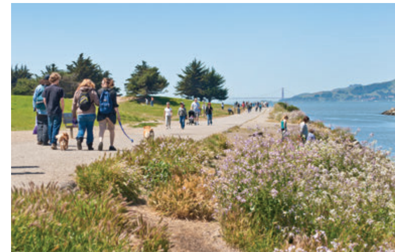
Point Isabel Regional Shoreline Richmond, CA

In Alameda County, Zone 1 boundaries include the incorporated cities of Alameda, Albany, Berkeley, Emeryville, Oakland, and Piedmont, as well as some unincorporated areas. In Contra Costa County, Zone 1 boundaries include the incorporated cities of Richmond, San Pablo, and El Cerrito and a portion of incorporated Pinole, as well as unincorporated areas of El Sobrante and Kensington. All revenue collected through this tax in Zone 1 must be spent in Zone 1.