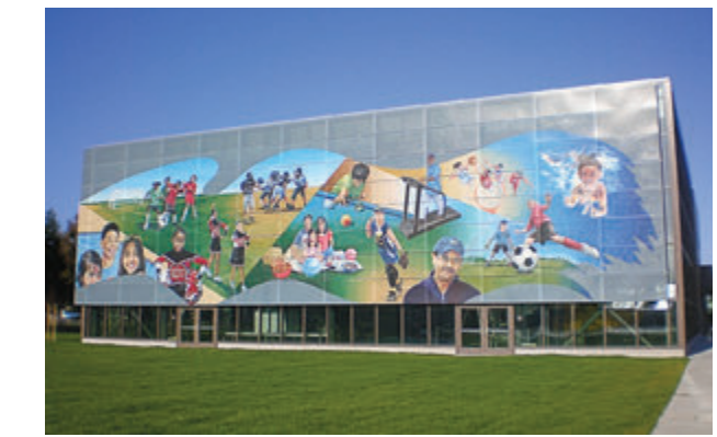
The East Oakland Sports Center