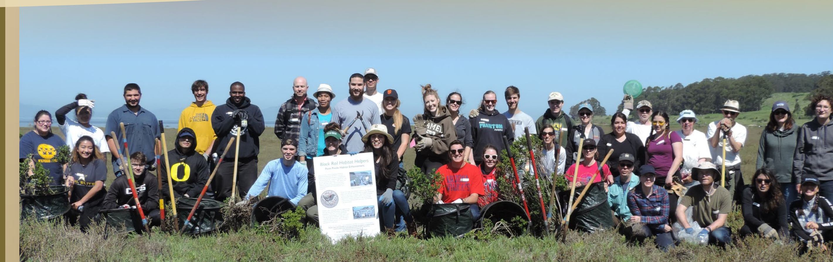
Figure 1. Wildlife Volunteers also known as "Black Rail Habitat Helpers" are pulling weeds to improve the Giant Marsh located at Point Pinole Regional Park, Richmond, California.

The restoration efforts to remove non-native plants and channel-clogging debris at the Giant Marsh located at Point Pinole Regional Park in Richmond is demonstrating that with time the desired species will respond positively to habitat improvements. The call count data indicates that the California Black Rail population is, significantly, four times higher now, than when Manolis (1978) provided the first baseline information on the area. Like Manolis's (1978) findings, the California Black Rails at this location seem restricted to high marsh habitat at the upper limits of tidal flooding. At Point Pinole this upper limit is usually along the pickleweed and marsh grindelia covered channel berms (Figure 2). Under stable habitat conditions with significant tidal marsh cover, above the extreme high tides, it is reported the adult Black Rail ( Laterallus jamaicensis ) survival is higher despite predation by herons and other avian predators which can be the primary source of mortality for this species (Eddleman et al., 1994).